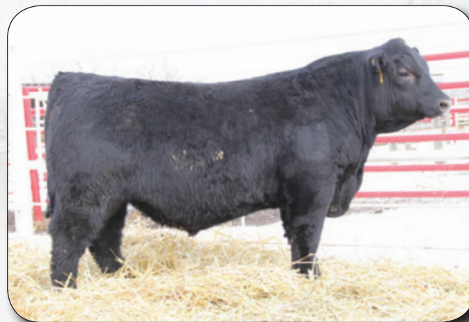
SON OUT OF LOT 23 DAM - AMDAHL'S MISS EMBLAZON 616