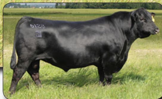
LOT 4A SIRE - G A R PROPHET