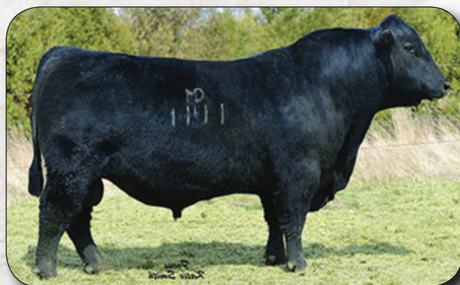
MOGCK FRONTMAN 1141