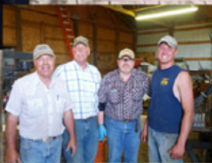
Fencing Bull Yards