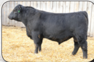
HALF BROTHER TO LOT 36