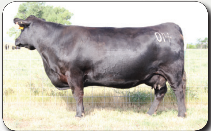
LOT 47 DAM - AMDAHL DIXIE 7402 014