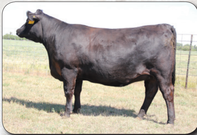
HALF SISTER TO LOTS 32 & 33