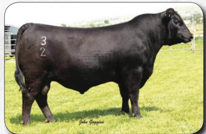
LOT 33 SERVICE SIRE - CONNEALY COUNT DOWN