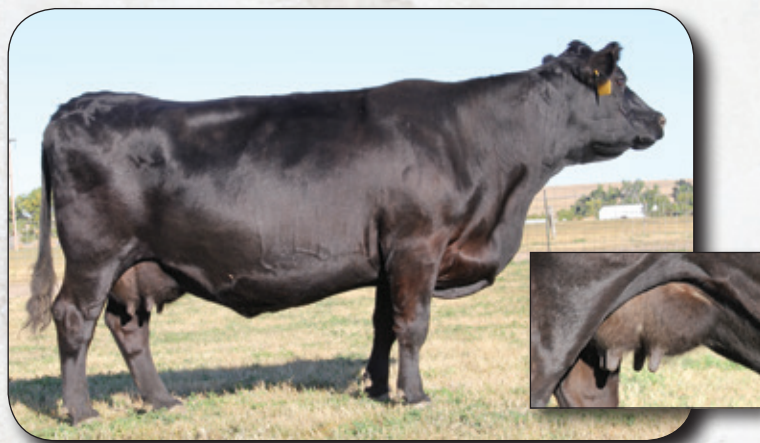
O C C EMBLAZON DONOR COW COMING 17 YEARS OLD. PROGENY SELL!