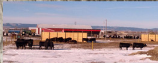
Cows coming home