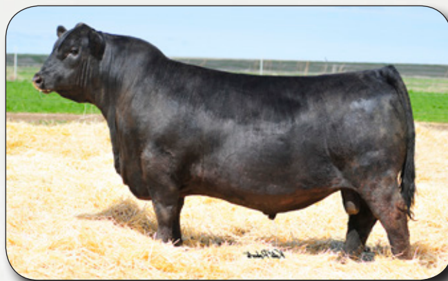
HA COWBOY UP 5405