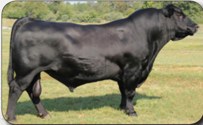
WERNER WAR PARTY 2417