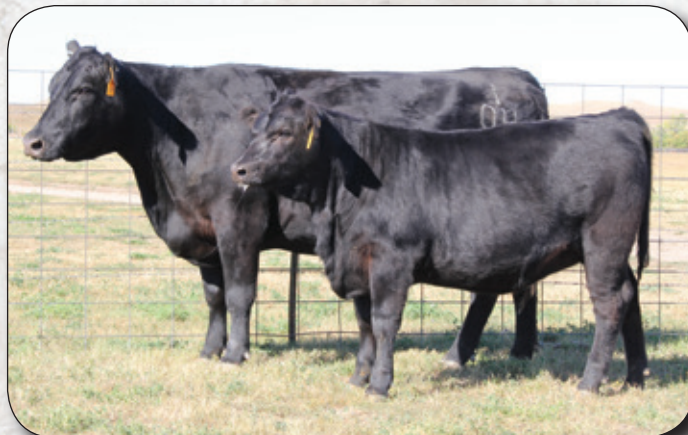
LOT 39 AND HER DAM - D R ERICA 104