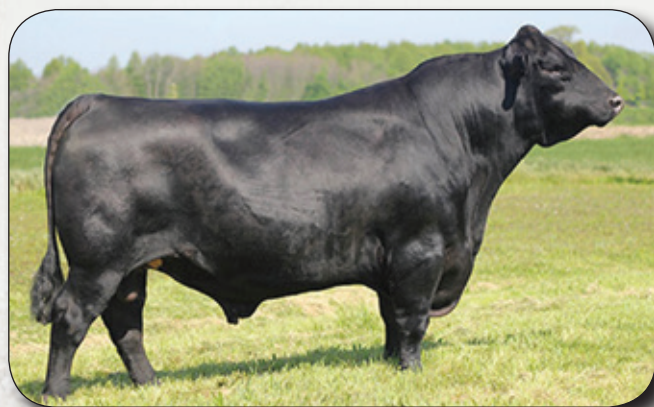
W H S LIMELIGHT 64V - SIRE TO AMDAHL'S HEAVY DUTY 323