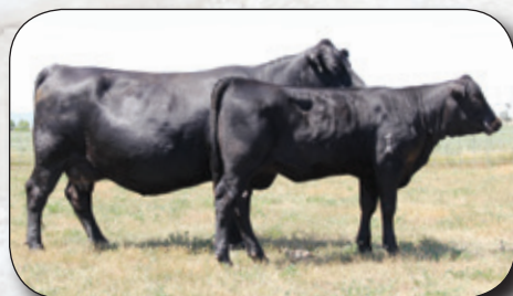
LOT 24 & DAM - PAR TRANSFORMING BROADSIDE83