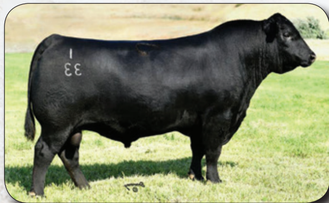
CONNEALY BLACK GRANITE