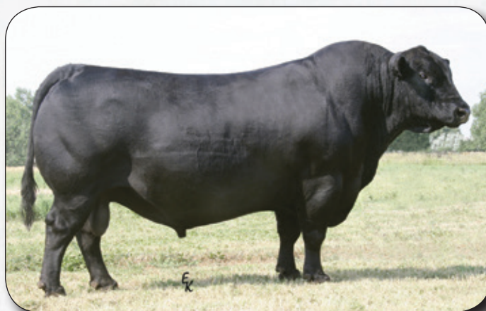
SIRE TO LOT 2 - S A V FINAL ANSWER 0035

Thank you for your interest in our program.