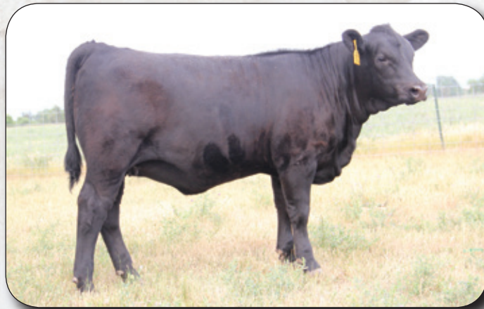
HALF SISTER TO LOTS 17 & 18