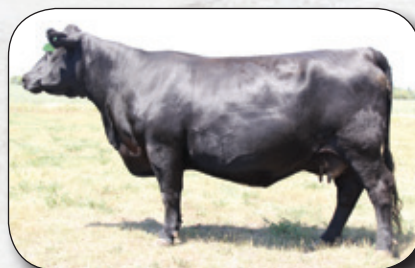
LOT 24'S DAM - PAR TRANSFORMING BROADSIDE83