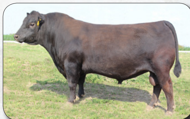
CB BLOCK PARTY 156