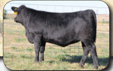
LOT 30 AS A CALF

Bred Heifer 30 AMDAHL MISS ALL AMER3140-501 BD: 02/10/15 Reg No: 18315613 Tattoo: 501