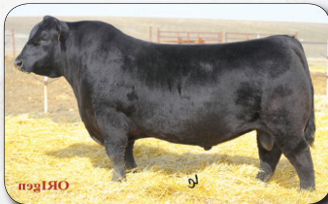
R B TOUR OF DUTY 177