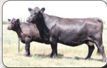
LOT 28 AND HER CALF, LOT 28A