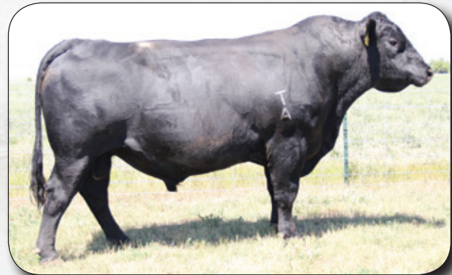
AMDAHL'S ALL AMERICAN 324