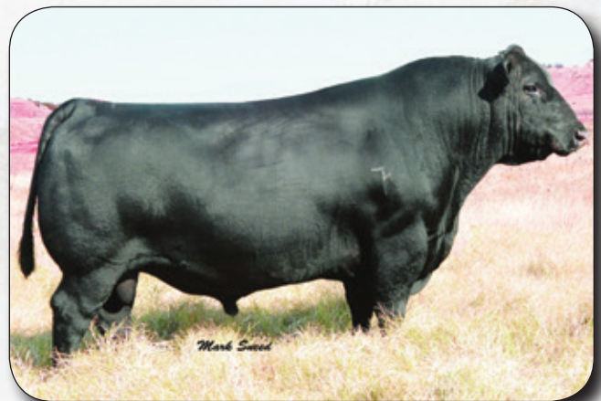
GRANDSIRE TO LOT 18 - KESSLERS FRONTMAN R001

Here is an opportunity to take home a set of Full sisters, bred to make great cows!