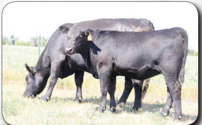
LOT 3C WITH DAM, AMDAHL EMMA 144-445 (LOT 3B)

VIDEOS AND INFORMATION ONLINE AT WWW.AMDAHLANGUS.COM