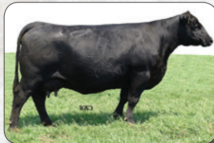
B A LADY 6807 305 RECORD SETTING COW AND DAM OF TOUR OF DUTY