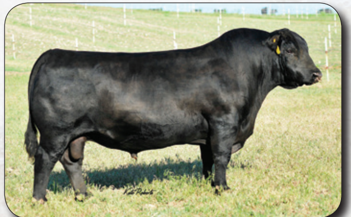
LOT 39 SIRE - MILL BAR HICKOK 7242