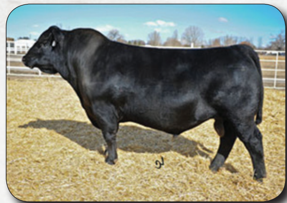
LOT 36 SIRE - KOUPALS B&B EXTRA 0011