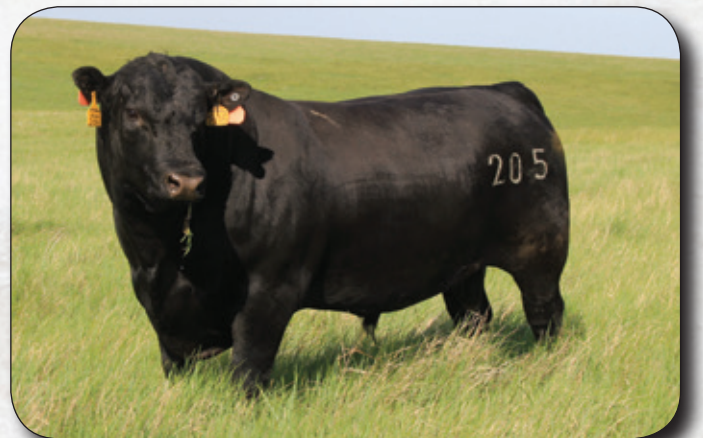
LOT 47 SIRE - BLACKTOP CONSENSUS 205