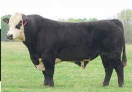
WR CURVE BENDER 8616

is producing good herd bulls and replacement heifers. He is a low birth weight bull so he is our heifer bull as well. His offspring have been cattle buyers' first choice from calves sold from our ranch. He is homozygous. Perfect package. High selling bull from J&N ranch sale 2008.