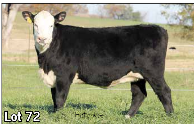
Lot 72 Hotchkiss

Consigned by Triple L Ranch. Homozygous package you don't want to miss. This beautiful, docile heifer comes with a Kansas homozygous heifer inside. This homozygous heifer will make anyone proud. Excellent heifer with great conformation. She's hard to beat.