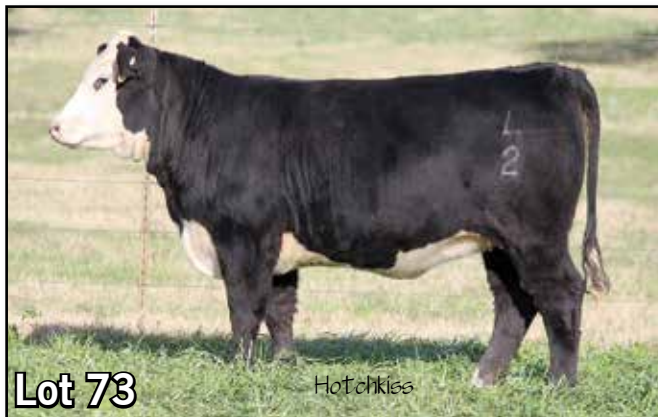
Lot 73 Hotchkiss

Consigned by Triple L Ranch. Own daughter of 6449 and dam is 100% Hereford cow. This heifer has excellent conformation and great color. She will fit any breeding program.