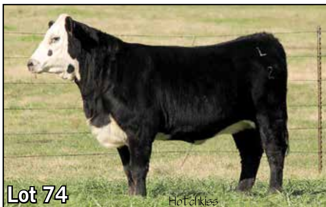
Lot 74 Hotchkiss

Consigned by Triple L Ranch. 56% N/R heifer is as good as they get. Very long and deep bodied, bred to Kansas, will have a heifer calf out of this world. This heifer can start your donor herd or be a good replacement for one of your donor cows.