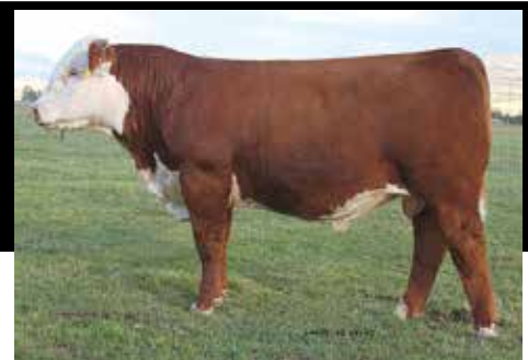
CHURCHILL 1251Y ET