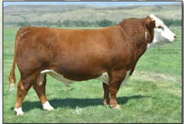
CHURCHILL RED BULL 200Z 43281860 2013 Houston Grand Champion