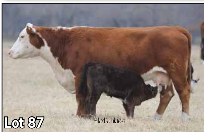
Lot 87 Hotchkiss

Consigned by Triple L Ranch. 100% Polled Hereford cow that has Kiepersol breeding. Her calves always top our market. This year's calf is out of 0449 and bred back to Kansas. Can't go wrong when you see what you're getting.