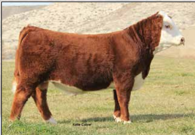
C CJC ILR REGAL 3174 ET 43386550 2014 Houston Grand Champion