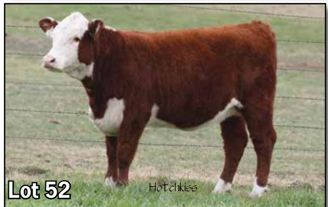
Lot 52 Hotchkiss

Consigned by Triple L Ranch. This female is a 6449 daughter that is outstanding. She will be highly competitive and more importantly will be a phenomenal breeding piece. She is bred to Kansas. If you need to add a little power and substance to your herd, look hard here.