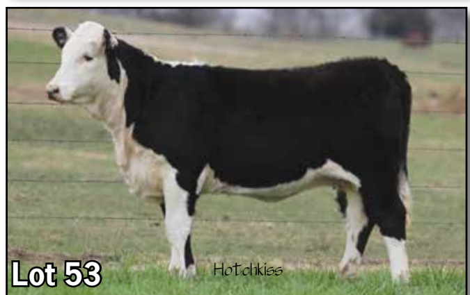
Lot 53 Hotchkiss

Consigned by Triple L Ranch. 9487 daughter bred to Kansas. 81% HB heifer. She is as stout as they get with great color and excellent conformation. Her calves will be great replacements in any breeding program.