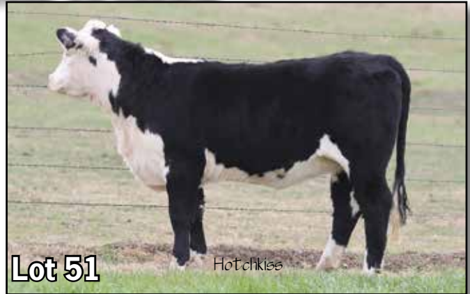
Lot 51 Hotchkiss

Consigned by Triple L Ranch. This is an 81% heifer out of 9487. This heifer is as stout as they get with excellent conformation. She is bred to Kansas and her calves will be great replacements in any herd.