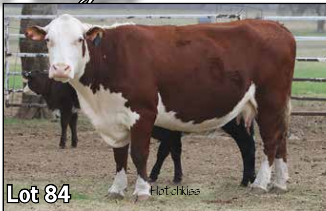
Lot 84 Hotchkiss

Consigned by Triple L Ranch. 100% Polled Hereford cow that has Kiepersol breeding. She has a calf at her side that is out of 0449 and bred back to Kansas. Take a look at her calf now and know there's another one on the way. Don't miss out on this package.