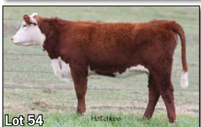
Lot 54 Hotchkiss

Consigned by Triple L Ranch. This is a beautiful cherry red heifer that is bred to Kansas. She is correct in her lines and just flat out good. She will improve any breeding program. She will have a black baby.