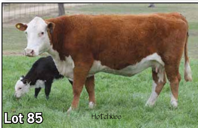
Lot 85 Hotchkiss

Consigned by Triple L Ranch. 100% Polled Hereford. The only reason we are selling is to make room for replacement heifers. She has many more years left to produce great calves. Her calf is out of 9487 and bred back to Kansas. This is the package you need to take home.