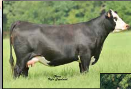
Revolution daughter out of an Angus cow.

LOOK FOR OUR GREAT F1 AND BLACK HEREFORD GENETICS THAT WILL BE AVAILABLE AT THE 2016 BLACK HEREFORD SHOW AND SALE.