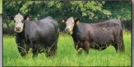
Bismark daughters out of our Hereford cows.