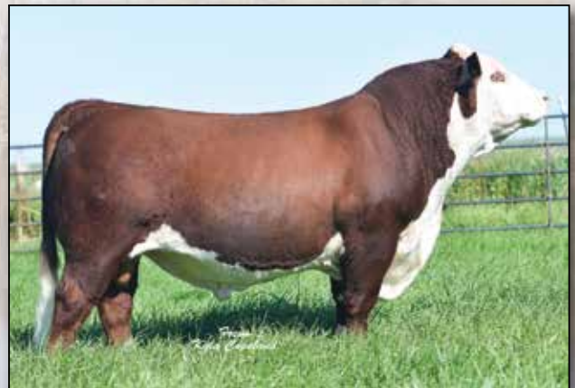
CRR 719 CATAPULT 109 43186342 2013 Fort Worth Reserve Grand Champion