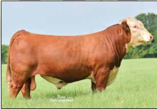
C MILES MCKEE 2103 ET 43270668 2014 Denver Supreme Champion