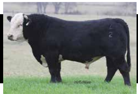
Z209 KEYNOTE SON