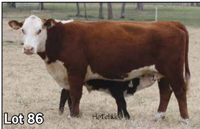
Lot 86 Hotchkiss

Consigned by Triple L Ranch. 100% Polled Hereford cow that works with any bull. She produces great replacement heifers. Her calf at side is out of 9487 and bred back to Kansas. This is a package you don't want to miss out on.