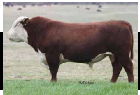
CHURCHILL 1251Y ET