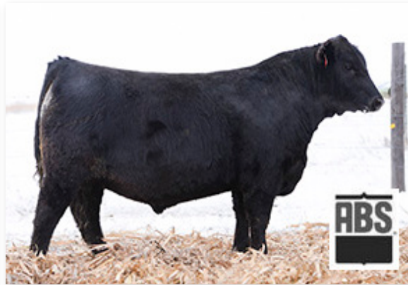
Blacktop Cash Crop