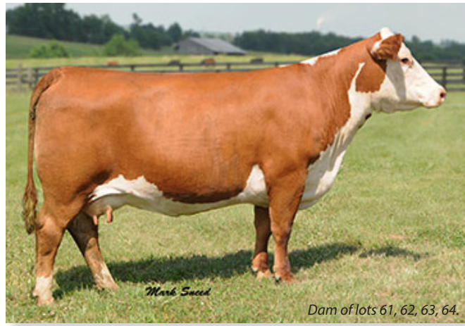
Dam of lots 61, 62, 63, 64.

Top performing ET bull out of a Keynote ET daughtersired by the great GO Excel L1 cowmaker. Vision has added fleshing ability and muscle to his calves.