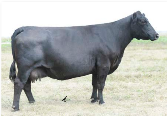
Dam :: Blacktop Katinka Kay 778