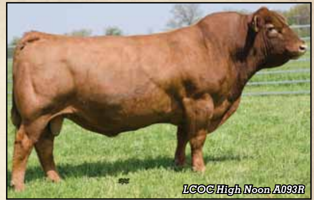
LCOC High Noon A093R

Visitors constantly ask which herd sire has the best disposition. Without a doubt, the answer is always High Noon. High Noon is an impressive bull and gets a lot of attention. He consistently passes his quiet and gentle demeanor on to his offspring. This disposition is combined with both stoutness and carcass quality that put him in the top 5% for marbling and top 8% for REA, which makes High Noon one of the breed's leading sires. High Noon has become a mainstay sire and we can't find any reason to quit using him. You won't find a sire line any more consistent! High Noon has sons and daughters that sell. Semen is available through CRV USA or at Bieber Red Angus Ranch.