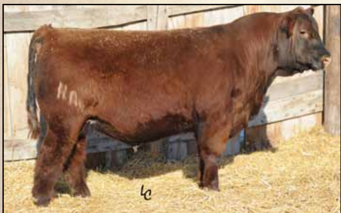
Roosevelt sires cattle that find another gear and really bring traits to the table that affect any operation for profit in a positive way. Lot 16 has the predisposition to produce heavy pay weights in the right package.