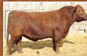
VGW Oly 903