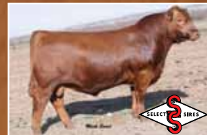
Bieber Outrider W388