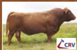
LCOC High Noon A093R