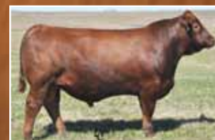
GP Wallace 016