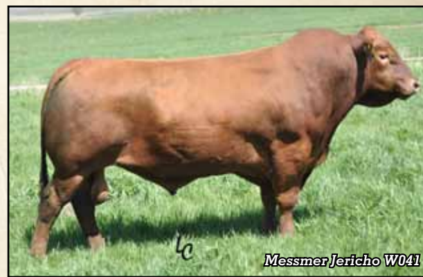
Messmer Jericho W041

Jericho was a member of a tremendous set of 18 full brothers to Joshua, who was Packer's sire. Jericho has his second set of sons on test now and he is calving ease deluxe. This sire is impressive and easy calving and has sons and daughters in the offering. Semen is available through Accelerated Genetics.