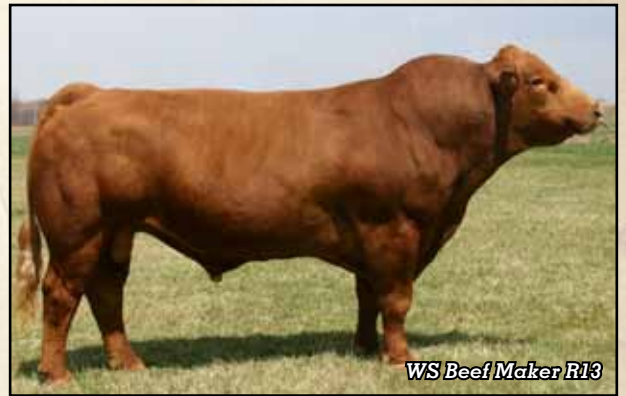
WS Beef Maker R13

Beefmaker is a leading Simmental sire. He was used in the Durham program, and they have sent us a very stout set of sons. If you are considering a SM/AR hybrid this sire is one you shouldn't overlook. Sons and daughters sell.