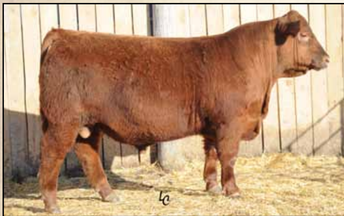
Lot 15's two-year-old Romero dam was a high performing standout herself. A lot of catalogs don't print the %Rank for all the traits, but we really feel buyers need to understand where these cattle are in every trait.