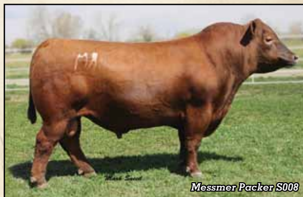
Messmer Packer S008

Packer puts together a nice combination of marbling and muscle. His sons are full of muscle and easy to look at. We purchased the natural service rights on him a couple of years ago and are impressed with the muscle he passes on to his progeny. Packer remains very moderate and easy fleshing. Bieber Mighty Packer X178 and Bieber Packer X375—both Packer sons—topped our March and December 2011 sales, respectively. The Packer sons in this sale are all ET calves. We are also using a full brother to his sire, Messmer Jericho W041. We work hard to make these cattle work for your operation. Packer makes that job easier by producing cattle that fit what our industry is looking for. Packer is a Genex Sire.