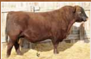
Bieber Roosevelt W384