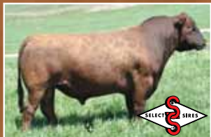
Bieber Rouse Samuri X22