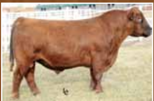
LSF Cyclone 9934W