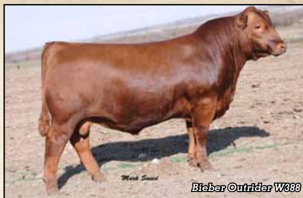
Bieber Outrider W388

If you are looking for calving ease and style, this is your sire. Outrider has done an outstanding job putting those traits together, with marbling and REA in the top 19% and 28% of the breed, respectively. Outrider's sons and daughters sell. Semen is available at Select Sires.