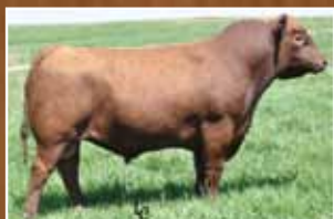
LSF Takeover 9943W