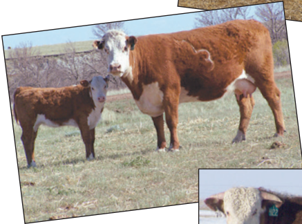
KC L1 Dominette 03035