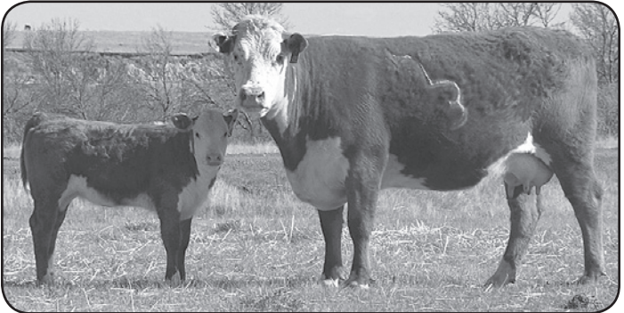
KC L1 Dominette 03035 - Grandam of Lots 23, 25, 58 & 81

A very balanced set of EPD's that rank him in the top 1/3 of the breed in all categories. 3/4 brother sells as Lot 11.