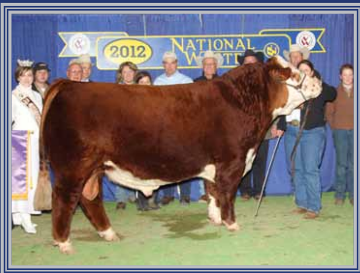
NJW 73S Trust M326 100W — Service sire for Lots 47 and 48