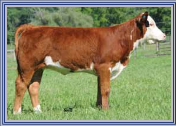
Lot 17 — DJF 73U 7167 Zee Zee 67Z