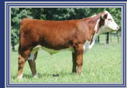
Lot 21A — DJF 401X 4037 Zane 79Z