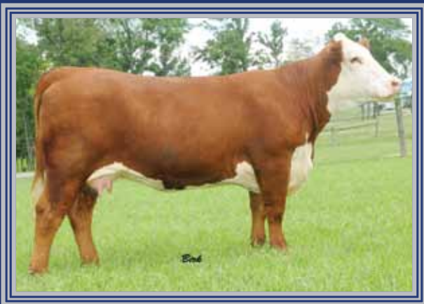
Lot 8 — R Miss Wrangler 749