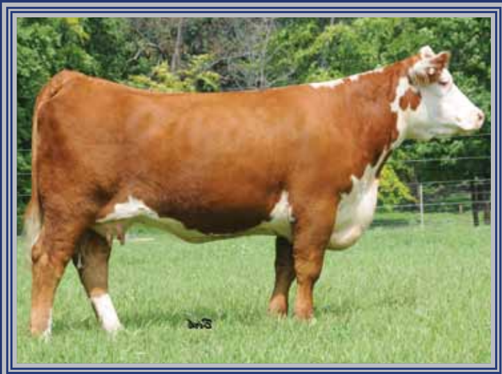
Maternal sibling to Lot 12