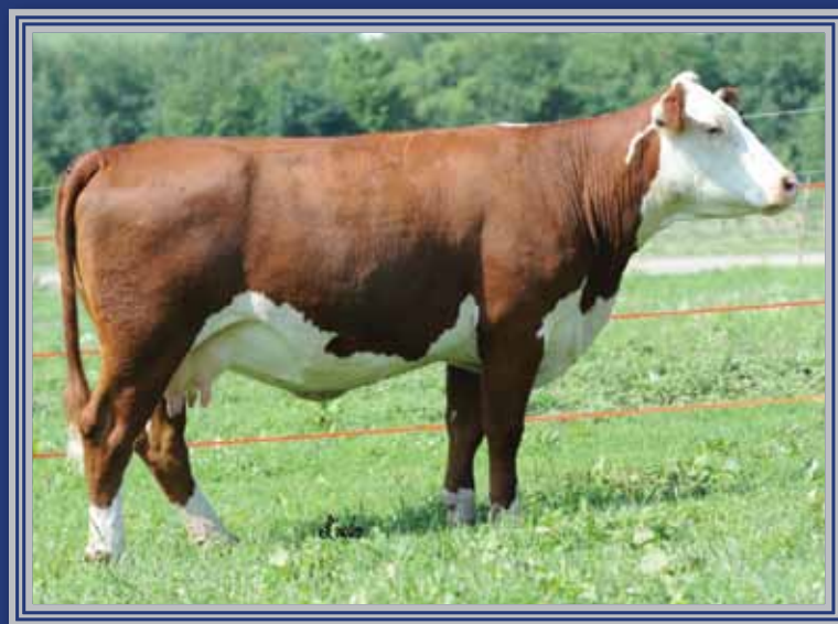
Lot 33 — DS 10H Reba 46U