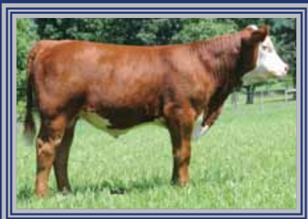
Lot 8A — DJF 749 0002 Zepplin 36Z