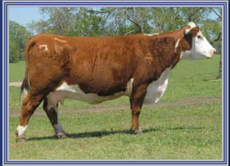
NJW 62E Emma 22L — Dam of Lot 50