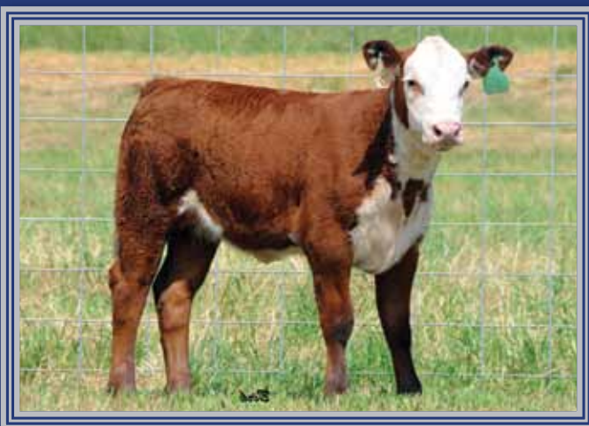
Lot 49A — Z8