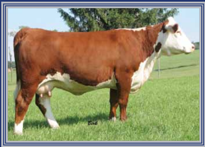
Lot 22 — BBF Saphire 16X