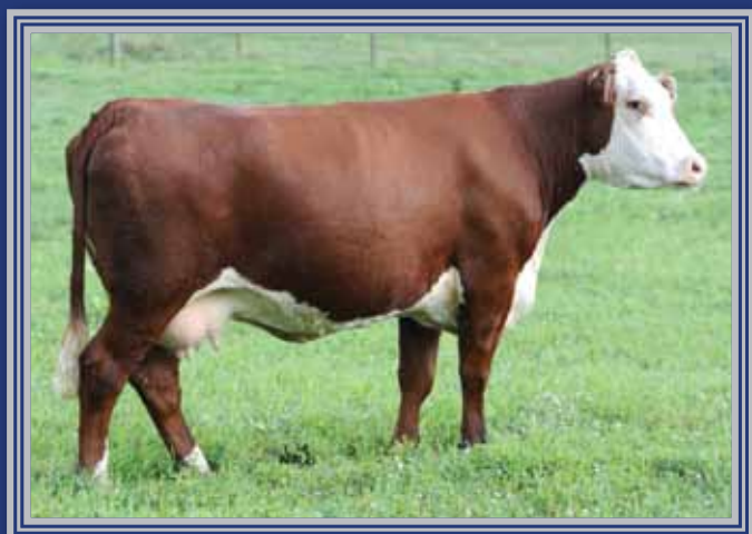
Lot 29 — DS P606 Bonnie 29U