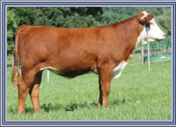
Lot 16 — DJF 326 367U Zandra 19Z