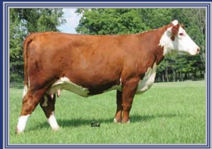
Lot 25 — DJF 408 P12 Aila 0028 ET