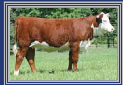
Lot 5A — DJF 079 0002 Zoleen 30Z