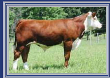
Lot 25A — DJF 0028 0002 Zodiak 37Z