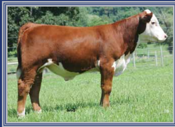
Lot 2A — DJF 369T 158W Zable 34Z