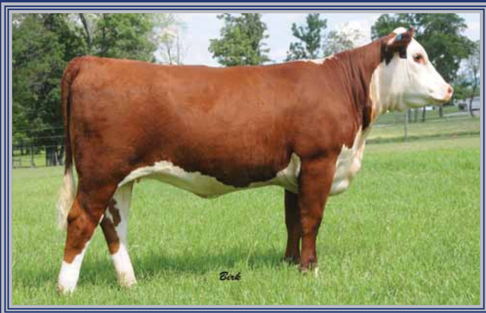
Lot 10 — FFV Revolution Victra Y5