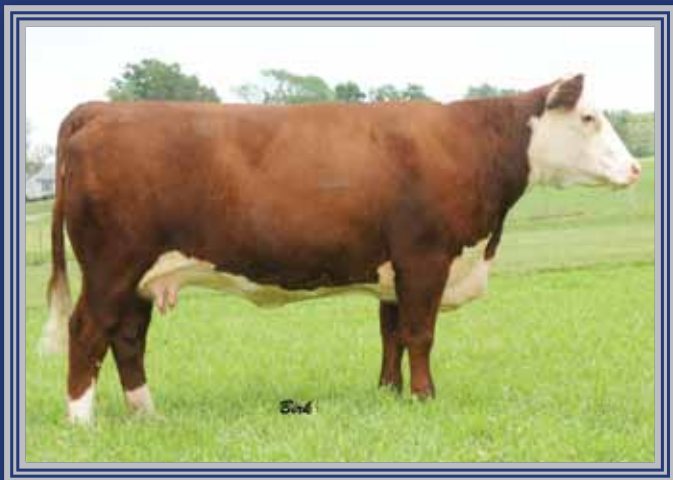
Lot 23 — DJF 4037 T35 Walina 915