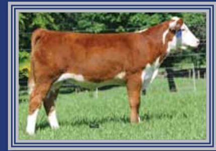
Lot 20A — DJF 0074 81S Zinnia 48Z