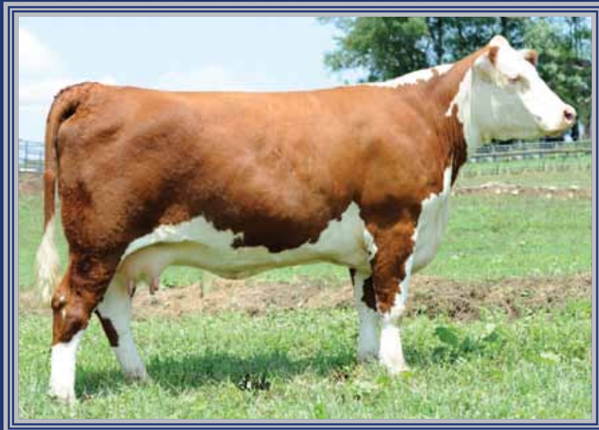
Lot 26 — DS Miss Sadie 1W