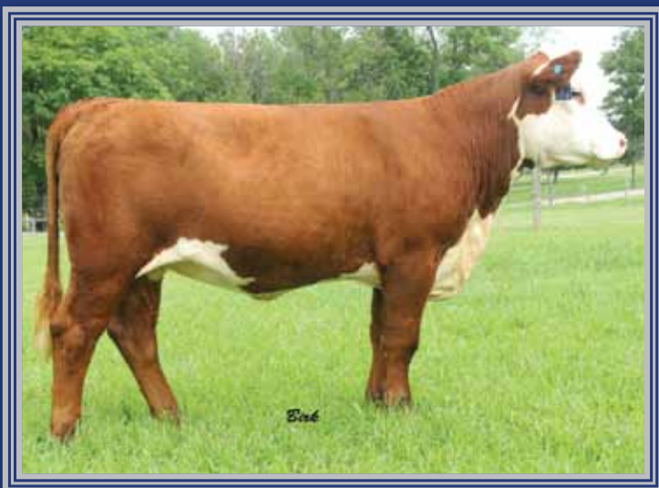
FBF KLH Bella 05PW — Dam of Lot 13