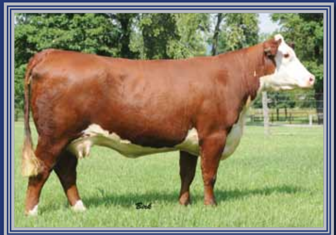
Lot 5 — R Miss Revolution 079