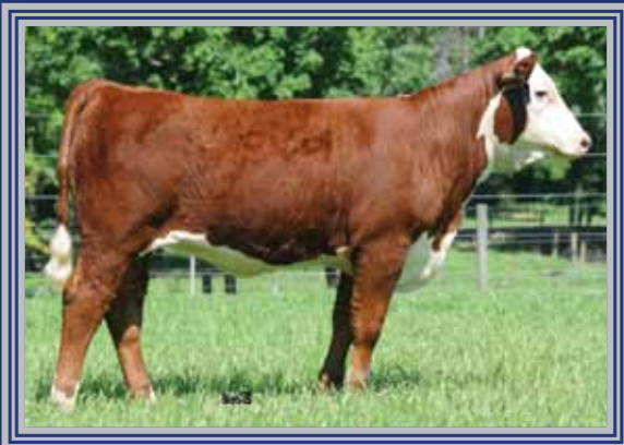
Lot 19 — DJF 109W 17PW Zabrina 17Z