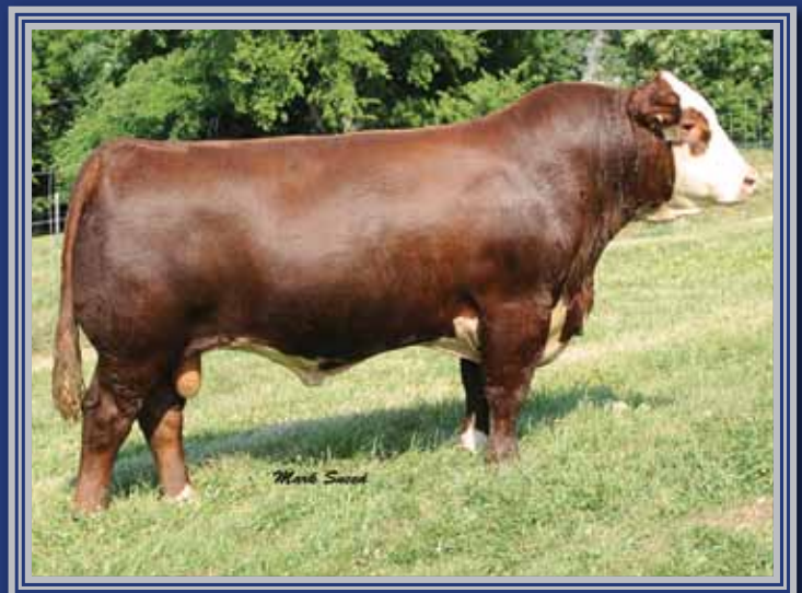
Boyd Masterpiece 0220 — Service sire for Lots 49, 50 and 51