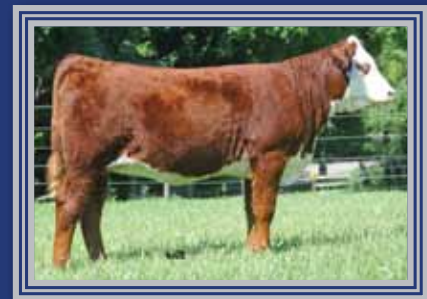
Lot 4A — DJF 942 0002 Zelma 20Z