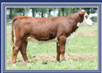
Lot 29A — DS Pure Bonnie 14Z