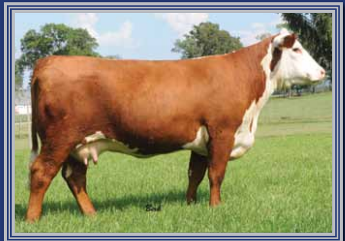
Lot 21 — Goble Easy On The Eyes 401X