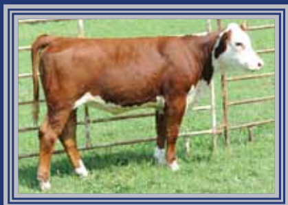
Lot 31 — DS Olivia NR Z1