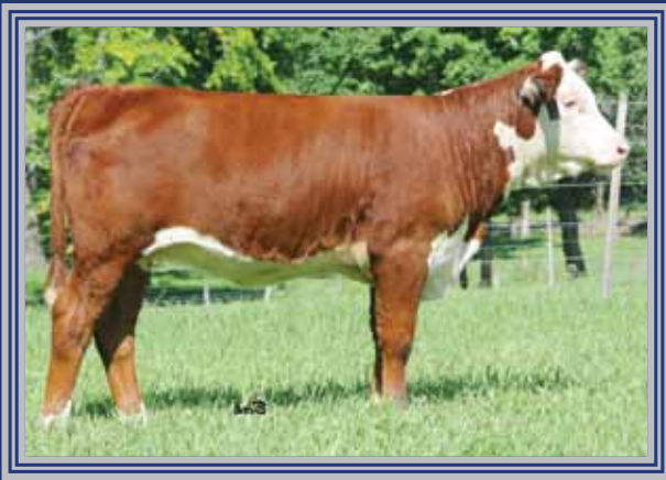
Lot 7 — DJF 944 0002 Zanni 26Z