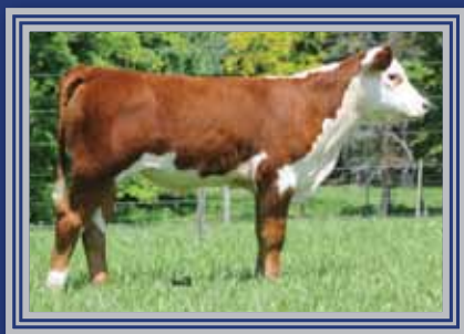
Lot 22A — DJF 16X 2L ZED 60Z