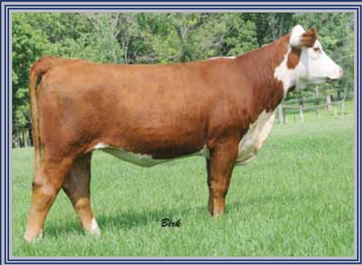
Lot 11 — DJF 388T 6014 Janessa 87Y