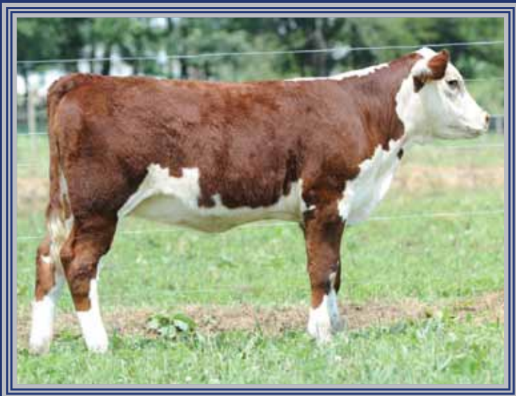
Lot 34A — DS Dolly 38Z NR