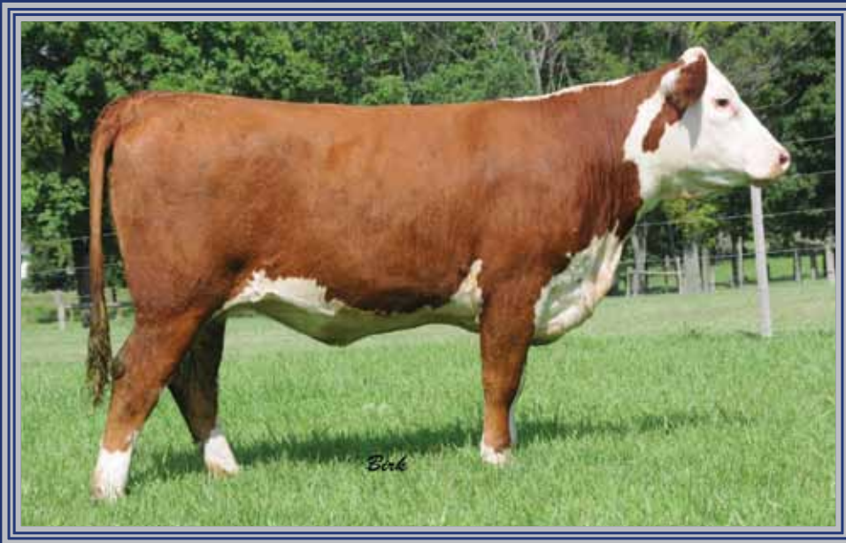
Lot 9 — SRM RMK 511 LUCKY STRIKE 1101