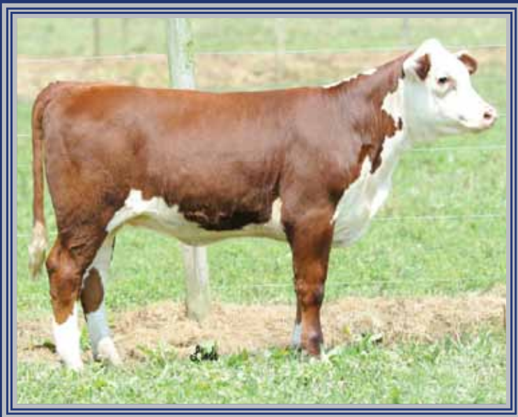
Lot 35A — DS 98U Holly 5Z