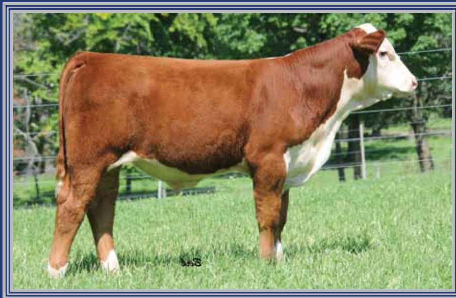
Lot 15 — DJF 32T 367U Zeal 54Z ET