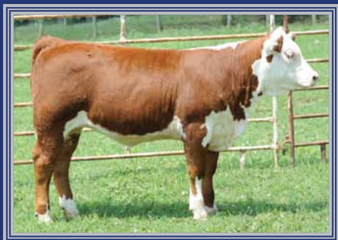
Lot 30 — DS Kahuna Rosey 33Z