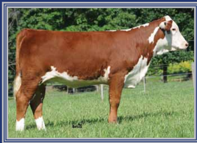
Lot 1A — DJF T77 158W Zahara 45Z