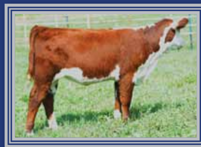
Lot 27A — DS Bonnie 47Z NR