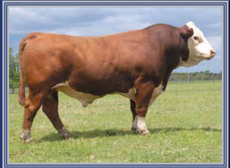
THM Solution 6056 — Sire of Lot 50A