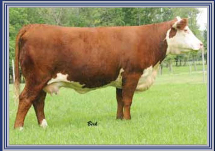
Lot 4 — DJF R23 R12 Wyla 942