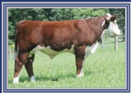
Lot 23A — DJF 915 0002 Zigmund 35Z