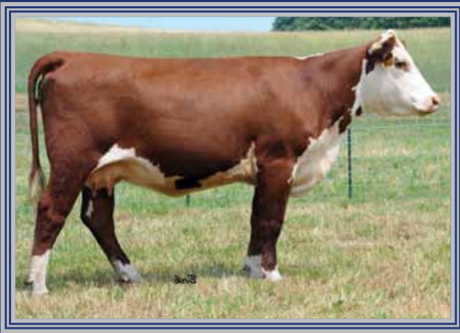
Lot 48 — RVP 45T Glorious 103X