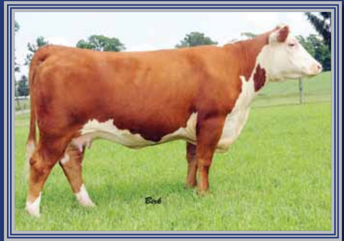
Lot 20 — Grassy Run Misty Belle 0074