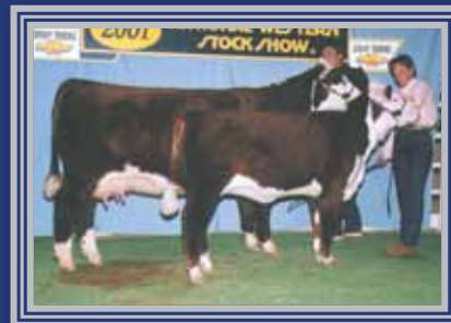
CS Miss Supreme 28G — Great Grandam of Lot 28A