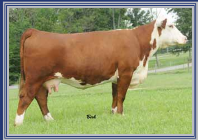
Lot 24 — MR 3030 Janell 6014