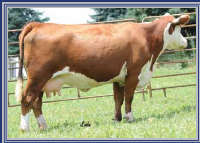
Lot 28 — DS Rosey 7U ET