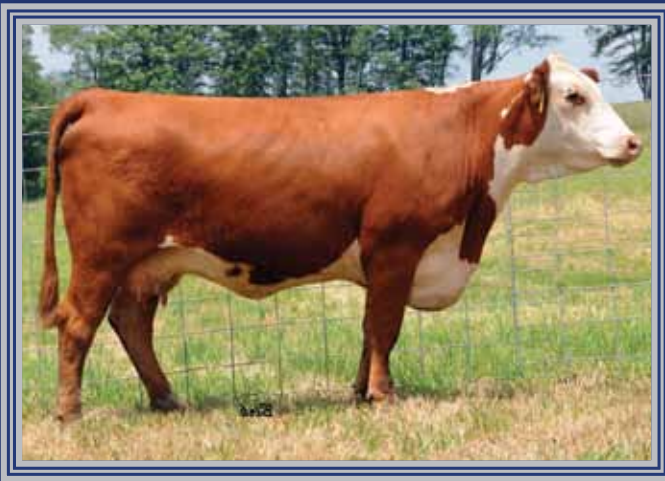
Lot 47 — Glenview 5052 Victoria W91 ET