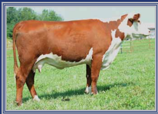
Lot 27 — DS 145R Bonnie 7W