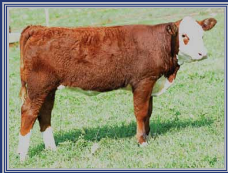
Lot 32A — DS 98U Keysha 8Z