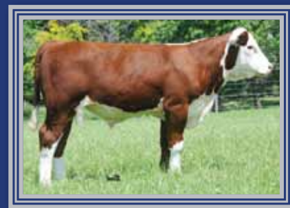
Lot 24A — DJF 601411 V4 Zion 50Z