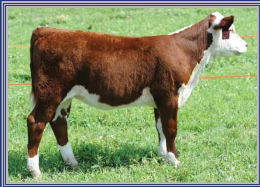
Lot 26A — DS Sadie 39Z NR