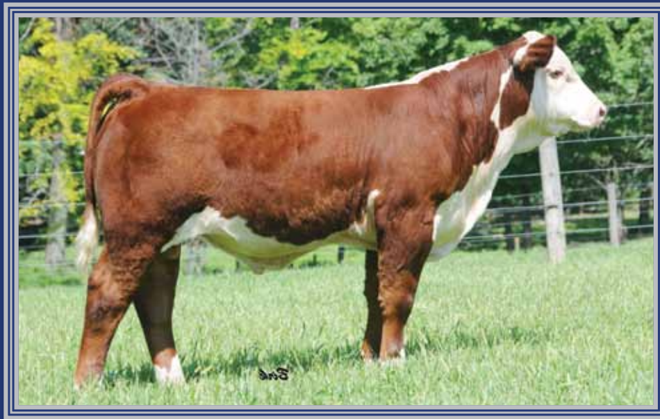
Lot 14 — DJF 181R 1ET Zenith 56Z ET