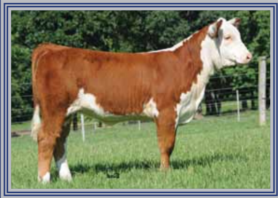
Lot 18 — DJF P75 1009 Zippora 55Z ET