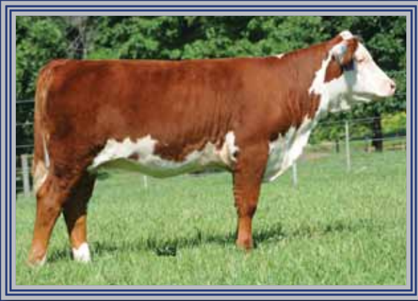
Lot 6 — DJF 914 0002 Zola 28Z