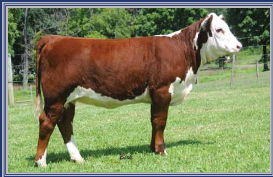
Lot 12B — DJF Agatha 52A ET