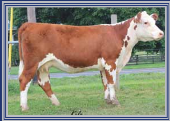
Lot 54 — KD Ariel 5Y