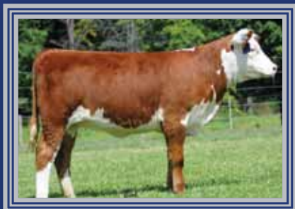
Lot 4A — DJF Annora 20A