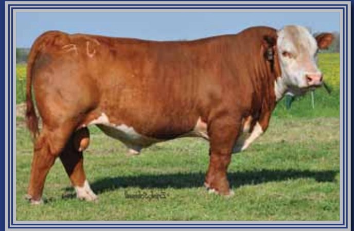
NJW 98S R117 Ribeye 88X ET

CE 4.9; BW 1.8; WW 59; YW 80; MM 29; M&G 59; FAT -0.017; REA 0.29; MA