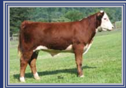
Lot 16A — DJF Prime 23A