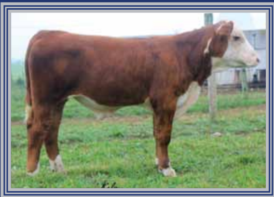
Lot 53A — KD Tonka 10A

Pending — March 27, 2013 — Tattoo: LE 10A