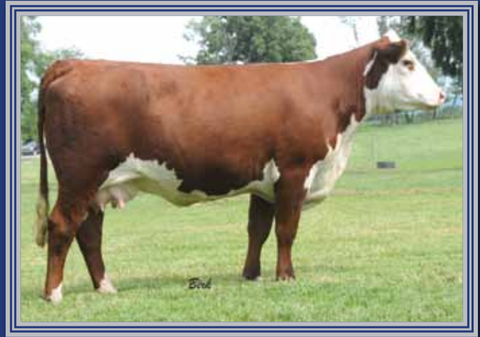
Lot 23 — DJF 196T 305 Vicky's Gem 1011