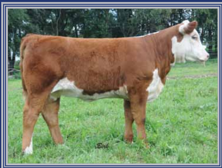
Lot 38 — DS Excel Lass 42A