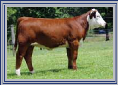
Lot 10A — DJF Aisha 66A