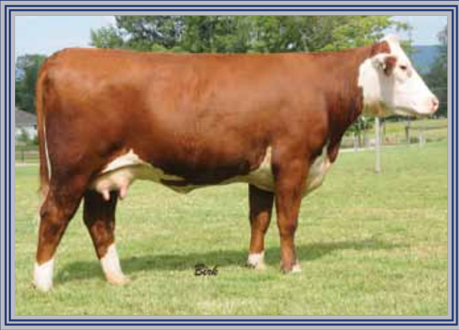
Lot 10 — DJF R23 64P Mia 0029