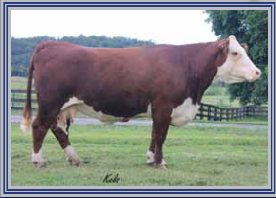
Lot 52 — JD Victoria 3T

P42852448 — Calved: March 17, 2007 — Tattoo: LE 3T