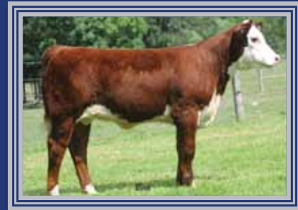
Lot 19A — DJF Arianna 11A