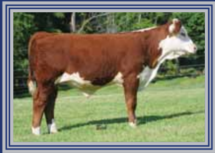
Lot 13A — DJF Glen 9A