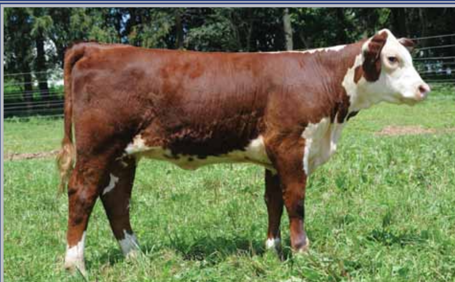
Lot 36 — DS 98U Holly 2A