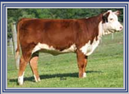
Lot 3A — DJF Ashlyn 29A