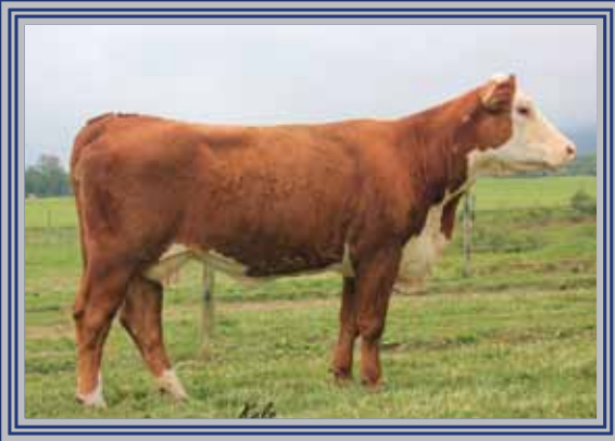
Lot 53 — KD Tina 16X

P43144541 — Calved: May 1, 2010 — Tattoo: LE 16X