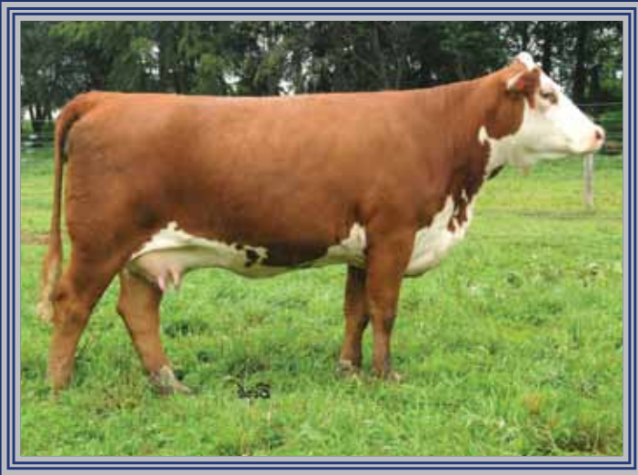
Lot 31 — CS 38T Sauly 27X