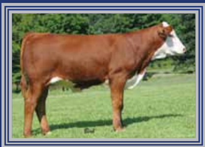
Lot 17A — DJF Titan 55A