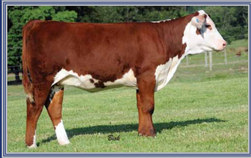
Lot 12A — DJF Divine 49A ET