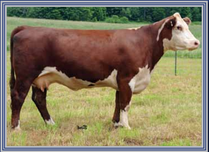
Lot 50 — JPF 106 Darlin 1W