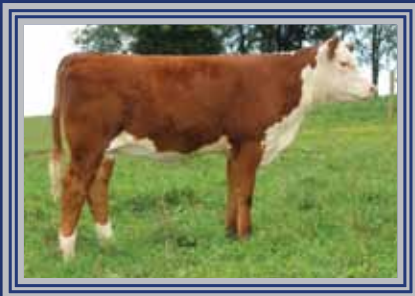
Lot 26A — DS 38T Reba 13A