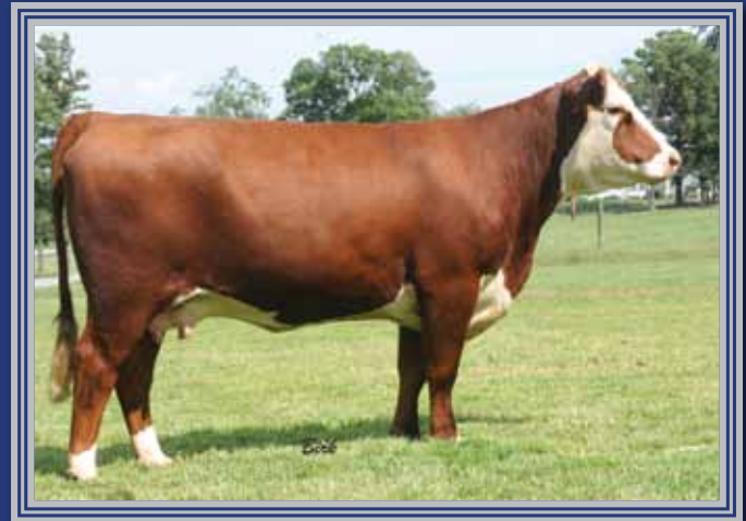
Lot 20 — E 832 Miss Boulder X20