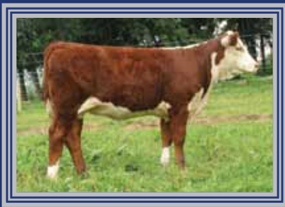
Lot 25A — DS 98U Joy 6A