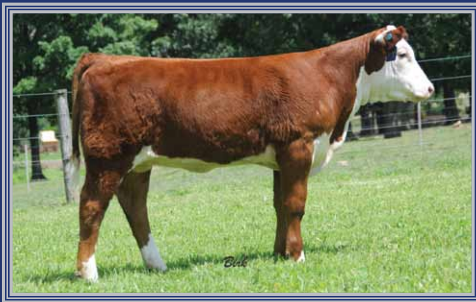
Lot 7 — DJF Bright Lady 70A