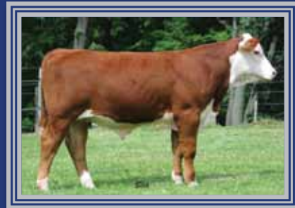
Lot 24A — DJF Actor 25A