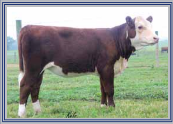
Lot 52A — KJD Valerie 1A

Pending — Calved: Feb. 6, 2013 — Tattoo: LE 1A