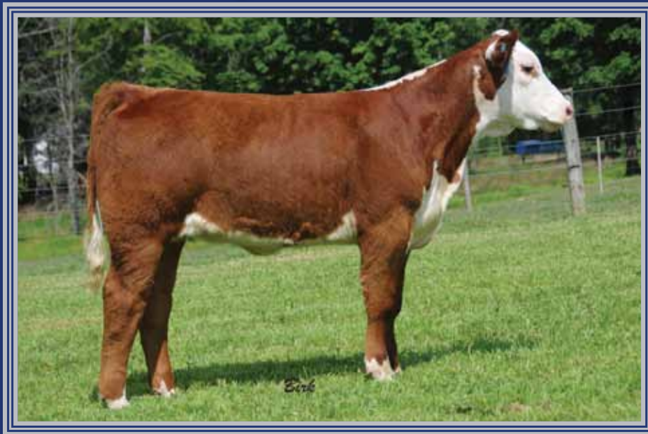
Lot 6 — DJF Adele 33A