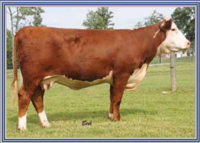
Lot 11 — DJF 8E 2069 Vienna 1038 ET