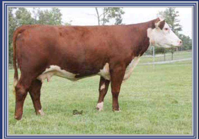
Lot 24 — DJF 8011 N1 Zylina 0109