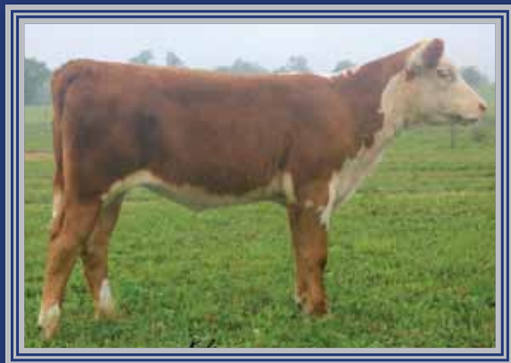
Lot 54A — KD Amber 13A