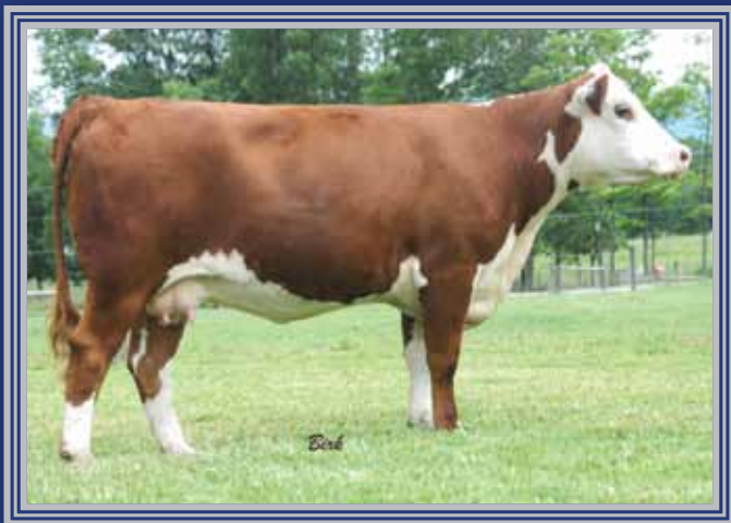
Lot 4 — DJF 388T 143M Lila Rose 86Y