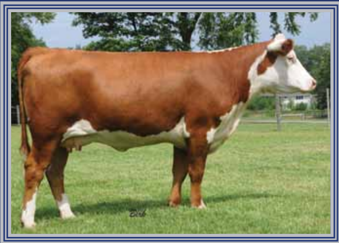
Lot 14 — FPH Miss Vicki Boomer P606 Y108