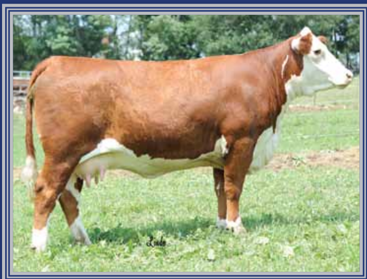
CS Miss She's So Pretty 18X ET

A great P606 daughter that is a leader in our donor battery. FLAT AWESOME!