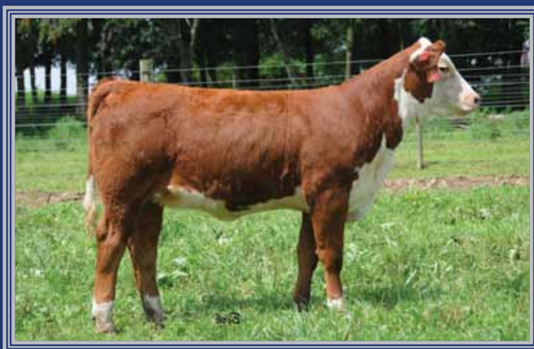
Lot 37B — DS 4R Gracie 12A