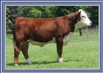
Lot 11A — DJF Sumo 12A