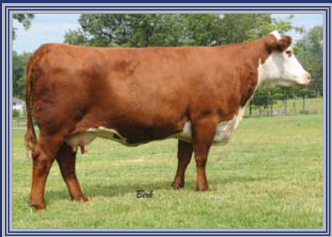
Lot 17 — R Miss Patend 326