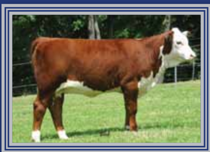
Lot 21A — DJF Amelia 32A