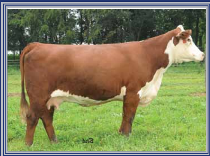
Lot 30 — CS Rocks Bonnie 69U