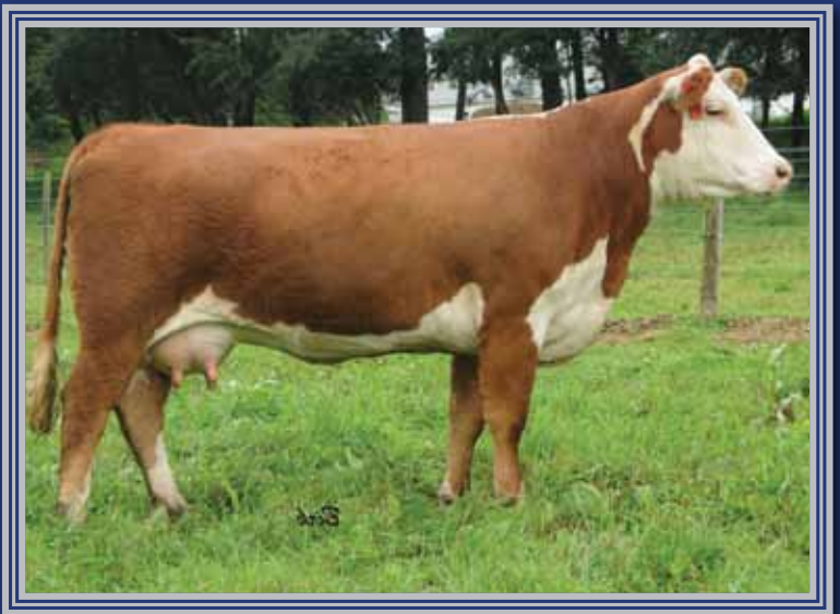
Lot 28 — DS P606 Lady 81W ET