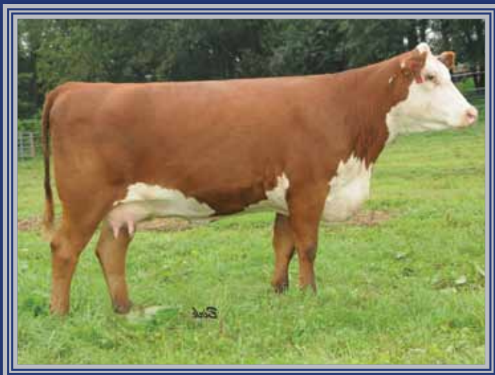
Lot 29 — DS 38T Britney 44X