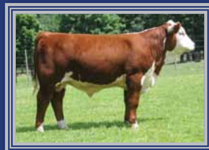
Lot 9A — DJF Shawnee 14A