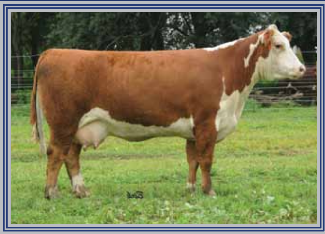
Lot 25 — DS P606 Joy 37U