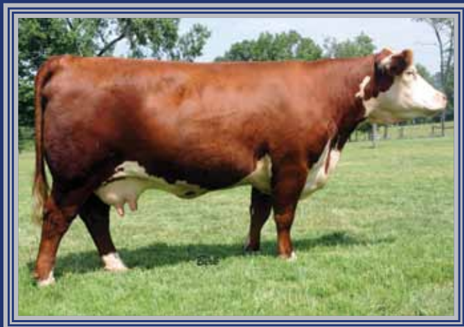
Lot 9 — DJF R23 S28 WINNIE 914