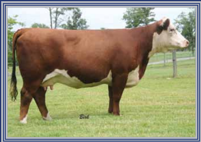
Lot 18 — CDC Dahlia 109W