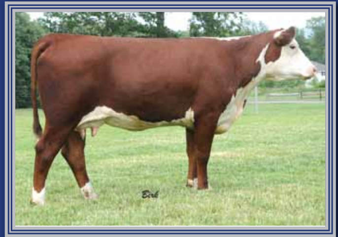
Lot 15 — WWF Dalilah 4Y