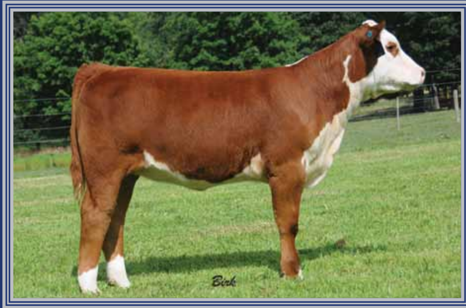
Lot 5A — DJF Arista 48A ET