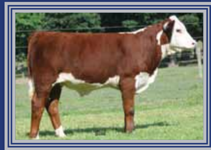
Lot 23A — DJF Sailor 57A