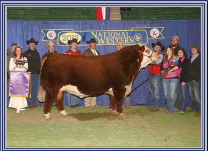
RST Time's A Wastin' 0124 — 2013 Denver Supreme Champion Service sire to Lot 51