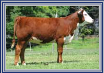
Lot 18A — DJF Aleah 56A