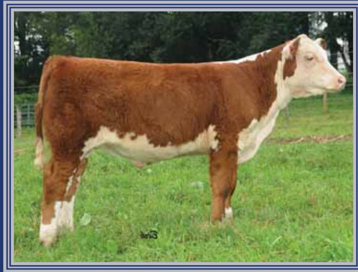
Lot 46 — Steer