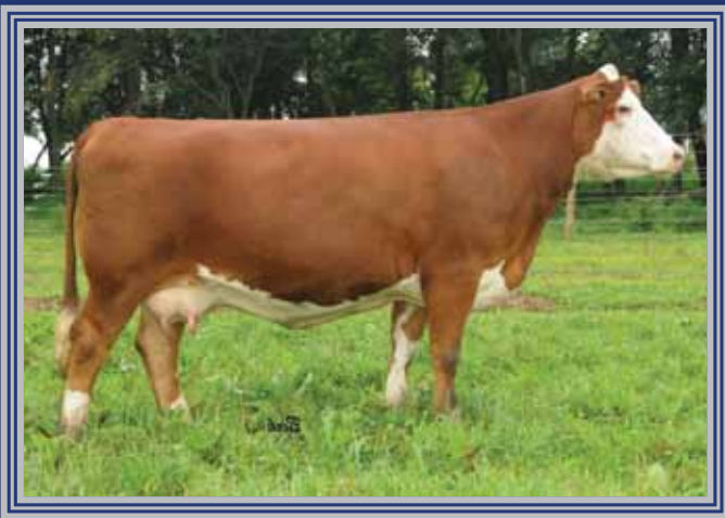
Lot 26 — DS 145R Reba 44W