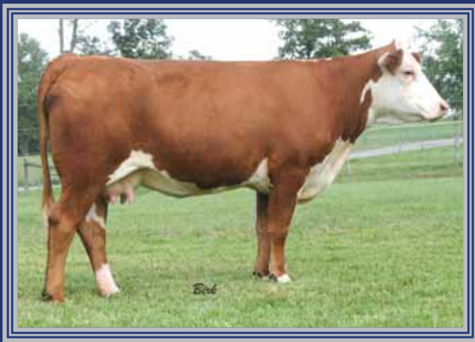
Lot 3 — DJF 158W 72RT Cadence 80Y