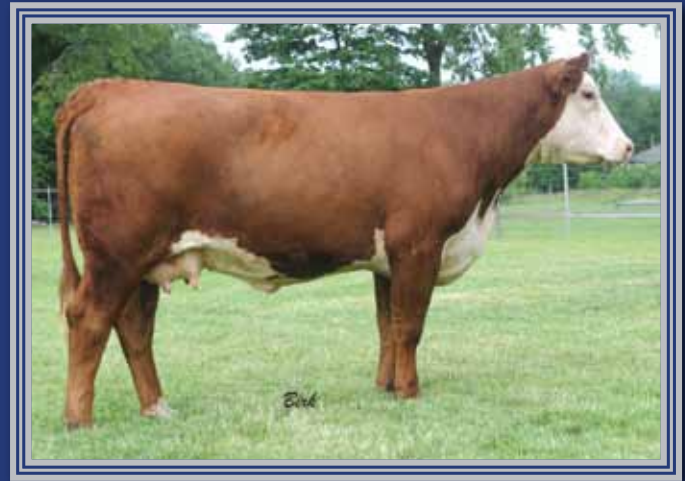
Lot 19 — DJF CHAN 602D Jayla 1036 ET