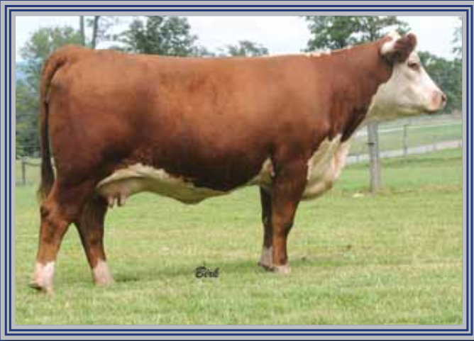
Lot 13 — DJF M326 32T Glee 1033 ET