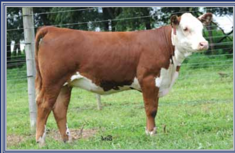
Lot 37A — DS 719T Miss Fancy 10A

These are special heifers that will show, but come back to the brood cow herd as tremendous producers. We are offering choice and my granddaughter, Rylee, will get the other for the this coming show season.