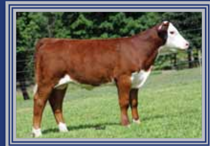
Lot 20A — DJF Apalonia 73A