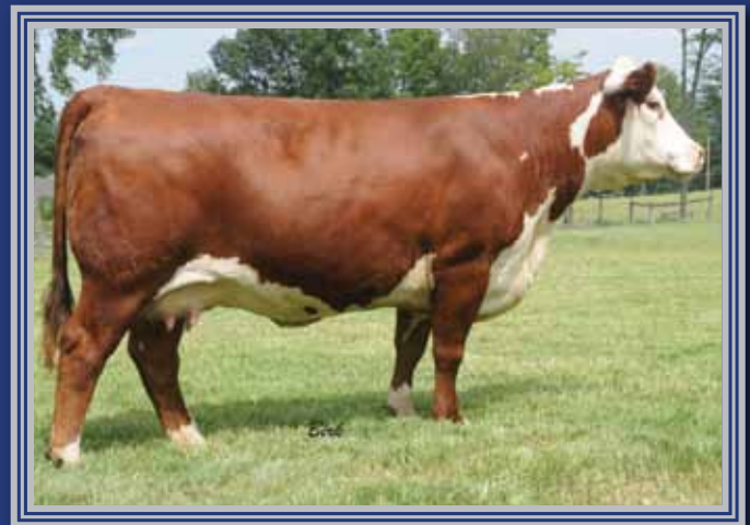
Lot 16 — THM 163M Vickyetta 9494