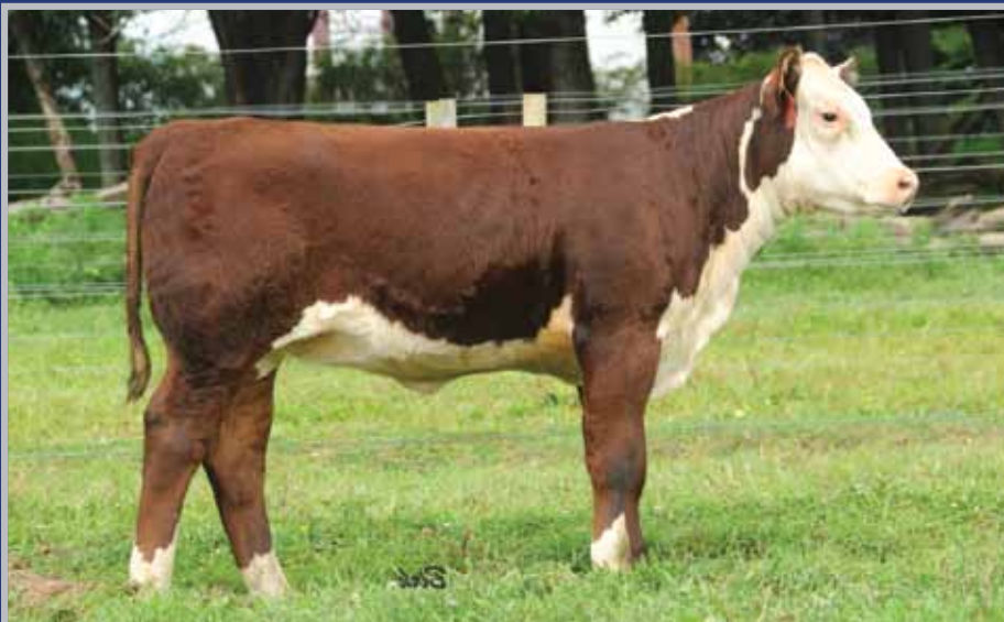
Lot 35 — DS Rev Lass 1A