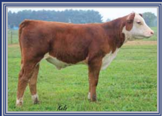
Lot 55A — KD Bandit 14A