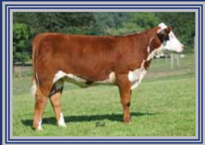
Lot 14A — DJF Auralee 26A