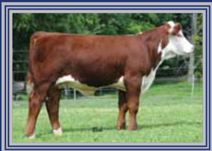
Lot 22A — DJF Victory 30A