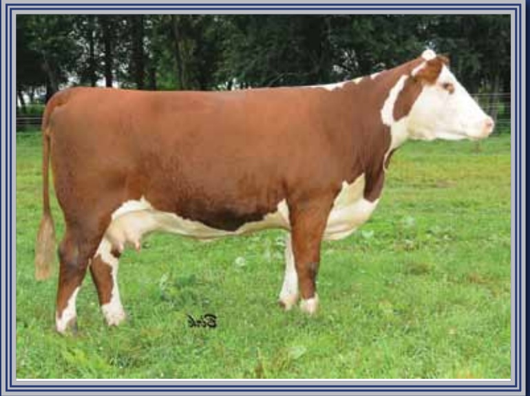
Lot 27 — CS 29F Sauly 91U