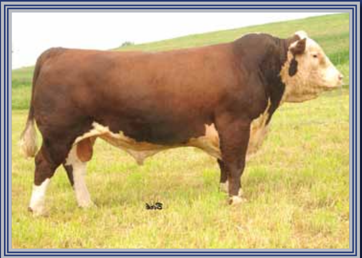
Glenview K16 Power Pac X97 ET — Sire to Lot 51A