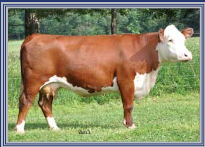
Grandam of Lot 21 — Boyd Fasionation 6090