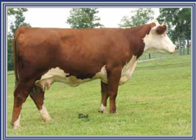
Lot 22 — DJF 408 P12 Yureeka 1022 ET