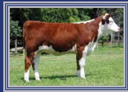
Lot 15A — DJF Adora 31A