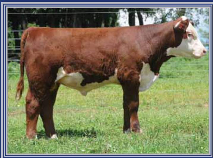
Lot 29A — DS Tanker 21A