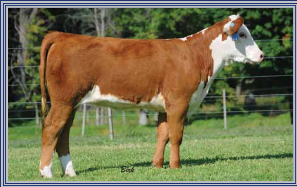
Lot 8 — DJF ABRIE 58A ET