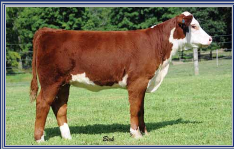
Lot 5B — DJF Careless Whisper 50A ET