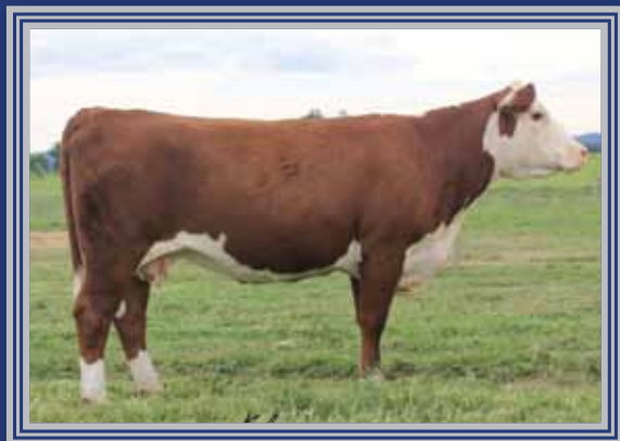
Lot 55 — KD Brandi 9X ET