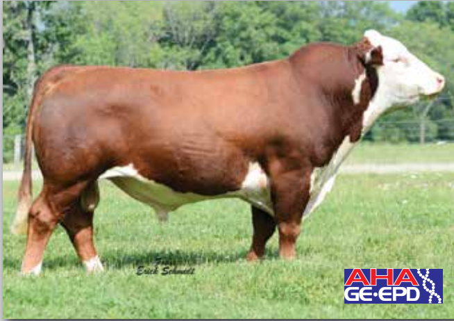
LCC 2T LONGDRIVE 3Y ET