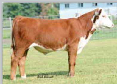
Lot 12A — DJF 2001 53Z Banjo 32B