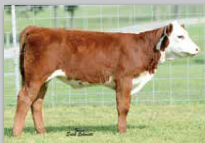
Lot 24A — KD Belinda 12B