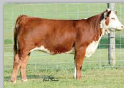
Lot 4A — DJF 414X 1107 Blair 4B