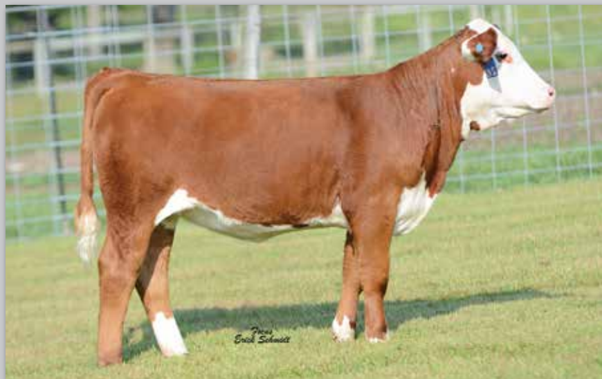
Lot 9 — DJF TKL 533P 749 Miss Me 19B