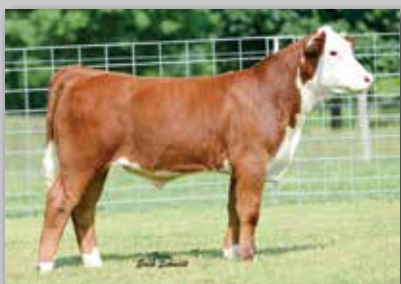
Lot 19A — DJF 2001 23Z Bogey 26B