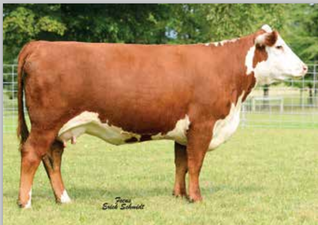
Lot 15 — DJF 52U 158W ZINA 49Z