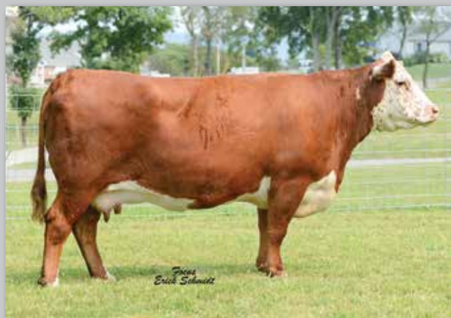
Lot 11 — NJW 55N Durango Spirit 52U