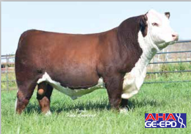
CRR 719 CATAPULT 109

CE 2.3; BW 2.3; WW 52; YW 84; MM 20; M&G 46; FAT 0.023; REA 0.31; MARB 0.12