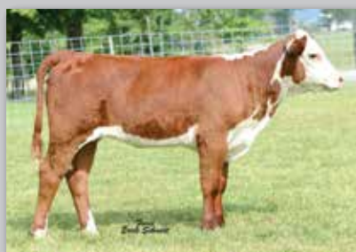
Lot 23A — KD Bella 22B