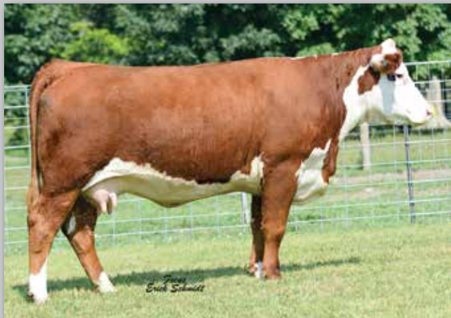
Lot 14 — DJF 931 41W ZELDA 24Z