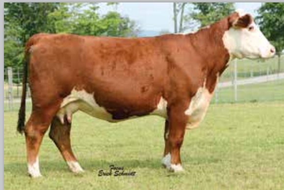
Lot 20 — DJF 388T 35S Sterling 89Y