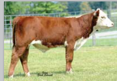
Lot 25A — KD Billy 2B