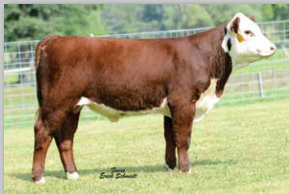
Lot 22 — KJD Babe Ruth 8B