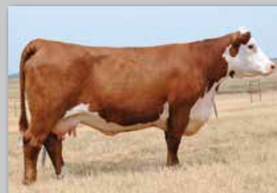
Dam of Lot 6 and 7 — STAR 19R Carlene 137T ET

MSU TCF TITLEIST 2T ET (CHB)(DLF,HYF,IEF) S&S KODIAK 49J (SOD) LCC 2T LONGDRIVE 3Y ET (DLF,HYF,IEF) MSU TCF RACHAEL ET 56N (DLF,HYF,IEF) P43187907 LCC MERRY TIME 244 (DLF,HYF,IEF) MSU BR HALLMARK 25H (CHB) MSU BR MERRY 24K SB 122L GIT-R-DONE 19R ET (CHB)(DLF,HYF,IEF) REMITALL ONLINE 122L (SOD)(CHB)(DLF,HYF,IEF) STAR 19R CARLENE 137T ET (DLF,HYF,IEF) RU 20X ERIN 54E P42774902 GHC MISS CARLA 35J (DLF,HYF,IEF) WTK 75A CONTINENTAL 66F (CHB) GL 127U KAREN 25Y