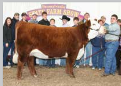
Dam of Lot 9 — R Miss Wrangler 749