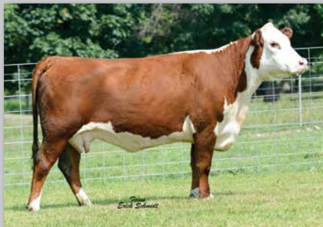
Lot 10 — JR Princess Anne