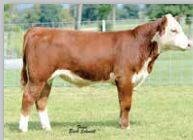
Lot 13A — DJF 0124 4Z Rookie 16B