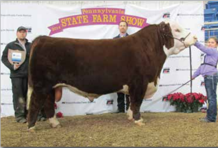
DS Swagger 56Y