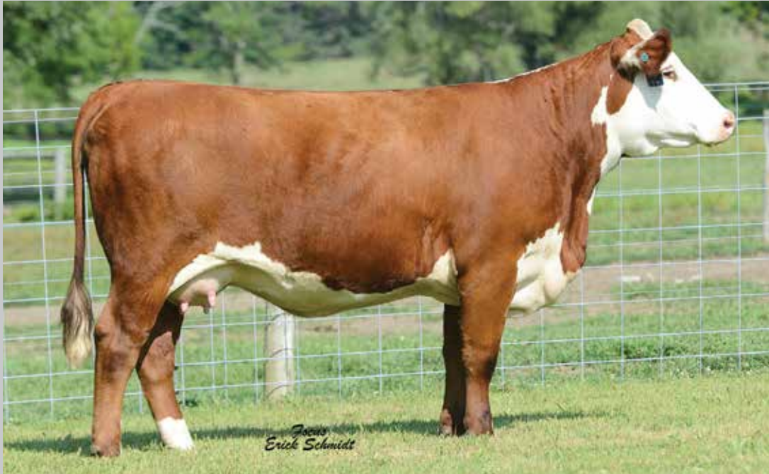
Lot 1 — DJF 64S 8094 Zarla 77Z