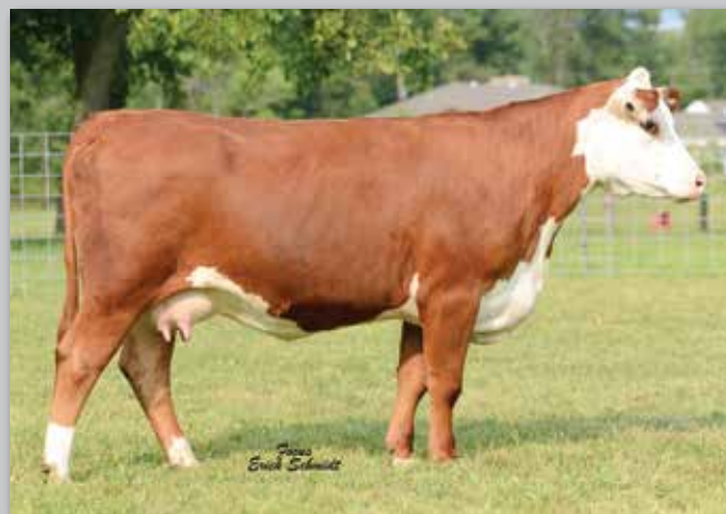
Lot 17 — DJF 0057 0002 Zora 51Z