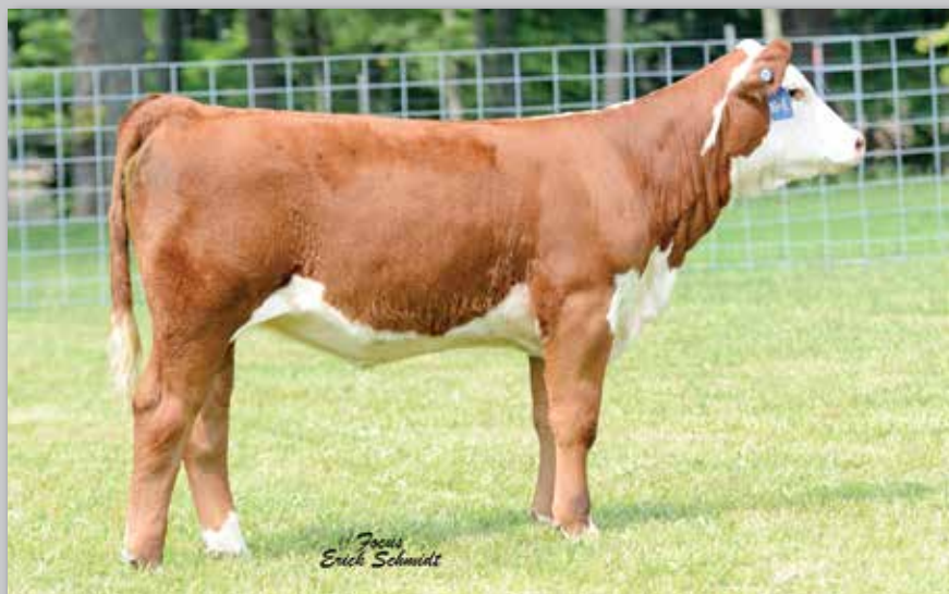
Lot 6 — DJF 3Y 137T Bailee 51B ET