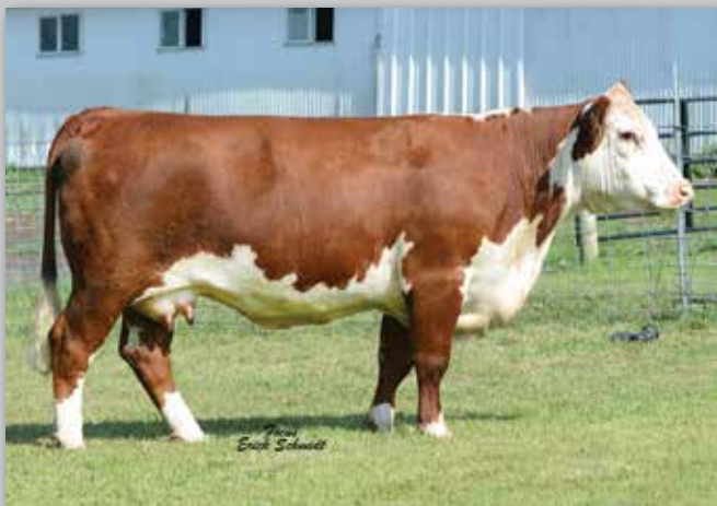
Lot 23 — CLF GCC Miss Vicci X337