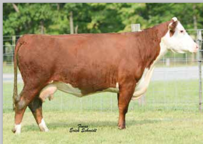
Lot 16 — MHPH Ms 102S Lass 1021U