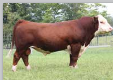
RST 44U Durango 2001 — Sire of Lot 14A, 15A, 17A, 18A, and 19A