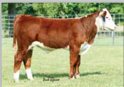
Lot 18A — DJF 2001 Z01 Benson 63B