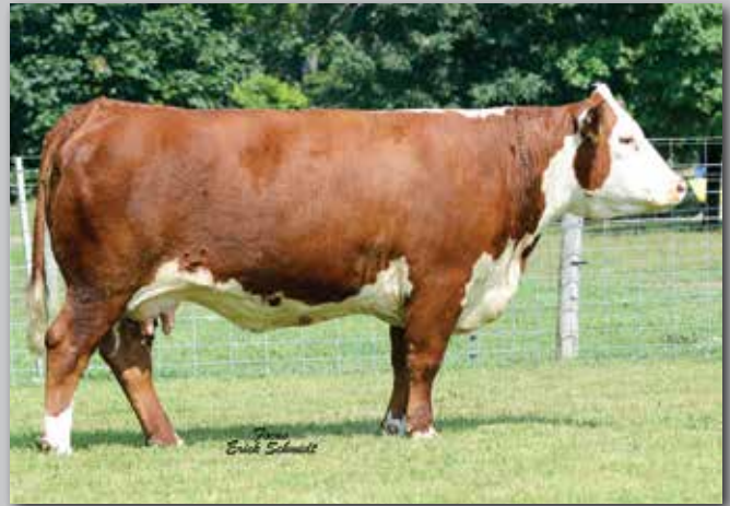
Lot 25 — C Beyond Platinum 9144 ET