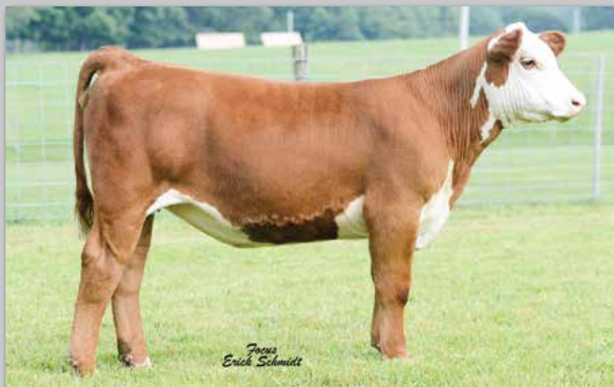
Lot 7 — DJF Bonita Carlee 24B ET