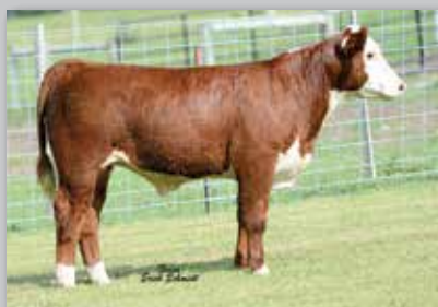
Lot 3A — DJF 225 28U Benny 10B