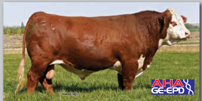
NJW 73S M326 Trust 100W ET

CE -2.8; BW 3.6; WW 65; YW 119; MM 30; M&G 63; FAT -0.043; REA 1.29; MARB 0.21