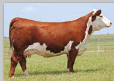
STAR KKH SSF Olivia15U ET — Dam of Lot 5