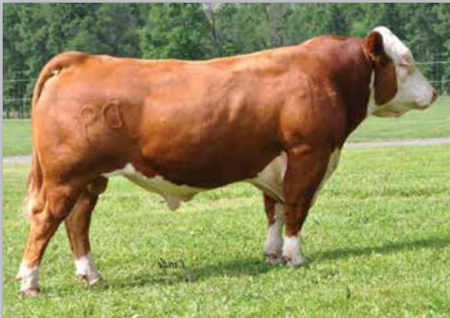
DS SPARTAN 8011

CE 0.1; BW 3.3; WW 54; YW 89; MM 20; M&G 47; FAT 0.027; REA 0.71; MARB 0.05