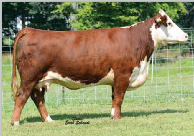
Lot 3 — C&T 86S Latte 28U