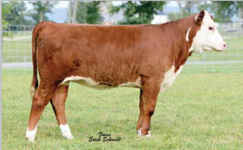
Lot 1A — DJF 2001 77Z Bria 27B