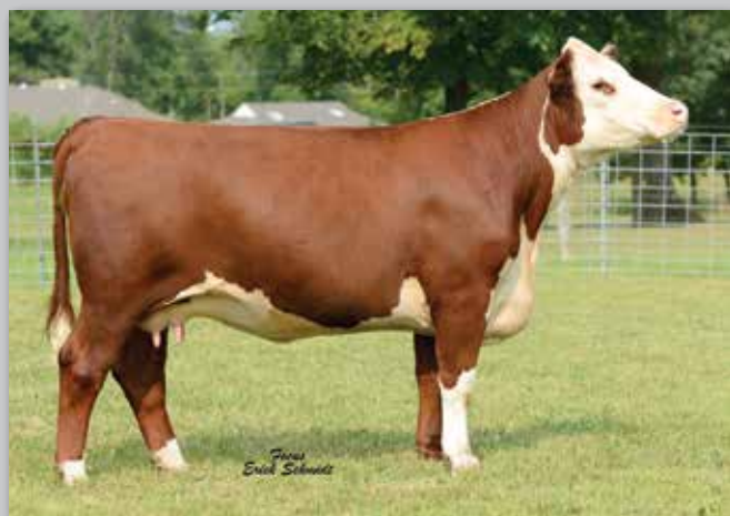
Lot 19 — DJF R07 144U Zafara 23Z