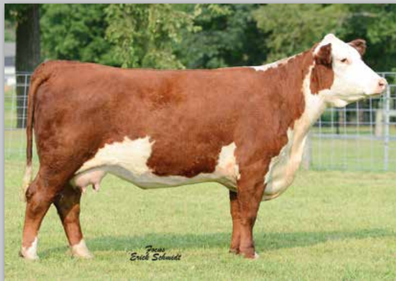
Lot 5 — DJF 158W15U Stunner 101Y ET