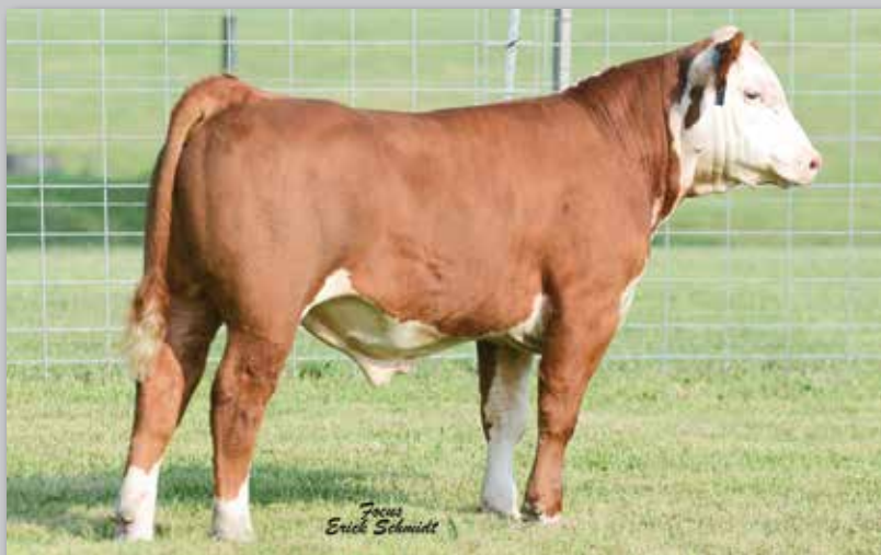
Lot 2 — DJF 3Y 64S Tee Time 3B ET