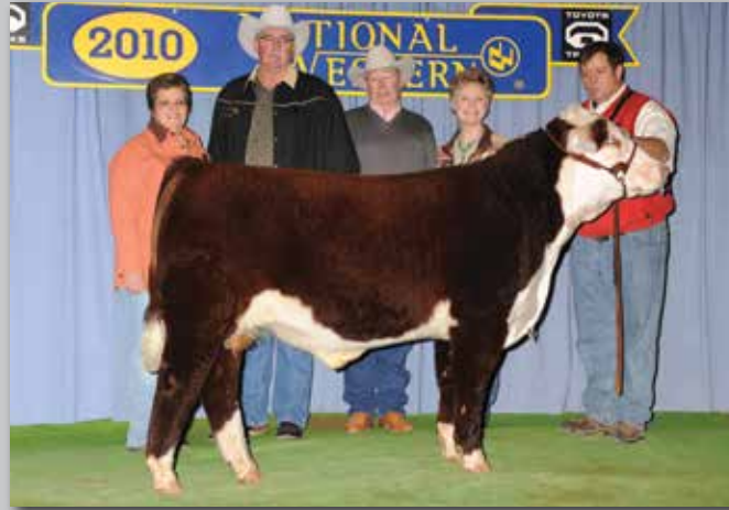
GV WSF 430 NO RISK 9366 ET — Sire of Lot 27 and 28