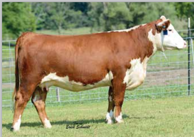
Lot 12 — DJF P75 1009 Zofia 53Z ET