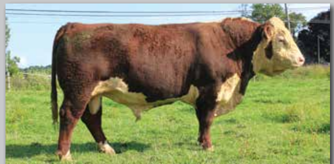
KD Dollar Bill 15Y ET

CE -4.3; BW 5.4; WW 48; YW 81; MM 20; M&G 44; FAT 0.009; REA 0.47; MARB -0.02