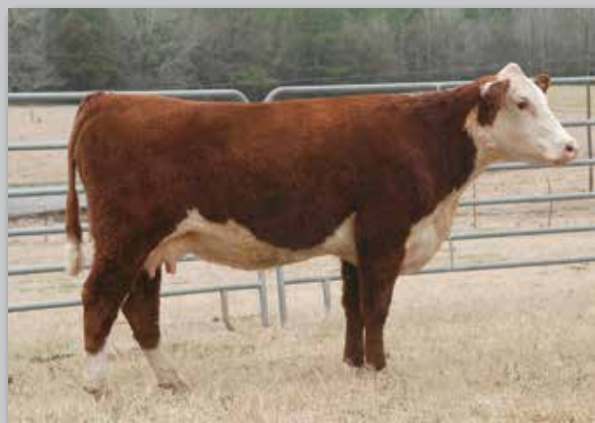
DS 4P Joy 74Y — Dam of Lot 32