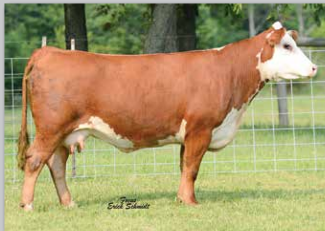
Lot 4 — SRM 811 Lady Rafter 1107