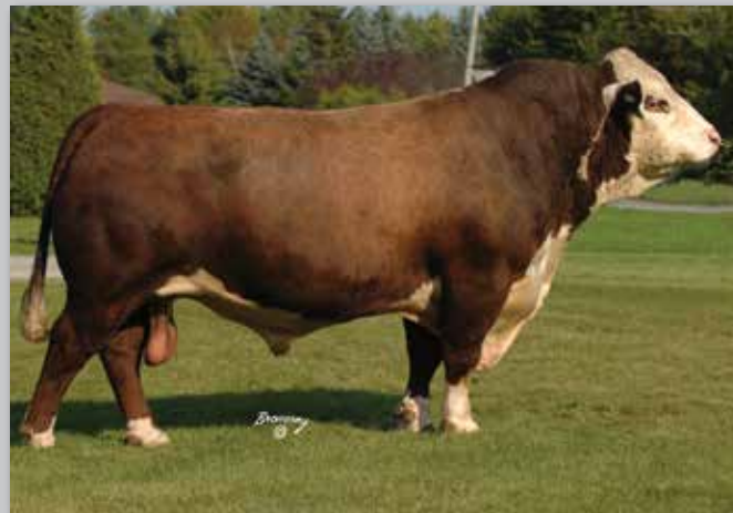
ELM-LODGE NEXT BIG THING 3N — Sire of Lot 29