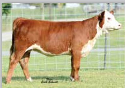
Lot 10A — DJF 0002 421 Bella Rae 36B