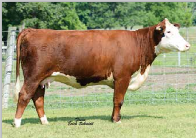
Lot 18 — FFV Happy Lady Z01