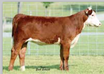
Lot 16A — DJF 3Y 1021U Bevy 59B