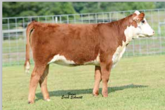
Lot 21 — KD Beyond Bliss 9B ET