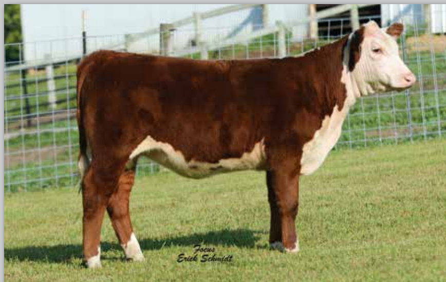
Lot 8 — DJF Bebe Rikka 23B ET