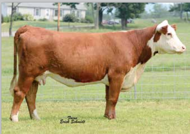
Lot 24 — DJF 388T 6014 Janessa 87Y