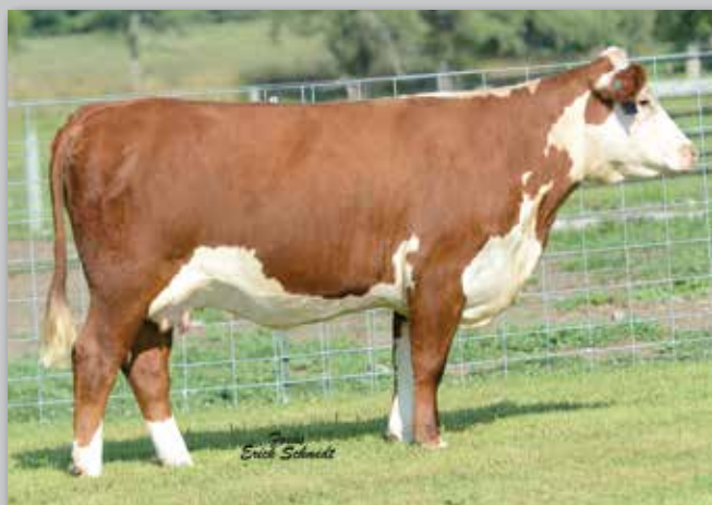
Lot 13 — KD Victoria 4Z