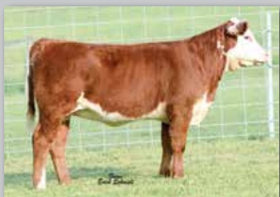
Lot 11A — DJF 9500 52U Bernita 18B