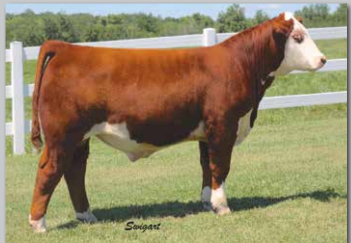
LCC FBF Time Traveler 480 — 213 son