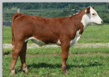
Lot 13A — KJD Candy Man 5C