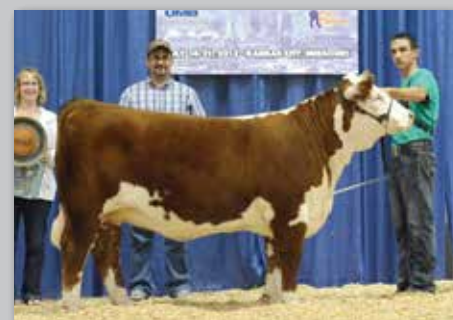
P75 x Kahuna Daughter