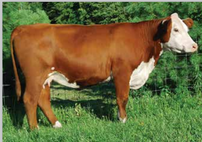
Lot 31 — JLCS 4033 Marsha 100W A4