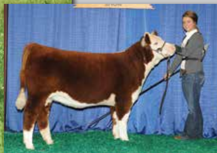
DJF Jessie J 40B ET — 43518415