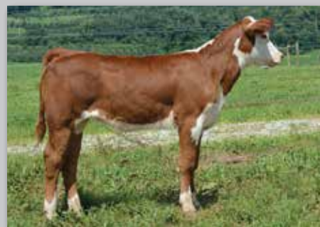
Lot 14A — KJD Carmella 13C