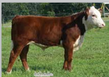
Lot 11A — DJF TKL Carlton 26C