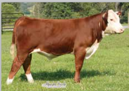
Lot 8A — DJF Cosmo 20C