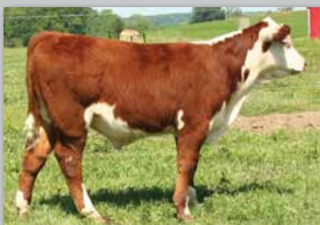
Lot 32A — JS 301 Robert 4C