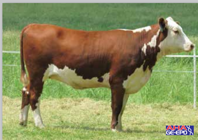
Lot 40 — Slayton 441 Durango 3Z/210