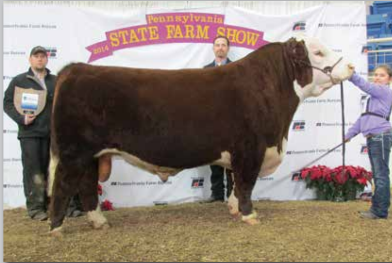
DS Swagger 56Y — Sire of Febuary 9C calf