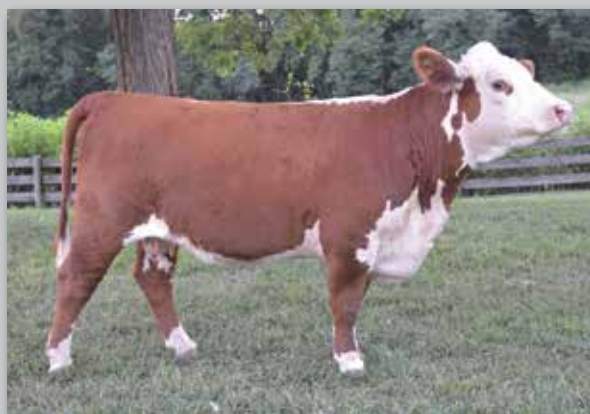
Lot 37 — PA Valentine