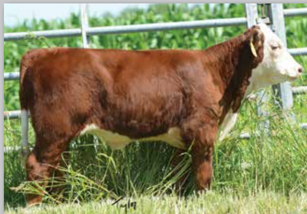
Lot 36 — WD 1301 Miss Stacey 5114