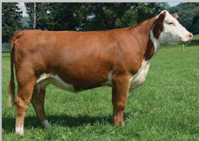
Lot 8 — DJF Alana Boo Boo 7A ET