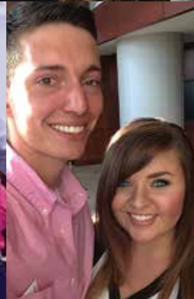
The pro wins!