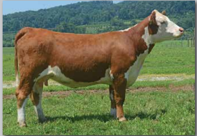
Lot 17 — KD Duchess 9A