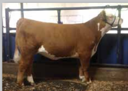
P75 x Enuff Profet Daughter