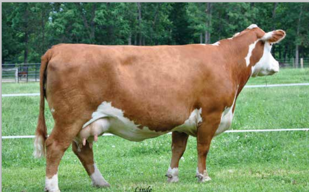
Lot 5 — Red Hilks Kerrie M33 P75