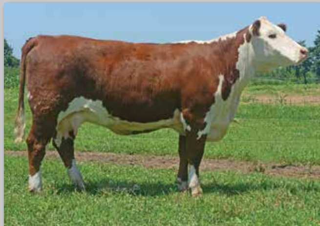
Lot 14 — KD Shakira 18Z