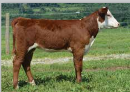
Lot 15A — KJD Cappuccino 10C