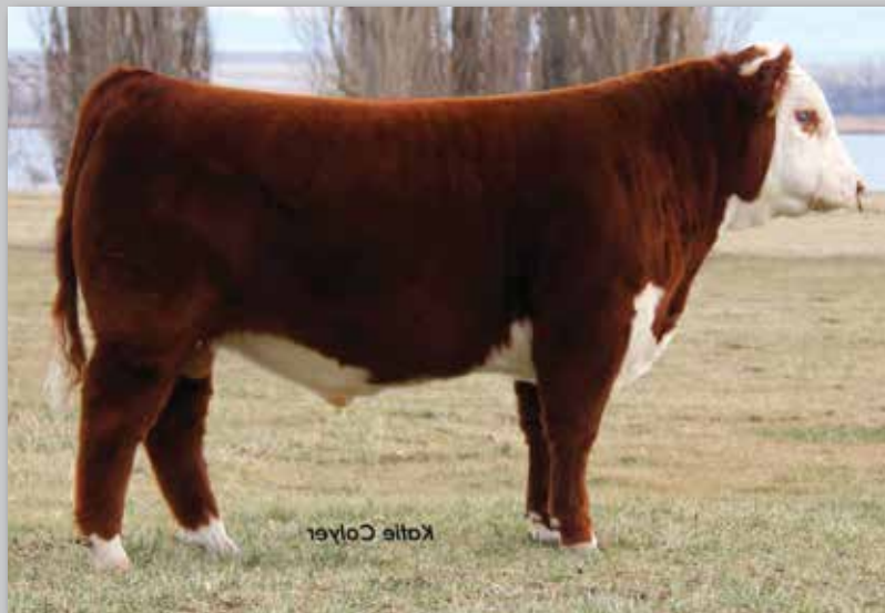
C ETF Wildcat 4248 ET — Service sire to Lot 25