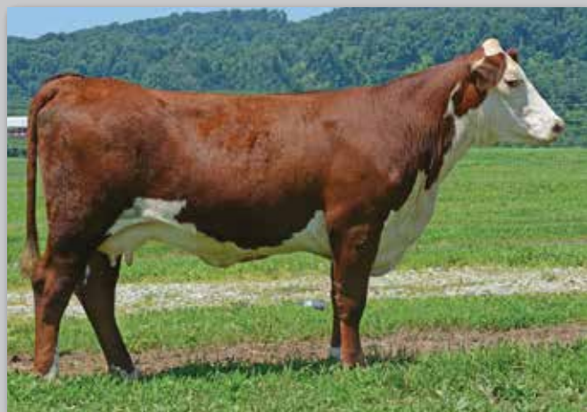
Lot 16 — KJD Apricot 7A