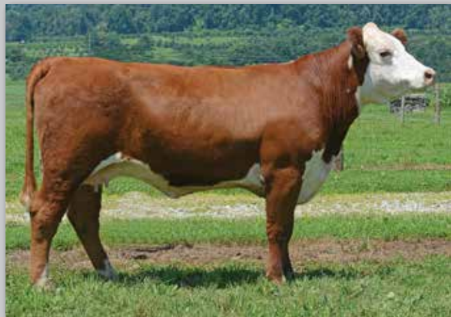
Lot 15 — KD Indigo 11A