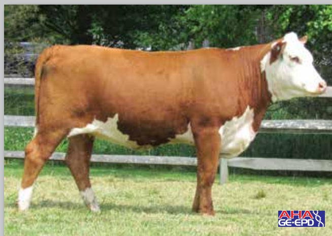
Lot 39 — WIB 51X P20 Lucky 401