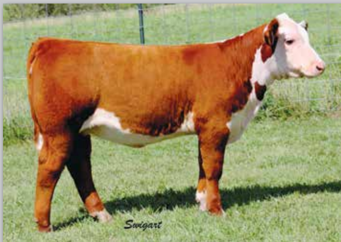
LCC FBF Peaches 4111 — 213 daughter