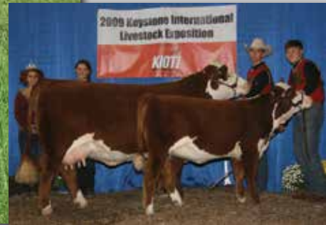
STAR 19R Carlene 137T — Donor of Lots 1A and 1B