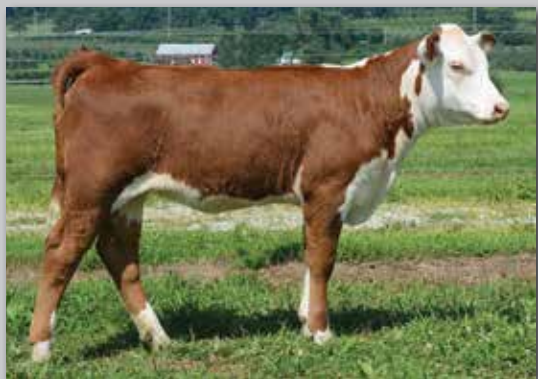
Lot 12A — KJD Candy Apple 2C ET