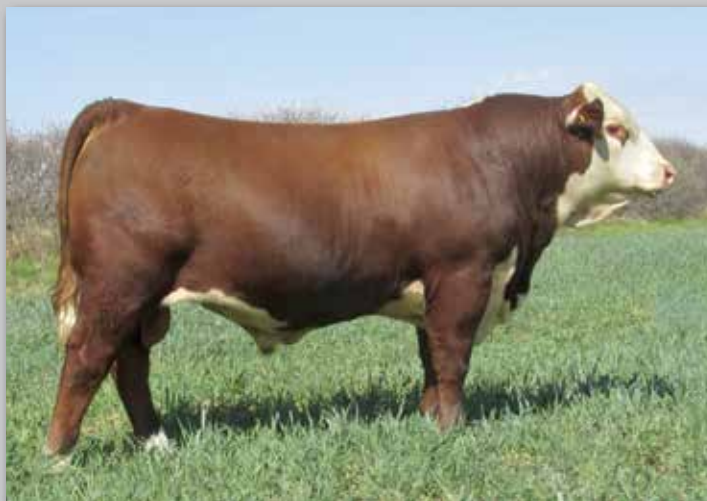
Gerber Anodyne 011A — Service Sire to Lots 39 and 40