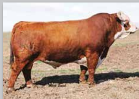
UPS Domino 3027 — Sire of Lot 31A