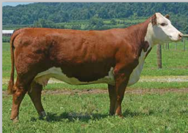
Lot 13 — KD Paris 25Y