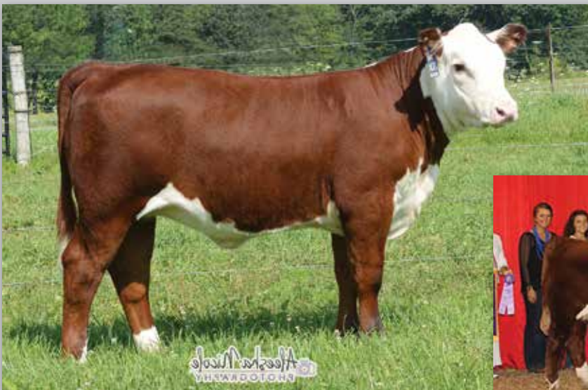
Lot 3 — DJF Chanel 33C ET