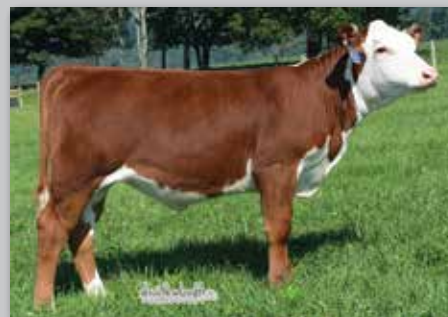
Lot 9A — DJF Cora 22C