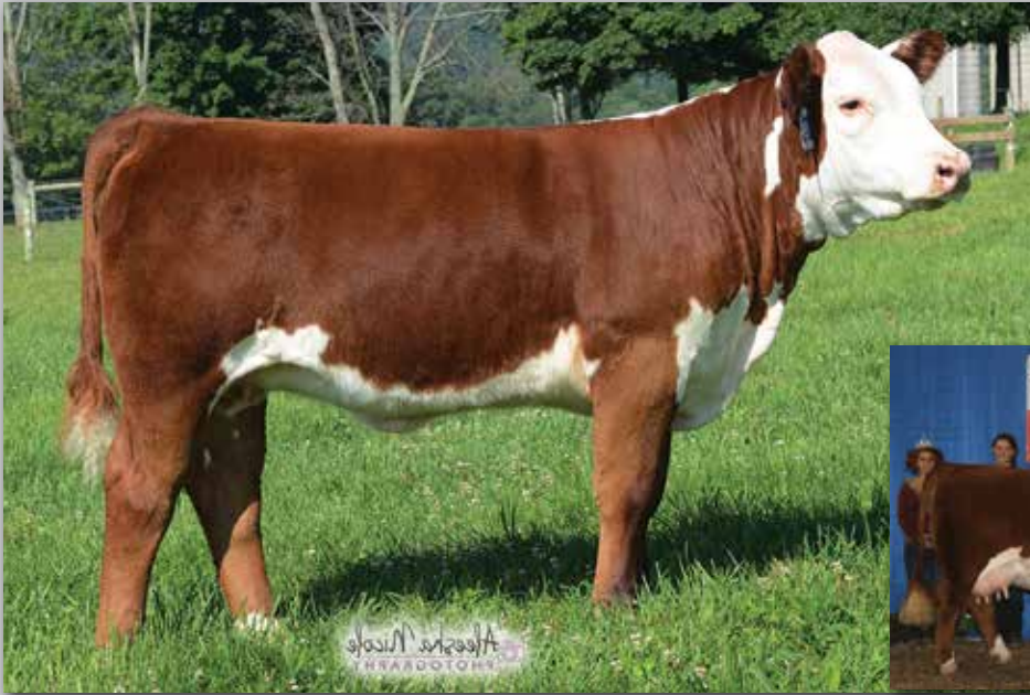
Lot 2A — DJF Miss Candy 13C ET