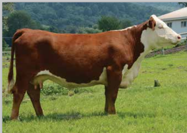
Lot 10 — DJF Star Simply Amazin 160Z ET