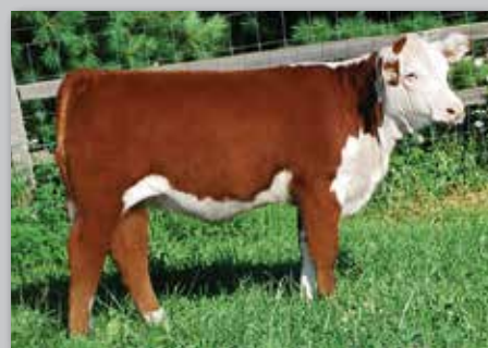
Lot 30A — Pennells Spirit Belle 1503