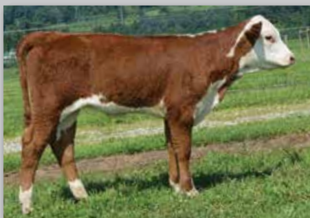
Lot 16A — KJD Casanova 21C