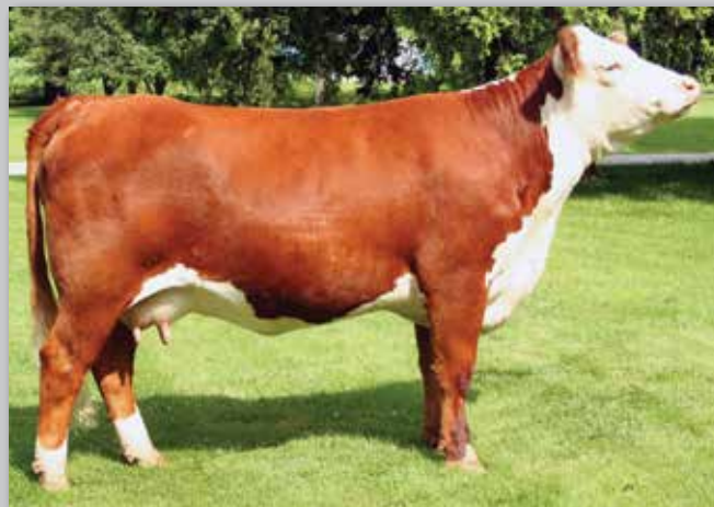
Lot 34 — DS 38T Reba 13A