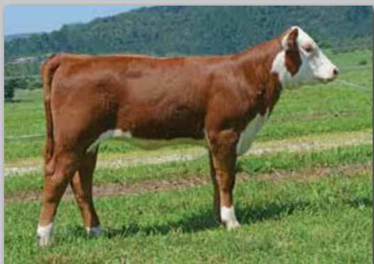
Lot 12B — KJD Caramel 9C ET