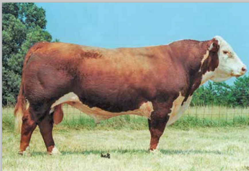
PW Victor Boomer P606 — Sire of Lot 27