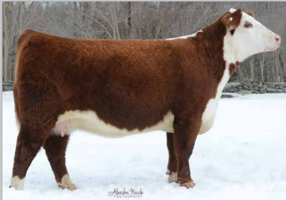
DEP Ms Lucky Lucy 133 ET — Dam of Lot 23