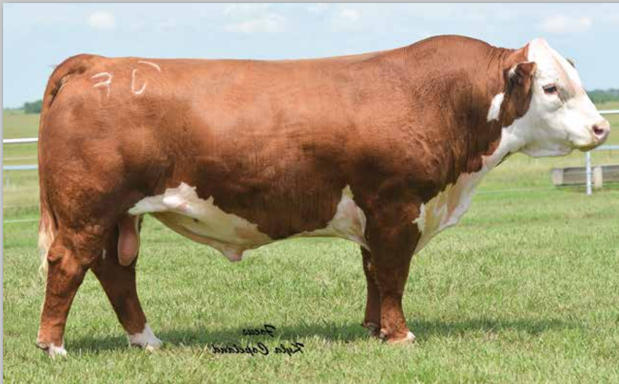
NJW 98S R117 Ribeye 80X ET — Sire of Lots 28 and 29