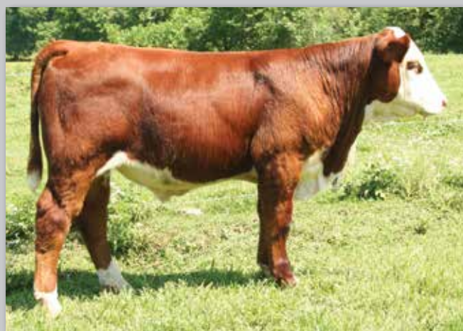
Lot 35 — JS 719T Snoop Dawg 2C