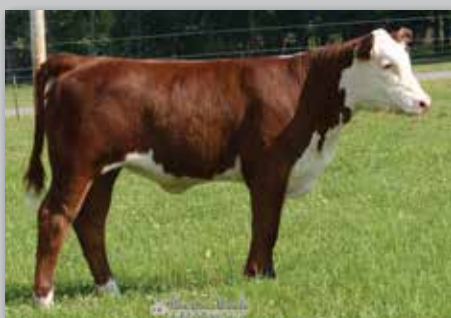
Lot 7A — DJF Cassidy 31C