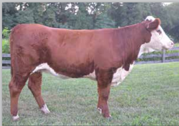
Lot 38 — PA Violet

DJF A85 32T DOUBLE UP 1008 (DLF,HYF,IEF) WIRRUNA ABRACADABRA PA VALENTINE DJF 196T 3037 DENALHI 1034 CS GPR OZ SAULY 32T (DOD)(DLF,HYF,IEF) P43377756 HARVIE DAN T-BONE 196T R MISS BOULDER 3037