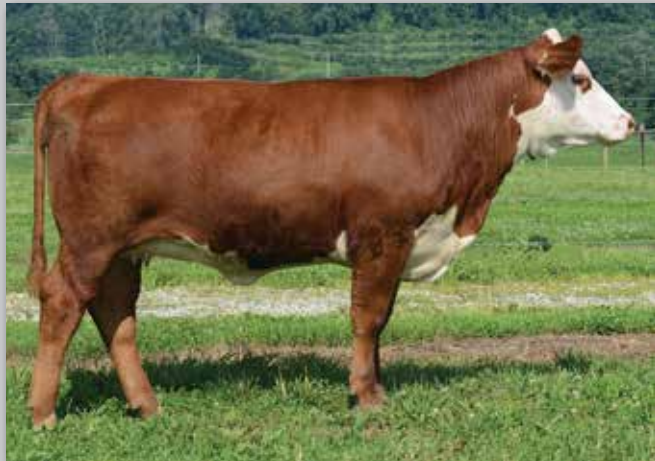
Lot 20 — KJD Bedazzled 19B