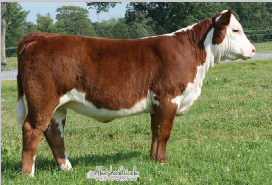
Lot 2B — DJF Callie 14C ET

P43605374 — Calved: Feb. 19, 2015 — Tattoo: LE 14C/RE DJF