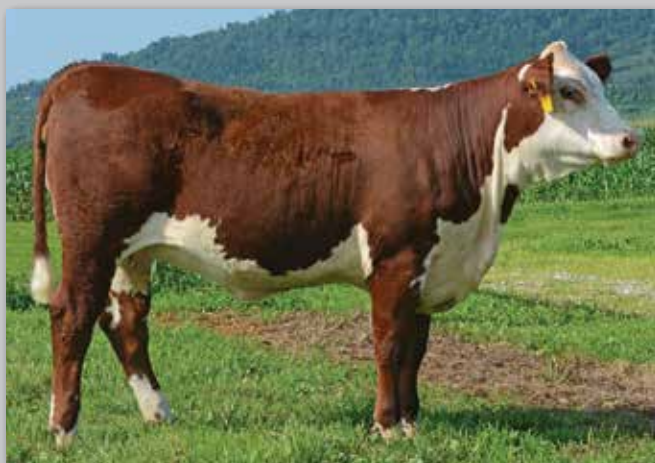
Lot 21 — KJD Bridget 26B