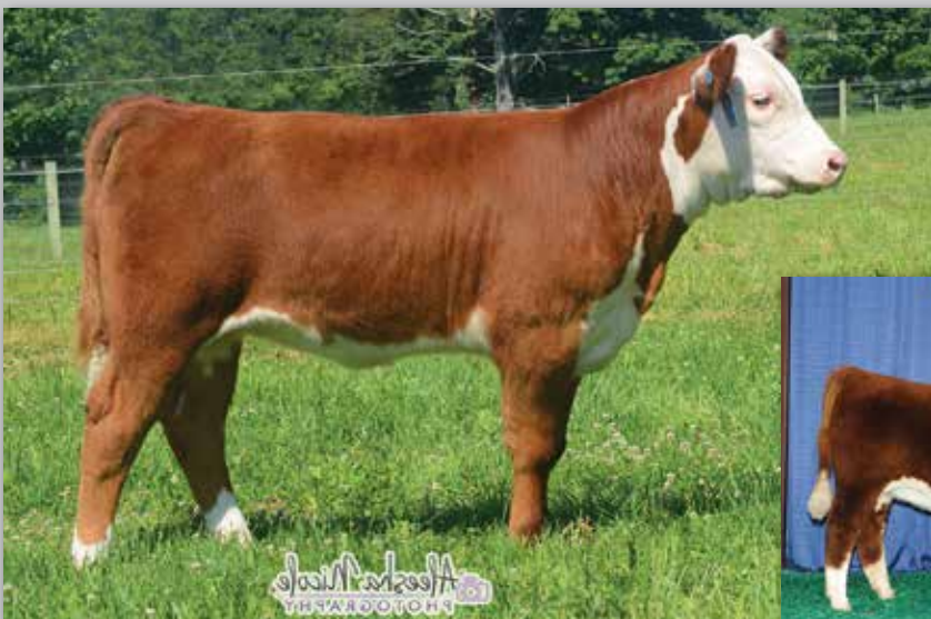
Lot 4 — DJF Claire 34C ET