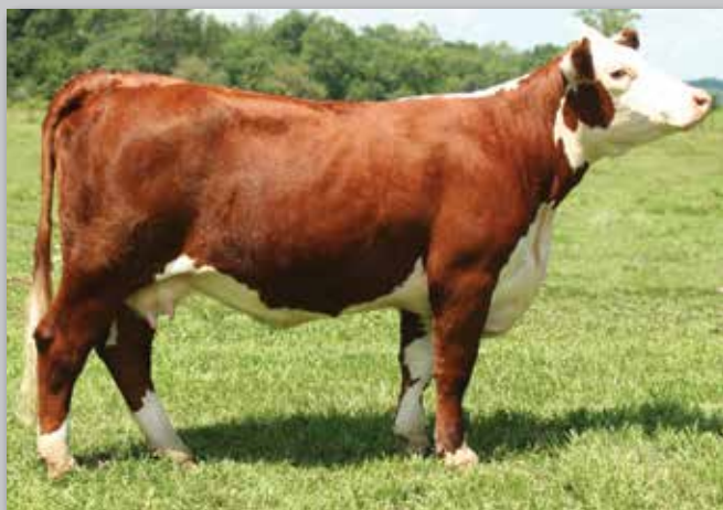
Lot 33 — DS 98U Holly 2A