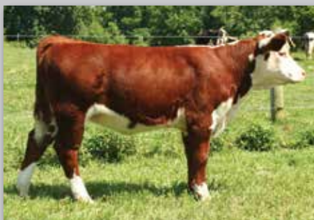
Lot 33A — JS 8051 Hester Prynne 1C