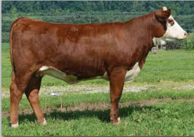
Lot 19 — KJD Berry 15B