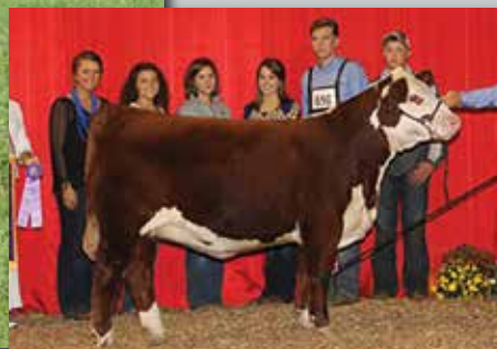
DJF Sweet Polly 85A ET — P43464309