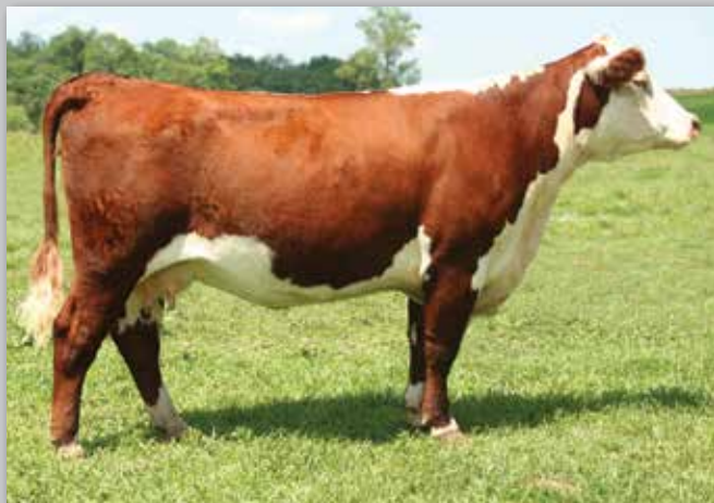
Lot 32 — DS Bonnie 47Z NR