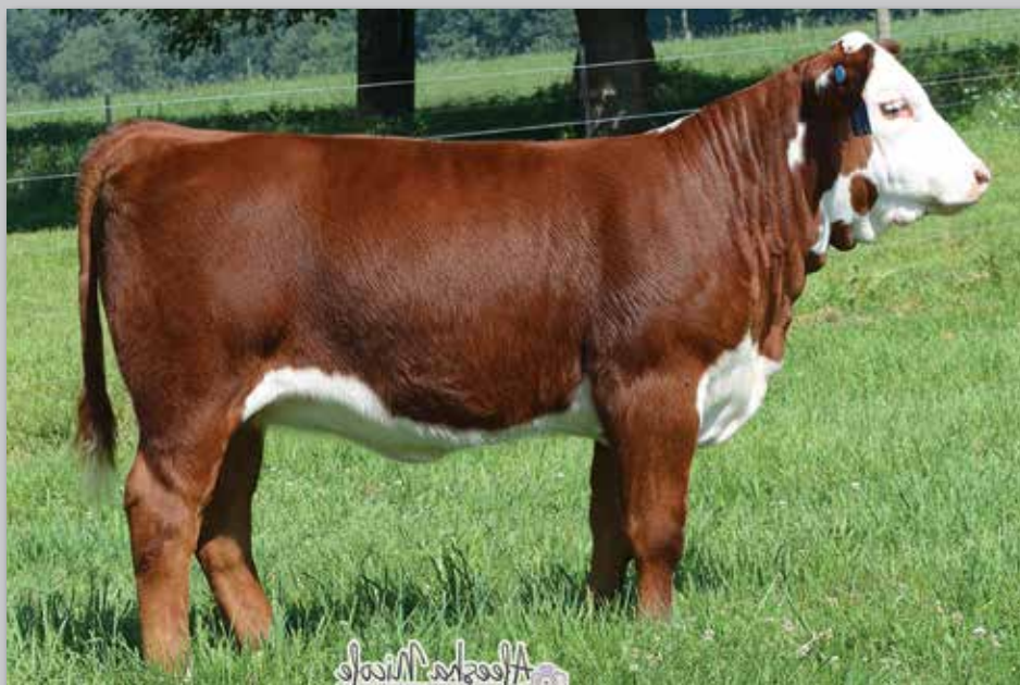
Lot 1B — DJF Cameron 35C ET

43605390 — Calved: March 14, 2015 — Tattoo: LE 35C/RE DJF