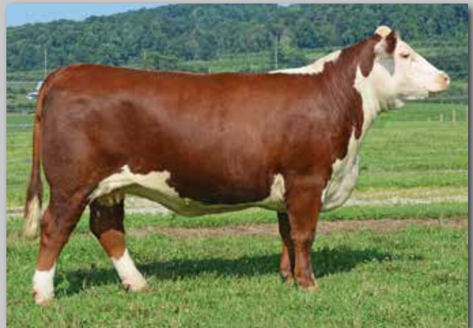
Lot 18 — KD Picture Perfect 3Y