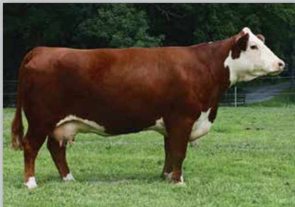
Lot 11 — DJF U33 R07 Zabrina 0107