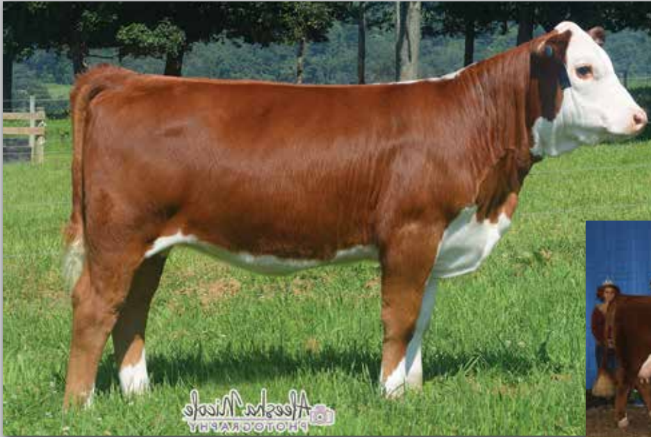
Lot 1A — DJF Corona 32C ET