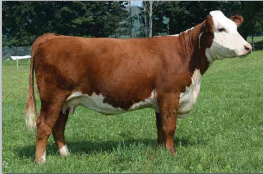
Lot 6 — ROPF Sara Evans