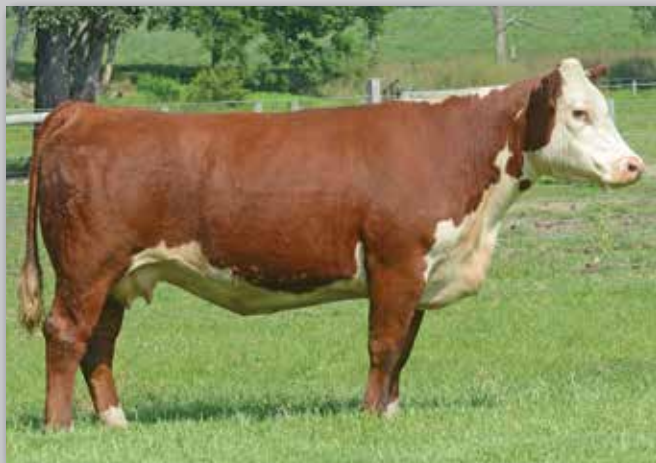
Lot 7 — DJF 3041 23H Ezella 02Z ET