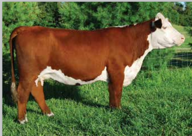
Lot 30 — Grassy Run Spirit Queen 20Y