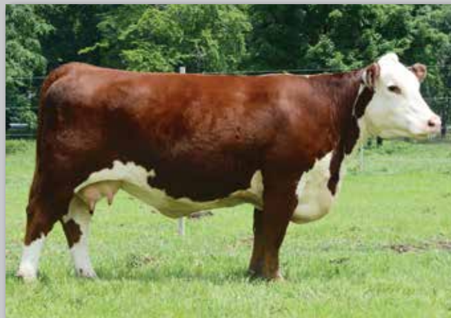
Lot 9 — DJF 0023 A85 Zsa Zsa 31Z