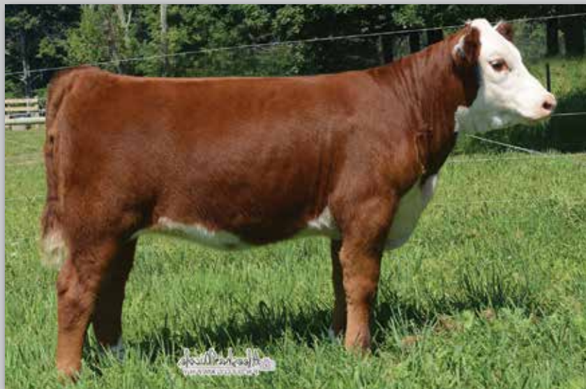
Lot 6A — DJF Cierra 23C