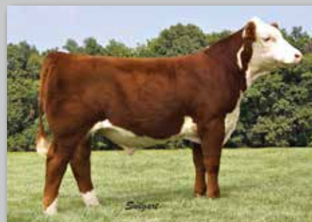
LCC 2T Longdrive 3Y ET — Sire of Lot 5A

CE 0.3; BW 3.2; WW 52; YW 84; MM 21; M&G 47; UDDR 1.21; TEAT 1.26; FAT 0.022; REA 0.46; MARB 0.05