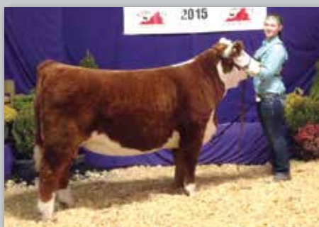
P75 x Excel 8051 Daughter