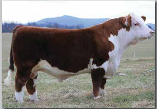
CHF MST Dozer 009X — Sire of Lot 22