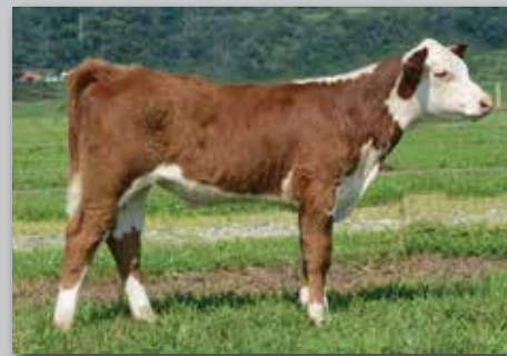
Lot 17A — KJD Caesar 11C