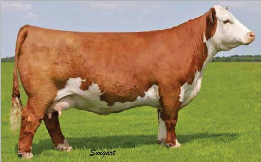
JB Remetee 213