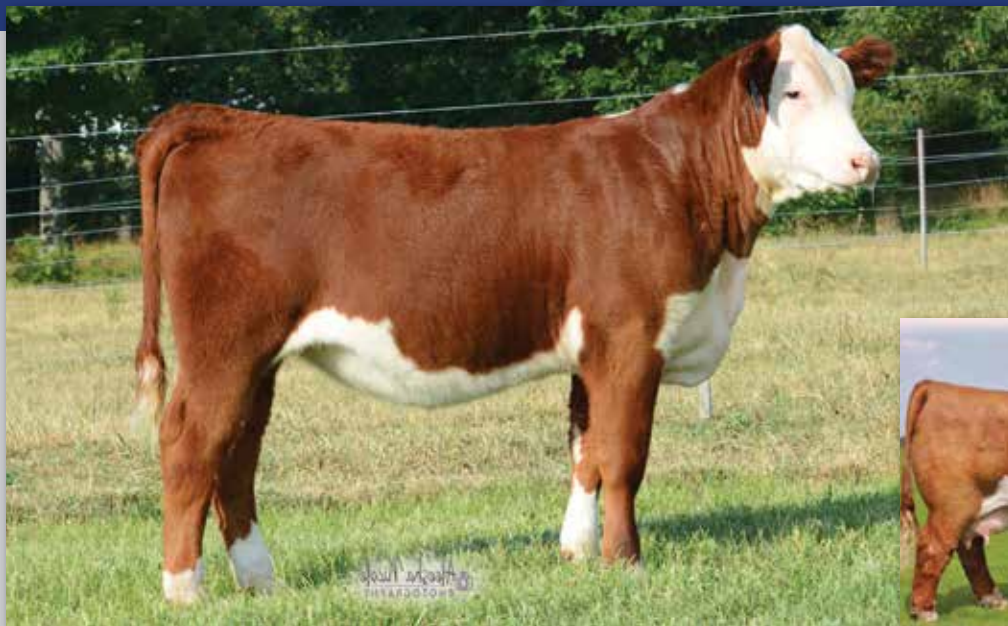
Lot 1 — DJF Marianna 27D ET