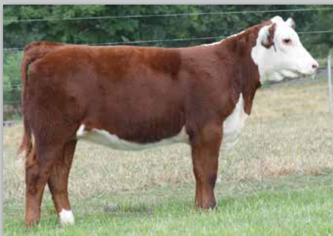
Lot 9 — DJF Wonderlust 31D ET