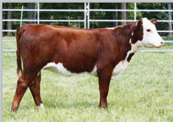
Lot 39A — DS 4R Penny 4D

REMITALL EMBRACER 8E (SOD)(HYF) SADDLE VLY LADYSPORT 120 DRF PEDIGREE K19 DRF RENEE 28E K18