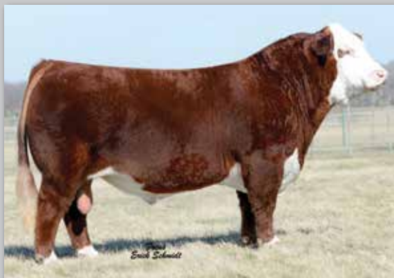
CHAC Mason 2214 — Sire of Lot 8