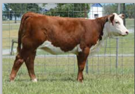
Lot 30A — DS 109 Lady 18D