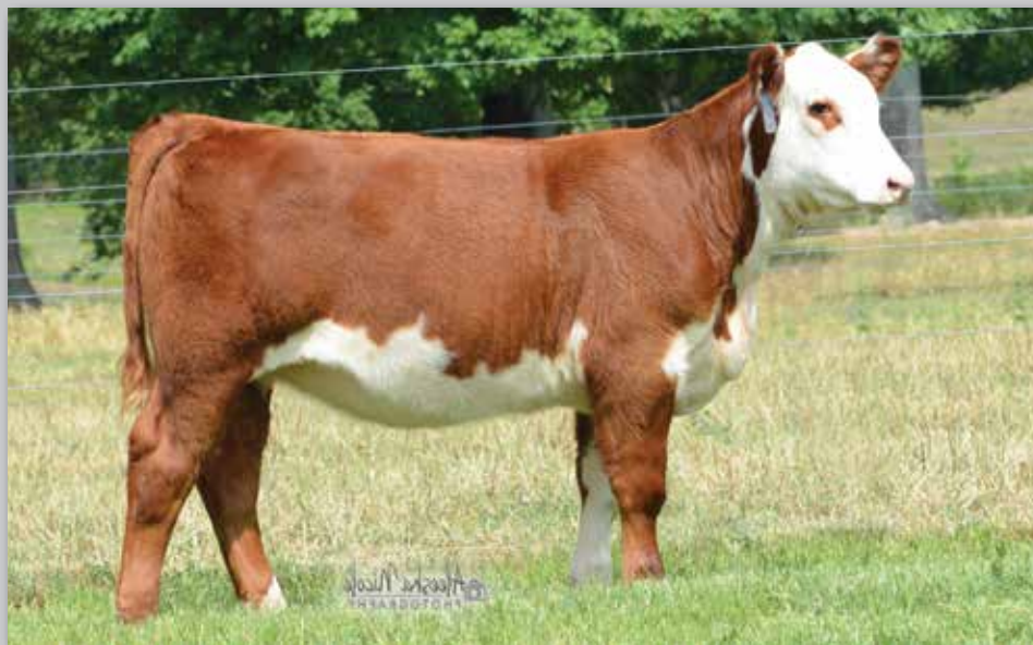
Lot 4 — DJF Abby Marie 28D ET