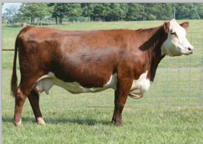
Lot 30 — DS P606 Lady 6Y