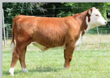
Lot 22A — DJF Richardo 15D