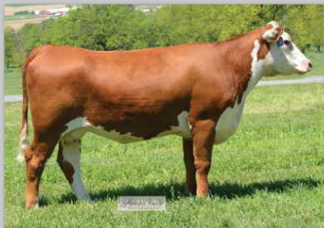
Lot 21 — DJF Becky Bae 74B ET