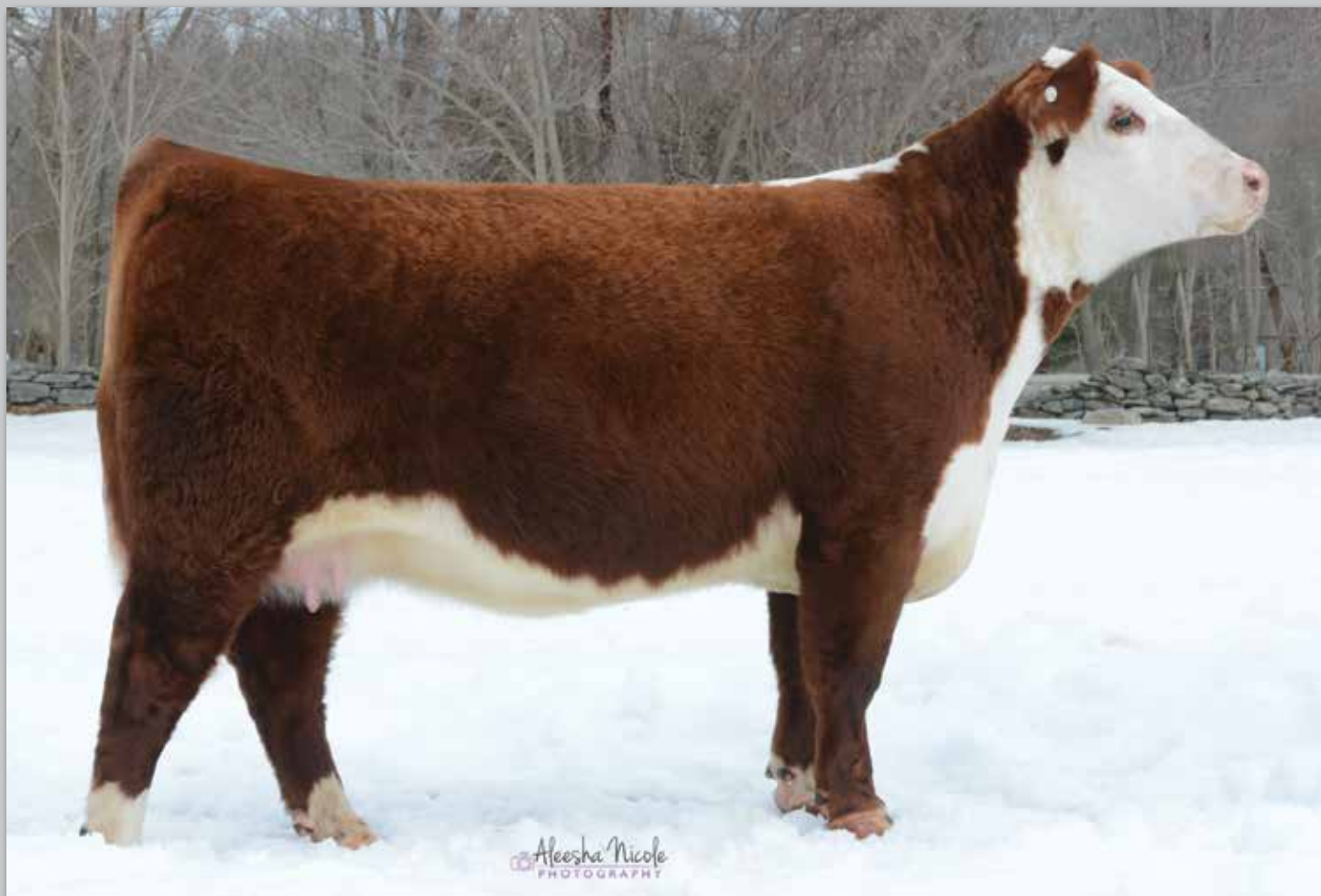
Lot 25 — DEP Ms Lucky Lucy 133 ET