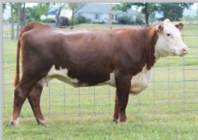
Lot 32 — DS 12Z Heidy 8B