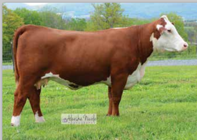
Lot 17 — DJF Miss Wonder 83A