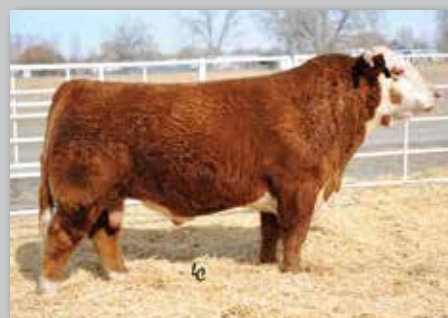
Churchill Sensation 028X — Sire of Lot 21A