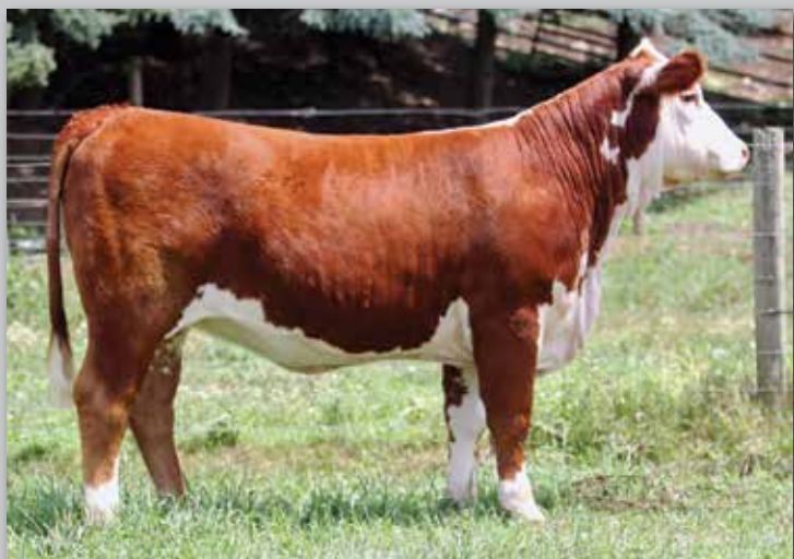
Lot 47 — RS Lola 48C