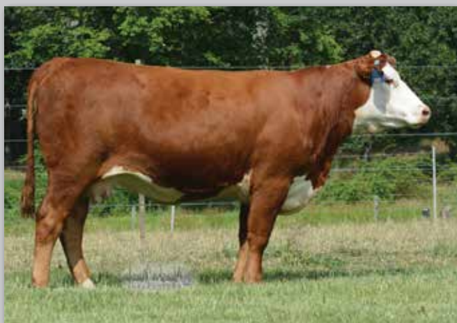
Lot 20 — DJF Tricia 21B ET