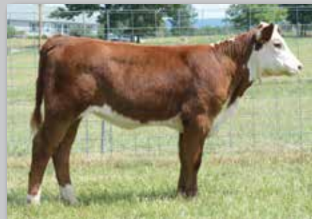
Lot 38A — CS 028X Ronda 15D