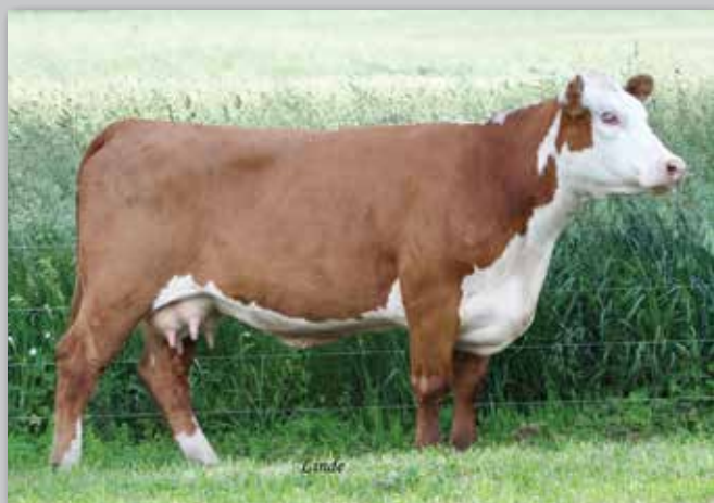
R Miss Felt 1997 — Dam of Lot 5