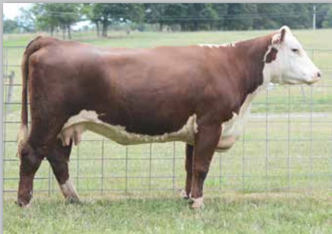
Lot 34 — DeLhawk Lady Roxy 91A