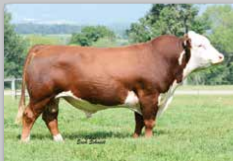
LCC 2T Longdrive 3Y ET — Sire of Lot 24A