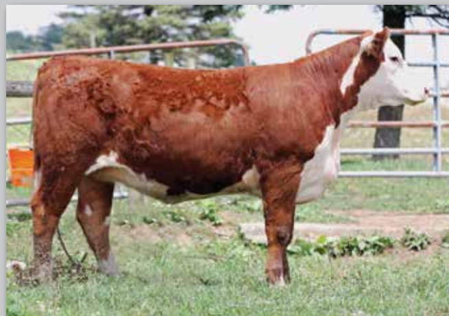
Lot 43 — DS 98U Vickie 43C