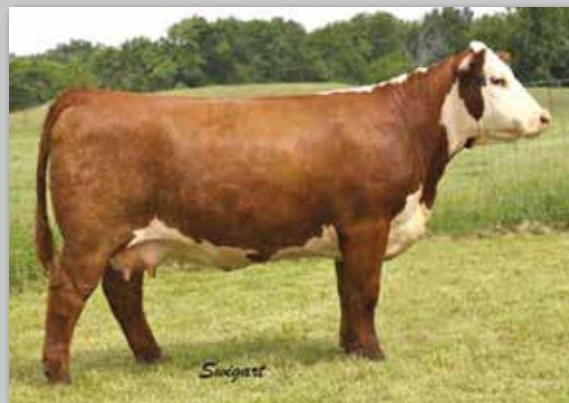
LCC Patton Kiwi 116 ET — Dam of Lot 8