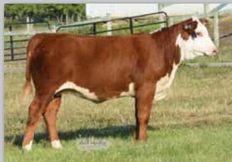
Lot 20A — DJF Donie 16D