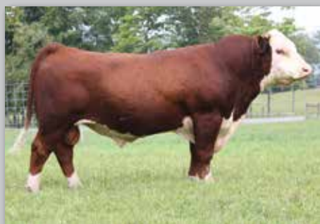
RST 44U Durango 2001 — Sire of Lot 16A