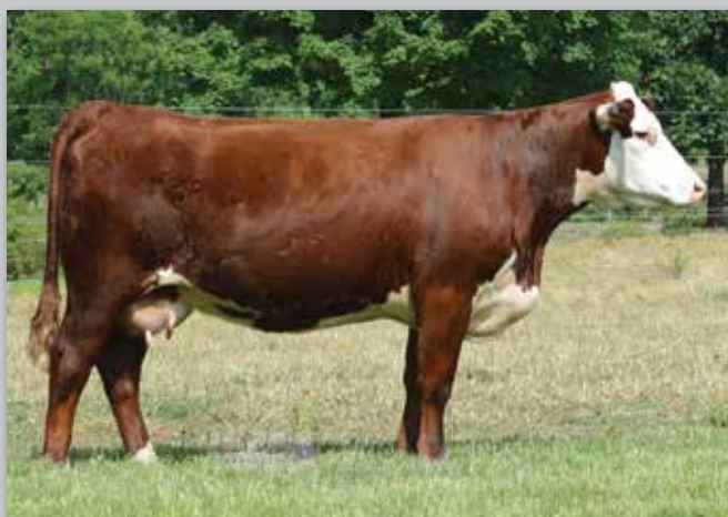
Lot 19 — DJF Brooklyn 25B ET