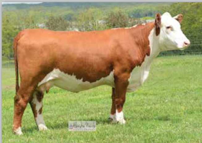
Lot 16 — DJF Belle 67B ET