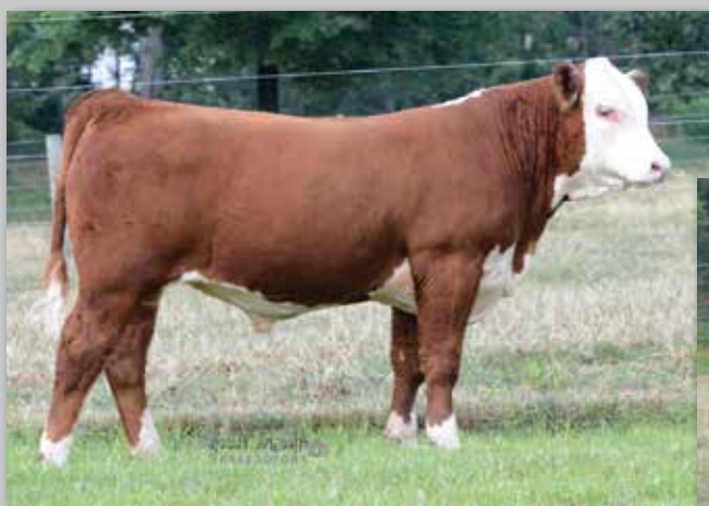
Lot 11 — DJF Huxley 1D ET