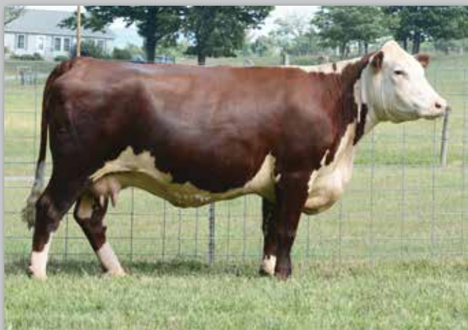
Lot 31 — DS Rocks Olivia 71Z ET