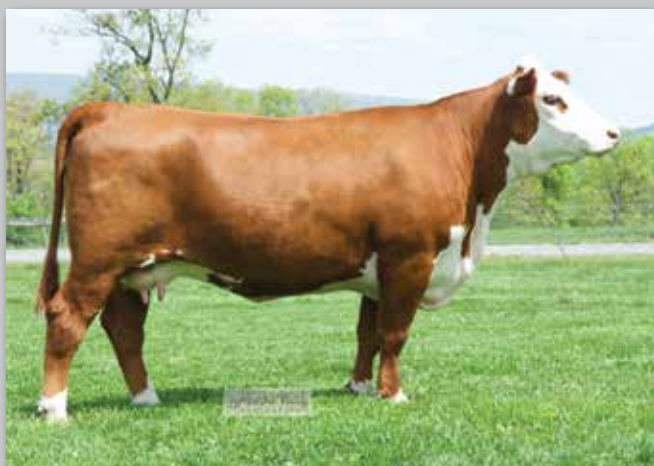
Lot 15 — DJF Scarlet Letter 76A