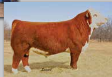
RS 45P Magnum 91Y