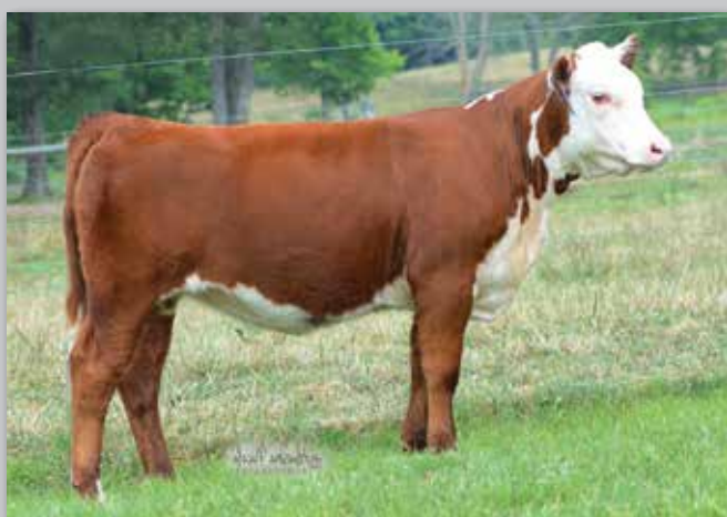
Lot 10 — DJF Annavela 20D