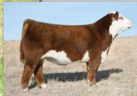
H/TSR/CHEZ/Full Throttle ET — Sire of Lot 3