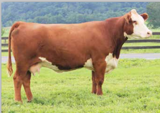
Lot 26 — BERG 242 Brook 69W