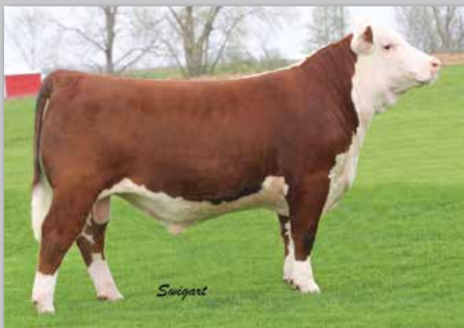
Purple SM DJF Fat Tony 501C ET

CE -7.5; BW 5.1; WW 61; YW 96; MM 18; M&G 49; UDDR 1.02; TEAT 0.96; FAT 0.021; REA 0.66; MARB 0.01