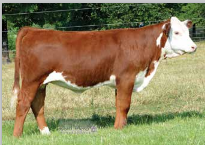
Lot 7 — DJF Donatella 26D ET