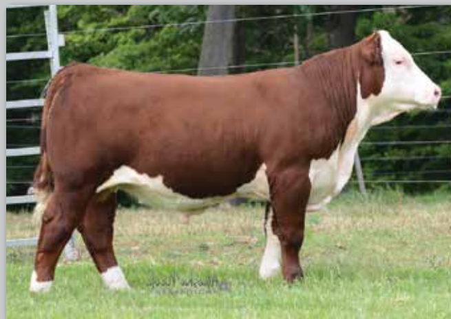
Lot 12 — DJF Bruno 3D ET