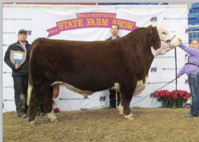
DS Swagger 56Y — Sire of Lot 38