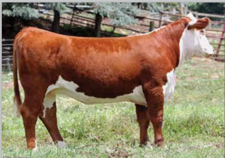
Lot 48 — RS Bella 40C