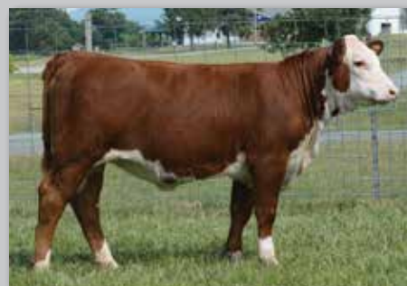
Lot 32A — DS 4R Heidy 8D