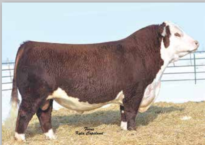
CRR 719 Catapult 109 — Sire of Lot 44