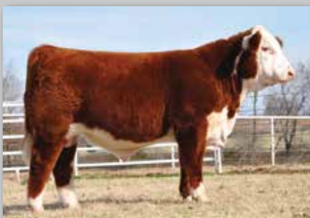
GV CMR Strong 156T Y449 — Grandsire of Lot 45A