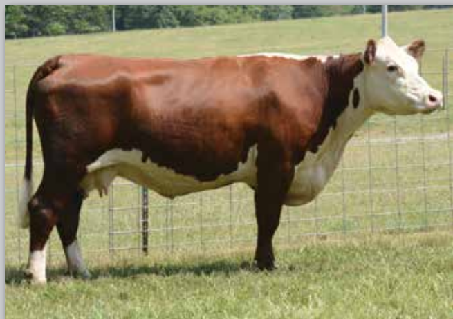
Lot 29 — DS Lady Lucia 17Z