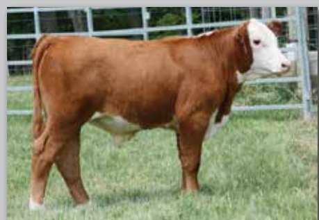
Lot 40A — DS 14B Strong 32D