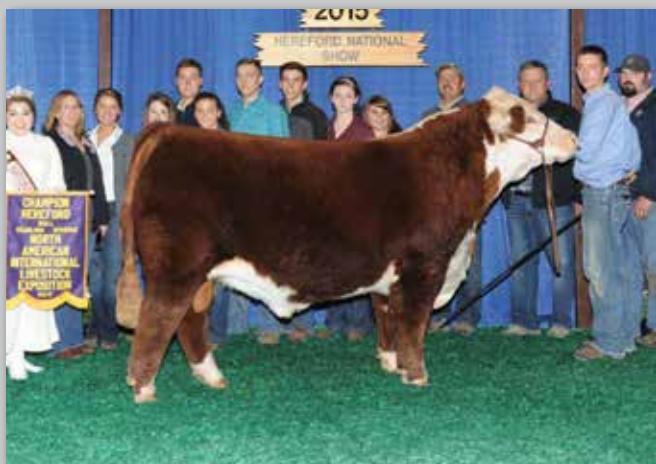
BAS DJF KJD Oshie 150B ET