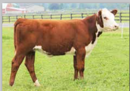
Lot 26A — KJD Daquiri 3D