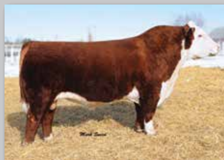
Lot 29A — DS 14B Lucia 44D