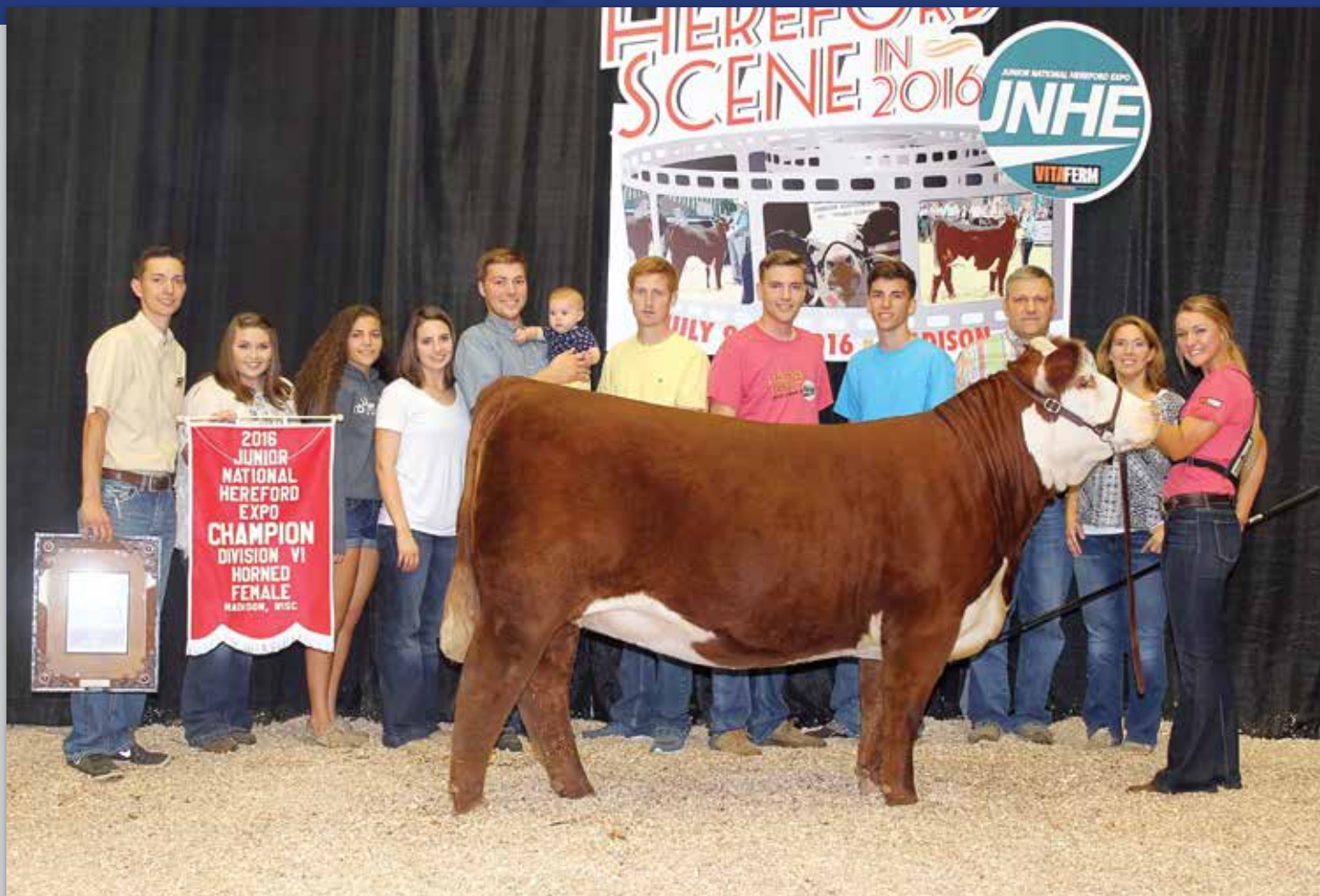
Lot 8 — LCC SHF Miss Lemon Lime 502 ET