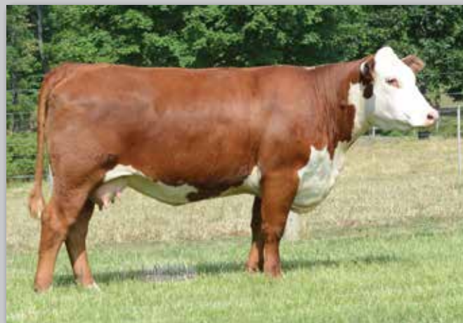
Lot 22 — DJF Rikka 6B ET