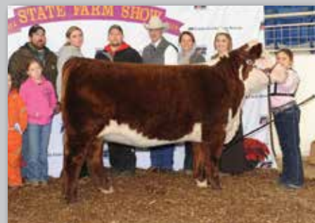
RS Bailey 95Z