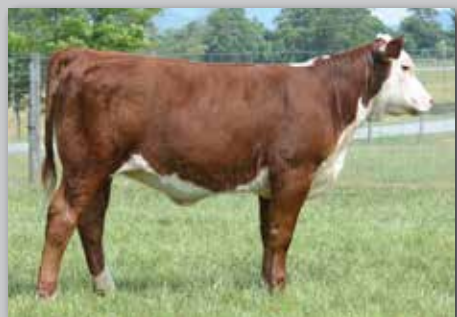
Lot 31A — DS 7110 Olivia 3D