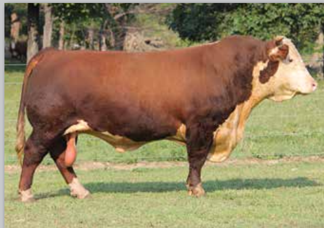
DS Maternal Meat 98U ET — Sire of Lot 42