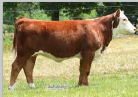
Lot 17A — DJF Donie 14D