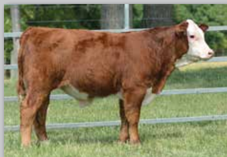
Lot 46A — DS 14B Strong 42D