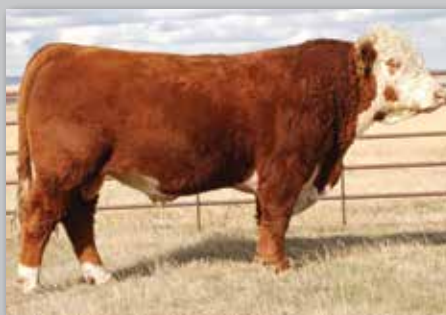
Churchill Sensation 028X — Sire of Lot 45B