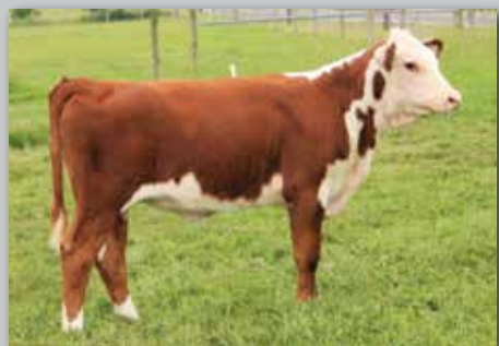
Lot 27A — KJD Dahlia 17D