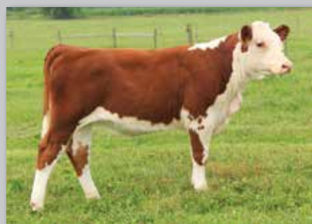
Lot 28A — KJD Dew Drop 1D