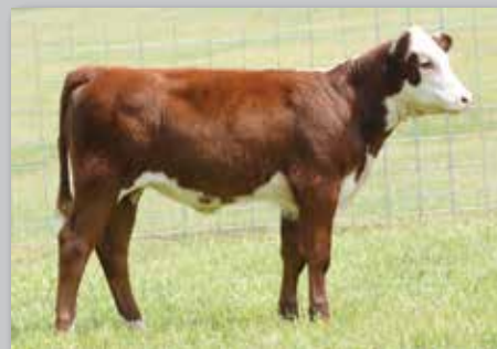
Lot 33A — DS 4109 Fancy 34D