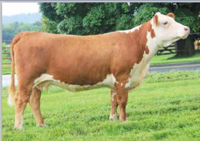
Lot 28 — KD Amber 13A