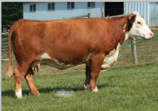
Lot 24 — DJF Big Booty Judy 83Z