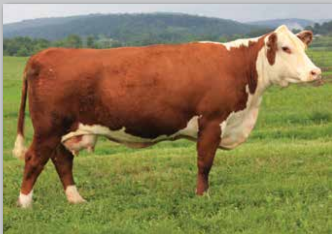
Lot 27 — HPH 5025 Debra 1036