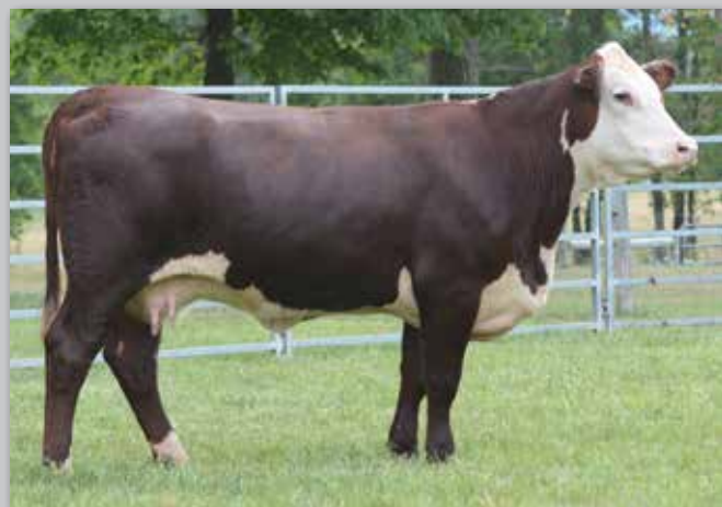
Lot 33 — DS 56Y Miss Fancy 69B