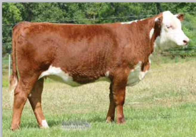
Lot 6 — DJF Reba 33D ET