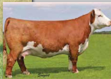
JB Remetee 213 — Dam of Lots 1-4