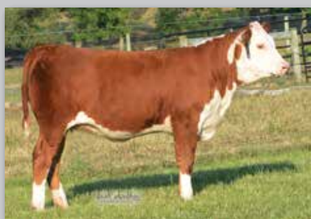
Lot 15A — DJF Scarlet 17D