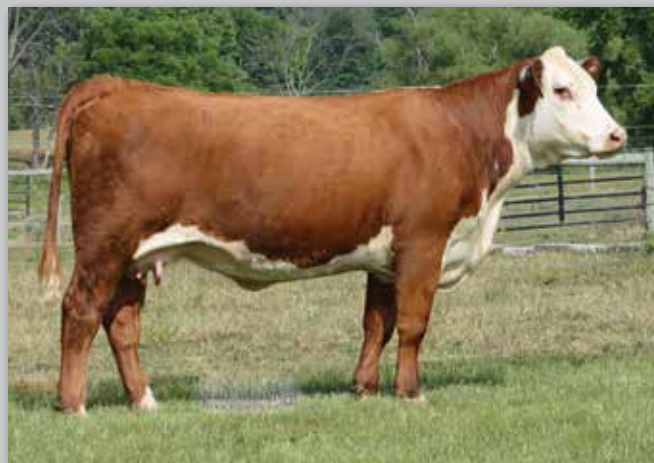
Lot 18 — DJF Bianca 45B