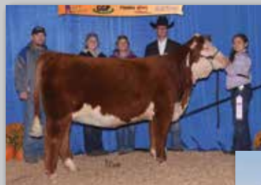
RS 88X Lucille 47B ET