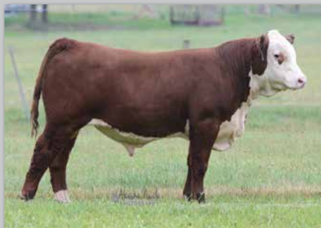
Lot 13 — DJF Edson 4D ET