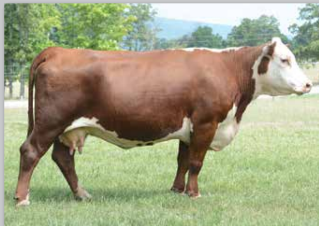
Lot 41 — DS 1009 Suzy 48Z ET