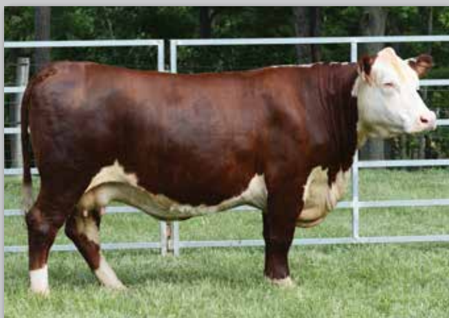
Lot 46 — DS 9366 Rosey 51Y