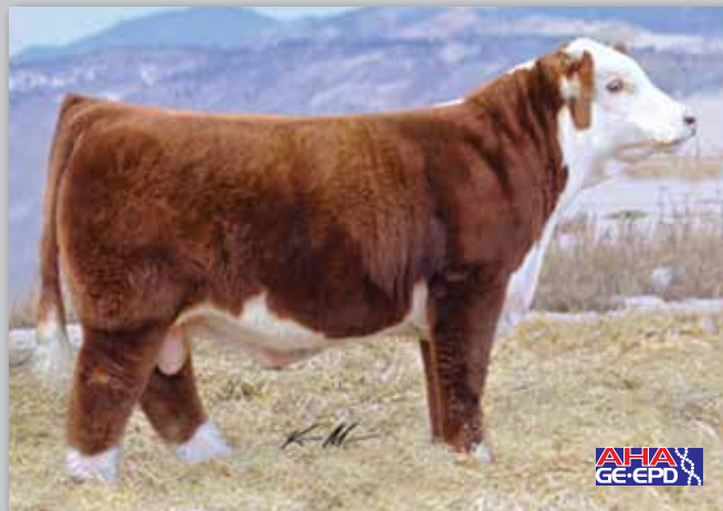
Perks 0003 Easy Money 4003

CE -0.3; BW 4.9; WW 65; YW 108; MM 23; M&G 56; UDDR 1.25; TEAT 1.18; FAT 0.002; REA 0.71; MARB -0.07