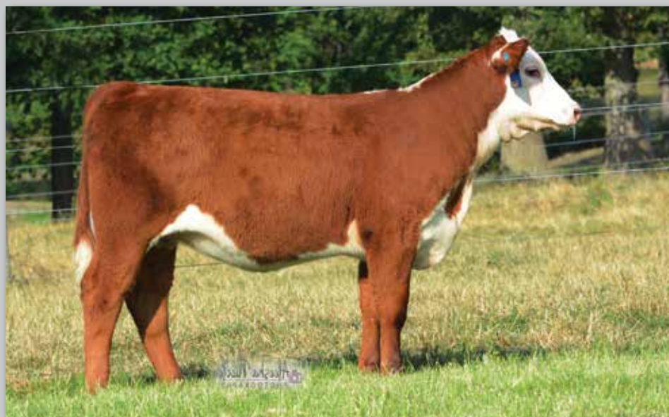
Lot 2 — DJF Dandee 36D ET