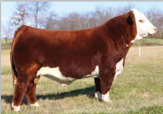
LCC FBF Time Traveler 480

CE 3.3; BW 2.4; WW 54; YW 87; MM 25; M&G 52; UDDR 1.16; TEAT 1.17; FAT -0.047; REA 0.58; MARB -0.01