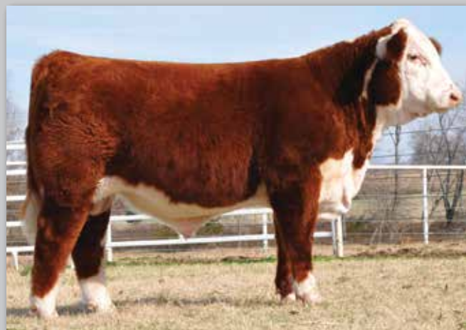
GV CMR Strong 156T — Sire of Lot 37