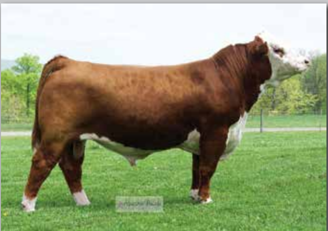
RVP 100W Billionaire 73B

CE -2.2; BW 3.6; WW 49; YW 75; MM 20; M&G 45; UDDR 1.10; TEAT 1.08; FAT -0.015; REA 0.54; MARB 0.01