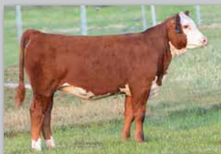
Lot 19A — DJF Brunta 13D