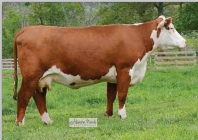
Lot 23 — DJF 408 P12 Eliza 05Z ET