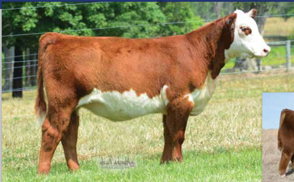
Lot 3 — DJF Damsel 30D ET