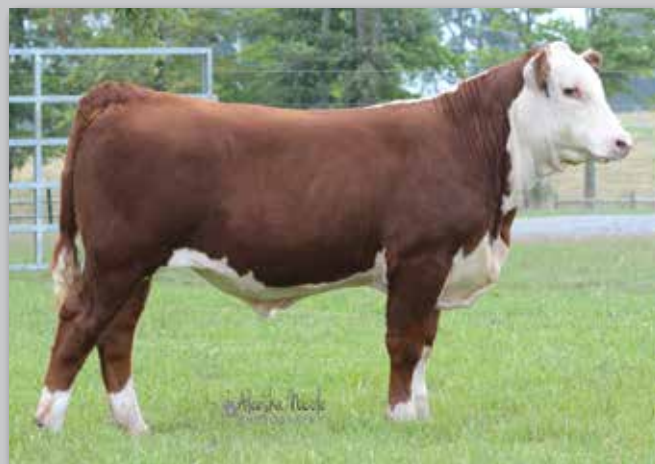
Lot 14 — DJF Rosco 7D ET