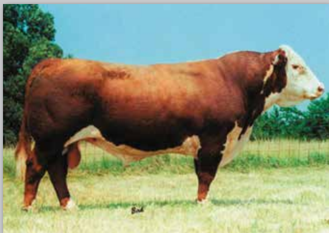
PW Victor Boomer P606 — Sire of Lot 36