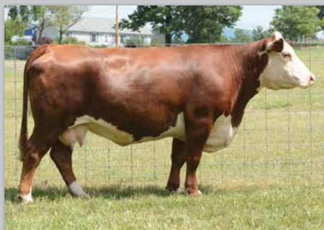
Lot 40 — DS 106U Leona 82Z