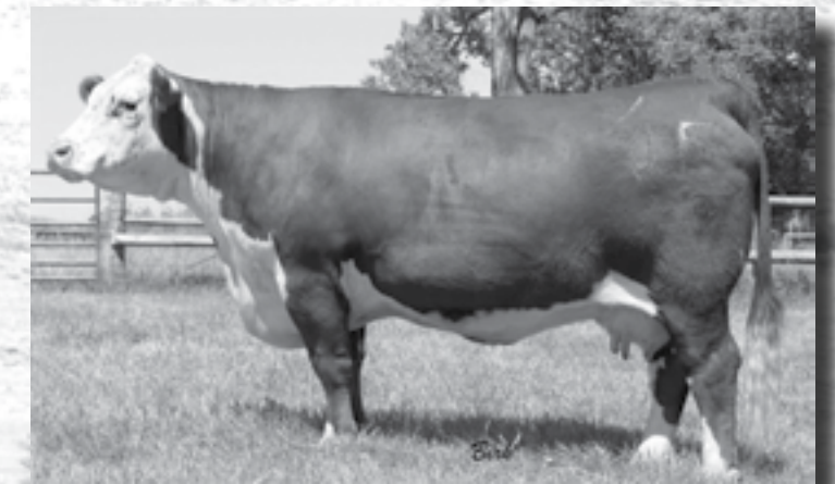
NJW BW Ladysport Dew 78P

"Durbin Creek Bulls travel the country well, and get the cows covered. The results are stout calves that weigh up well and gain good!"