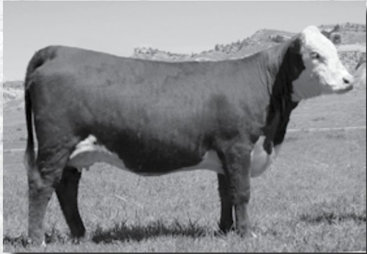
DCR 199B Lauretta 7637