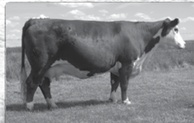
BAR-RZ 72S Waverly 73W

Blair-Athol 13K Major 101N Myalta Kortland 51K Lady 3N BAR-RZ 23M Rembrant 88R BAR-RZ 39N Robin 32R