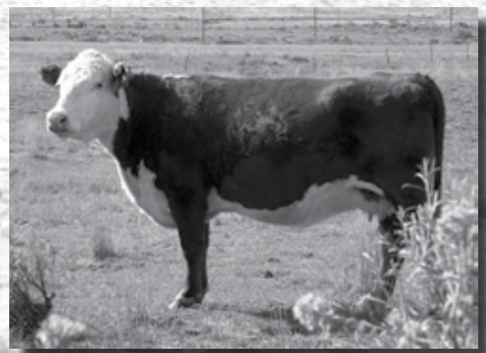
Red Hills Keri T85