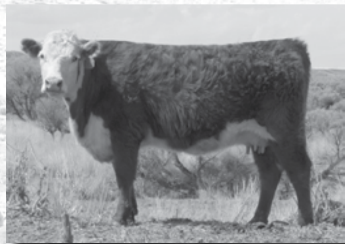
Precedence 518 daughter that calved last year.

Remitall Olympian ET 262L Remitall Ginger 23G Remitall Governor 236G SHF MISS Keynote 20X D18