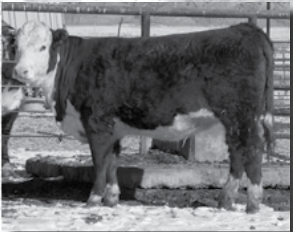
DCR 479 Lauretta Supreme Female 2018 Hot Springs County Fair

DCR 99 DCR 479 Range Boss 8616 BW: 76 WW: 700 YW: 994 Age of Dam: 3 11/22/2018 PAP: 45