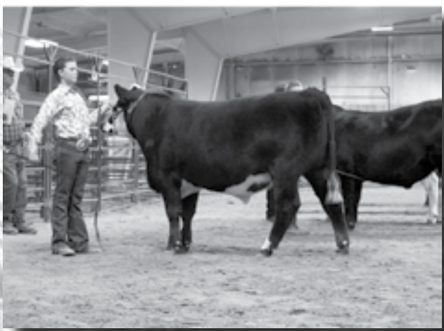
2019 Class Winner Hot Springs County Fair Cowboss Son