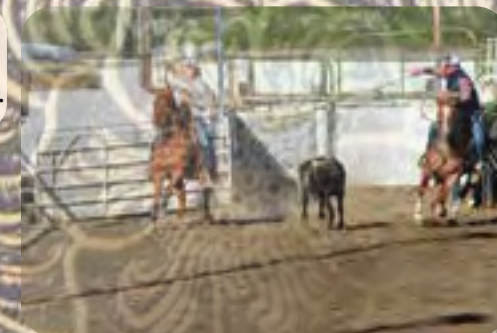
Clay heading on a paternal sister to Autumn.