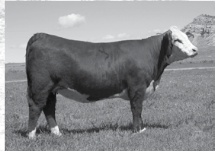
DCR 199B Dominet 7632