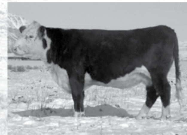
DCR Diana 7020