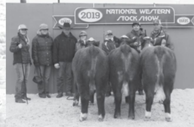
Fall Division Winners at NWSS All Cowboss Daughters

The longer we use 199B in our commercial program the more impressive his real world data becomes! His calves come easy, mature early, convert feed and hang up dollar generating carcasses. Sons are stout and economic, daughters are broody and very productive. Sired the Champion Carcass Steer at the Hot Springs County Fair.