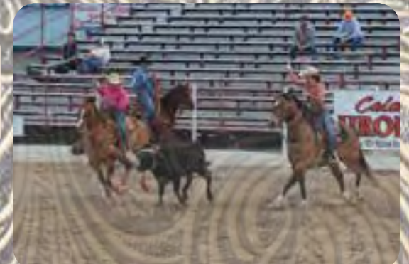
Mattie heading on a paternal brother to both Sweet Pea & Grace.