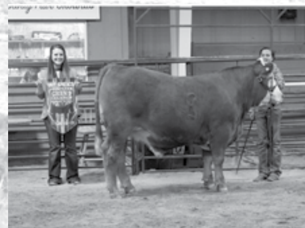
Archie - Champion Market Steer 2019 Hot Springs County Fair Range Boss Son

The high selling bull in our 2016 sale, we were lucky enough to retain a piece of him. By 713 and out of the great 7020 cow, he represents the most reliable and proven DCR genetics of the last 20 years. The real world numbers backing him up don't lie. He offers ample early growth and maturity coupled with eye appeal. Steer calves posted impressive rate of gains and the females have a very cowy look to them.