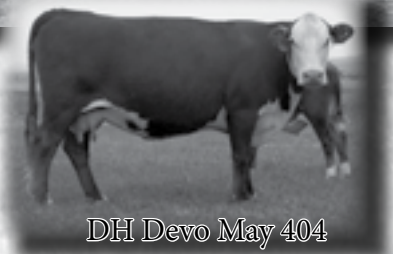
DH Devo May 404

CED BW WW YW SC MILK M&G FAT REA MARB BMI BII CHB 2.4 3.5 65 100 0.6 25 57 0.011 0.53 0.04 $379 $456 $121 IMF Ratio 129%