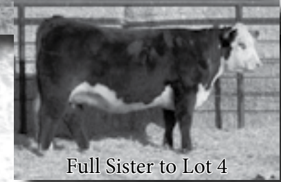
Full Sister to Lot 4

DCR 5 DCR 199B Cowboss 8018 BW: 84 WW: 565 YW: 788 Age of Dam: 5 4/11/2018 FAT: 0.12 REA: 9.3 IMF: 1.82 PAP: 40 TS: 2