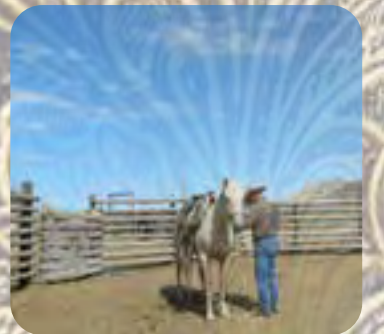
Bruce working a paternal sister to Red & Carmel.