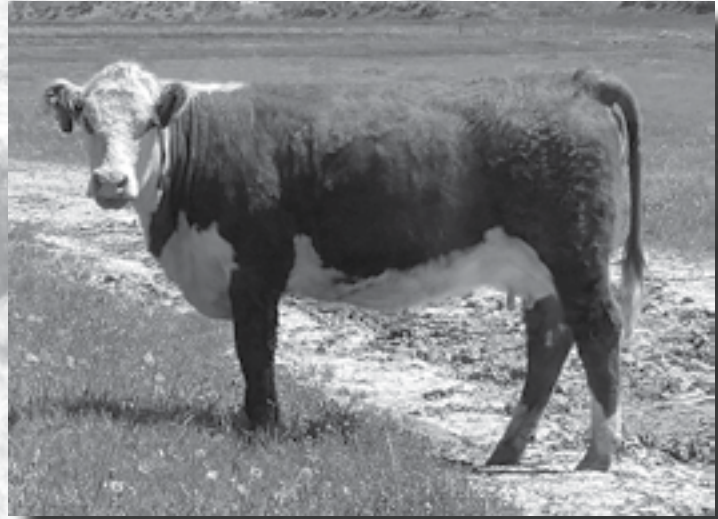
DCR 199B Ella 6358