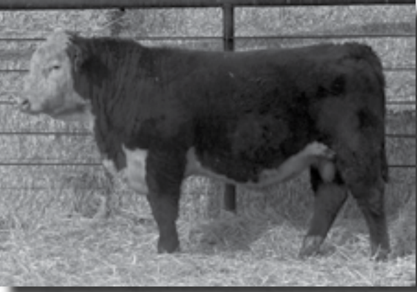
2018 Champion Carcass Steer Hot Springs County Fair Cowboss Son

DCR 8 DCR 199B Cowboss 8032 BW: 79 WW: 570 YW: 745 Age of Dam: 7 4/12/2018 FAT: 0.13 REA: 10.2 IMF: 1.7 PAP: 41 TS: 2