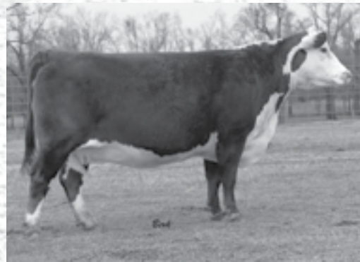
THM TLS Lacey Lou 8763