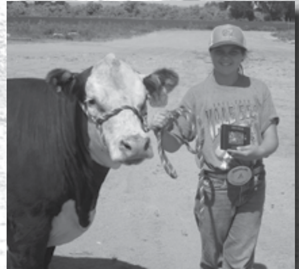
Supreme Female 2019 Hot Springs County Fair