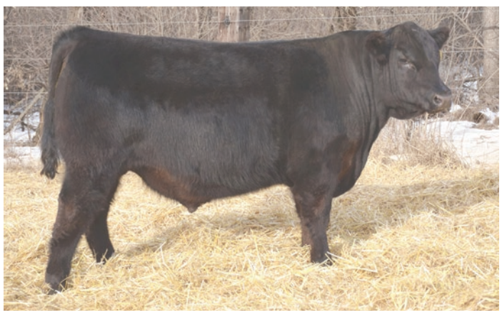
Fast Double Vision 5105 - Lot 52

A very attractive, up headed bull with a long spine and excellent muscle expression over his top and through his rear quarter. He combines a moderate birth weight with a high weaning and yearling weight. He ranks in the top 5% for WW and top 10% for YW.