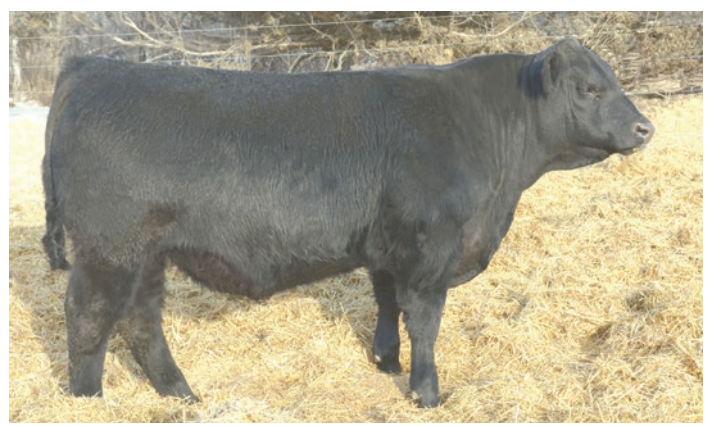
Fast Shock Top 5134 - Lot 49

Actual Weaning Weight: 770 lbs. A moderate frame bull with muscle expression, a wide top, and depth of rib that will catch your eye! He scanned an IMF: 4.21, Ratio: 116 and posts a $F: 77.38 and $B: 148.44 which ranks him in the top 10% for $F, and $B. He also ranks in the top 10% for YW and 20% for WW.