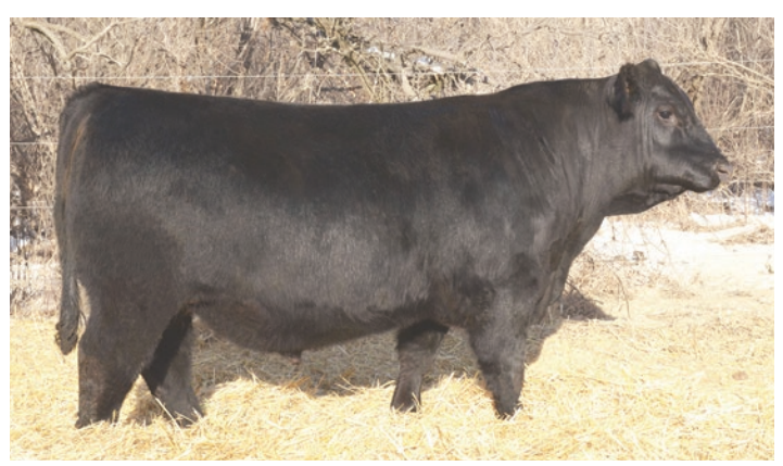
Fast Power Train 59 - Lot 2

Suitable for heifers or cows. A super smooth, long bodied bull with a clean front and laid in shoulders. Maternal great grand dam is a Pathfinder cow. He ranks in the top 25% of the breed for CED.