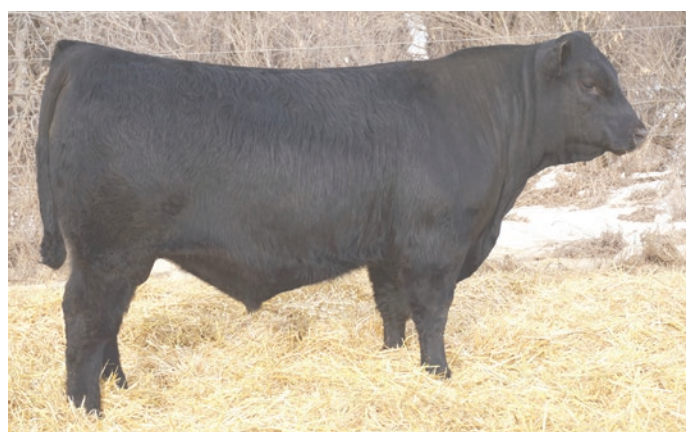
Fast Incentive 514 - Lot 23

A larger frame bull with good depth of rib, length of body, and muscle expression through his rear quarter. His dam is from our superb Primrose Lady cow family and his maternal great grand dam was a Pathfinder cow. He posts a $F: +75.28, $B: +123.25. He ranks in the top 3% for WW, top 5% for YW and top 10% for $W and $F.