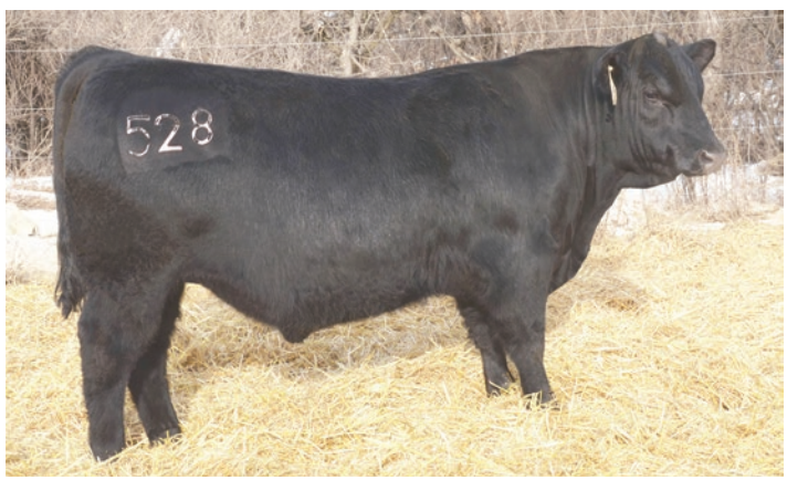
Strommen Coal Power 528 - Lot 9

His dam is a 12-year-old cow still in production and produced a top quality bull! Keep every daughter sired by this bull as his dam is known for longevity, a sound udder, and producing heavy weaning weights.