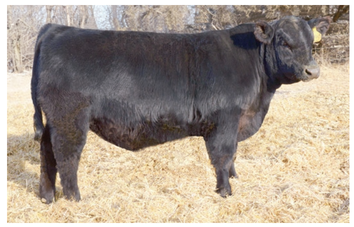
Fast Amber Bock 5147 - Lot 55

numerous high selling bulls. He ranks in the top 5% for WW and 10% for YW.