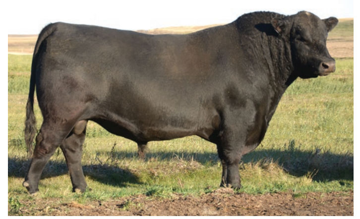
Hart Shock Top 2142

Our Packer sons have tremendous length of body, a little more frame size, and exceptional growth from weaning to yearling. He has a wide spread between BW to YW EPDs and offers an outcross pedigree. His daughters are reported to be exceptional for disposition, fertility and maternal traits. Packer ranks in the top 10% of the breed for YW and $B, top 15% for Marb and $W, and top 20% of the breed for WW and SC.