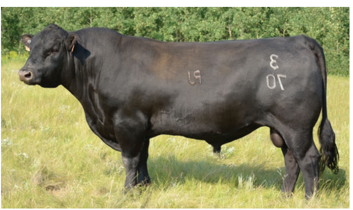
Connealy Power Pro 370

Power Pro has proven himself to be our calving-ease specialist bull! Bred to both cows and heifers, 49 calves sired by him in 2015 had an average birth weight of 74 lbs.! His calves have rapid growth from birth to weaning, and more moderate growth from weaning to yearling. They generally are of a moderate frame size and have a soft, easy fleshing appearance. The Fasts purchased Power Pro in 2014 from Connealy Angus, Whitman, NE. Power Pro ranks in the top 4% of the breed for CED, 3% for BW, 15% for WW, 10% for YW, 2% for M, 5% for Marb, and top 1% for $B.