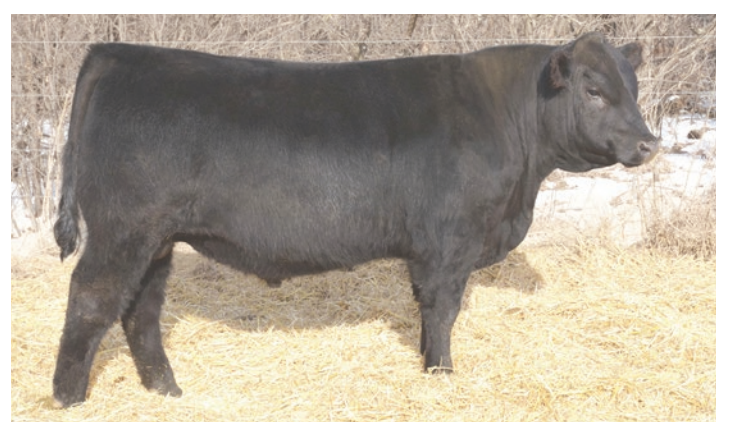
Fast Built Tuff 537 - Lot 1

You want to produce pounds at weaning time? Here is your bull! A power house bull, who is massive and long bodied with sound feet and legs. His dam is a beauty for structural correctness and soundness of udder. He ranks in the top 1% of the breed for WW, YW, SC, and $W, and top 10% for $B. Retaining a 1/3 revenue sharing interest.