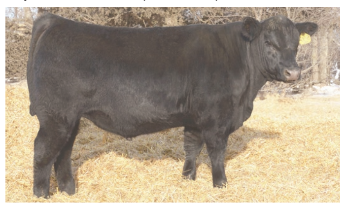
Fast Capitalist 547 - Lot 26

Actual Weaning Weight: 810 lbs. His dam is a 2-time Pathfinder from our outstanding Primrose Lady cow family. Put pounds into your calf crop at weaning with this big, rugged, long bodied bull! He posts a $B: +139.13 ranking him in the top 10%. He is easy to handle and his Doc EPD puts him in the top 1%.