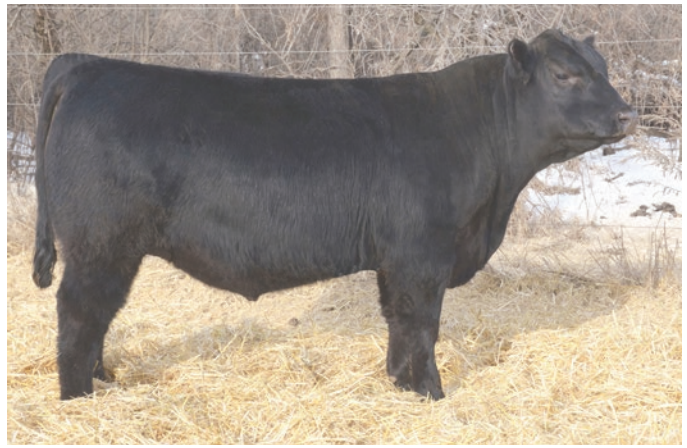
Fast Power Pro 570- Lot 39

A smooth made, long bodied bull with depth of rib and structural correctness. An easy fleshing bull that really put on the pounds in the feedlot! He scanned a RE: 13, Ratio: 102, and IMF: 4.28, Ratio: 118.