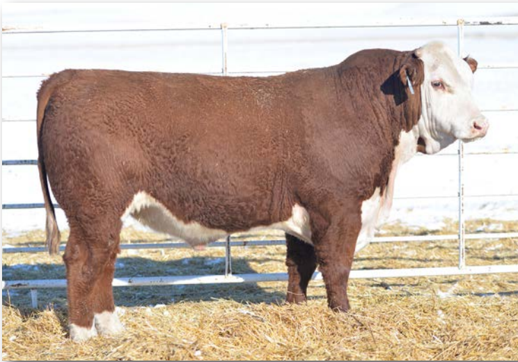
Lot 100 • ECR Cash Flow 4351 ET