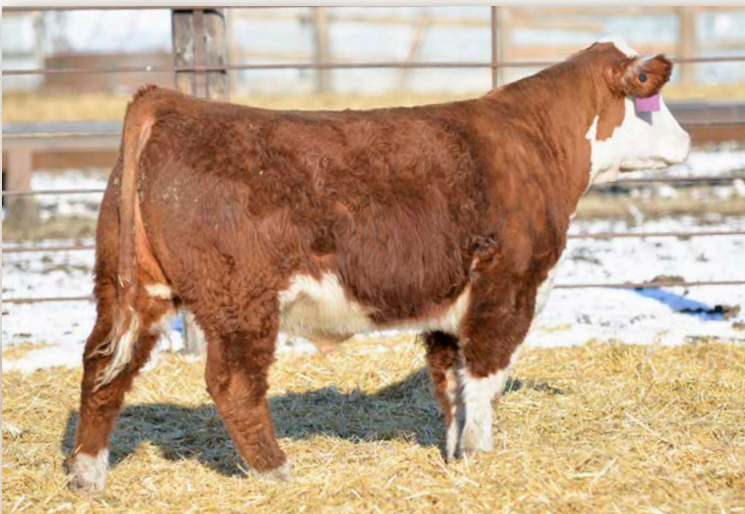
Lot 15 • ECR 43Y Vic Domino 5055

Polled calving ease bull that still has enough weight per day of age and power. Easy fleshing and stout.