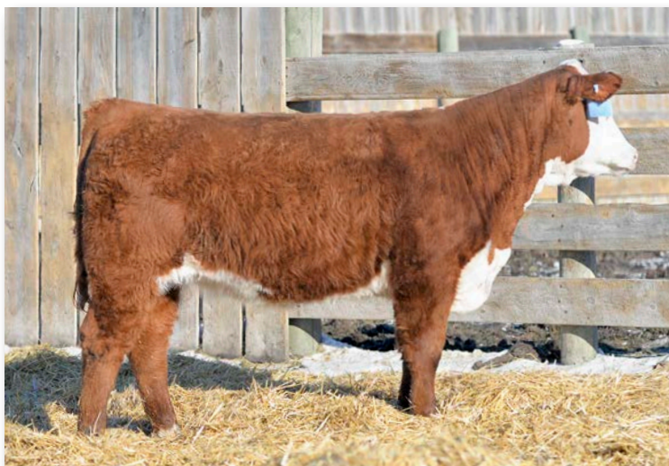
Lot 156 • ECR 0133 Miss Extra 5354

A super complete package. She's feminine yet has plenty of power and muscle shape. She's out of a Bob daughter that goes back to 552. A nice balanced EPD's and a nice one to look at.