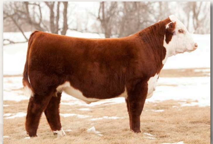
Sire to Lots 102 and 103 • DKF RO Cash Flow 0245 ET

A super powerful Cash Flow son out of the 131 donor. Massive, easy fleshing and powerful with full pigment. He is modern and functional. A bull that will add longevity to your cow herd. Lot 102 is a really sound structured bull that can really get out and move with a long stride. He has that herd bull look. If you decide to use him on papered cows or commercials he will not dissapoint.