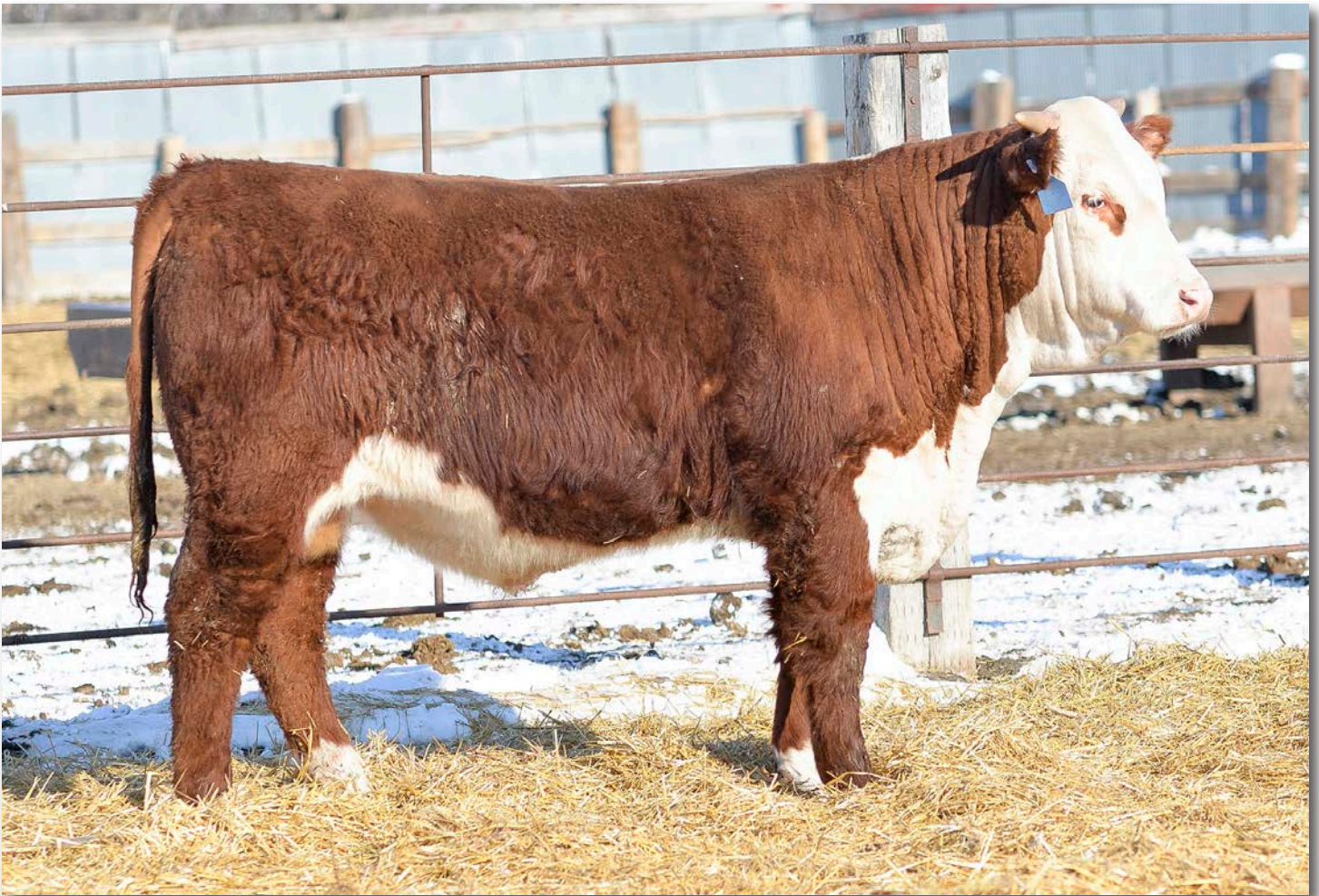
Lot 32 • ECR 2029 Advance 5119