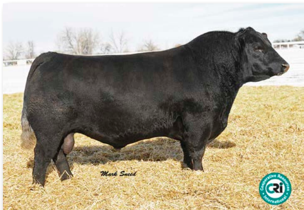
Reference Sire • Cole Creek Cedar Ridge 1V