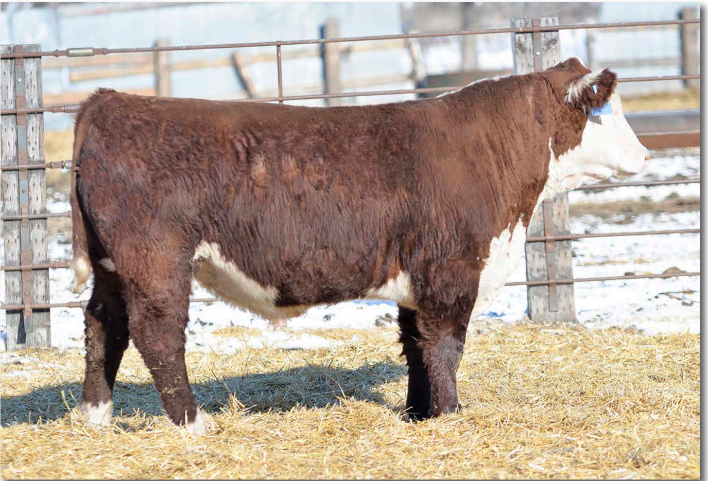
Lot 6 • ECR Bar John 5009