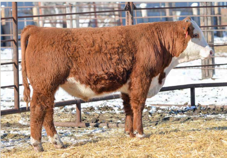
Lot 29 • ECR 2029 Advance 5115

Out of one of my favorite older cows who produces great cattle. Longevity in his background, power in his blood and shows length and power.