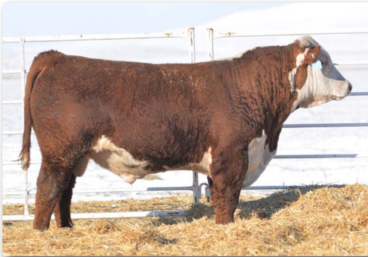
Lot 96 • ECR 2109 Excel Dom 4331

Performance bull with lots of power, pounds and muscle shape. Out of a really good cow. Weaned off at 733 lbs.