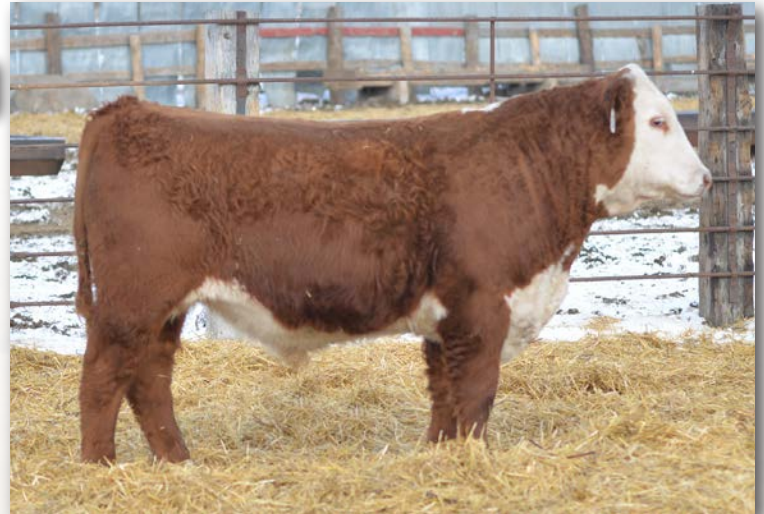
Lot 17 • ECR 177 Domino 5060

This 177 son is out of a first calf heifer and started at just 75 lbs. and still weaned off at 722 lbs. He's a complete bull with length and muscle.