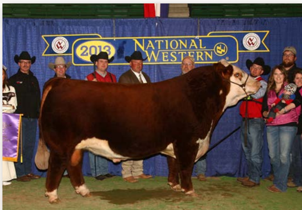
Reference Sire • RST Times A Wastin 0124