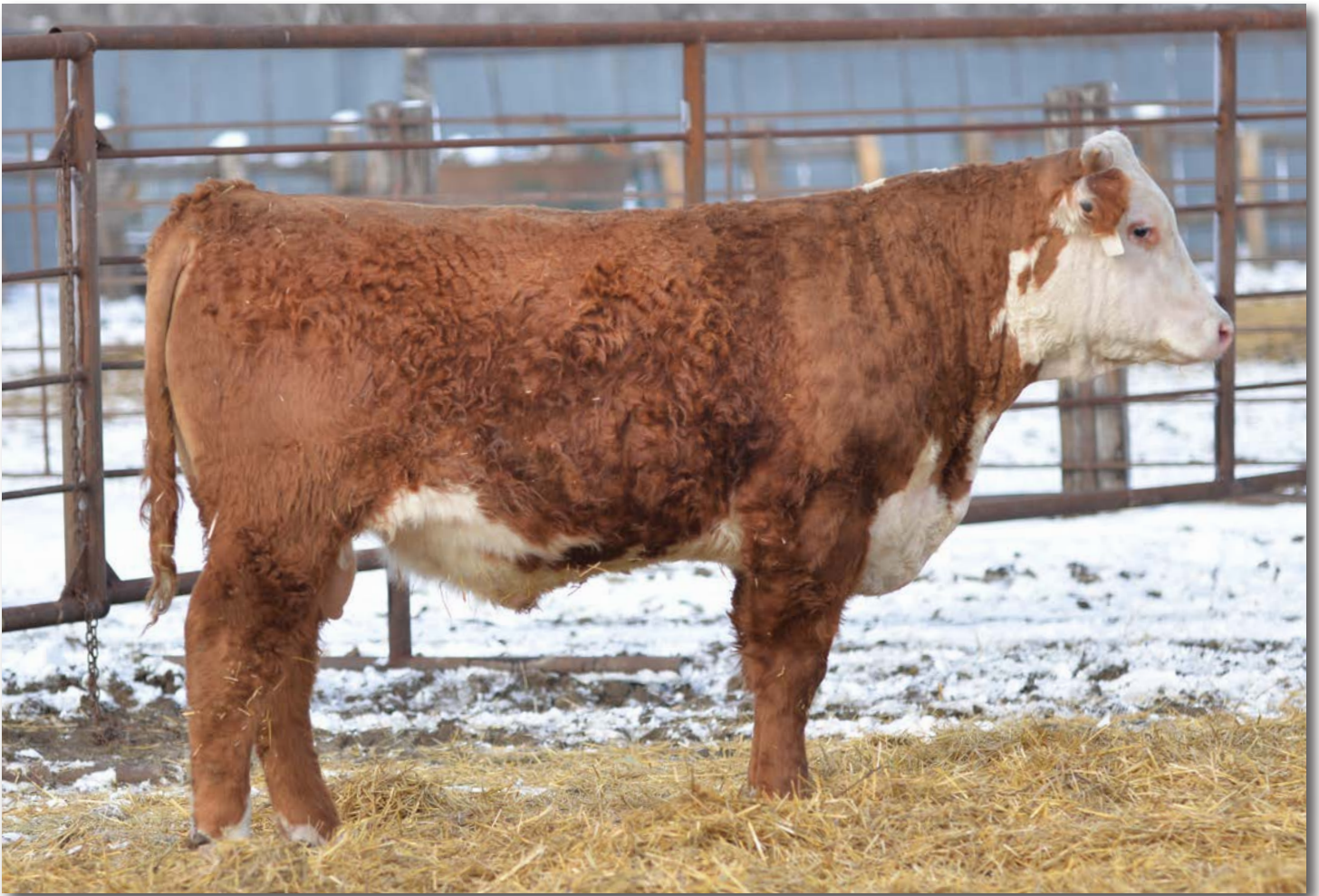
Lot 5 • ECR 2109 Domino 5007