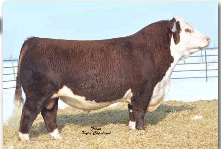
Sire to Lot 31 • CRR 719 Catapult 109

Complete Catapult son with a lot of power backed by a really good Hunter daughter. Muscle shape, thickness and width of skeleton. The Catapult offspring are impressive as a group and this one sets the bar high.