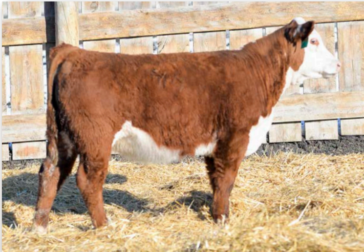
Lot 163 • ECR High Class Lady 5626

Really powerful Game Changer daughter. She is wide constructed, big hipped with more than average muscle shape yet she is still feminine. This one has the pieces to raise those big stout polled bulls.