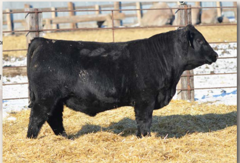
Lot 72 • ECR Imprint 509

Take note of his spread from birth to weaning started off at just 69 lbs. and weaned off at 786 lbs.! Calving ease without sacrificing weight per day of age.