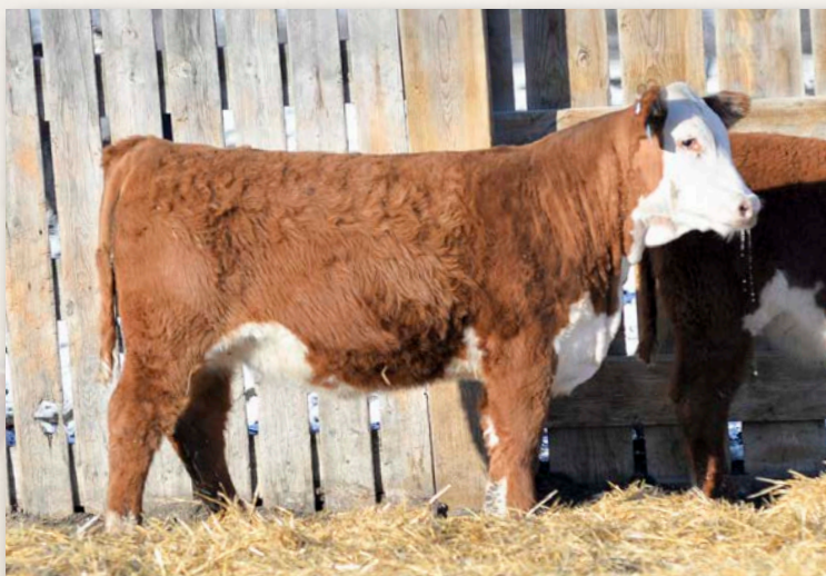
Lot 159 • ECR 0271 Dominette 5458

A really complete female. She contains some powerful genetics in her pedigree including the 0001 donor, 860U and 4202. She's long and sleek fronted, straight in her lines and has a great amount of rib shape and volume. Combine her phenotype with a great set of numbers makes the one a future power cow.