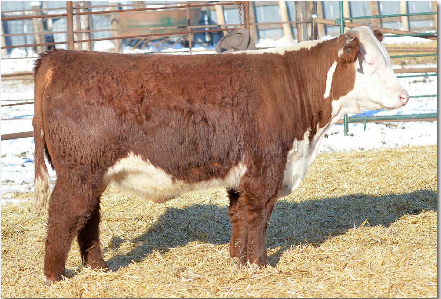
Lot 7 • ECR 2109 Domino 5017