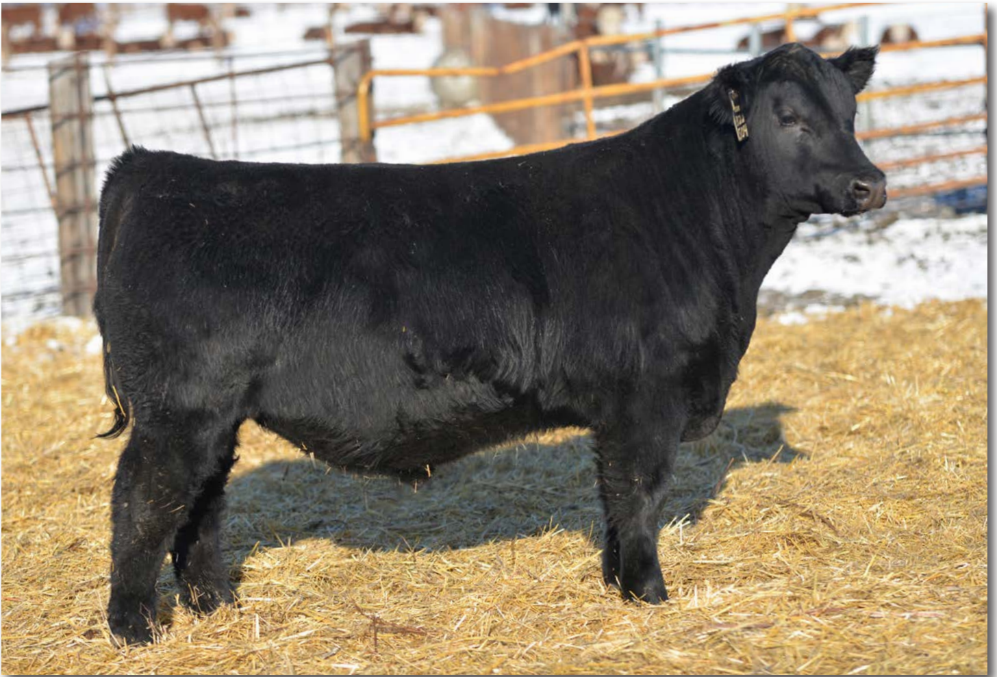
Lot 82 • ECR Effective 5004