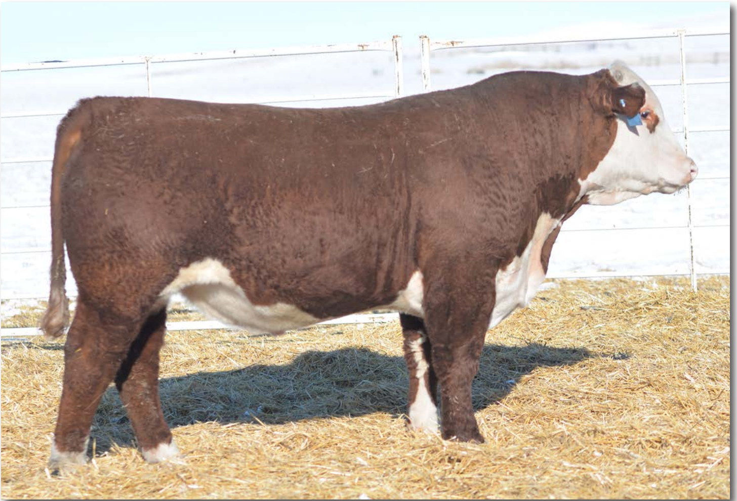
Lot 102 • ECR Cash Flow 4355 ET