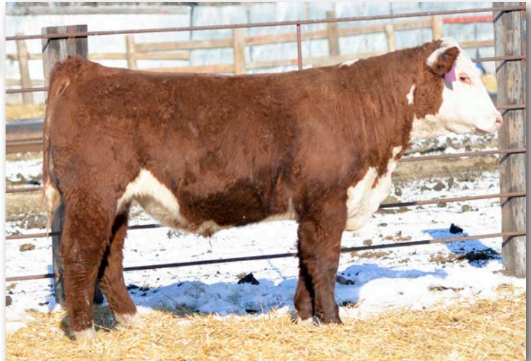
Lot 41 • ECR Bar John 5167

Middle framed, soft made, easy fleshing bull who has plenty of power depth and muscling.