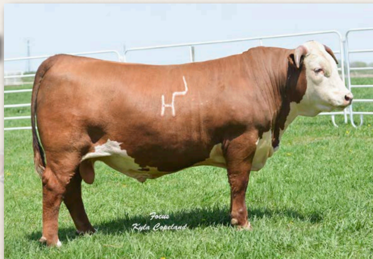
Sire of Lots 116 & 119 • HH Advance 2029Z ET

Lot 120 is a middle framed, sound, functional bull who grew rapidly early through weaning and then maintained a nice middle frame score. He's backed by one of the elite cows on the ranch. 120 IMF ratio.