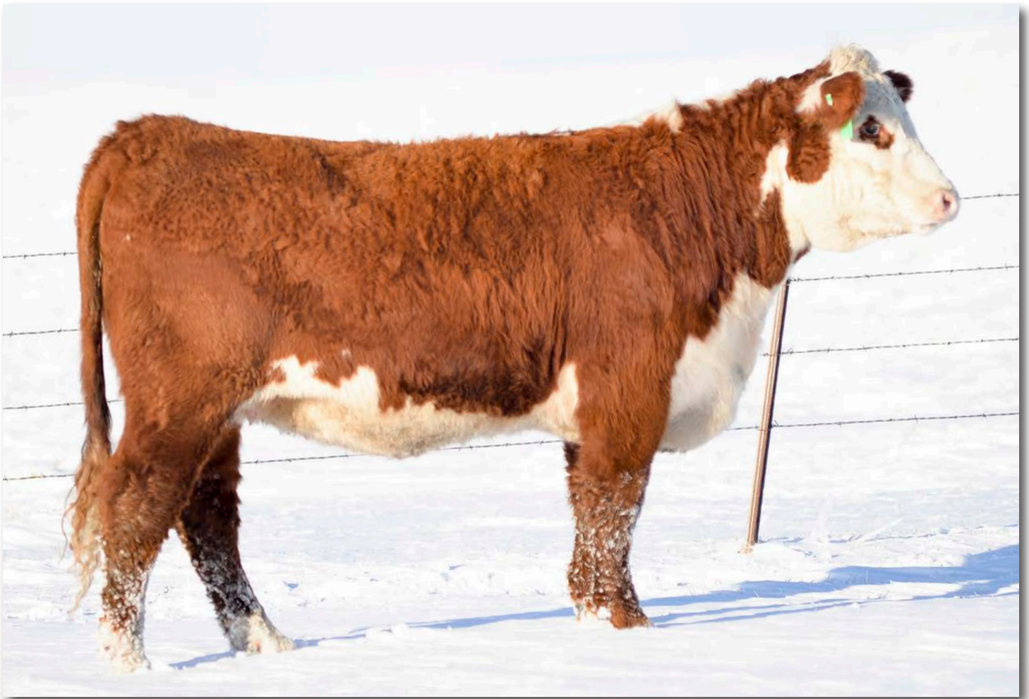
Lot 143 • ECR AJ Miss Turbo 4095