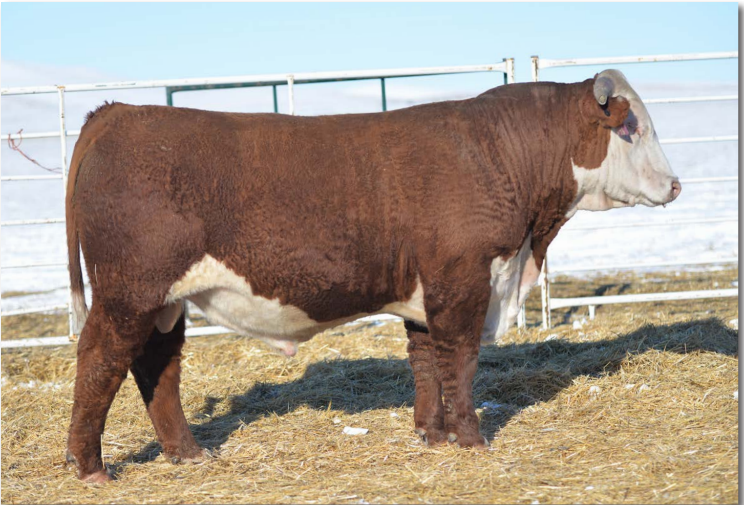
Lot 103 • ECR AL Cash Flow 4369 ET