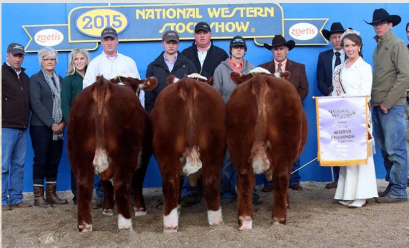
Reserve Champion Pen of Three Bulls 2015 National Western Stock Show, Denver, Colo.