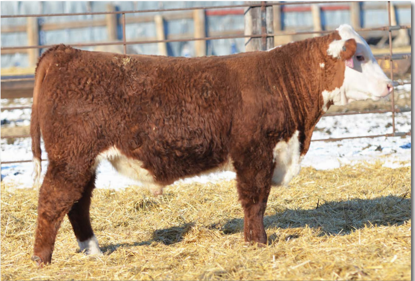
Lot 64 • ECR Meat Maker 5437 ET