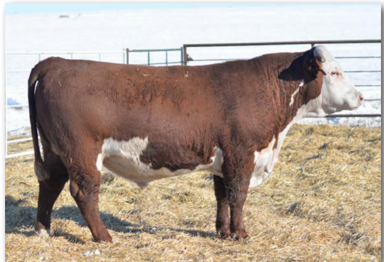
Lot 84 • ECR 2029 Advance 4265

Herd bull candidate. He is great to look at with a tremendous amount of length and tons of body. Packed full of red meat and fleshing ability and ratio'd 135 IMF. He is backed by greats such as 9126J, 477P and the old 664 for on the bottom.