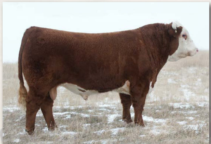
Sire to Lot 83 • ECR L18 Extra Deep 9279 (aka Bob)

This Bob son is out of 9058, a young donor that you will hear more about in the future. This bull is absolutely fault free from so many different angles. Great carcass data scanning with 126 IMF ratio and a big REA. He is heavily pigmented and dark in color. Study him from the side and he gives you a profile like no other, he holds his head high, straight in his lines, level from hooks to pins and has the perfect amount of muscle shape and expression. An easy fleshing bull that has plenty of softness and depth to his rib cage. BUT more importantly he is a maternal powerhouse being a Bob son having the 0028 cow on the top side and the 7195 bull on the bottom side. Expect phenomenal udder quality, teat size and longevity from his offspring. Terms to be announced. Call for more details.