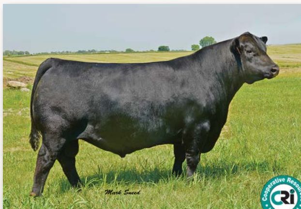
Reference Sire • Schiefelbein Effective 61