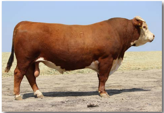
Reference Sire • GB L1 Domino 177R