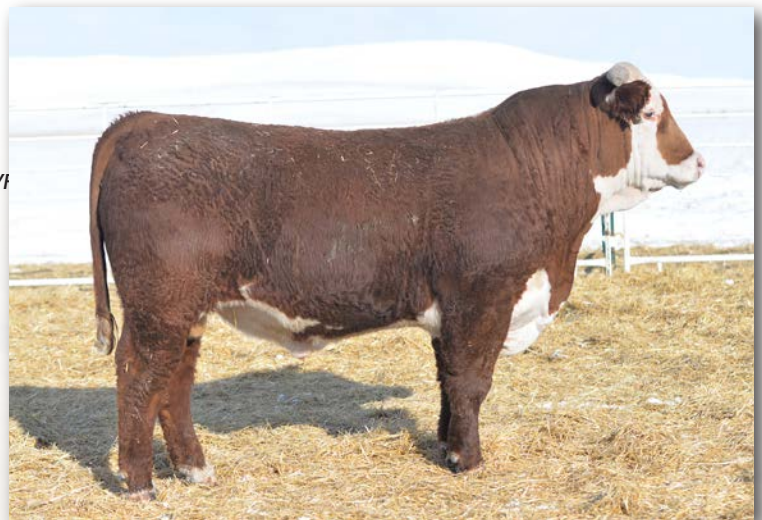
Lot 113 • ECR 2109 Domino 4446

Lower birth weight bull who would be a heifer bull candidate. Fully pigmented with some muscle shape. His daughters will be feminine with great teat size and udder structure and his sons will be straight in their lines with plenty of power.