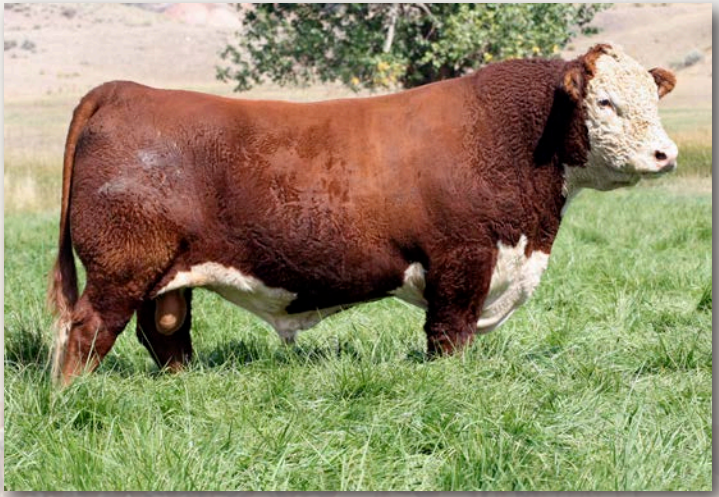
Sire of Lot 22 • NJW 73S W18 Hometown 10Y ET

This horned 10Y son has been a standout since birth. He has always been one that is easy to find in the pasture and is still an easy one to find in this pen of bulls. A really complete bull that is thick throughout and really balances well.