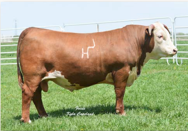
Reference Sire • HH Advance 2029Z ET