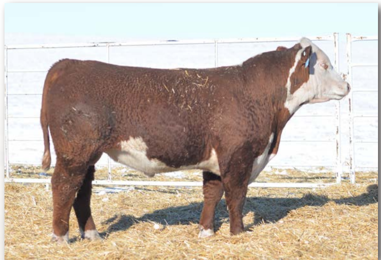
Lot 127 • ECR MNR Who Maker 465 ET

Middle framed, stout, polled bull that balances quite well tying together muscle shape bone and rib shape. Really complete, sound and functional type bull.