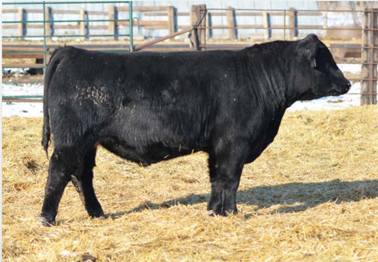
Lot 68 • ECR Cedar Ridge 503

Low birth weight heifer bull prospect yet still weans at 686 lbs. Middle framed, easy fleshing with plenty of muscle shape.