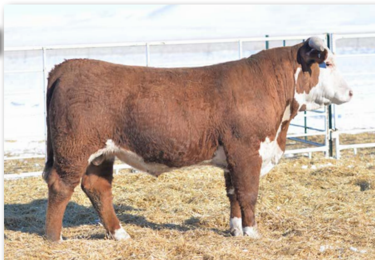
Lot 118 • ECR 0133 Adv Dom 4475

This fully pigmented bull is tremendous in terms of length and thickness. An abundance of performance with loads of muscle shape and power. His offspring will be sure to push down the scale at weaning time.