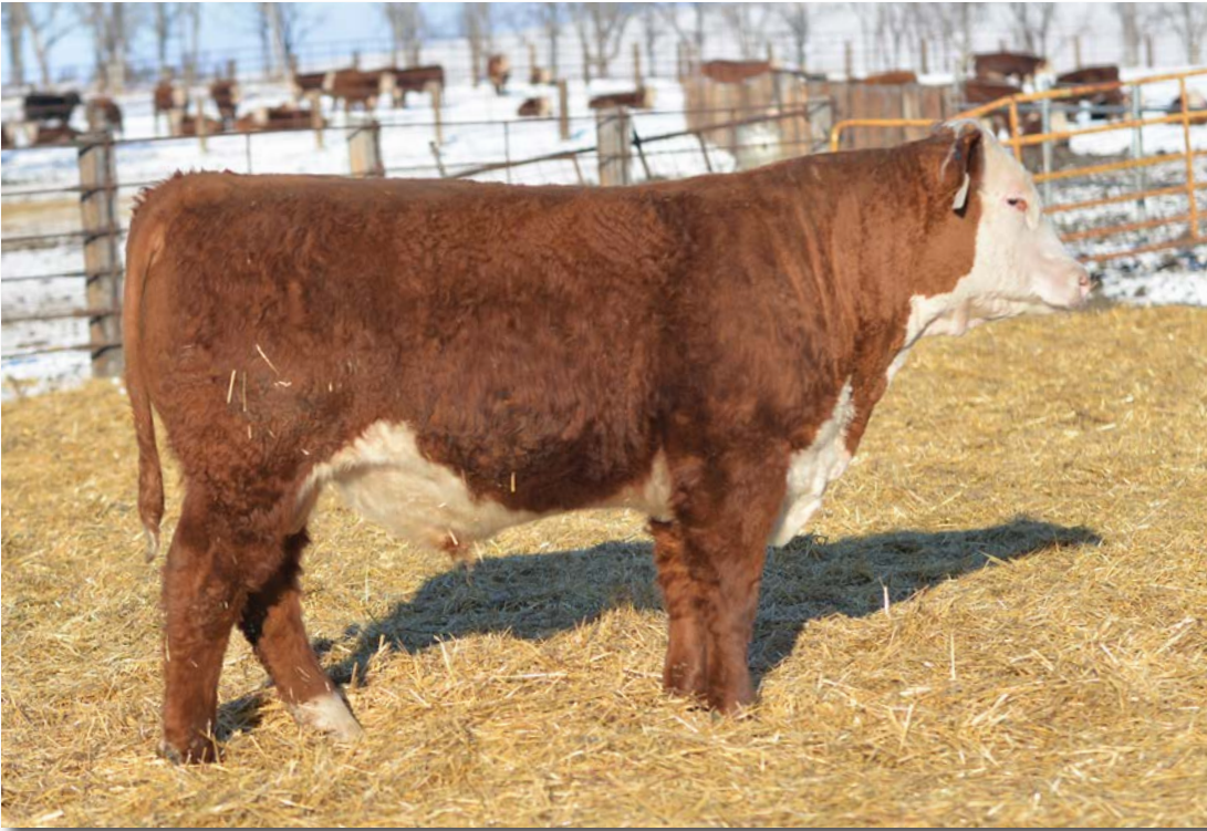
Lot 57 • ECR 2109 Excel Domino 5220