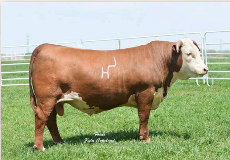
Sire to Lot 38, 40 • CL 1 Domino 2109Z

Long bodied bull with plenty of rib shape and muscling.