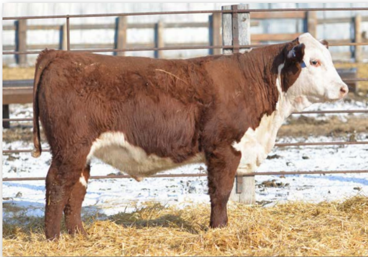
Lot 46 • ECR High Cash Flow 5183

Long as train with big caboose. Straight in his lines and shows extra power, width and muscle shape.