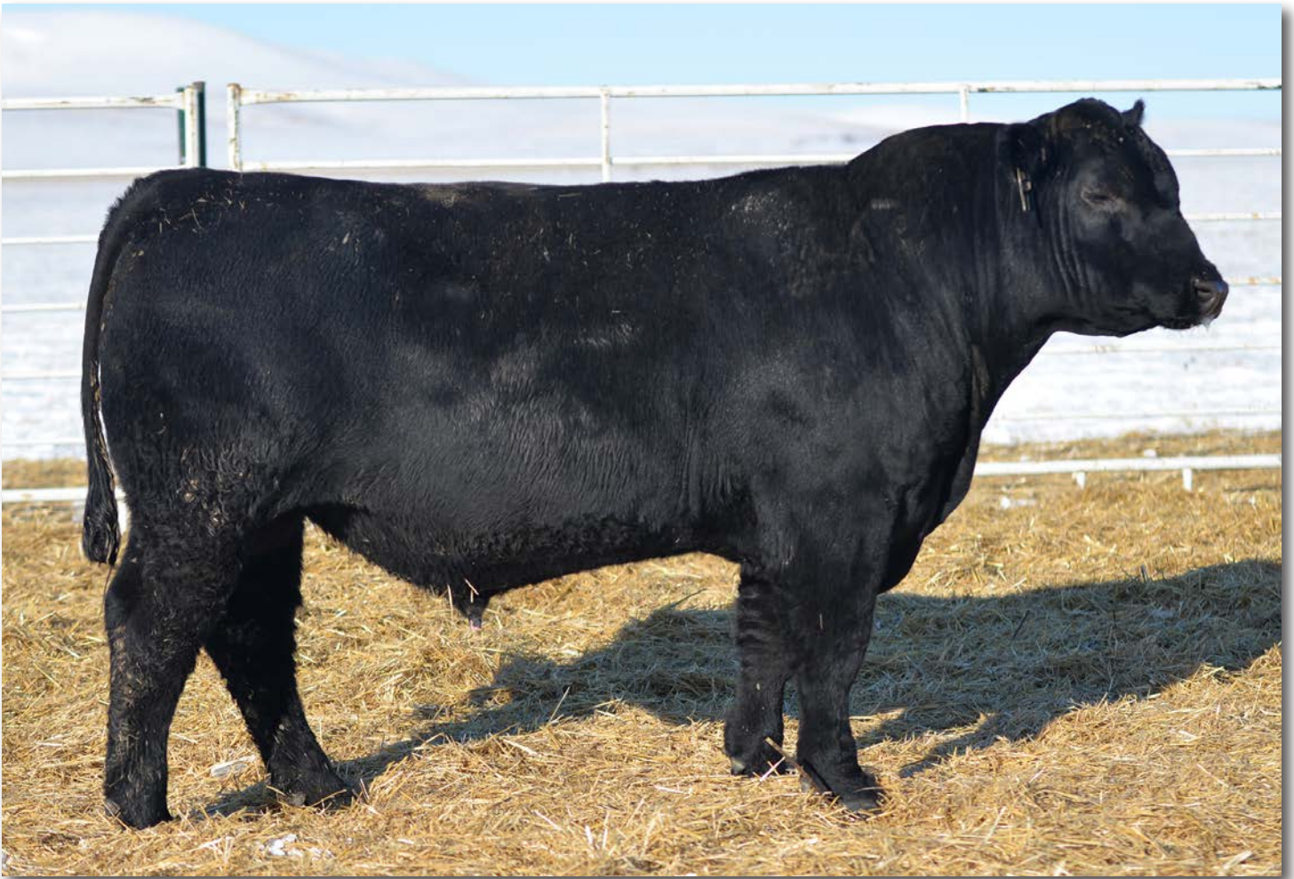
Lot 138 • ECR 6753 Lookout 441 ET