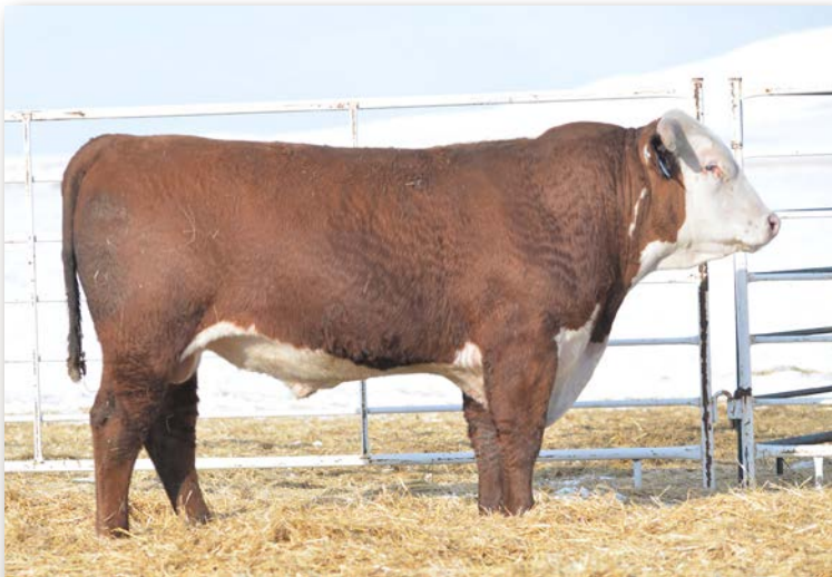
Lot 132 • ECR 2029 Advance 4173

Big, long bodied performance bull with the EPD's to match. Super long bodied and extended yet still maintains enough body and softness.