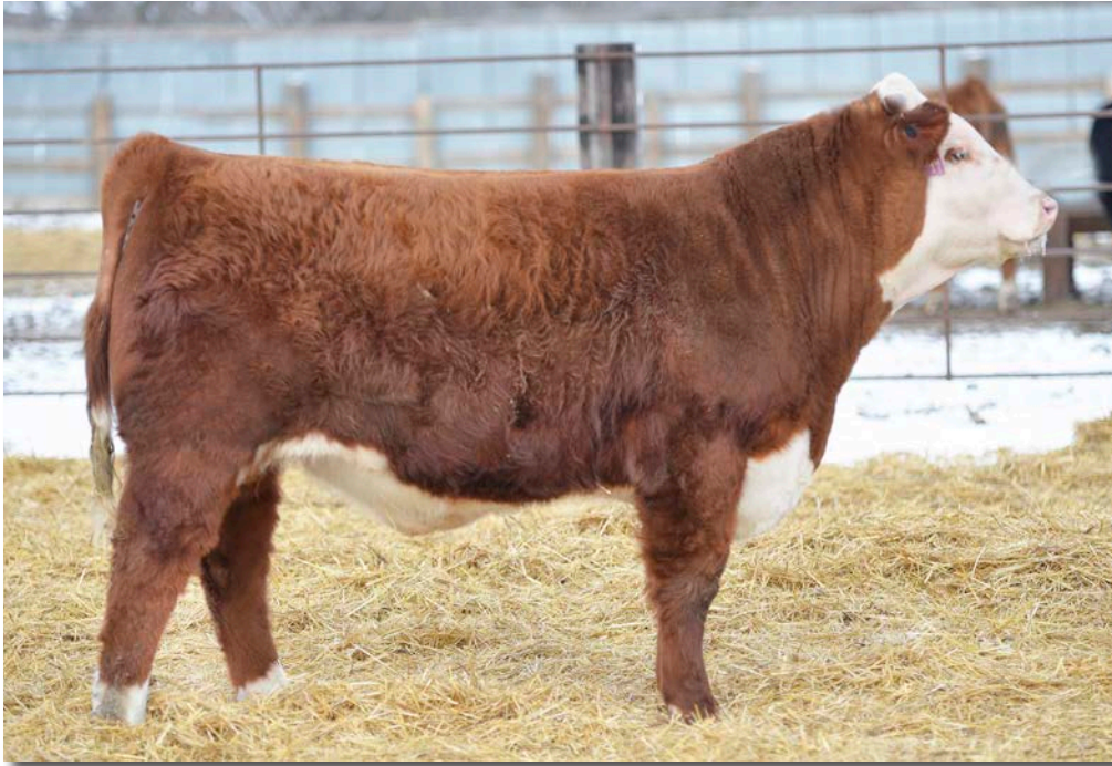
Lot 2 • ECR Wastin' Daylight 5390 ET