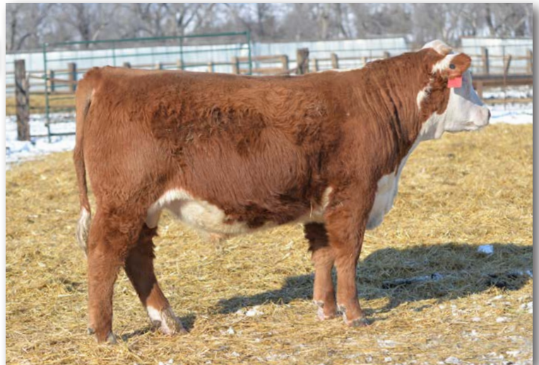
Lot 34 • ECR 2029 Bobs Advance 5122

A big middled, stout featured bull who weaned off heavy. Good pigment, really extended and ties a lot of things together correctly.