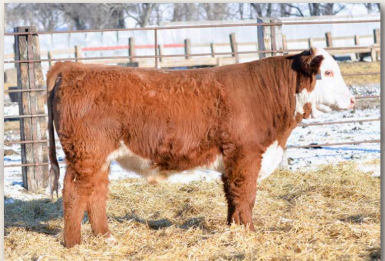
Lot 36 • ECR 2141 Domino 5131

A sound functional type of bull that is fault free in terms of structure and build.