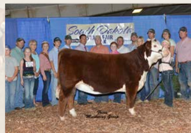
Full sister to Lot 105 Champion Hereford, 2015 SD State Fair Reserve Champion Hereford, 2015 American Royal Jr Show

A huge ribbed bull that is really soft in his design yet has an abundance of muscle shape and power. His mother is a full sister to Who Maker. Lot 105's full sisters have been named Champion and Reserve Champion at the SD State Fair, Spring Calf Champion at the National Western Stock Show and a many time Champion in Indiana. He has power in the blood and the ability to sire cattle with growth and performance that are sure to push the scales down at weaning.