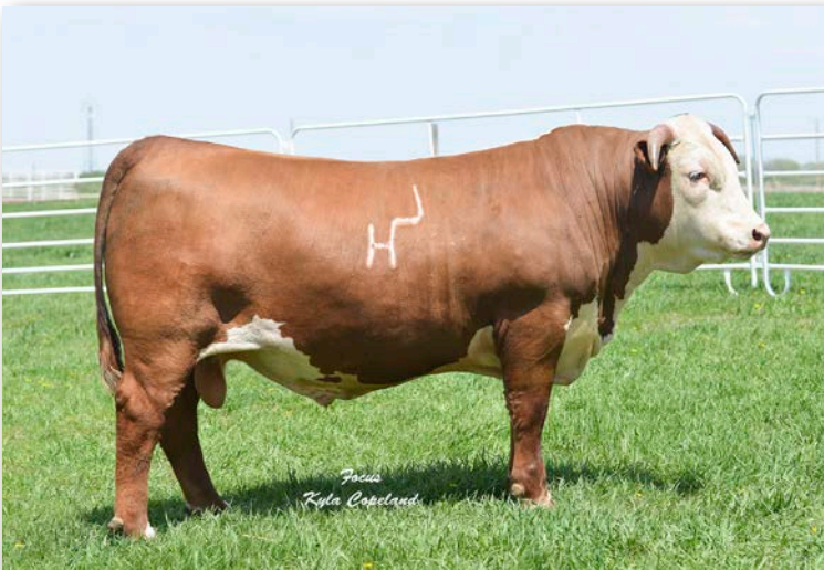
Sire of Lots 28, 29, 30 & 32 • HH Advance 2029 ET

10Y son that replicates his sire in way of type and kind. Soft, stout and wide constructed. Out a consistent producer of quality cattle.