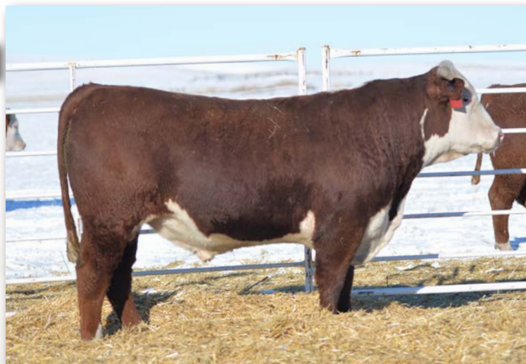
Lot 119 • ECR 2029 Advance 4480

Middle framed 2029 son who has an abundance of muscle shape and depth of body. Great fleshing ability and eye appeal. He is packed full of red meat having a great turn to his top and muscle expression in his hind quarter. Stands with some width of chest and thickness throughout. Good carcass numbers and even better phenotype to go with. He is a little different in terms of pedigree offering a bit more power from Hunter on his bottom side stemming back to breaker. High quality bull.