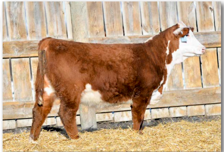
Lot 150 • ECR 1103 Dominette 5256

Well balanced complete Turbo daughter. She's feminine, deep bodied and cowy in her design.