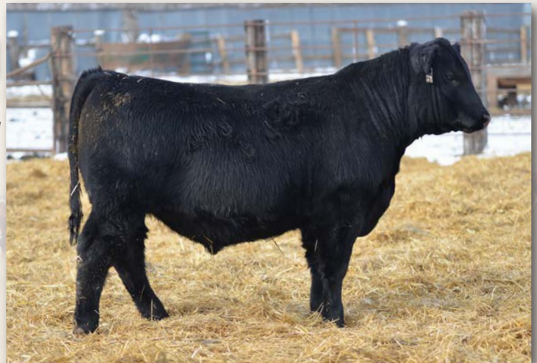
Lot 80 • ECR Resource 536

Really complete Resource son that has plenty of power and length of body. He's deep side, sound structure and is easy fleshing.