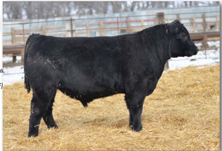
Lot 78 • ECR Cedar Ridge 5190

Super complete Cedar Ridge son out of a first calf heifer that offers power and performance.