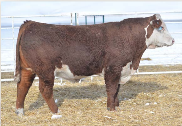
Lot 97 • ECR 2109 Logan 4333

Super soft, middle framed 2109 son out of a polled cow who shows muscle shape and expression. Full pigment and dark in color.