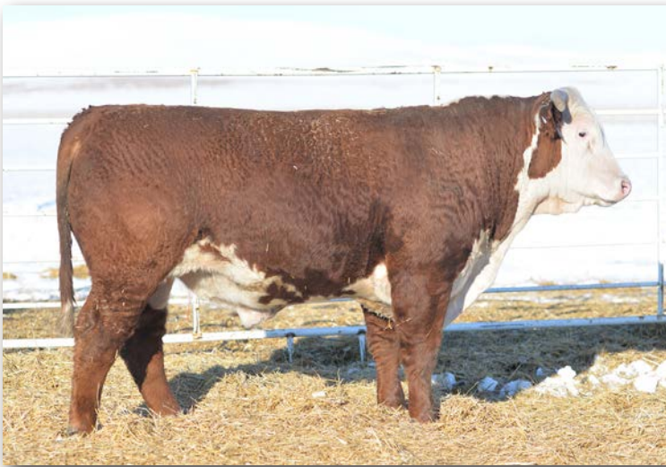
Lot 123 • ECR 2109 Domino 4526

Lot 121 is not only good to look at but he scanned with a 117 IMF ratio separating himself from the group in terms of marbling. This black tailed bull is easy fleshing and has plenty of shape.