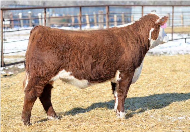
Lot 27 • ECR 10Y Hometown 5108