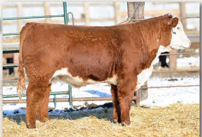
Lot 18 • ECR 2109 Domino 5064