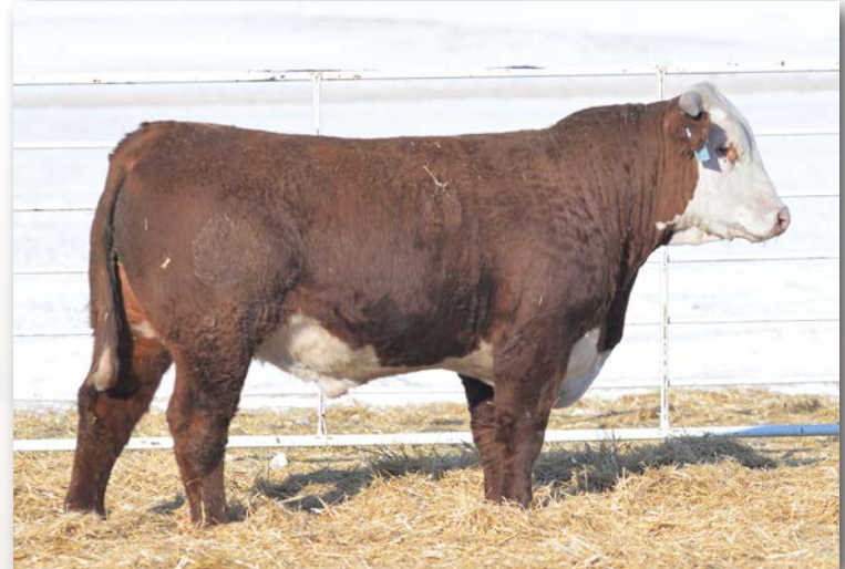
Lot 92 • ECR 0133 Advancer 4299

Red eyed, short marked, power bull. Loads of muscle shape down his top and throughout his hind quarter.