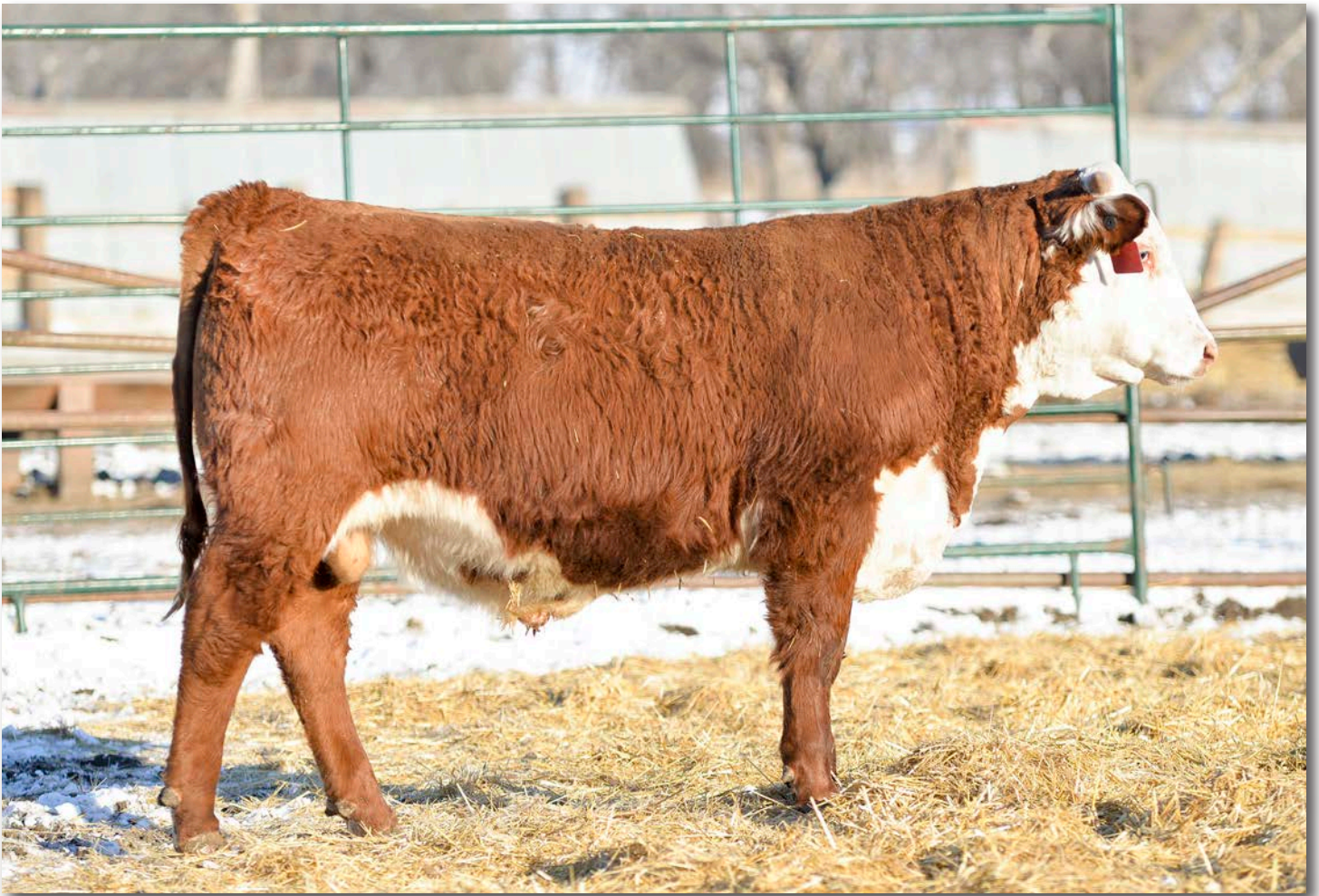
Lot 55 • ECR 2029 Adv Domino 5204