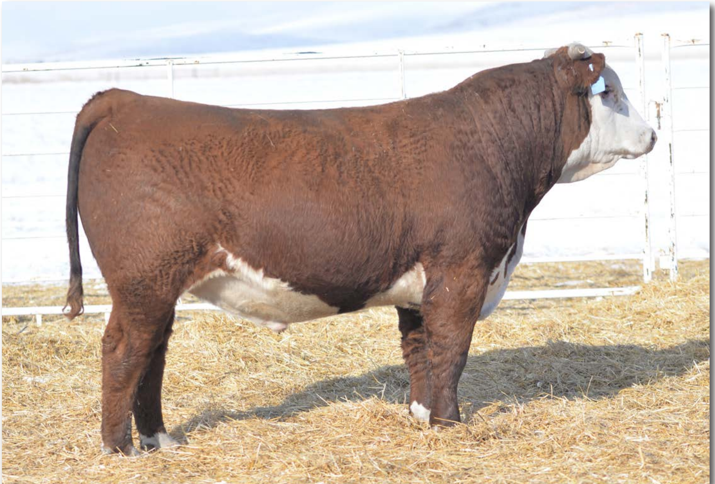
Lot 83 • ECR Extra Deep 4264 ET

We are really excited about this years group of two-year-old bulls. This group of bulls predominately come from the second group of cows calving from mid March through May. In this group of cows you will find calves sired by AI sires and the bulls resulting from embryo transplant. The quality has never been this good as you will find great bulls scattered throughout the offering out of proven cows and donors. This group of bulls leave the yards as soon as the grass has greened in the spring and are on their own until fall without supplement, and then are fed a high roughage ration out on pasture where they have room to travel. They are sound, hard in their condition and ready to work and last.