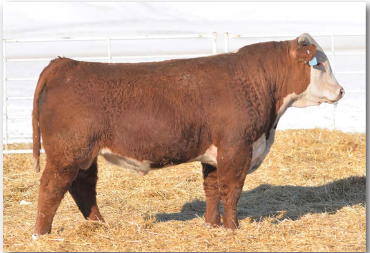
Lot 101 • ECR Extra Deep GE 4352 ET