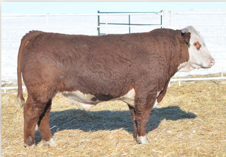
Lot 133 • ECR 88X Ribeye 4194

Super complete son of 2029 that is straight in his lines, deep sided with plenty of muscle shape who scanned with extra IMF.