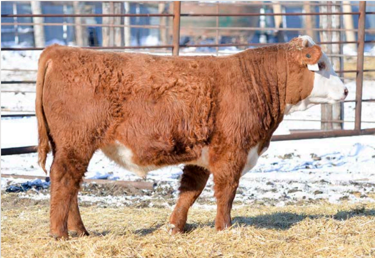
Lot 13 • ECR 177 Domino 5048

This bull is packed full of power. Lots of muscle shape in his hind quarter, great turn to his top and has a tremendous amount of width to his skeleton. Started off with a lower birth weight and still came in off the cow with one of the heaviest weaning weights of the group.