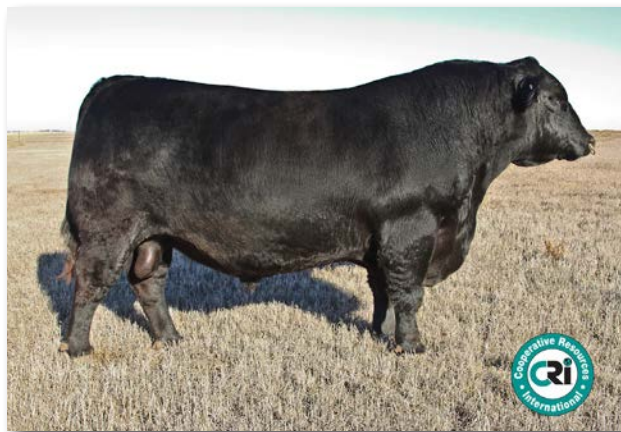
Reference Sire • Jindra Double Vision