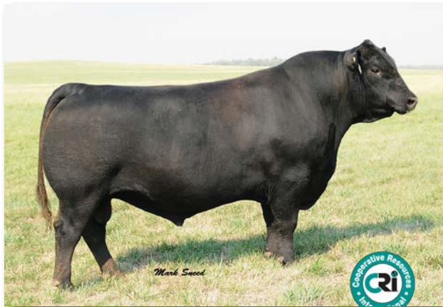
Reference Sire • Connealy Imprint 8317