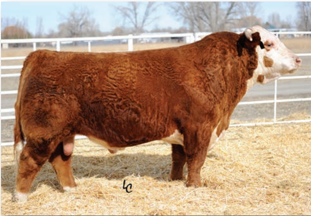
Reference Sire • Churchill Sensation 028X