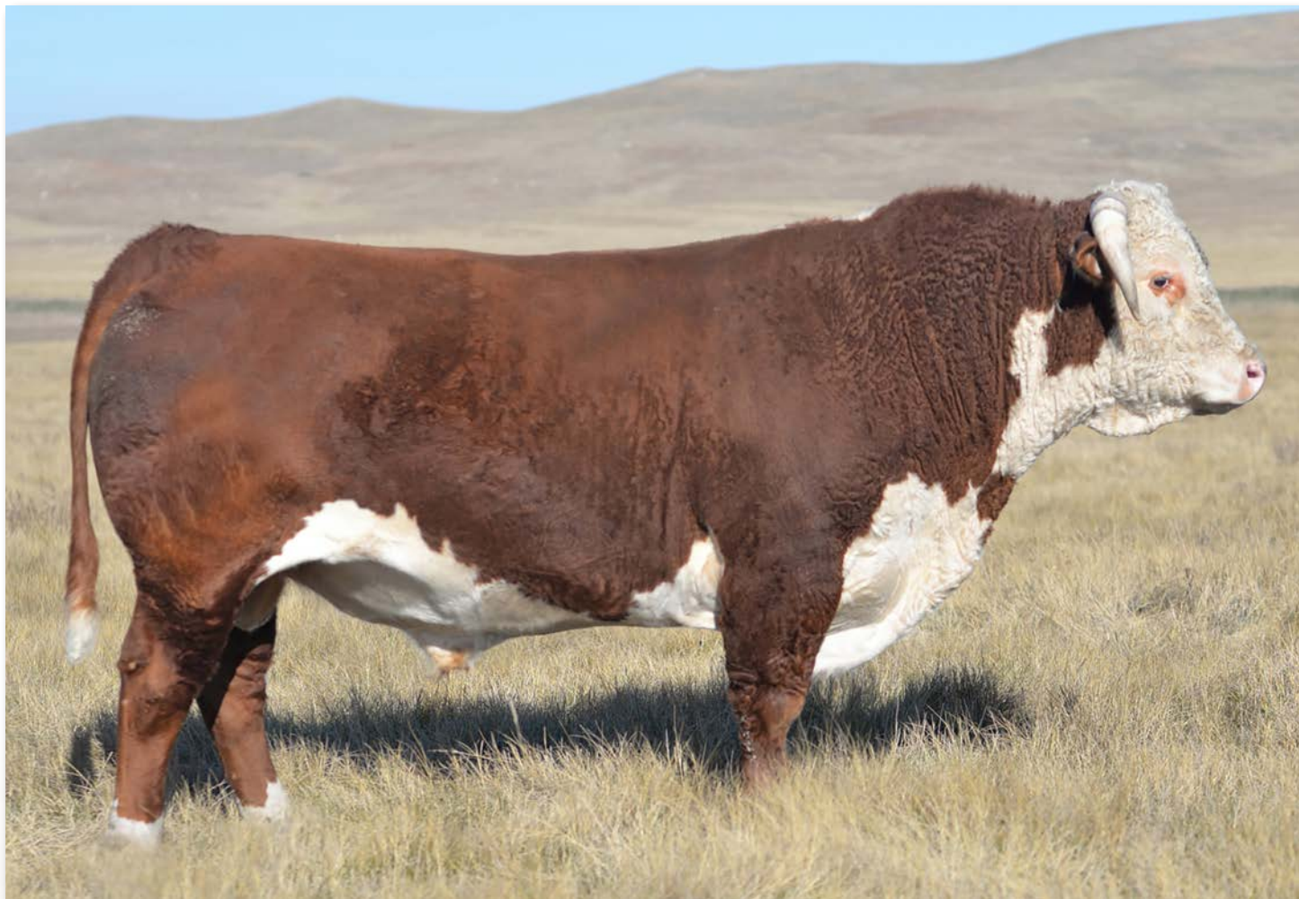
Reference Sire • CL 1 Domino 2109Z