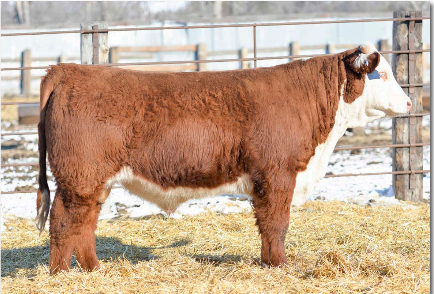
Lot 53 • ECR 1103 Turbo 5201