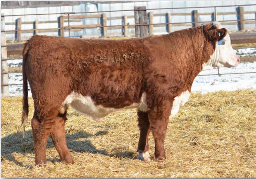
Lot 51 • ECR 2109 Domino 5191