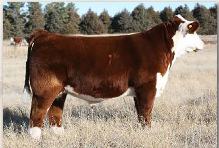
Sire of Lot 111 • H BK CCC SR Game Changer ET

High quality, dark red bull with an abundance of pigment including a red patch on his face. Long bodied, deep and sound.