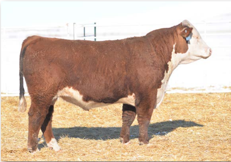
Lot 121 • ECR 1103 Turbo 4497