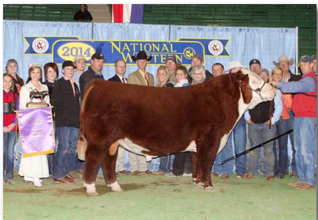
Reference Sire • ECR Who Maker 210 ET