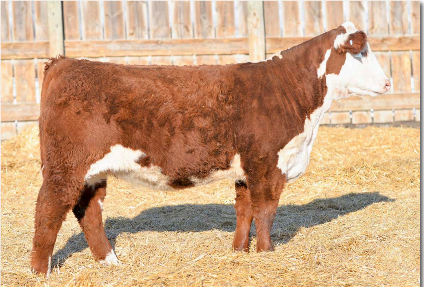
Lot 147 • ECR 0245 Miss Sparkle 5117