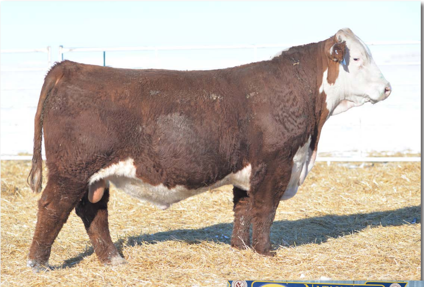
Lot 105 • ECR 2296 Flo Sensation 4387 ET