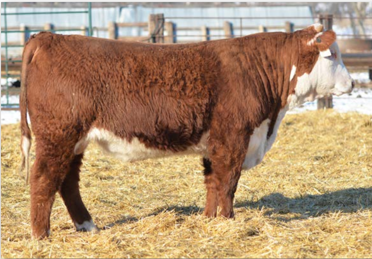
Lot 25 • ECR 2141 Domino 5098