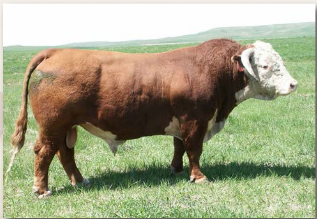
Reference Sire • ECR 4202 Dakota Lad 9022