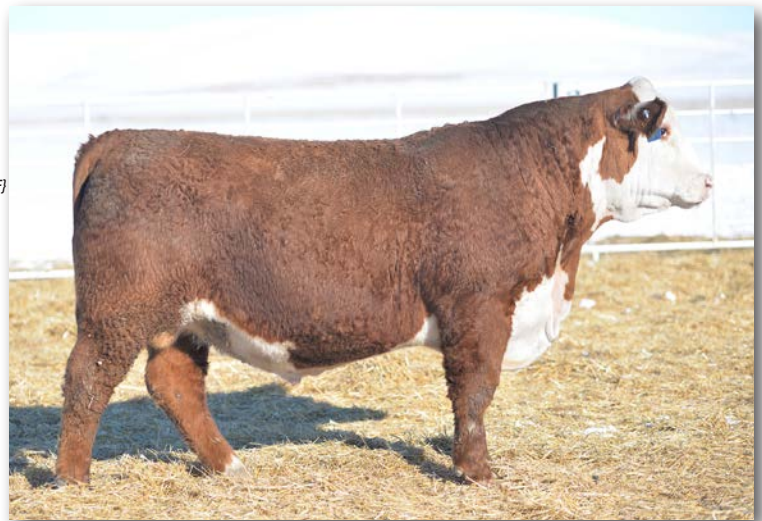
Lot 111 • ECR Game Changer 4432

Really complete polled bull who ties a lot of things together correctly. Weaned off heavy with loads of muscle and body.