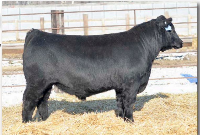
Lot 71 • ECR Resource 506

Real nice Angus bull that is good structured, big footed and started life with just a 72 lb. birth weight.