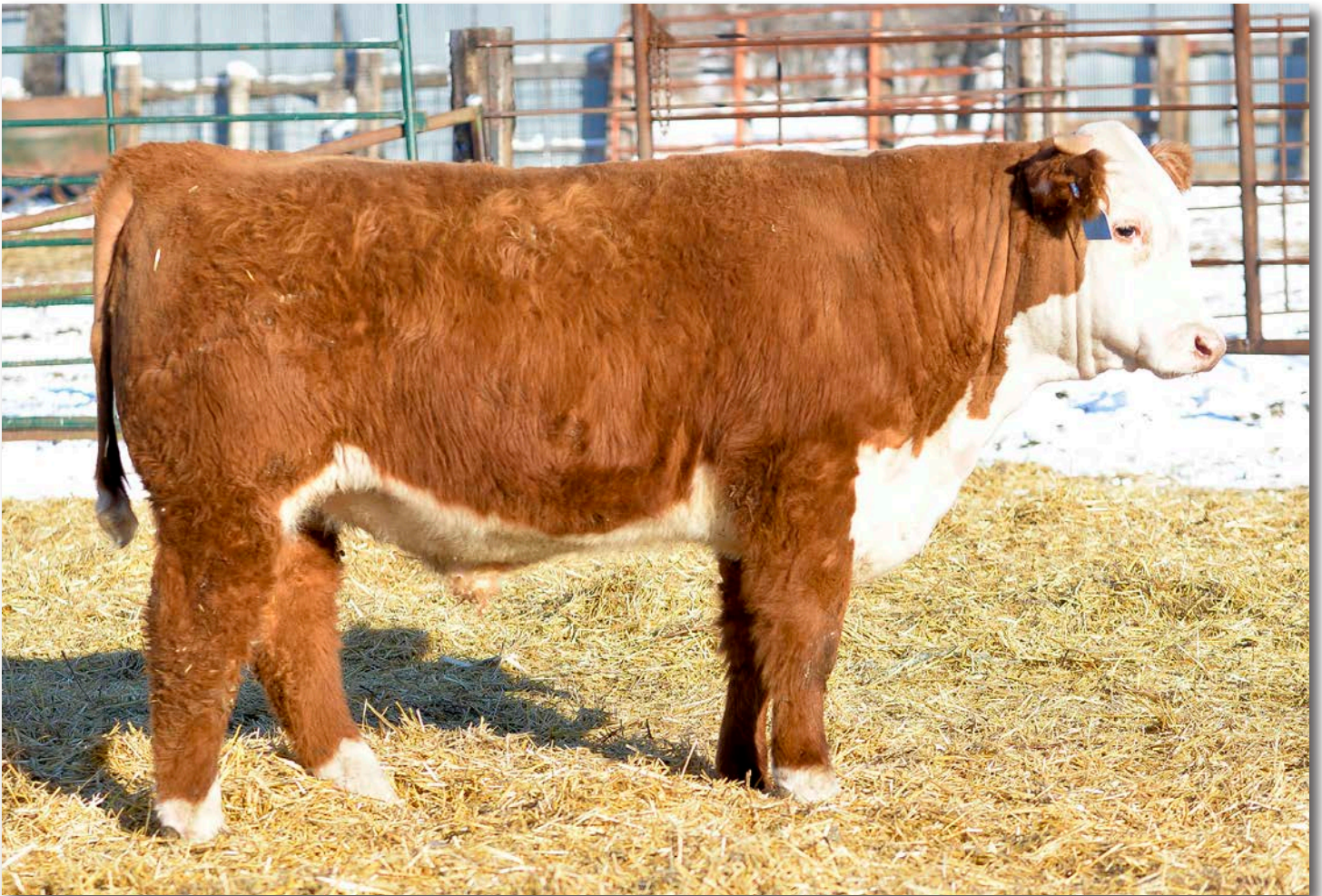
Lot 24 • ECR 394 Domino 5096