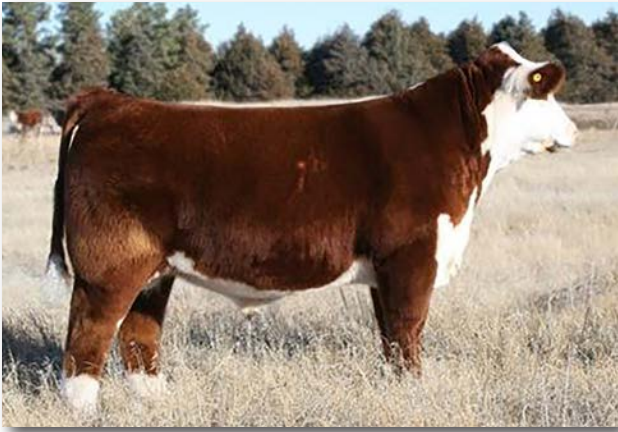
Reference Sire • H BK CCC SR Game Changer ET