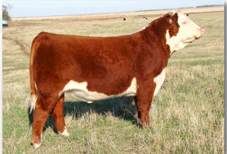
Sire to Lots 35, 37 & 42 • ECR AL Ree Heights 3003 ET

A super stout, wide constructed bull with plenty of power and muscle shape.