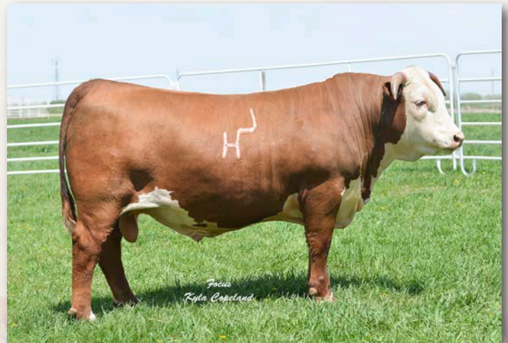
Sire to Lot 99 • HH Advance 2029Z ET

Carcass bull and so much more! Lot 99 is a big, stout and rugged bull. Lots of muscle shape and depth of body. 108 REA and 125 IMG ratio make him a standout as far as carcass with the look and pedigree to make him valuable in many different scenarios. Expect great uddered females out of this bull and his sons to be powerful. He reads with excellent carcass and growth giving him a $34 CHB.