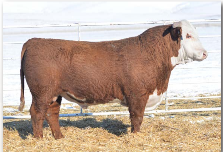
Lot 85 • ECR 0271 Domino 4266

Red necked, moderate, easy fleshing bull with an abundance of muscle and power. Out of a tremendous 7195 daughter. Expect superb udder quality without sacrificing carcass traits. 119 IMF ratio.