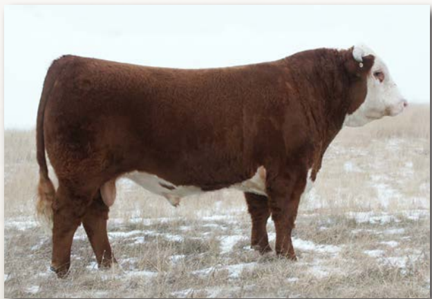
Reference Sire • ECR L18 Extra Deep 9279 (aka Bob)