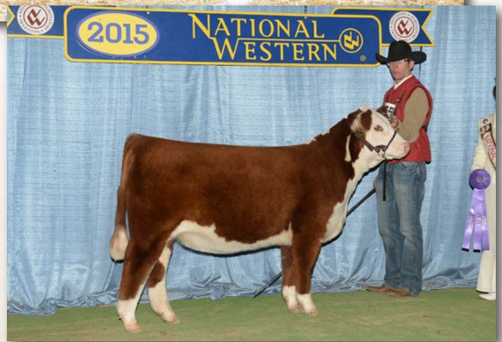
Full sister to Lot 105 • Spring Calf Champion, 2015 NWSS