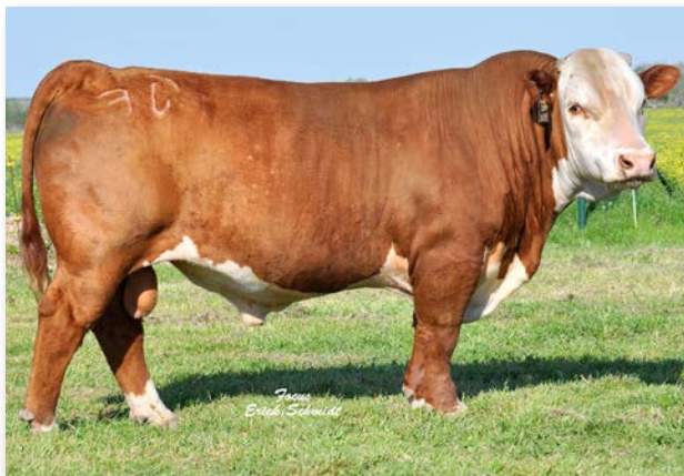
Reference Sire • NJW 98S R117 Ribeye 88X ET