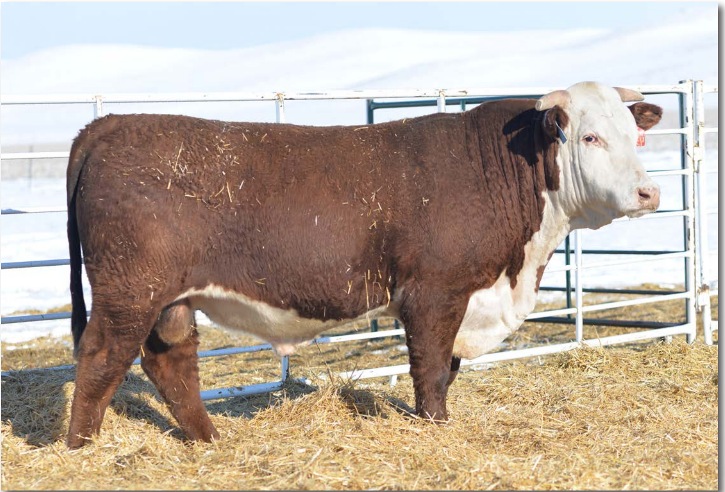
Lot 99 • ECR 2029 Advance 4350