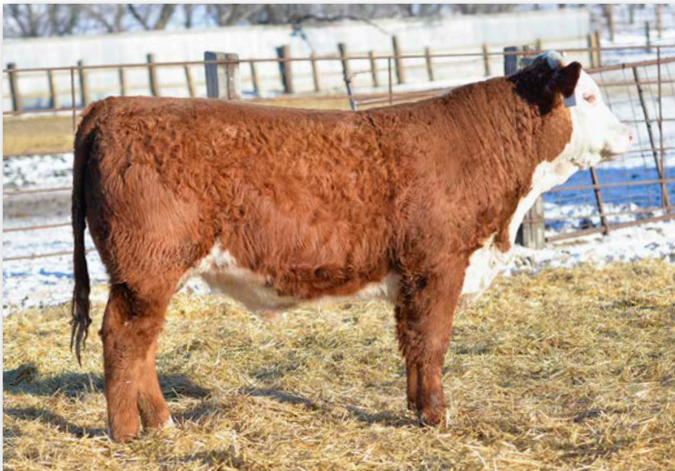
Lot 59 • ECR 2109 Domino 5228