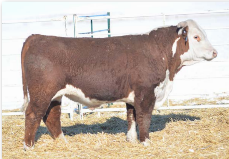
Lot 114 • ECR 1103 Turbo 4447