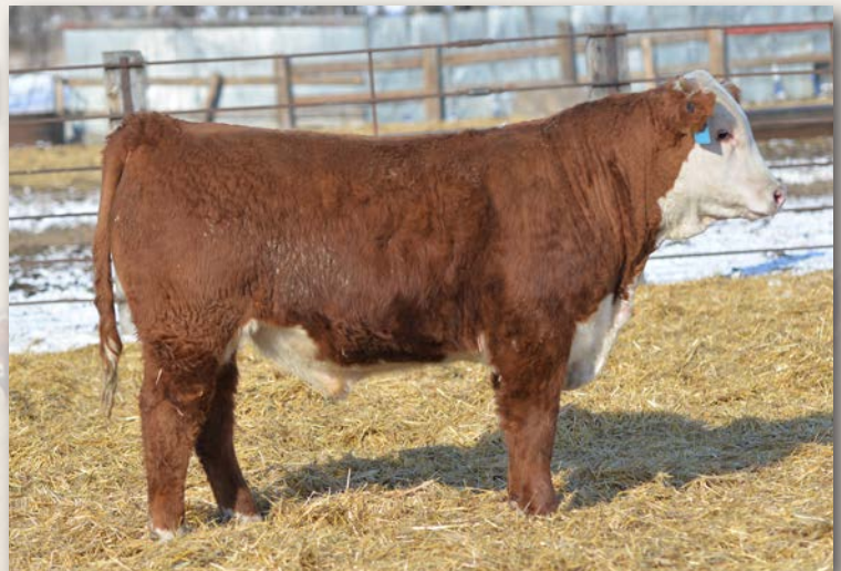
Lot 43 • ECR 9279 Extra Deep 5175

Lot 43 is a long bodied Bob son the has a lot of muscle shape and plenty of depth. On his cow side he combines 175E and 2110. Expect his offspring to open up with a larger than average ribeye.