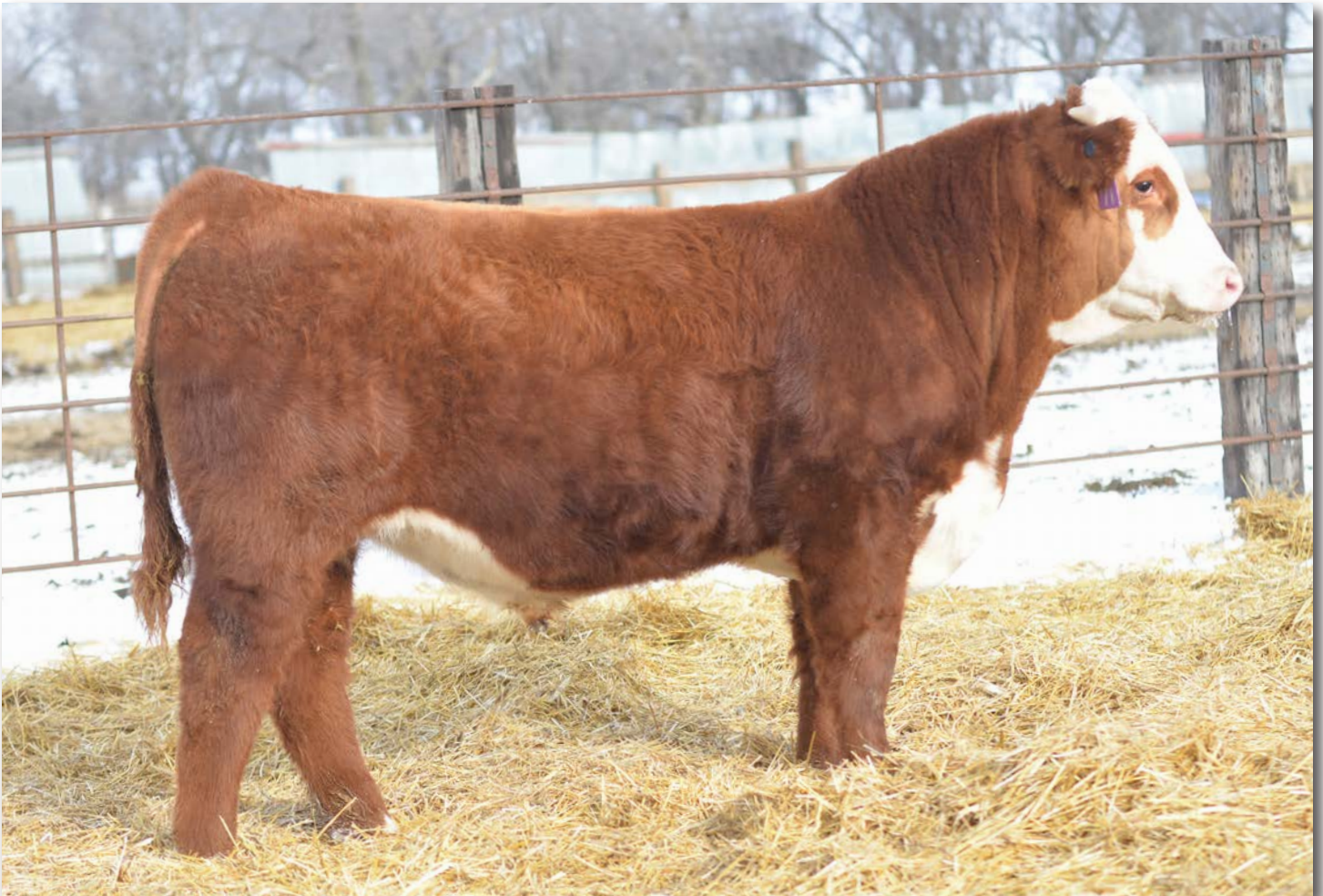
Lot 1 • ECR Burning Daylight 5335 ET

The yearling bulls come predominately from the group of cows calving late January through mid March with the exception of the Denver pen bulls and a few others. These bulls have been on a high roughage ration at a low MCAL to ensure longevity. We want our bulls to be able to work hard and last years without any problems. You will find many 1/2 and 3/4 brothers in this offering to help you to have a consistent calf crop. Most all of the bulls in this group are the result of Artificial Insemination. Carcass data, scrotal and a projected yearling weight will be available on sale day. If there are any questions on pedigrees or any other information you are interested in please ask.