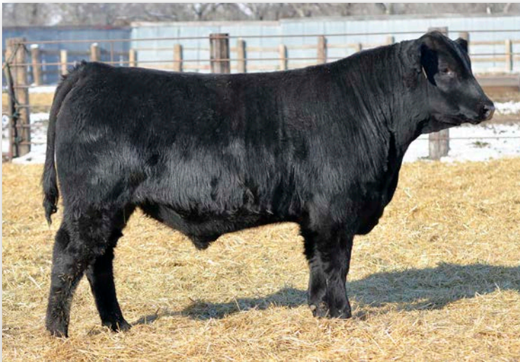
Lot 74 • ECR Resource 512

This Prowler son is an absolute meat wagon out a consistent cow that produces a good one every year. He's long bodied, deep sided and has that herd bull look and presence.