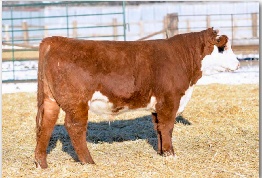
Lot 52 • ECR 1103 Turbo 5193