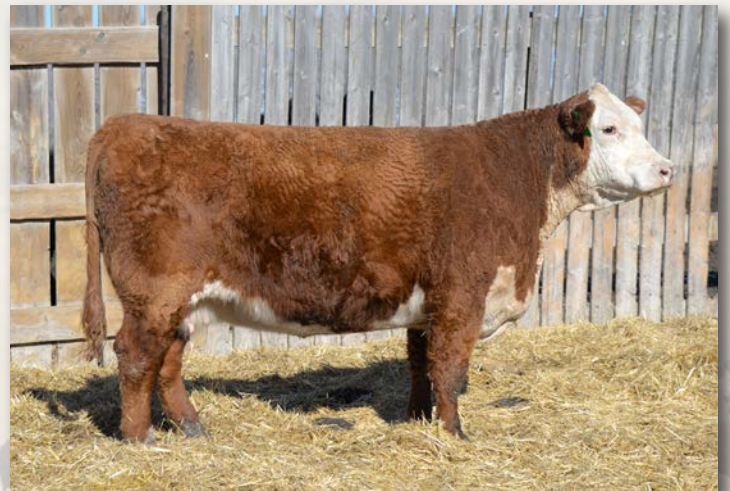
Dam to Lots 1-3 • ECR L18 Gen Lady 6131

Lots 1,2 and 3 are the members of our Denver pen of three. These bulls all offer a tremendous amount of power, length and eye appeal. They are wide constructed, heavy muscled, deep and easy fleshing. Their donor dam is a direct daughter of L18 out of the 131 donor. The 6131 donor and 131 donor have left their mark significantly on our herd with herd bulls and numerous daughters retained in the herd. These bulls are no accident, they are backed by a great cow families. They are sound, functional type bulls that will work in many scenarios to improve your cow herd and at the end of the day the weight and marketability to your calf crop.