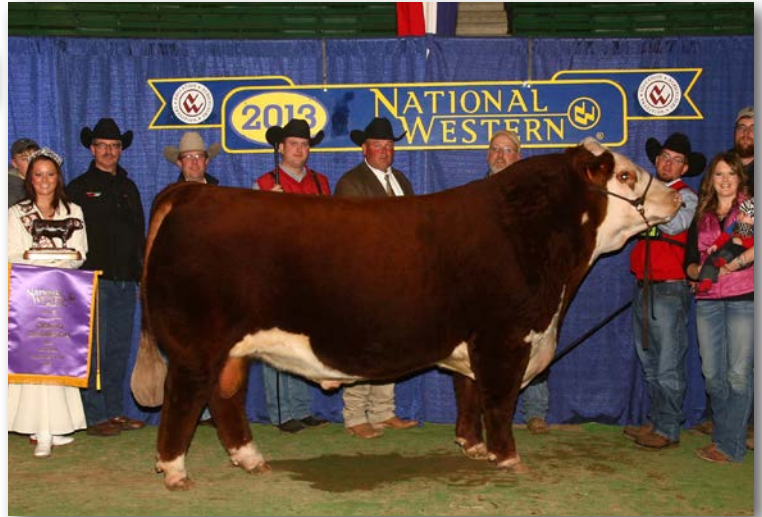
Sire of Lot 62 • RST Times A Wastin 0124

A full brother to the Denver pen bulls who offers a bit more length in a higher yielding package. Big topped, hiped and has plenty of pigment and muscle.