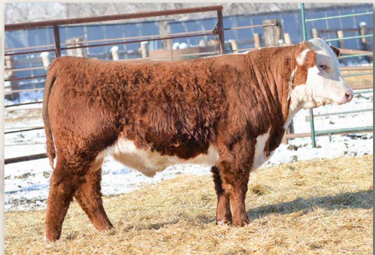
Lot 11 • ECR 2109 Domino 5042

Big stout powerful bull out of a first calf heifer. Started off light and weaned off heavy. Long deep and wide constructed.