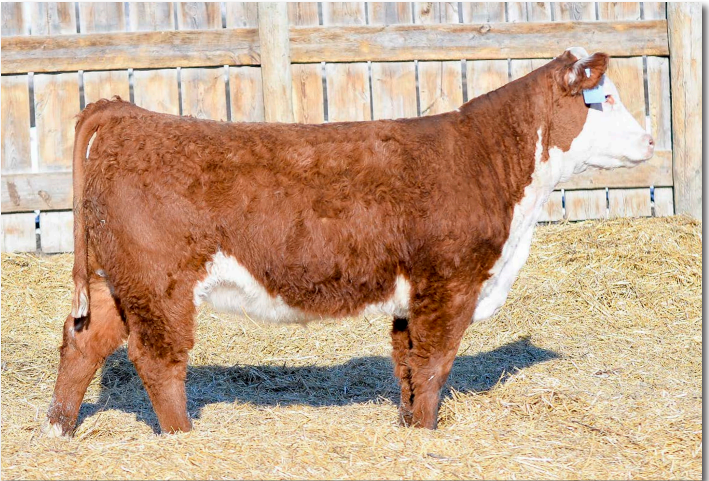
Lot 155 • ECR 0271 Christi 5352