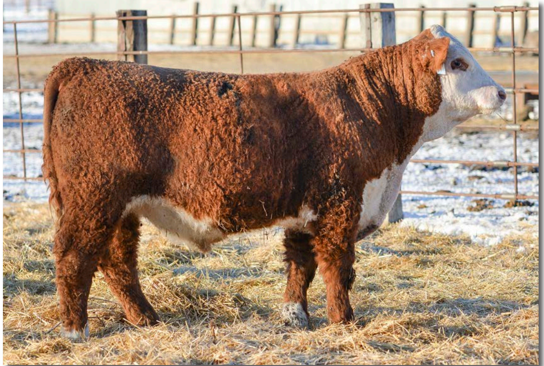
Lot 26 • ECR 109 Stacked Cat 5106