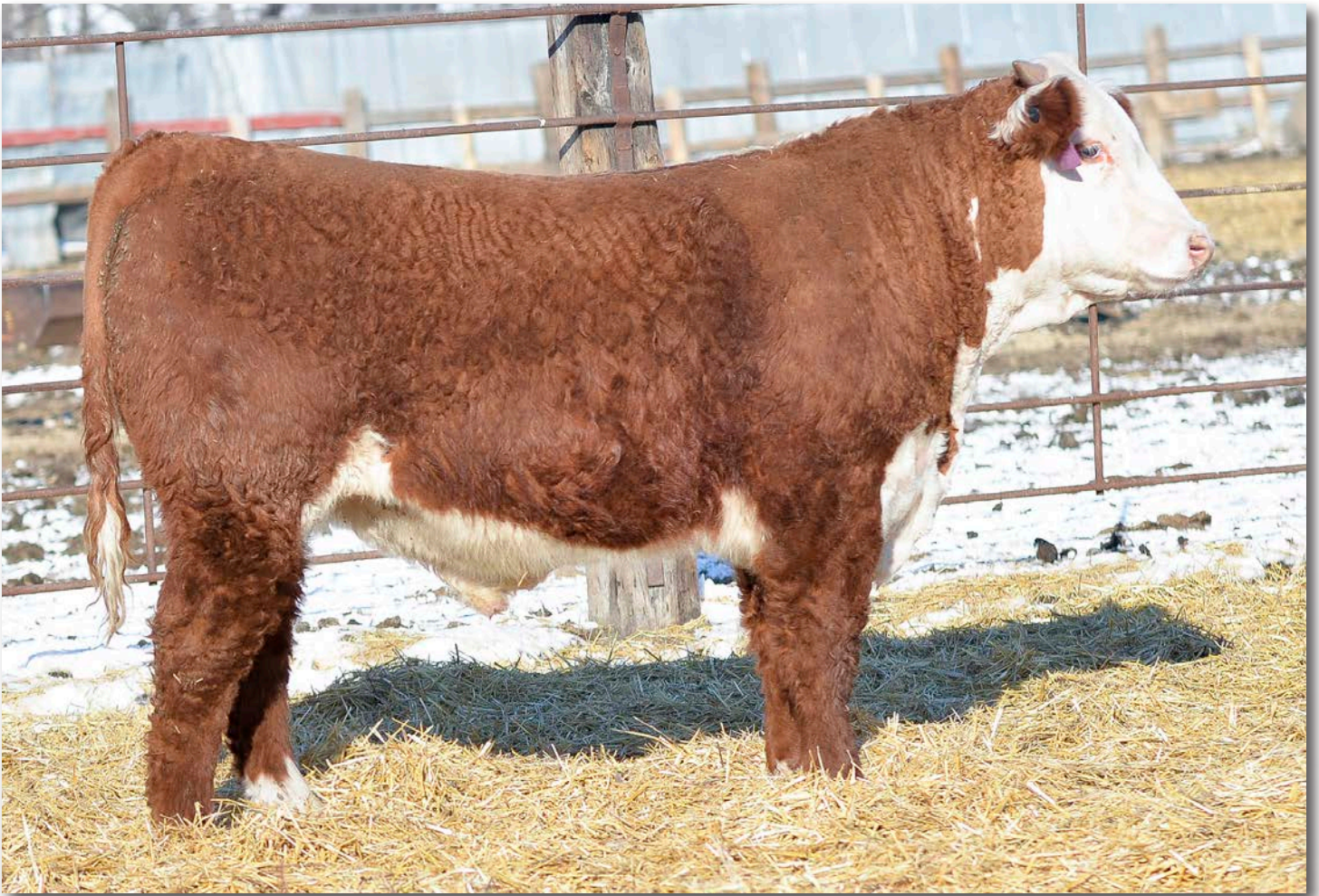
Lot 22 • ECR 10Y Hometown 5091