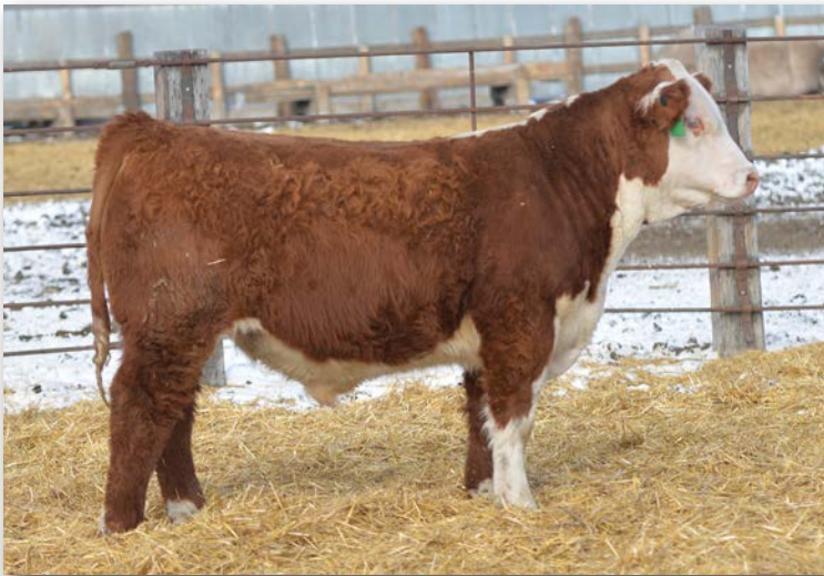
Lot 60 • ECR Dakota Outcross 5285

A 2109 son that has a nice spread on paper and will sire cattle with a larger than average rib eye and extra growth and performance.