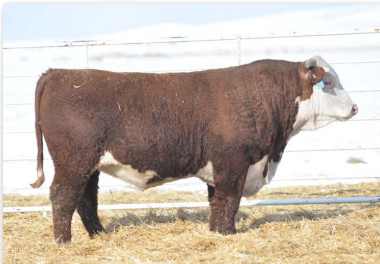
Lot 115 • ECR Cash Flow 4448 ET

Lower birth weight bull yet still has plenty of growth and performance. A sound functional bull with full pigment that will be able to cover a bunch of cows.