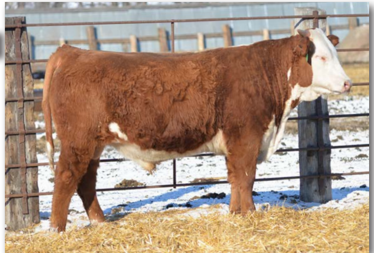
Lot 30 • ECR 2029 Excel Adv 5116

Lot 30 is a powerful 2029 son that offers growth performance and good carcass traits all in smooth complete package. He goes back to 2121 on the bottom side who has been a consistent producer of quality cattle.