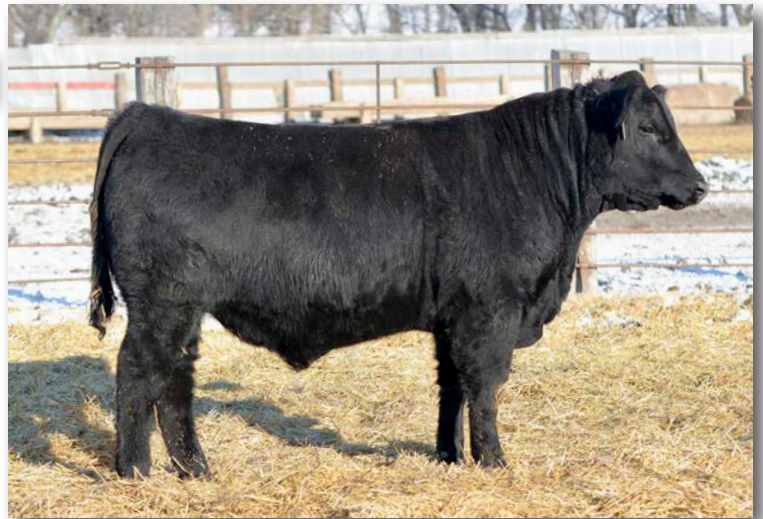
Lot 70 • ECR Cedar Ridge 505

Super complete Angus bull who offers a low birth weight yet stilled weaned off at over 700 lbs.