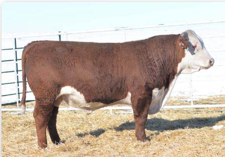
Lot 108 • ECR 2029 Domino 4413

Long bodied polled bull who is deep bodied and has plenty of width and muscle shape.