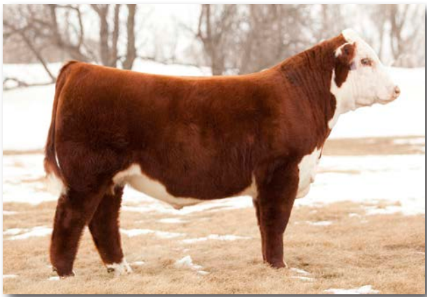
Reference Sire • DKF RO Cash Flo 0245 ET