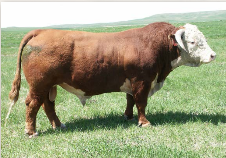
Sire to Lot 60 • ECR 4202 Dakota Lad 9022

Out of a cow we purchased from Hoffman Ranch. He is powerful in terms of skeleton, muscle and body shape. He's attractive from the side and will be sure to sire those high performing cattle that will get it done in the feedlot and in the pasture.