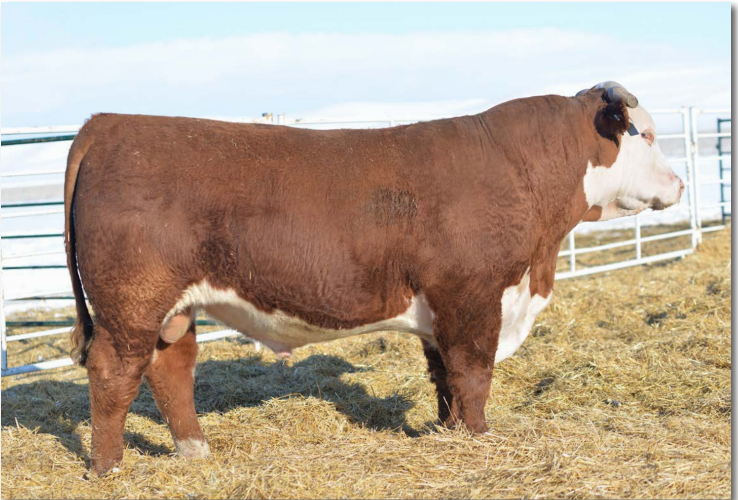
Lot 89 • ECR Genetic Explosion 4290 ET