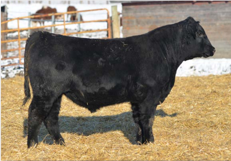
Lot 73 • ECR Prowler 510