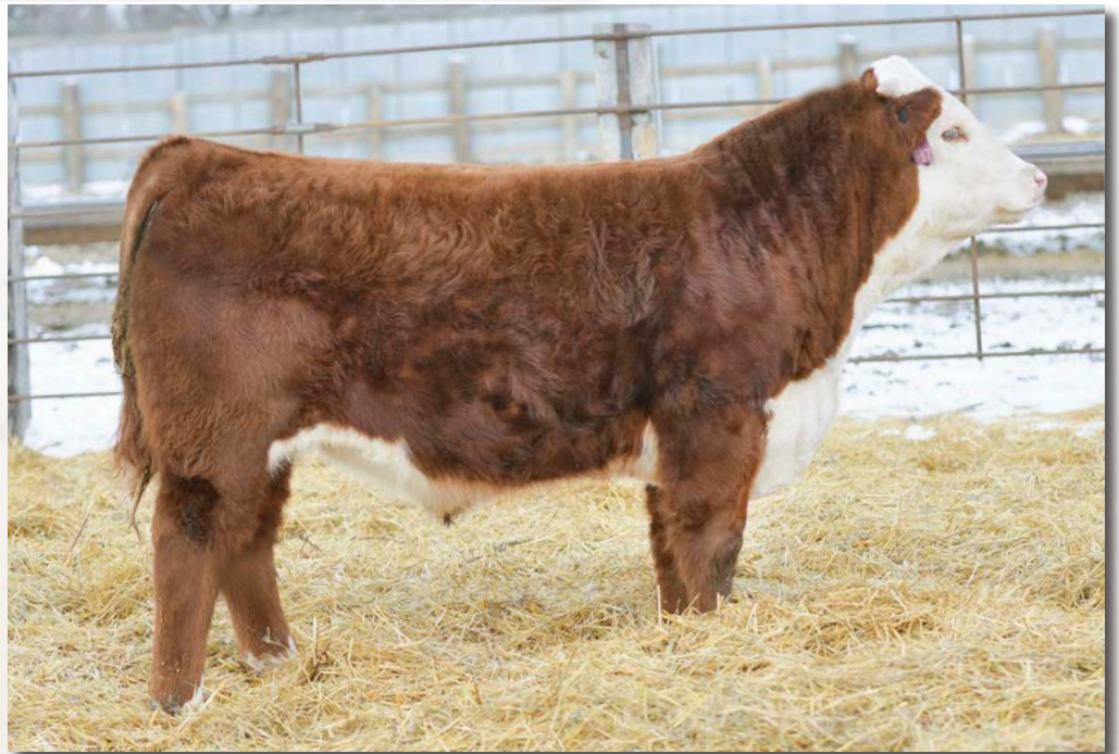
Lot 3 • ECR Burning Daylight 5406 ET