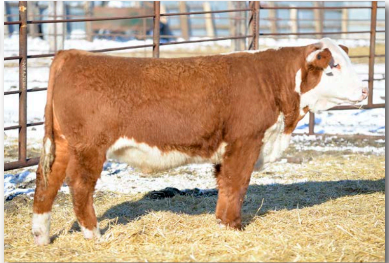
Lot 63 • ECR 394 Excel Domino 5342

Big topped, heavy muscled bull who shows extra shape, power and dimension. A really complete son of 394.