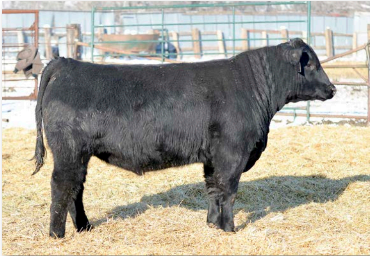
Lot 67 • ECR Cedar Ridge 502