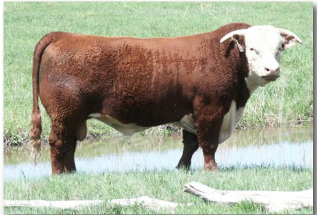
Reference Sire • DHD Turbo HH 1103