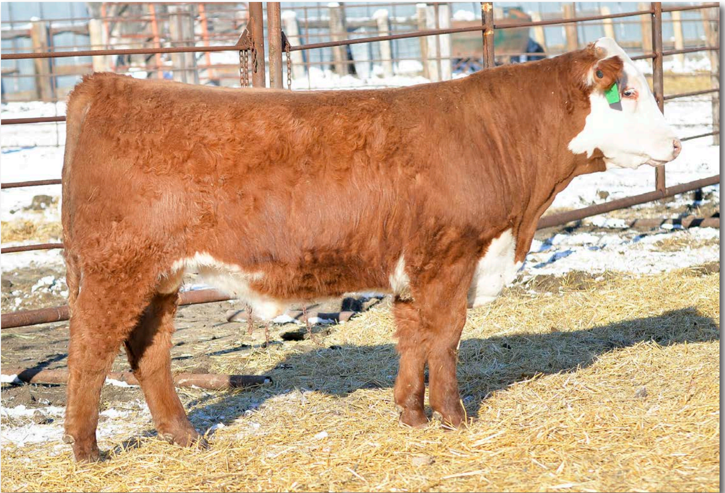
Lot 21 • ECR 394 Domino 5089