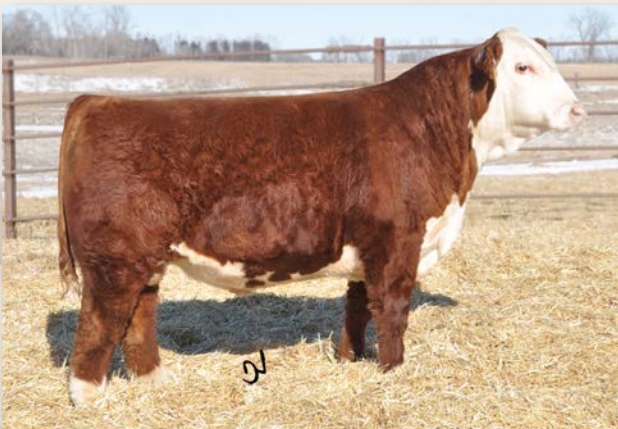
Reference Sire • TH 60W 719T Victor 43Y