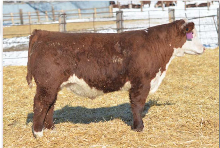
Lot 8 • ECR 005 Bar John 5029

Heifer bull candidate. Moderate and stout with extra muscle and rib shape. Starting off at just 72 lbs. yet still weans off at 635 lbs. He is straight and level down his top. He has plenty of muscle shape and depth of body. Nice heifer bull prospect.