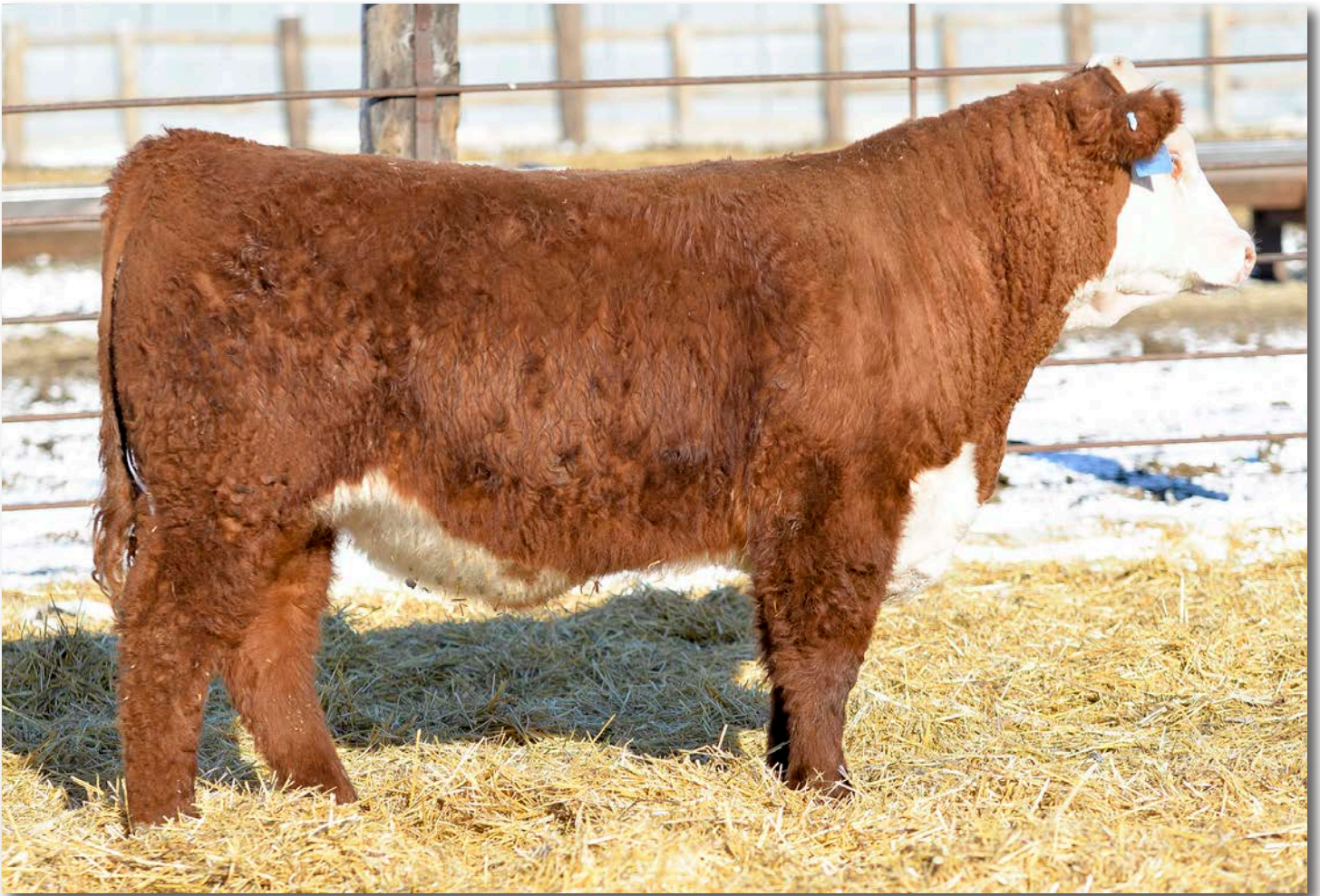
Lot 50 • ECR Cash Flow 5190