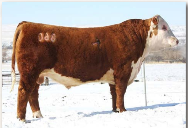
Reference Sire • CL 1 Domino 860U