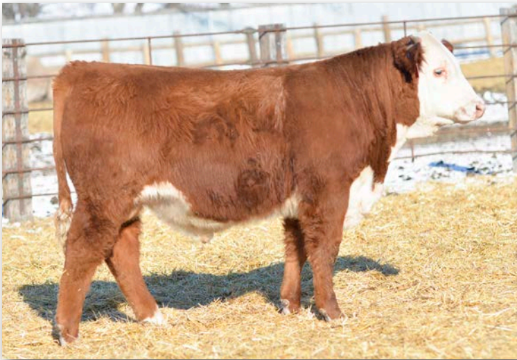
Lot 39 • ECR 2029 Advance 5155

Middle framed Ree Heights son who is soggy, easy fleshing and still has plenty of mass and power. Out of a really good 7195 daughter. Expect his offspring to push down the scales and the females to have excellent udders.