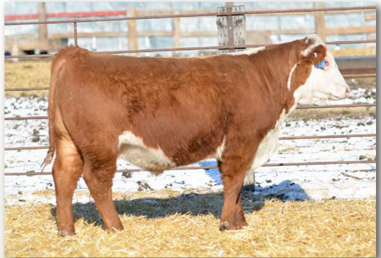
Lot 58 • ECR 2029 Advance 5225