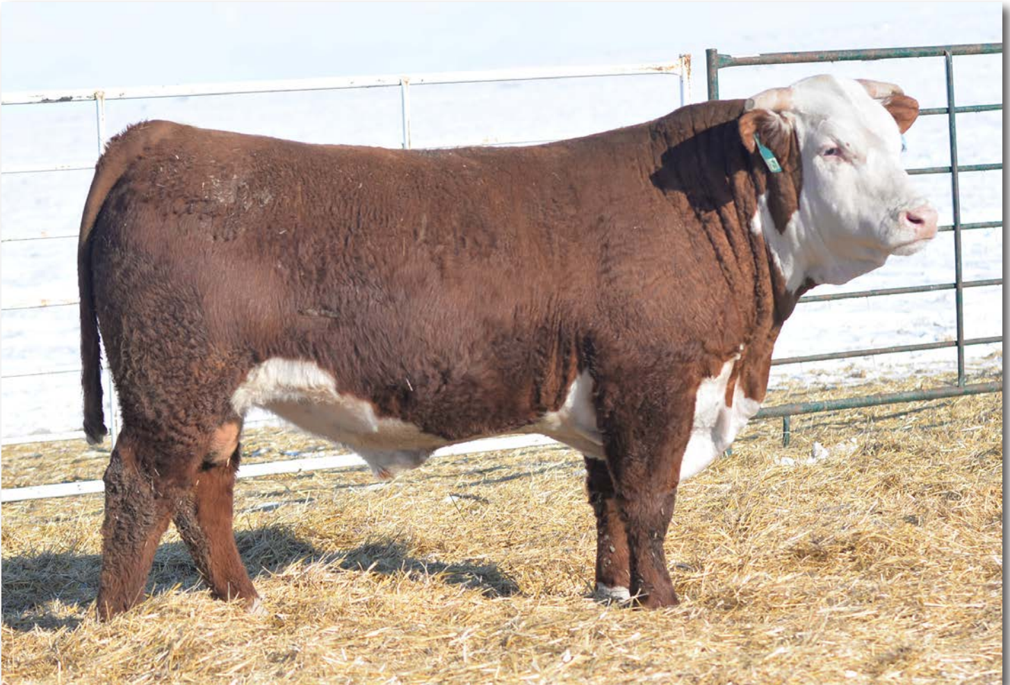
Lot 135 • ECR 0133 Mark Advance 4257