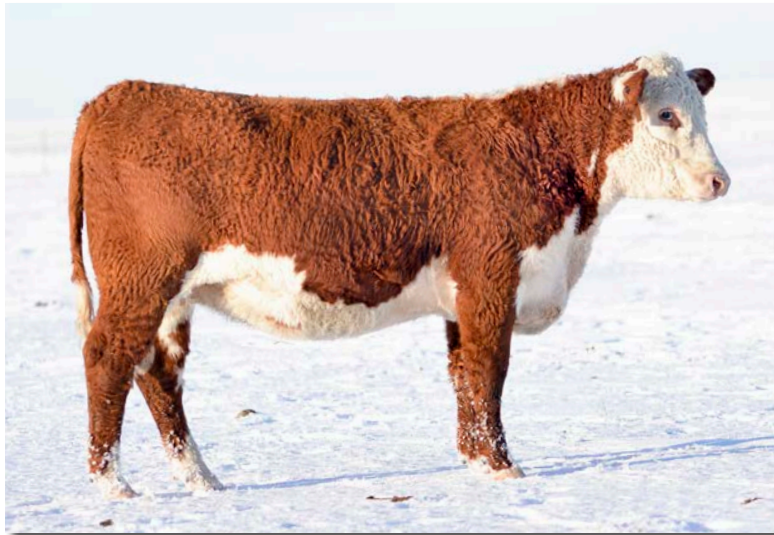
Lot 140 • ECR 0133 Dominette 4248

The hardest thing for me to do for this sale is to pick out bred heifers right out of our replacements. This group of bred heifers represents a cross section of our replacements and offers something for everyone. They were sorted out of the group late December and have had no special treatment. These females are future power cows, herd bull mommas and potential donors. We hate to see these leave. RETAINING 1 SUCCESSFUL FLUSH ON ALL REGISTERED FEMALE LOTS.