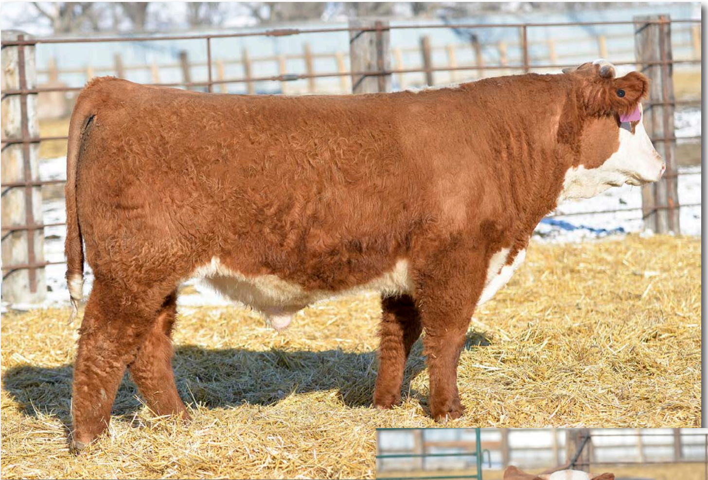
Lot 66 • ECR 9279 Deeper Yet 5650