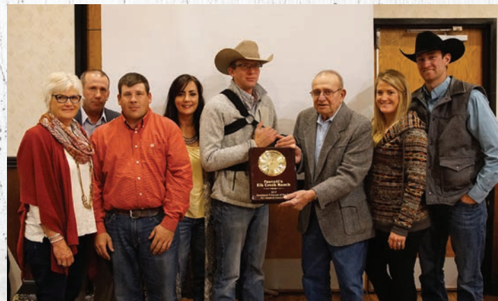
2017 Seedstock Producer of the Year, South Dakota