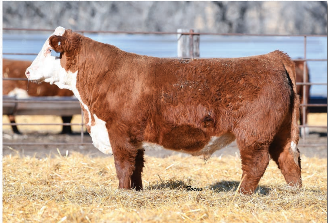
Lot 29 • ECR 2029 Jacks Shop 8247