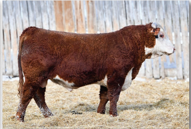
Lot 94 • ECR 3275 Bravo 7496