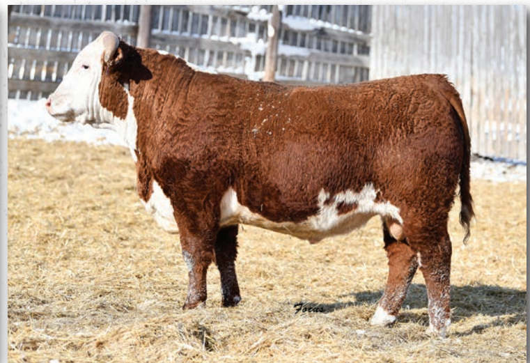
Lot 78 • ECR 2109 Jack Domino 7537