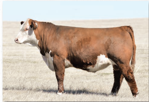
Reference Sire • UPS Undisputed ET