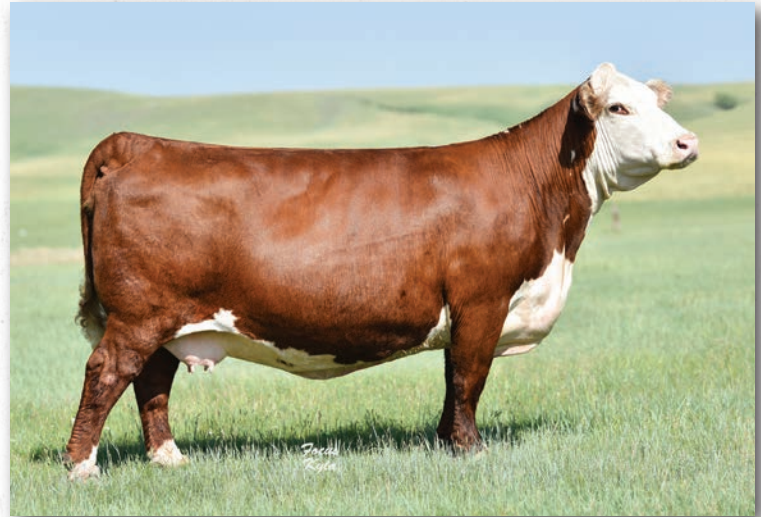
JRR Miss Tobey 711T • Dam of Lot 124

Fawcett's ELMCREEKRANCH Ree Heights, South Dakota