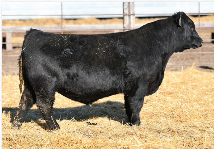
Lot 62 • ECR Payweight 813