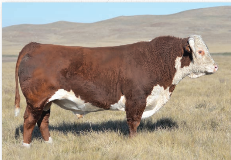
CL 1 Domino 2109Z • Sire of Lot 71