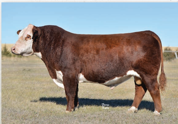
UPS Undisputed ET • Sire of Lots 107, 109 & 110

• Big scrotal with a shot of 7195 back in his pedigree • His daughters will be perfect uddered