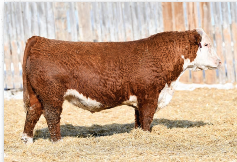
Lot 113 • ECR 738 Sleep On 7289

• Moderate and easy fleshing bull with plenty of mass and shape