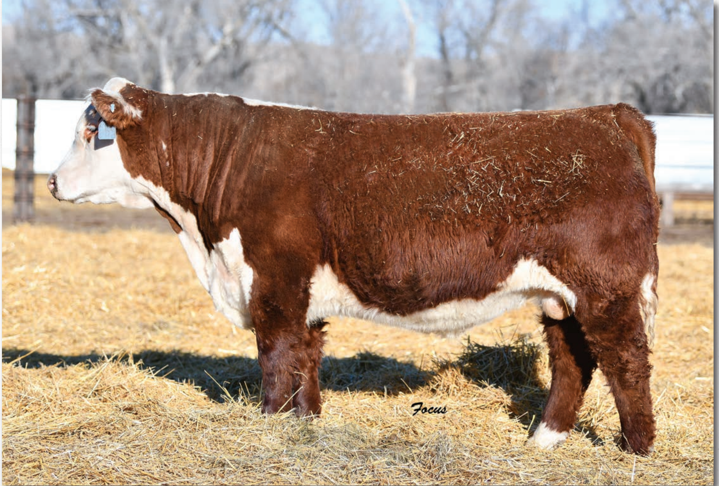
Lot 26 • ECR 173D Endure 8154