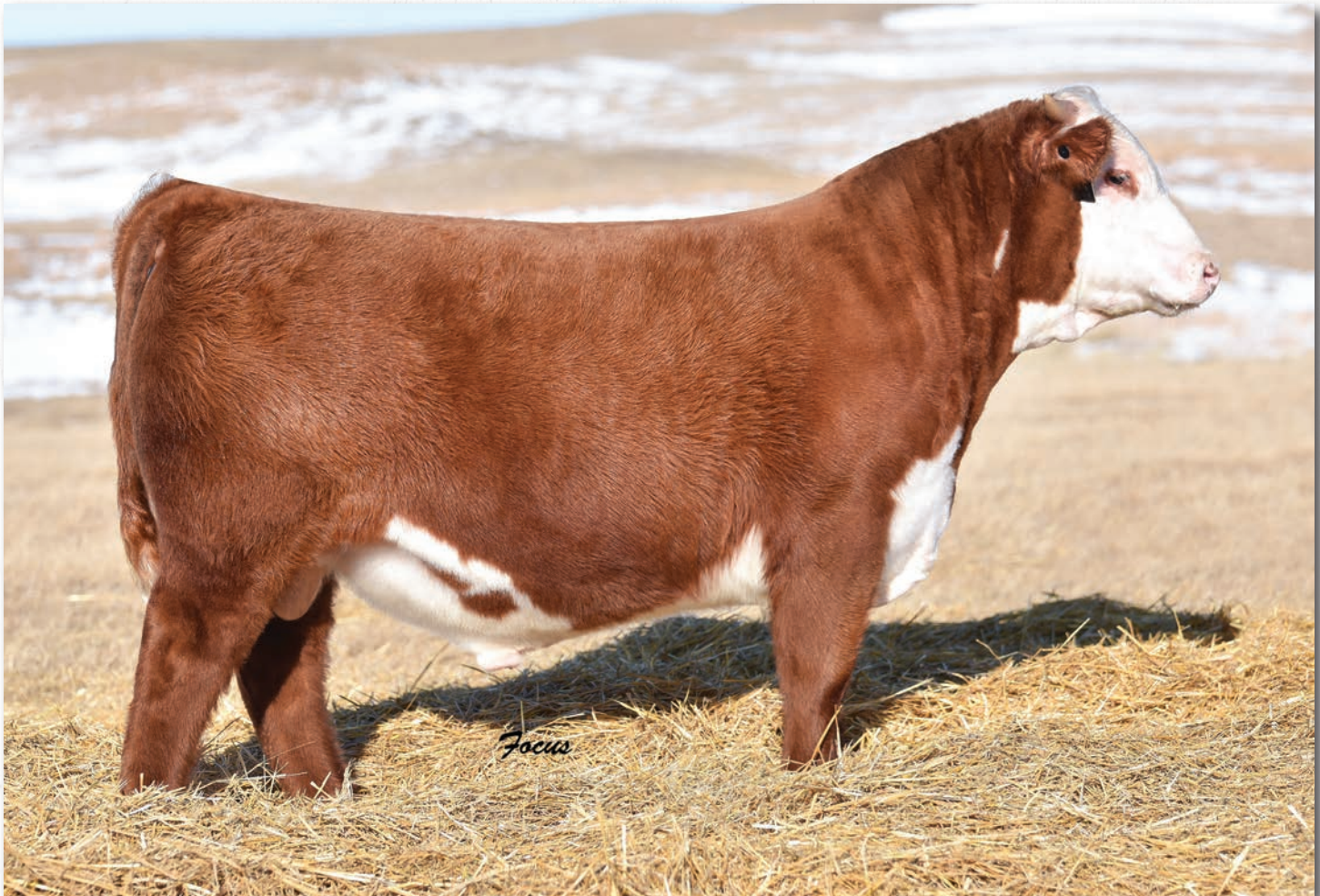
Lot 1 • ECR 628 Advance 8014