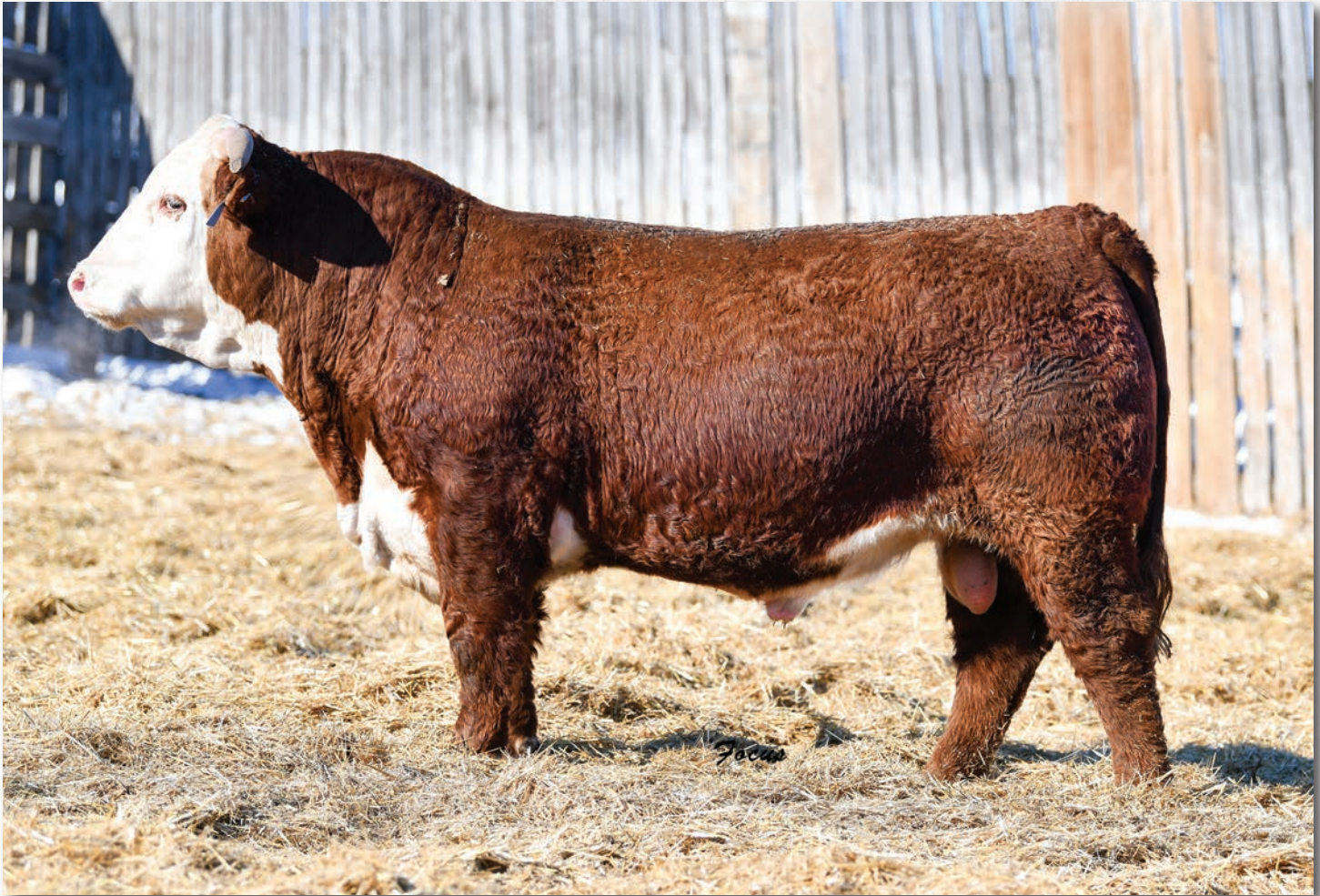
Lot 74 • ECR 2296 Sensation 7472