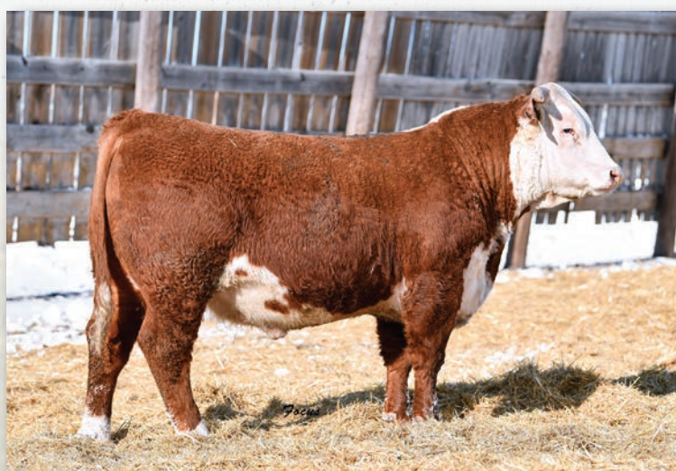
Lot 90 • ECR 394 Domino 7425

• Low birth with 116 WW ratio • Really like the pedigree on the bottom side containing the old reliable 9022 and the 4140 cow