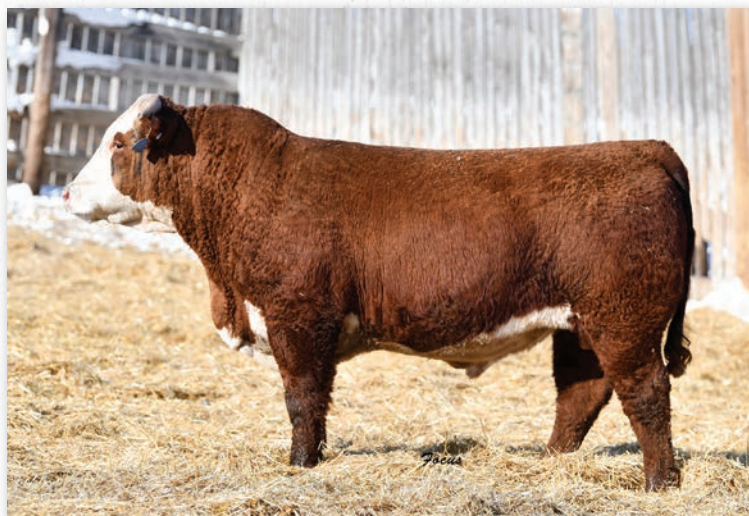
Lot 88 • ECR 4264 Extra Deep 7272