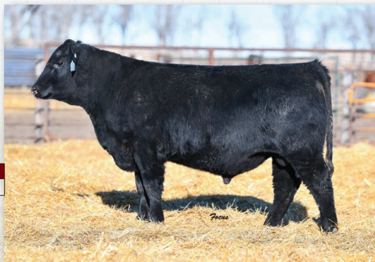
Lot 64 • ECR Final Answer 840

• LONG bodied and growthy Final Answer out of the 6753 donor