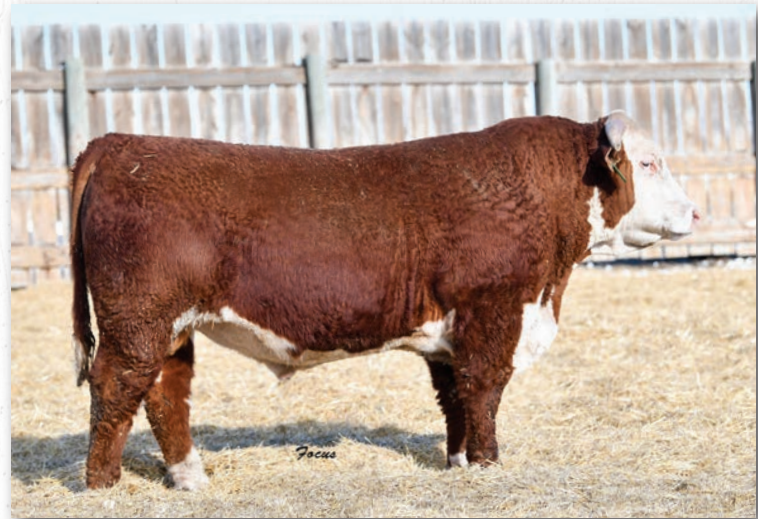
Lot 121 • ECR 0245 Cash Flow 7619 ET

• Horned bull that's moderately framed and powerful