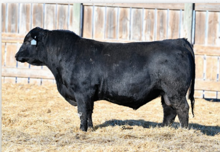
Lot 128 • ECR Resource 756