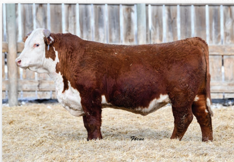
Lot 72 • ECR 3275 Bravo 7373