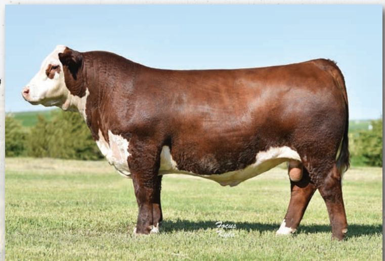
NJW 79Z Z311 Endure 173D • Sire of Lots 21 & 23-28