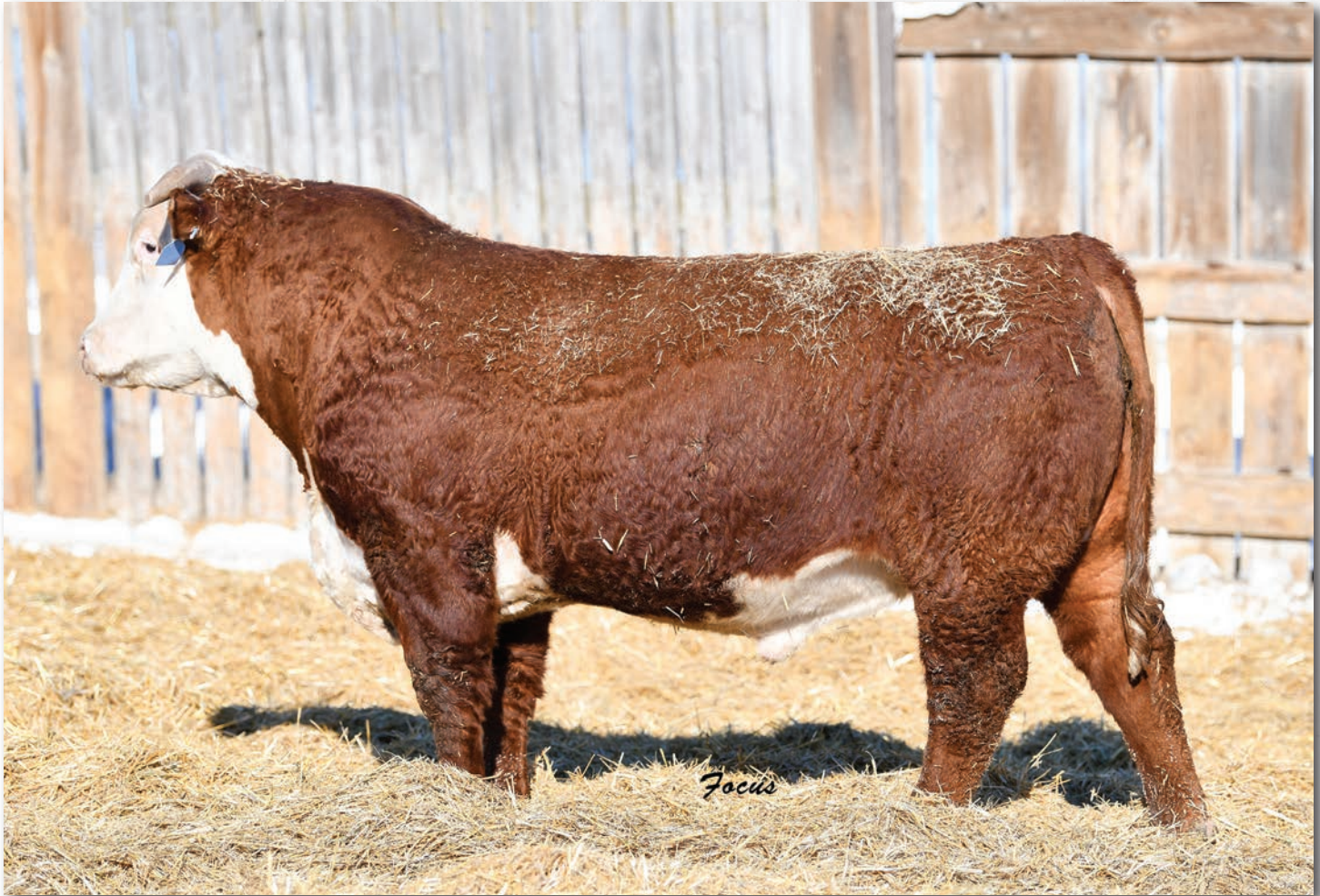
Lot 92 • ECR 394 Domino 7454