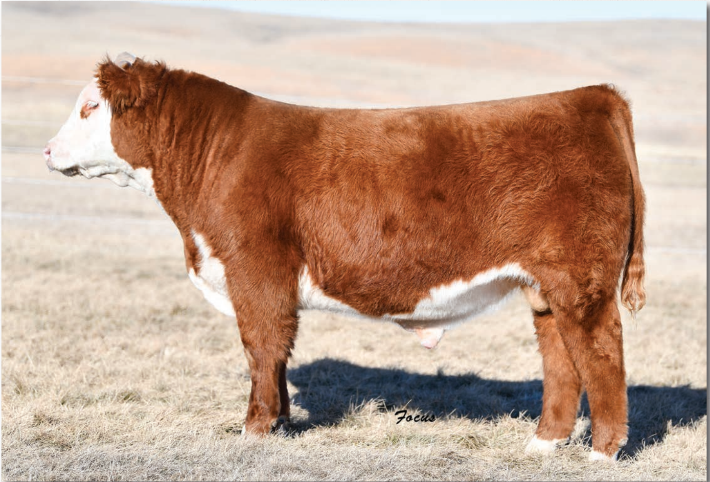
Lot 11 • ECR 628 Advance 8225