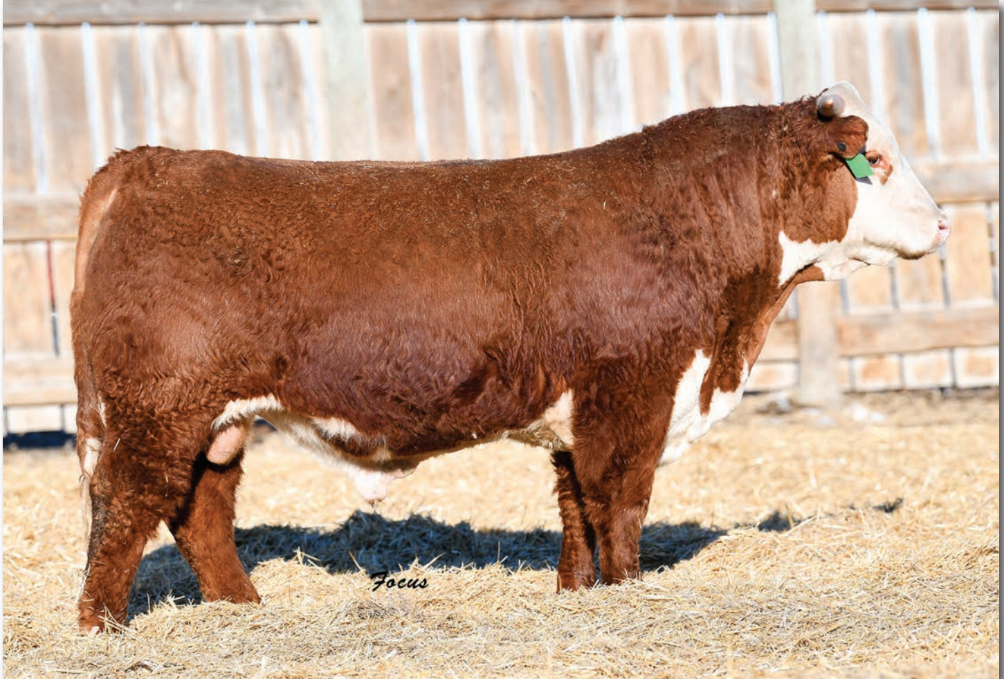
Lot 100 • ECR 418 Rushmore 7583