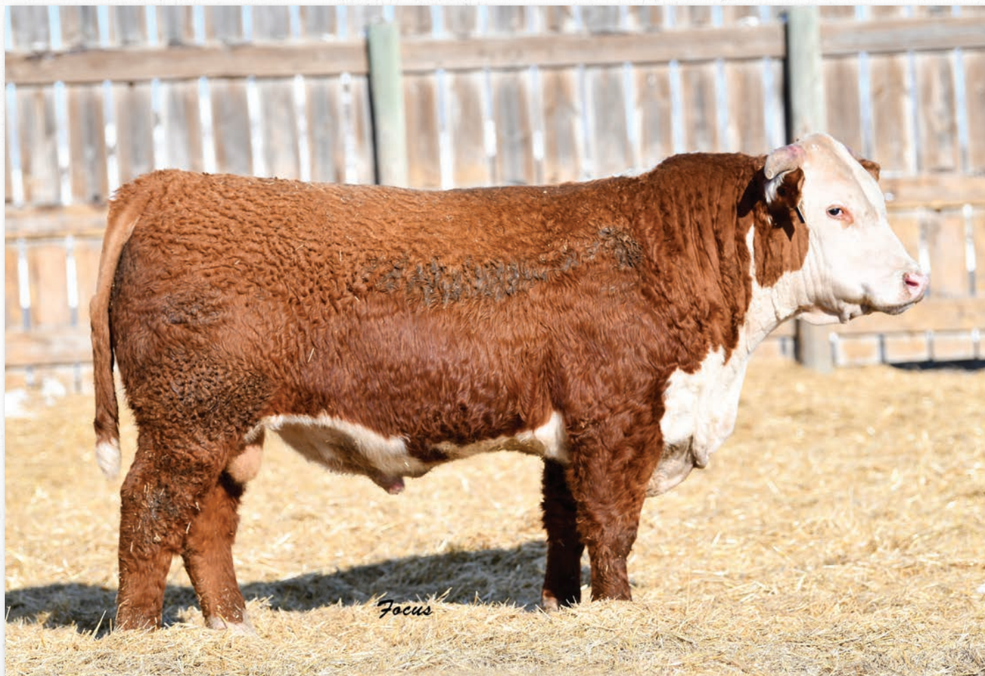
Lot 69 • ECR 704X Exceed 7588

We are excited about this years group of two-year-old bulls. This group of bulls predominately come from the second group of cows calving from mid March through May. In this group of cows you will find calves sired by AI sires and the bulls resulting from embryo transplant. This group of bulls leave the yards as soon as the grass has greened in the spring and are on their own until fall without supplement, and then are fed a high roughage ration out on pasture where they have room to travel. They are sound, hard in their condition and ready to work and last.