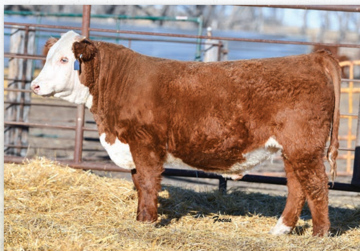
Lot 8 • ECR 628 Advance 8138