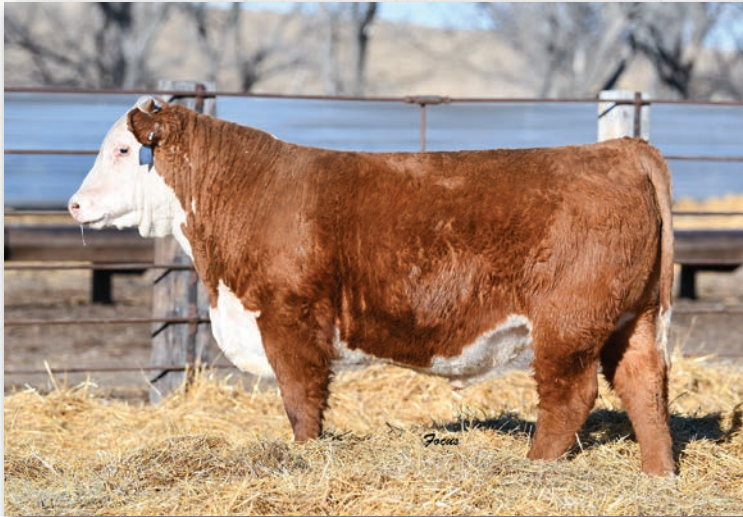
Lot 31 • ECR 2029 Advance 8264