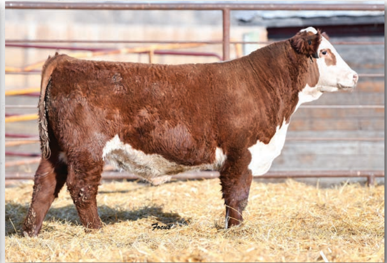
Lot 23 • ECR 173D Endure 8125