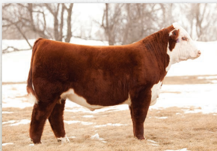
DKF RO Cash Flow 0245 ET • Sire of Lot 99