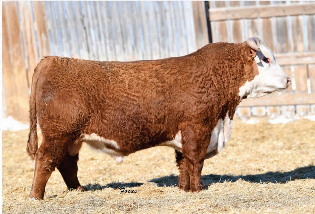
Lot 87 • ECR 394 Domino 7143