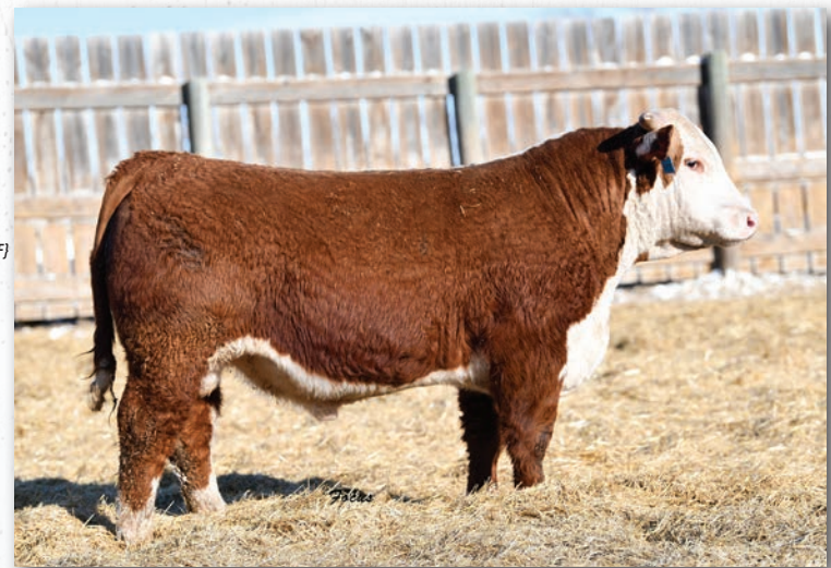
Lot 84 • ECR L18 Sensation 7653 ET

If planning to utilize online bidding, please contact Dan or any sale staff prior to the sale in case there happens to be a problem with the internet during the auction.