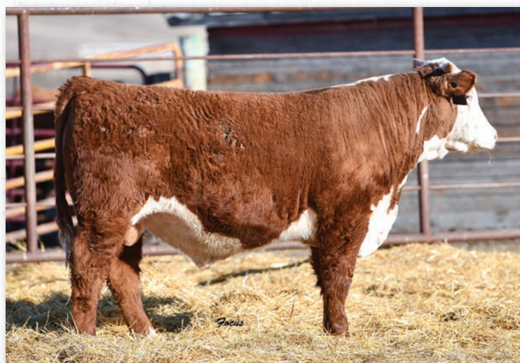
Lot 7 • ECR 628 Advance 8132