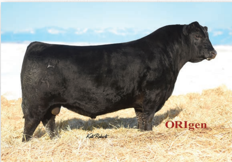
HA Cowboy Up 5405 • Sire of Lots 66 & 67

• Low BW with depth and fleshing ability