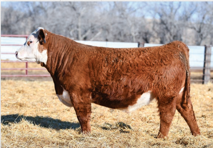
Lot 4 • ECR 628 Advance 8089