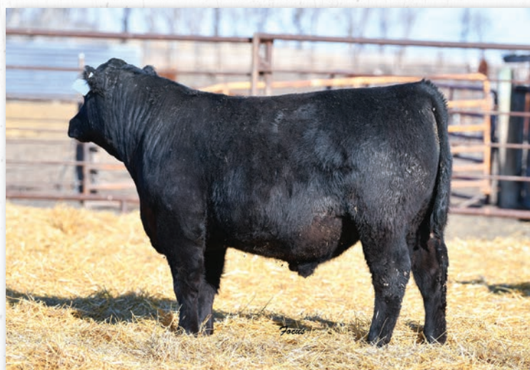
Lot 63 • ECR Payweight 814

• Low birth weight bull with extension and growth