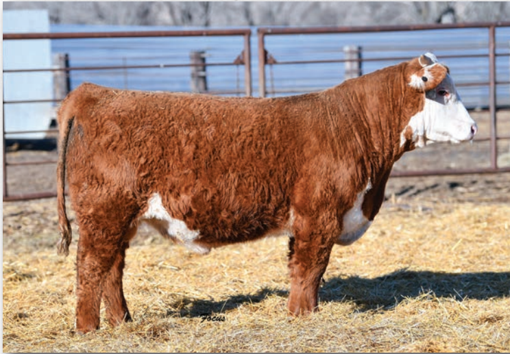
Lot 9 • ECR 628 Extra Advance 8153