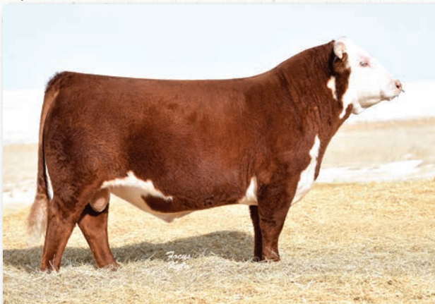
Reference Sire • H FHF Advance 628 ET