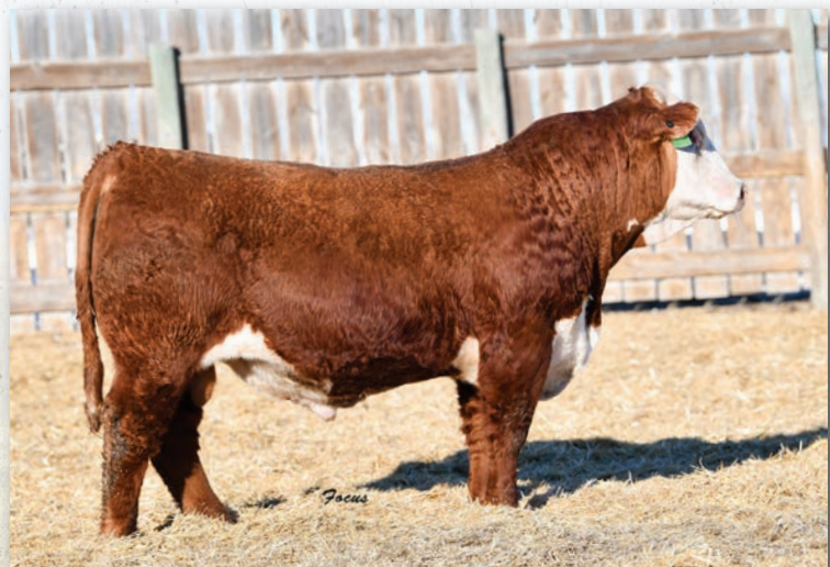
Lot 114 • ECR 3371 Dakota Reward 7411

• Big, long, growthy, polled bull • 125 WW ratio