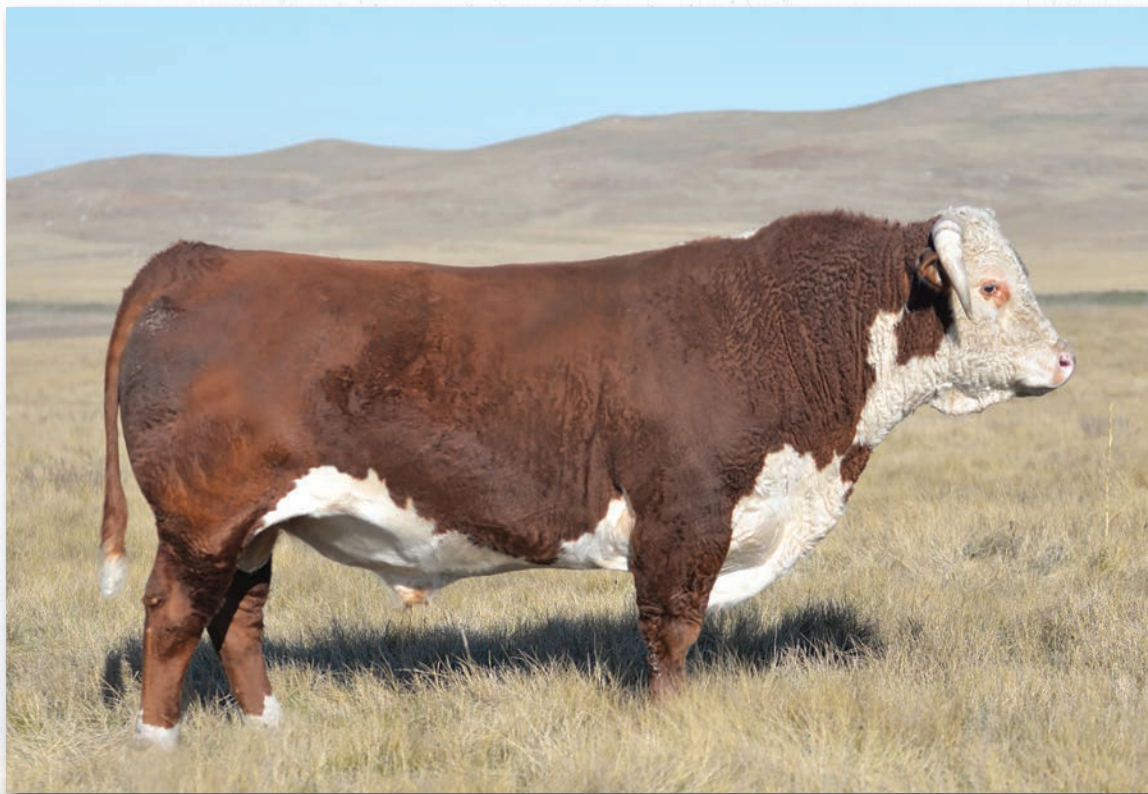
CL1 Domino 2109Z

2109 has been an anchor here at the ranch for some time. His influence floods our herd. He is very predictable in the type of cattle he produces. They will have BW's lighter than average and they will have growth that exceeds their contemporaries.