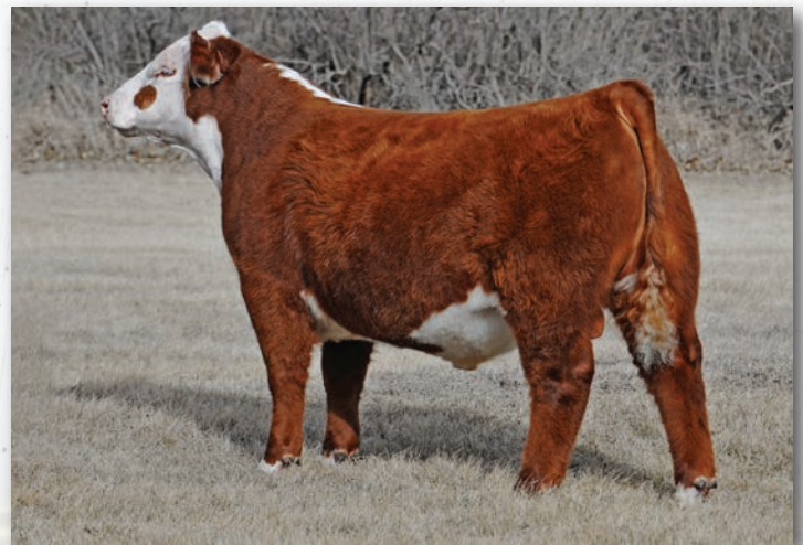
ECR RO Rushmore 418 ET • Sire of Lot 81

• This polled bull has been a stoundout since the beginning. He was right on the border line for age to sell as yearling but held back to offer this power house as a two year old.