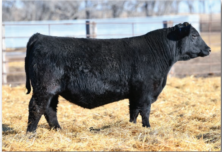
Lot 68 • ECR Payweight 803

• Low BW bull with an abundance of performance