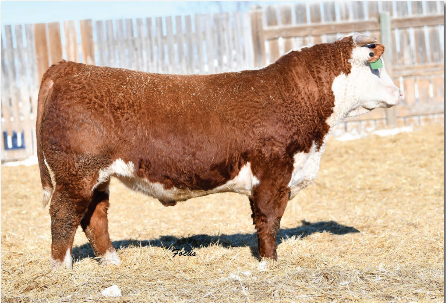
Lot 85 • ECR 860 Domino 7829 ET