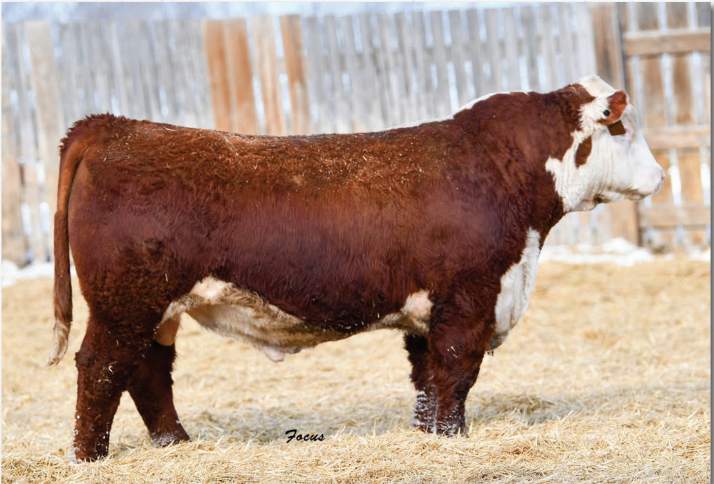
Lot 81 • ECR 418 Rushmore 7601