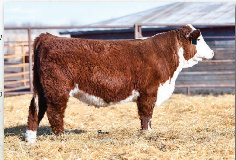
Lot 43 • ECR 3304 Undisputed 8368