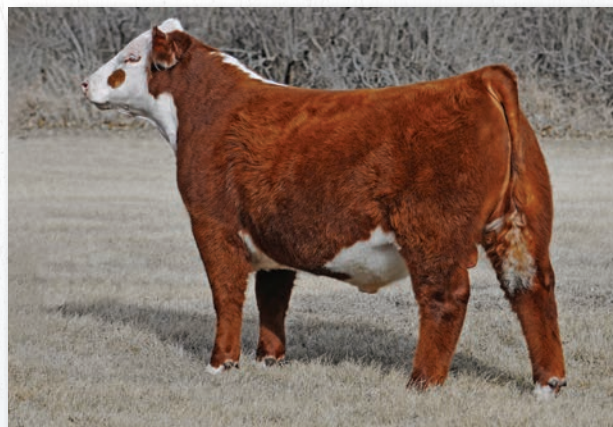
Reference Sire • ECR RO Rushmore 418 ET