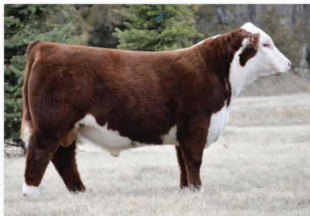
Reference Sire • ECR RO Chosen One 424 ET