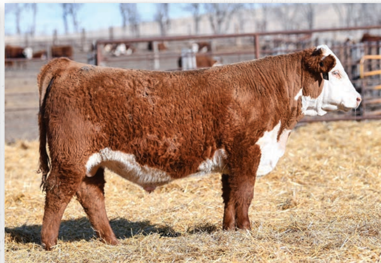
Lot 14 • ECR TSR 628 Advance 8341 ET