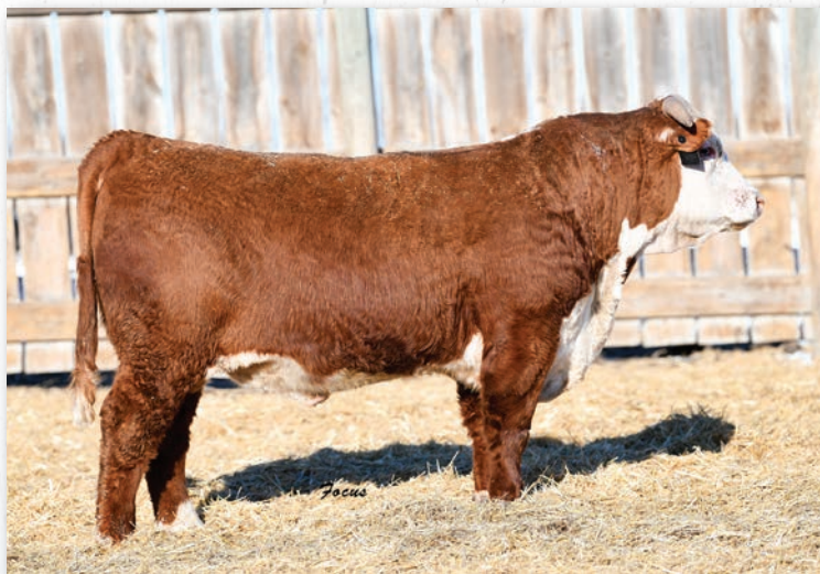
Lot 77 • ECR 3275 Bravo 7501