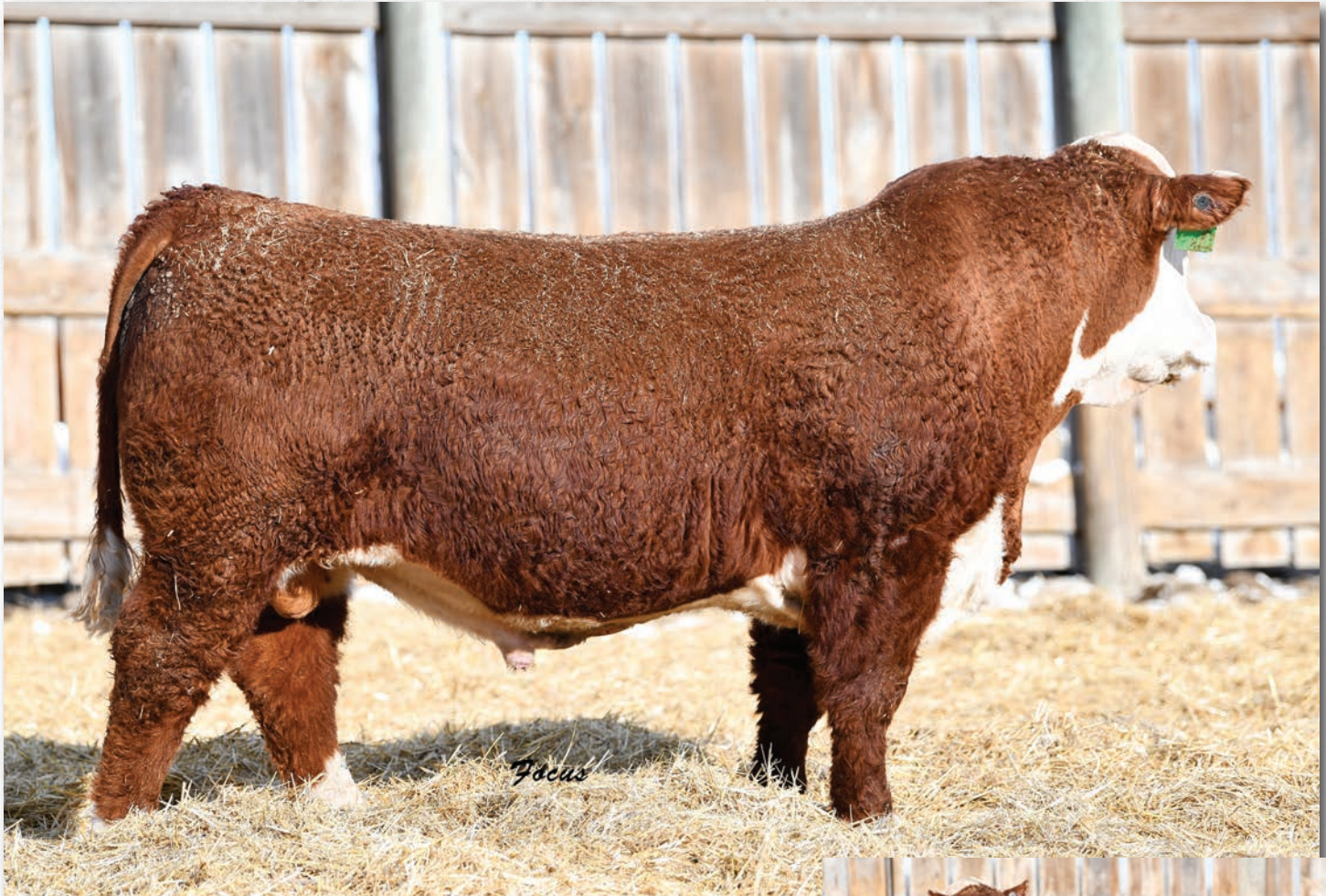
Lot 120 • ECR 0245 Cash Flow 7612 ET