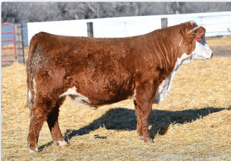
Lot 32 • ECR 2029 Advance 8277