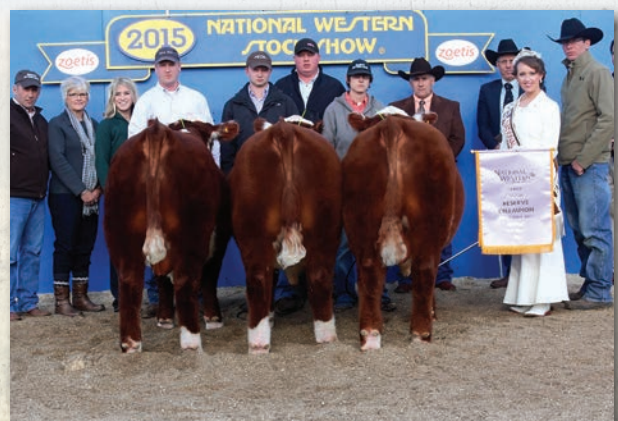
2015 Reserve Champion Pen of Three, NWSS • Full sibs to Lot 56