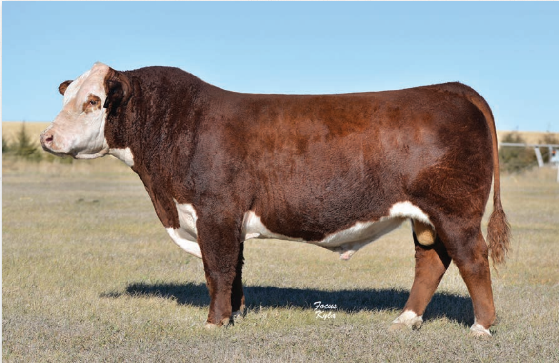
UPS Undisputed ET

We have used Undisputed across the board on heifers, cows, horned and polled. He consistently produces cattle that are short marked with extra pigment. His daughters have incredible teat and udder quality that are built for the long haul. His sons will sire cattle with pigment and short marked baldies.