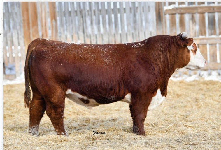
Lot 119 • ECR 418 Rushmore 7505

Fawcett's ELMCREEKRANCH Ree Heights, South Dakota