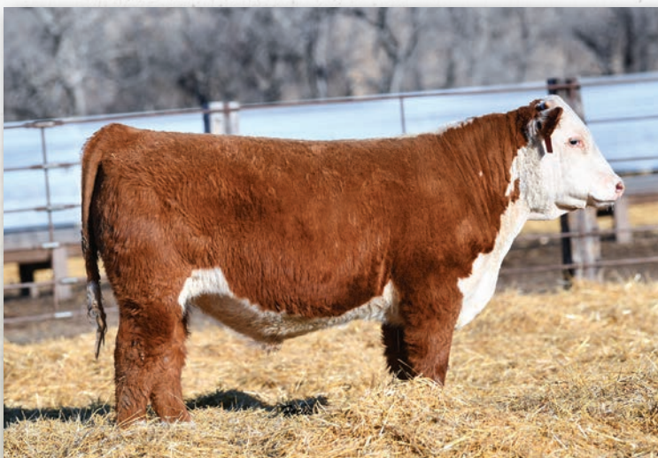
Lot 33 • ECR 2029 Advance 8287