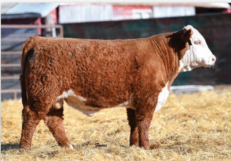
Lot 5 • ECR 628 Advance 8099