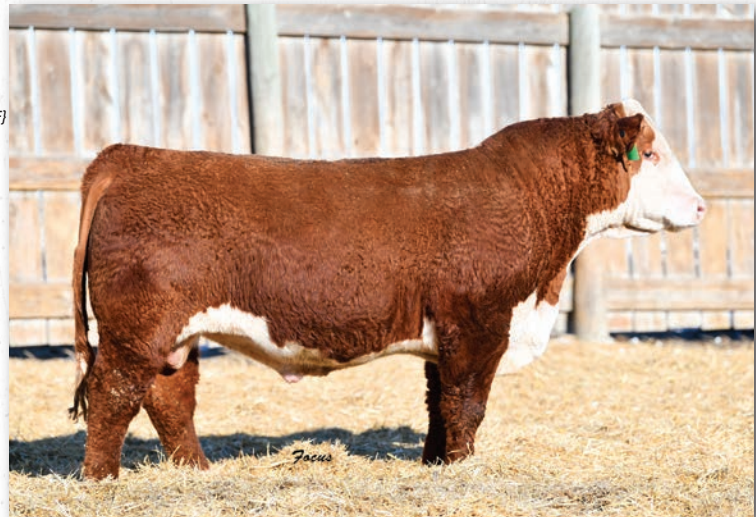
Lot 112 • ECR 738 Sleep On 7251

• Sleep On with added power and performance