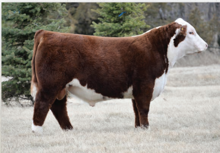
ECR RO Chosen One 424 ET • Sire of Lot 117