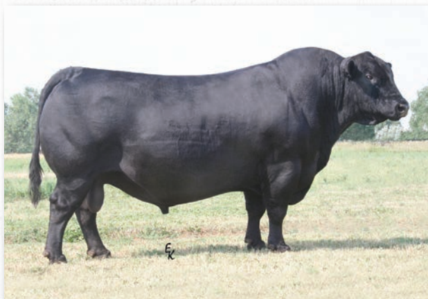
Reference Sire • SAV Final Answer 0035