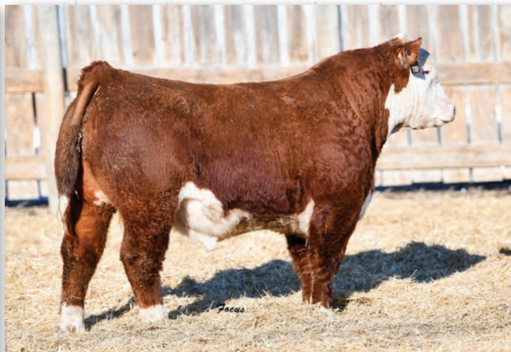
Lot 103 • ECR 3116 Sensation 7647 ET