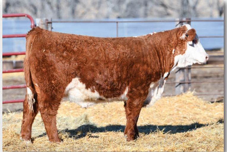
Lot 54 • ECR 2109 Domino 8367