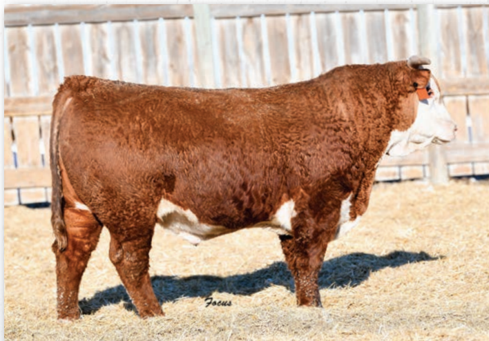
Lot 105 • ECR 860 Domino 7827 ET