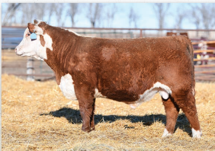
Lot 38 • ECR 5575 Redemption 8179