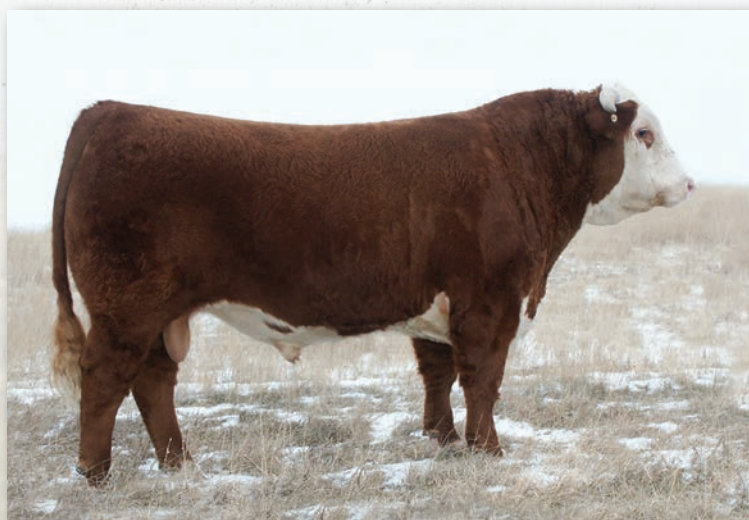
ECR L18 Extra Deep 9279 • Sire of Lot 73

• Bravo out of a powerful heavy milking 860 daughter • Dam is a Dam of Distinction