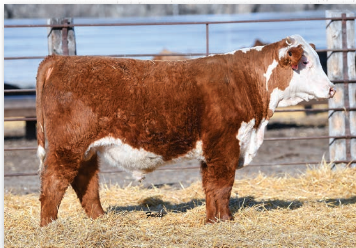
Lot 30 • ECR 2029 Advance 8257