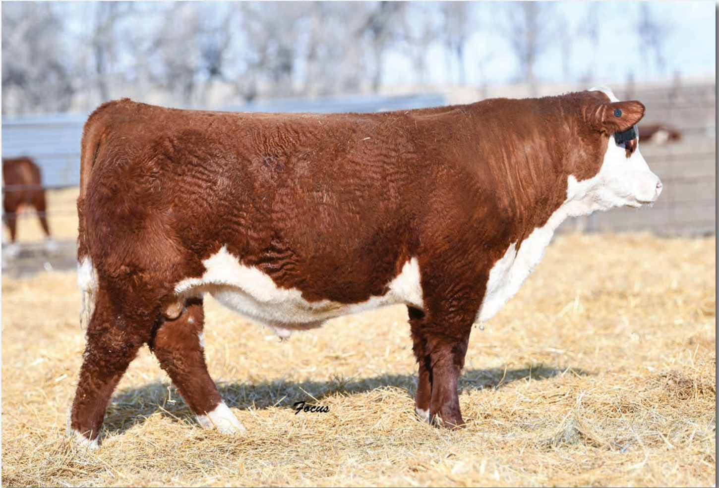
Lot 25 • ECR 173D Endure 8131