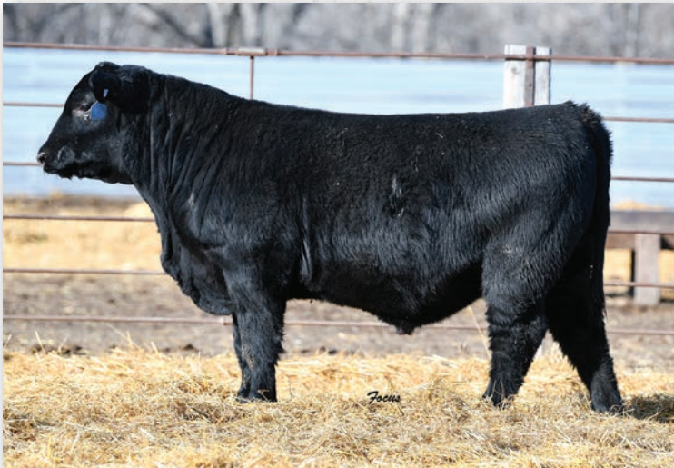
Lot 65 • ECR Torque 841