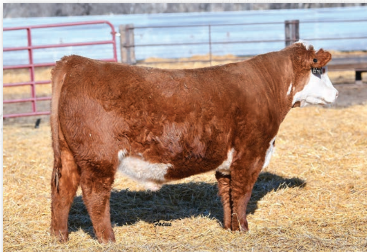
Lot 13 • ECR TSR 628 Advance 8295 ET