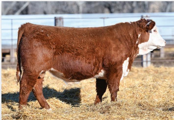
Lot 86 • ECR RO Tobeyes Sensation 725 ET