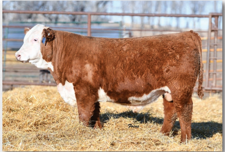
Lot 10 • ECR 628 Advance 8157