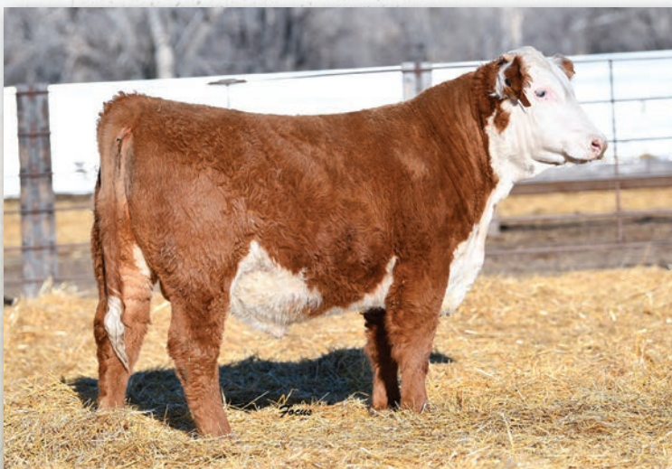
Lot 59 • ECR 9022 Domino 8388