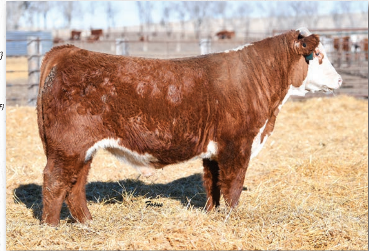
Lot 40 • ECR 3304 Undisputed 8021