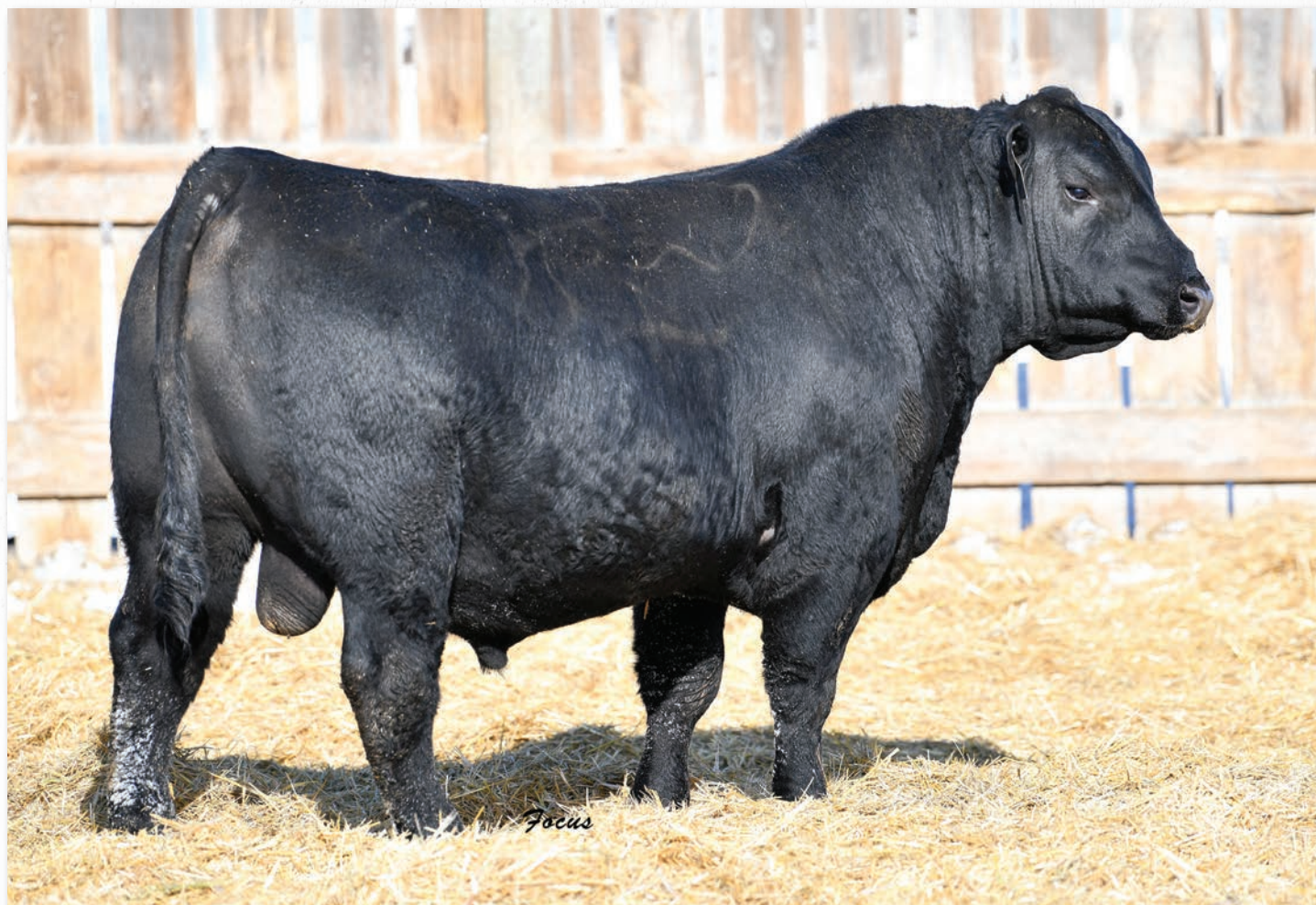
Lot 125 • ECR Resource 7830 ET