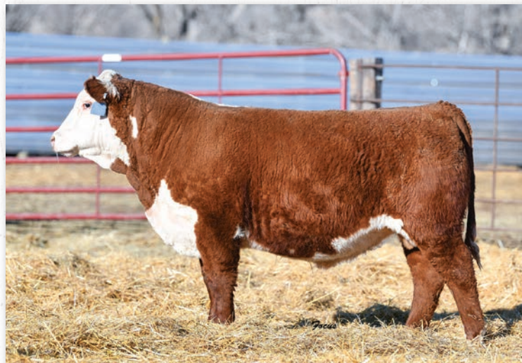
Lot 6 • ECR 628 Advance 8110