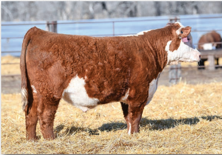
Lot 57 • ECR 738 Sleep On 8143

Sleep On is exactly what his name suggests. He is the ultimate calving ease bull. If its cold you better be on top of them when calving and not sleeping on because they will come squirting out in a hurry. Sleep On offspring are moderately framed cattle that are easy fleshing and have plenty of muscle and width as they mature.