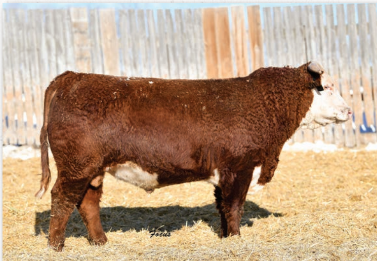
Lot 115 • ECR 3275 Bravo 7415