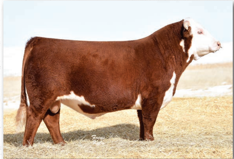
H FHF Advance 628 ET • Sire of Lots 1-20