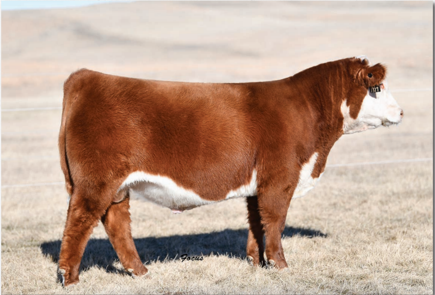
Lot 15 • ECR TSR 628 Advance 8358 ET