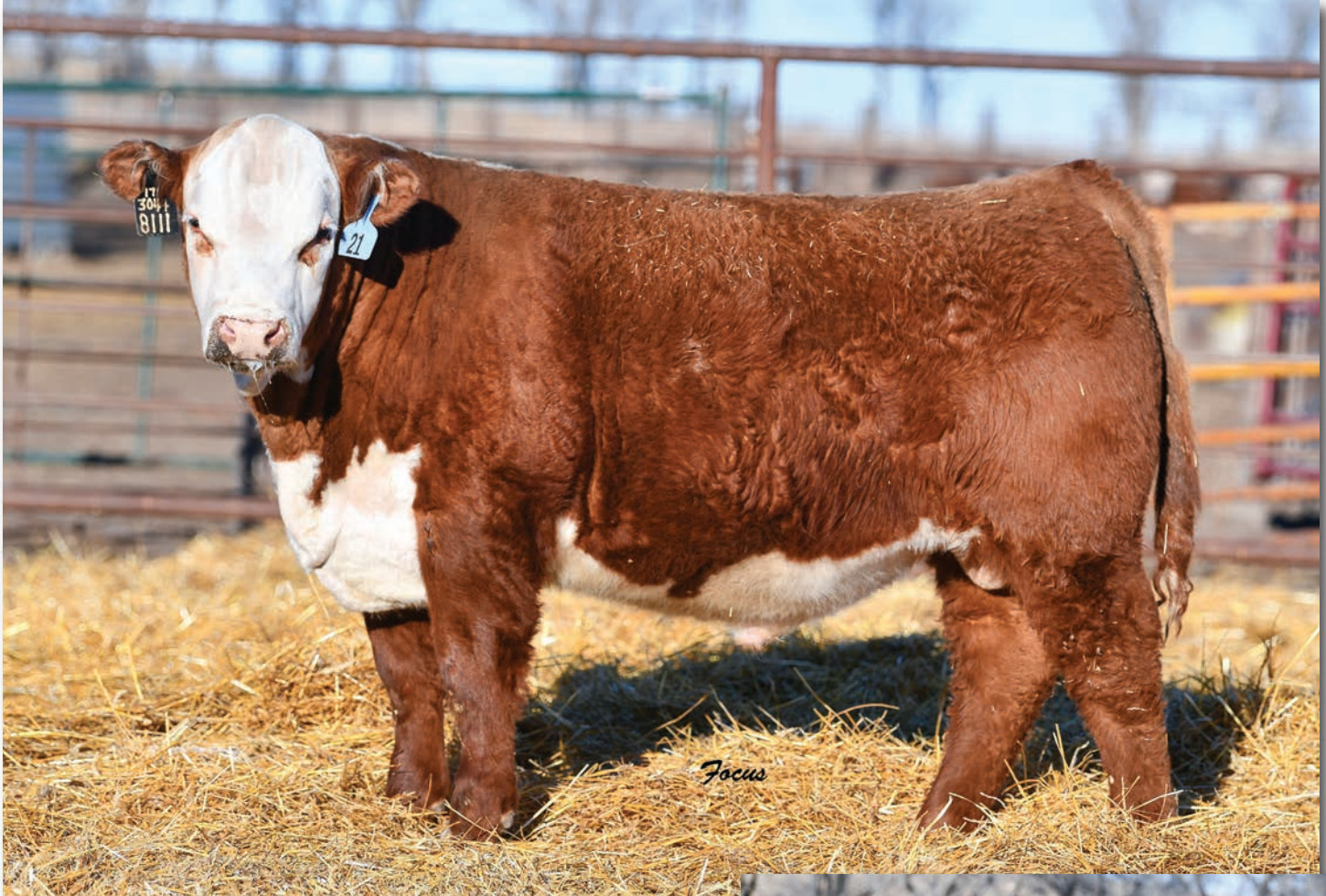
Lot 21 • ECR 173D Endure 8111