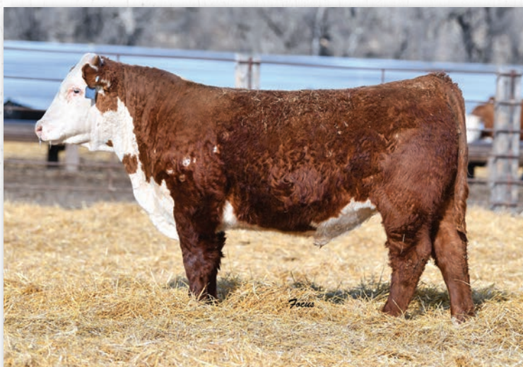
Lot 37 • ECR 5575 Redemption 8177