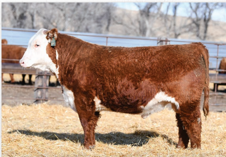
Lot 36 • ECR 5575 Redemption 8092