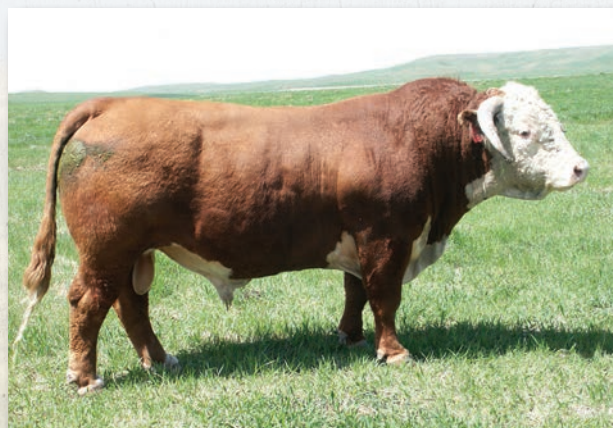
Reference Sire • ECR 4202 Dakota Lad 9022