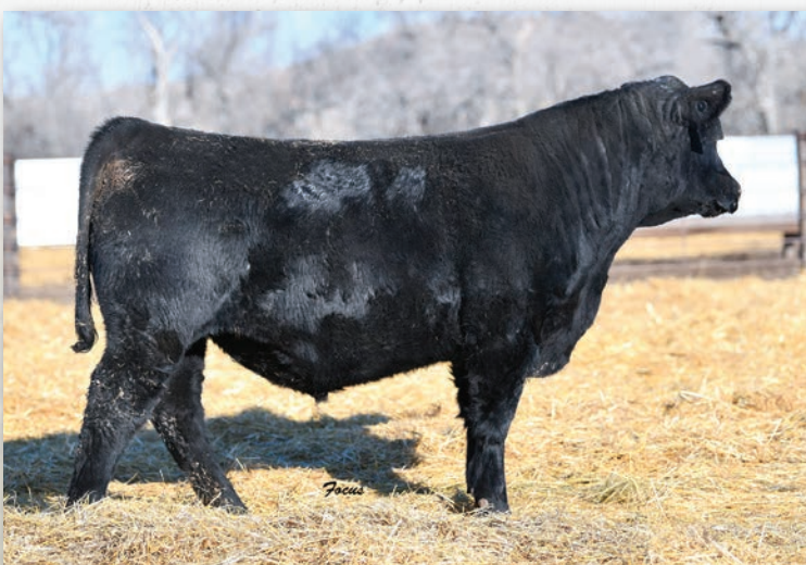
Lot 67 • ECR Cowboy Up 855