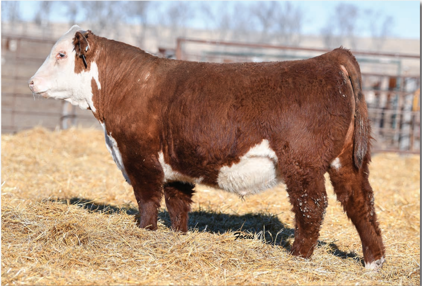
Lot 46 • ECR WF Bravo 8007