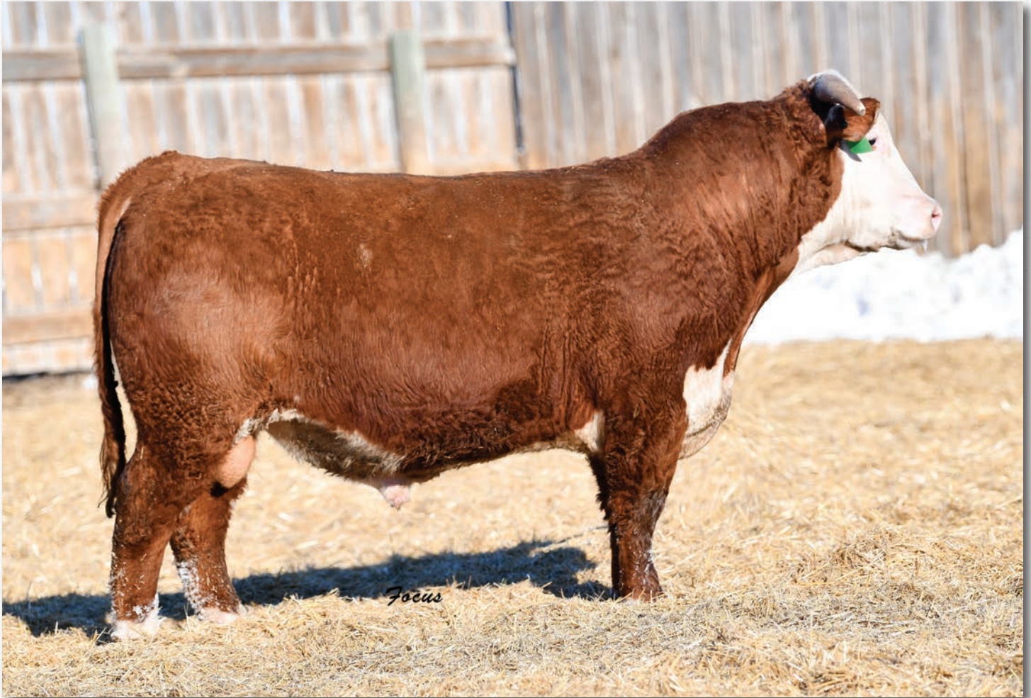
Lot 75 • ECR 3371 Rewards 7491