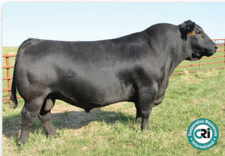
SAV Resource 1441 • Sire of Lots 125, 127 & 128

• Long bodied bull with added growth and performance