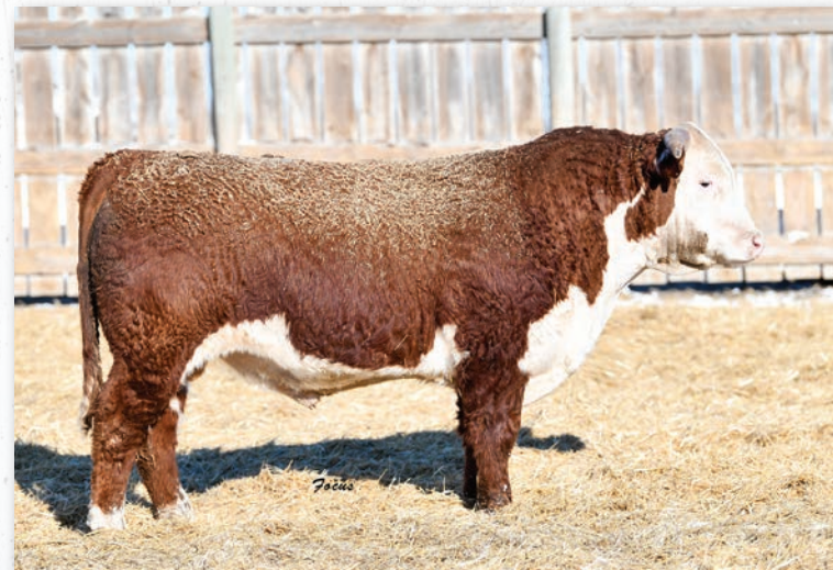
Lot 122 • ECR 2109 Domino 7701

• Below average birth weight and above average weaning weight