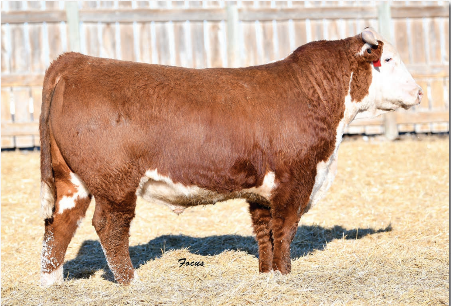
Lot 95 • ECR 2029 Advance 7507