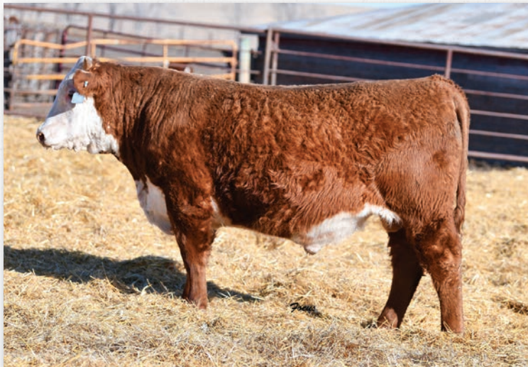
Lot 49 • ECR 3275 Bravo 8240