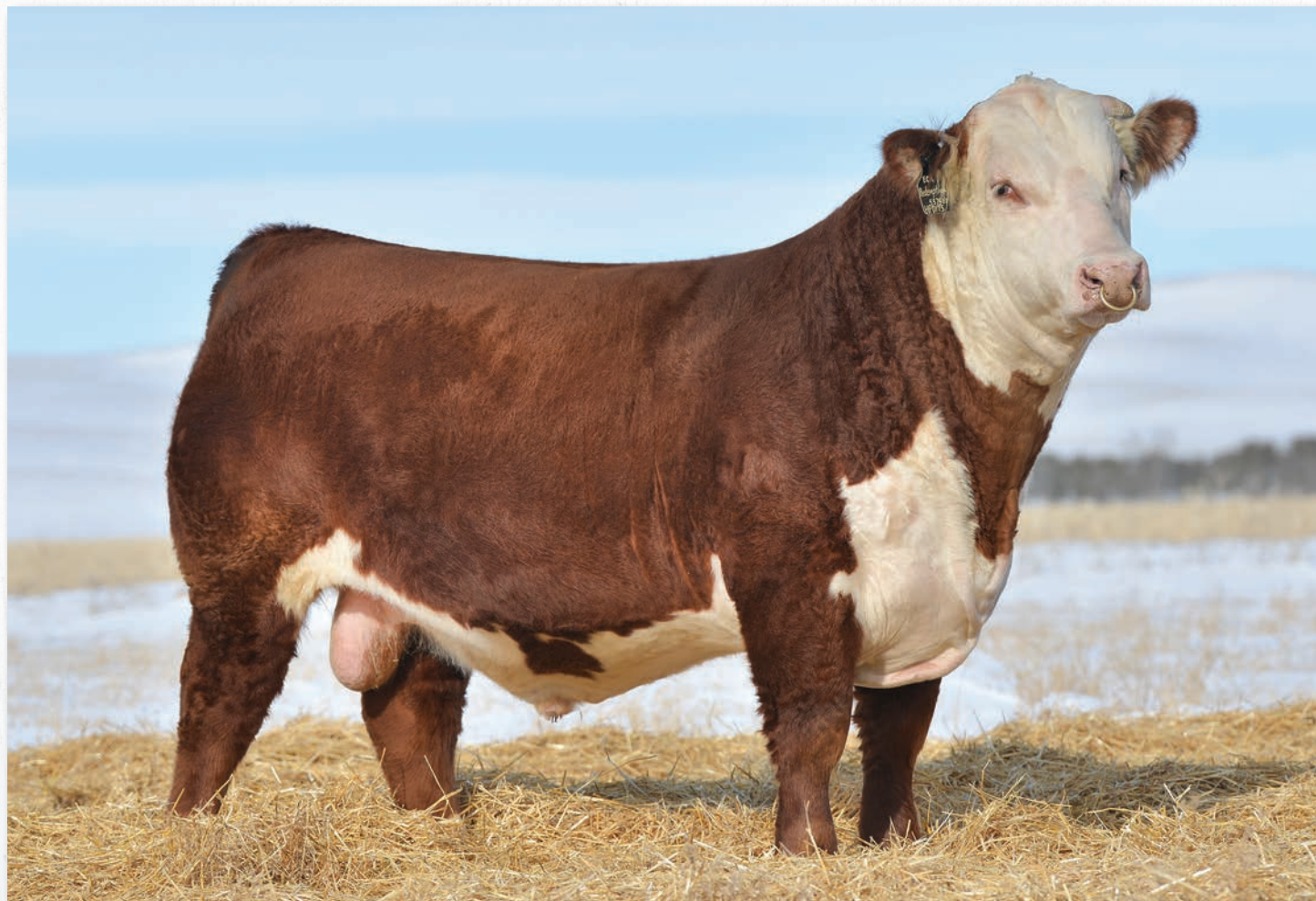
ECR Redemption 5575 ET

Redemption is the big stout bull in the group of herd bulls. He is easy to find. He sires cattle with extra power and growth. He is a descendant of a great donor cow and he and his siblings have all done well in production.