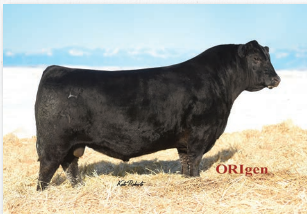
Reference Sire • HA Cowboy Up 5405