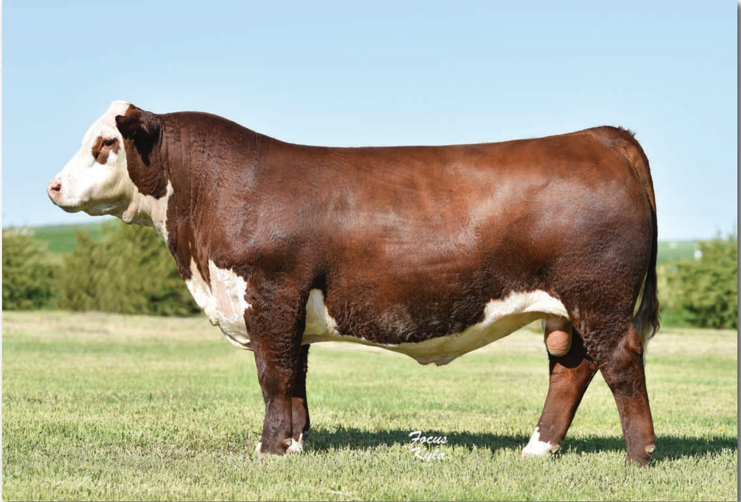
NJW 79Z Z311 Endure 173D ET

When I came across Endure out at NJW I knew he was the polled bull I had been looking for to take the polled side of things to the next level here at the ranch. He was the heaviest bull in the offering but not the largest framed. He was wide bodied and a foot longer than his contemporaries. He is backed by a tremendous cow family that is sought after by Hereford breeders across the globe. We have sold semen to Australia, Canada and South America. His calves are generally dark red and have ample amount of power. We can't wait to get his daughters into production.