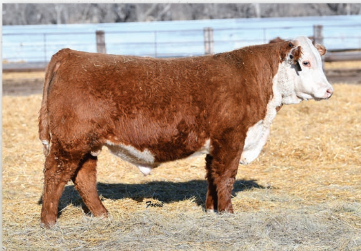
Lot 50 • ECR 6305 Domino 8055