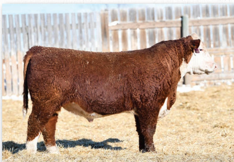
Lot 98 • ECR 743 On Time 7544 ET