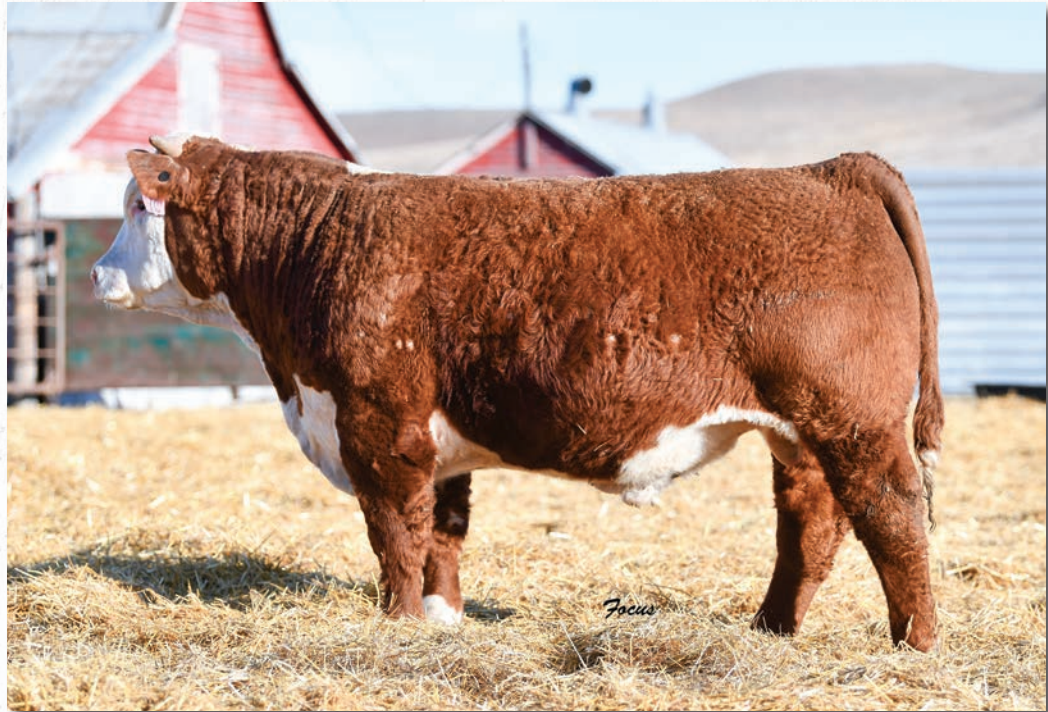
Lot 61 • ECR 10Y Hometown 8198E ET