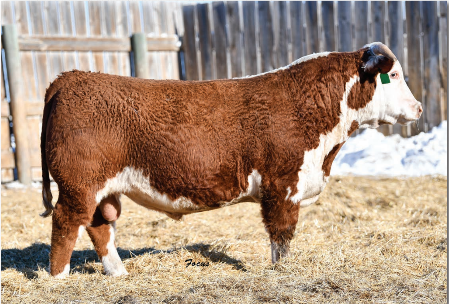
Lot 70 • ECR 3371 Rewards 7413