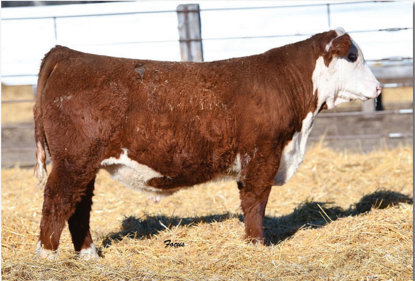
Lot 56 • ECR RO Tobey's Sensation 822 ET