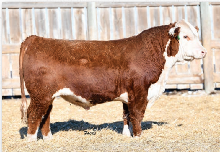
Lot 116 • ECR 3371 Rewards 7416

• Middle framed bull that is easy fleshing and stout