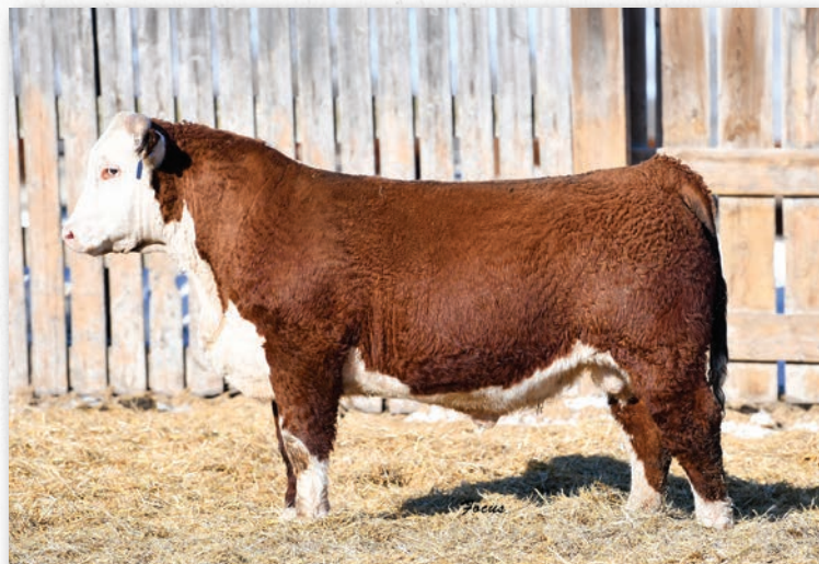
Lot 101 • ECR WF Aventus 7613 ET