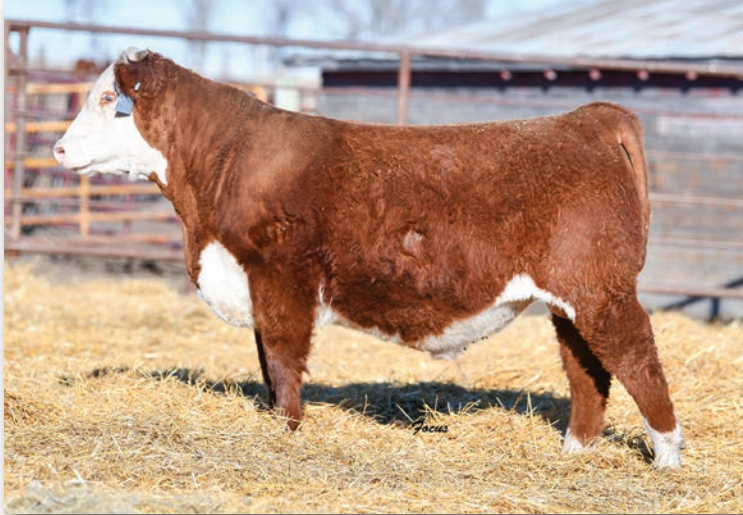
Lot 39 • ECR WF 5575 Redemption 8595