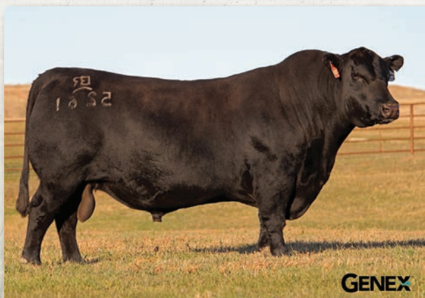
Reference Sire • Bruin Torque 5261