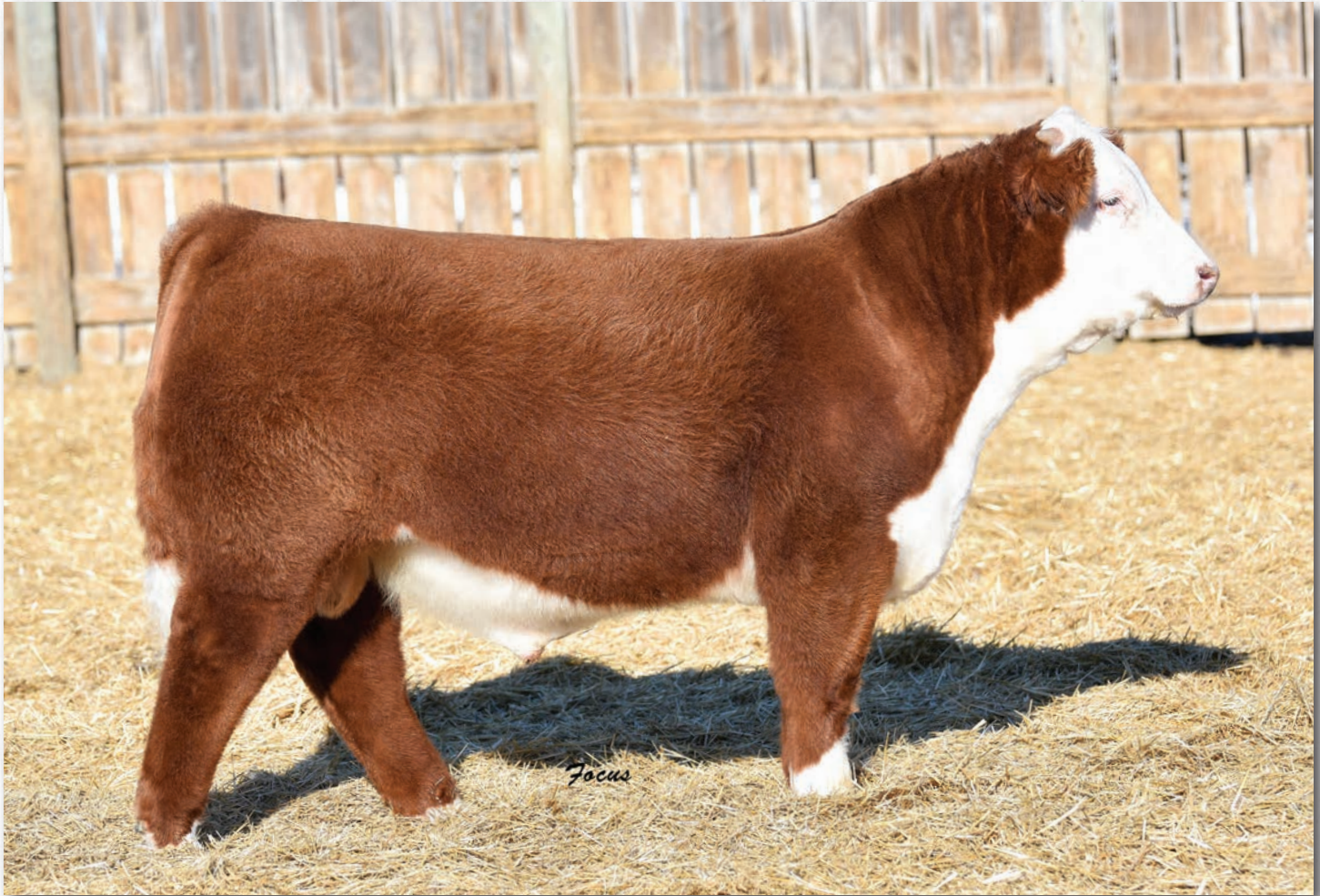
Lot 18 • ECR WF 628 Advance 8940 ET