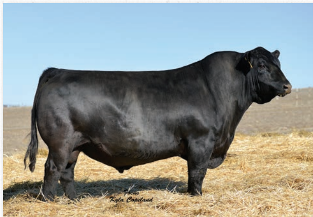
Reference Sire • Basin Payweight 1682