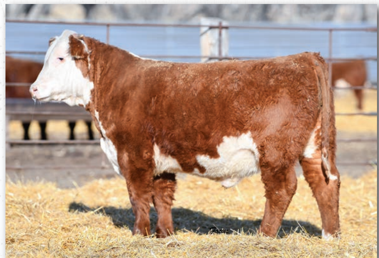
Lot 20 • ECR 628 Advance 8281

If planning to utilize online bidding, please contact Dan or any sale staff prior to the sale in case there happens to be a problem with the internet during the auction.