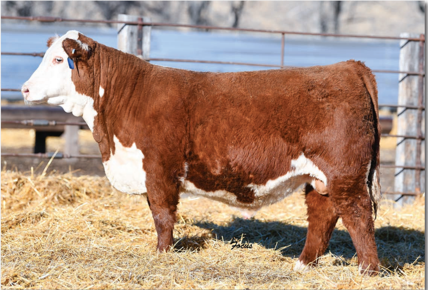
Lot X • ECR 0245 Golden Flow 8210