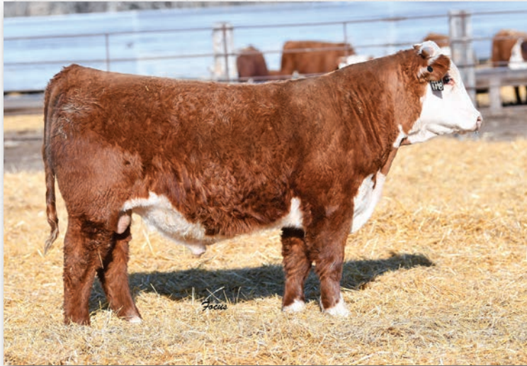
Lot 48 • ECR 3275 Domino 8230