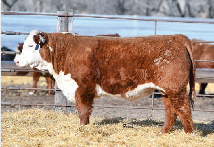
Lot 53 • ECR Excel Domino 8276