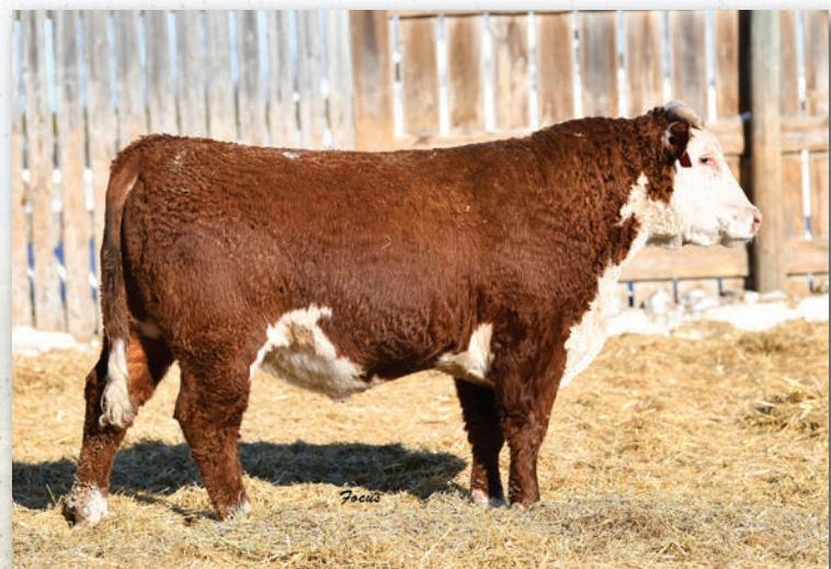
Lot 123 • ECR 2029 Advance 7213

• 119 WW ratio • Middle framed and easy fleshing