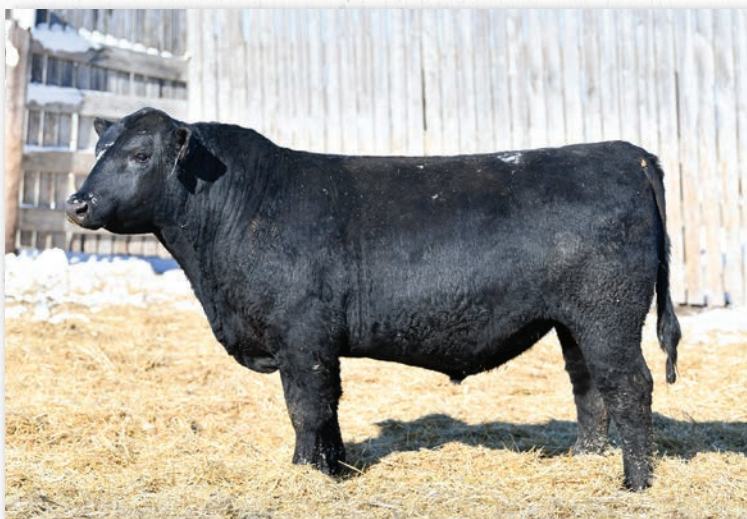
Lot 126 • ECR The Product 742