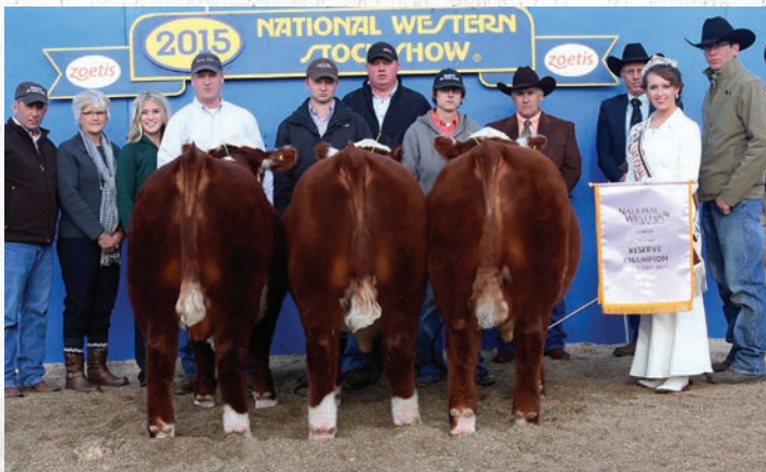
Reserve Champion Pen of Three Bulls 2015 National Western Stock Show, Denver, Colo.

Lots 131-138 (10 head per Lot) F1 replacement type females