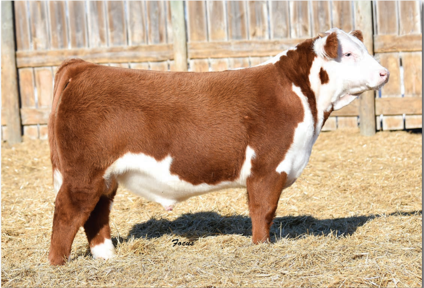
Lot 17 • ECR WF 628 Advance 8909 ET