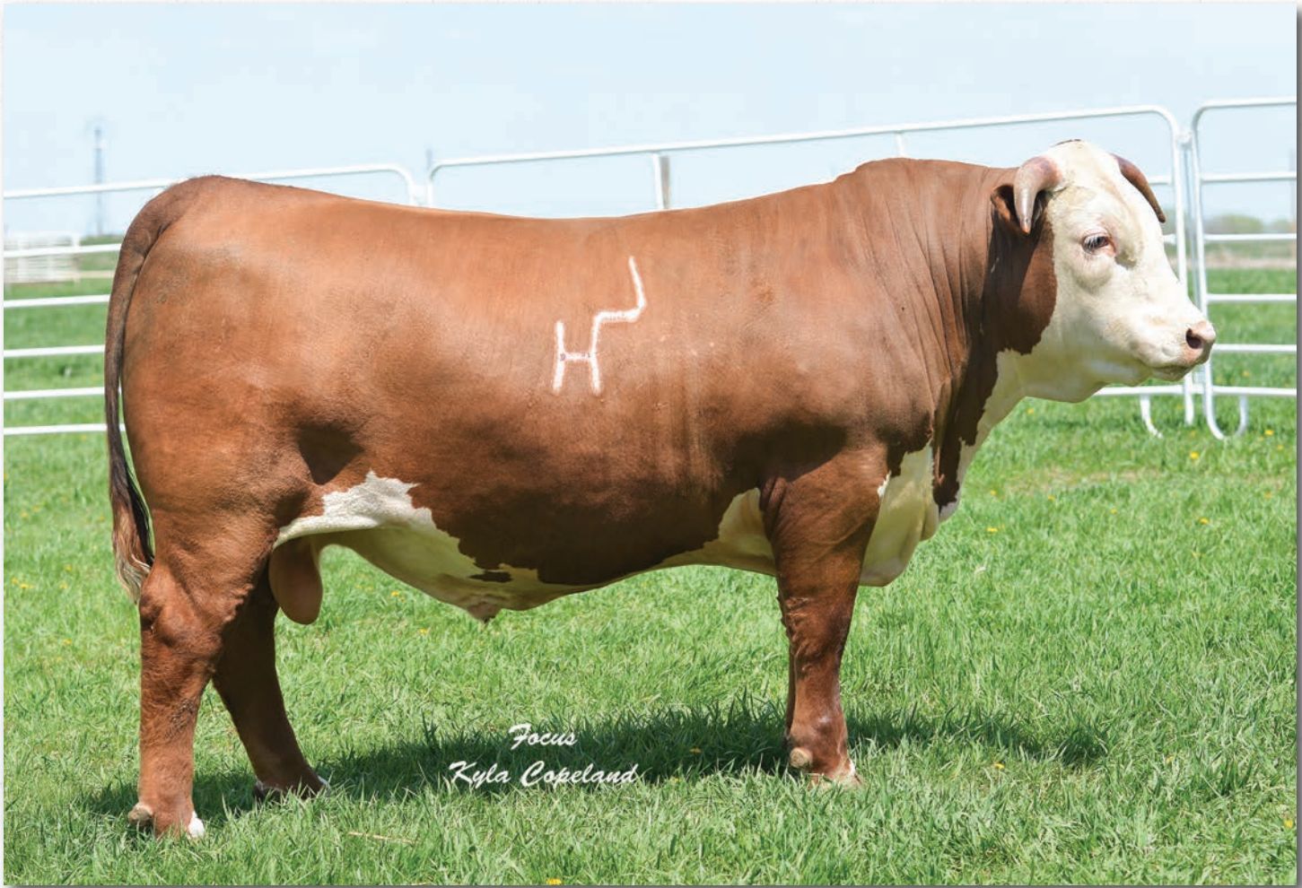
Focus Kyla Copeland

2029 has been consistent sire of high quality cattle here at the ranch. They are generally short marked, red necked and docile. 2029 daughters offer exceptional mothering ability and are the ones you really appreciate when it's a cold night during calving season. They have great teat size and udder. He offers a high calving ease direct, big scrotal and great carcass numbers. In his pedigree you will find some of the greats from Holden including 8203 who was one of the all time most powerful bulls to come out of Montana and 2029 is a direct daughter of 5139 who was an all time great producer and money generator for Holden.