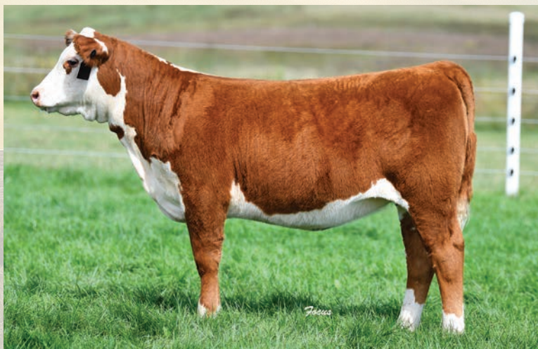
ECR 173D Candi 9478 ET :: Lot 5

Lot 4 has been a standout since birth and not just because of her wild color. She is very correct in her top line and tailhead with plenty of body and mass. Her mother is just getting started as a donor and will have influence in the future.