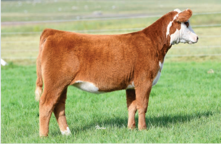
ECR LP Sabrina 9911 :: Lot 29