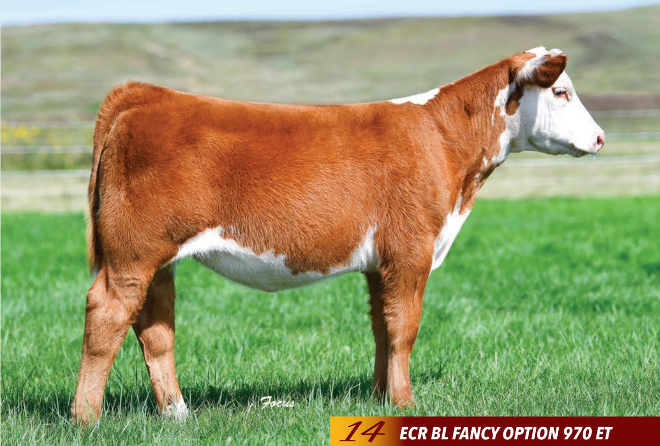
14 ECR BL FANCY OPTION 970 ET