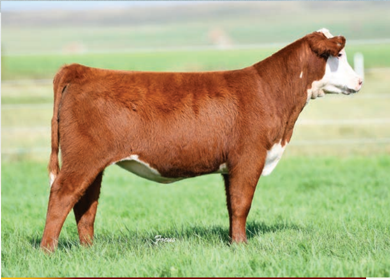
21 ECR 0245 GOLDEN LADY 9638 ET

BD: 4/29/19 • Reg. #44055284 • Polled • Tattoo 9638