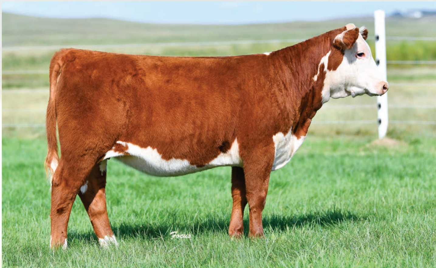
ECr 394 Golden Lady 9266 :: Lot 20