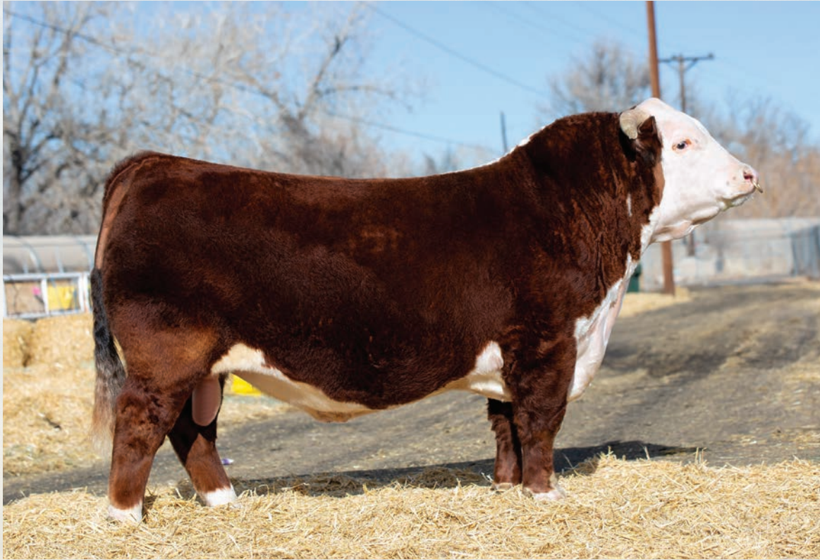
ECR CHEZ L18 Sensation 7076 ET :: Sire of Lots 33 & 34