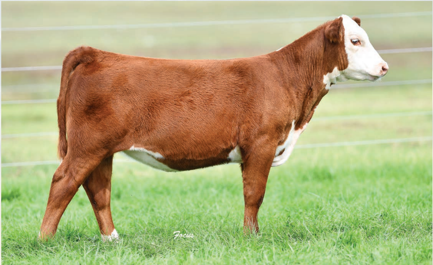
ECR WF 2296 Miss Donna 9909 ET :: Lot 3