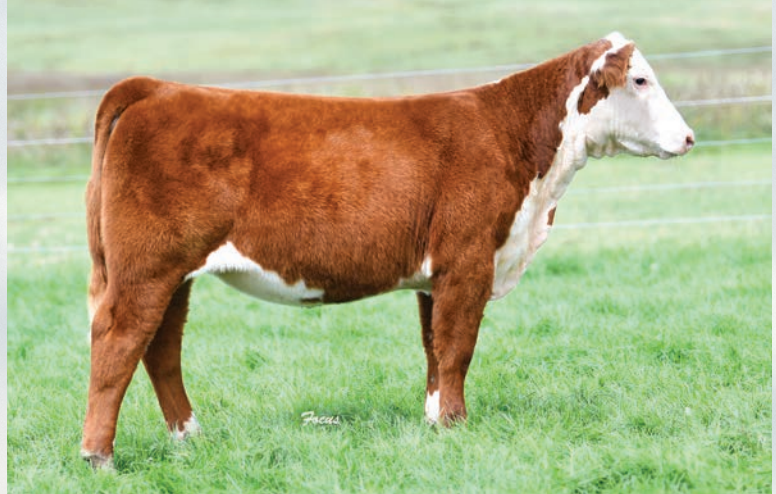
ECR BHR Miss Shameless 9926 ET :: Lot 11

This one has all the pieces. She's stout and rugged with a huge hip, plenty of body and extended through the front 1/3