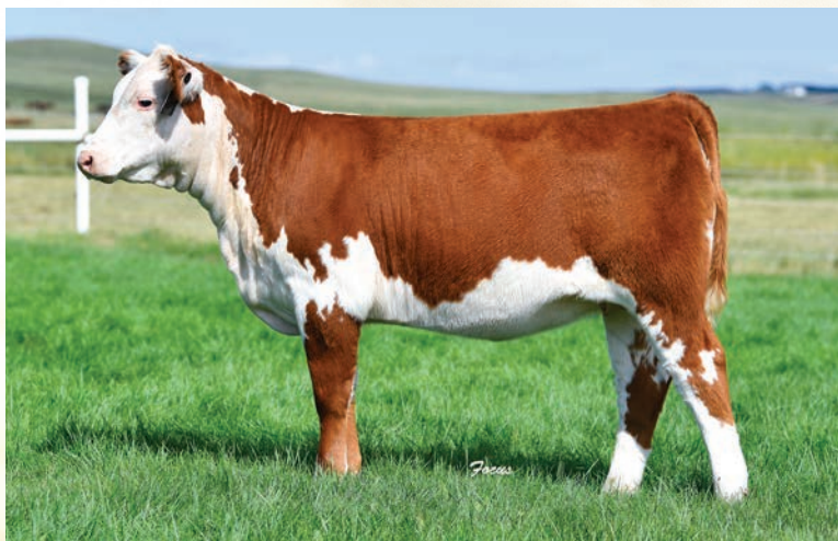
ECR Miss Olivia 9331 ET :: Lot 4