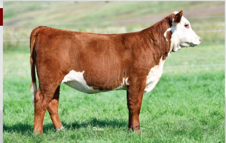
ECR 7076 Misty 9111 :: Lot 33

BD: 2/28/19 • Reg. #44056090 • Horned • Tattoo 9111