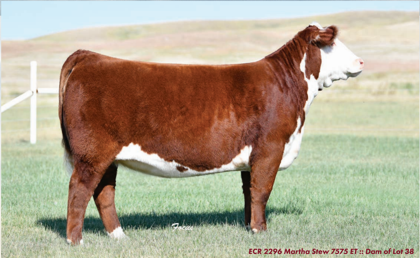
ECR 2296 Martha Stew 7575 ET :: Dam of Lot 38