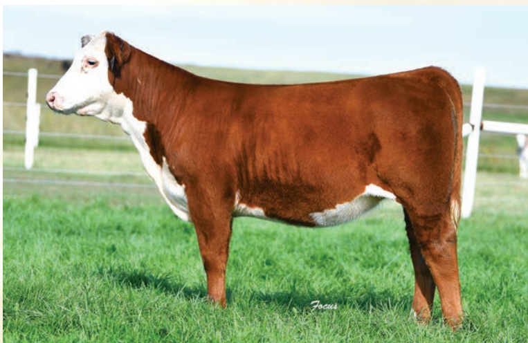
ECR 6494 Veronica :: Lot 17

Find this one on sale day! She's got what it takes to be super competitive. She's one that has that showing presence and one that I think will continue to get better and better.