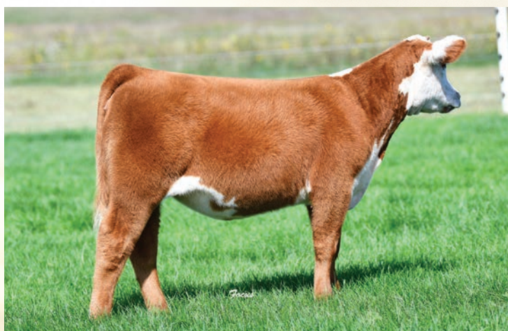
ECR WF Miss Ella 9515 :: Lot 36

Cool lookin', moderately framed Undisputed daughter with a ton of look who balances really well. She excels in terms of extension throughout the fron 1/3 of her body.