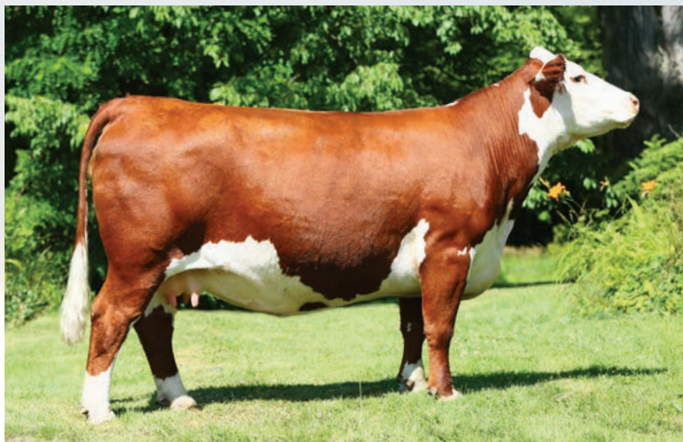
SULL Olivias Time :: Dam of Lot 4