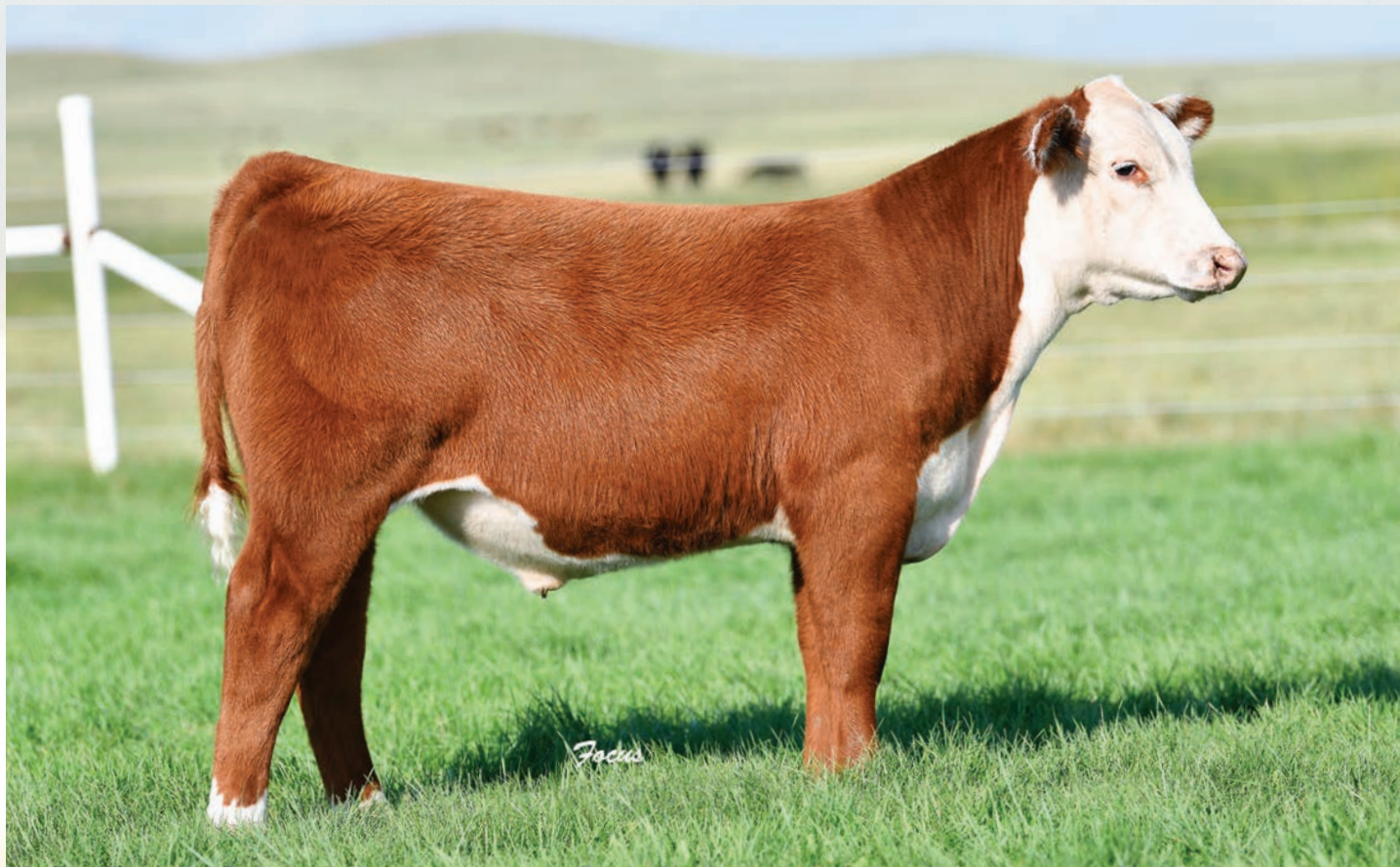
ECR 0245 George 9654 ET :: Lot 40