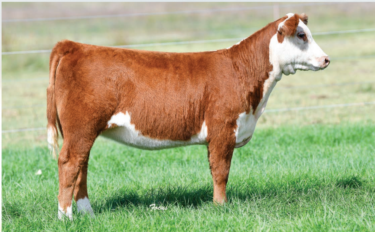
ECR Shame Girl 9403 :: Lot 10