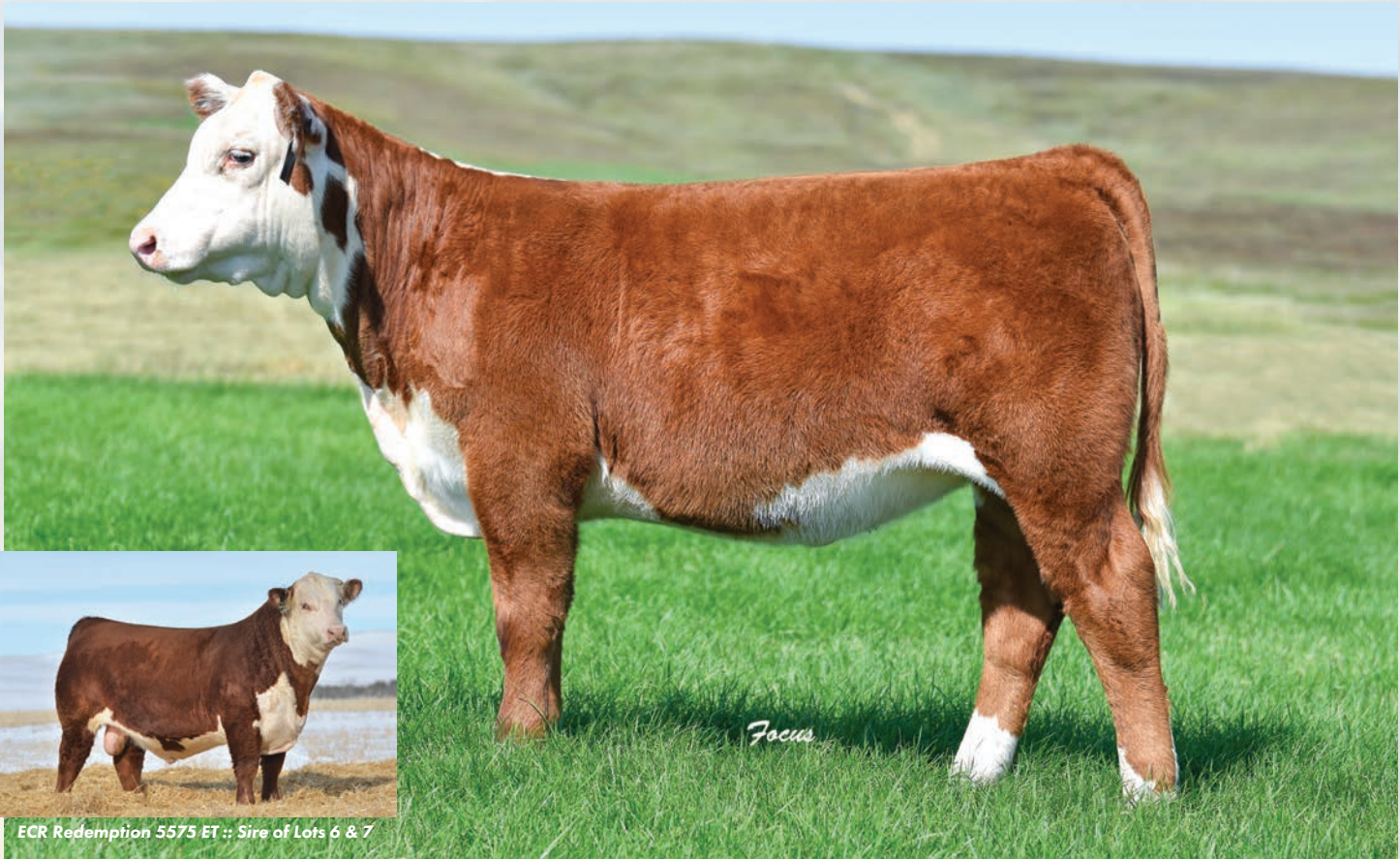
ECR Redemption 5575 ET :: Sire of Lots 6 & 7