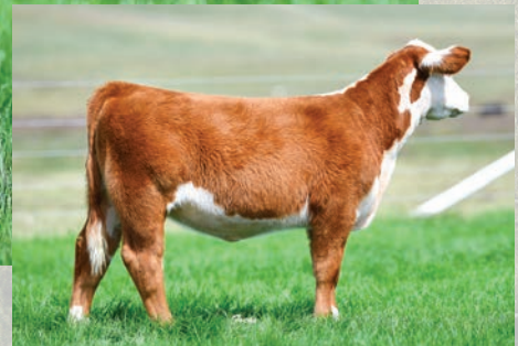
ECR BL Fancy Option 981 ET :: Lot 15

BD: 5/25/19 • Reg. #44055237 • Polled • Tattoo 981