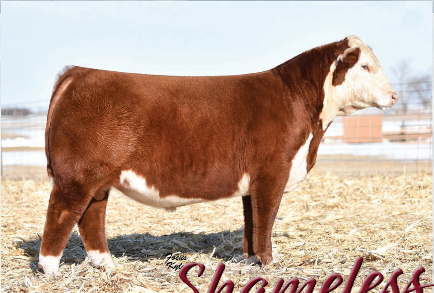
ECR Shameless 7586 ET