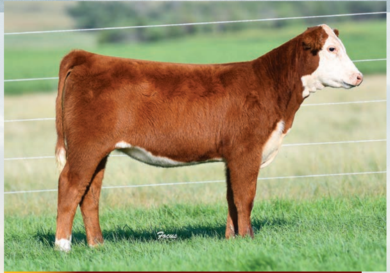
22 ECR 0245 MANDY BLAKE 9655 ET

BD: 4/29/19 • Reg. #44055284 • Polled • Tattoo 9638