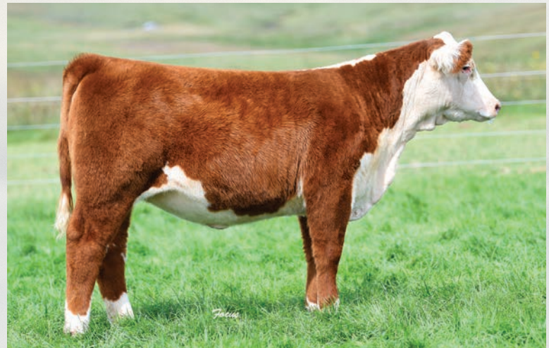
ECR BHR Miss Shameless 9812 ET :: Lot 12

So massive in her build. She is huge bodied, hiped and boned. Has great hair and one that I think will be a GREAT breeding piece when she's done showing. Her MGS is a full brother to Redemption and Candi. Power in the blood.