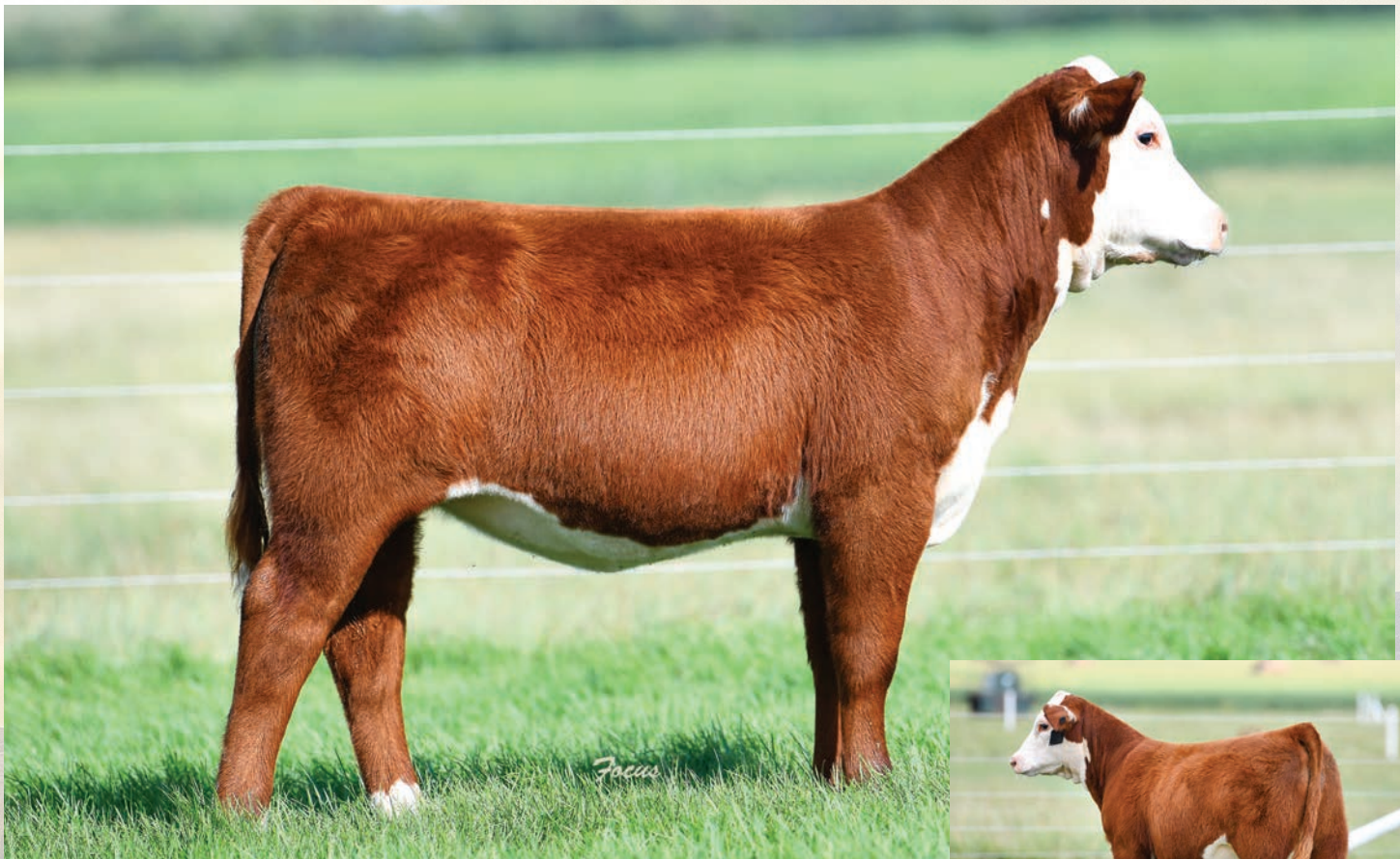
23 ECR 0245 MISS GLADYS 9656 ET

BD: 5/2/19 • Reg. #44056084 • Polled • Tattoo 9655