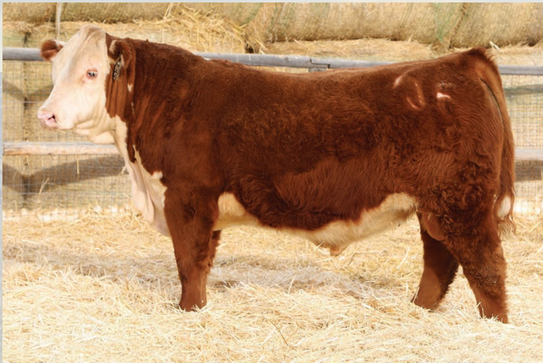
NJW 84B 10W Journey 53D :: Sire of Lots 30 & 31

The result of a bred heifer purchased in last year's sale. She has a sweet personality and would be a great project for a younger junior. She is long bodied with plenty of rib shape and depth.