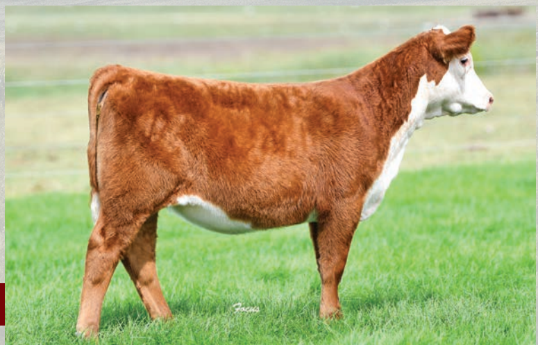
ECR 7076 Misty 9327 :: Lot 34

BD: 3/27/19 • Reg. #44056068 • Horned • Tattoo 9327