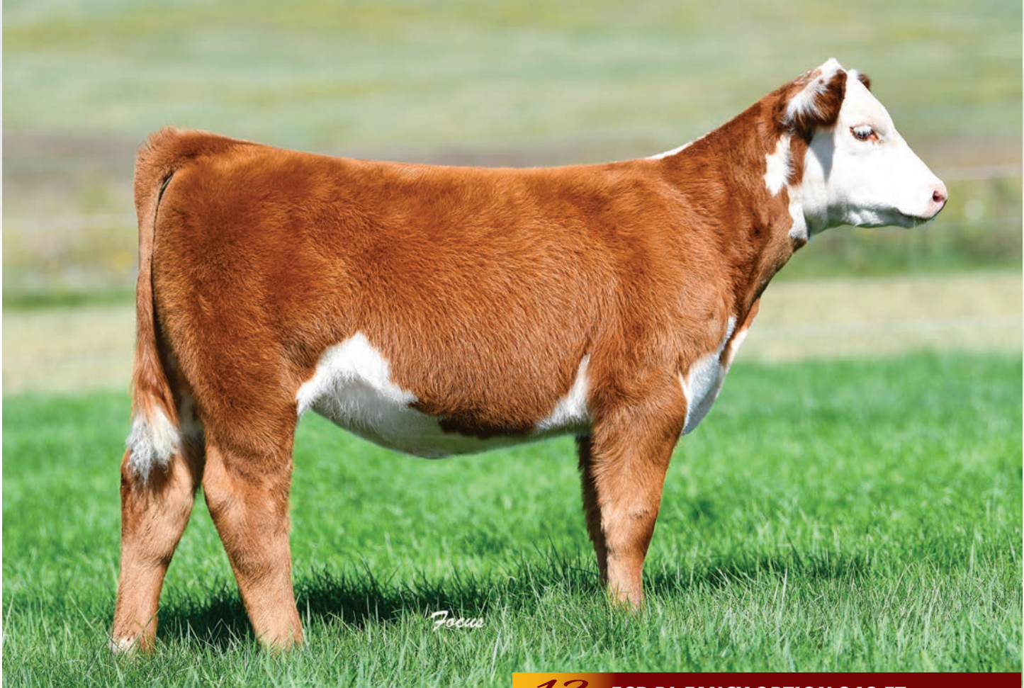
ECR BL Fancy Option 969 ET :: Lot 13