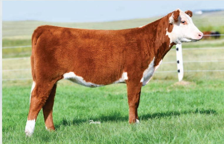
ECR Miss Bobbie 9418 :: Lot 19