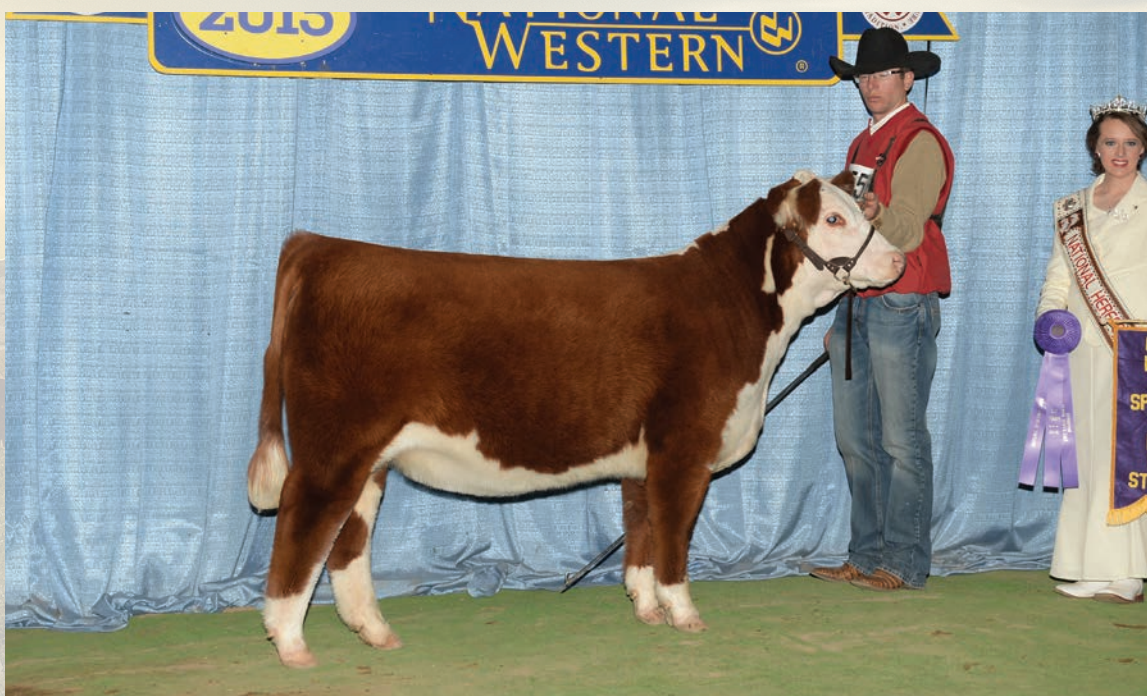
ECR Miss Sensation 4328 ET :: Dam of Lots 31 & 32

BD: 5/9/19 • Reg. #44056067 • Polled • Tattoo 9903