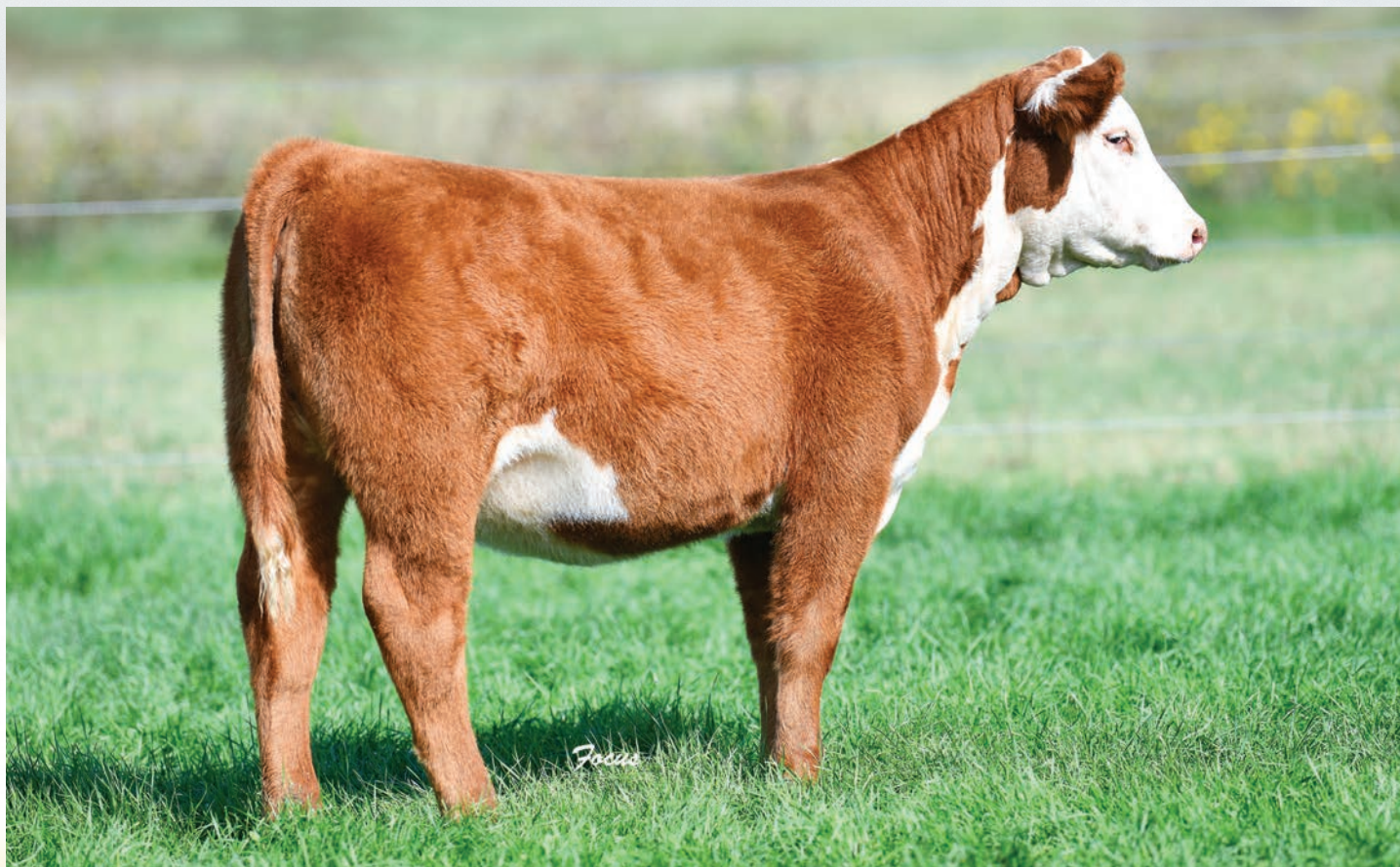
ECR Lady Shameless 9377 :: Lot 8