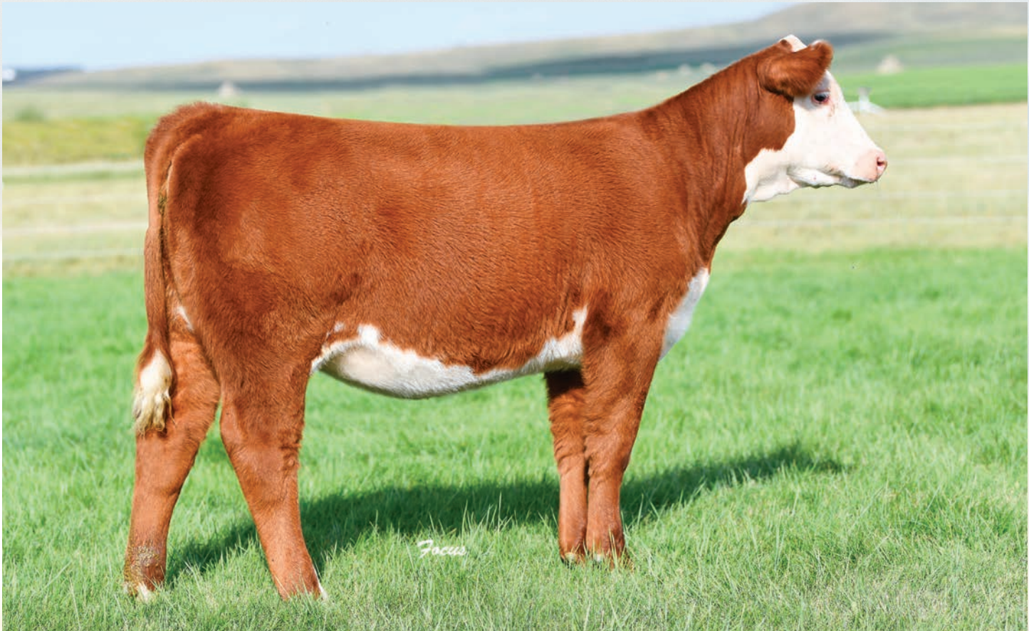
ECR 2296 Lady Flo 9323 ET :: Lot 2