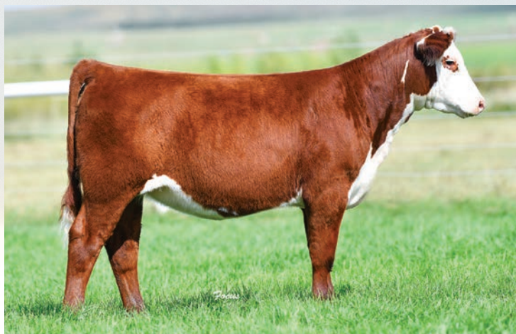
ECR 3304 Miss Tobey 9389 :: Lot 35