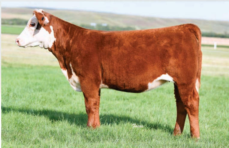
ECR Jackie 9244 :: Lot 16