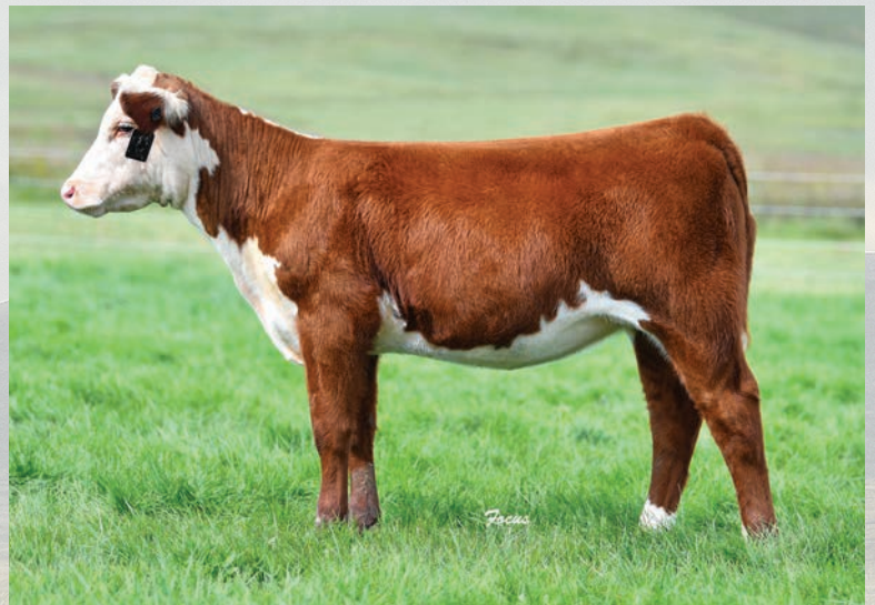
25 ECR 0245 GOLDIE LOX 9683 ET

BD: 5/5/19 • Reg. #44055282 • Polled • Tattoo 9670