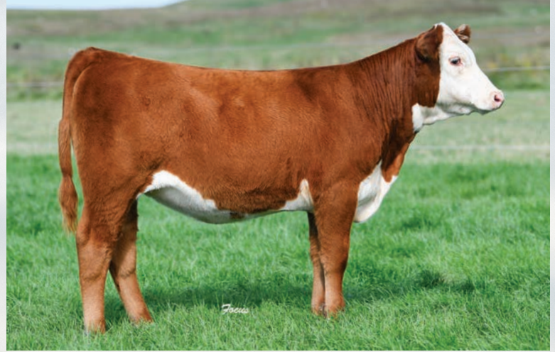
ECR TH 53D Miss Diamond 901 :: Lot 30