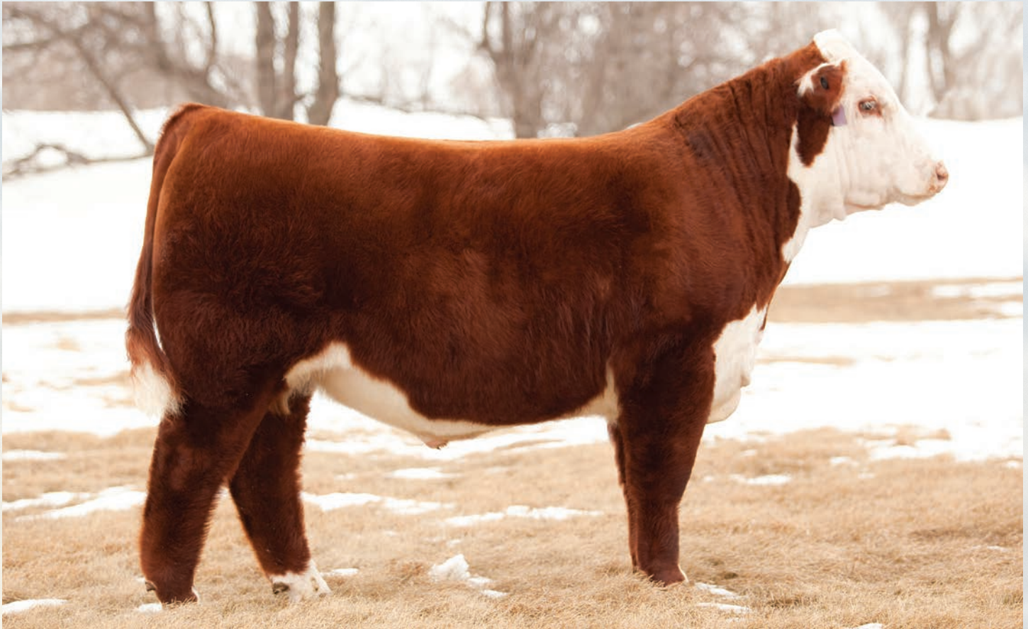
DKF RO Cash Flow 0245 ET :: Sire of Lots 21-27