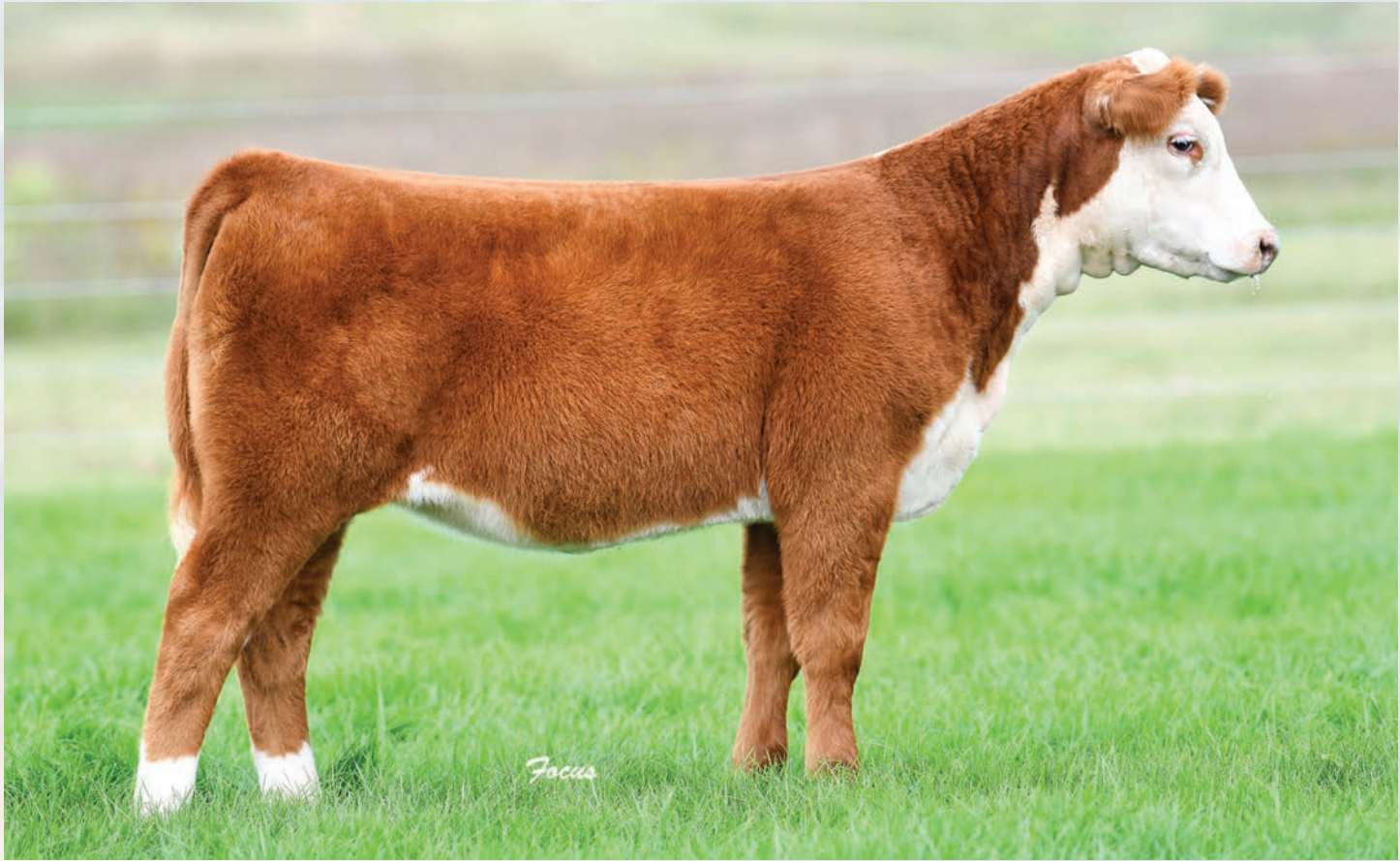
ECR 7586 Gretta 9380 :: Lot 9