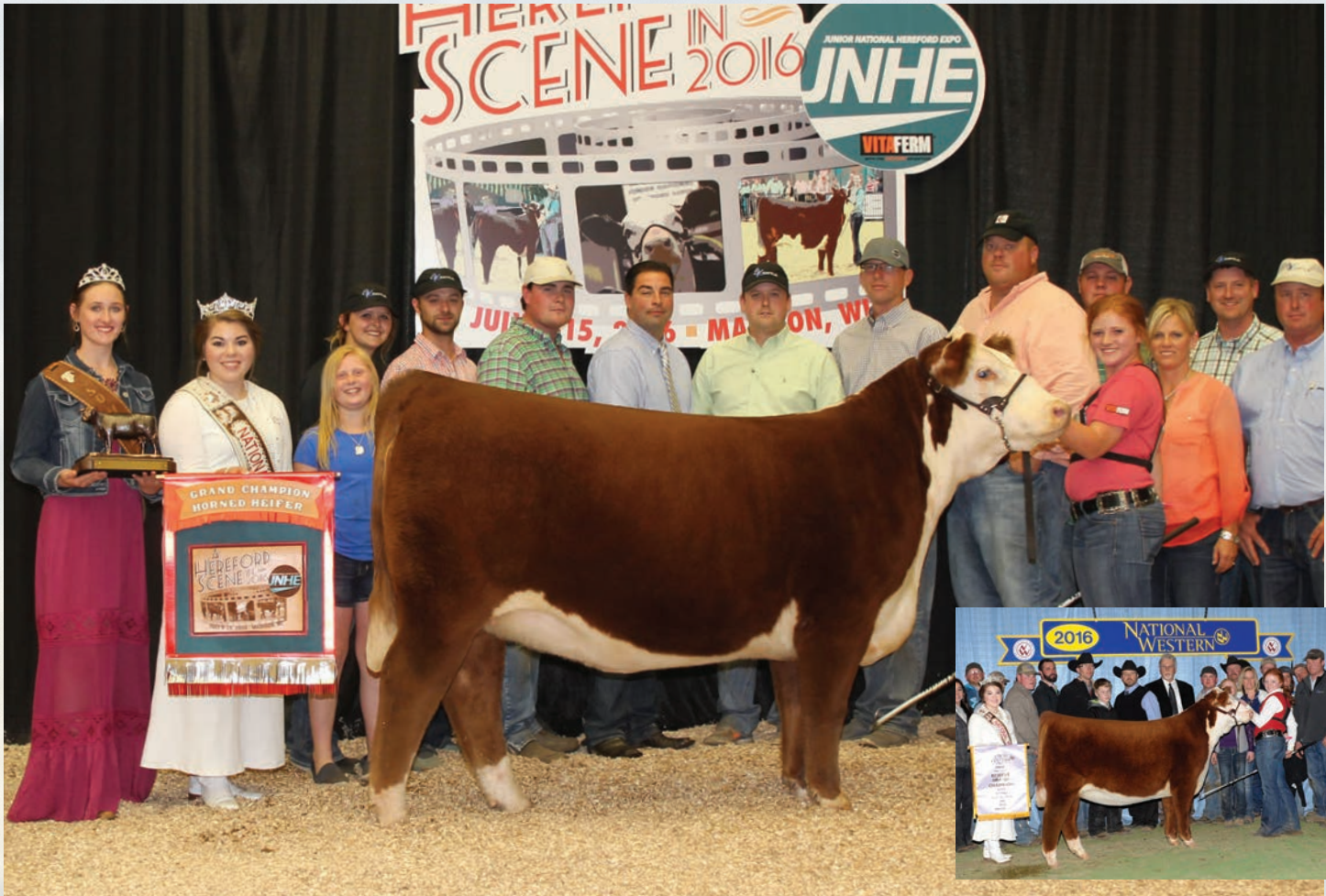
ECR Candi 5451 ET :: Full sib in blood to Lots 1-3 2016 NWSS Reserve Champion Horned Female & 2016 JNHE Champion Horned Female