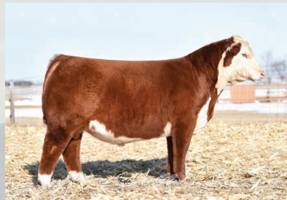
ECR Shameless 7586 ET :: Full sib to Lots 21-27

Grand Champion Polled Female 2016 JNHE Supreme Champion 2017 San Antonio Stock Show Grand Champion Female, 2017 Houston Livestock Show