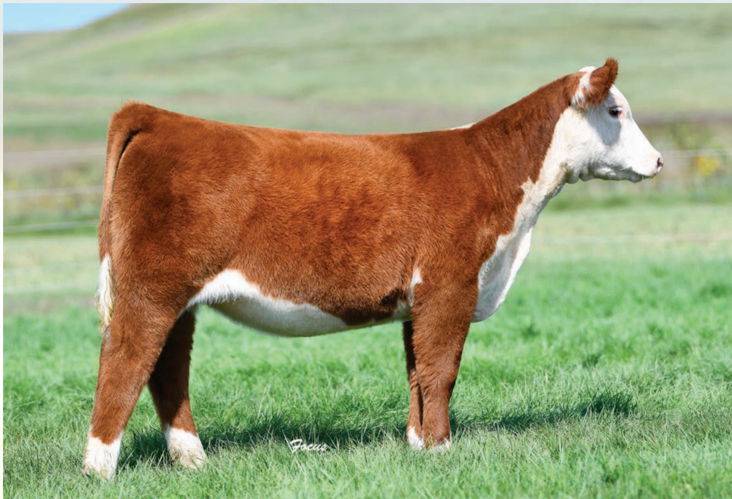
ECR LP Sugar 9171 ET :: Lot 1