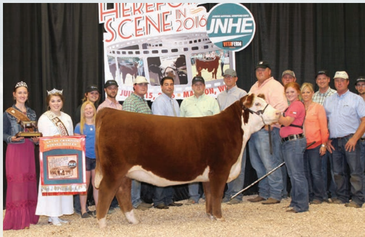
ECR Candi 5451 ET :: Dam of Lot 5