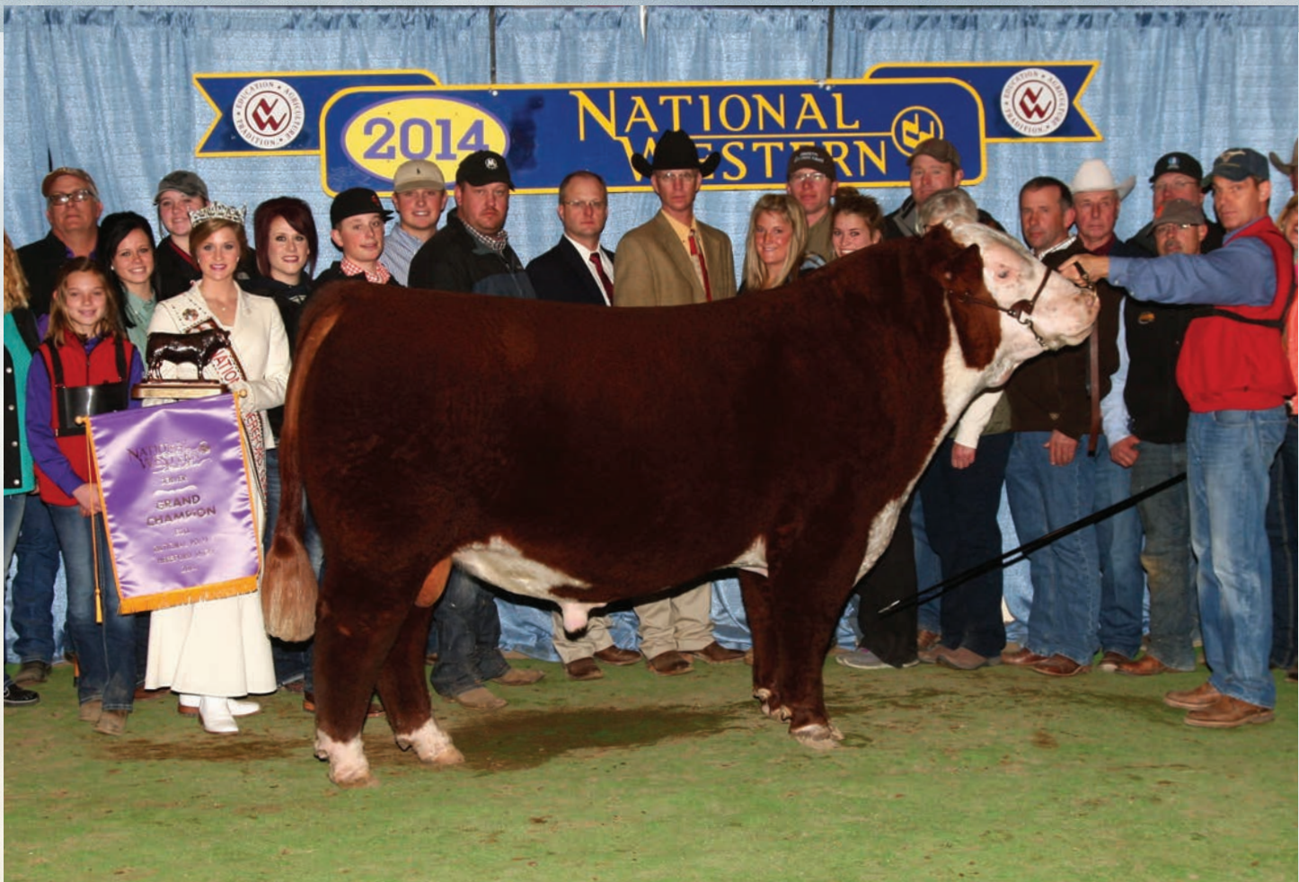
ECR Whomaker 210 ET :: Full sib to Lots 21-27 :: National Champion Bull 2014 NWSS