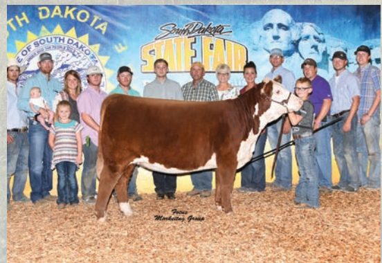
ECR 2296 Bobbi Sue 7789 ET Grand Champion Female, 2018 SD State Fair Hereford Special Full sib to Lots 1 & 2