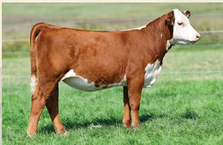
ECR BHR Miss Sooner 9176 ET :: Lot 37

Looking for something with a little different pedigree? Something a bit unique in the way she's put together? One that has EPD's that excel just like her phenotype? This might be your girl.