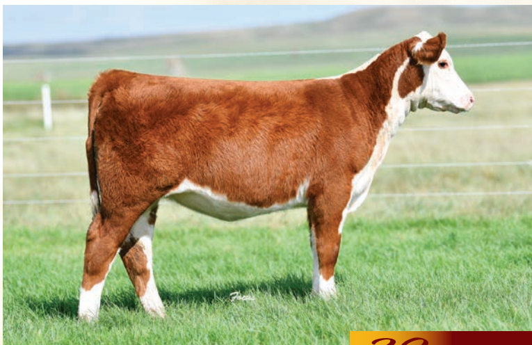
ECR WF Lucky Lady 9903 ET :: Lot 32

BD: 5/6/19 • Reg. #44056065 • Horned • Tattoo 9902