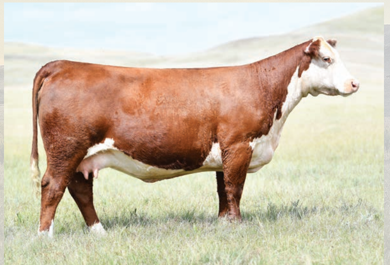
ECR Lady Flow 211 ET :: Dam of Lot 1 & 2

Tremendous amount of future in this female. She resembles Hollis's fall that did some winning in terms of her growth curve and the way she is put together. She has all the pieces and will be a bit later maturing but when she gets there, I expect big things from this female.