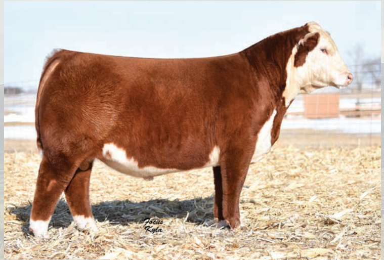
ECR Shameless 7586 ET :: Sire of Lots 8-12

She has a really sweet look and just needs a little time. If you have a history of maybe getting your show heifers a little chunky in the past this heifer would be a great option as she is one that will be able to handle some feed and still keep herself looking like a lady.