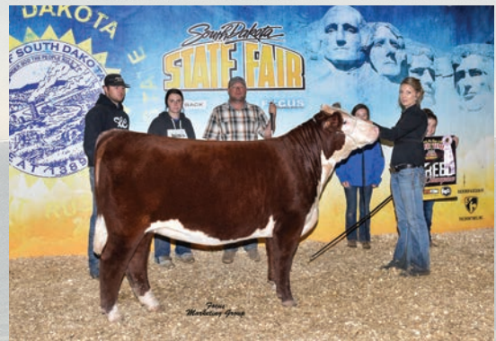
ECR RO Demi 824 ET Reserve Champion Female, 2019 SD State Fair Open Show Grand Champion Female, 2019 SD State Fair Hereford Special Grand Champion Hereford Female, 2019 State Fair 4-H Grand Champion Hereford Female, 2019 SD Summer Spotlight Full sib to Lots 1 & 2