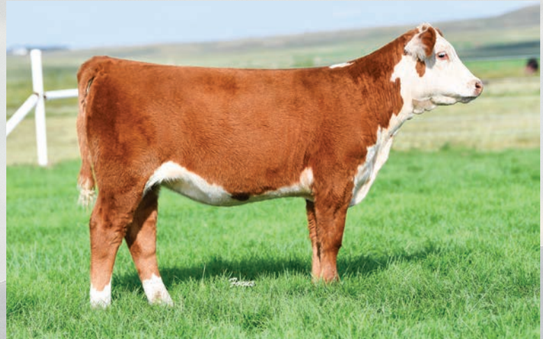
ECR 721 Martha Stew 9171 :: Lot 38

This heifer was supposed to be lot tagged within the first 10 lots but due to technical difficulties she got moved down in the sale catalog. Do not miss this female. We think a lot of her and the future that she has. Fault free, well balanced plenty of eye appeal. Her mother has had plenty of success in the show ring and we think her first calf will exceed her mother.