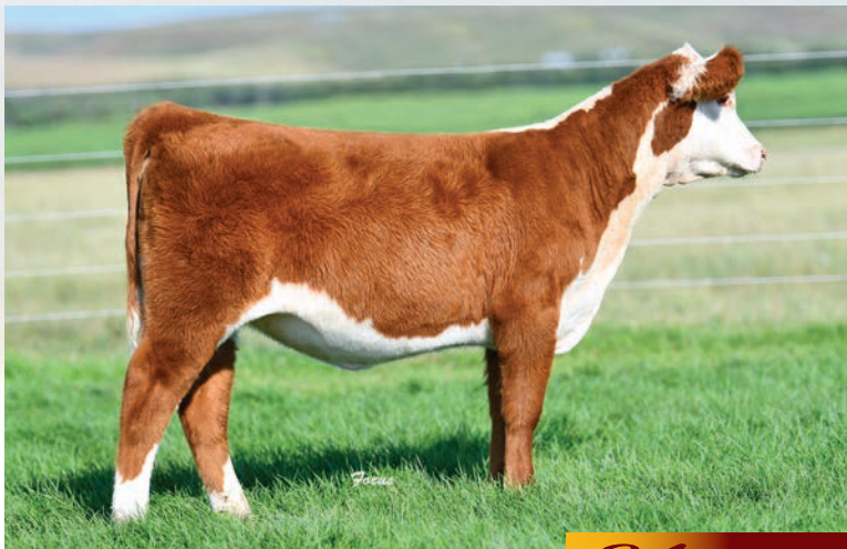
ECR WF Lucky Lady 9902 ET :: Lot 31