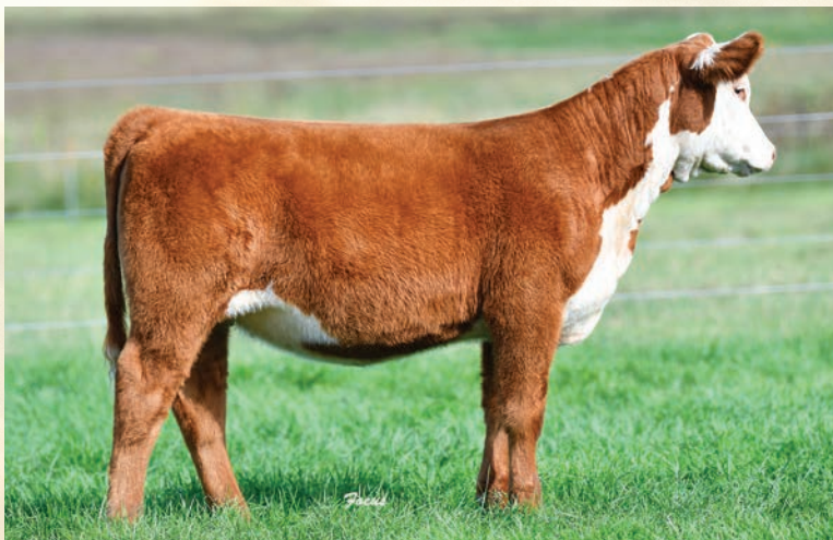
ECR Lady Shameless 9377 :: Lot 8