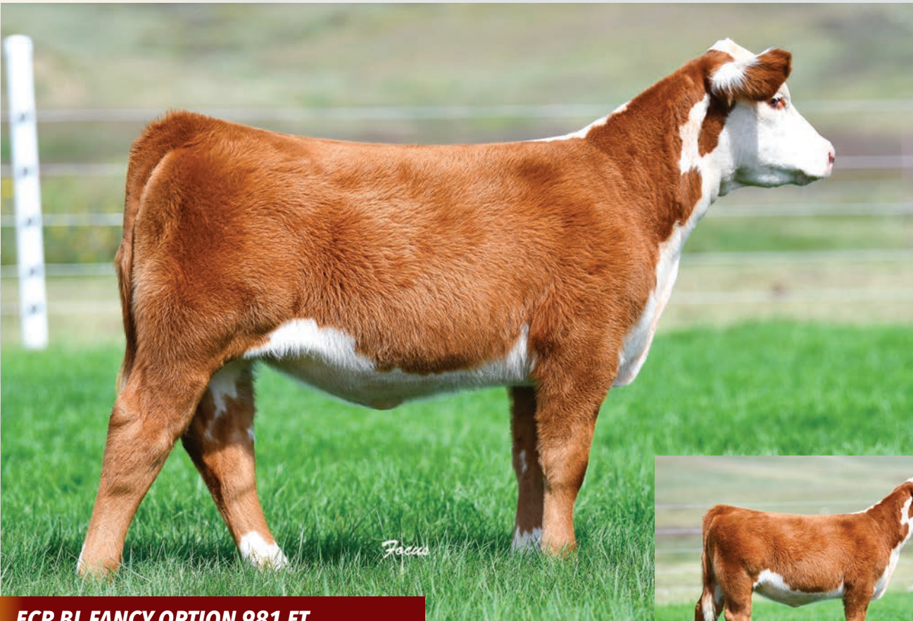
15 ECR BL FANCY OPTION 981 ET

BD: 5/18/19 • Reg. #44055236 • Polled • Tattoo 970