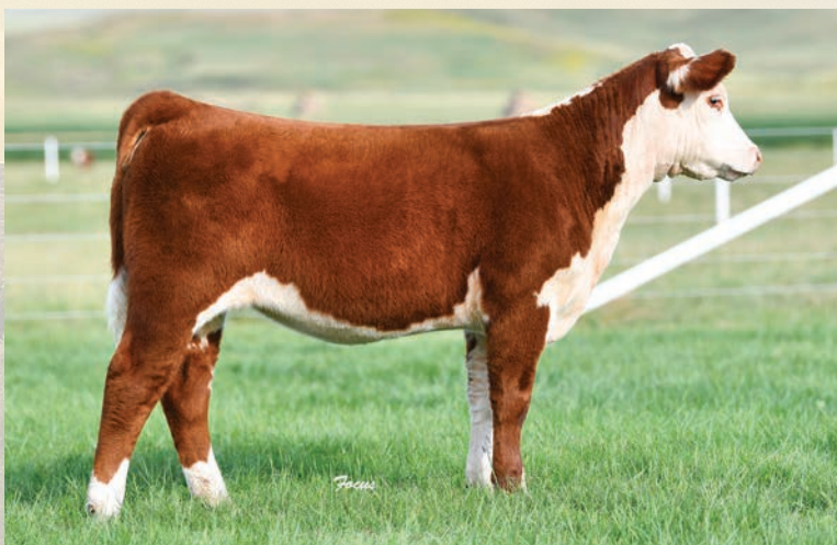
ECR ATM Georgia Girl 9272 :: Lot 18

Lot 17 was one of my favorites when we gathered these heifers to head to the barn. Not only is she an incredible beast in her own right but her mother is one of our very best. This heifer has a ton of width to her skeleton and an abundance of rib shape and quality. Buy her to show and enjoy her power when she matures into her momma.