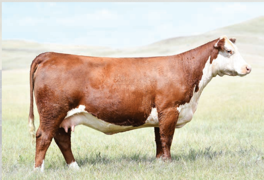
ECR Lady Flow 211 ET :: Dam of Lots 1 & 2