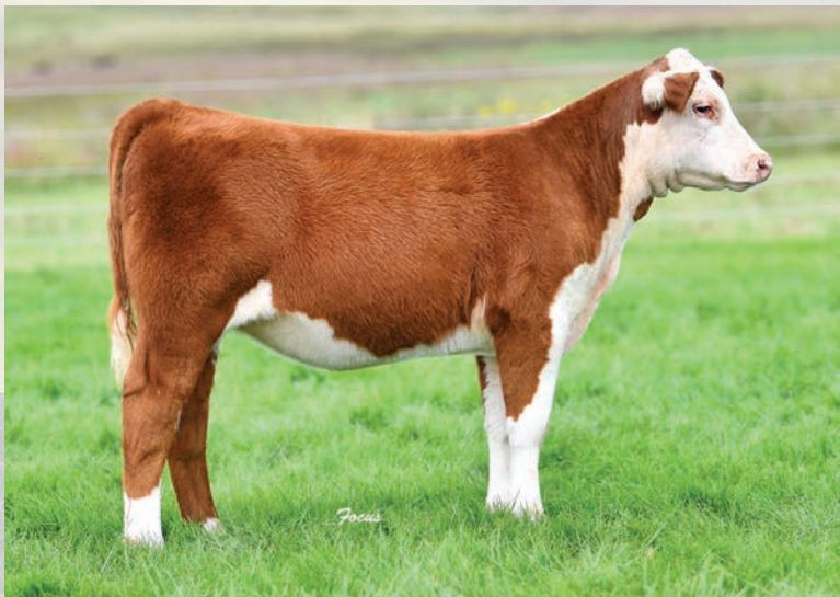
24 ECR 0245 GOLDIE LADY 9670 ET

BD: 5/5/19 • Reg. #44055282 • Polled • Tattoo 9670