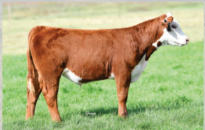
Lot 39 Steer

This steer has been a standout since early on. Has plenty of muscle and shape. Will be very competitive in SD Hereford special or any other state fair.