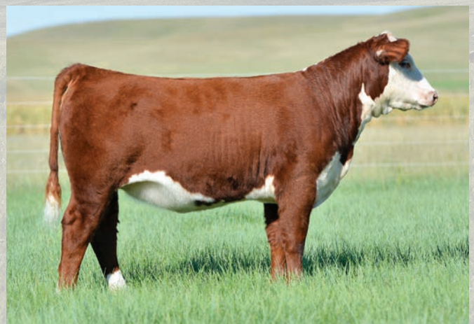
ECR Miss Donna 6898 ET :: Dam of Lot 3