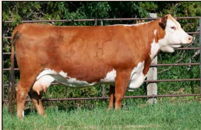
Lot 14 – HH Miss Advance 3015A