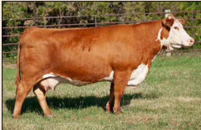
Lot 6 – HH Miss Advance 3242A