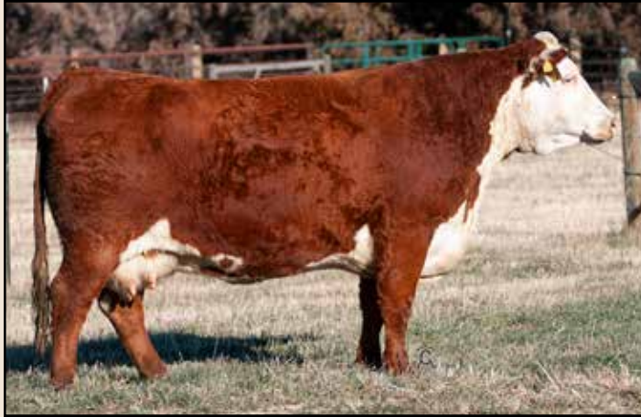
Lot 1 – HH Miss Advance 2022Z ET