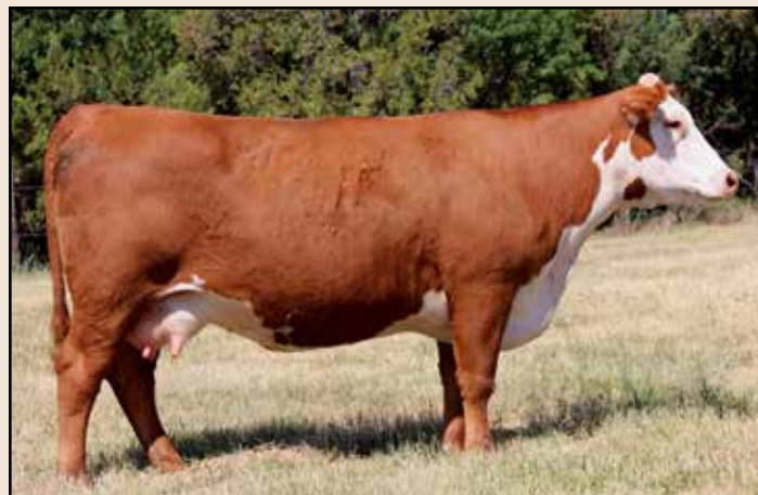
Lot 2 – HH Miss Advance 0041X ET