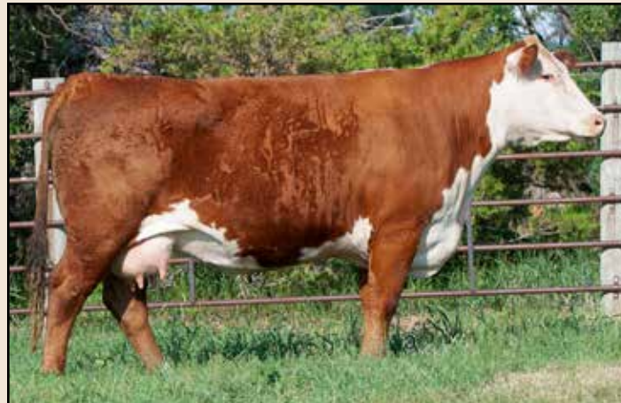
Lot 10 – HH Miss Advance 3321A ET