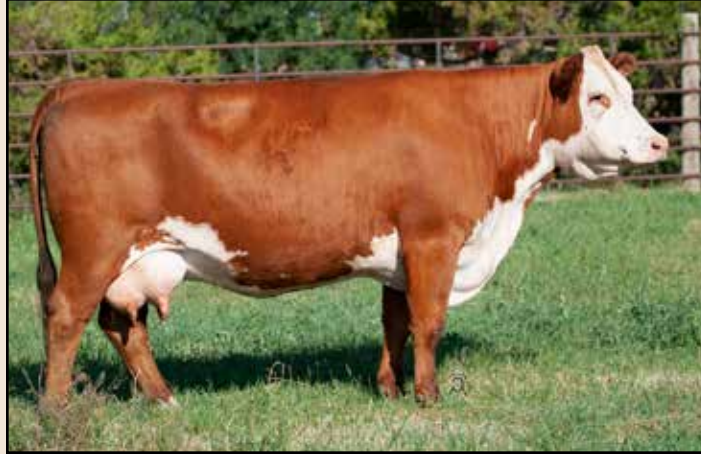
Lot 13 – HH Miss Advance 3124A