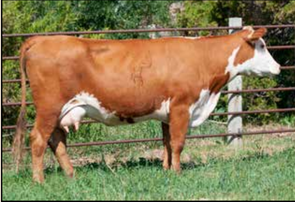
Lot 26 – HH Miss Advance 6130D