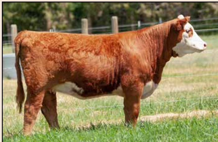
Lot 78 – HH Miss Advance 8348F