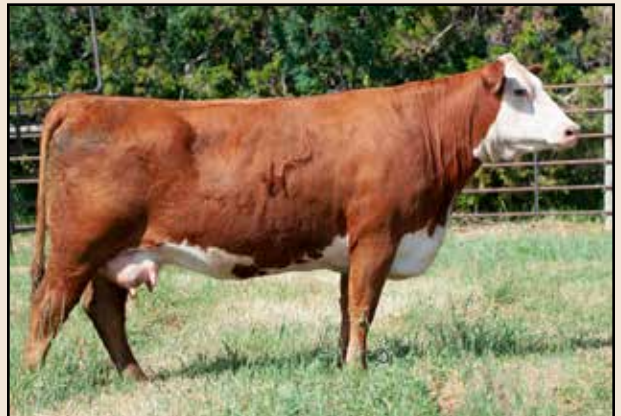
Lot 24 – HH Miss Advance 6041D