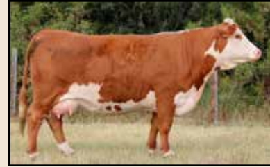
Montana Miss 753T – Dam of Lots 7 and 8