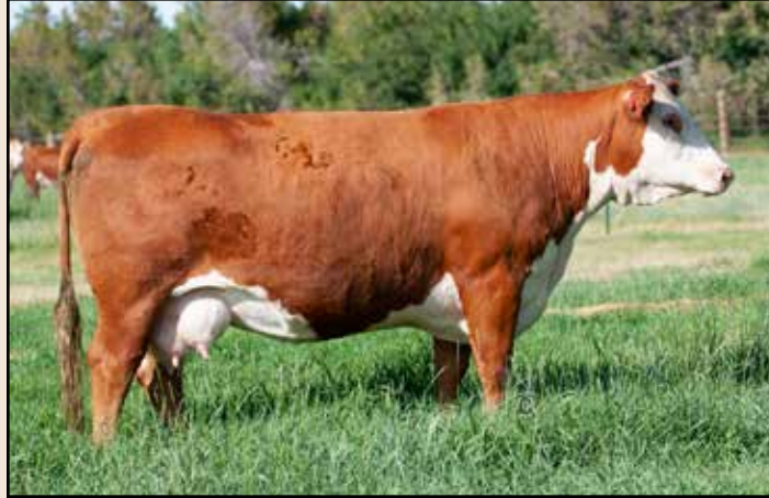
Lot 15 – HH Miss Advance 3151A