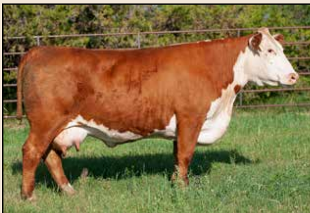
Lot 22 – HH Miss Advance 5184C ET