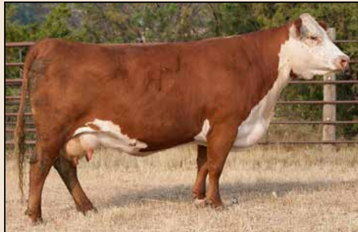
Lot 4 – HH Miss Advance 3080A ET