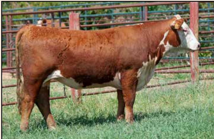
Lot 62 – HH Miss Advance 8031F ET