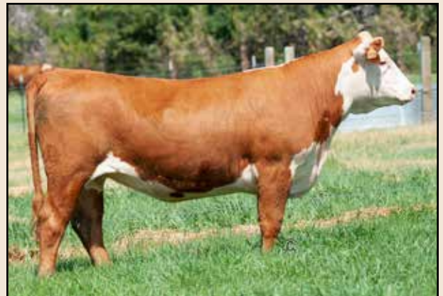
Lot 73 – HH Miss Advance 8295F ET