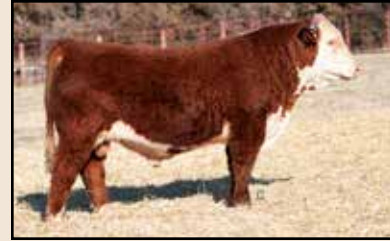
HH Advance 8120F – Son of Lot 9