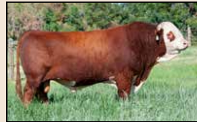
HH Advance 5018C ET – Maternal brother of Lots 7 and 8