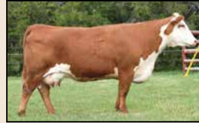
HH Miss Advance 5139R ET – Grandam of Lot 1 and dam of Lot 2