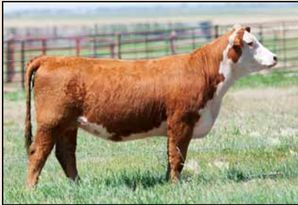
Lot 76 – HH Miss Advance 8336F