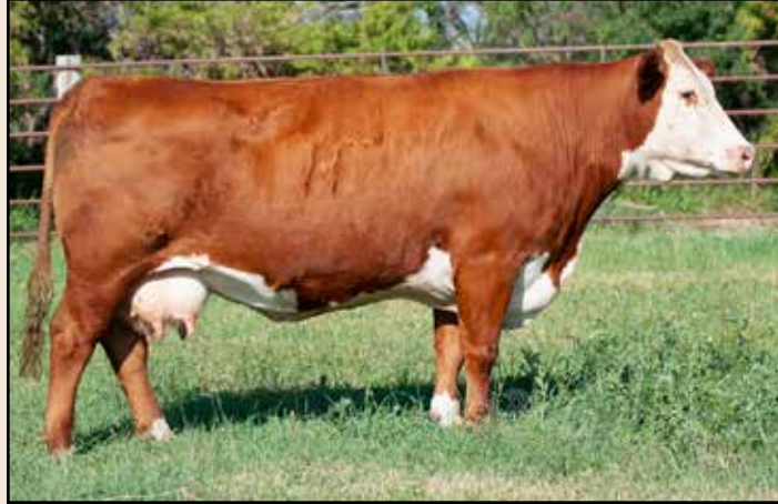
Lot 5 – HH Miss Advance 3037A ET