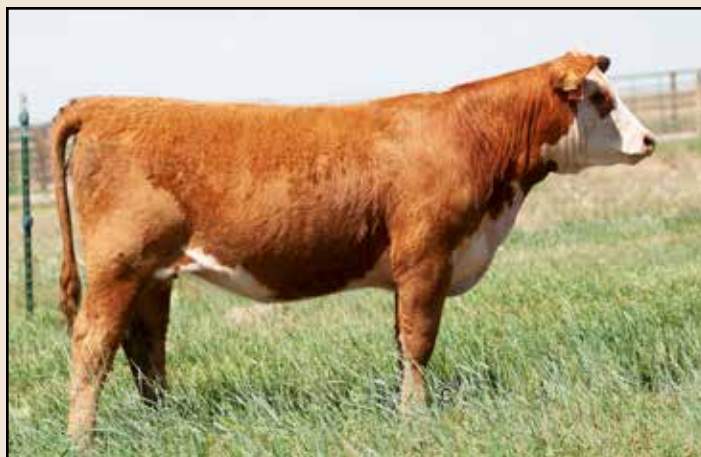
Lot 79 – HH Miss Advance 8358F