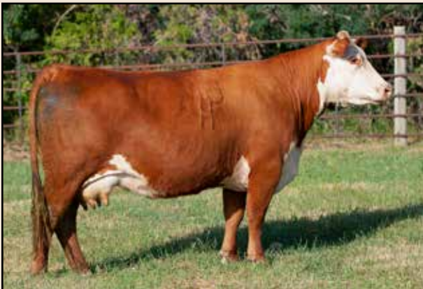
Lot 28 – HH Miss Advance 6165D