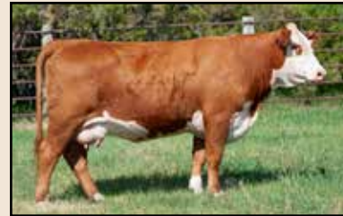
HH Miss Advance 7231E – Daughter of Lot 11