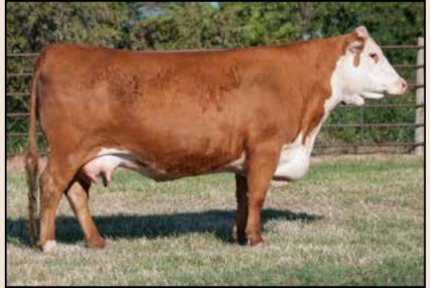
HH Miss Advance 1072Y – Dam of Lot 23