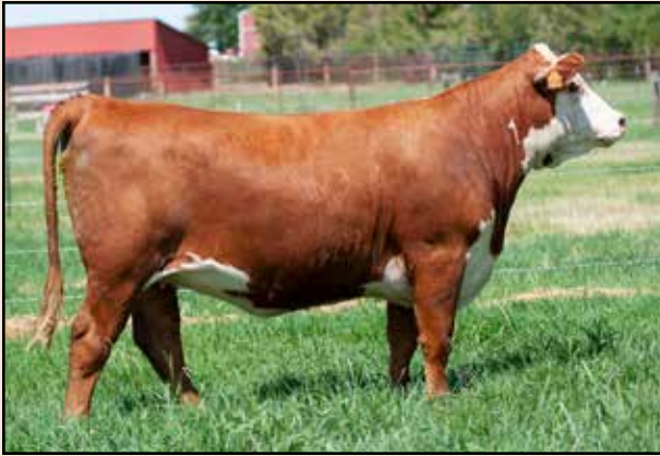
Lot 66 – HH Miss Advance 8176F