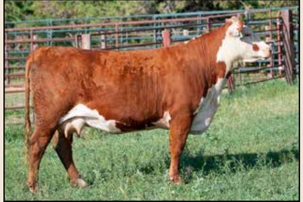
Lot 29 – HH Miss Advance 7092E