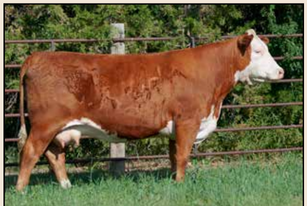
Lot 25 – HH Miss Advance 6060D ET