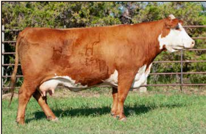
Lot 8 – HH Miss Advance 3294A ET