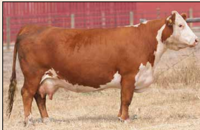
Lot 12 – HH Miss Advance 2182Z