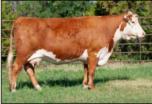
Lot 20 – HH Miss Advance 5062C ET