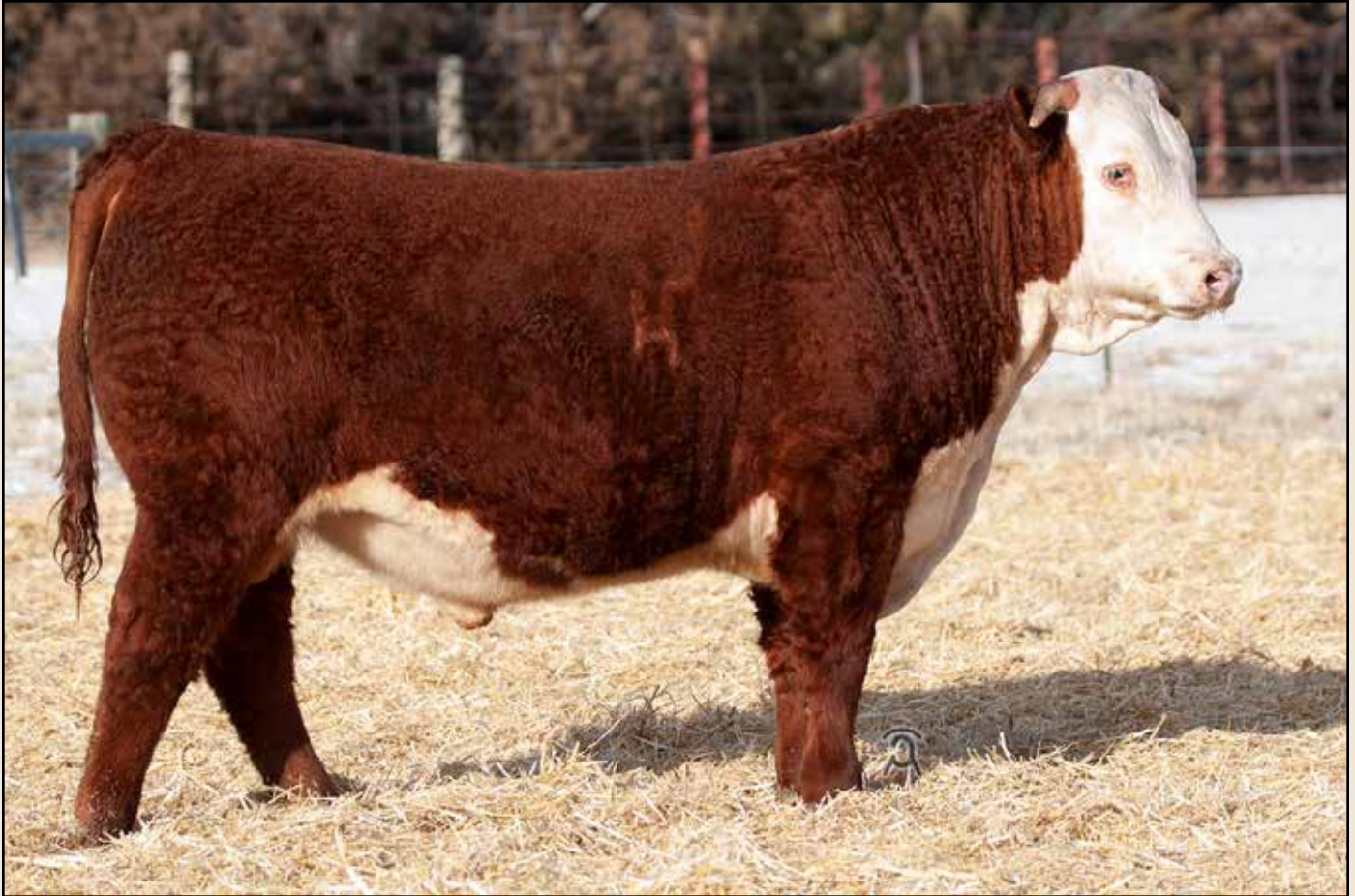
Lot 86 – HH Advance 8132F

H ere is an opportunity to be one of the first breeders to use our new junior herd sire, HH Advance 8132F. This unique young sire combines big time, curve bending EPDs that rank him in the top 3% of the breed on CED, BW, SC, Milk, M&G and MARB and the top 10% on CHB$. He also has a flawless phenotype with a huge hip, big top, full pigment and he is fancy fronted. He is unmatched by any other horned bull with GE_EPDs for his combination OF CED, BW, YW, REA, MARB, and CHB$.