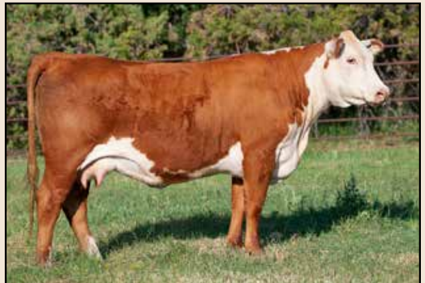
Lot 31 – HH Miss Advance 7240E