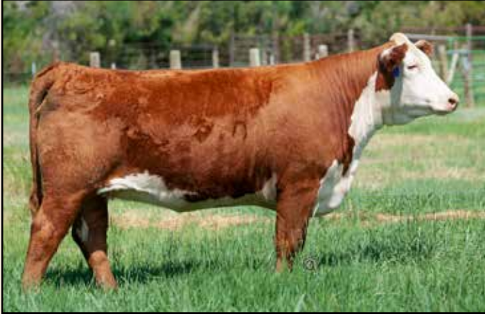
Lot 61 – HH Miss Advance 8025F