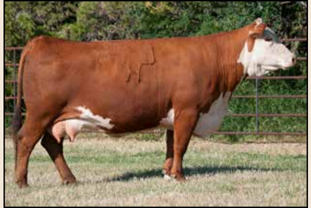
Lot 17 – HH Miss Advance 1023Y ET