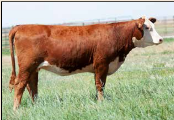
Lot 77 – HH Miss Advance 8338F