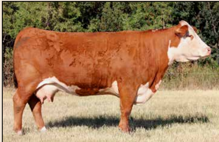
HH Miss Advance 6155S – Dam of Lot 16