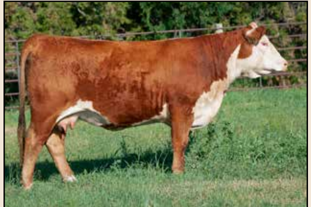
Lot 30 – HH Miss Advance 7115E ET