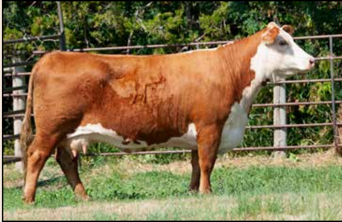
Lot 7 – HH Miss Advance 3279A ET