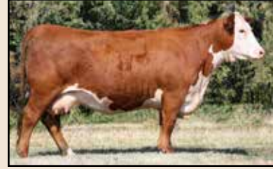
HH Miss Advance 1126Y – Dam of Lot 3