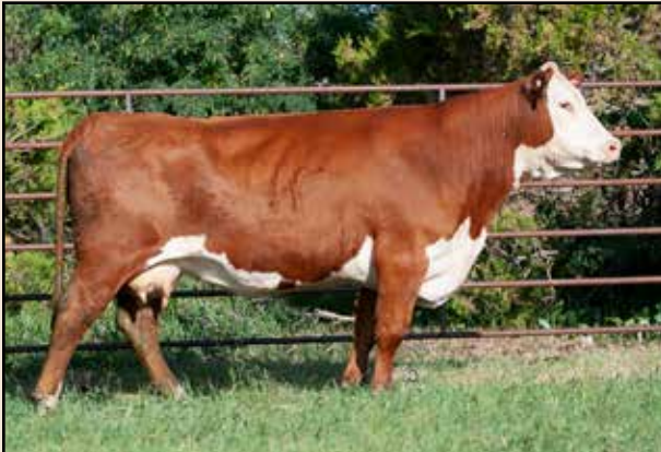
Lot 27 – HH Miss Advance 6146D ET