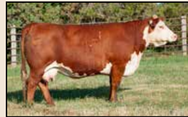
HH Miss Advance 0121X – Dam of Lot 30 and Lot 62