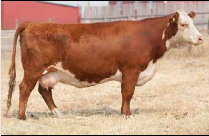
Lot 9 – HH Miss Advance 2178Z