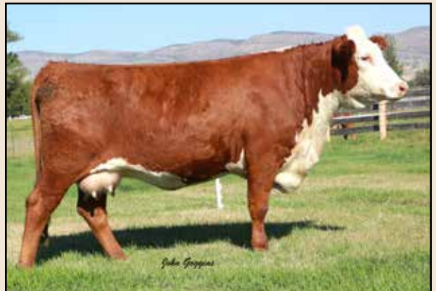
Lot 19 – CL1 Dominette 148Y