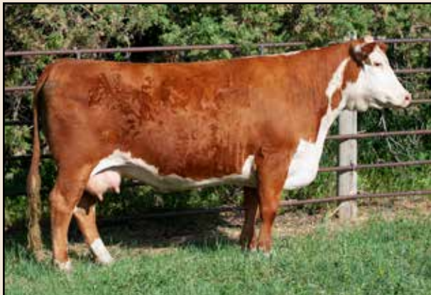
Lot 21 – HH Miss Advance 5104C ET