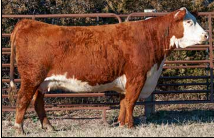
Lot 3 – HH Miss Advance 3058A