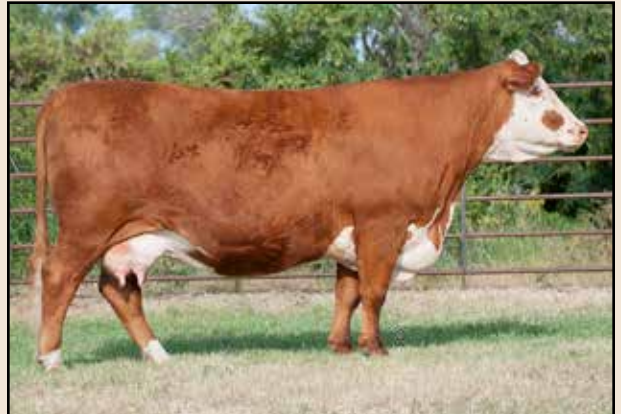
Lot 18 – HH Miss Advance 1188Y