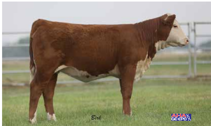
Lot 18A — TDP J11 54J

18 TDP NJB JEWEL 239D {DLF,HYF,IEF,MSUDF,MDF} COW P43755853 Calved: 9/30/16 Tattoo: RE TDP/LE 239D