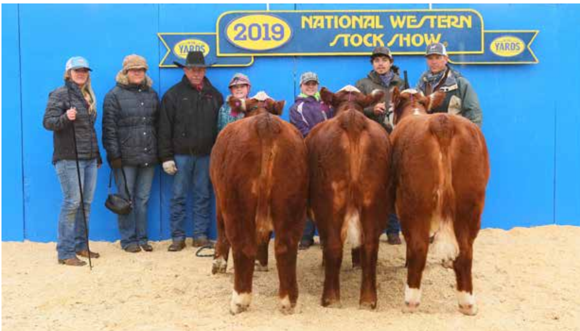
Senior Heifer Calf Champion — Pen of 3 / Denver 2019 - All Cowboss Daughters