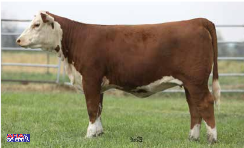
Lot 35 — Mohican Rita 227H