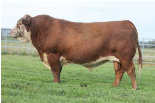
NJW 76S 27A Salute 201C — Featured Sire