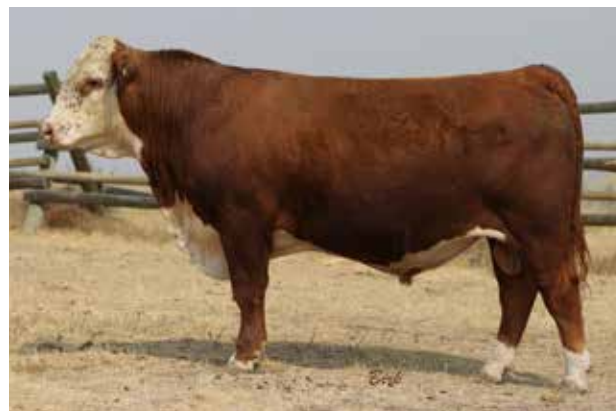
MC DH25 132E Whitmore 2030 ET — Reference Sire