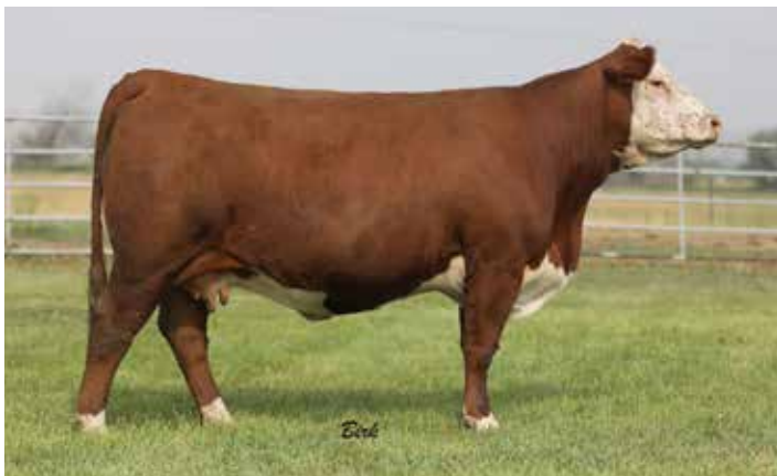
Lot 22 — TDP Lady Sport 203F