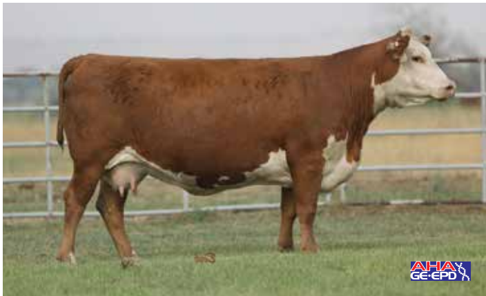
Lot 21 — Mohican Kandee 35E