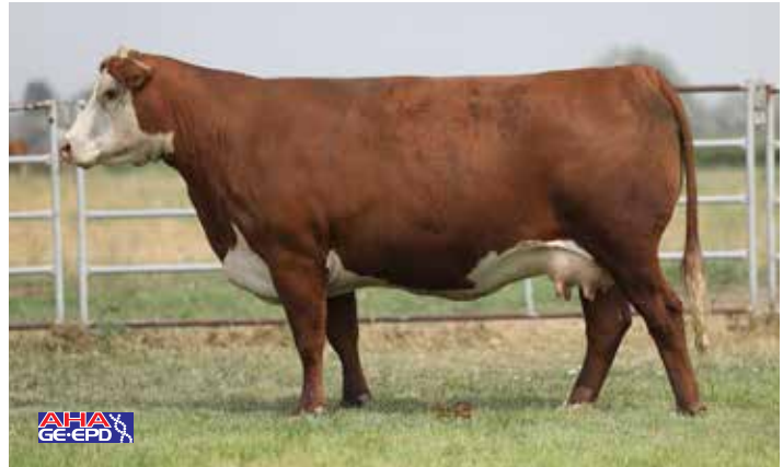
Lot 25 — Mohican Unforgettable 32E