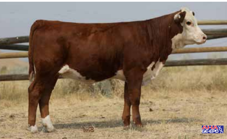
Lot 39 — MC 508 8Y Classy Lady 2147 ET