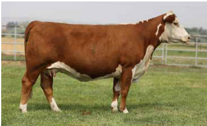
Lot 23 — BW Miss Knox 9E