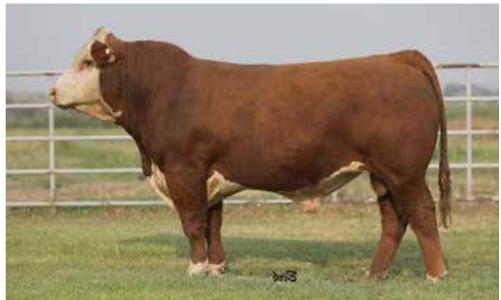
NJB 132E 714 Big Ben 928 — Reference Sire