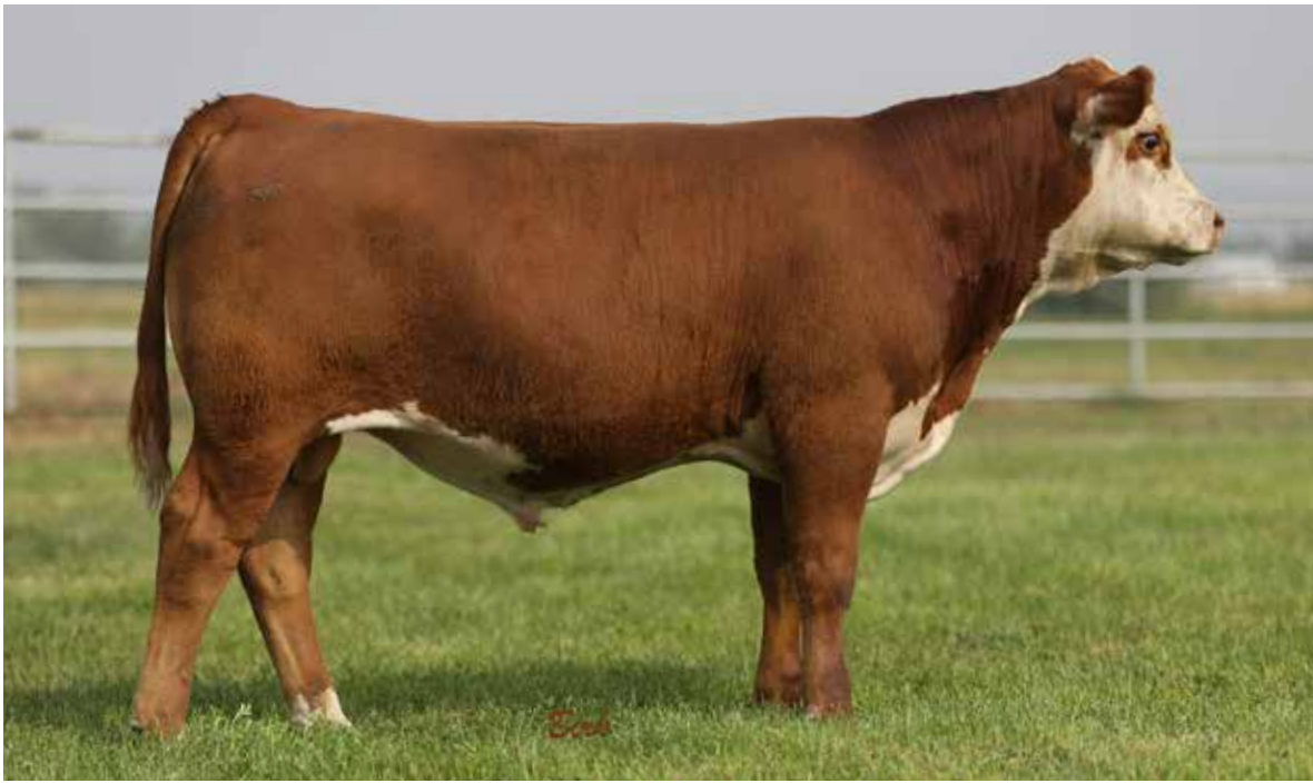
Lot 8A — Mohican 4013 23J