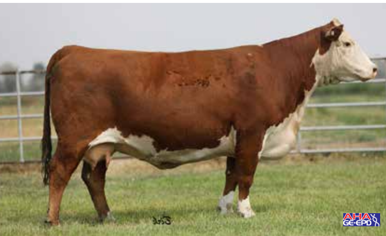
Lot 18 — TDP MJB Jewel 239D