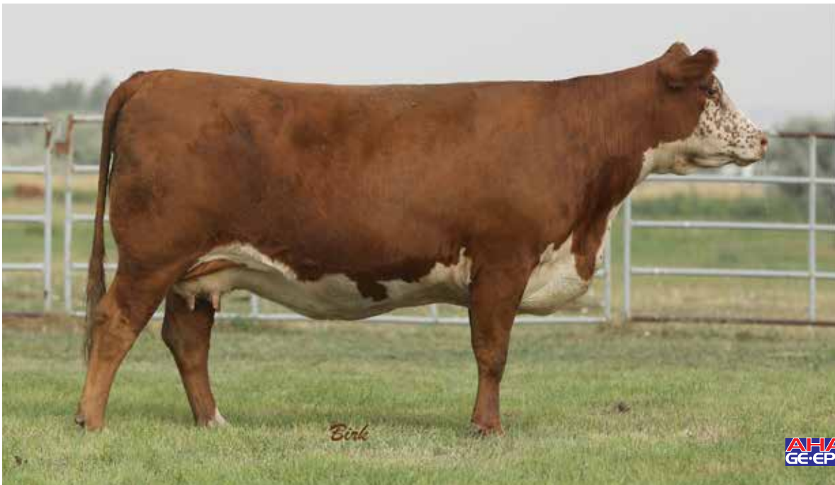
Lot 6 — Mohican Mattie 16E