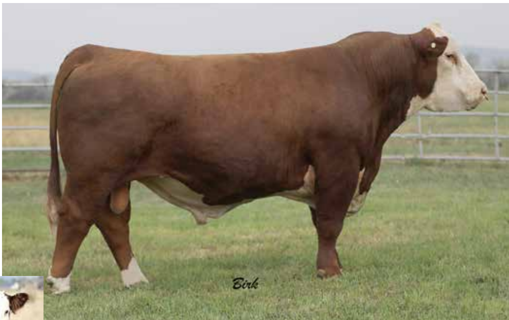
DM All Around 904G — Sire of Lots 18A and 19A