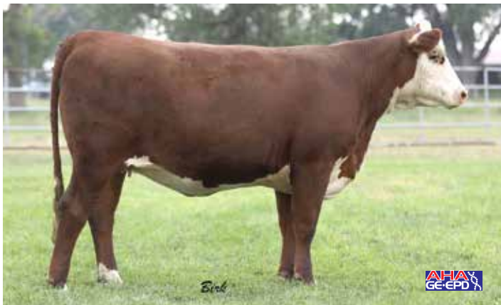
Lot 30 — Mohican Excell 77H