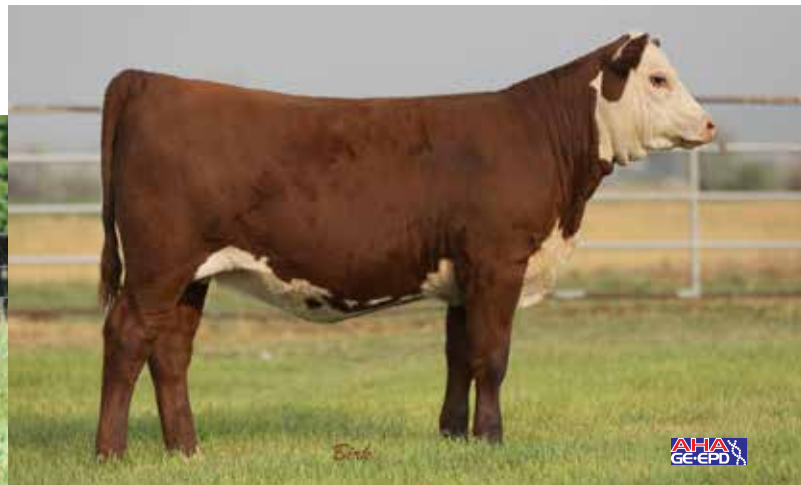
Lot 34 — Mohican Lana 53J ET