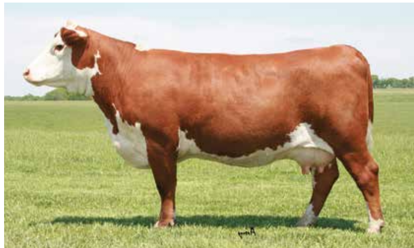
RHF 8Y Rose Garden 4067B ET