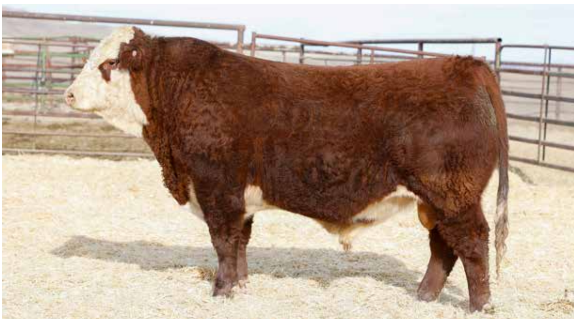
DCR 199B Cow Boss 9244 — $10,000 Full Brother in Blood to Lot 51