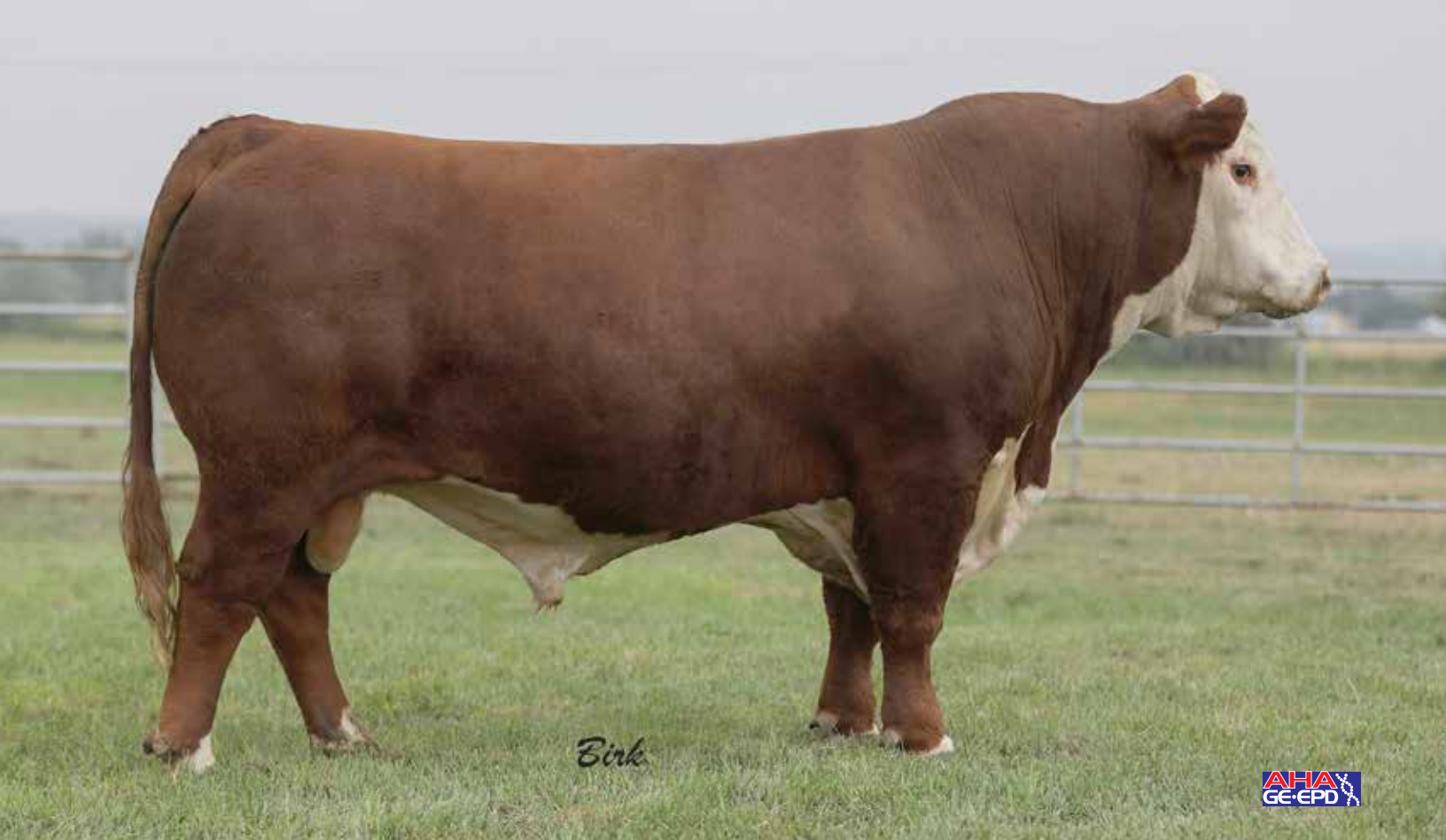
Lot 1 — Mohican Sure Fire 76G