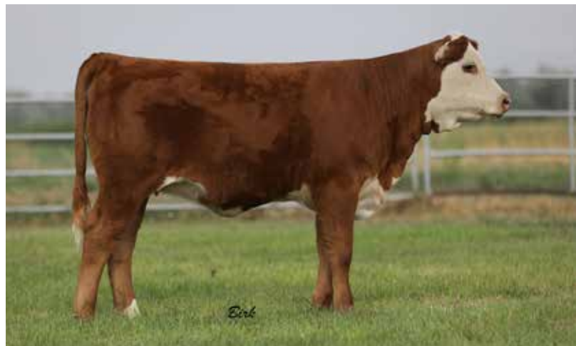
Lot 10A — TDP Heidi 90J