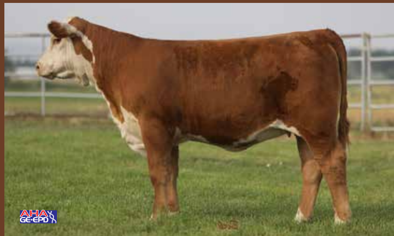
Lot 3A — Mohican Daisy 83J