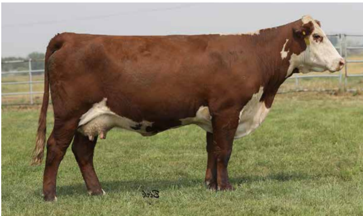
Lot 16 — WSF Lady Heartbeat F139