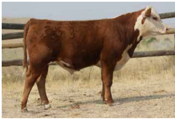
Lot 42A — MC 1926 1644 Outcross 2167