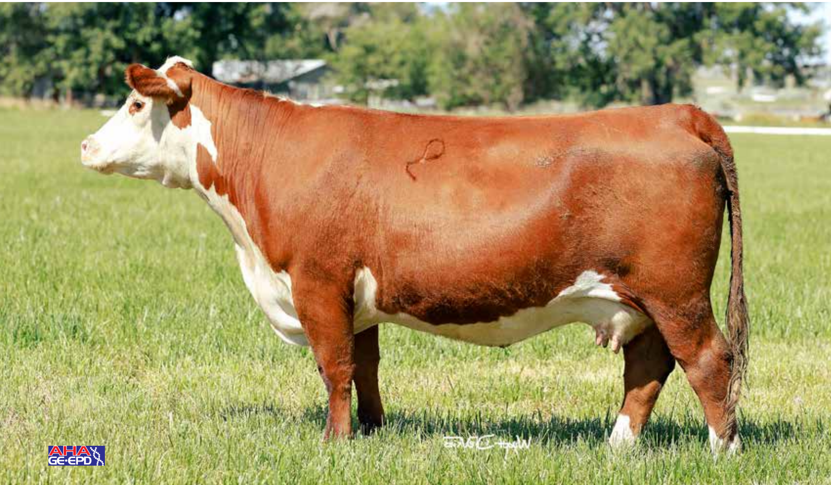
Lot 48 — DCR 199B Standard Lady 7625