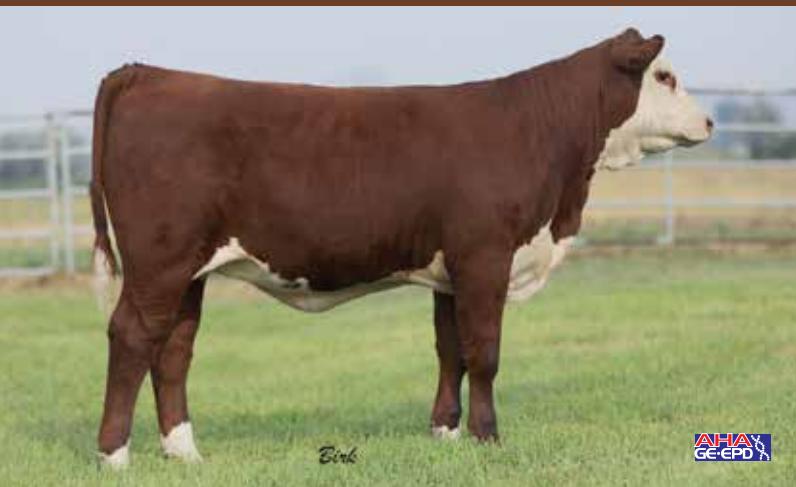
Lot 33 — Mohican Lana 55J ET