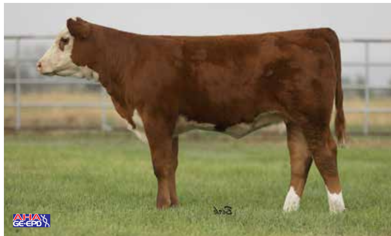
Lot 7A — TDP Lady 91J