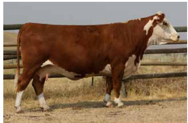
Mohican Irene 436B — Dam of Lot 37