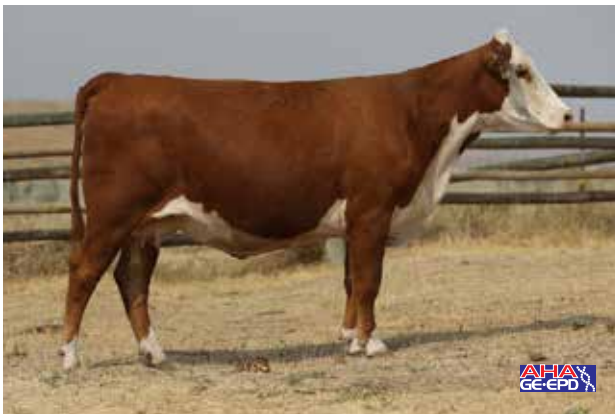
Lot 43 — MC 1754 1753 First Class 1956