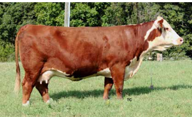
DR Lady of Class 10H S08 — Dam of Lot 39