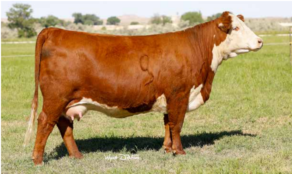
Lot 45 — DCR 376 Ella 9205 ET

45 DCR 376 ELLA 9205 ET {DLF,HYF,IEF,MSUDF} COW P44180171 Calved: 3/27/19 Tattoo: LE 9205