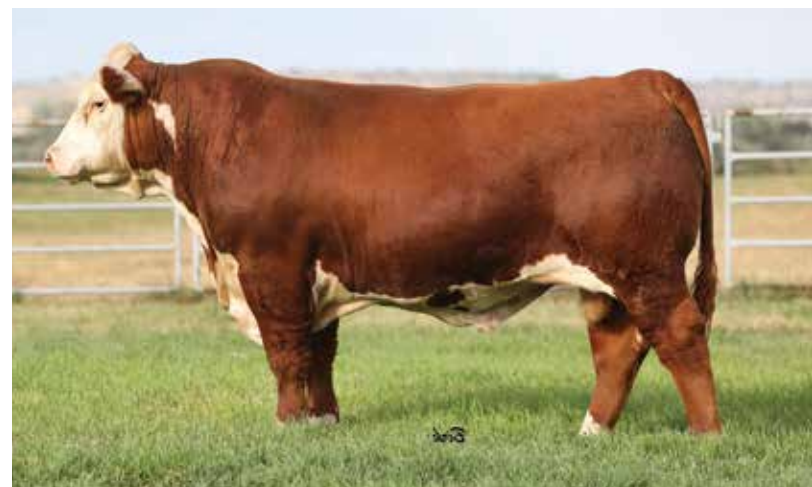
Mohican Playbook 4G — Son of Lot 3, Herd sire for Clifford Farm in Kentucky