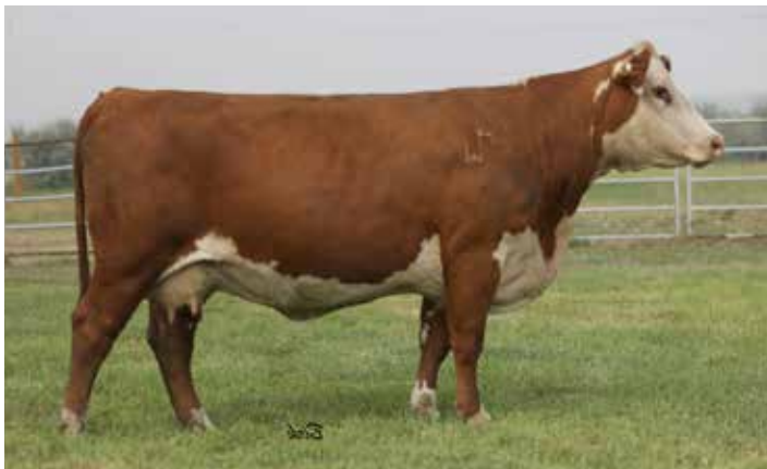
Lot 20 — ESF C235 17Y RyAnne