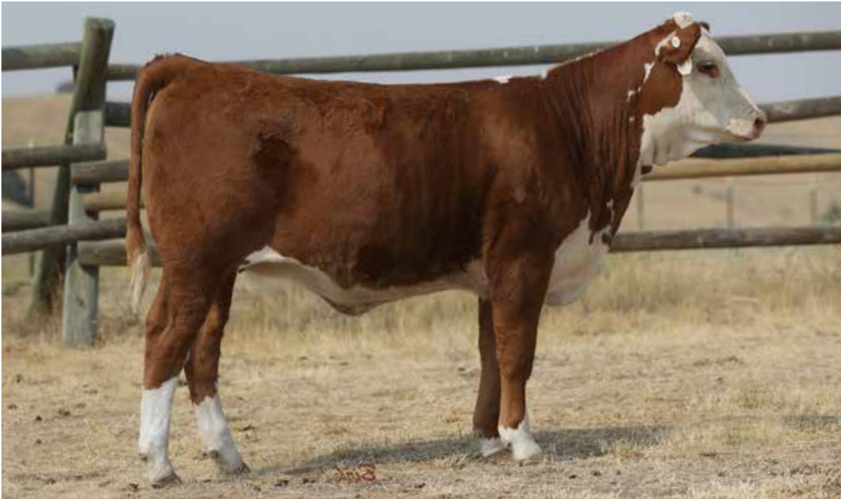
Lot 37 — MC 4363 308F Irene 2109