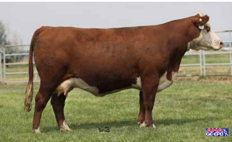
Lot 10 — TDP Heidi 97E