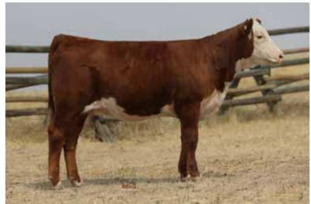
Lot 43A — MC 1956 1826 Gloria 2112