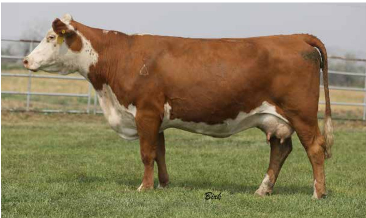
Lot 15 — WSF Jackie E132