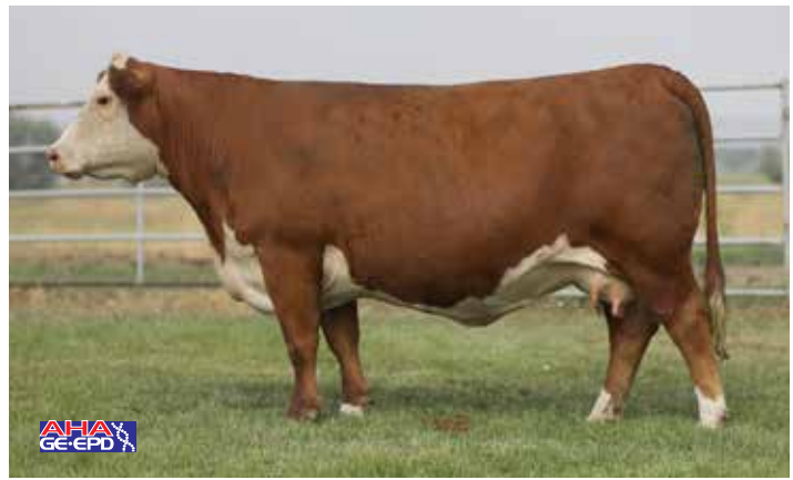
Lot 24 — ASM 705 Miss Caroline 736E ET