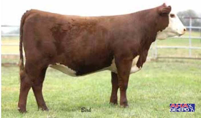
Lot 29 — Mohican TDP Tara 135H