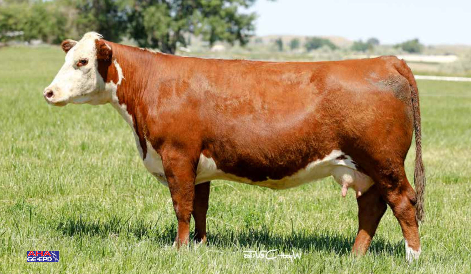
Lot 47 — DCR 199B Leslie 7064