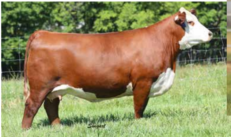
TH 329 358C Lana 76E — Dam of Lots 33 and 34