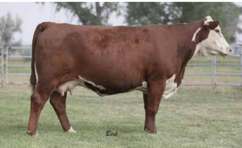
Churchill Lady 7220E — Dam of Lot 1