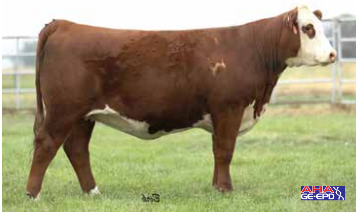
Lot 27 — Mohican TDP Madison 128H ET