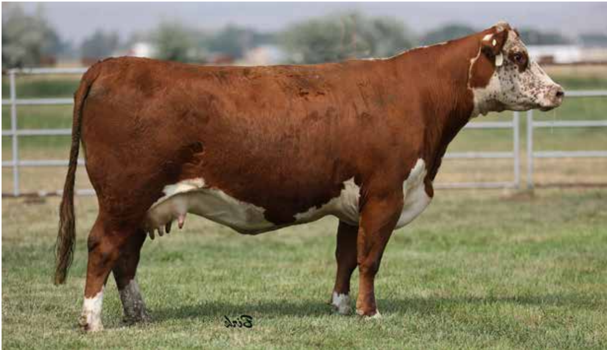
Lot 8 — Mohican Pet 217E