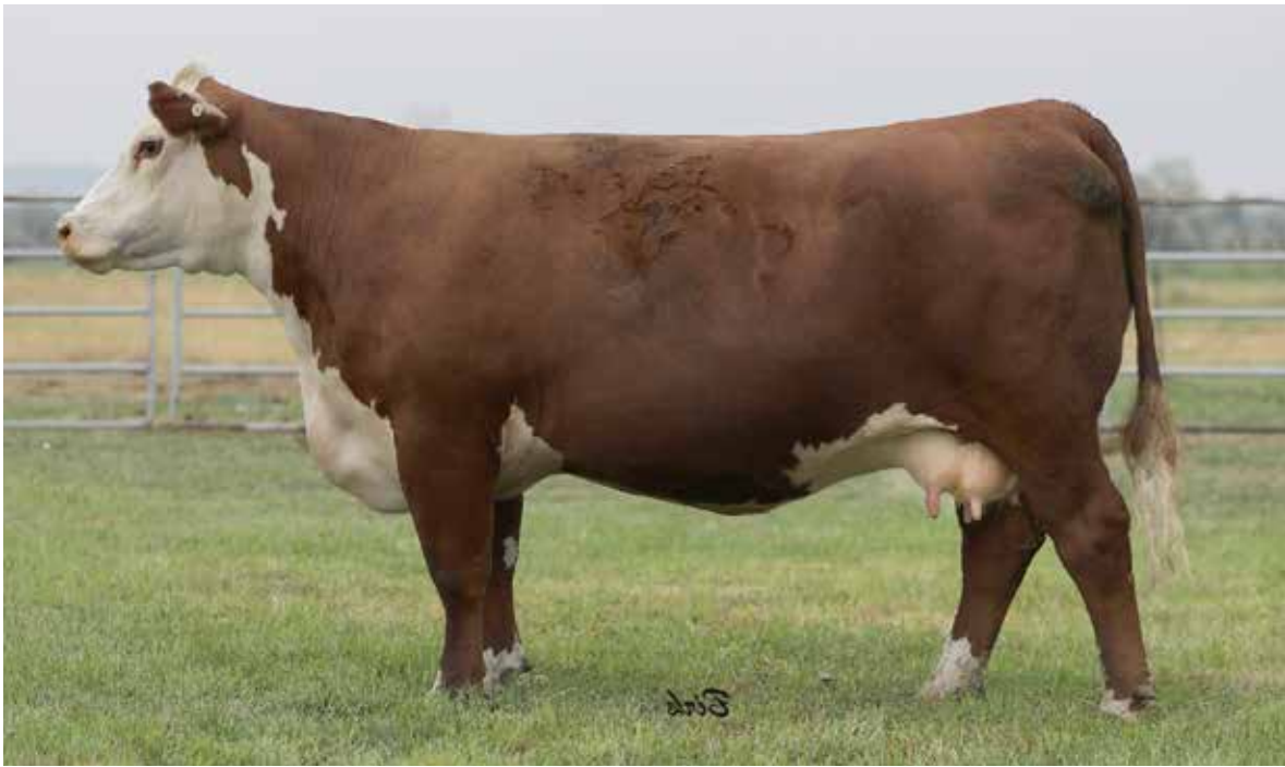
Boyd 31Z Rita 7117 ET — Dam of Lots 35 and 36