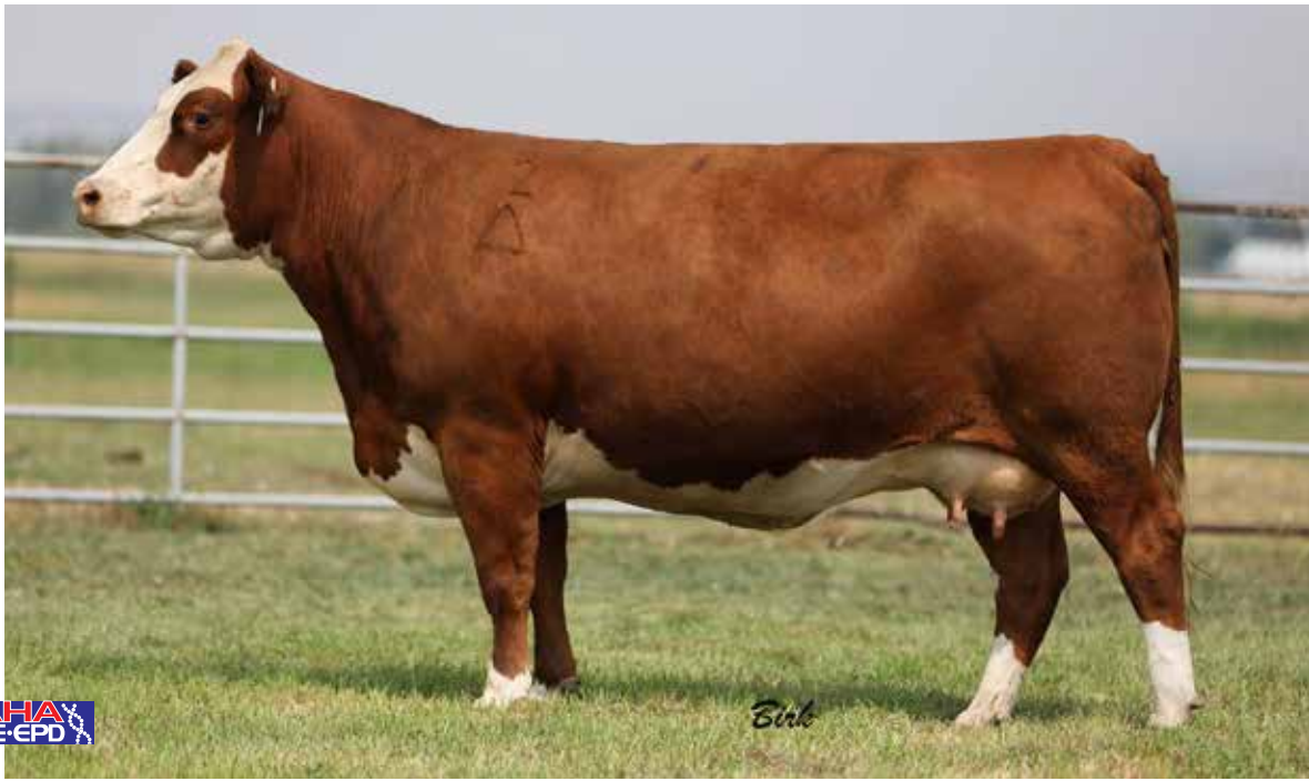
Lot 7 — TDP Lady 230E