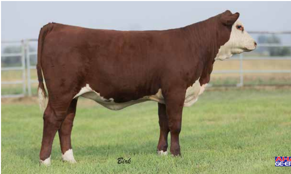
Lot 33 — Mohican Lana 55J ET