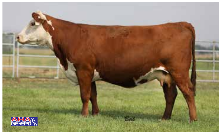
Lot 26 — Mohican Plus 84E