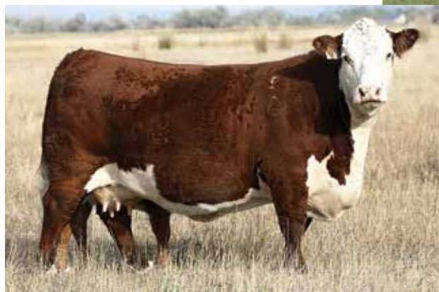
BAR-JM Windy K Victoria 11B — Dam of Lot 18