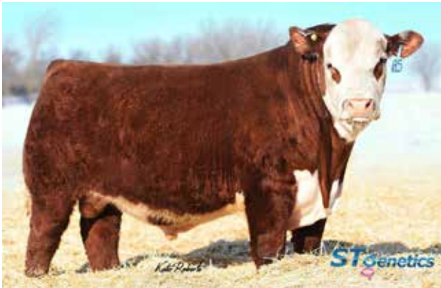
TH Masterplan 183F — Sire of Lots 32 and 36