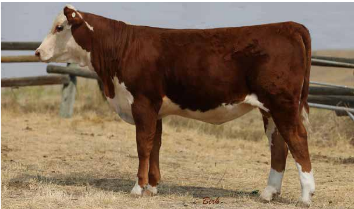
Lot 44A — MC 1765 1927 Nelle 2151