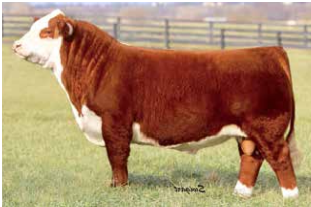
Boyd 31Z Blueprint 6153