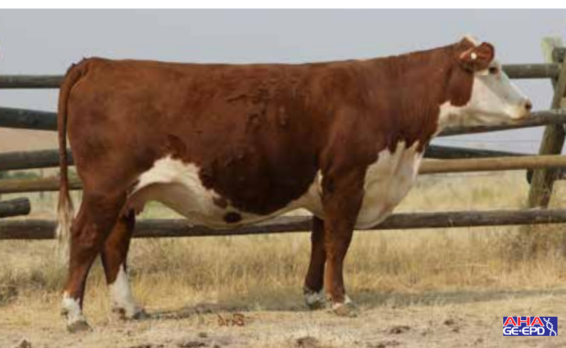
Lot 40 — MC 1A 331 Resource 1843 ET