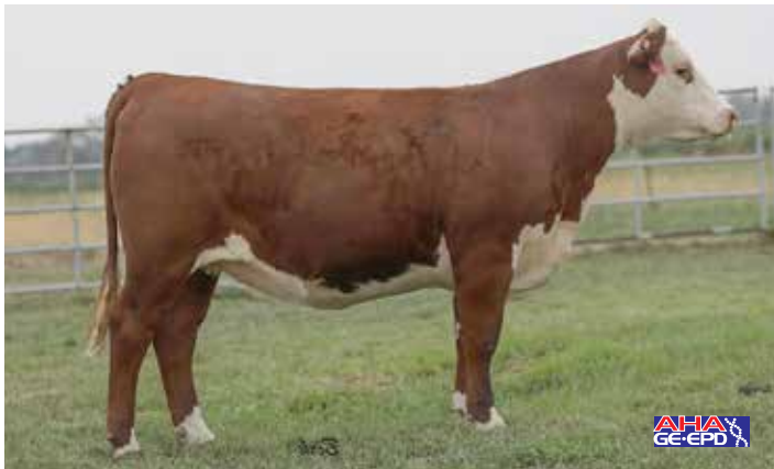
Lot 28 — Mohican TDP Madison 126H ET