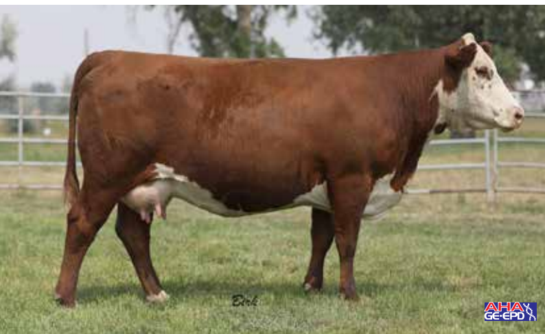
Lot 11 — Mohican Tracy 103E