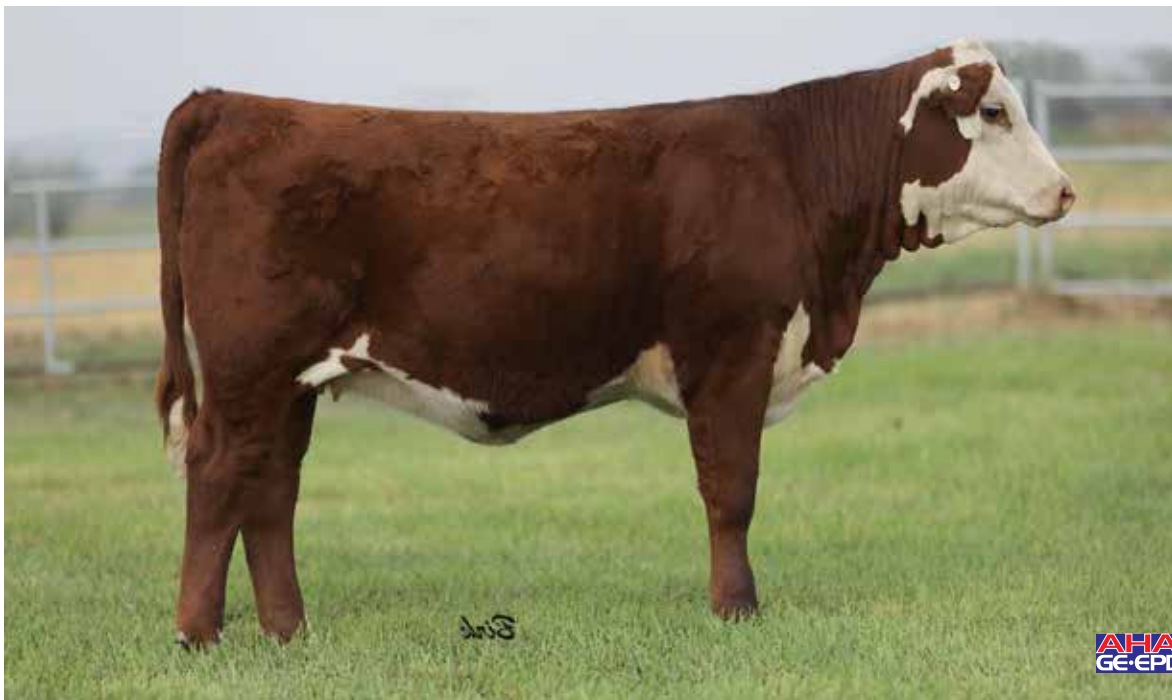
Lot 16A — Mohican Heartbeat 76J