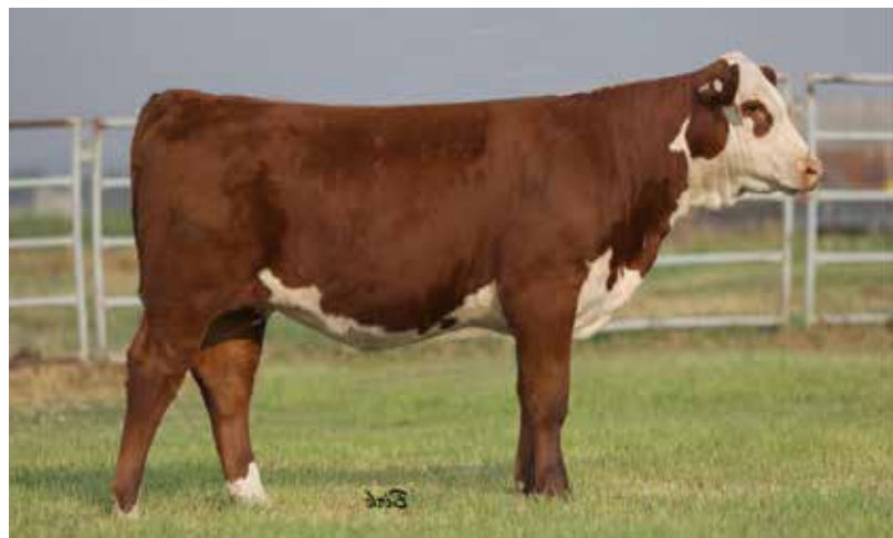
Lot 11A — Mohican 77J