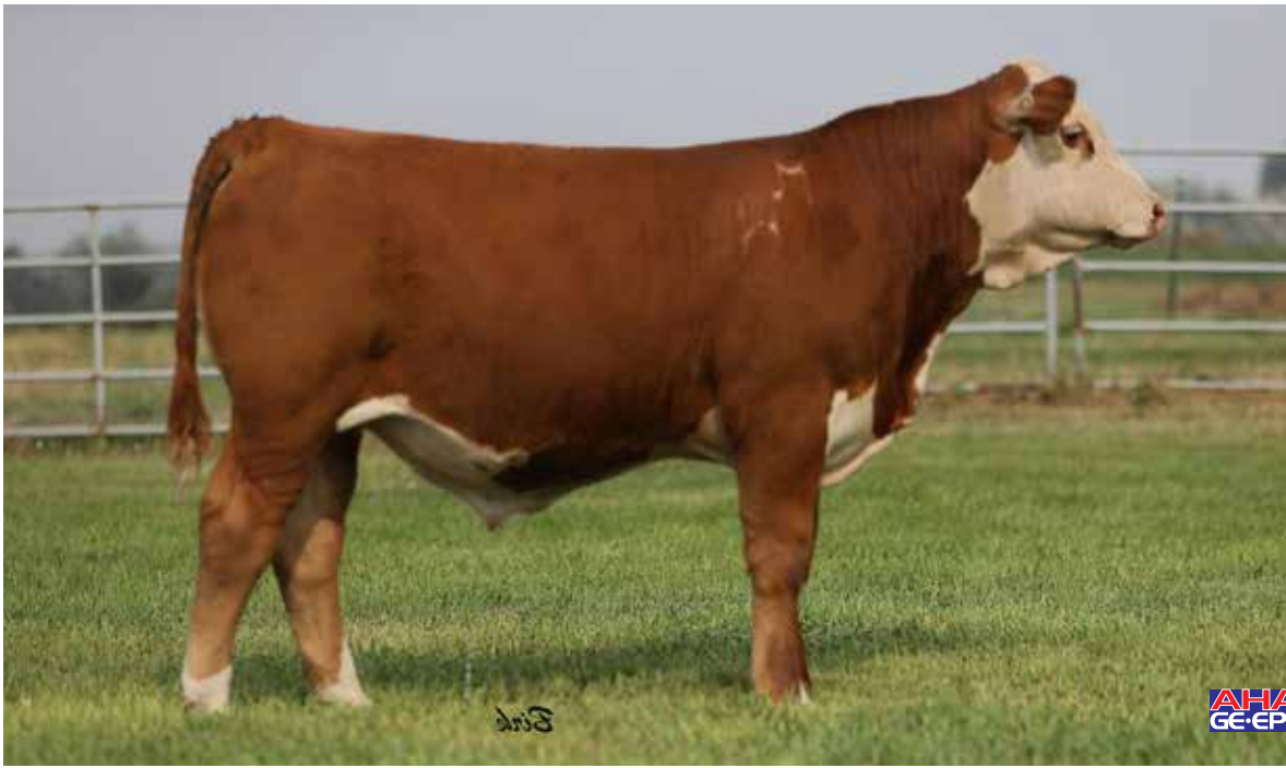
Lot 6A — Mohican 4013 43J