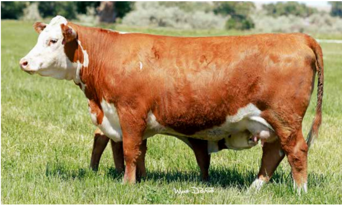
Lot 53 — DCR 7167 Diana 9230 ET