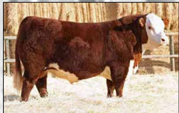
Heifer bull prospect out of Hometown. This bull is a little more up headed.

DAM: THM DURANGO 4037 CKP 4037 JEWEL 2047 HERITAGE 107N 69N JEWEL 114R