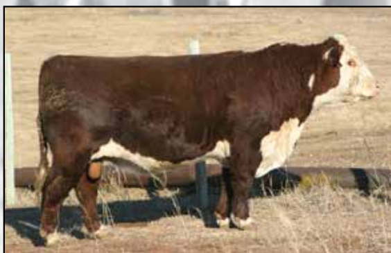
Another 41 X son showing the consistency of his sire. He has calving ease and good maternal.