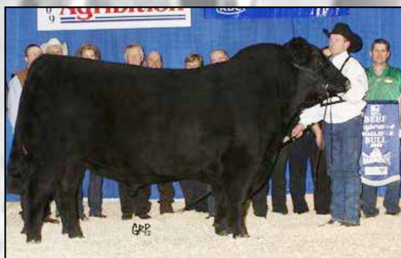
Will be one of the high performance bulls. Tiger sons will add bone and sturctural to the black bulls.

SIRE: HF TIGER 273X HF TIGER 5T HF QUEEN 1078 DAM: LAFLINS FREE BIRD 9875 LAFLINS KATMANDU 387 GUYS FREE BIRD