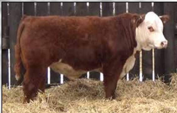
Thick. This Ringer son is thick. He is structurally correct with good pigmentation.