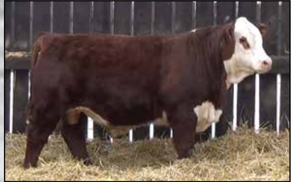
This is a really deep bodied goggle eyed masterpiece son. These Masterpiece sons have tons of depth and guts. He is a dark red Heifer bull.

DAM: H 8E EMBRACER 8006 WILL VIA VICKI 8006 R-1 WILL-VIA MS 698 K-59