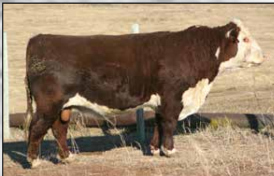
This Regulator son has a super front end on him. He is another big stout performance bull with lots of growth and pounds on him.