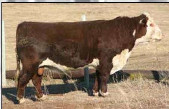
A Regulator son that shows the consistency of his sire. This bull is well made and shows excellent structure and muscling.