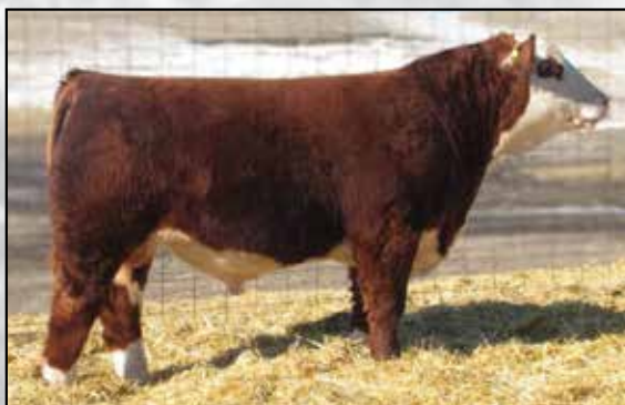
This long spined Goggle eyed son of Ringer has a tremendous profile. He is a little up headed.