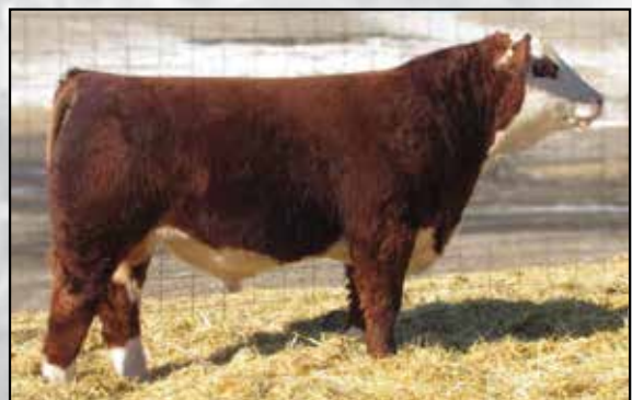
Denver bull. Probably the best Ringer son. His dam is out of the Mirada cow family. This bull certainly carries lots of style and length to him.

DAM: SB 122L GIT-R-DONE 19R ET CKP MIRADA 0989 ET SB 62J MIRADA 61N ET