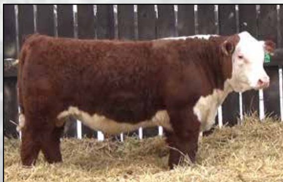
There is a lot of middle and depth to this Helton Son. These Heltons are a soggy bunch. Notice the power of them as a group.