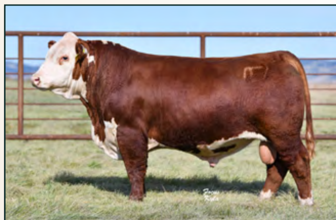
LOT 116 • PYRAMID HOMEGROWN 8163