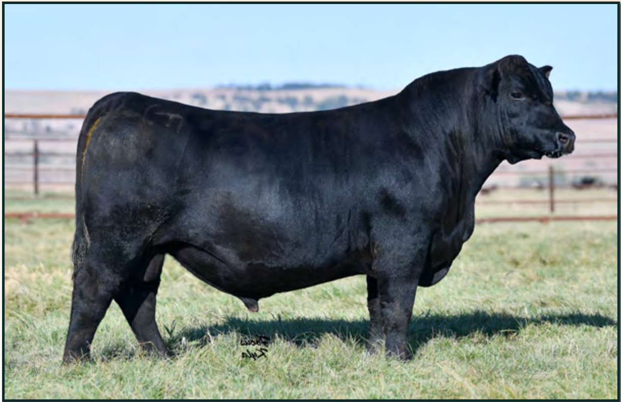
LOT 48 • PYRAMID STEADFAST 8057