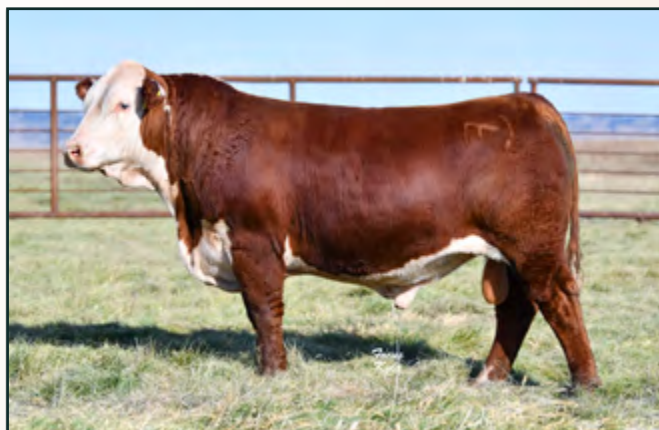
LOT 118 • PYRAMID HOMEGROWN 8173