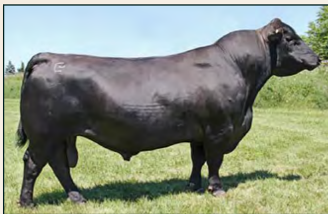
BALDRIDGE COMMAND C036 • SIRE OF LOTS 23-33

Suitable for use on heifers Bull was used for natural service