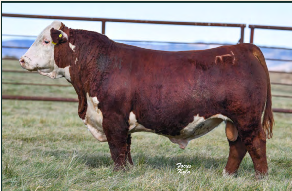
LOT 117 • PYRAMID HOMEGROWN 8166