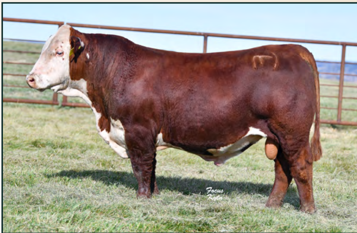
LOT 90 • PYRAMID PERFECTO 8172