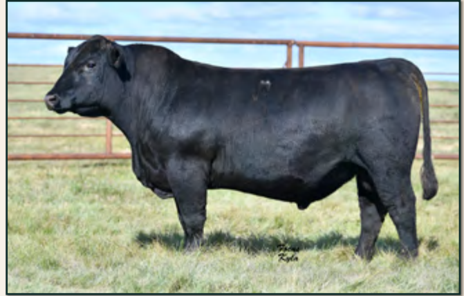
LOT 22 • PYRAMID PACKER 8246