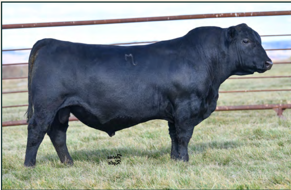
LOT 14 • PYRAMID PACKER 8220