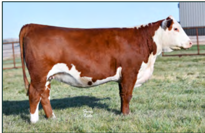
LOT 143 • FHF 632D VICTRA 19F ET