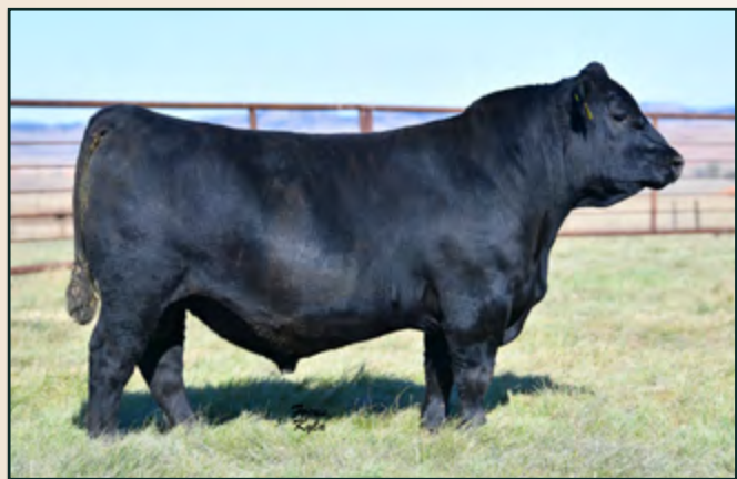
LOT 26 • PYRAMID COMMAND 8061

26 PYRAMID COMMAND 8061 Reg. 19246408 Tattoo: 8061 Calved: 03/12/18 EF COMMANDO 1366 BALDRIDGE COMMAND C036 BALDRIDGE BLACKBIRD A030 CONNEALY HUSKER 1833 GLACIAL 1883 BLKBIRD EVE 61A GLACIAL 19T BLACKBIRDEVE 15W #EF COMPLEMENT 8088 RIVERBEND YOUNG LUCY W1470 #HOOVER DAM BALDRIDGE BLACKBIRD X89 #CONNEALY THUNDER PEARLA OF CONANGA 8538 GLACIAL TOTAL 19T GLACIAL 6P BLACKBIRD EVE 13S