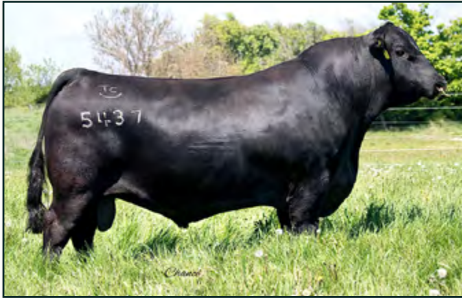
REFERENCE SIRE E • TEX PLAYBOOK 5437

Resource continues to be a major part of this program. There are over 15 sons and grandsons selling again this year. Resource is a uniquely powerful bull in that he sires nearly unmatched performance and pay weight in an efficient and moderate framed package. The sons and grandsons are wide based, thick ended cattle that push the scale down at all measurable junctures. The young daughters are deep sided, easy fleshing cows that are nice uddered, sound footed and good tempered.