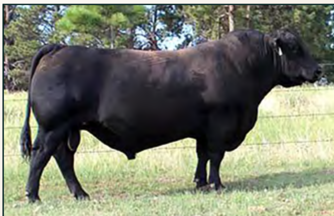
REFERENCE SIRE B • 21AR PACKER 4313