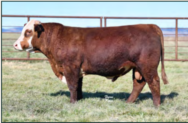
LOT 123 • PYRAMID PERFECTO 8304