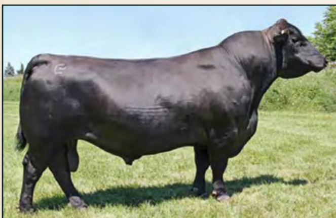
REFERENCE SIRE C • BALDRIDGE COMMAND C036

This is the second year we have offered Command sons for sale. Command is a calving ease sire that we added for his carcass merit, without sacrificing the type and kind we are striving to produce. The bulls are stout, rugged, and exhibit excellent performance for his moderate frame size. We had the pleasure of calving the first Command daughters this spring. They presented tremendous udder quality and excelled in production.