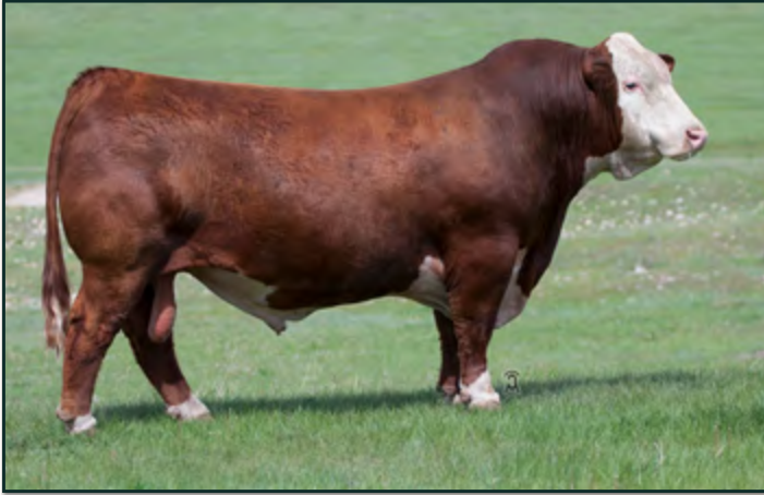
REFERENCE SIRE A • LCX PERFECTO 11B ET

on having cows with exceptional udder quality and the ability to produce adequate levels of milk. We expect our Hereford bulls to compliment our customers who run Angus based genetics and serve as a genetic option for those wanting to incorporate the many advantages of heterosis.