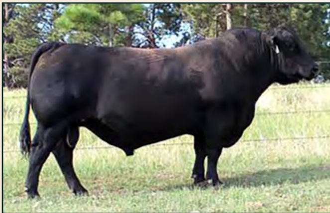
REFERENCE SIRE B • 21AR PACKER 4313

Packer is a sound, thick, long made bull that is an efficient breeder and whose progeny weigh heavy and possess good dispositions. He stems from the tremendous Estrada cow family at 21 Angus Ranch in North Dakota. His daughters have demonstrated that he should improve udder quality and hoof shape. Of the 40+ we have calved thus far, they have produced stout, heavy calves as young cows.