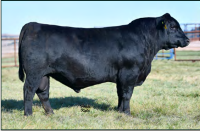
LOT 57 • PYRAMID RESOURCE 8078