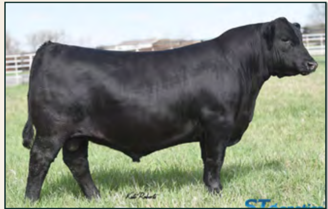
REFERENCE SIRE A • MC CUMBER STEADFAST 635

Steadfast was purchased in the spring of 2017 with ST Genetics and Koupal Angus of Dante, SD. Steadfast was added to our program due to the maternal strength behind him. Both his dam and grand-dam are Pathfinder cows at McCumber Angus, one of the premier maternal herds in the country. Steadfast is a truly unique bull in his ability to sire true calving ease without sacrificing muscle shape and performance. He sires a very consistent type and pattern. This set of Steadfast sons excel in their structure and foot quality. They are also very quiet in their demeanor. We will calve the first daughters this spring and couldn't be more pleased with how they have developed. We feel he is one of those bulls you will look back at in 5 years and wish you had more daughters. The majority of his sons selling are safe for use on heifers.