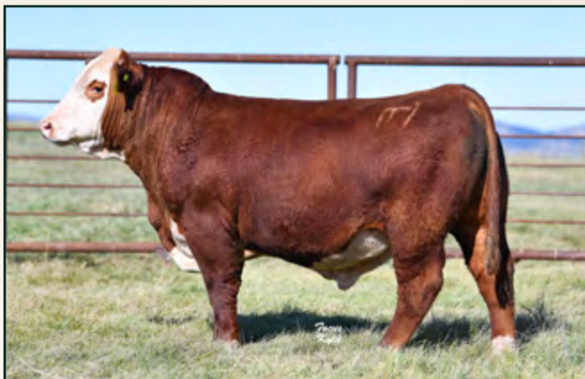
LOT 131 • PYRAMID PERFECTO 8156