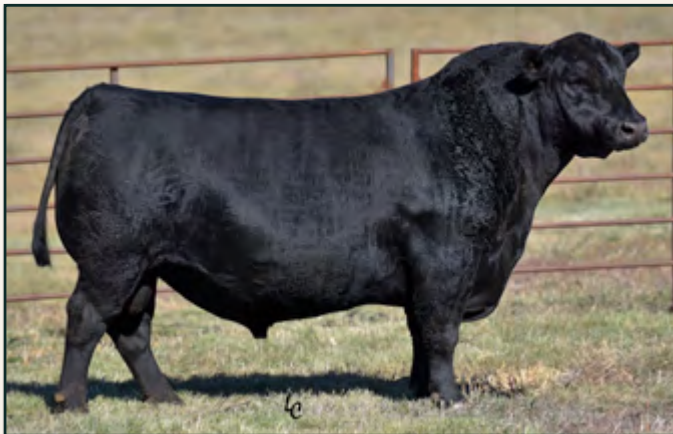
REFERENCE SIRE F • KOUPAL ADVANCE 28

Tex Playbook is the sire to the majority of yearling bulls selling in the sale. After traveling throughout the country and viewing his offspring, it was evident we wanted to bring in the influence of Basin Payweight 1682. No matter what sale catalog you looked through, those sons stood out for their depth of body and performance, while maintaining a very moderate stature. Which is just what we strive to produce. The downside was semen is in very short supply, so we decided to go with a son instead. Which ultimately lead us to Select Sires lead Payweight son, Tex Playbook. With over 50 calves on the ground this spring we are very pleased with the results. In my tenure of raising Angus cattle, I have never used a sire that transmits this kind of docility in Angus cattle. These Playbook sons act just like a Hereford!