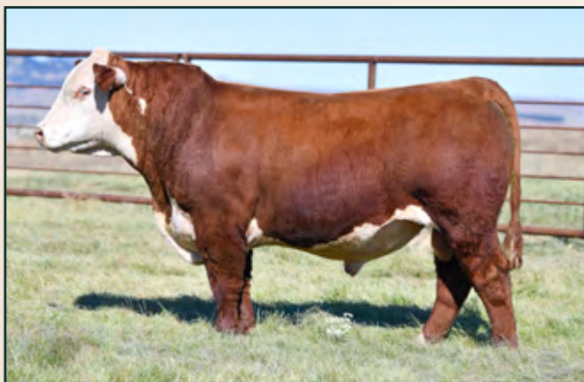
LOT 101 • PYRAMID PILGRIM 8133