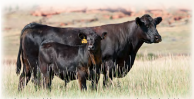
GLACIAL 0035 BLKBIRD EVE 5W • DAM OF LOTS 79-80

Lots 79-80 represent a set of flush brothers out of Glacial 0035 Blkbird Eve 5W who records progeny ratios of 111 for weaning and 113 for yearling. She is a cow that adds true performance without adding frame. If adding pounds is your objective, then look no further.