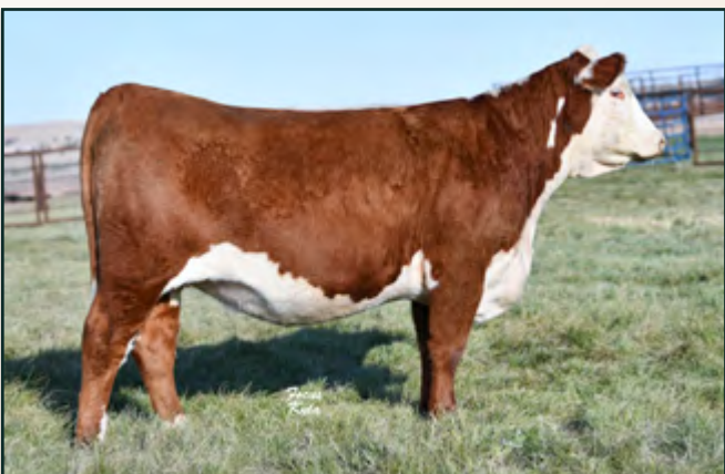
LOT 144 • FHF 632D RENAE 120F