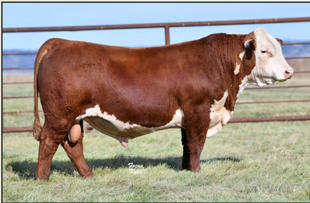
LOT 115 • PYRAMID HOMEGROWN 8130