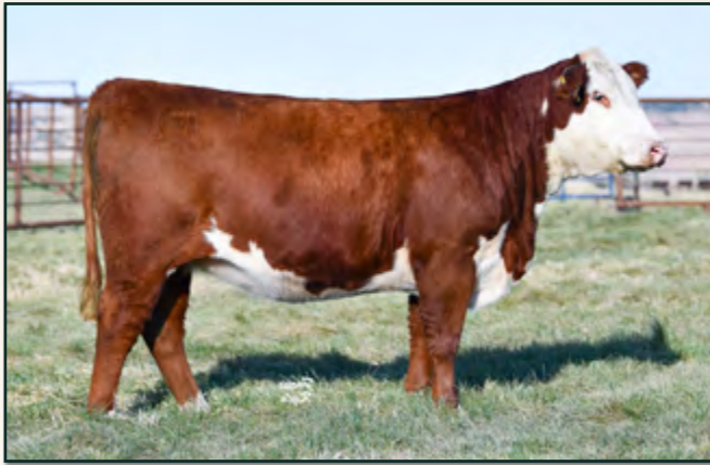
LOT 141 • FHF 11B RITA 117F