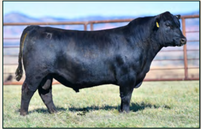
LOT 29 • PYRAMID COMMAND 8059