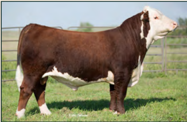
H FHF AUTHORITY 6026