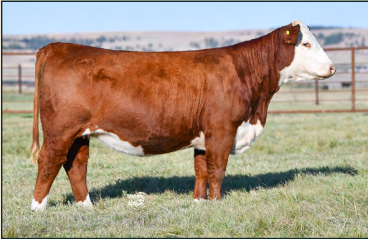
LOT 140 • FHF 11B RITA 102F