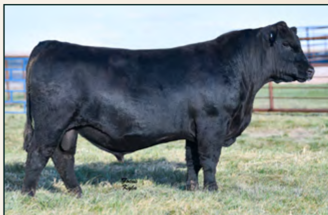
LOT 15 • PYRAMID PACKER 8202