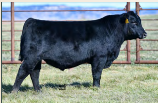
LOT 71 • PYRAMID PLAYBOOK 9014