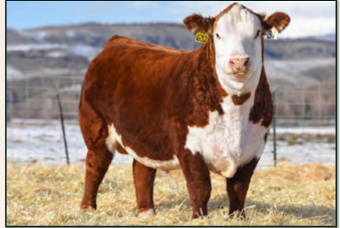
REFERENCE SIRE B • CHURCHILL PILGRIM 632D ET