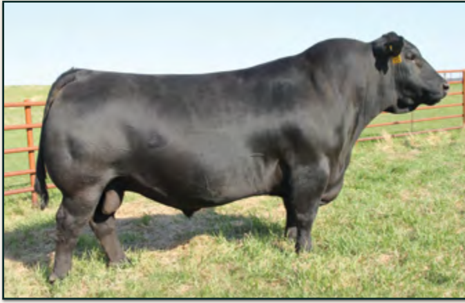
REFERENCE SIRE D • SAV RESOURCE 1441