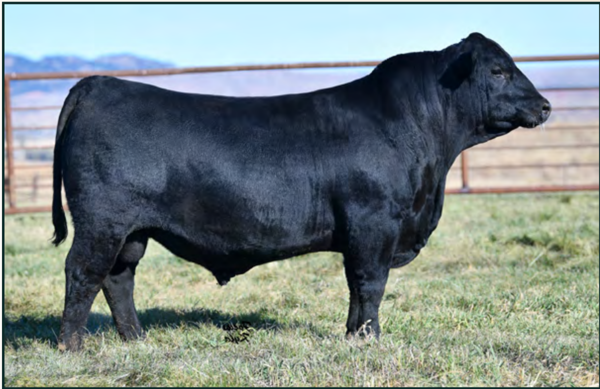
LOT 59 • PYRAMID ADVANCE 8203