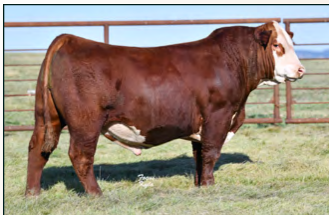
LOT 91 • PYRAMID PERFECTO 8152