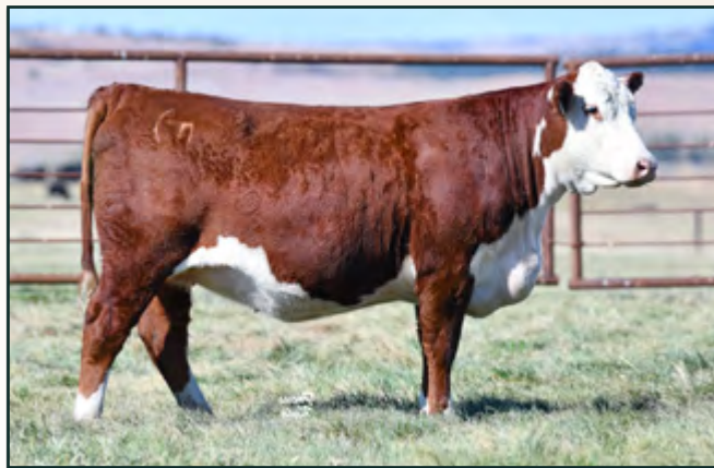
LOT 142 • FHF 632D VICTRA 21F ET