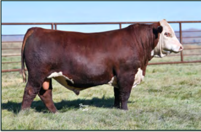
LOT 112 • PYRAMID DAYBREAK 8135