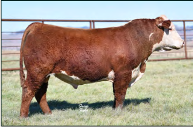
LOT 105 • PYRAMID PILGRIM 8138