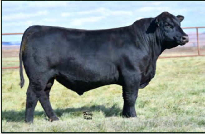
LOT 42 • PYRAMID PACKER 8253