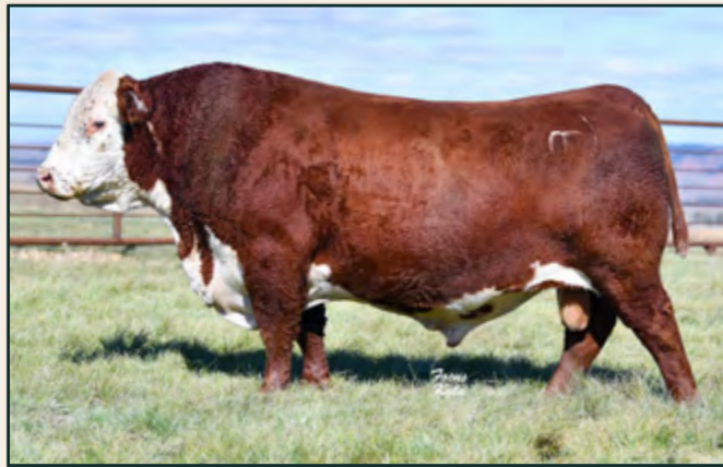
REFERENCE SIRE D • PYRAMID HOMEGROWN 5155