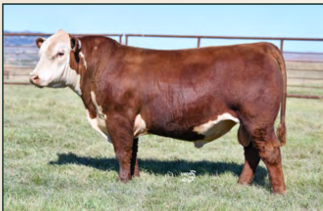
LOT 102 • PYRAMID PILGRIM 8137