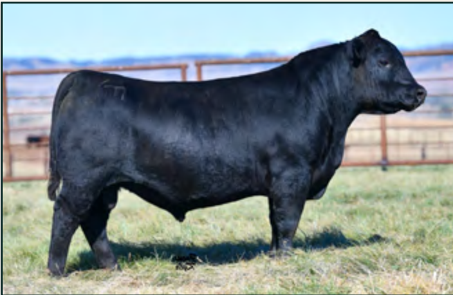
LOT 30 • PYRAMID COMMAND 8060