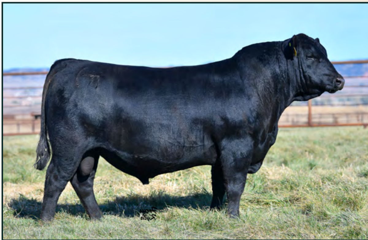
LOT 7 • PYRAMID PROCEED 8058