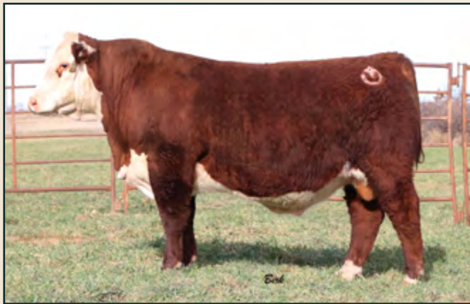
REFERENCE SIRE C • SHF DAYBREAK Y02 D287