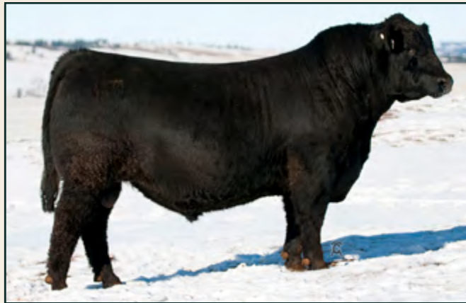
PYRAMID PROCEED 5012 • SIRE OF LOTS 7-8