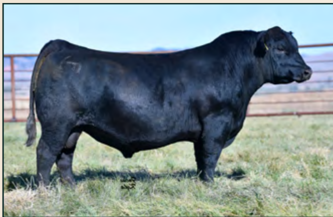
LOT 23 • PYRAMID COMMAND 8003

23 PYRAMID COMMAND 8003 Reg. 19400406 Tattoo: 8003 Calved: 02/01/18 EF COMMANDO 1366 BALDRIDGE COMMAND C036 BALDRIDGE BLACKBIRD A030 CONNEALY HUSKER 1833 GLACIAL 1883 MISSIE 33B GLACIAL 6P MISSIE 10S #EF COMPLEMENT 8088 RIVERBEND YOUNG LUCY W1470 #HOOVER DAM BALDRIDGE BLACKBIRD X89 #CONNEALY THUNDER PEARLA OF CONANGA 8538 GLACIAL 616 RITO 6P GLACIAL 228K MISSIE 40P