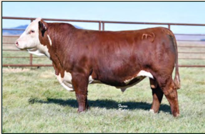
LOT 100 • PYRAMID PILGRIM 8143