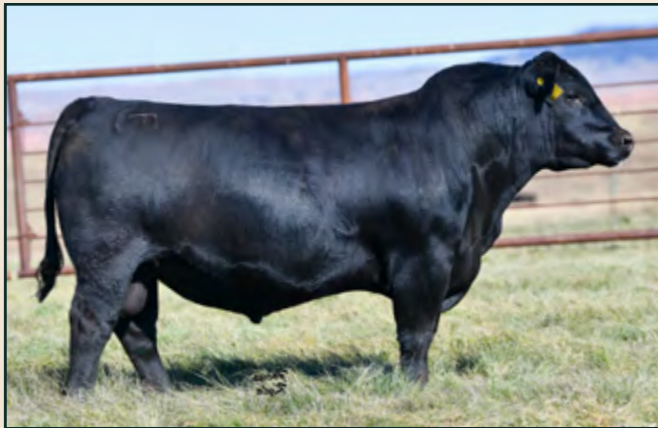
LOT 8 • PYRAMID PROCEED 8064