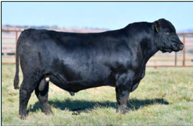
LOT 49 • PYRAMID RESOURCE 8083