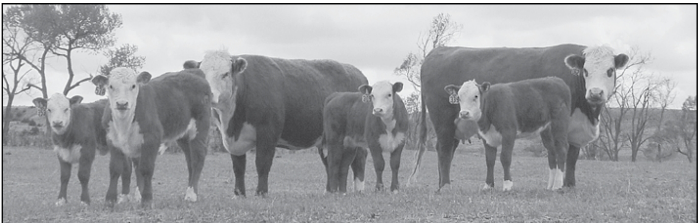
Ridder Hereford Ranch — Feb. 6, 2014