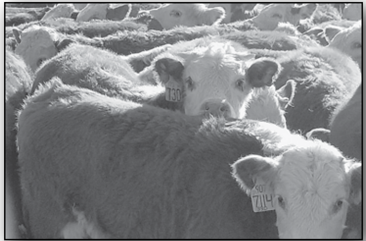
Newly weaned heifers.