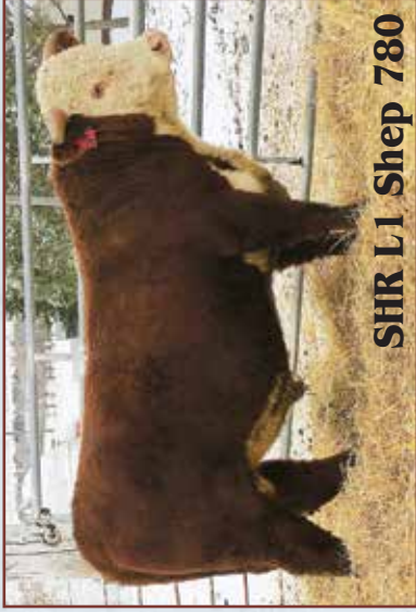
SHR L1 Shep 780

FIRST CLASS US POSTAGE PAID Fargo, ND Permit No. 684