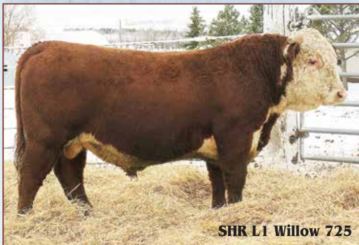
SHR L1 Willow 725