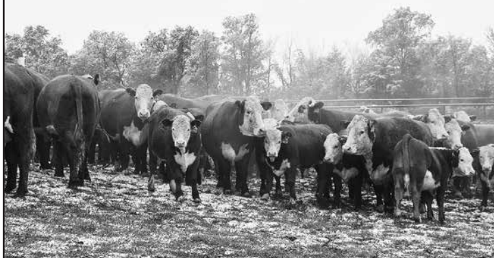
Group of cattle shown at the 2018 All Breeds Cattle Tour.

A rugged 2128 son that falls into the ranchers deluxe category. Out of a great 9130 daughter that is a front pasture cow.