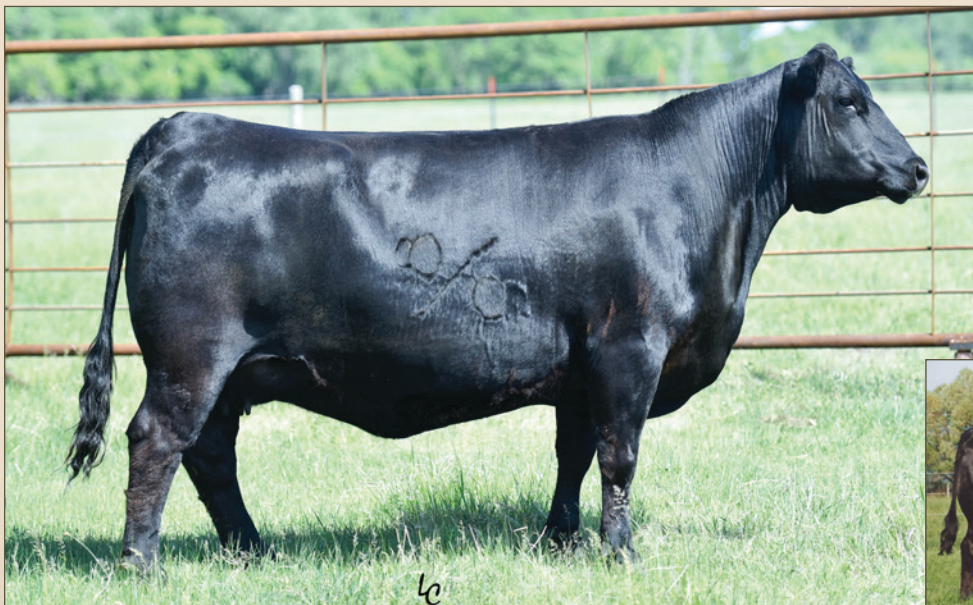
COLEMAN DONNA 0176 - LOT 10