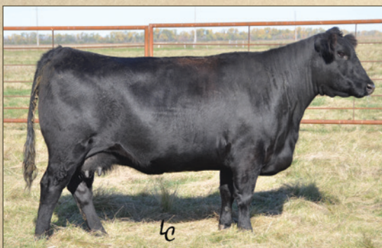
TC PRIDE 4226 The dam of Lots 5 through 5D.

TC Pride 8067, the Pathfinder granddam, was the $37,000 second top-seller of the 2006 TC Female Sale and her progeny includes the $25,000 Genex sire TC Foreman 016 and the $13,500 TC Grid Topper 355 from the same cow family that also produced the famous Pathfinder Sire TC Stockman 365.