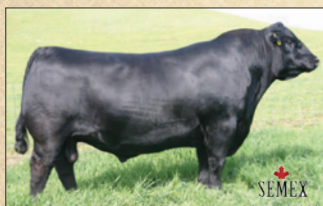
SAV HEAVY HITTER 6347

Maternal sister to the dam of Lots 15 through 15D.