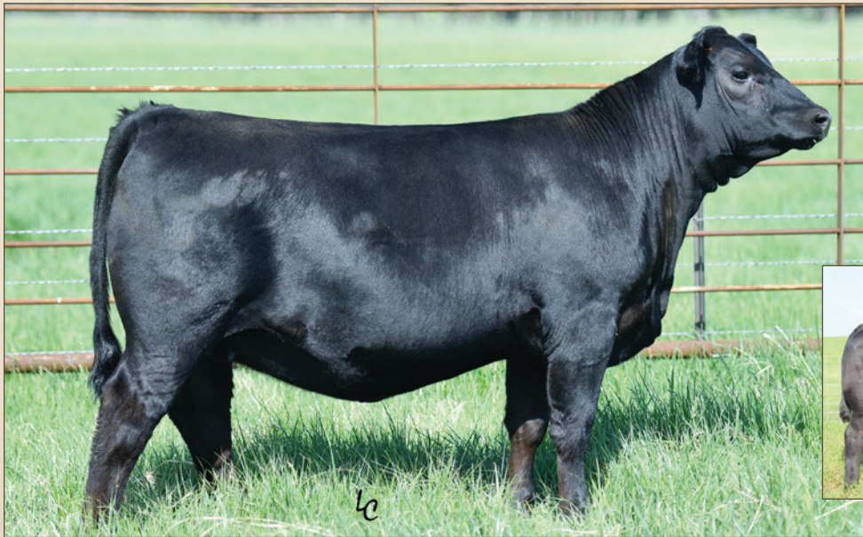
TOPP BLACKCAP MAY 6263 - LOT 16