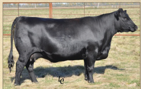
TC FOREVER 6123 The dam of Lots 6, 6A and 6B.

A trio of flush sisters by Connealy Capitalist 028 from a proven donor dam by the Pathfinder Sire TC Grid Topper 355, from the family that produced the Pathfinder Sire JR Juice 2005.