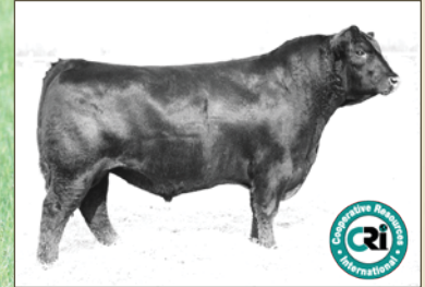
TC VANCE 011 Produced from a maternal sister to Lots 5 through 5D.