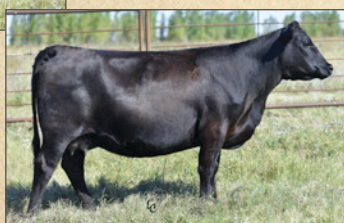
TA FOREVER 3738 Maternal sister to Lots 6, 6A and 6B.