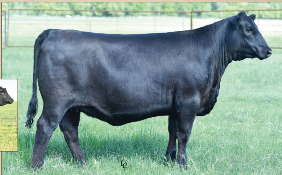
TOPP BLACKBIRD 6078 - LOT 12A

$65,000 full brother Lots 12A and 12B and maternal brother Lot 12.