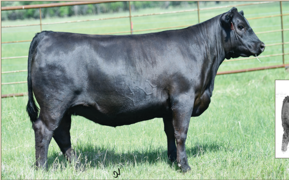
TOPP PRIDE 6033 - LOT 5