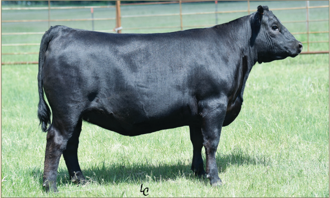
TOPP MARCIA 6006 - LOT 1A