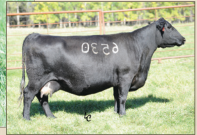
TC RUBY 6530 The dam of Lot9.