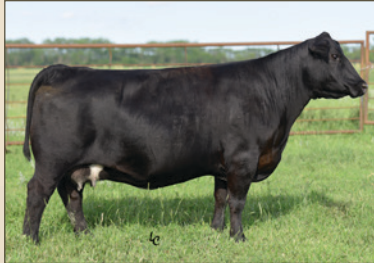
TC MARCIA 0616 The dam of Lots 1A through 2B.