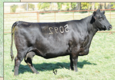
TC PEGGY 5092 The fourth-generation Pathfinder Dam of Lots 7 through 7C.