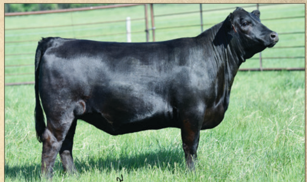
TOPP MARCIA 6012 - LOT 1G