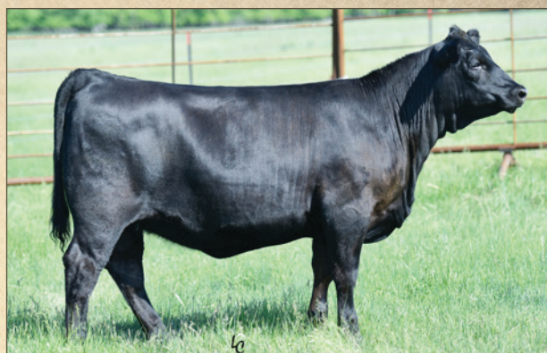
TOPP QUEEN 6260 - LOT 14