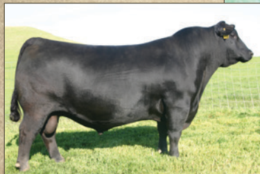
SAV PIONEER 7301

A special opportunity to acquire full sisters to the $65,000 Genex Pathfinder Sire SAV Pioneer 7301 who is one of the breed's leading high-maternal and balanced-trait sires. The productive donor dam has a progeny birth ratio of 95 balanced with a progeny weaning ratio of 109 on four natural calves and a progeny yearling ratio 106 on three head along with a progeny ribeye ratio of 108 on seven head, backed by one of the oldest and most productive families in the SAV program.