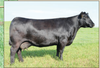
SAV BLACKCAP MAY 4136 The record-setting double grandam of Lots 16, 16A and 16B.