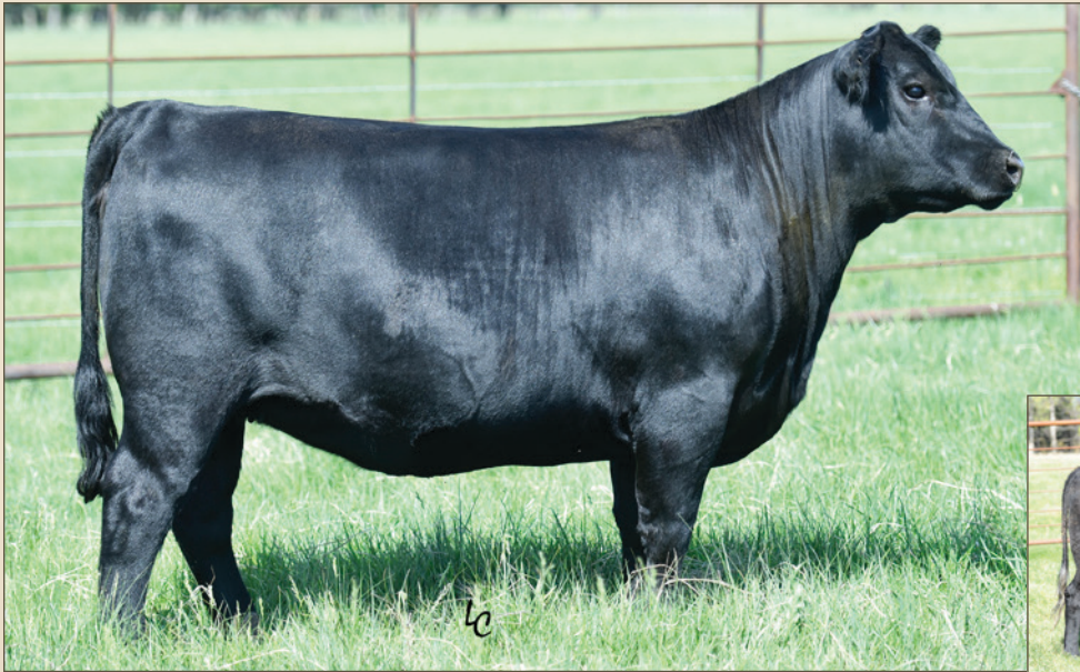
TOPP ERIANNA 6049 - LOT 8