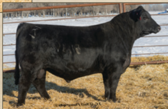
TOPP CAPITALIST 5411 Full brother to Lots 3 and 3A.