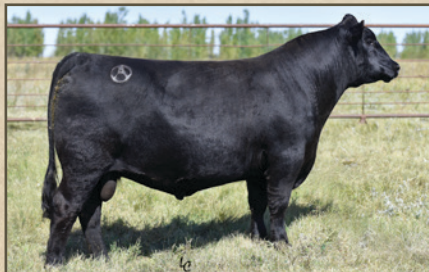
CIRCLE A MOGUL 3463 The top-selling bull of the 2014 Circle A Fall Sale.