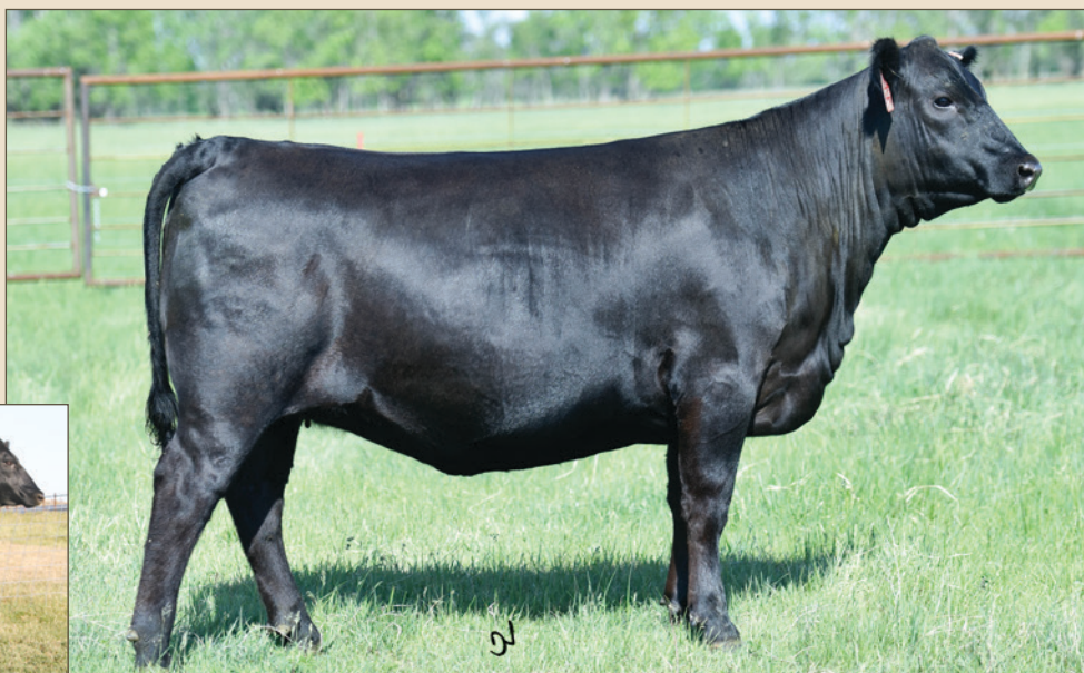
TOPP BLACKBIRD 6084 - LOT 12

This special attraction female is a maternal sister to SAV Pioneer 7301, the $65,000 top-selling bull of the 2008 Schaff Angus Valley Sale who went on to become a proven Pathfinder Sire and a popular member of the Genex AI Stud. The productive donor dam of this heifer balances a progeny birth ratio of 95 with a progeny weaning ratio of 109 on four natural calves and a progeny yearling ratio of 106 on three head along with a progeny ribeye ratio of 108 on seven head.