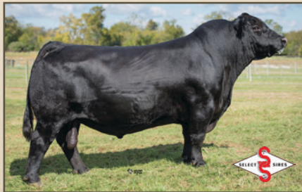
CONNELY CAPITALIST 028 The $120,000 second top-selling bull of the past Connealy sale.