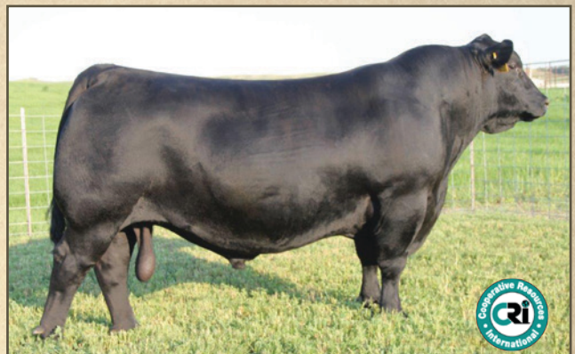
SAV RENOWN 3439 The $175,000 lead-off bull of the 2014 SAV Sale.