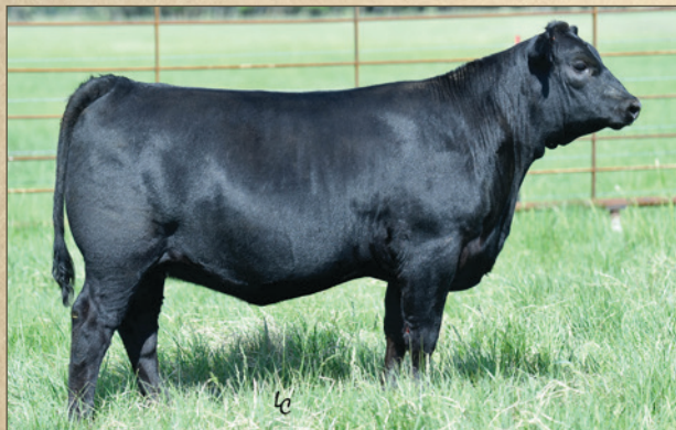
TOPP ABIGALE 6266 - LOT 17

A tremendous trio of double granddaughters of SAV Blackcap May 4136, the all-time world record income-producing cow who has generated $8,463,000 on 171 progeny in SAV sales to date, in addition to 55 daughters retained in the SAV herd. The donor dam has a progeny weaning ratio of 109 on her first natural calf, and she is maternal sister to an impressive array of prominent individuals including Resource, Renown, Recharge, Seedstock, Sensation, Pedigree, Universal, Revolution, Heritage, President, Governor, Raindance, Rainfall, Rainmaster and Reign.