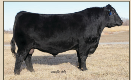
MUSGRAVE BIG SKY The $145,000 top-selling bull of the 2013 Musgrave sale.