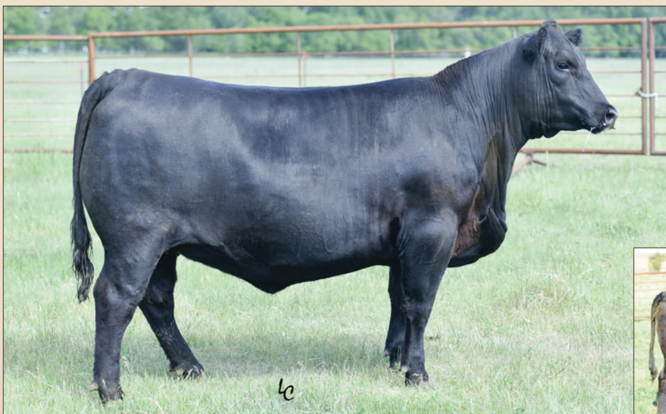
TOPP PEGGY 5350 - LOT 7A