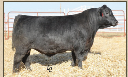
MOHNEN WOLF CREEK 1871 The $17,000 co-top-selling bull of the 2012 Mohnen Sale.