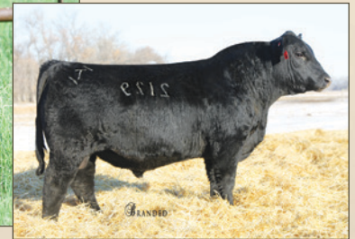
TOPP CRAFTSMAN 2129 Maternal brother to Lots 4 through 4C.