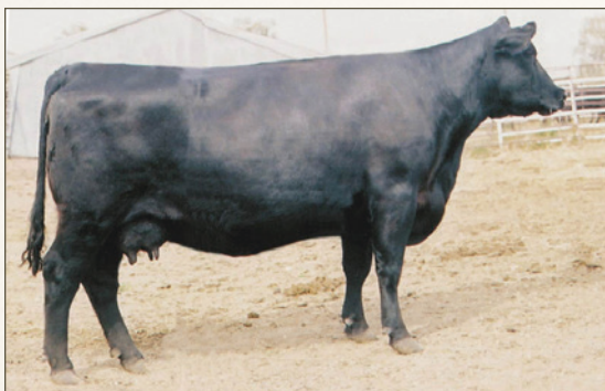
ALC LYN T03L

A trio of flush sisters from the high-maternal Donna family sired by the $145,000 Musgrave Big Sky.