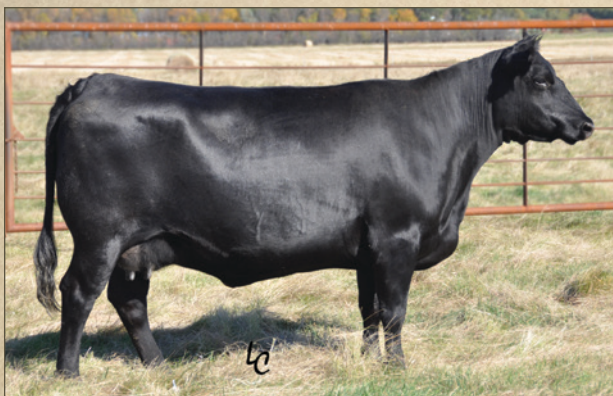
TC BARBARA 3088 The Pathfinder Dam of Lots 3A and 3B and grandam of Lots 4 through 4C.