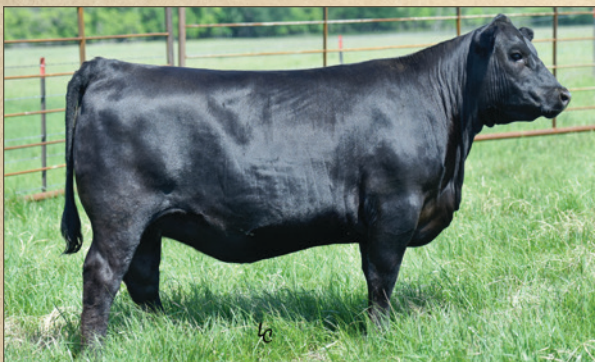
TOPP MARCIA 6022 - LOT 1B

A full brother was the $9,700 top-seller of the 2017 Topp Inaugural Bull Sale where a maternal brother was the $8,000 second top-seller and other full brothers were selected by leading registered and commercial cattlemen.