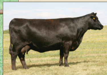
SAV BESSIE HEIRESS 1184 The grandam of Lots 15 through 15D.