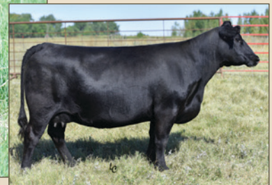
TA BARBARA 1307 Maternal sister to Lots 3A and 3B.