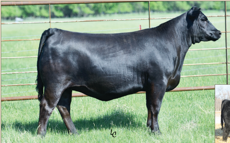
TOPP BARBARA 5403 - LOT 4