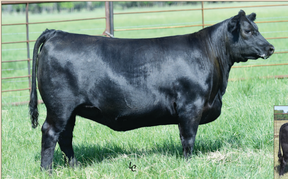
TOPP BARBARA 5401 - LOT 3A