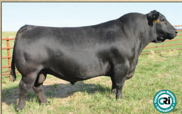
SAV RESOURCE 1441 The $110,000 top-selling bull of his sire group in the 2012 SAV Sale.