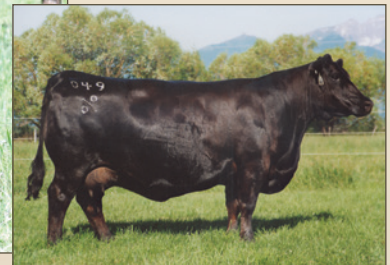
KMK DONNA J311 The $60,000 valued dam of Lot 10.