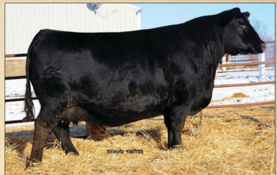
MOHNEN ERIANNA 2576 The $19,000 dam of Lot 8, 8A and 8B.

The result of mating the $145,000 Musgrave Big Sky with the $19,000 Mohnen Erianna 2576, backed by generations of breeding in the Mohnen and Bon View herds.