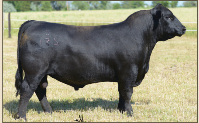
BALDRIDGE COLONEL C251 $580,000 top-selling Lot 1 bull of the 2017 Baldrige Brothers Sale.