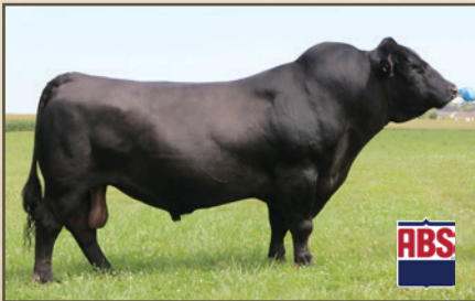
QUAKER HILL RAMPAGE OA36 A one-time EPD record-breaker.