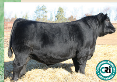
SAV ABUNDANCE 6117 $135,000 maternal brother to the dam of Lot 13, 13A and 13B.