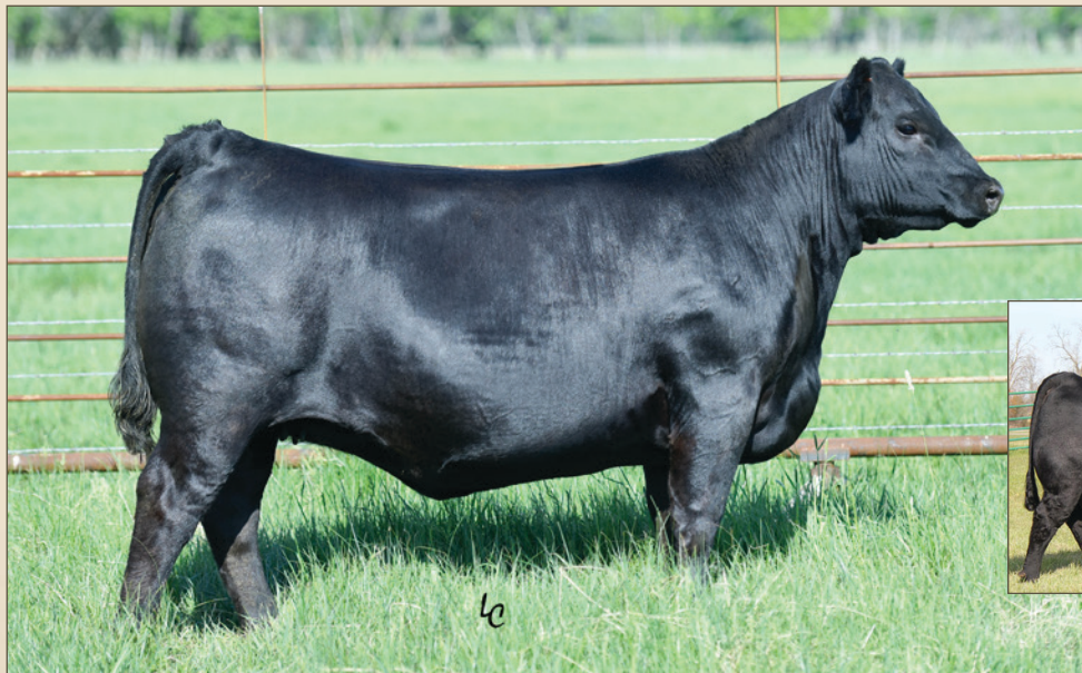
TOPP GEORGINA 6013 - LOT 6