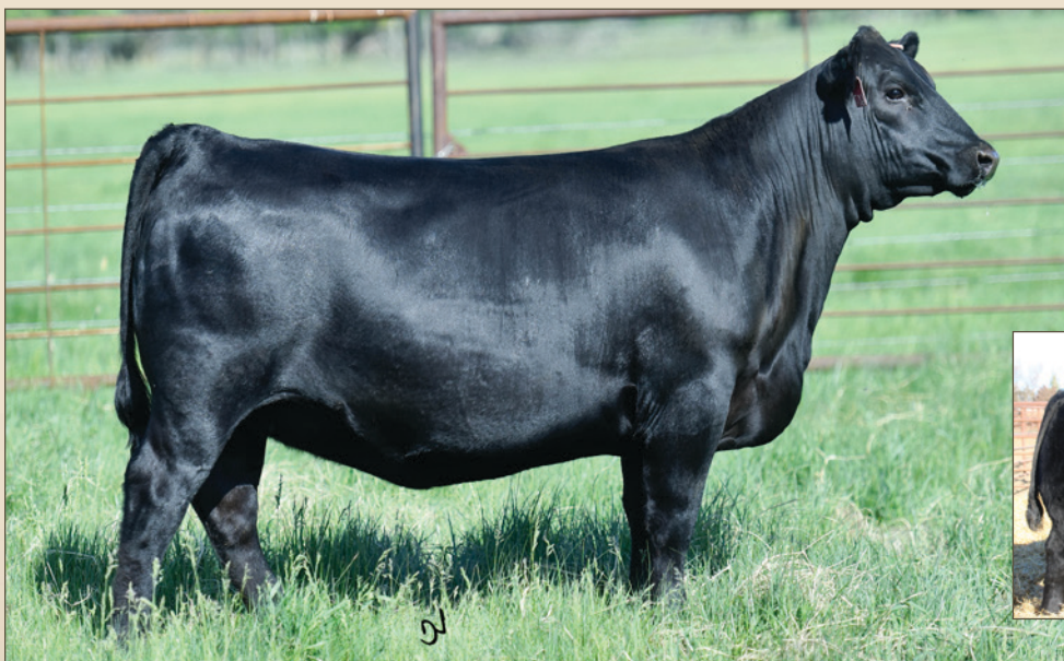
TOPP EMBLYNETTE 6077 - LOT 13