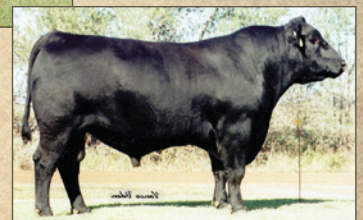
TC FOREMAN 016 $25,000 maternal brother to the dam of Lots 5 through 5D.