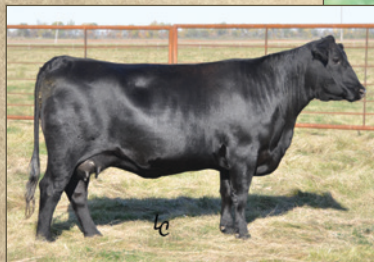
TC MARCIA 6170 The grandam of Lots 1A through 2B.