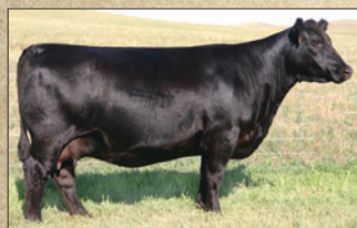
SAV BESSIE HEIRESS 4149

These heifers are by the popular Genex sire SAV Resource 1441 who was the $110,000 top-selling bull of the 2012 SAV sale and has no equal among proven sires for combining performance, fleshing-ease, muscle, structural soundness, breed character and fertility.