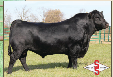
TC THUNDER 805 Maternal brother to Lots 6, 6A and 6B.