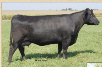
TC PRIDE 8067 $37,000 Pathfinder granddam of Lots 5 through 5D.