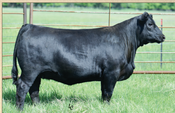
TOPP BESSIE HEIRESS 6085 - LOT 15A

Maternal brother to the dam of Lots 15 through 15D.