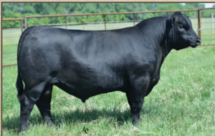
TC FREAL 625 The $25,000 second top-selling bull of the 2017 TC Sale.