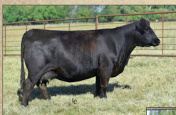
TA PRIDE 0615 Maternal sister Lots 5 through 5D.

The donor dam is a maternal sister to the $25,000 TC Foreman 016 and to the $13,500 TC Grid Topper 355, stemming from the $37,000 Pathfinder Dam TC Pride 8067.