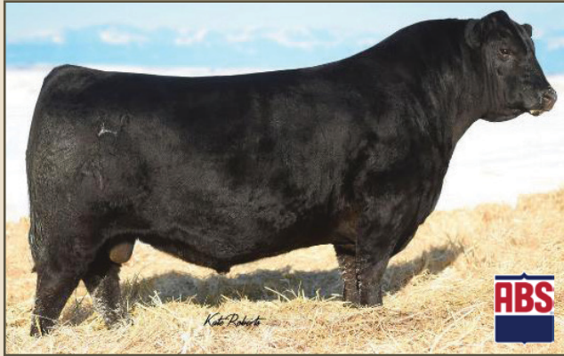
HA COWBOY UP 5405 $350,000 all-time top-selling bull in Montana through the 2016 Hinman Sale.