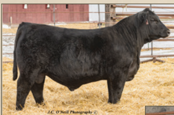
TOPP CAPITALIST 6073 Full brother to Lots 3 and 3A.