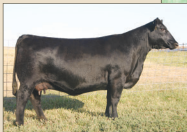
SAV BLACKBIRD 5297