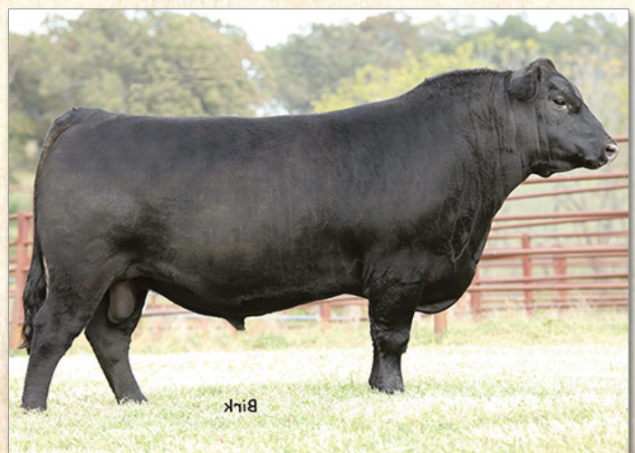
BUBS Southern Charm AA31