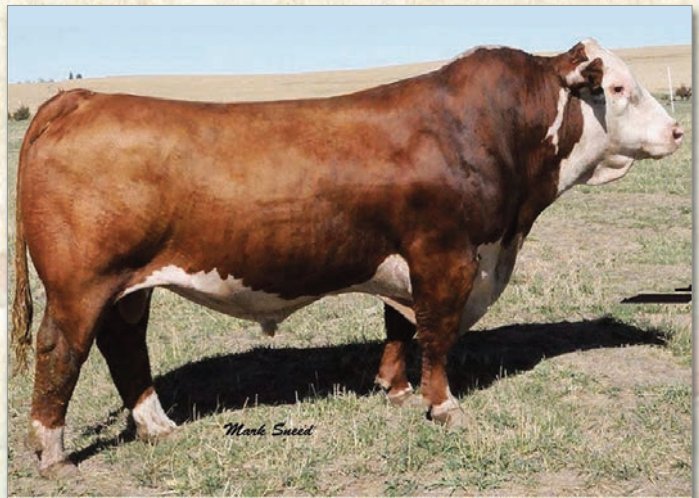
TH 403A 475Z Pioneer 358C ET

NJW FHF 9710 TANK 45P TH 814H 3L RITA 7N