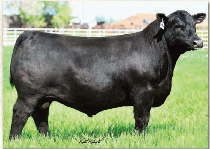
S Powerpoint WS 5503