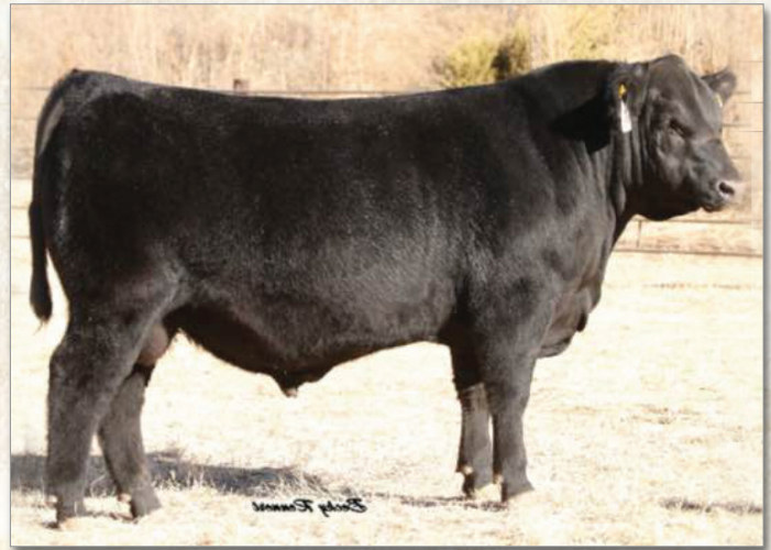
TC Elite 772

CONNEALY RIGHT ANSWER 746 BALDRIDGE FOREVER LADY N506