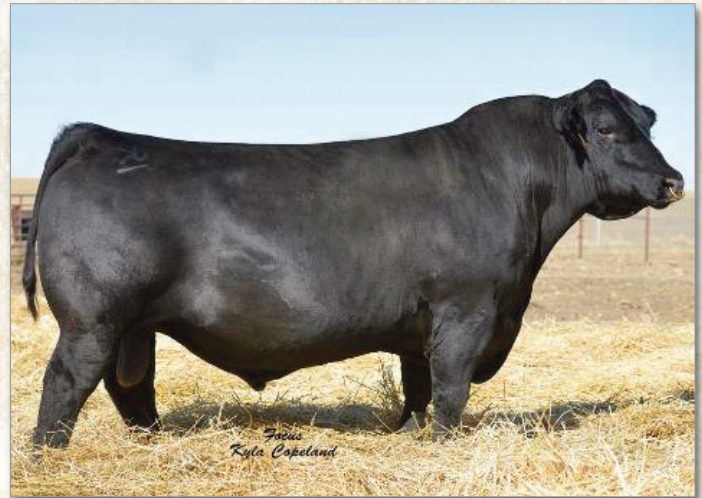
GDAR Leupold 298

D H D TRAVELER 6807 GDAR MISS BLACKCAP 320