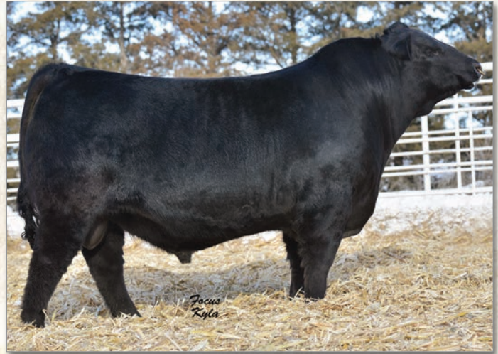
FAR Long Range

FAR Long Range is a performance sire! He has extra frame and power.