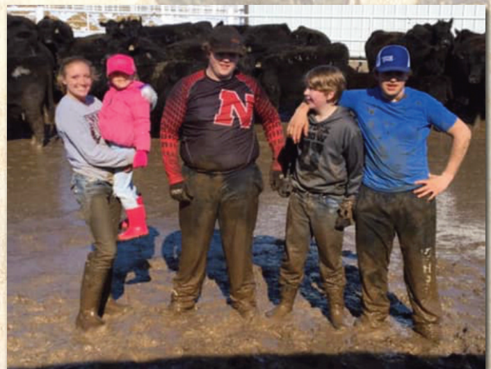
Preconditioning was muddy this year.