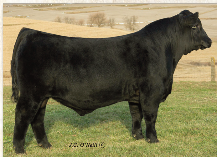
J.C. O'Neill ©