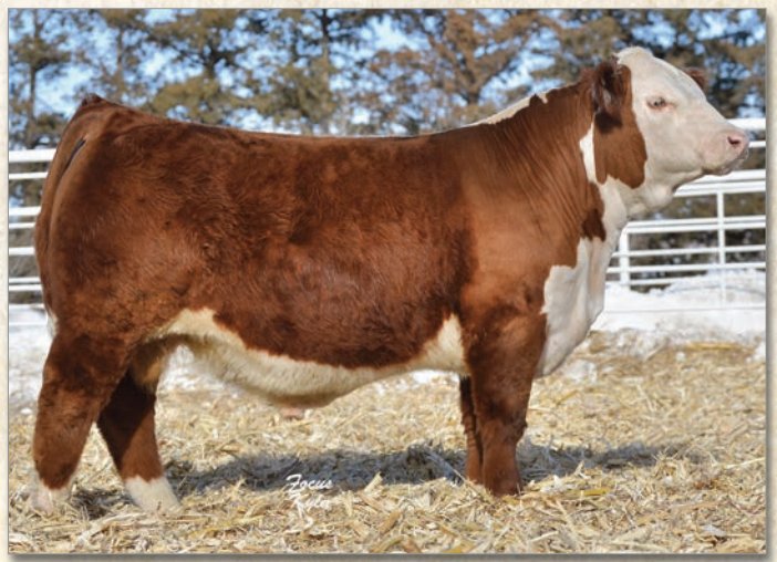
Vin-Mar Wildcat 633

BECKLEY 758P ONTIME 934S MGM MERRY MAID P606 17R