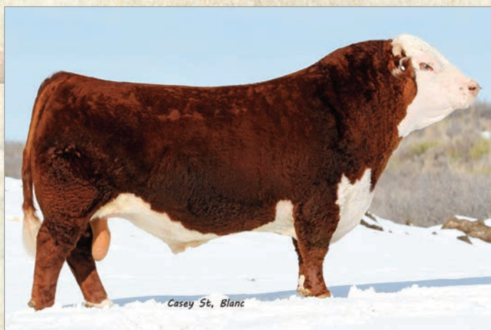
Pictured Sire to Reference Sire UPS Hutton 4258 ET NJW 73S 980 Hutton 109Z ET