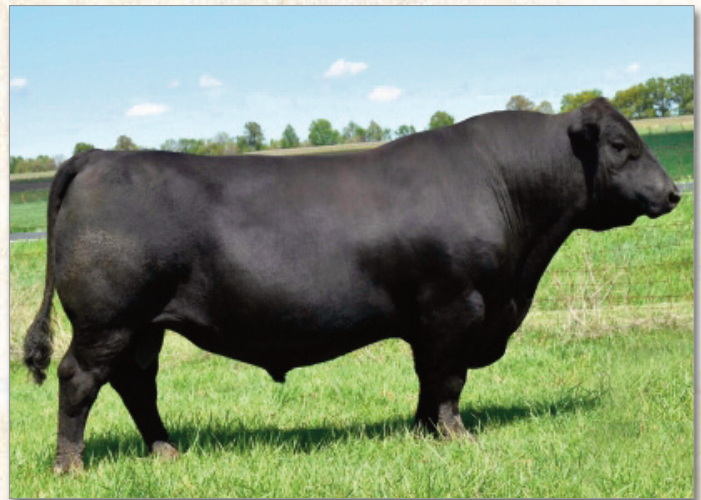
Brockmere Trinity 3013

Lot 69 Vin-Mar Trinity 9513 BORN: 01/12/2019 REG: #19516065 TATTOO: 9513