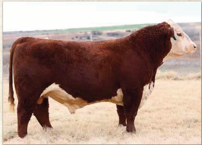
Pictured Sire to Reference Sire TH 95W 7B Vinny 65D Remittal-W Start Me Up ET 7B

CB 57U CAN DOO 102Y RVP STAR 533P CAN-AM ET 57U HF 74M LIMELIGHT LADY 42P REMITALL-W START ME UP ET 7B REMITALL-WEST MARVEL ET 76Y SHF WONDER M326 W18 ET REMITALL MARVEL 78T DRF JWR PRINCE VICTOR 711 KBCR 19D DOMINETTE 122 TH 122 711 VICTOR 719T TH 112T 719T CASSANDRA 95W TH 43P 243R CASSANDRA 112T TH SHR 605 57G BISMARCK 243R ET TH 121L 8146 CASSANDRA 43P