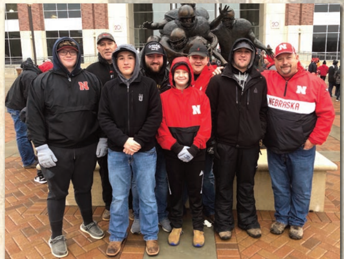
Enjoying the Nebraska Husker Football game with the boys and family.