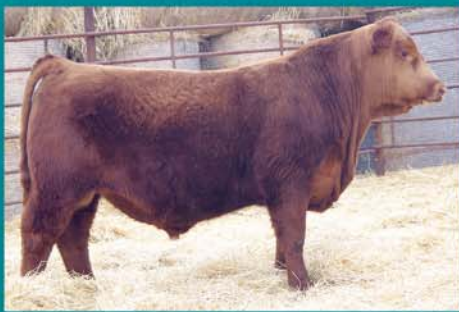
Lot 8 – WSM COWBOY 851F