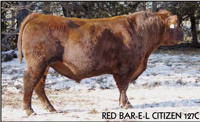
RED BAR-E-L CITIZEN 127C