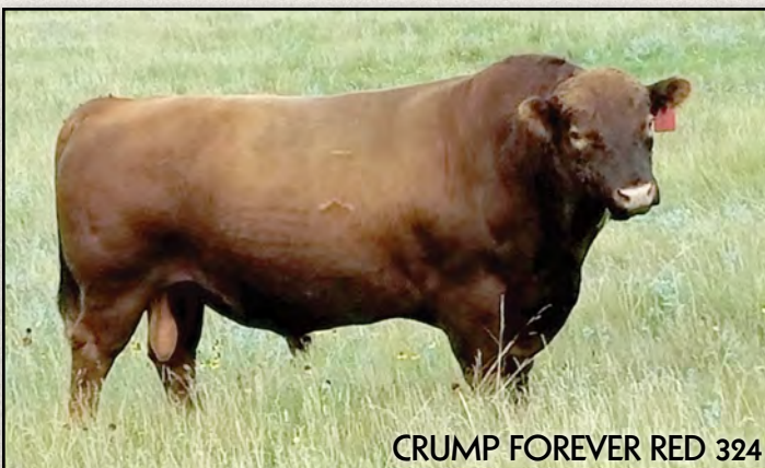
CRUMP FOREVER RED 324