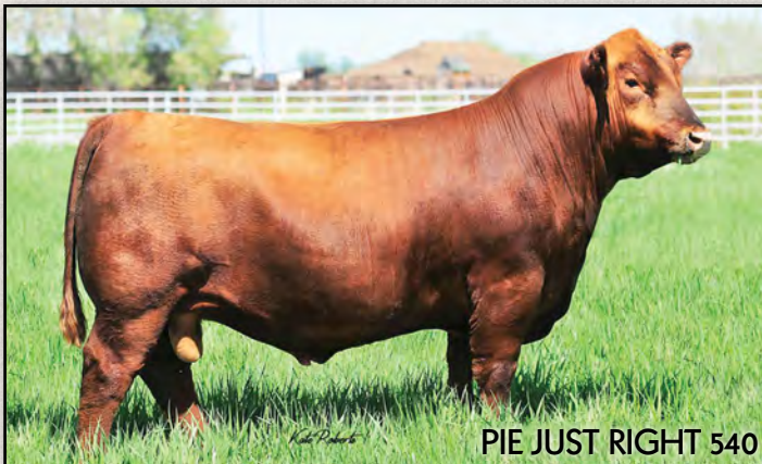
PIE JUST RIGHT 540