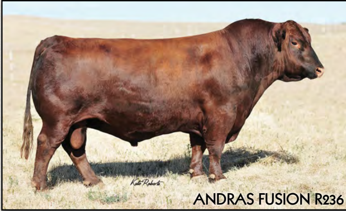
ANDRAS FUSION R236