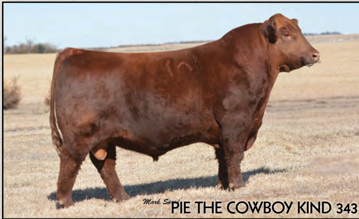
PIE THE COWBOY KIND 343