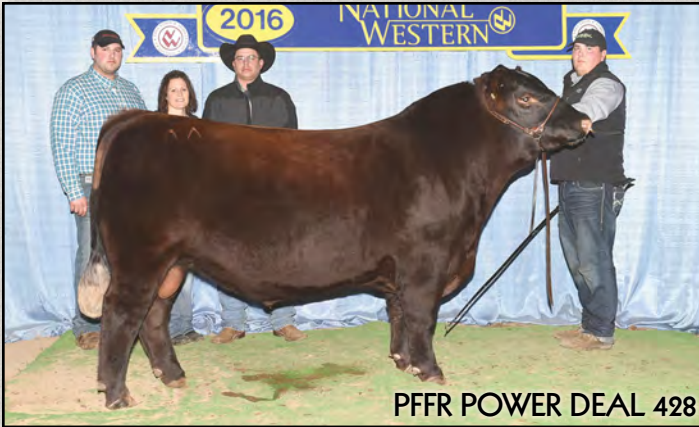
PFFR POWER DEAL 428