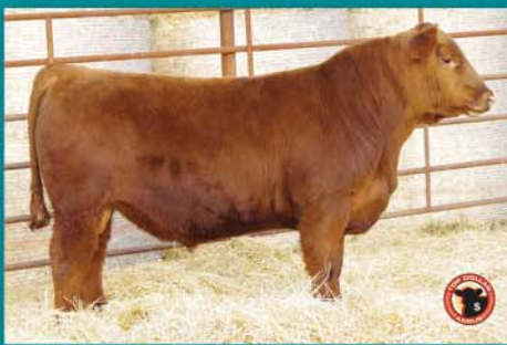
Lot 22 – WSM POWER DEAL 852F

Guest Consignor: Larry, Payton and Teigan Pavlenko Payton: (701) 495-1168