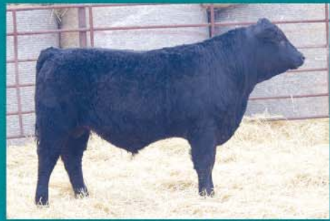
Lot 35 – PAV MR OUTLAW F836