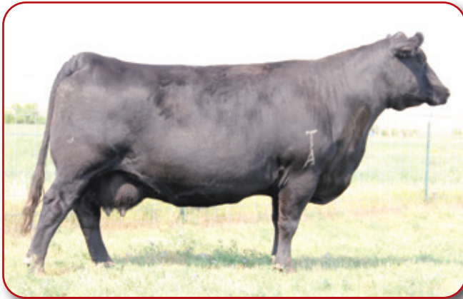
933 was a Linebred daughter. She served in our program for 10 years and earned Pathfinder and donor cow status.

BD: 3/19/2008 Reg No: 16267946 Tattoo: 802