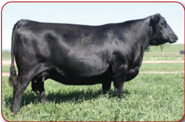
AMDAHL JD MISS UPDATE50-5139 DAM OF LOT 22