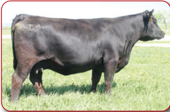
AMDAHL ERICA HICKOK 544-9202 DAM OF LOTS 79 & 81