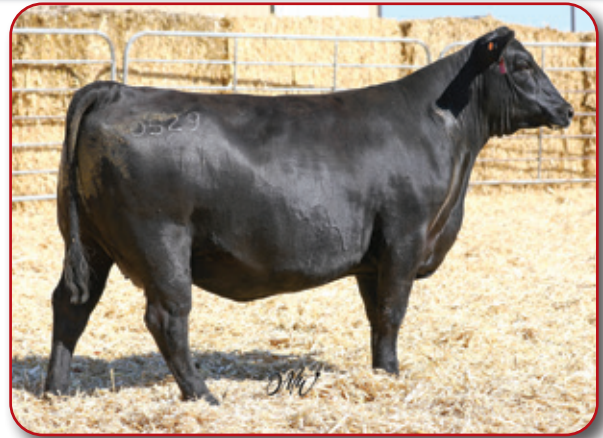
HUWA 6017 KNOW HOW 0529 DAM OF LOT 78