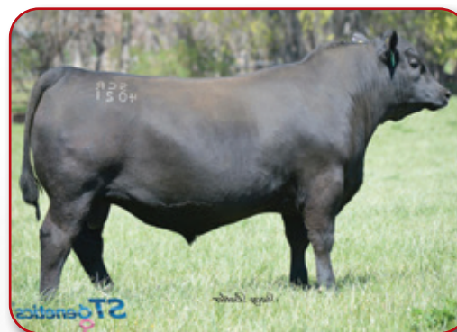
SPRING COVE RENO 4021 MATERNAL GRANDSIRE OF LOTS 84 & 85