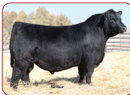
BALDRIDGE WAR CRY K041 SIRE OF LOT 84