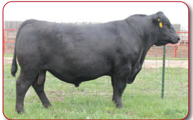
BALDRIDGE GENESIS G421 SIRE OF LOT 44

• Will make moderate and easy fleshing females.