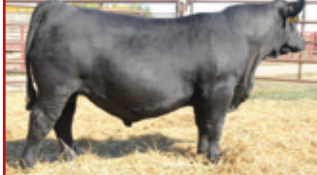
SON OF BLACKBIRD 148-460

• 460 is a highly proven donor Pathfinder cow that has raised many daughters that now serve in the herd. She has also produced many herd bulls that have been top sellers throughout the years. • Milk 4%; $W 5% • She has weaned off 6 natural bull calves for an average weaning weight of 837lbs. • 460 sells safe bred to Baldrige Flagstone due 5-4-23.