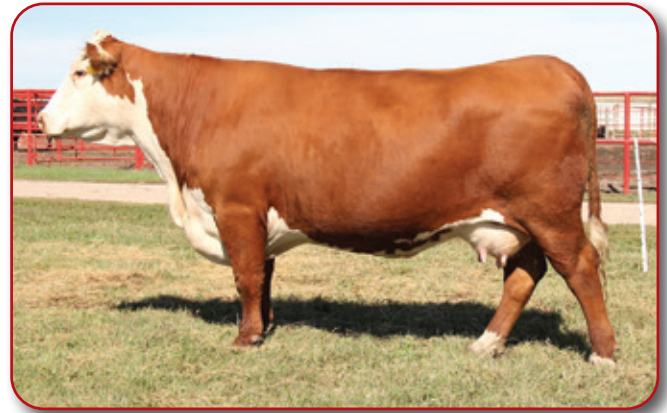
The 376 cow what is a corner stone Donor cow for her exceptional production and stunning phenotype