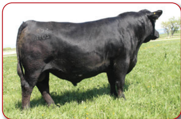
SPRING COVE MISSION (REG: 20103153) SERVICE SIRE FOR MANY LOTS IN THE SALE