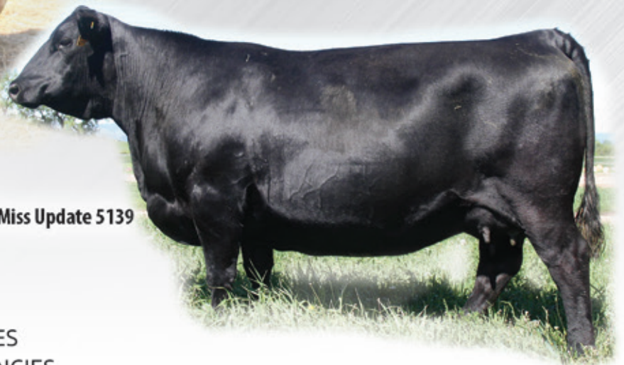
Amdahl Miss Update 5139