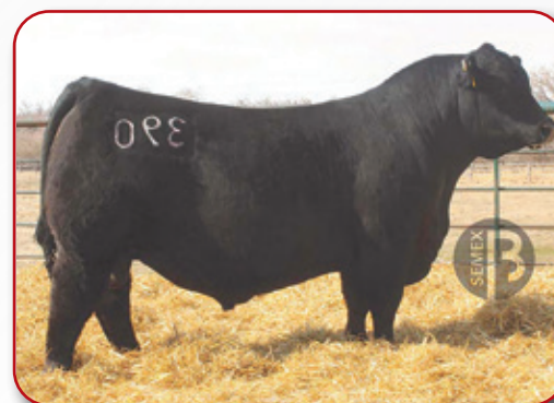
BROOKDALE BRUTUS 390 SIRE OF LOT 85