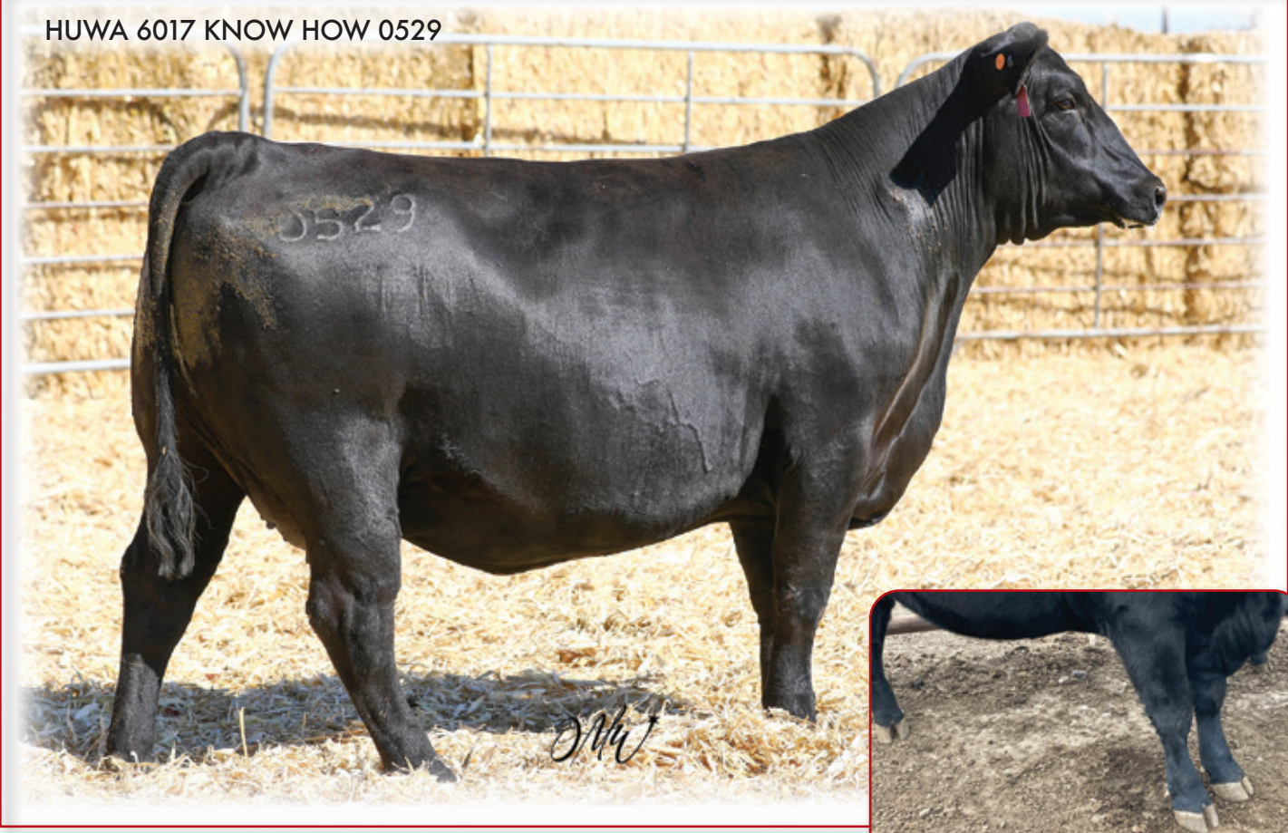
HUWA 6017 KNOW HOW 0529