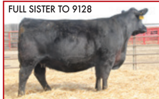
FULL SISTER TO 9128