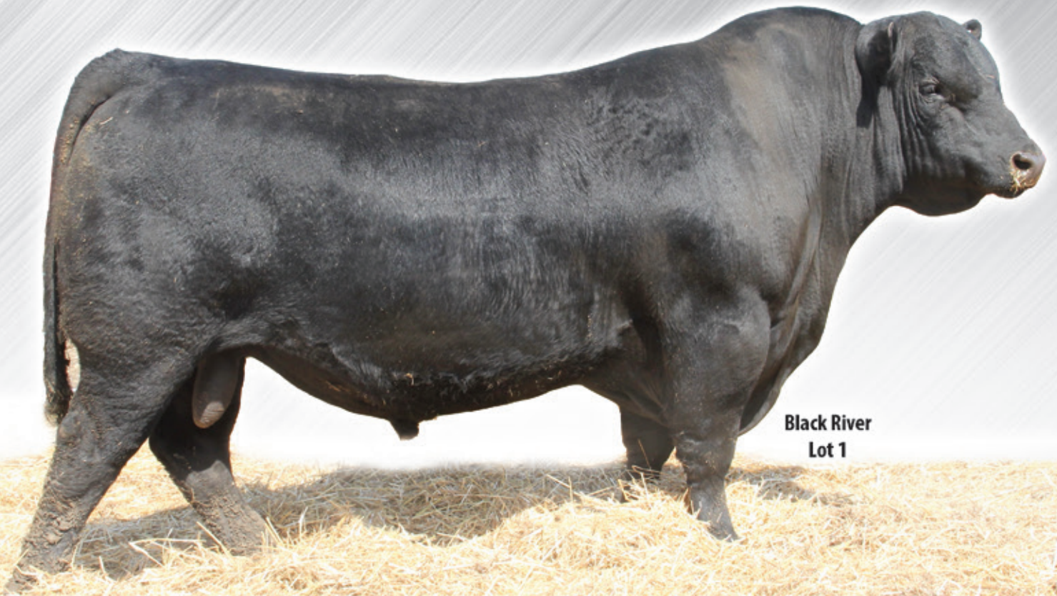
Black River Lot 1

1:04 p.m. MST • at the ranch, North of Rapid City, SD