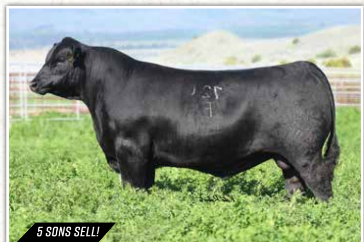
SITZ ACCOMPLISHMENT 720F

Accomplishment offers strong calving ease and maternal traits while excelling for foot quality, substance and power. 5 sons sell!