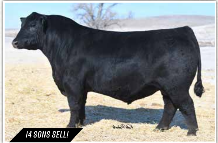
SITZ RESILIENT 10208

Sitz Resilient rates in the top 5% for Foot Claw and Angle, $Maternal and $Weaned Calf Value EPDs. He offers outstanding maternal design, and is producing fantastic females while his sons have been topping sales across the country. 14 sons sell!