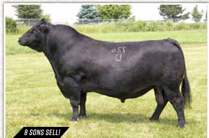
SITZ STELLAR 726D

Stellar has consistently sired our top weaning weight group. He has impressive muscle, outstanding foot quality, and added depth of heel. He has a tight sheath, big scrotal, is docile and has no white. 8 sons sell!