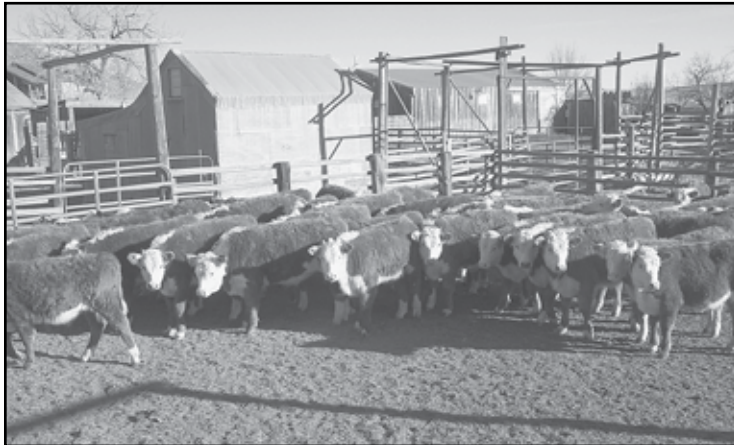
Shipping day at the Seim Ranch.

Dam's MPPA is 103.4 on 3 head. Ranks in the top 1% for WW top 2% for YW and top 10% for M&G. This bull was used on cows as a yearling. He has been trich tested.