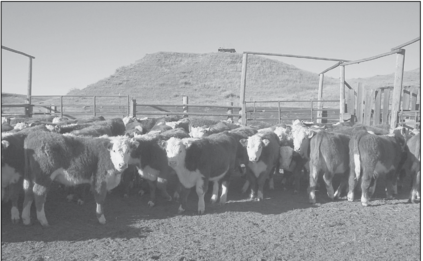
Shipping day at the Seim Ranch.