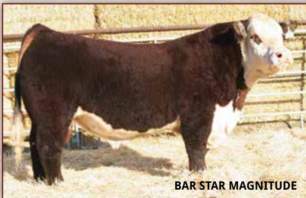
BAR STAR MAGNITUDE

Very correct in his structure, with a big solid foot. He has a presence and stature that can't be copied. Long necked and long spined, he will add pounds and performance to progeny all while maintaining appeal. Digby was the 2017 CWA Canadian National Champion Bull and the 2017 Canadian Agribition champion polled bull.