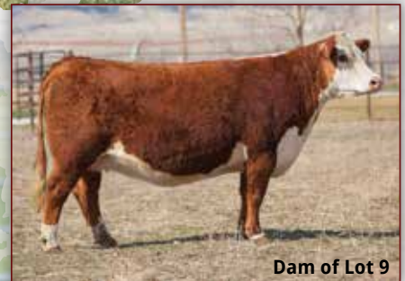
Dam of Lot 9