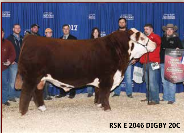
RSK E 2046 DIGBY 20C

Smooth made, homozygous polled, Braxton 719 son that is backed by a very productive cow family. The maternal is bred into C009. We are very much looking forward to having his daughters in production. C09 is nicely pigmented and short marked; he will see continued use here. Structural soundness and calving ease are hallmarks of the Braxton line of cattle. Owned with Anchor Polled Herefords.