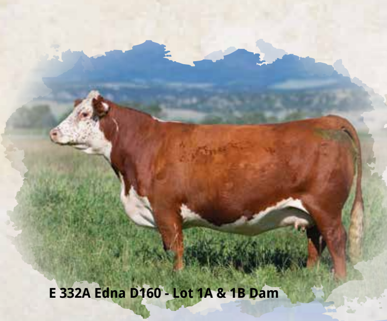
E 332A Edna D160 - Lot 1A & 1B Dam