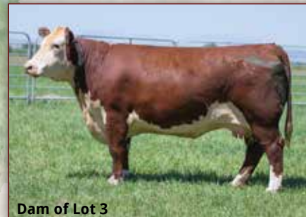
Dam of Lot 3