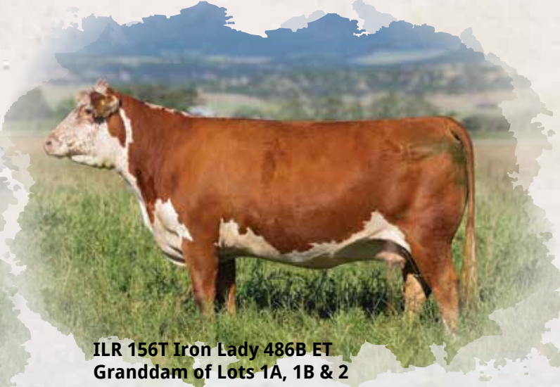
ILR 156T Iron Lady 486B ET Granddam of Lots 1A, 1B & 2