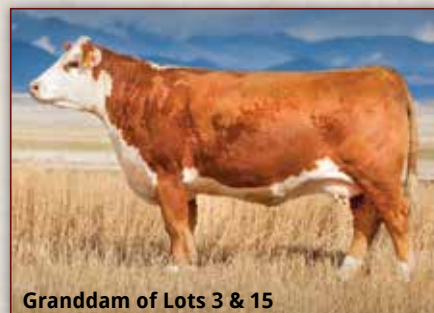
Granddam of Lots 3 & 15