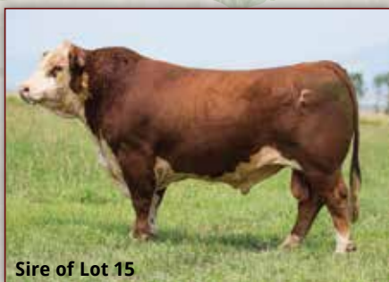
Sire of Lot 15