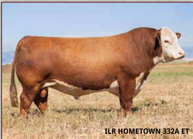
ILR HOMETOWN 332A ET