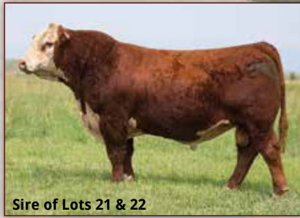
Sire of Lots 21 & 22