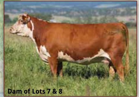
Dam of Lots 7 & 8