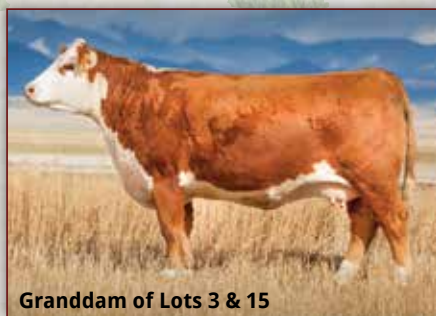
Granddam of Lots 3 & 15