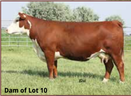
Dam of Lot 10