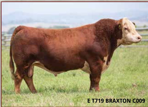
E T719 BRAXTON C009

Powerfully constructed 10Y son with depth, muscle definition and length of spine. 332A is well pigmented, structurally sound and posts an outstanding EPD profile. The 332A daughters in production here are outstanding young cows; tidy udders and good milk flow are the norm. 332A is one of the best 10Y sons working today. Owned with Iron Lake Ranch, Langley Farms, LLC and Woolfolk Farms.