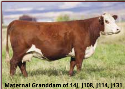
Maternal Granddam of 14J, J108, J114, J131