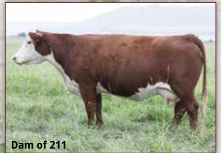
Dam of 211