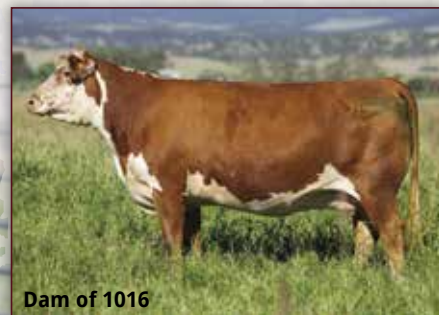
Dam of 1016