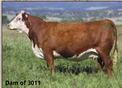
Dam of 3011

One of the first Guardians to sell. 3011 goes back to the Beth 1L on the bottom side of his pedigree. Couple that up with the performance behind Guardian and the 3011 progeny should be something special. It appears like 3011 will be freckle faced like his dam and maternal grand dam. 3011 weaned at 700 lbs at 6 months of age.