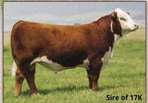
Sire of 17K