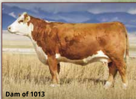
Dam of 1013