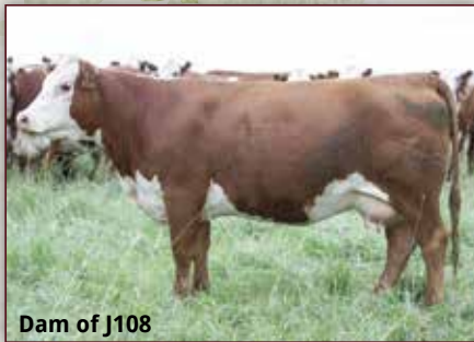
Dam of J108