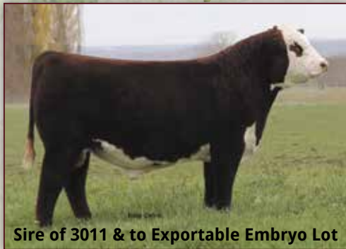
Sire of 3011 & to Exportable Embryo Lot