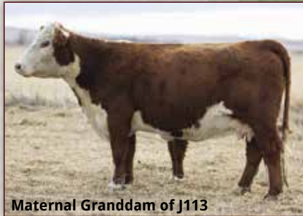
Maternal Granddam of J113