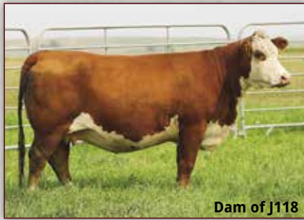
Dam of J118