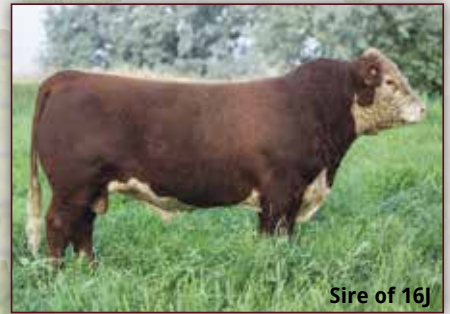
Sire of 16J