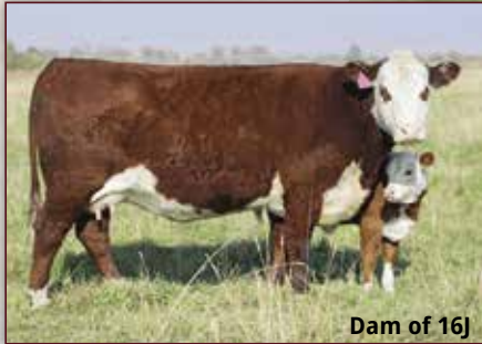
Dam of 16J