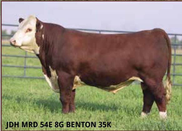
JDH MRD 54E 8G BENTON 35K

873 ILR 16W Ladyc Mariah 873 ET SELLING 4 EMBRYOS Embryos