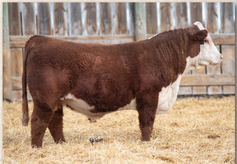
Lot 59 • ECR 53D JOURNEY 0195