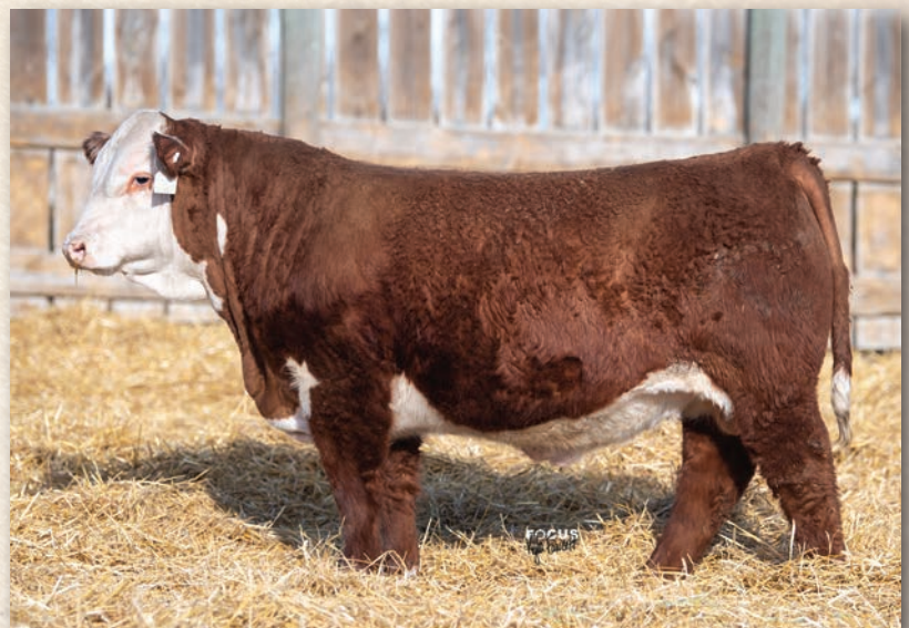
Lot 30 • ECR 238 FORTIFY 1010