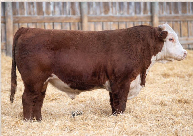
Lot 66 • ECR 6017 DOMINO 0551