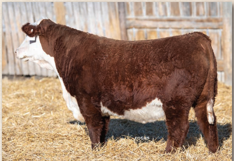
Lot 29 • ECR 238 FORTIFY 1108