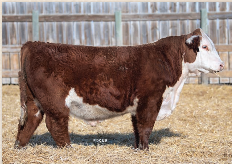
Lot 22 • ECR 173D ENDURE 1173

• If you came to take home the biggest, stoutest bull with the most performance here he is, put some pounds on a calf crop