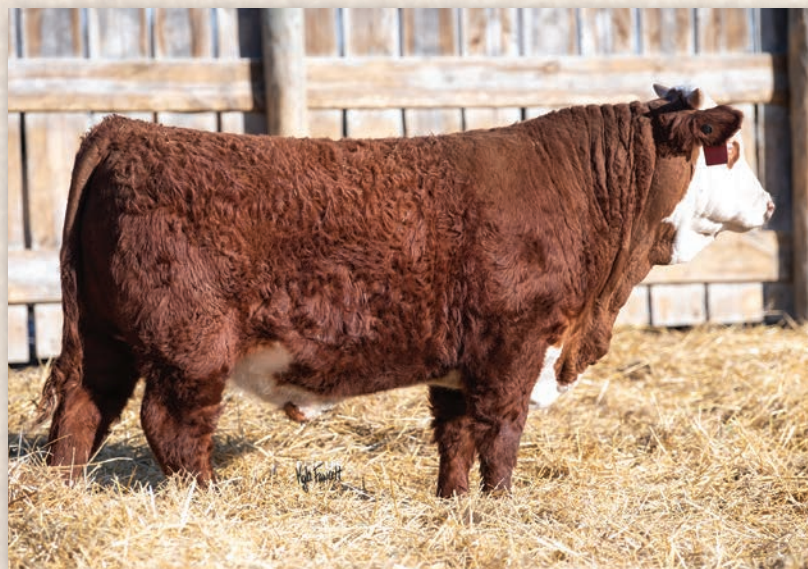
Lot 33 • ECR 4126 ADVANCE 1134