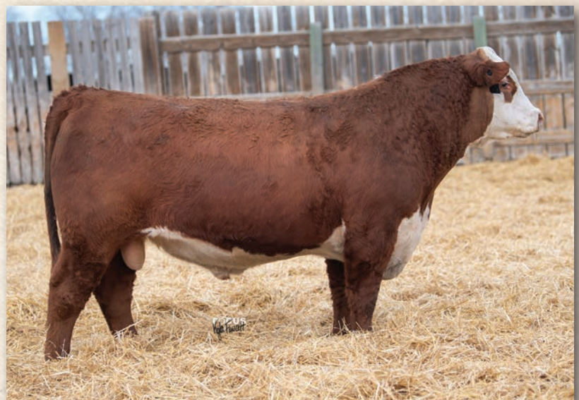
Lot 65 • ECR 173D ENDURE 0310