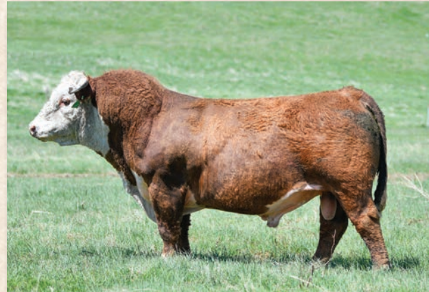
ECR BRAVO 6305