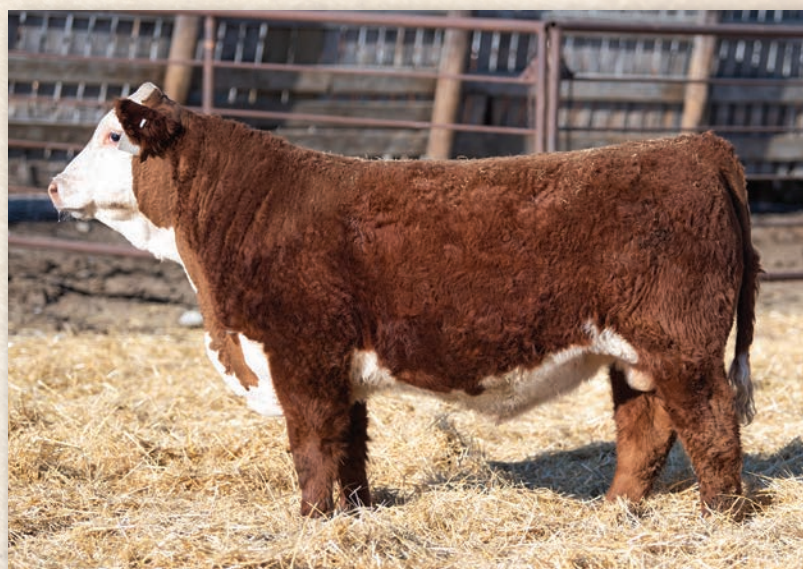
Lot 24 • ECR SPH 47F ADVANCED 102

• Big nuts, big butt and plenty of performance • Baldy maker deluxe