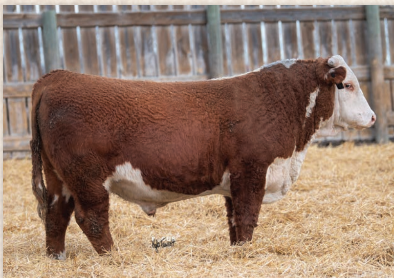
Lot 61 • ECR 8055 DOMINO 0402

• Big time growth bull with great set of EPD's with added carcass value and CHB