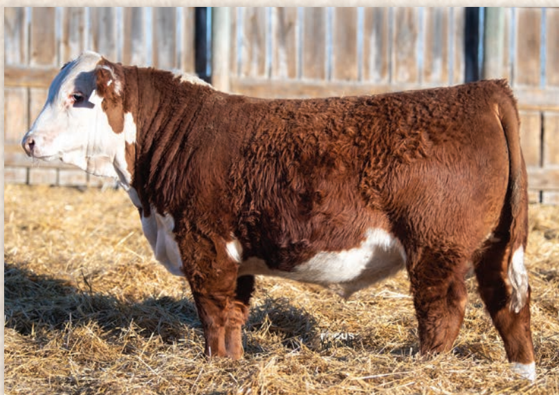
Lot 38 • ECR 11E DOMINO 1150

• Big time spread on paper with tremendous carcass numbers without sacrificing the balance and performance