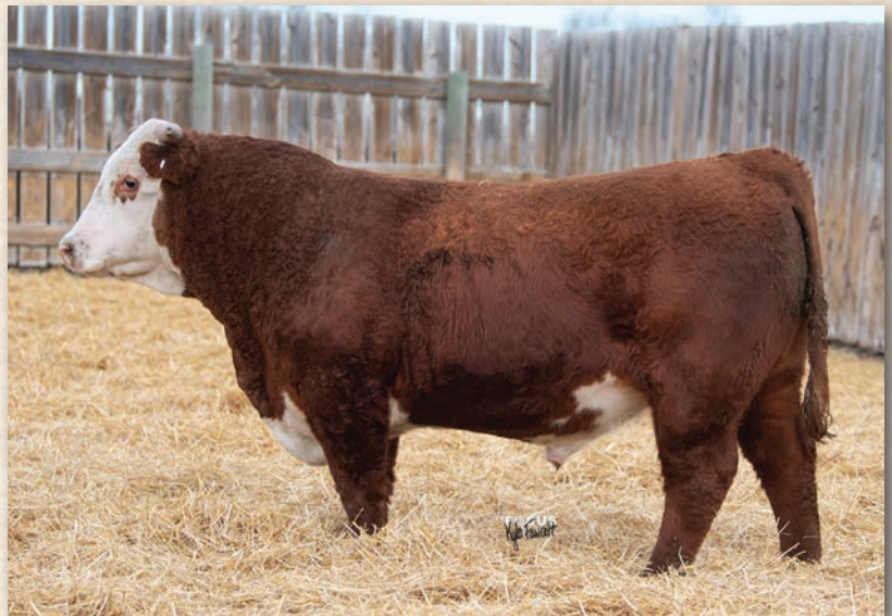
Lot 70 • ECR 4126 ADVANCE 0235

• Top end horned bull with full pigment, short marked and the kind we like