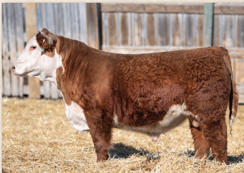
Lot 11 • ECR 238 FORTIFY 1049