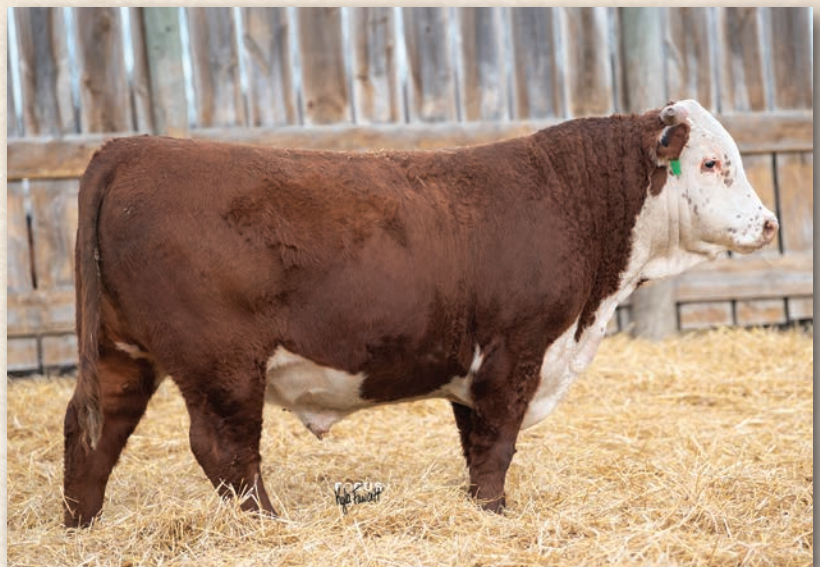
Lot 94 • ECR 4126 ADVANCE 0540