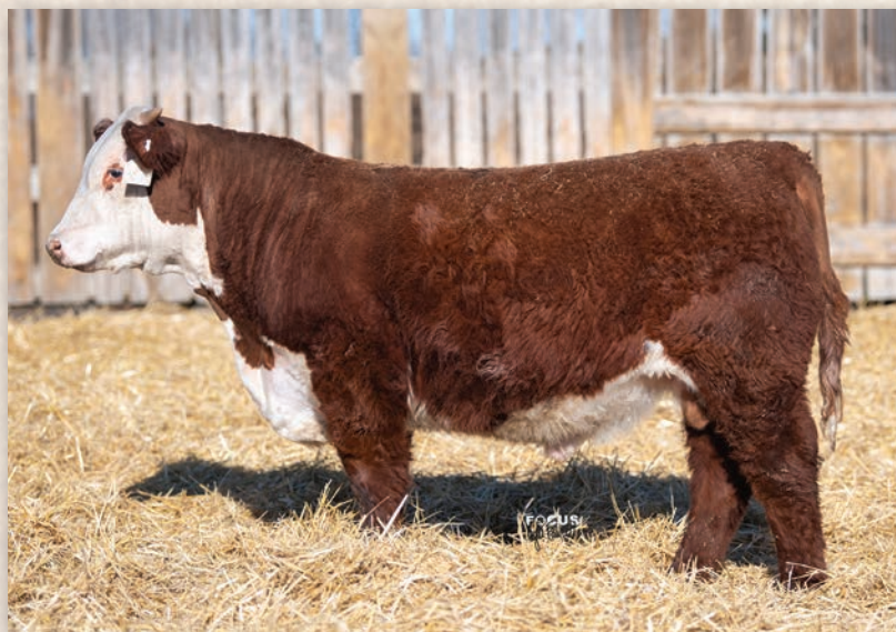
Lot 21 • ECR 9156 DOMINO 1339