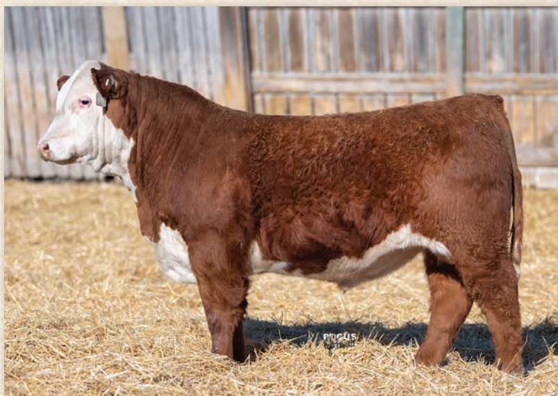
Lot 23 • ECR 11E LINNI 1242

• An Endure daughter sure out did herself here • Powerful bull not only visually but he's got everything you can ask of one on paper, huge spread, carcass, and a huge CHB number