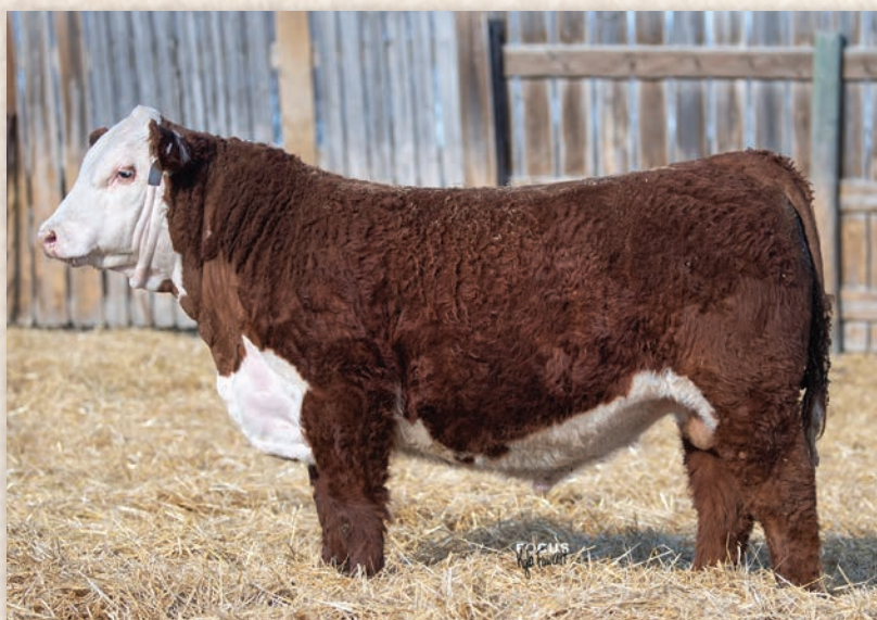
Lot 2 • ECR 8923 ADVANCE 1183