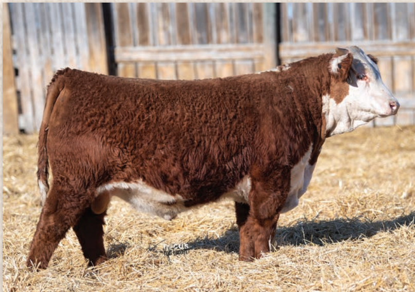
Lot 19 • ECR 8014 ADVANCE 1028