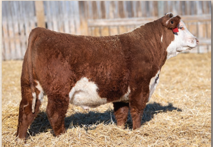
Lot 28 • ECR 9156 ADVANCE 1218