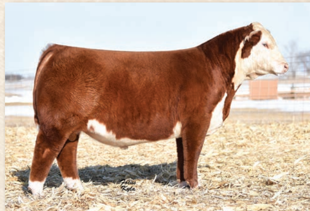
ECR SHAMELESS 7586 ET

If planning to utilize online bidding, please contact Dan or any sale staff prior to the sale in case there happens to be a problem with the internet during the auction.