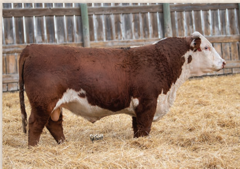
Lot 74 • ECR 5204 DOMINO 0448