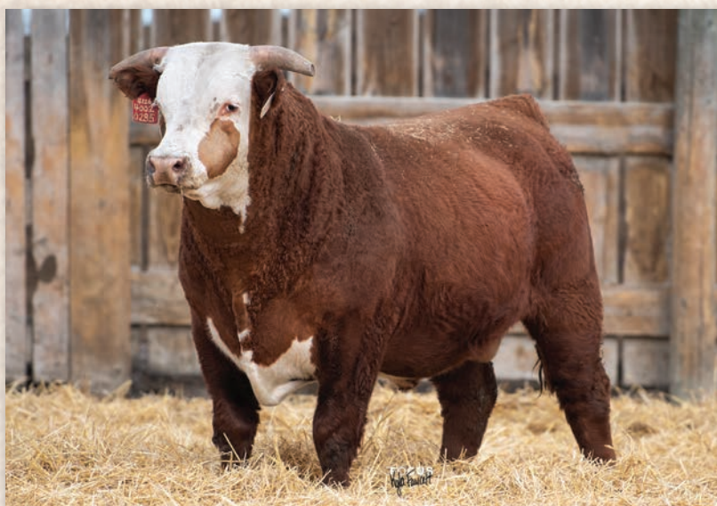
Lot 85 • ECR 4126 ADVANCE 0285

• Stretchy high growth bull begging to stretch out some Angus cows