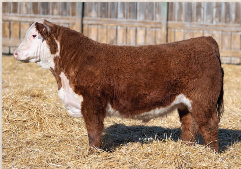
Lot 9 • ECR 238 FORTIFY 1070