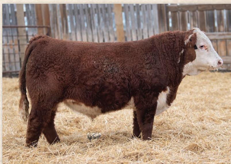
Lot 48 • ECR 238 EXTRA FORTIFY 1052