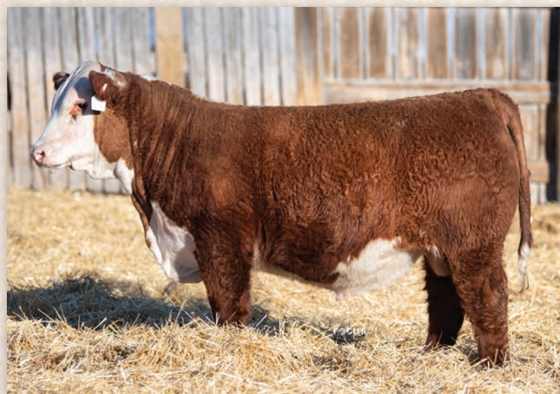
Lot 15 • ECR 238 FORTIFIED 1027