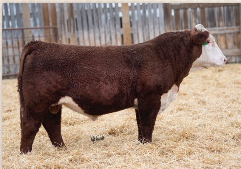
Lot 68 • ECR E326 WHIT 0579

• Dam to be determined by sale day; EPD's will be available sale day