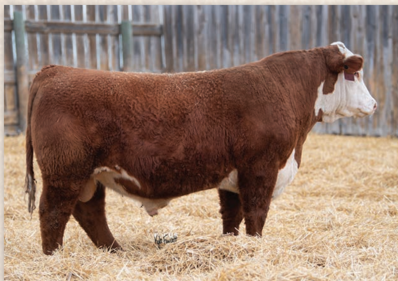
Lot 62 • ECR 7586 SHAMELESS 0709

• Looking to add $$ at the barn? Be sure to find this bull on sale day