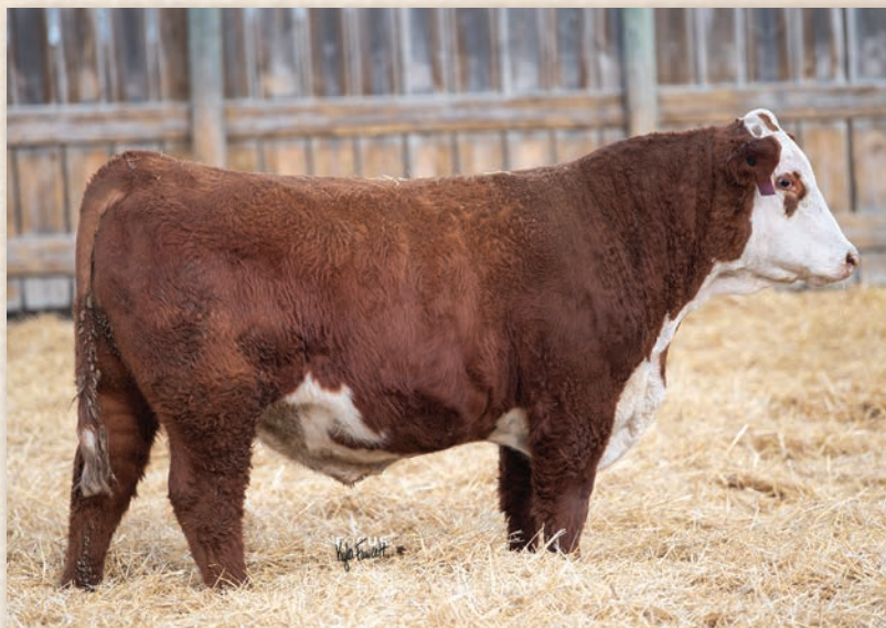
Lot 81 • ECR 7586 SHAMELESS 0503