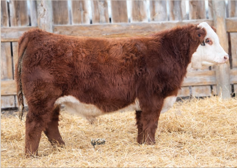
Lot 49 • HDF ECR HIGH ROLLER 1301 ET