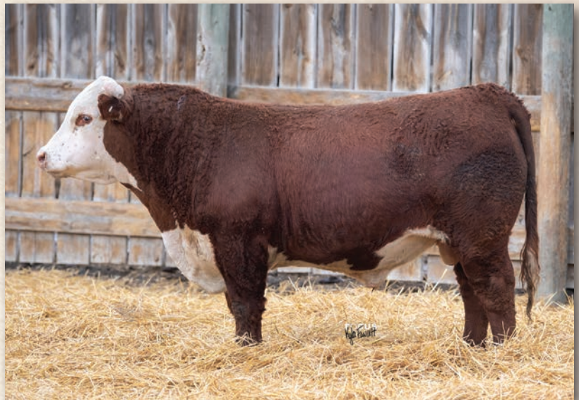
Lot 64 • ECR 4126 ADVANCE 0444