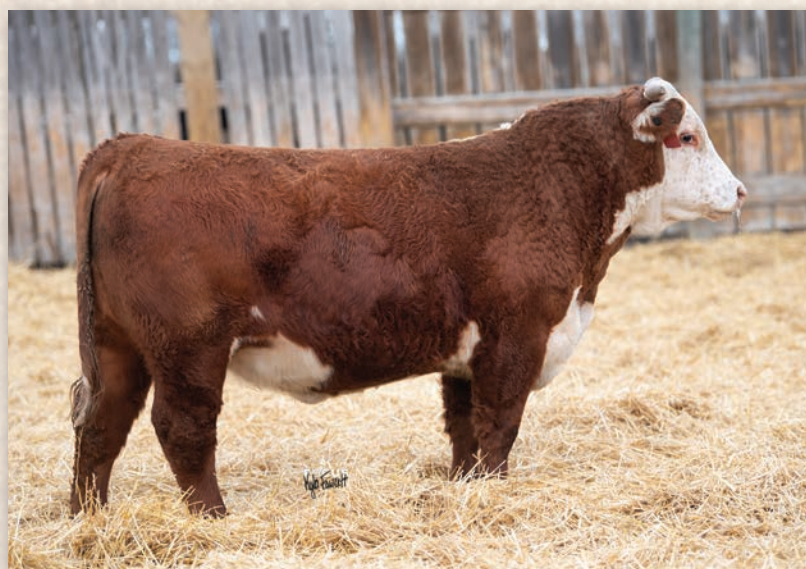
Lot 86 • ECR 5204 DOMINO 0637

• 4126 son out of a direct daughter of Sensation • Low birth, high performance bull who is short marked