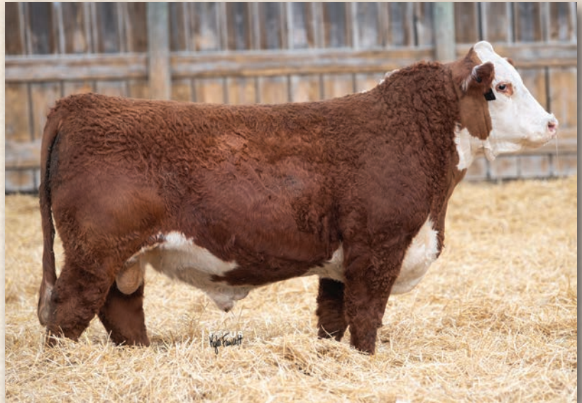
Lot 63 • ECR 173D ENDURE 0421