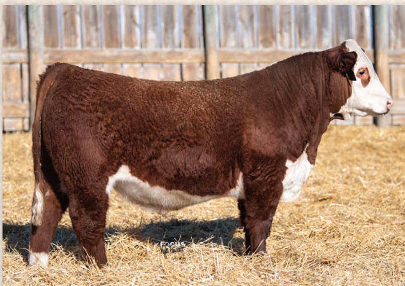
Lot 20 • ECR 173D ENDURE 1193