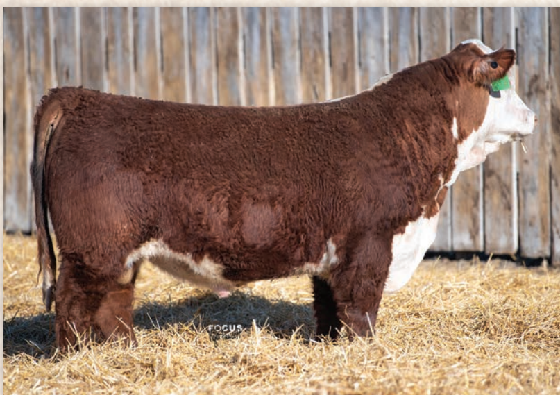
Lot 26 • ECR 11E DOMINO 1062