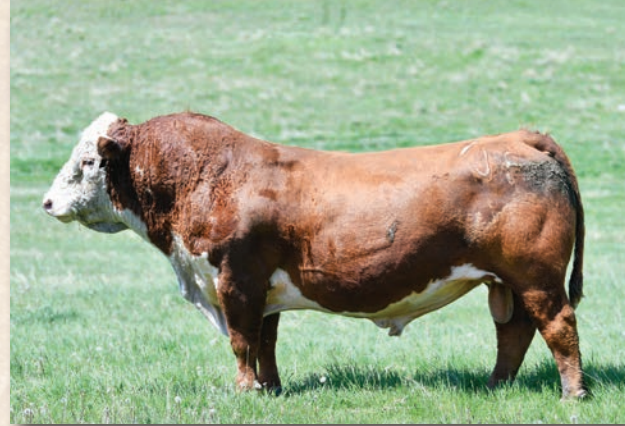
NJW 84B 10W JOURNEY 53D