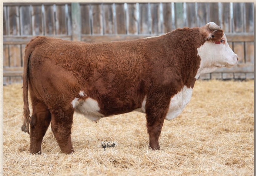
Lot 77 • ECR 4126 ADVANCE 0664