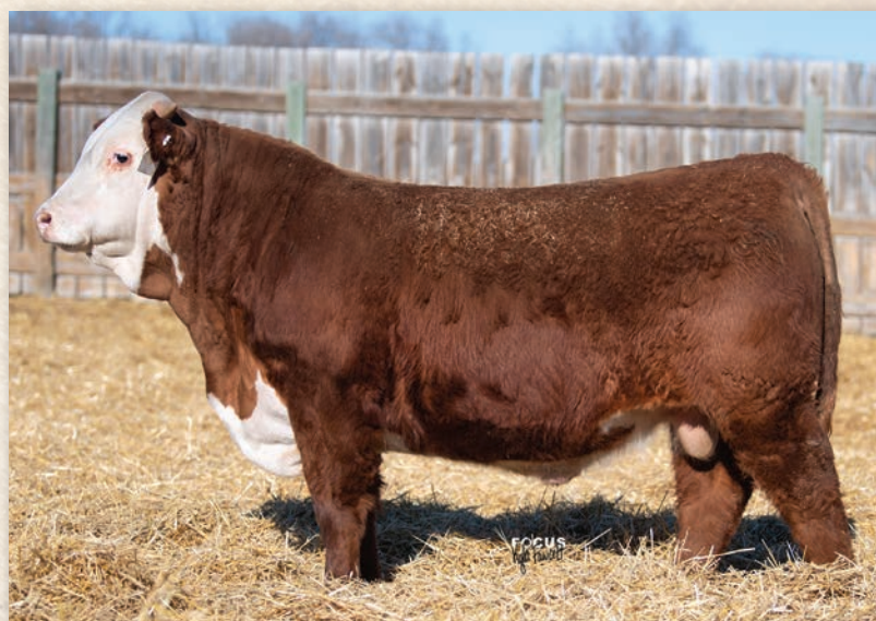
Lot 18 • ECR 4126 ADVANCE 1136