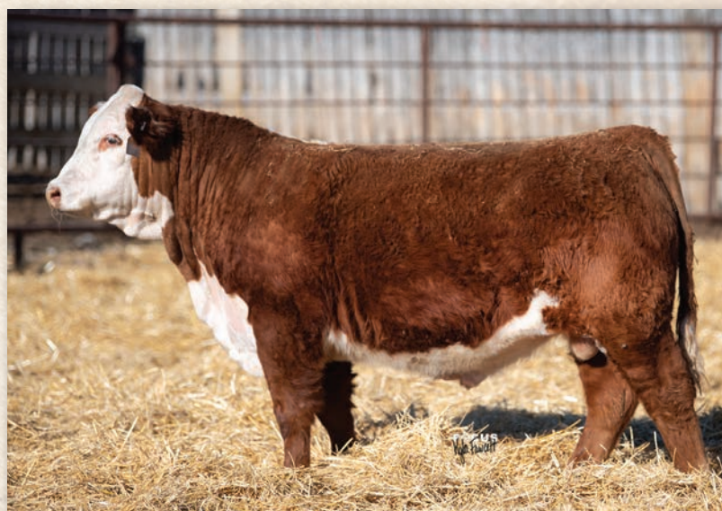
Lot 42 • ECR 173D ENDURE 1202