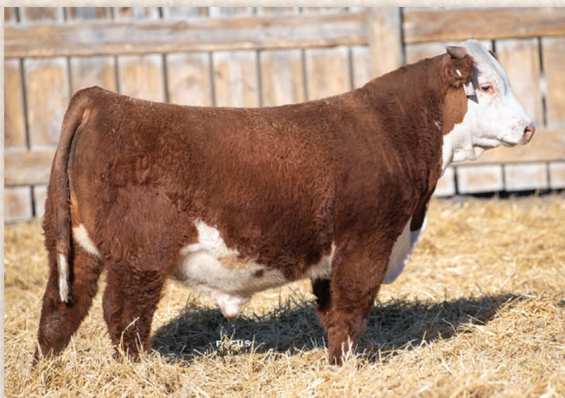
Lot 44 • ECR 8923 ADVANCE 1176