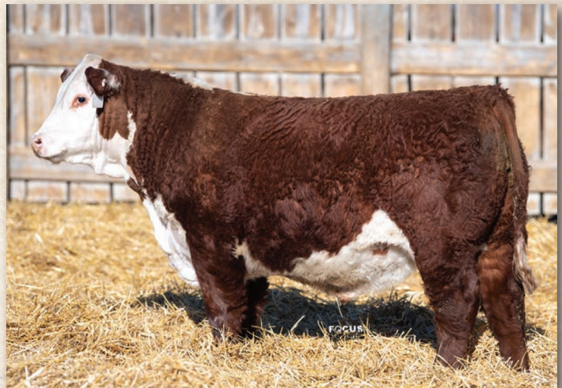
Lot 36 • ECR 173D ENDURE 1275

365 DAY WEIGHT • 1270 lbs. | ADJ SCROTAL 35 • Take a good powered up homo polled bull like Endure and breed him to a good horned cow and you get the good of both worlds • Big stout bull