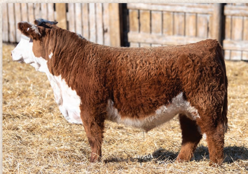
Lot 13 • ECR 8923 DOMINO 1162