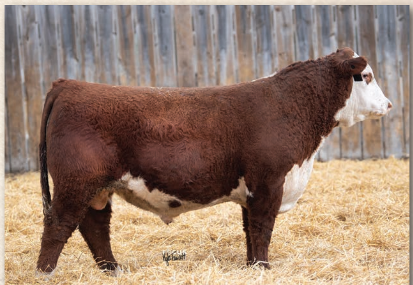
Lot 95 • ECR 173D ENDURE 0472