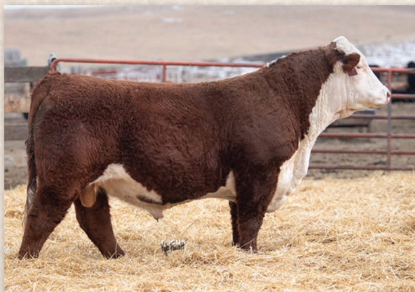
Lot 98 • ECR 7586 DICK TRACY 0396

• Short marked horned bull that scanned with added muscle and IMF • Has muscle shape, length and width