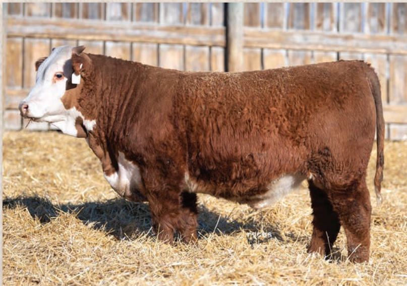
Lot 25 • ECR 4126 ADVANCE 1269