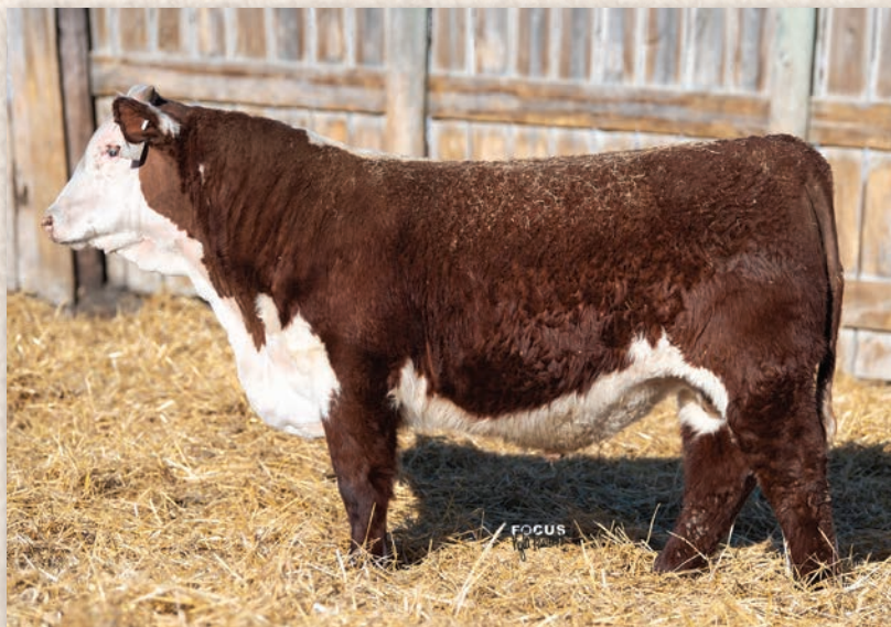
Lot 43 • ECR 9156 ADVANCE 1215