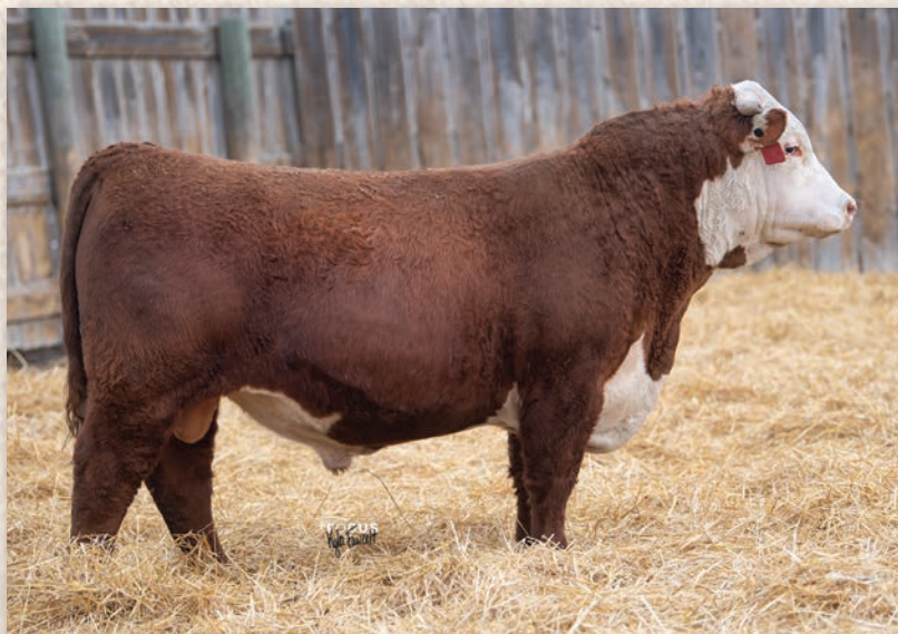
Lot 72 • ECR 4126 ADVANCE 0358