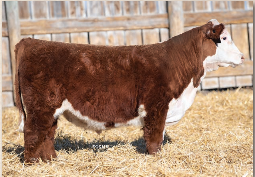
Lot 34 • ECR 173D ENDURE 1262

365 DAY WEIGHT • 1204 lbs. | ADJ SCROTAL 36 • Weaning weight is in the top 3% of the breed