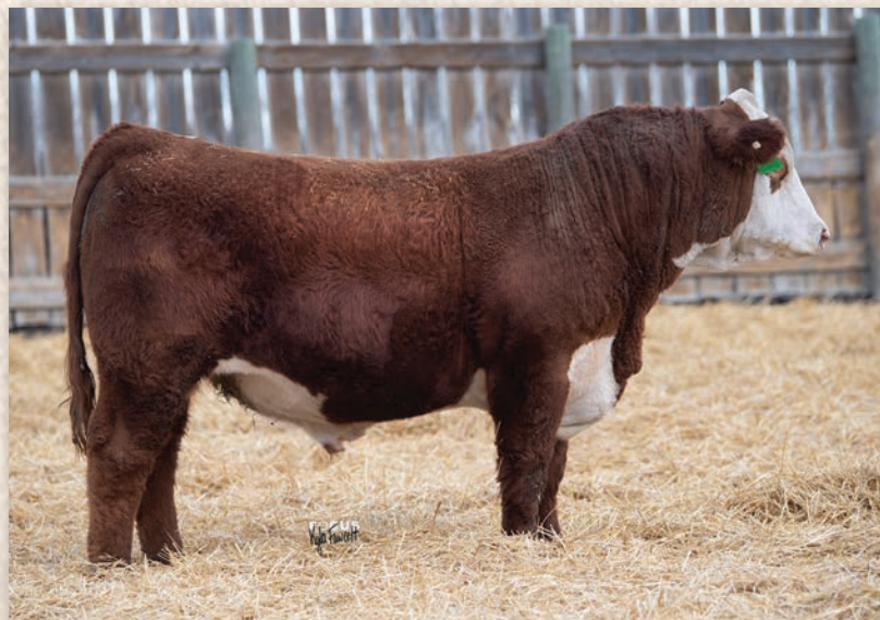
Lot 78 • ECR 53D JOURNEY 0343