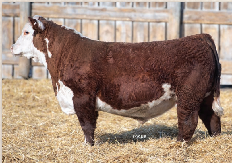
Lot 45 • ECR 238 HARRY 1058