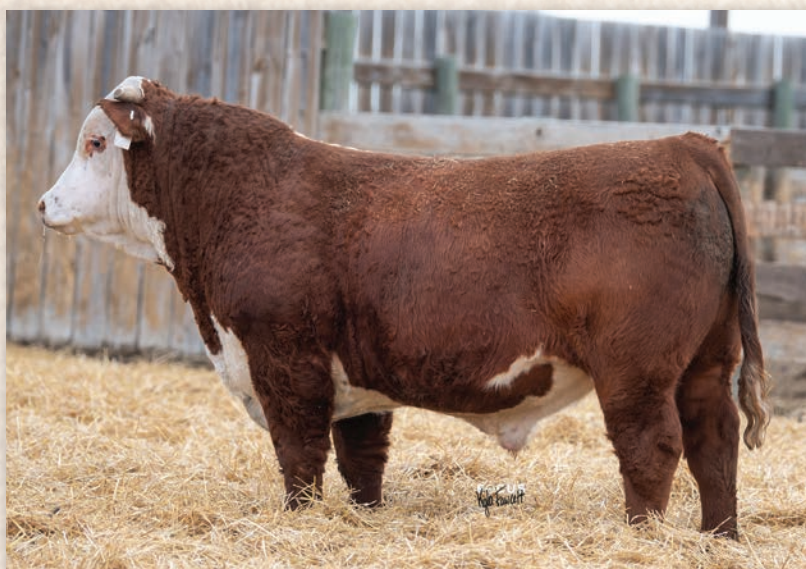
Lot 73 • ECR 4126 ADVANCE 0620