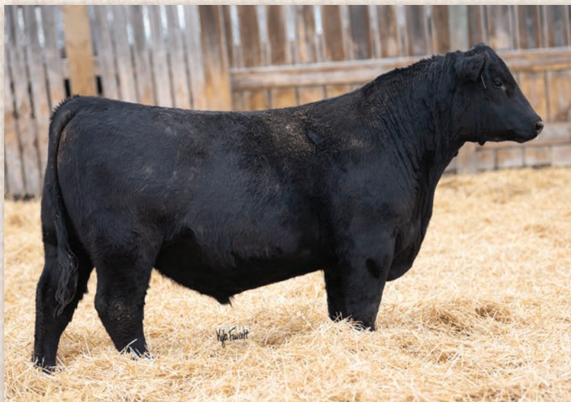
Lot 96 • ECR EXTENSION 035