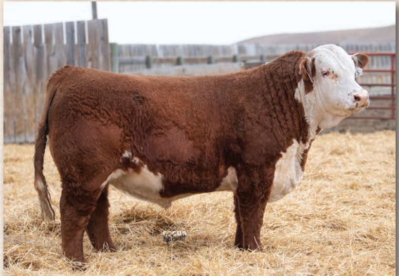
Lot 93 • ECR 7586 SHAMELESS 0445