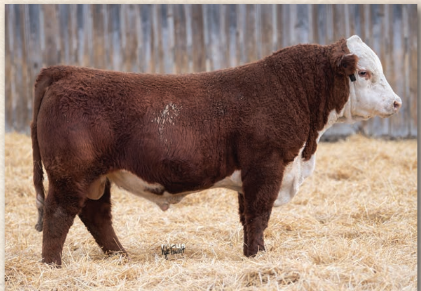
Lot 71 • ECR 53D JOURNEY 0231

• Well rounded individual that has a good look and reads good on paper