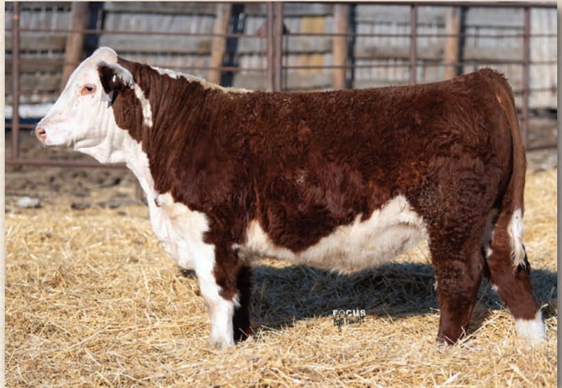
Lot 35 • ECR SPH VICTOR 113

365 DAY WEIGHT • 1266 lbs. | ADJ SCROTAL 36 • Dark red stout rascal with a real nice set of EPD's all the way from BW to YW to CHB, its all good