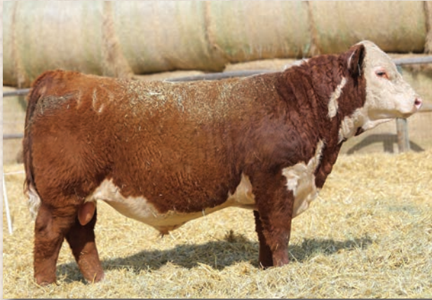
NJW 84B 4040 FORTIFIED 238F