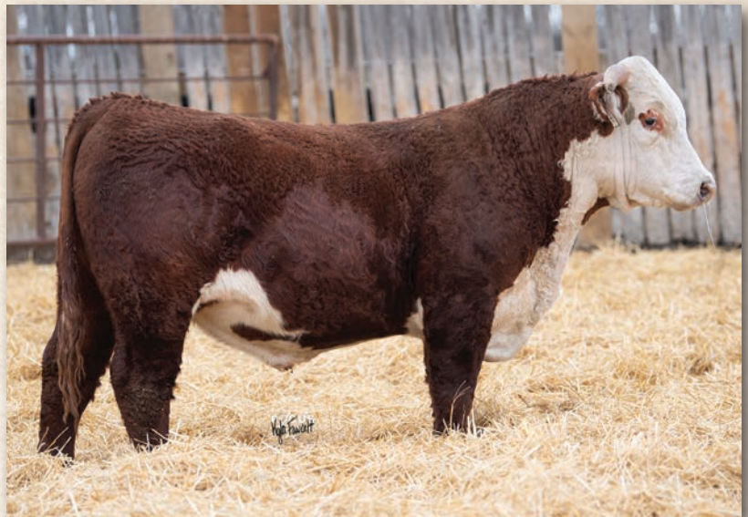
Lot 58 • ECR 326 WHITMORE 0566