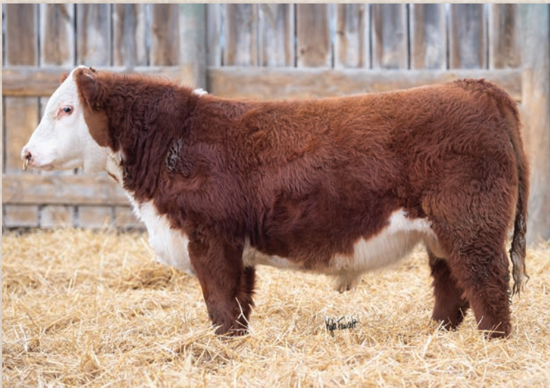
Lot 50 • ECR HIGH ROLLING BOB 1326 ET