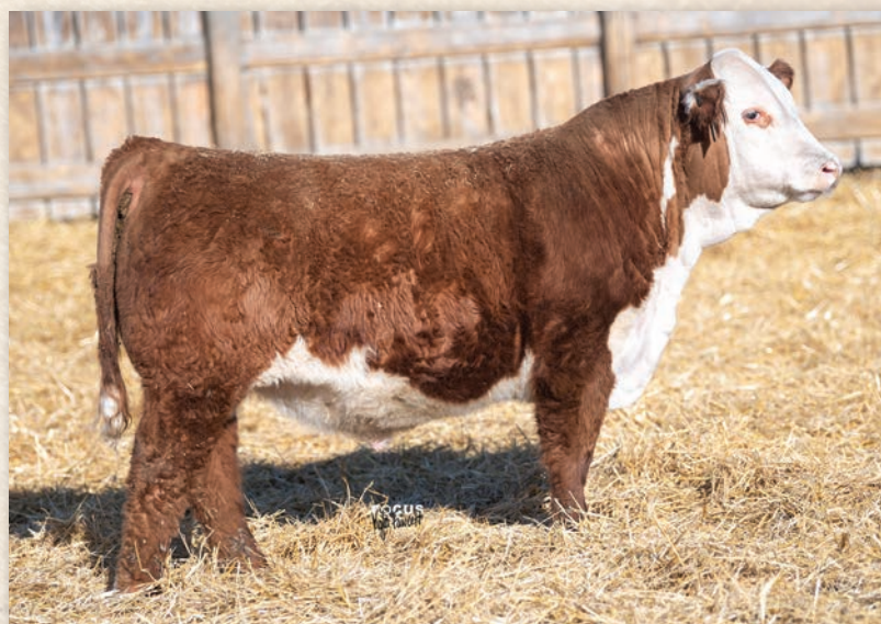
Lot 12 • ECR 238 FORTIFY 1069