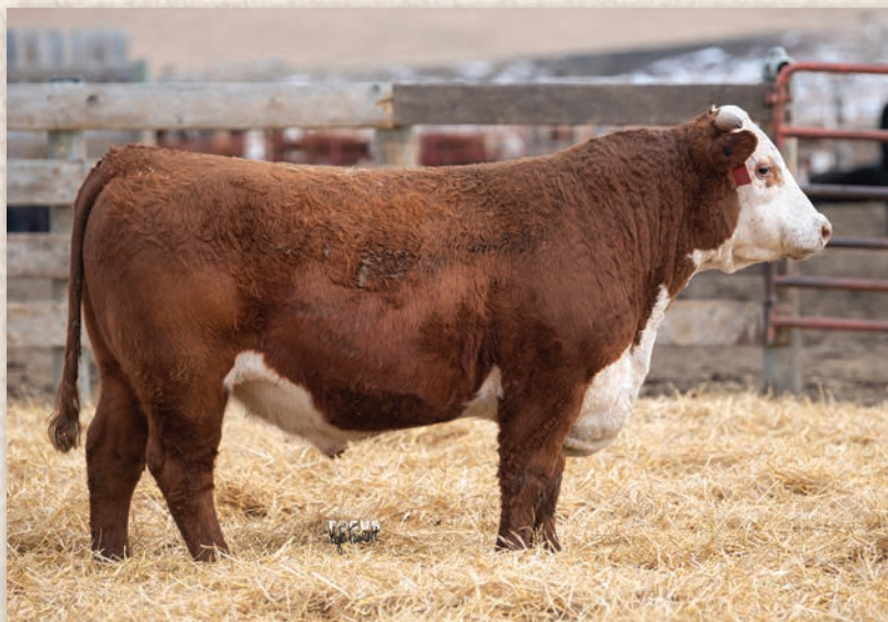
Lot 90 • ECR 5204 DOMINO 0584