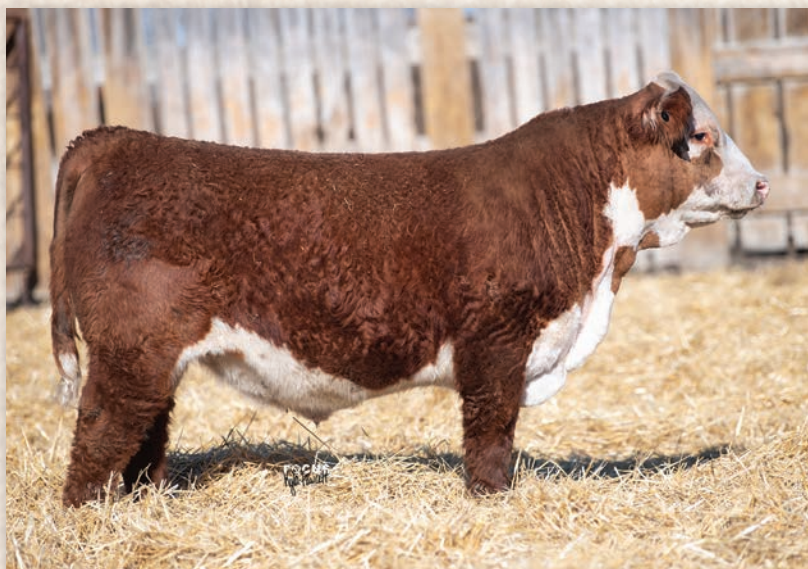
Lot 32 • ECR 238 EXCEL FORTIFY 1008