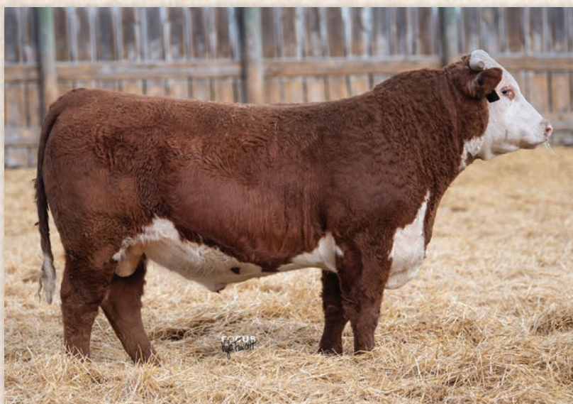
Lot 97 • ECR 8014 ADVANCE 0539

• Here is a LONG bodied Angus bull and that seems to be getting harder to find