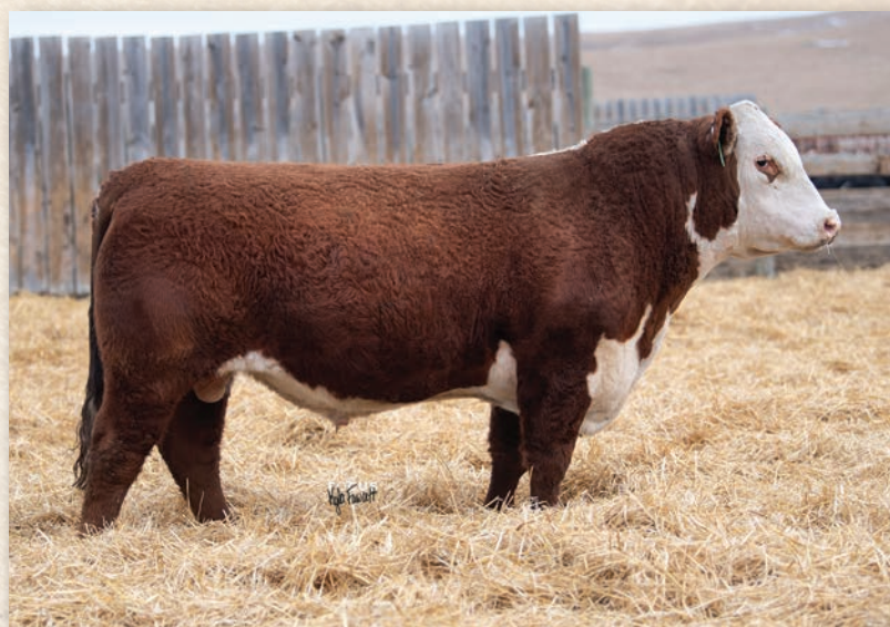
Lot 83 • ECR 238 ENDURE 0031