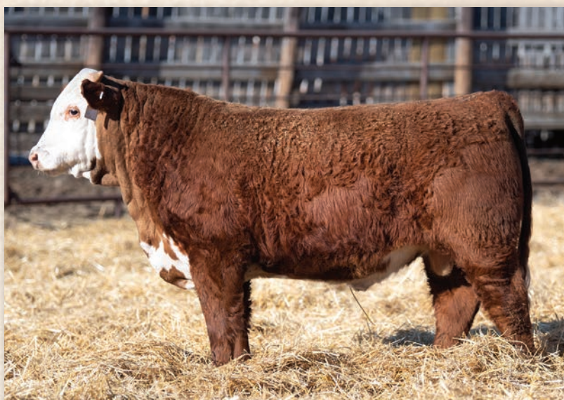
Lot 46 • ECR 4126 ADVANCE 1138