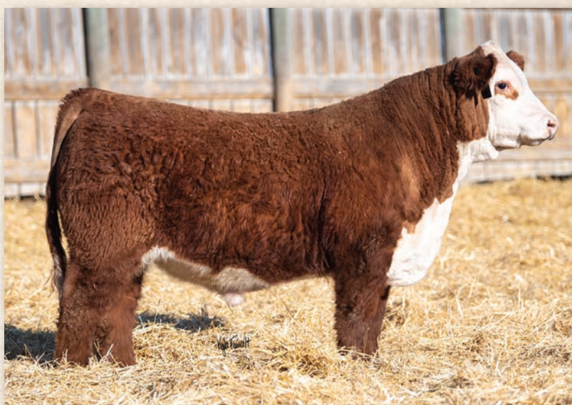
Lot 47 • ECR 238 EXTRA FORTIFY 1057