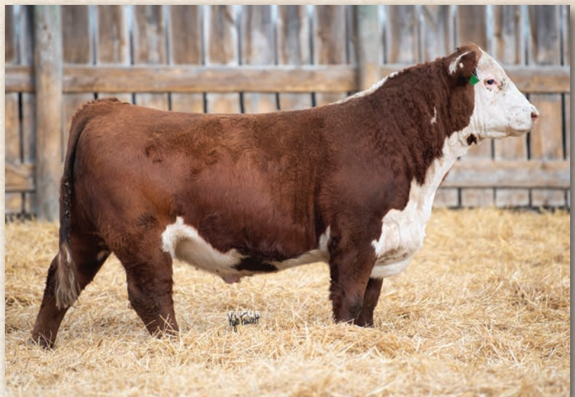
Lot 76 • ECR 173D ENDURE 0456