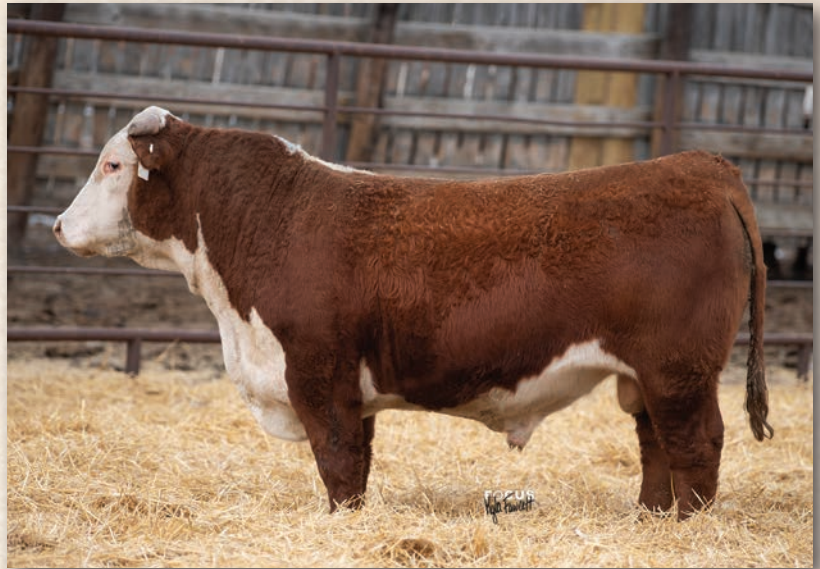
Lot 69 • ECR 8055 DOMINO 0586

• Top end horned bull with a 114% weaning ratio