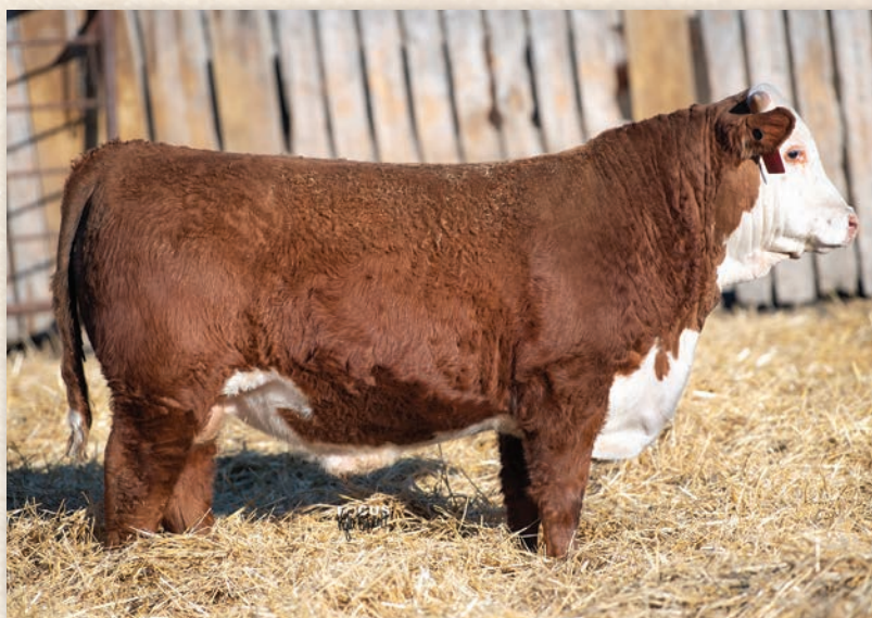
Lot 5 • ECR 4126 ADVANCE 1154