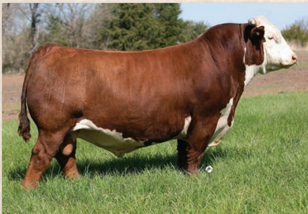
ECR 628 IVYS ADVANCE 8923 ET "SANCHO"