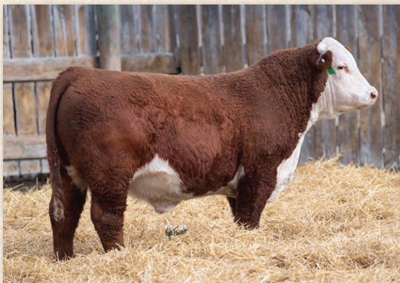
Lot 82 • ECR 4126 DOMINO 0657