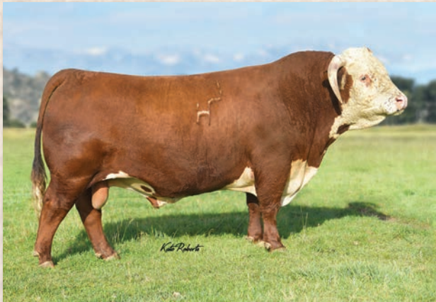
HH ADVANCE 4126B