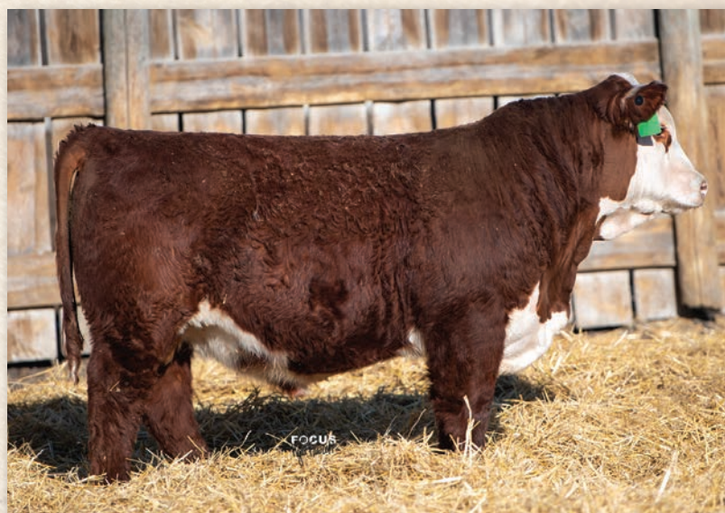
Lot 6 • ECR 4013 PAYTON 1209