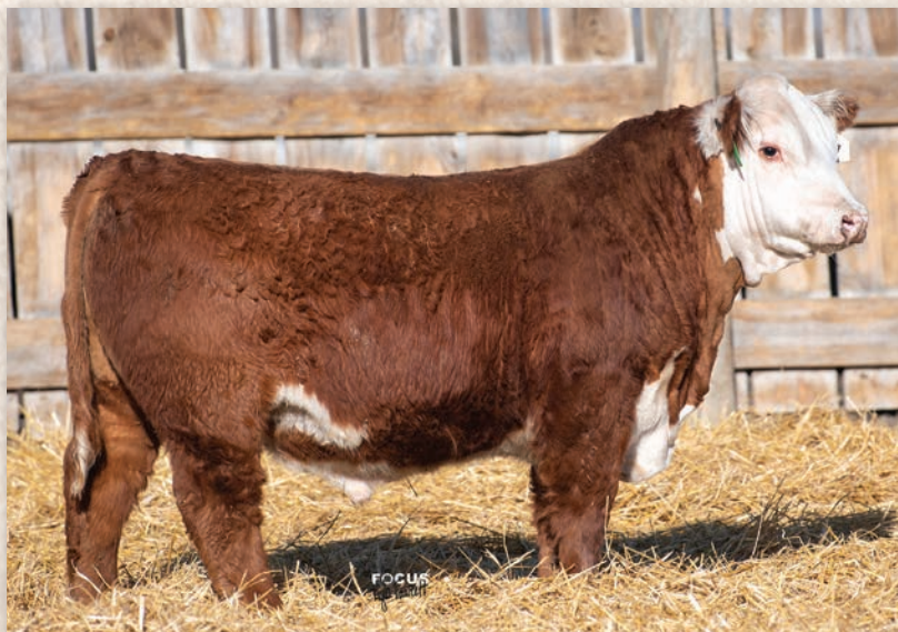
Lot 37 • ECR 11E JOE 1232