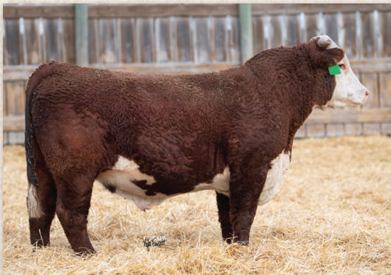
Lot 84 • ECR 8014 ADVANCE 0520