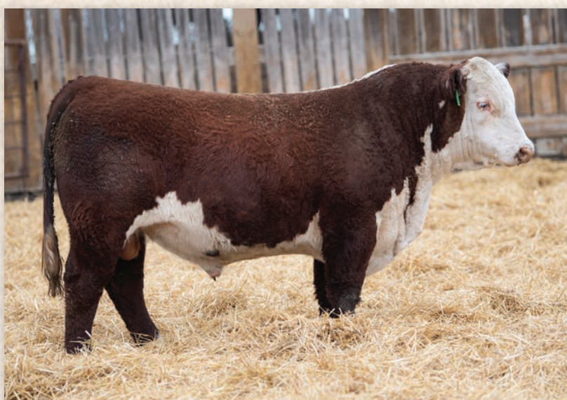
Lot 91 • ECR 7005 LUCKY 0692