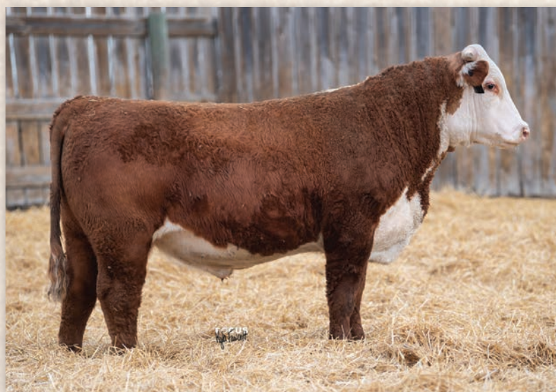
Lot 56 • ECR 6305 BRAVO 0521