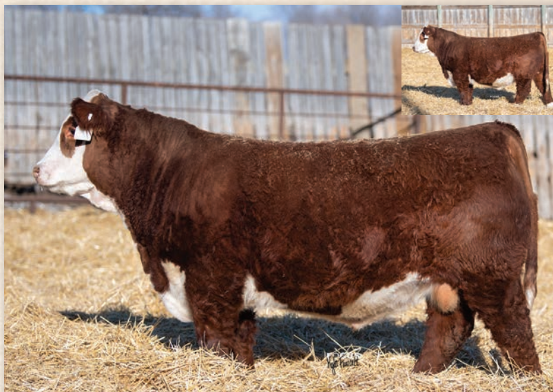
Lot 4 • ECR 173 ENDURE 1248