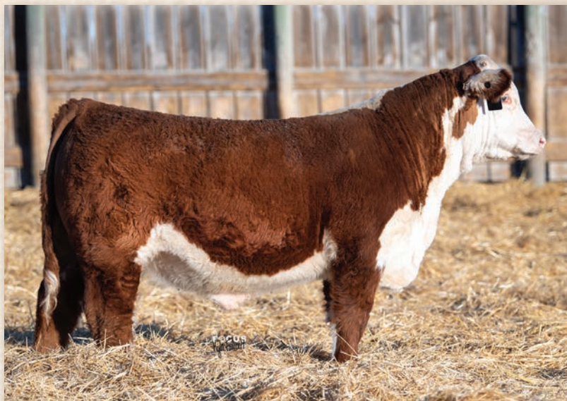
Lot 40 • ECR 53D JOURNEY 1054