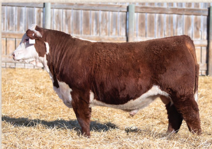
Lot 8 • ECR 173D ENDURE 1194