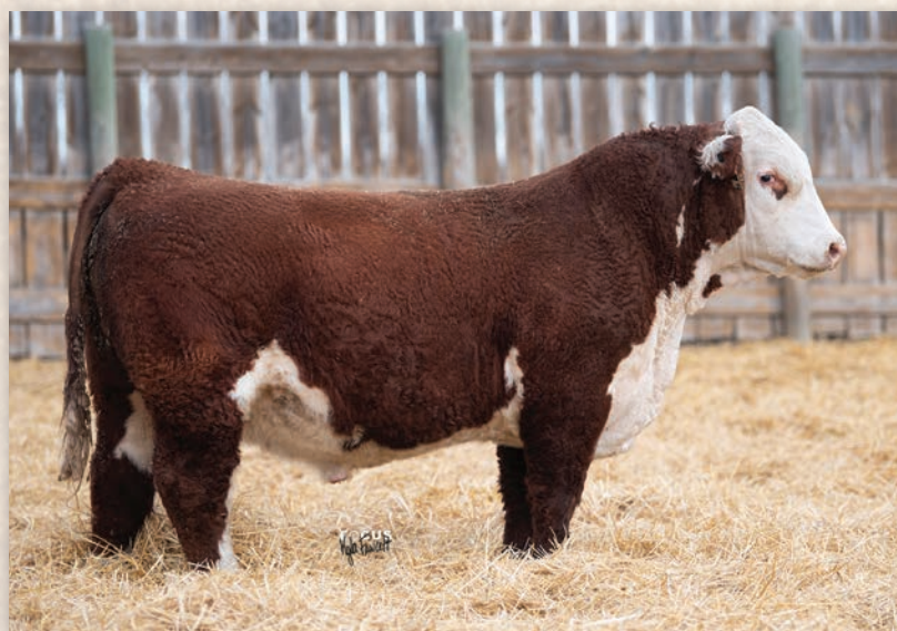
Lot 92 • ECR DUSTY GUSTY 0385 ET