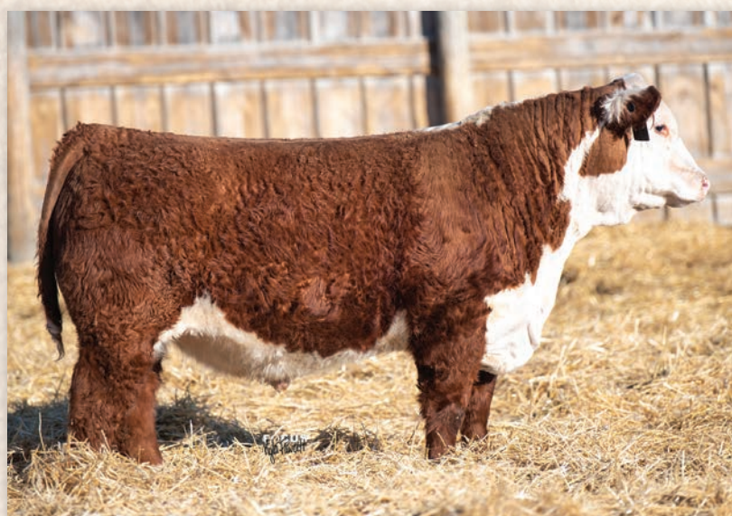
Lot 14 • ECR 238 FORTIFIED 1002