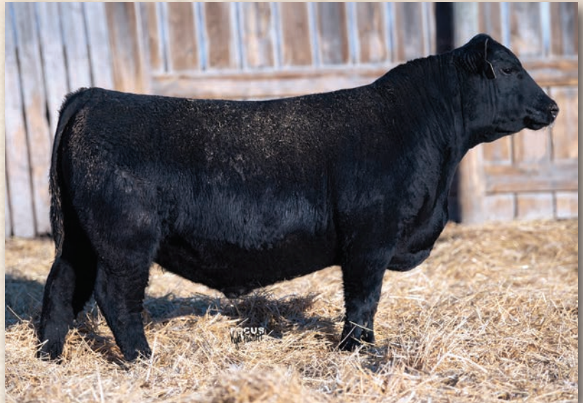
Lot 52 • ECR RENOWN 107

• Long, deep bodied bull out of a cow that's older than the hills you drove through to get here