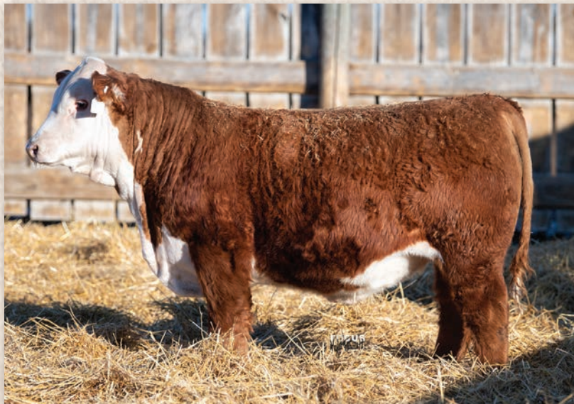
Lot 31 • ECR 11E BOBBY SUE 1217