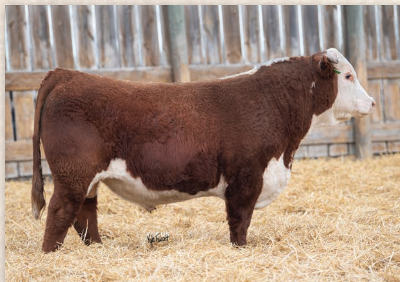
Lot 80 • ECR 6017 DOMINO 0681