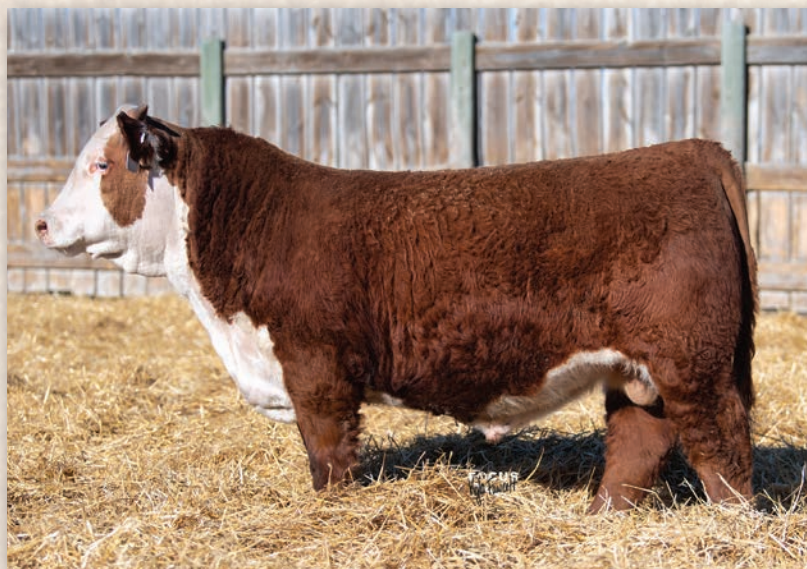
Lot 27 • ECR 1089