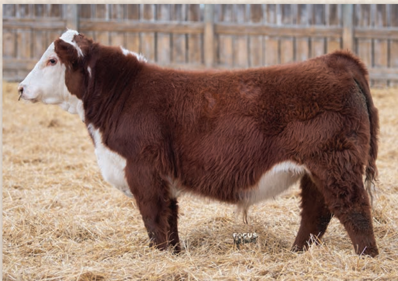
Lot 51 • ECR 7586 SHAMELESS 1570