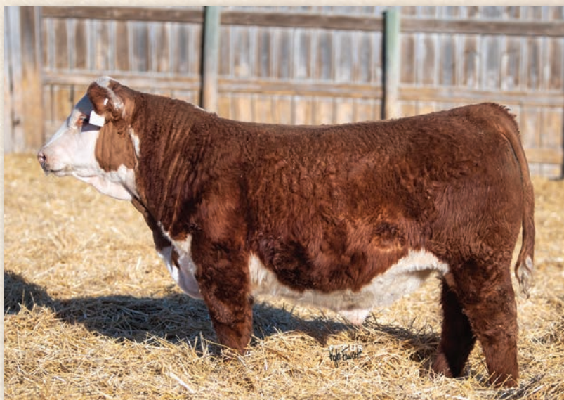
Lot 17 • ECR 238 FORTIFY 1038