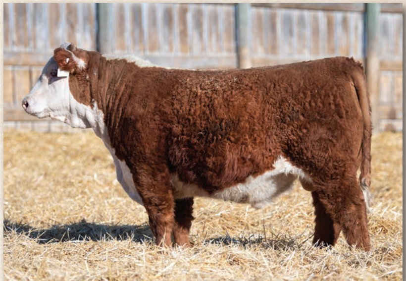
Lot 53 • ECR 8014 ADVANCE 1091

• Moderate birth weight pedigree • Soggy, easy fleshing bull with plenty of growth and performance