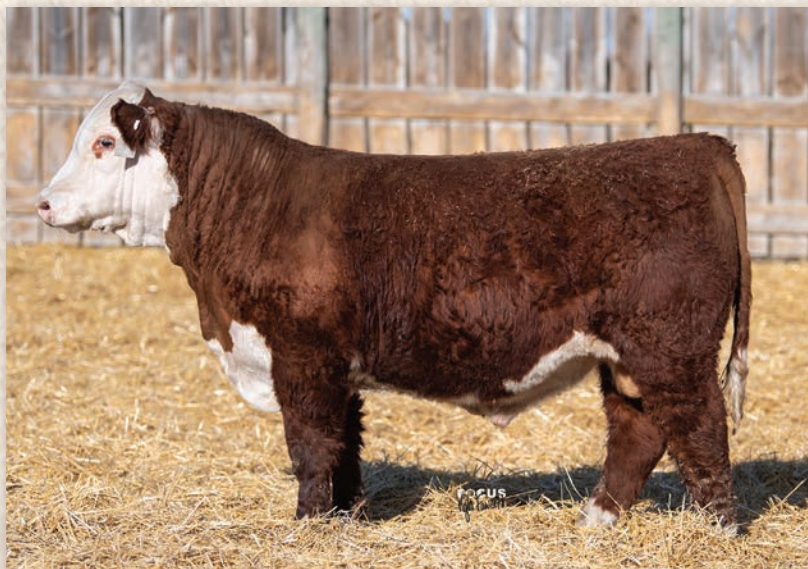
Lot 7 • ECR 4013 JOEY 1295