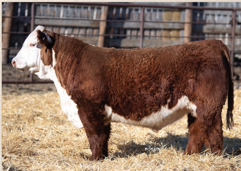
Lot 16 • ECR 8923 ADVANCE 1159