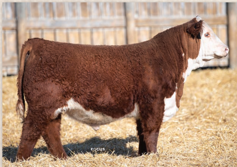
Lot 3 • ECR 238 FORTIFY 1033