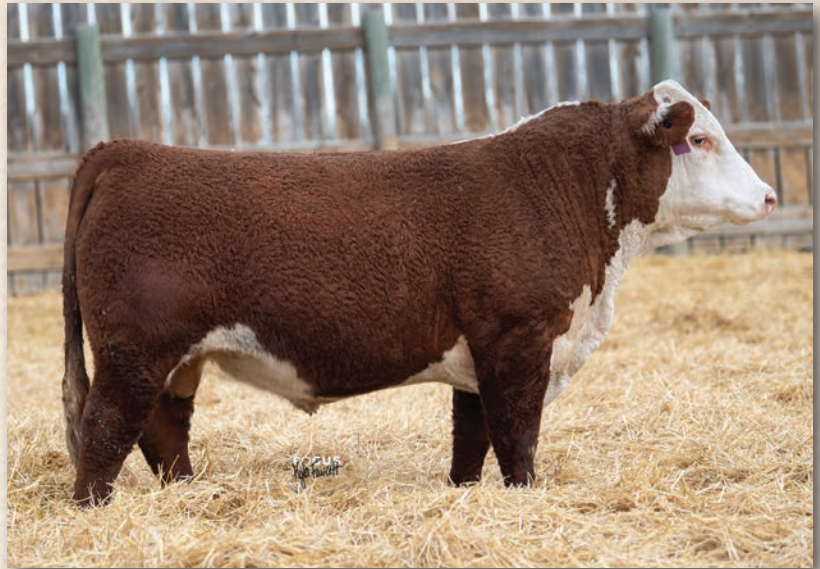
Lot 57 • ECR 738 SLEEP ON 0548