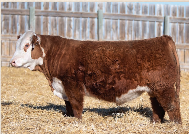
Lot 10 • ECR 8454 LAMBO 1103