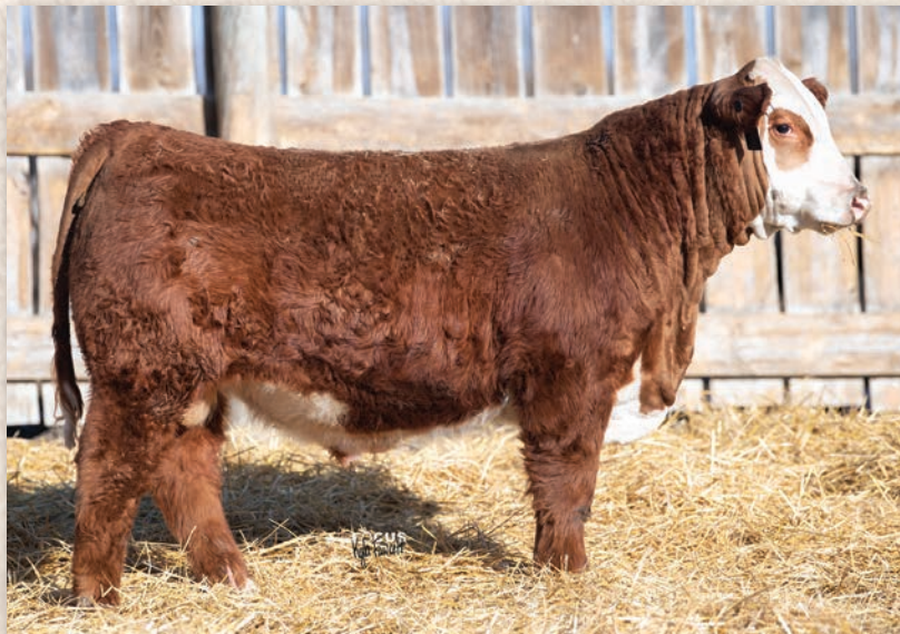
Lot 1 • ECR 11B PERFECTO 1001