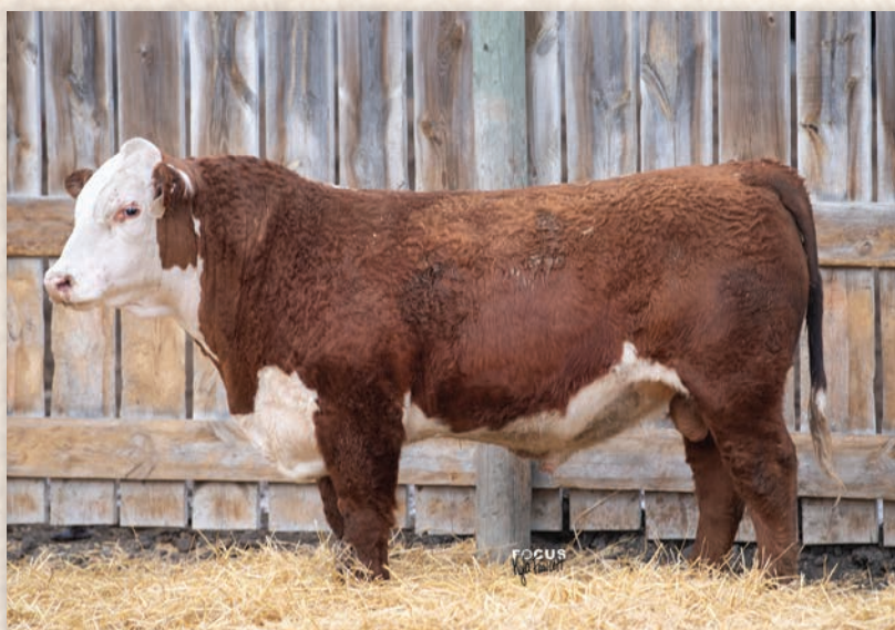
Lot 67 • ECR 0470