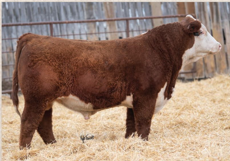
Lot 54 • ECR 53D JOURNEY 0595