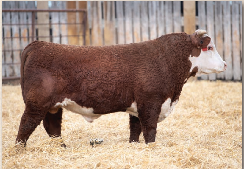
Lot 75 • ECR 4126 ADVANCE 0365