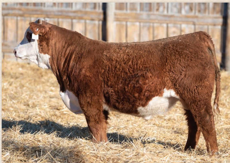
Lot 41 • ECR 8923 ADVANCE 1226