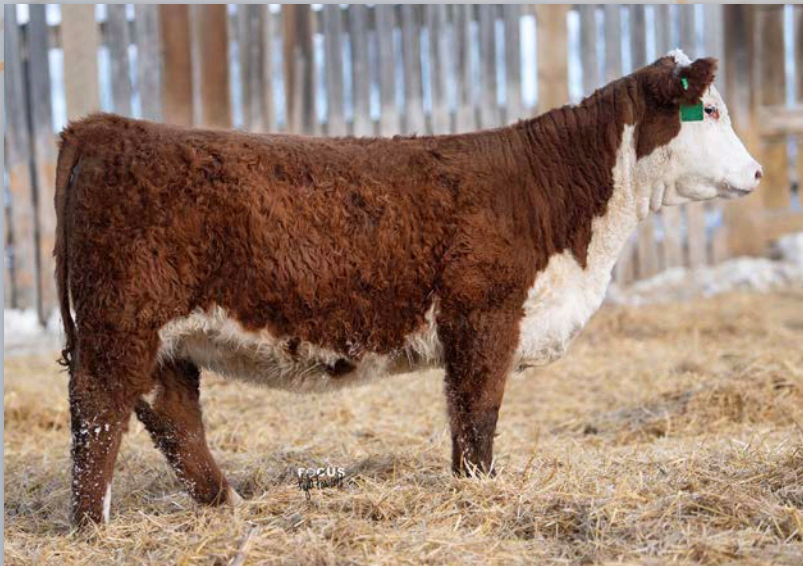
Lot 9 • ECR SANCHOS FANCY 201 ET

I've been watching this heifer since day one. All summer I kept questioning if it was worth it to sell her in October or if she needed to stay here. All of the heifers in the fall sale are ET calves and mated specifically to be junior projects. This one being a natural calf gave me another excuse to keep her. Her mother has been marked as a future donor as long as she's able to prove herself as a cow and her first calf puts her on track to do just that. Now she's on this sale. Don't miss this opportunity. She won't be your biggest cow but I bet she will be one of your most powerful producers.