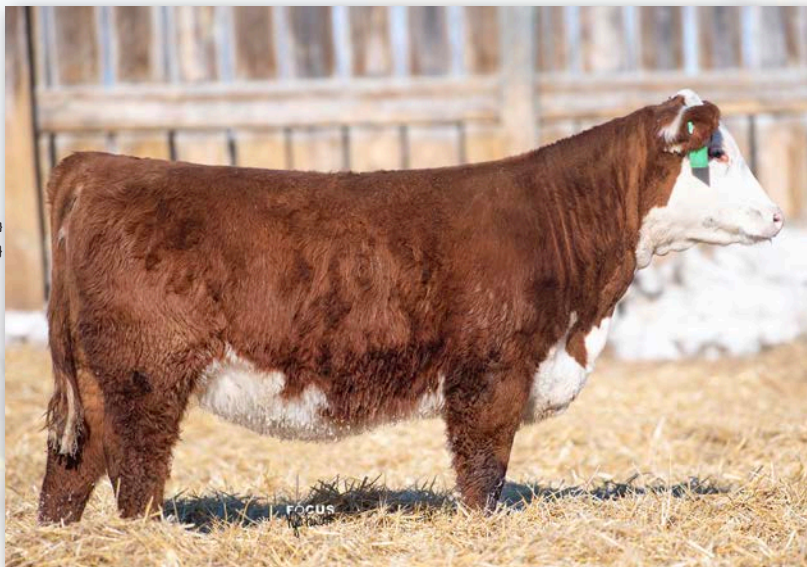
Lot 4 • ECR 5707 MISS EXTRA 2525

Moderate heifer out of Heston with a lot of eye appeal. Big bodied, long fronted and super flexible on the move. Be sure to notice Undisputed and 88X on her bottom side.