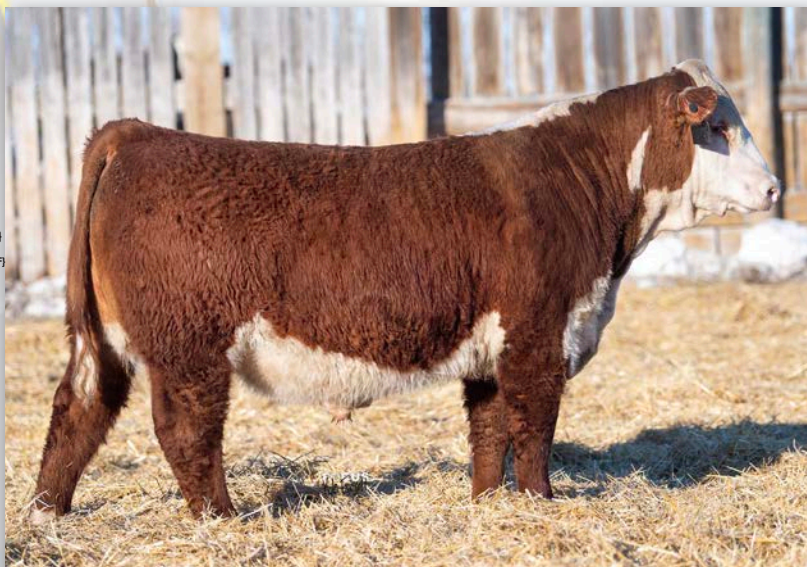
Lot 40 • ECR 9170 HEY JOE 2316