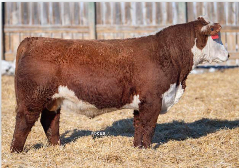
Lot 97 • ECR ADVANCE 1699