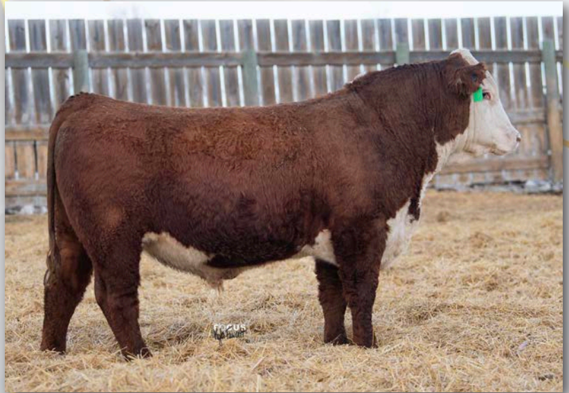
Lot 110 • ECR 4013 JOEY 1517