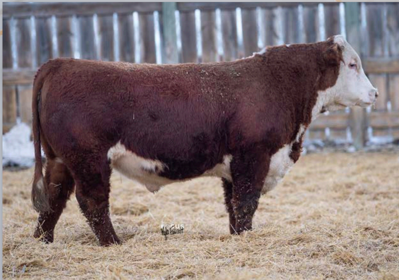
Lot 120 • ECR 1628 ADVANCE 1469