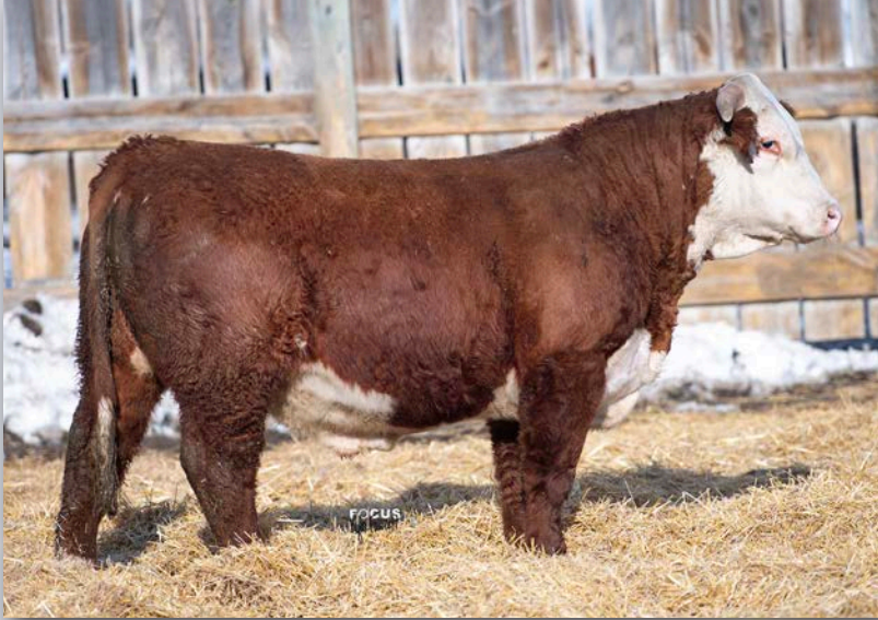
Lot 24 • ECR 813 DOMINO 1542