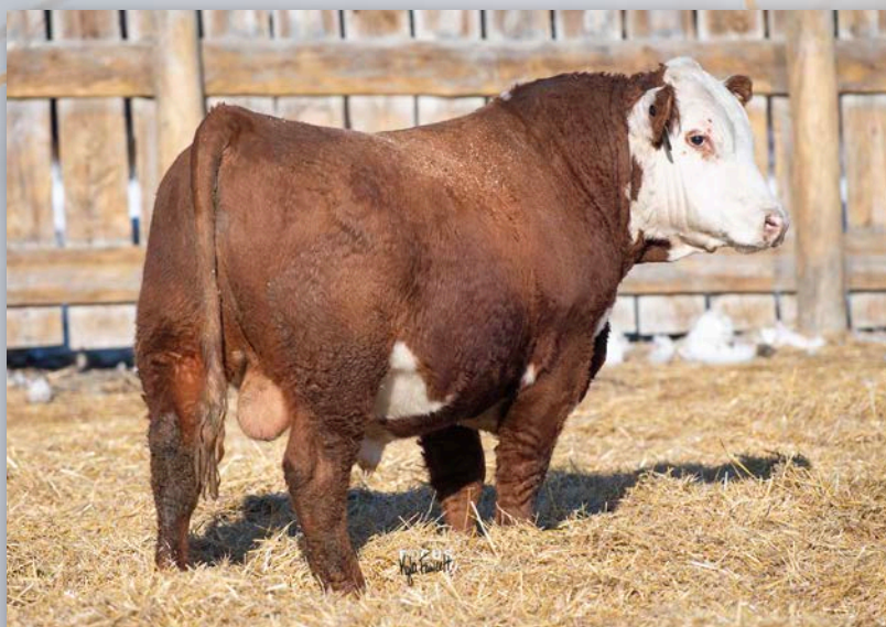
Lot 90 • ECR 893 ADVANCED REDEEM 1748