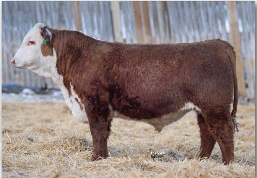
Lot 33 • ECR 0025 ADVANCE 2132 ET