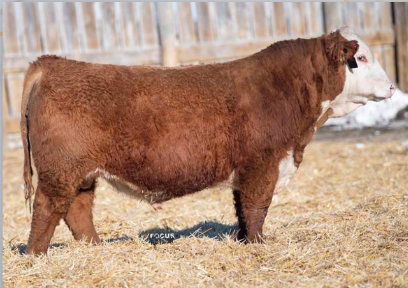
Lot 74 • ECR 9170 EARLY RISER 2072