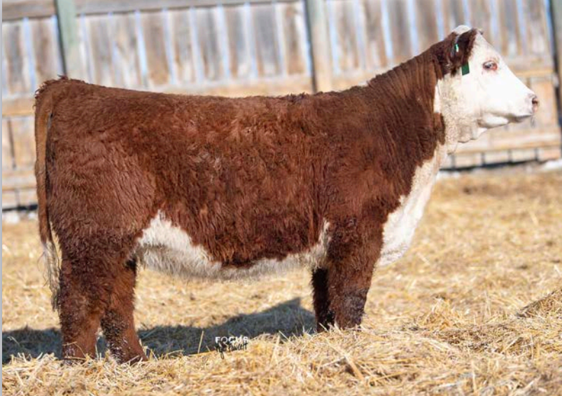
Lot 25 • ECR 326 LADY WHIT 2695