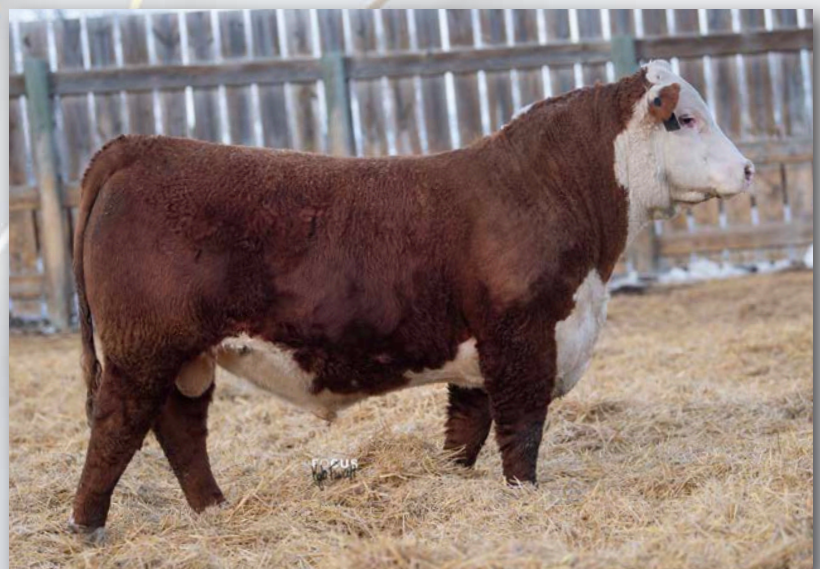
Lot 93 • ECR 8014 ADVANCE 1336