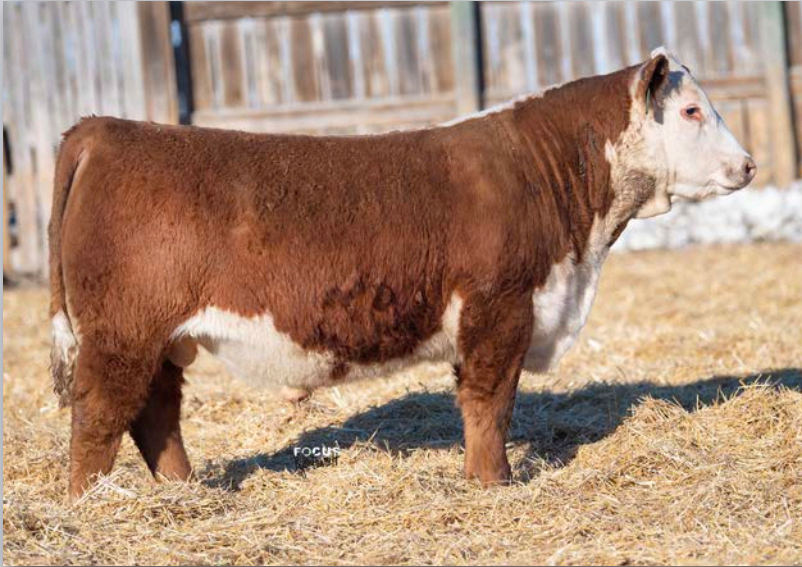
Lot 49 • ECR 901 VICTOR 2252