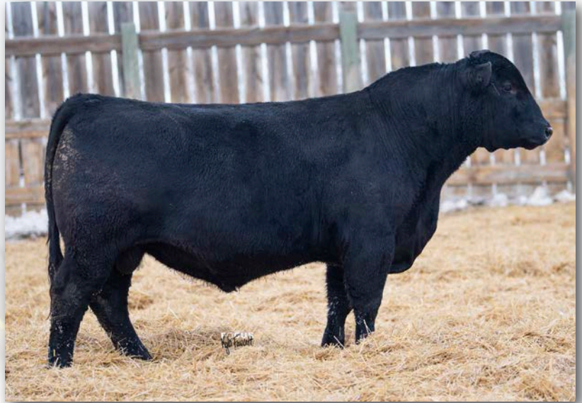
Lot 85 • ECR RENOWN 121