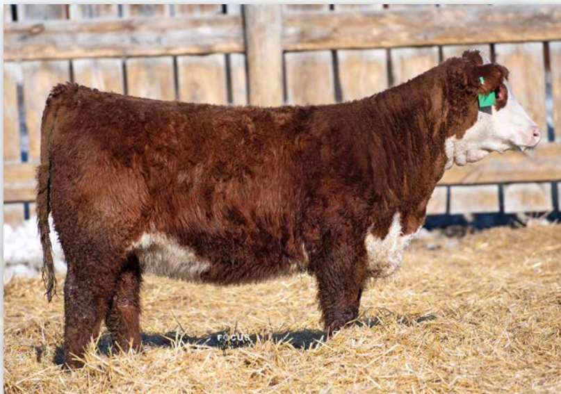
Lot 28 • ECR 6305 DOMINETTE 2463

Sensation granddaughter that is short marked and easy fleshing. Added pigment and dark colored. Middle framed heifer that has all the bells and whistles that lead us to believe she will be an exceptional cow.