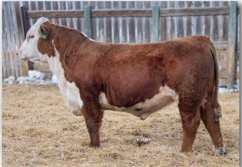
Lot 103 • ECR 813 TRUSTED GENETICS 1644

• Heavy bull with great spread on paper with added length in a trim, powerful package