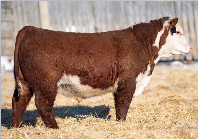
Lot 43 • ECR 238 FORTIFIED 2042