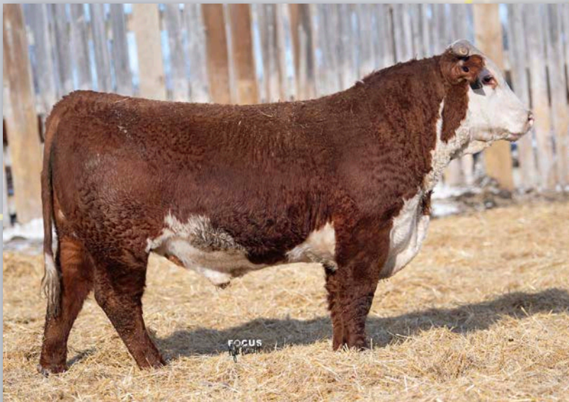
Lot 107 • ECR 8014 ADVANCE 1288