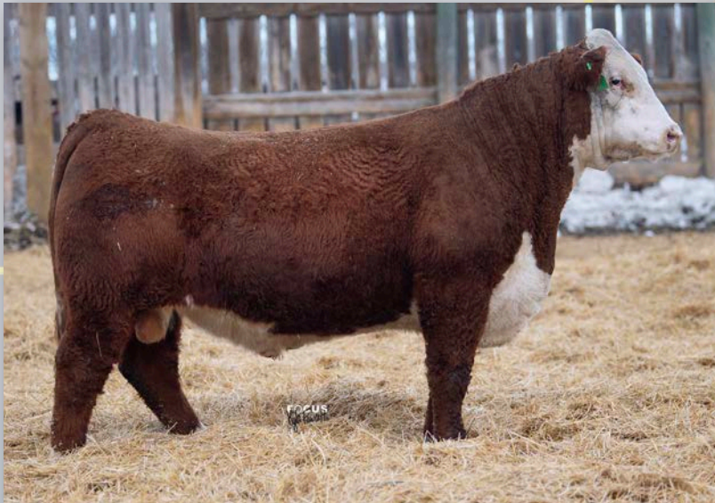
Lot 83 • ECR SPH 13G ADVANCED 108