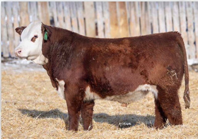
Lot 45 • ECR 9170 EARLY RISER 2212