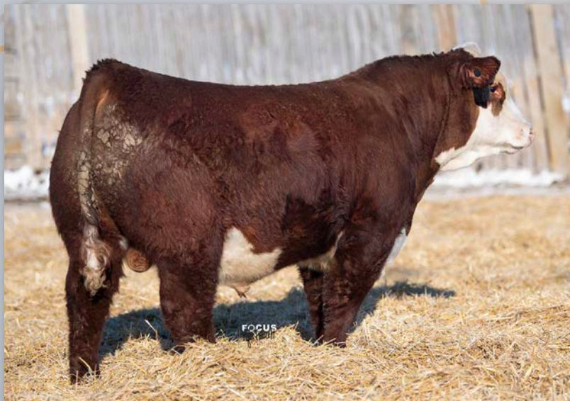
Lot 68 • ECR 9170 EARLY RISER 2127

• Heifer safe horned bull with a lot to offer • Below average BW with above average weaning weight ratio • Pedigree loaded with standout females on the bottom side