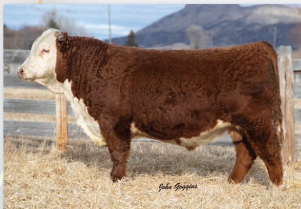
CL 1 DOMINO 0136H