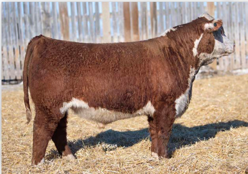
Lot 57 • ECR 238 FORTIFIED 2044