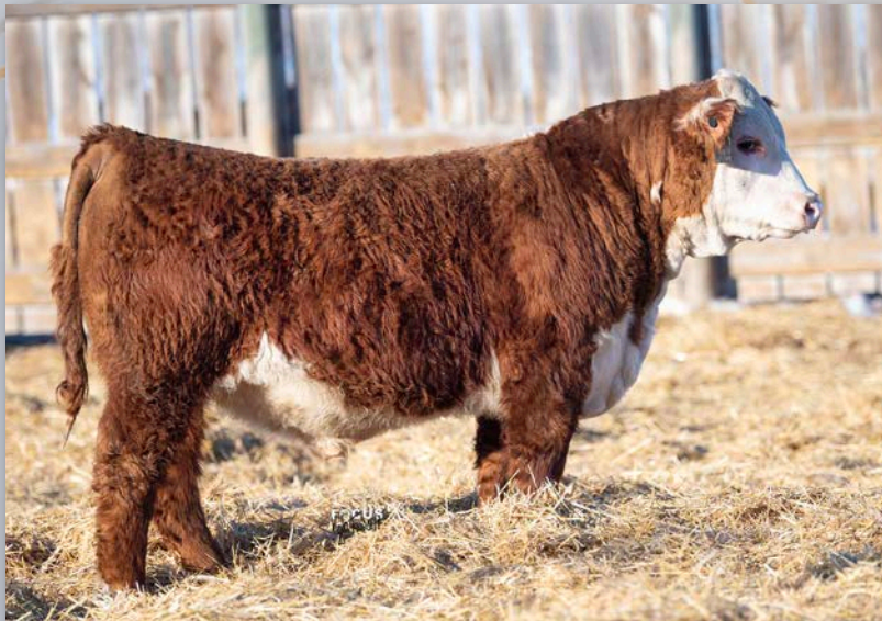
Lot 44 • ECR 238 FORTIFY 2157