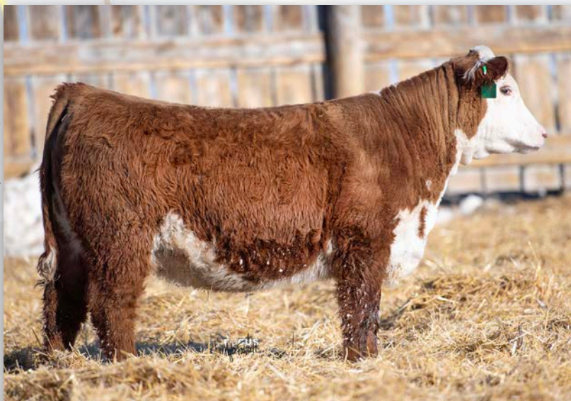
Lot 29 • ECR 53D MISS JOURNEY 2076

She's got plenty of shape and power. More likely to be a moderate cow than a big cow that converts feed to gain easily. She's sure to make a great cow and last a long time.