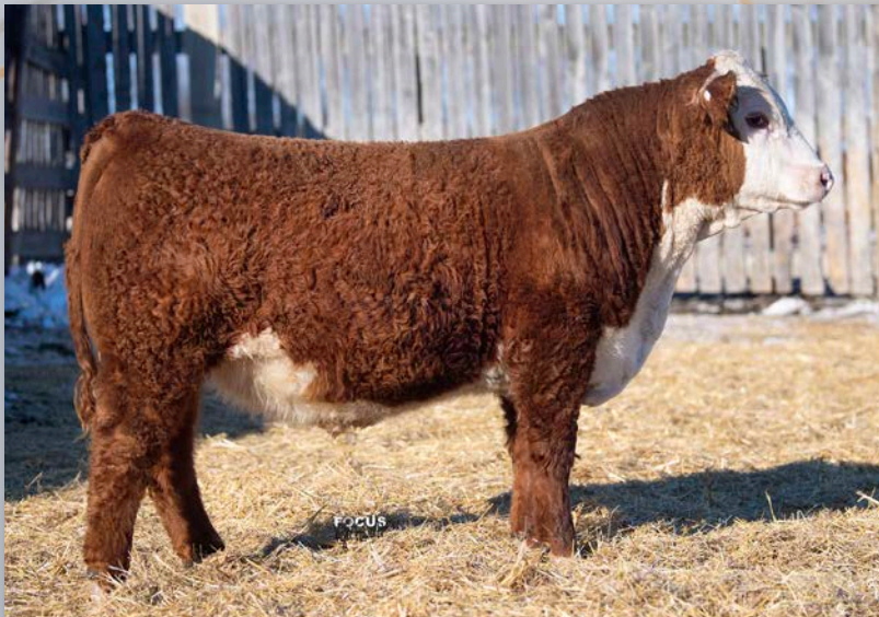
Lot 32 • ECR 238 FORTIFIED 2113