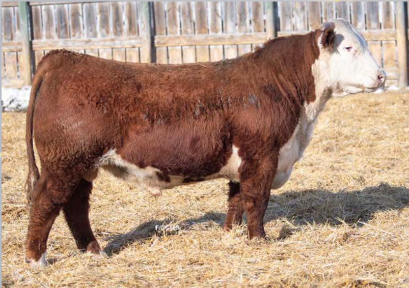
Lot 119 • ECR COPPER CANDY 1393 ET