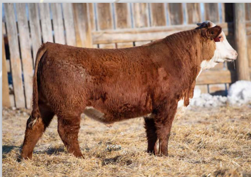
Lot 59 • ECR 0025 ADVANCE 2110