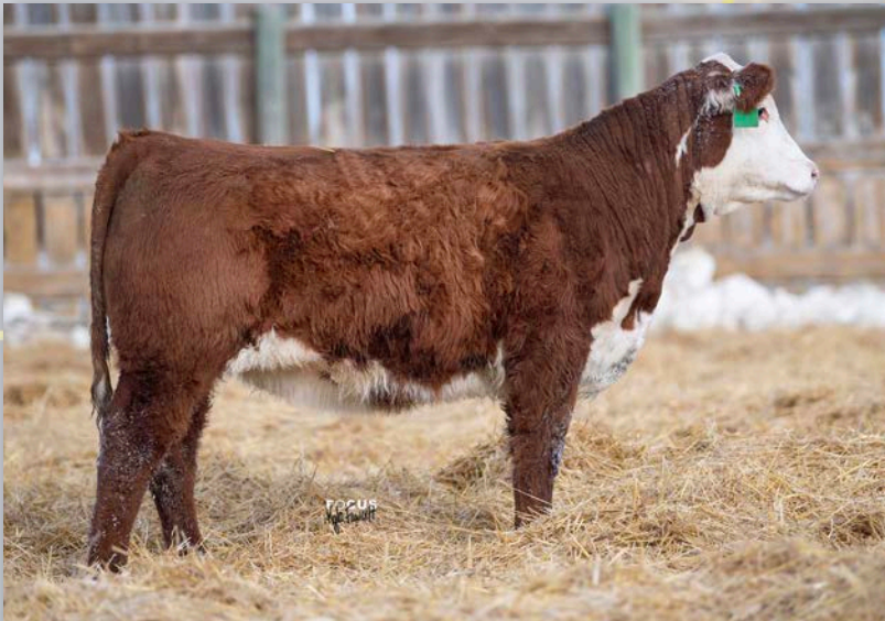
Lot 14 • ECR 97F DOMINETTE 2559