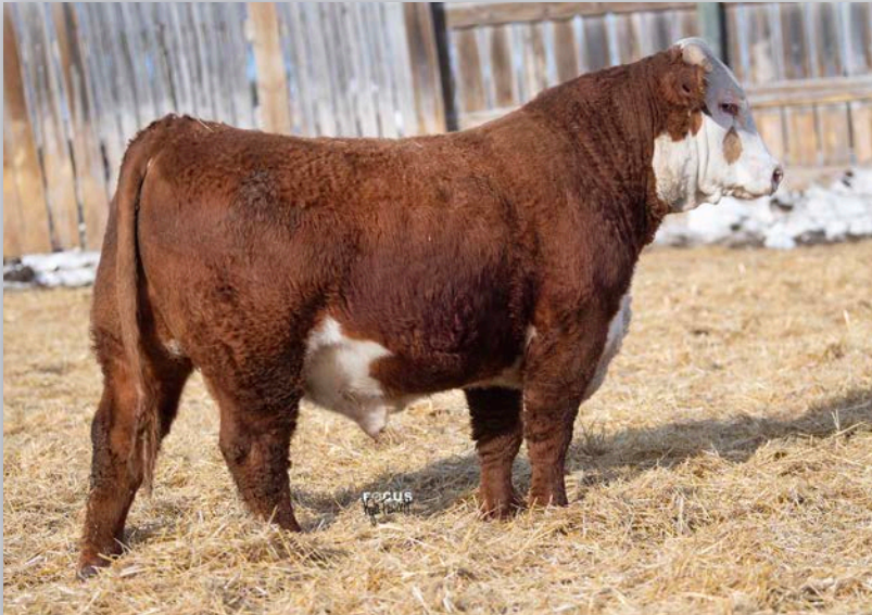
Lot 95 • ECR 893 ADVANCE 1547