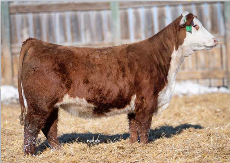
Lot 20 • ECR 8014 DOMINETTE 2551

Yes she has a bit bigger BW EPD than ideal but what comes with that is absolute power. Power in phenotype, power on paper and a powerful future. WW, YW are in top 1%, Scrotal top 5%, Milk top 1%, Milk and Growth top 1%, Carcass Weight top 1%, REA top 1%, Marbling top 10% and just shy of top 1% CHB. Mate her to a lower birthweight bull and reap all the benefits she has to offer.