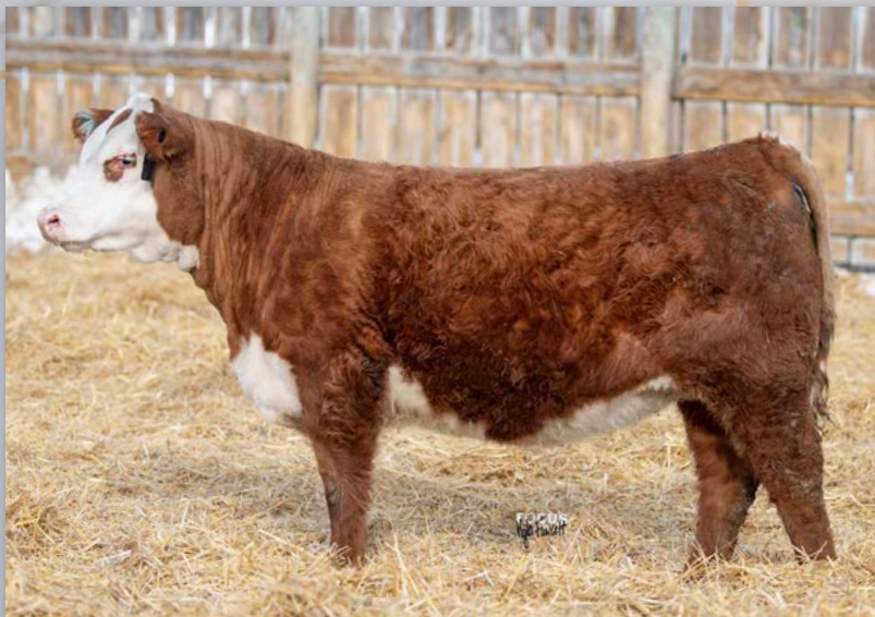
Lot 21 • ECR 0495 LADY FORTIFIED 2235

Sired by 8014 that Genex purchased from us who has proven to be a sire of great cattle. Dam has a track record of lighter birthweight calves with added growth when compared to contemporaries at weaning and yearling. High quality in an easy fleshing package with added power from her sire.