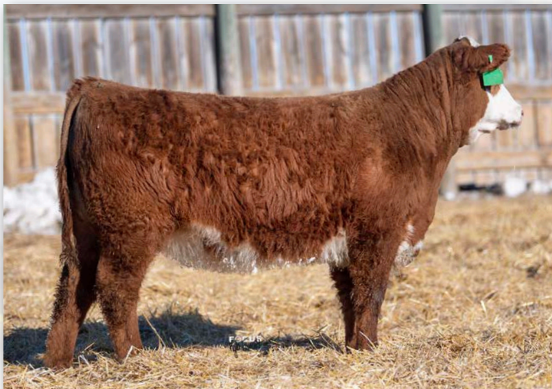
Lot 16 • ECR SANCHETTE 2398

2398 ties up some of the elites in the breed very close all the way through her pedigree. 4075B, donor 21W, 2296, donor 212, Sancho, donor 4406, L18, donor 0028 (Bob's mother) and Harland. All the way through there are elites which set this female up to have a very productive future. Red eyed and short marked. Genetically and phenotypically she reads like a herd bull raising machine and the kind you'll keep every daughter out of.