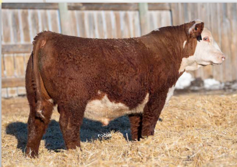
Lot 70 • ECR 238 FORTIFIED 2149