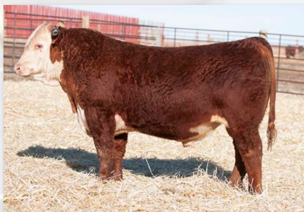
HH ADVANCE 0025 ET