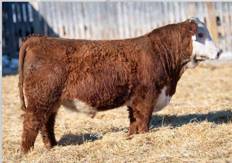
Lot 41 • ECR 0136 DOMINO 2029