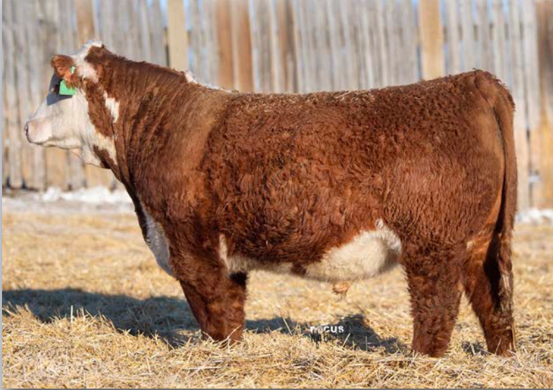
Lot 30 • ECR 238 FORTIFIED 2100