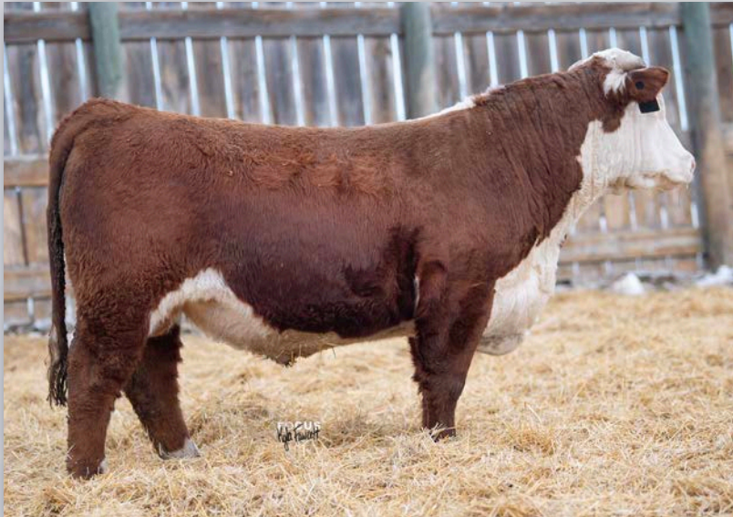
Lot 88 • ECR 9069 EXTRA ADVANCE 1309