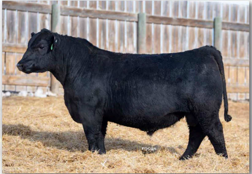
Lot 109 • ECR RENOWN 116