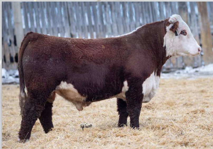
Lot 81 • ECR BRAVO 1595