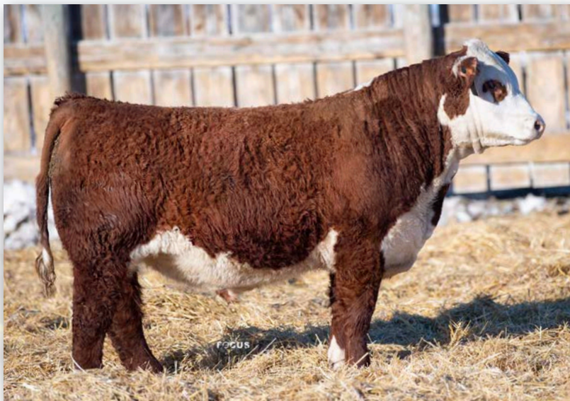
Lot 69 • ECR 173 ENDURE 2226

• Endure - phenotype with flexibility, carcass and quality