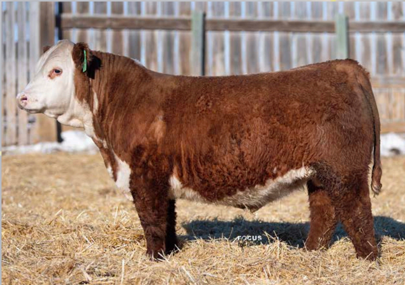
Lot 73 • ECR 238 FORTIFIED 2088