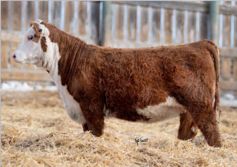
Lot 8 • ECR 8923 GRACIE 2184

Nice heifer with big time figures. Quite a spread on paper boasting a 110 YW, great teat and udder and exceptional carcass numbers. Comes to you in a moderate package with a ton of performance in her pedigree.