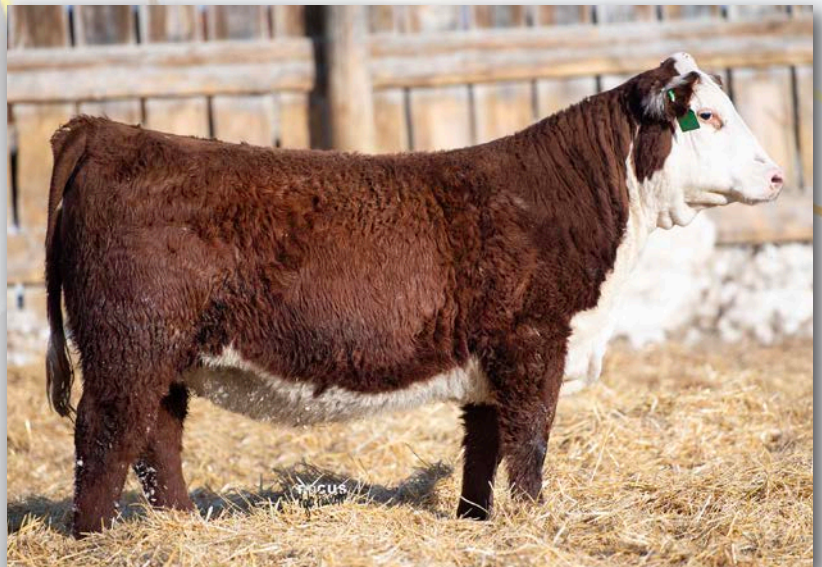
Lot 11 • ECR 8194 MS NIGHTING GALE 2232

Homozygous polled. Not one, but two shots of Sleep On in this heifer and that is a recipe for elite teat/udder, dark red and very good EPD's. Brood cow power and a true herd bull raiser of those light birthweight bulls that are highly sought after.