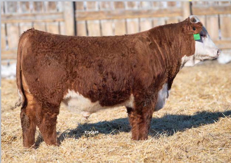
Lot 67 • ECR EXTRA DOMINO 2039

• Three full brothers in this sale... find them and buy them all to add pounds and uniformity. Your black cows will come running when these guys show up