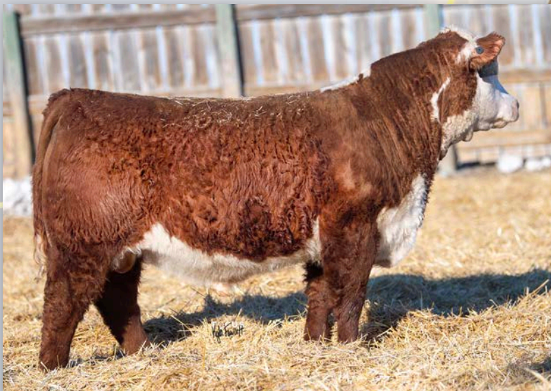
Lot 50 • ECR 238 FORTIFIED 2101