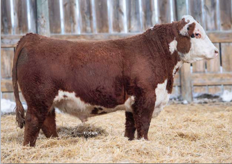
Lot 112 • ECR 8454 LAMBEAU 1369