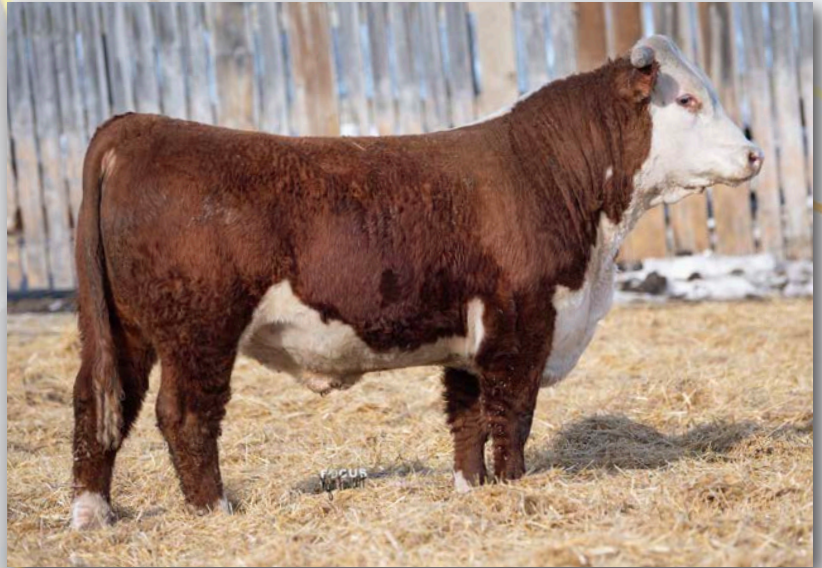
Lot 86 • ECR 9156 EXCEL ADVANCE 1679