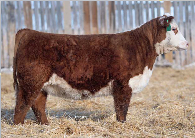
Lot 2 • ECR 9170 CHRISTI 2140

Heifers were lot tagged as they came through the chute but what a way to start off with a heifer that we think has a tremendous amount of potential. Sired by the calving ease professional that we have kept quiet but has been stamping his offspring here at the ranch with extra power and mass in a moderate package. This female is sure to do big things just like her mother who is a direct daughter of Endure. She came light at 93% and weaned heavy at 108% when compared to her contemporary group.