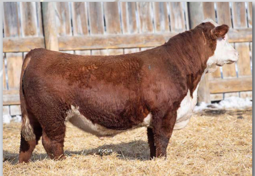
Lot 105 • ECR 813 TRUSTED 1687

• Middle framed, short marked and powerful • Easy fleshing with a great cow family behind him