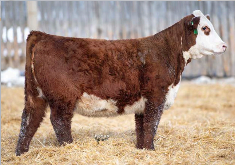
Lot 27 • ECR 97F BOBBIE 2451

Love the body and shape this female offers. EPD's read just as good on paper as she does phenotypically. Added carcass values especially marbling.