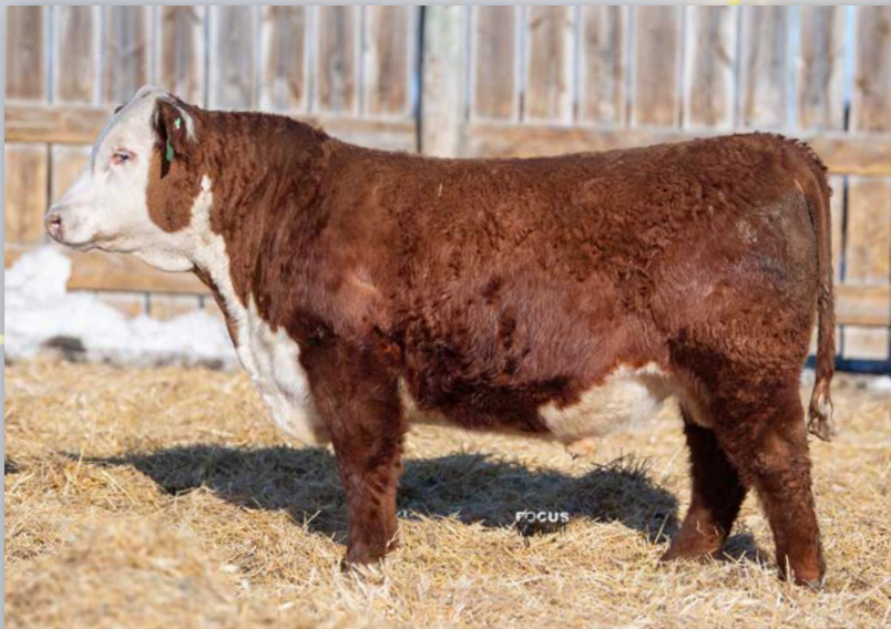
Lot 61 • ECR 0136 DOMINO 2107