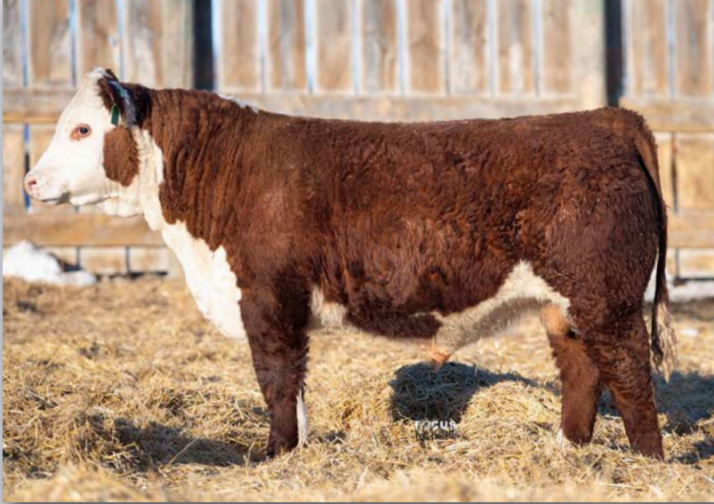
Lot 42 • ECR 173 ENDURE 2204 ET