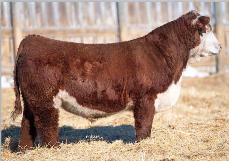
Lot 38 • ECR WHIT 2267