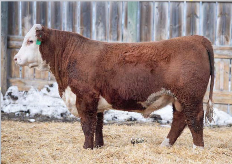
Lot 89 • ECR 1628 ADVANCE 1504