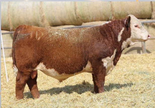
NJW 84B 4040 FORTIFIED 238F