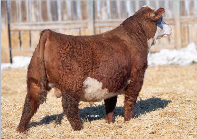
Lot 60 • ECR 238 FORTIFY ENDURE 2073