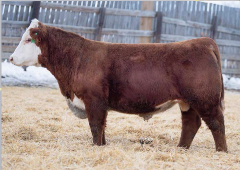
Lot 78 • ECR 6305 RIBS 1564