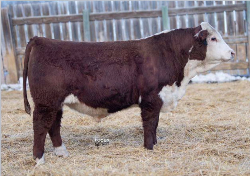
Lot 54 • ECR 9179 EARLY RISER 2138