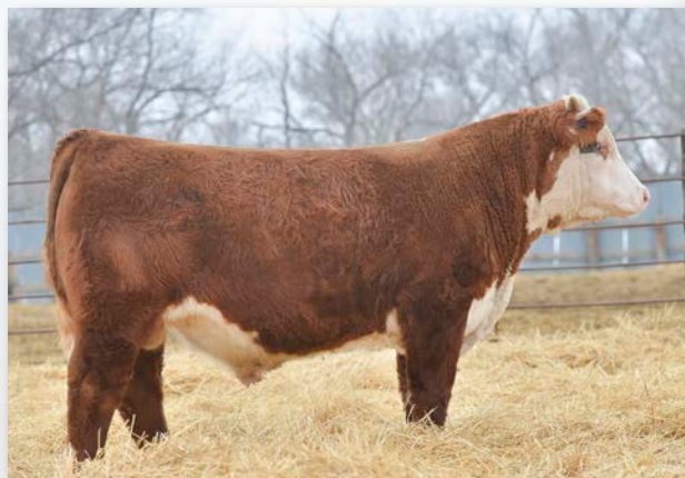
ECR BRAVO 6305