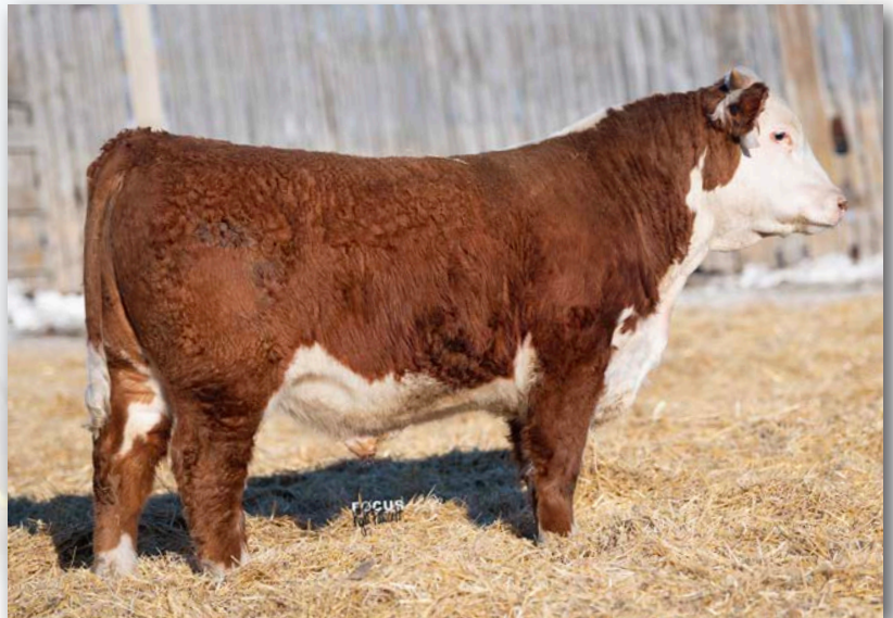
Lot 75 • ECR 0136 DOMINO 2104