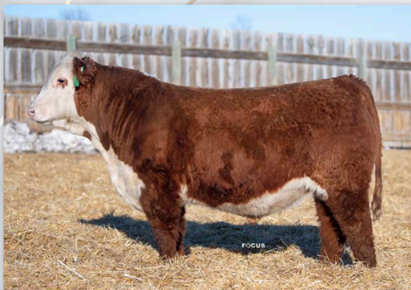
Lot 47 • ECR 9170 EARLY RISER 2156