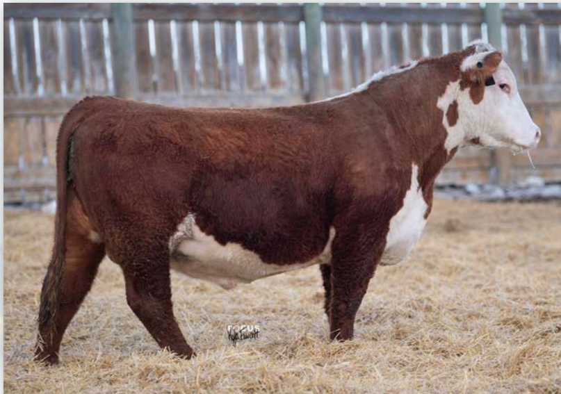
Lot 79 • ECR 893 HUNNYS ADVANCE 1603