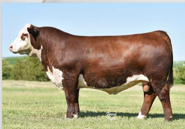
NJW 79Z Z311 ENDURE 173D ET