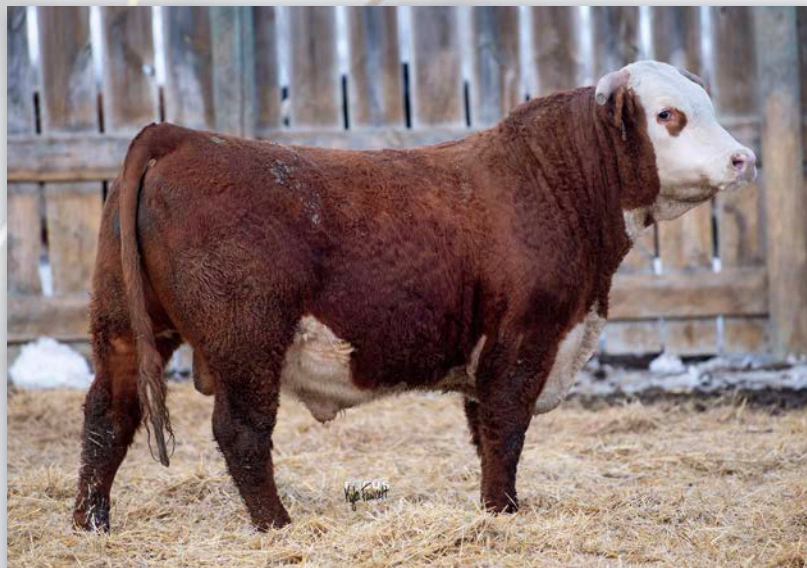
Lot 99 • ECR 8014 ADVANCE 1255