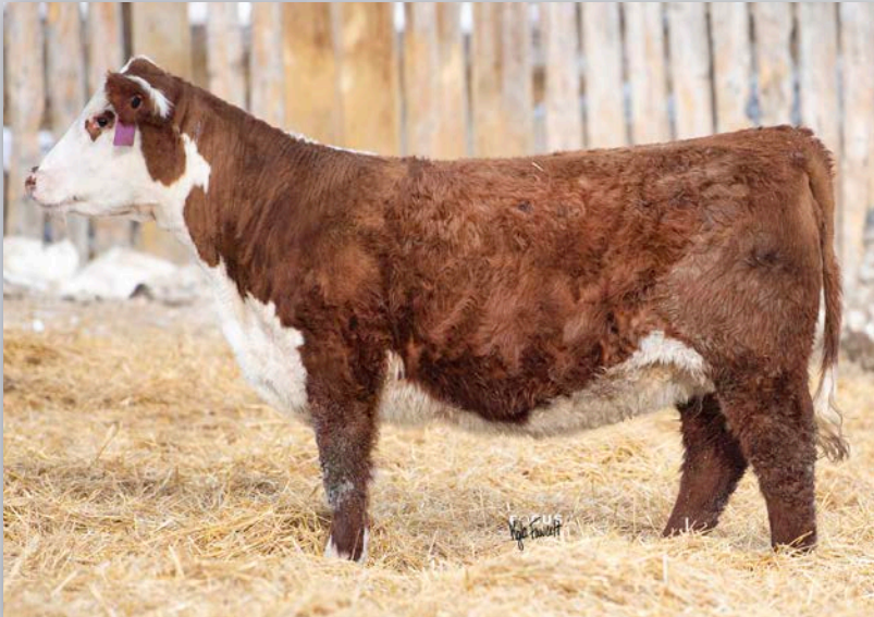
Lot 19 • ECR 97F MISS ENDURE 2396