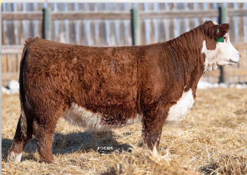
Lot 17 • ECR 8923 MILA 2481 ET

Here's another D78 daughter that when this mating happened I had no intentions of selling these daughters... yet again, here we are writing a footnote for another one of those that wasn't supposed to be leaving. BUT we want to offer you some of the very best.