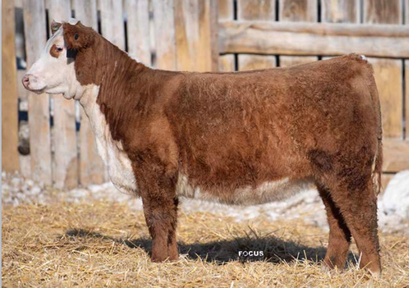
Lot 13 • ECR 8923 TATOR TOT 2453 ET