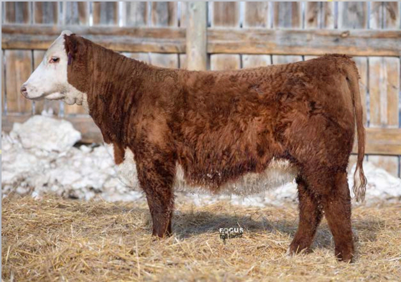
Lot 26 • ECR LADY HOMETOWN 2425

Just a May heifer that is the result of natural service that I had been watching all summer with consideration of putting her in our October sale but since all of those heifers were ET calves it gave me an excuse to keep her. A bit different pedigree that is very intriguing compared to a lot of mainstream genetics giving this female unlimited mating options. This isn't one that's easy to sell.