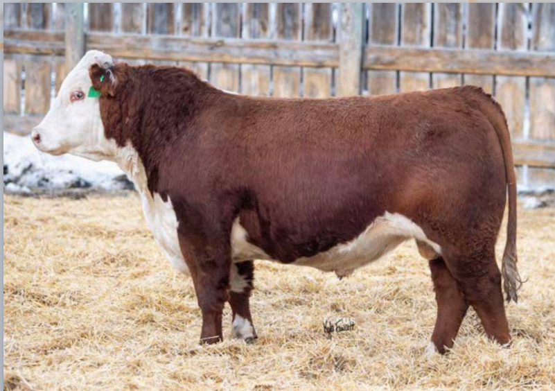
Lot 114 • ECR 9156 ADVANCE 1116

• Straight horned pedigree with added extension, performance and true cow power • Below average BW with above average WW