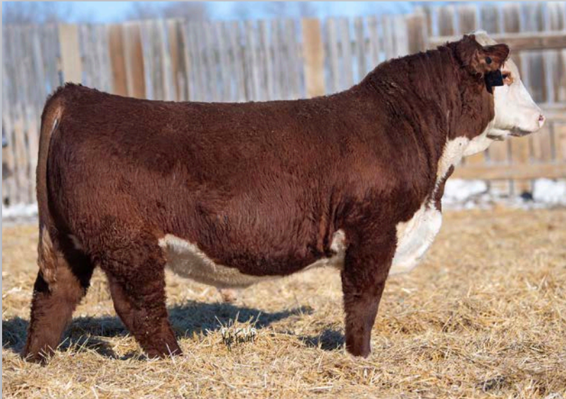
Lot 36 • ECR 9170 OUTLIER 2155