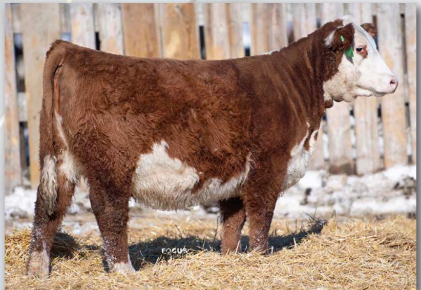
Lot 12 • ECR 8454 MISS DIAMOND 2230

It doesn't matter where your priorities are in terms of type of cattle because this heifer offers a very elite phenotype combining a powerful build yet is still so feminine and cowy in her appearance. She's got the Who Maker back in there to add that extra eye appeal.