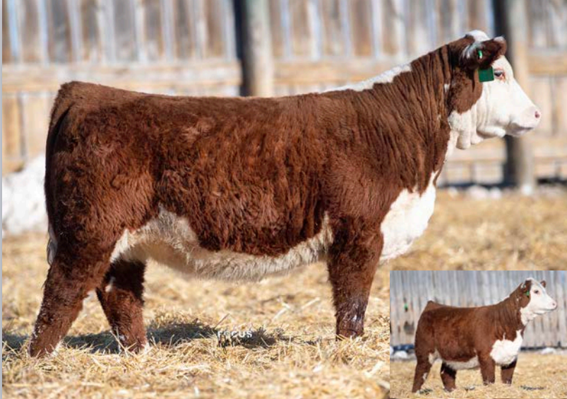
Lot 7 • ECR 9170 MISS ADVANCE 2182