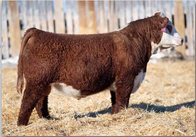
Lot 52 • ECR 8194 ENDURE 2151