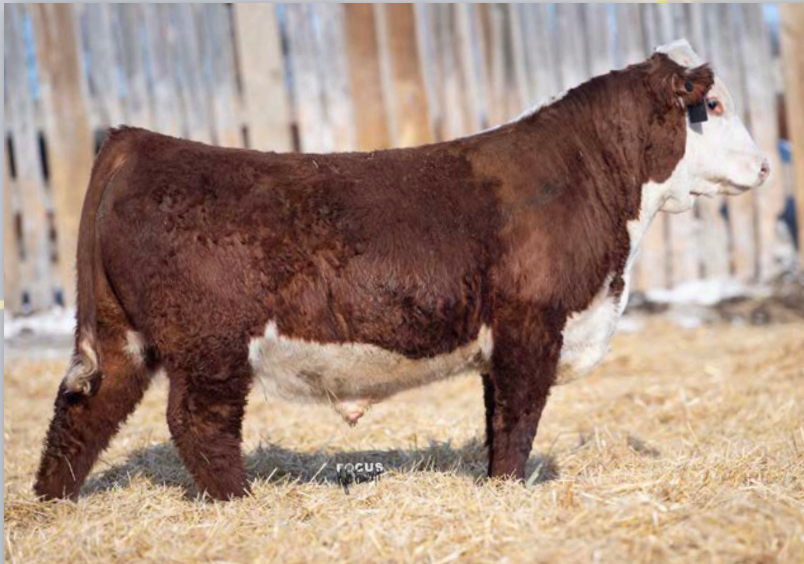
Lot 55 • ECR 9170 JOSE 2122