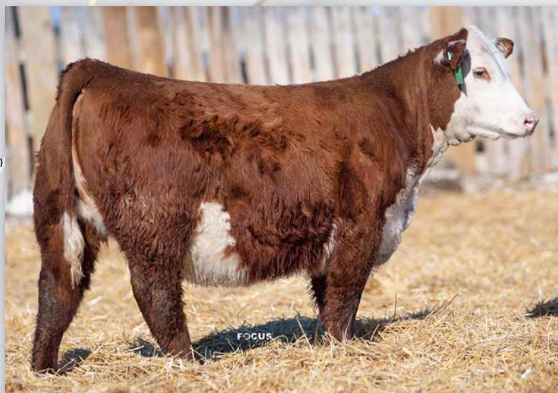
Lot 6 • ECR 7586 DOMINETTE 2670

Born light and weaned off with a whopping 114% weaning ratio. Mother has history of having babies with well below average birthweights and weaning them off all well above average. I think that's a bit of what we all are after. Add to it the added quality in phenotype this heifer offers and she sets her new owner up for a bright future with this young female.