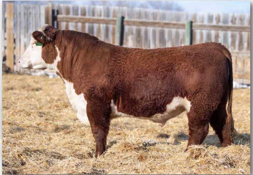
Lot 121 • ECR 8454 LAMBO 1122