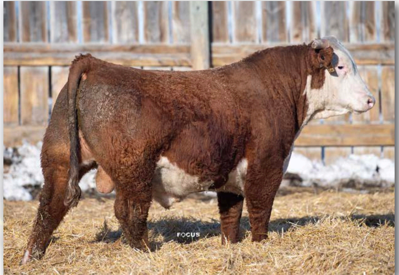
Lot 115 • ECR 8923 ADVANCE 1348 ET

• Sancho x 5580 is sure to add power and eye appeal