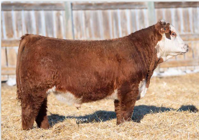
Lot 39 • ECR 326 DOMINO 2245