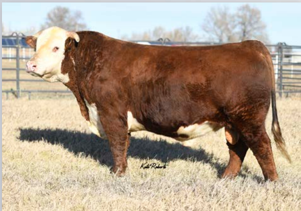
ECR 628 ADVANCE 8014