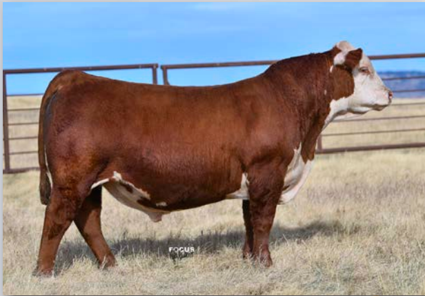
PYRAMID DAYBREAK 9170