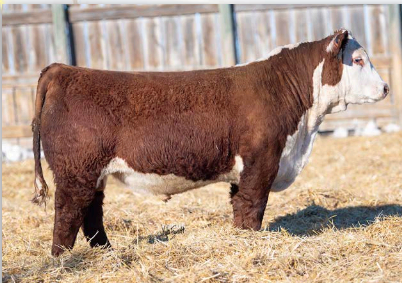
Lot 46 • ECR 173 ENDURE 2209 ET