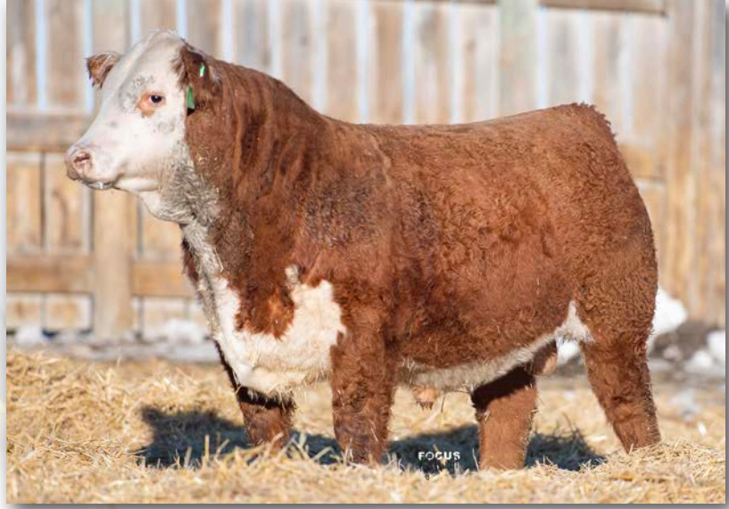
Lot 51 • ECR 238 BOBS FORTIFIED 2160