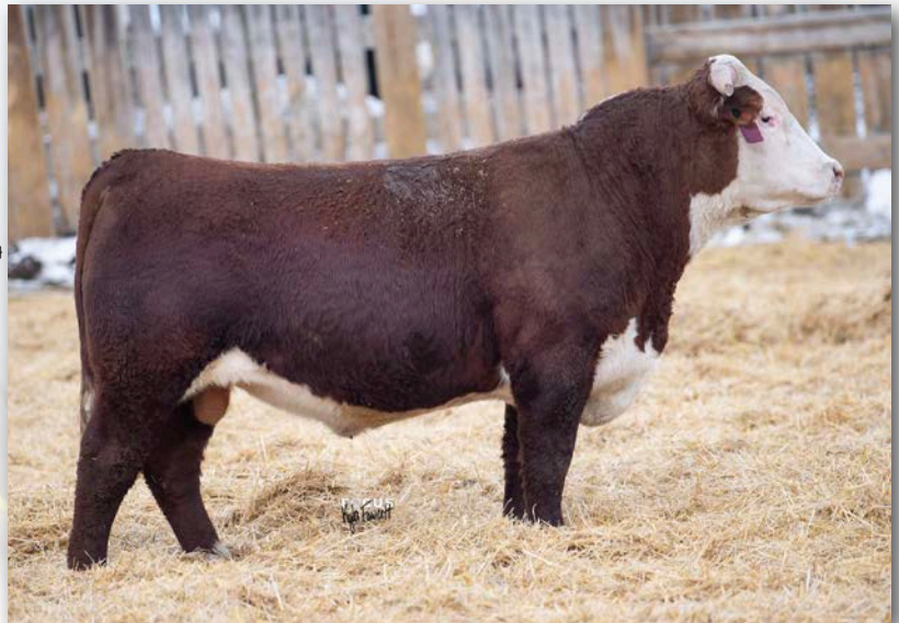
Lot 91 • ECR 738 LEGEND 1463