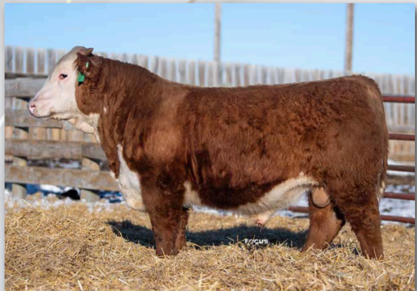
Lot 53 • ECR 8014 ADVANCE 2118