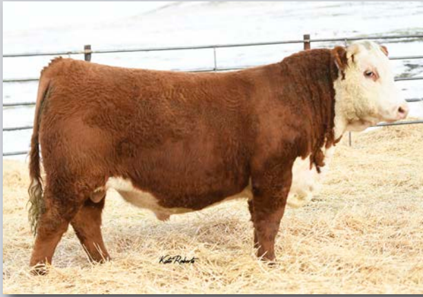
LW 6128 DOMINO 901G ET