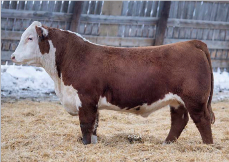
Lot 118 • ECR 326 BOBBIE 1444