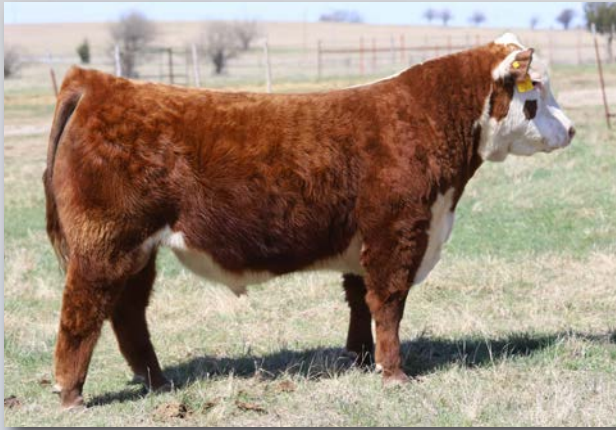
BK HESTON 5707H