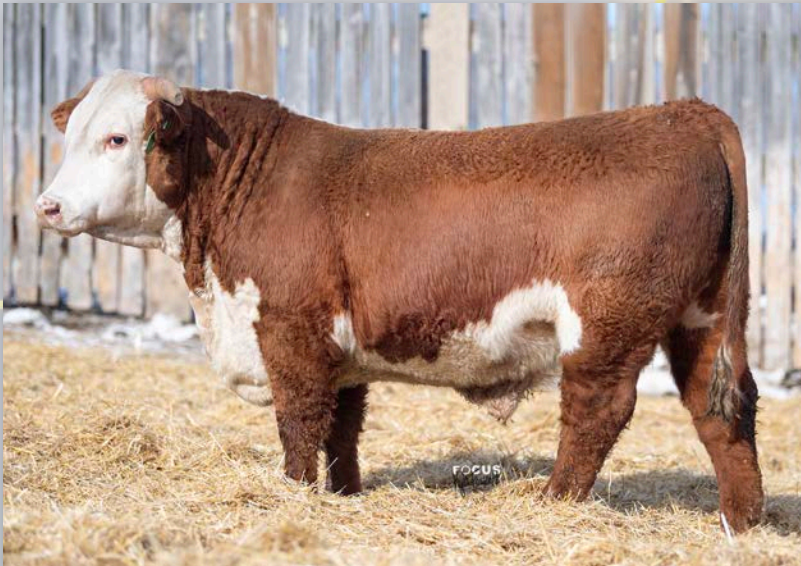
Lot 113 • ECR 5204 BOBS ADVANCE 1313

• Easy fleshing bull in a middle framed package that is sure to last the test of time