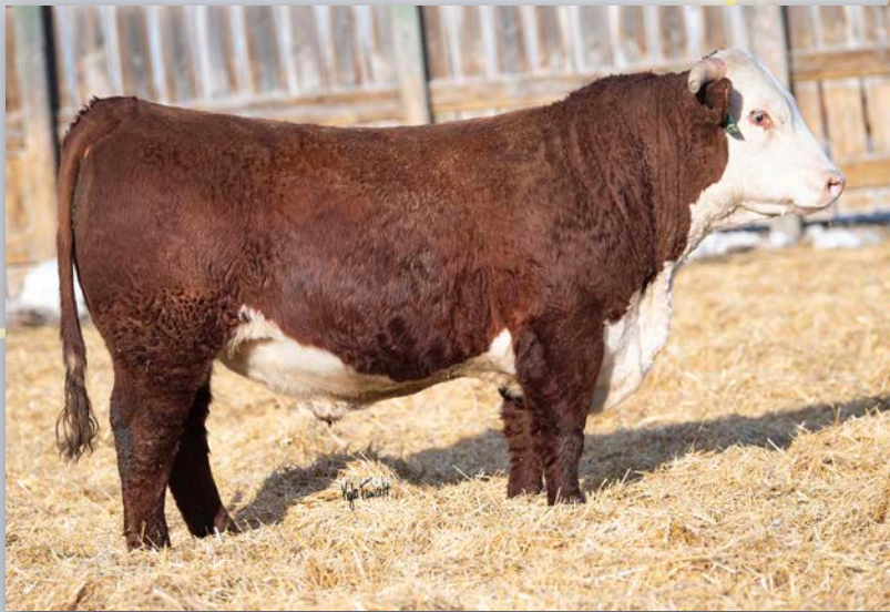
Lot 96 • ECR 7787 DOMINO 1573