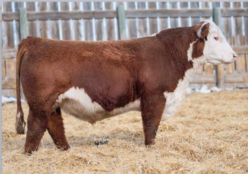
Lot 102 • ECR 8454 LAMBEAU 1620