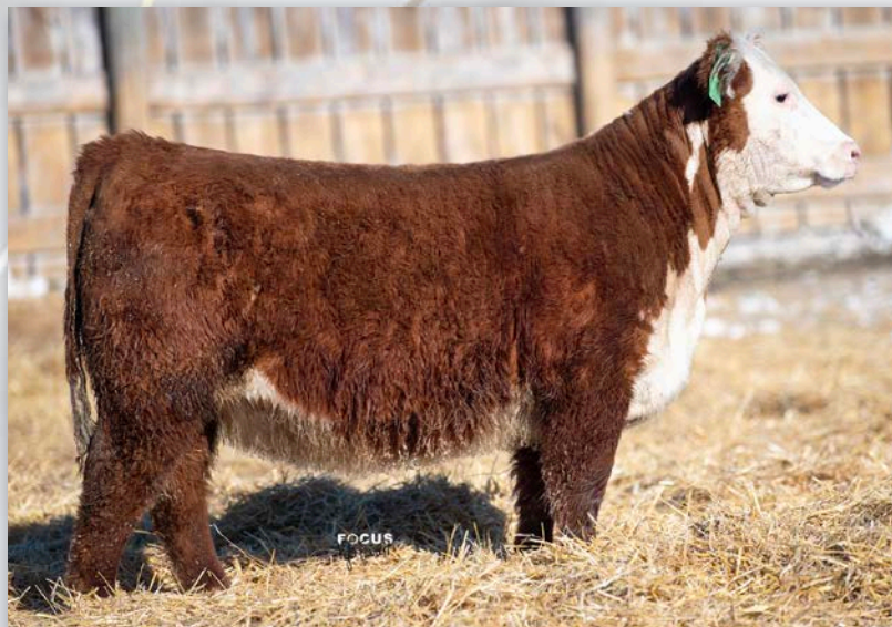
Lot 18 • ECR 8923 LADY SANCHO 2383 ET

I've never kept one of the best 211 daughters nor have I kept one of the best daughters of her grandmother (5064) besides 211. Between those two donors they have had 79 calves, 5064 is long gone and 211 is coming on 11 this spring and this heifer was to be the one to stay and one of the absolute best females either have produced. Deserving of a long windy footnote but only thing that needs said is: COME BOYS. Retaining embryo interest to be equal partner(s) with new buyer(s).