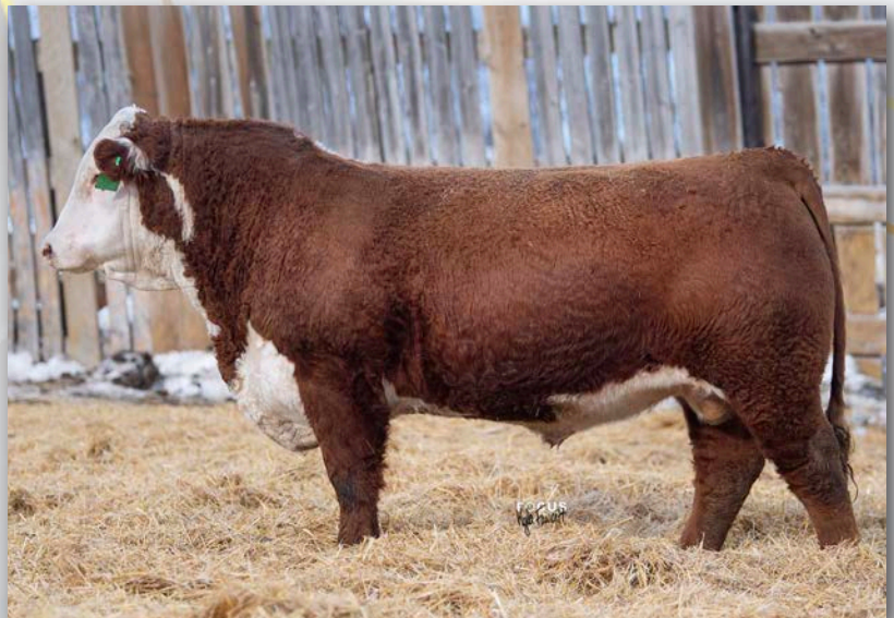
Lot 92 • ECR 38C REDEEM 1318