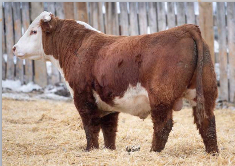
Lot 84 • ECR HIGH ROLLER 1353 ET