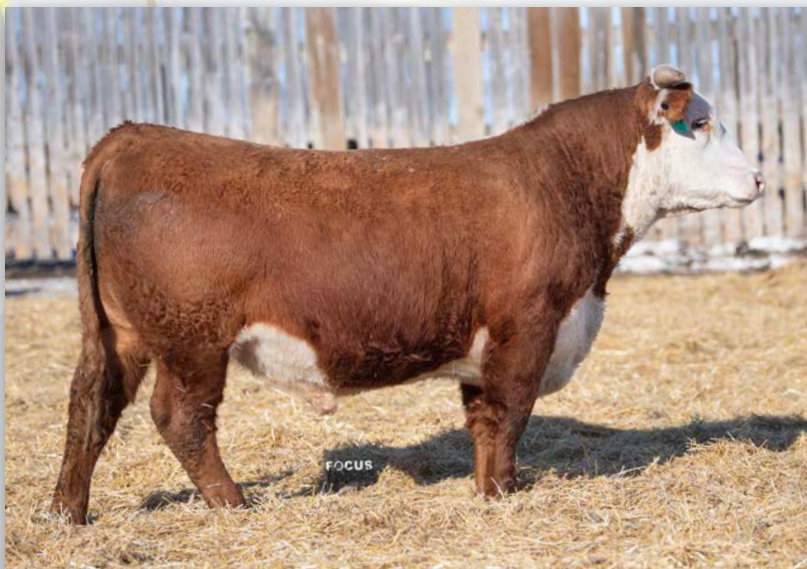
Lot 98 • ECR DOMINO 1580