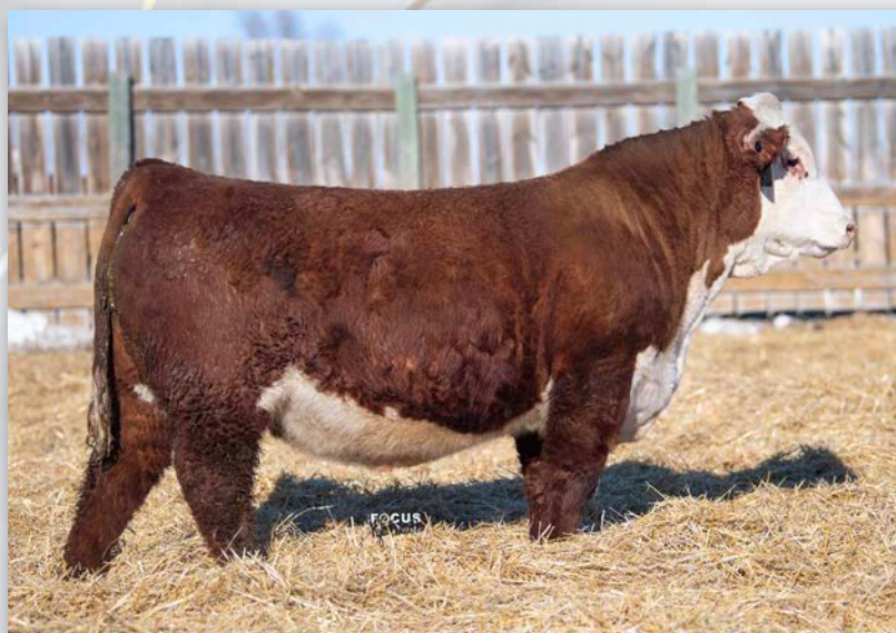
Lot 71 • ECR 9170 ENDURE 2178