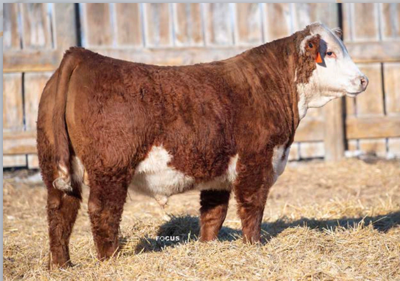
Lot 56 • ECR