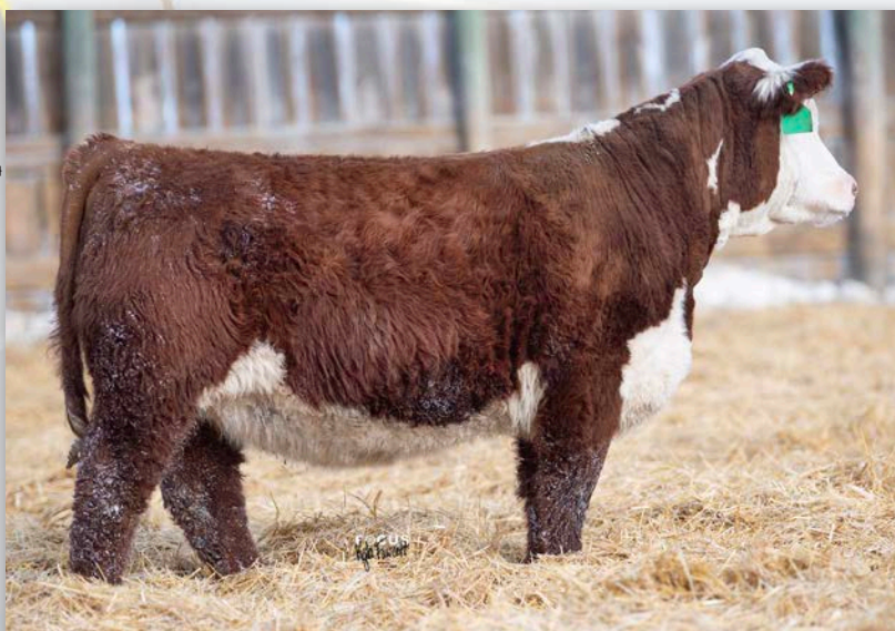
Lot 5 • ECR 97F HAZEL 2388

Dark red 97F daughter with tons of cow power and mass. Traces back to household names here at the ranch with the donor 0500, Redeem and Undisputed. Look here for the front pasture kind.