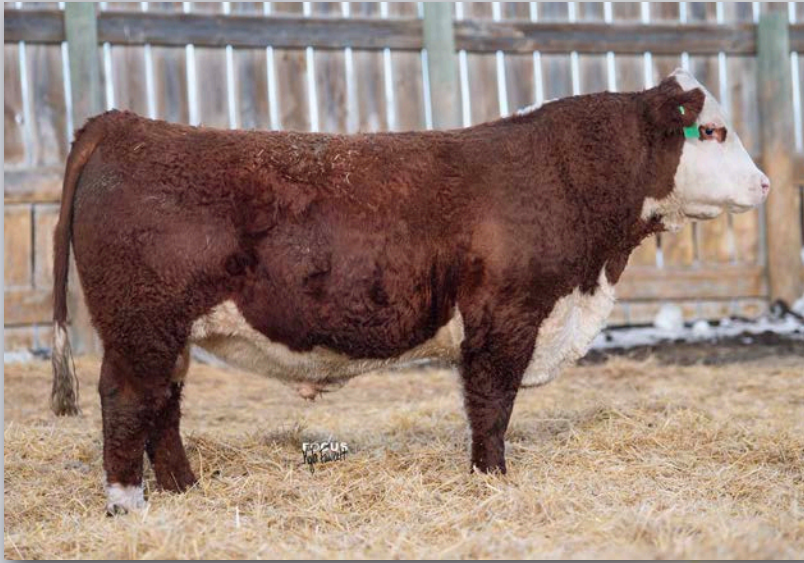
Lot 100 • ECR SPH 516 ENDURE 110