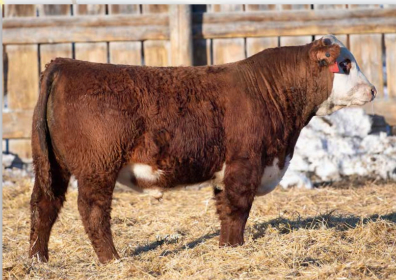
Lot 64 • ECR 0025 ADVANCE 2103