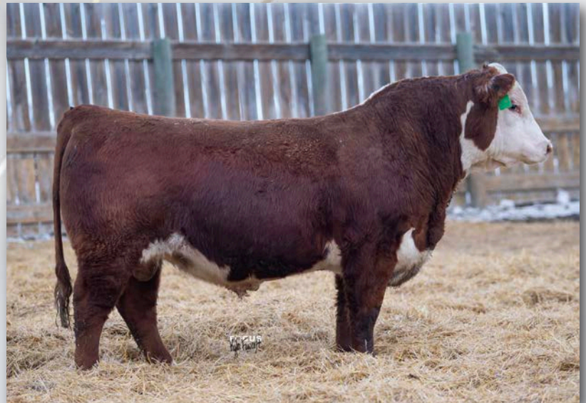
Lot 87 • ECR 11E BAR NONE 1231