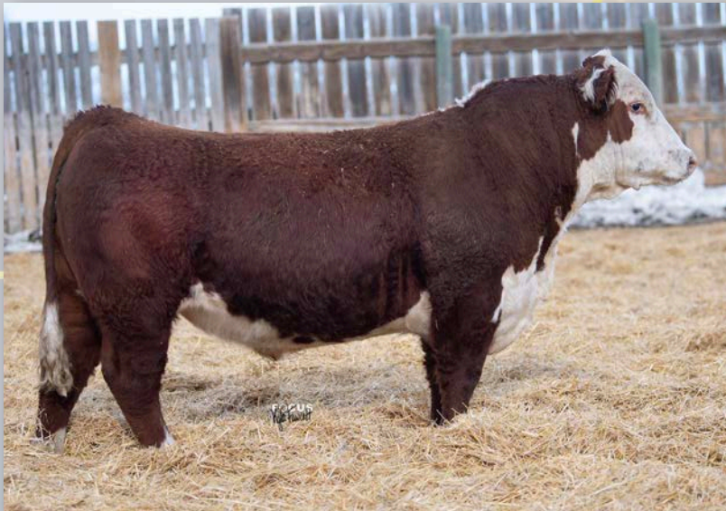
Lot 101 • ECR 38C REDEEM 1565