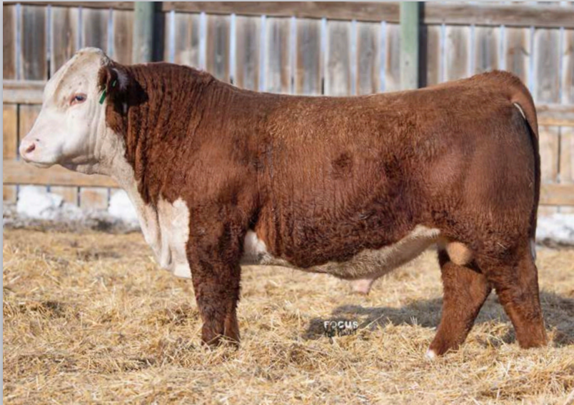
Lot 82 • ECR 53D JOURNEY 1507