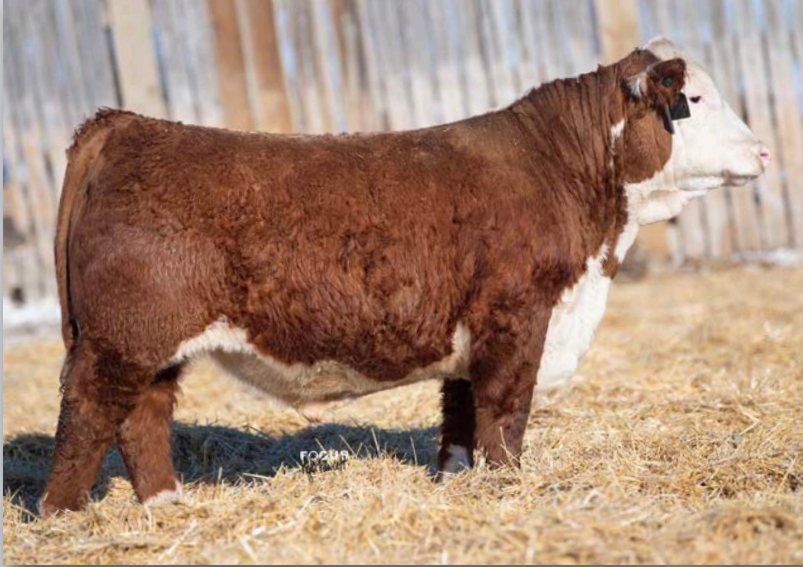
Lot 72 • ECR 238 FORTIFIED 2139