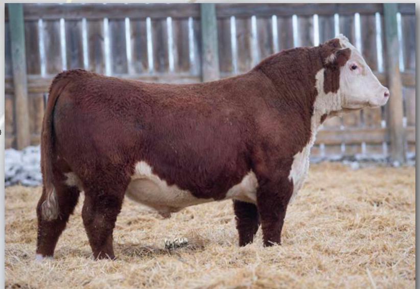
Lot 117 • ECR 8454 LAMBEAU 1131

• Long bodied bull with extra power, carcass traits and flexibility