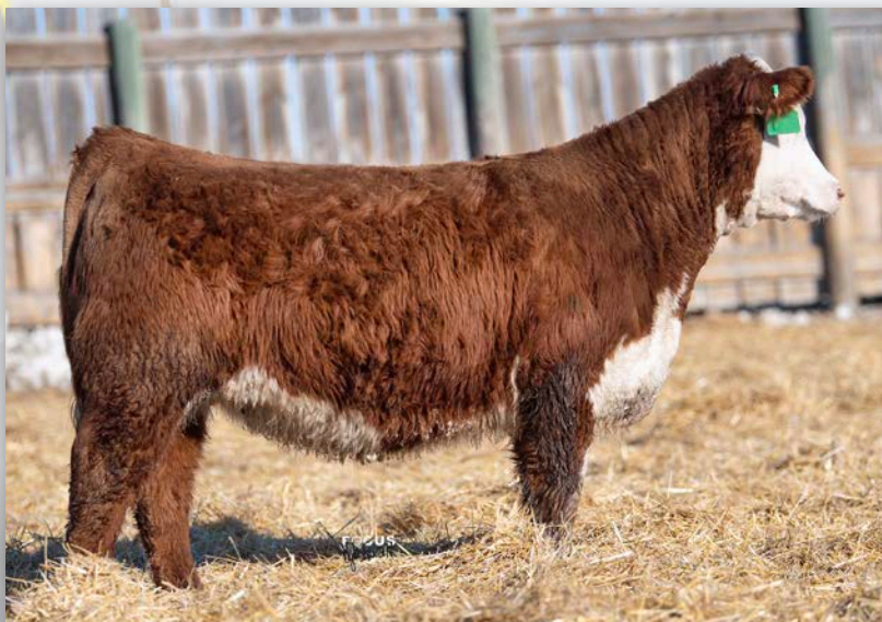
Lot 23 • ECR 6305 DOMINETTE 2264

Sired by 6305 who was one of our keeper bulls from a stout denver pen years ago. I like this kind in terms of moderation and fleshing ability with added longevity standing behind her on both sides of her pedigree.