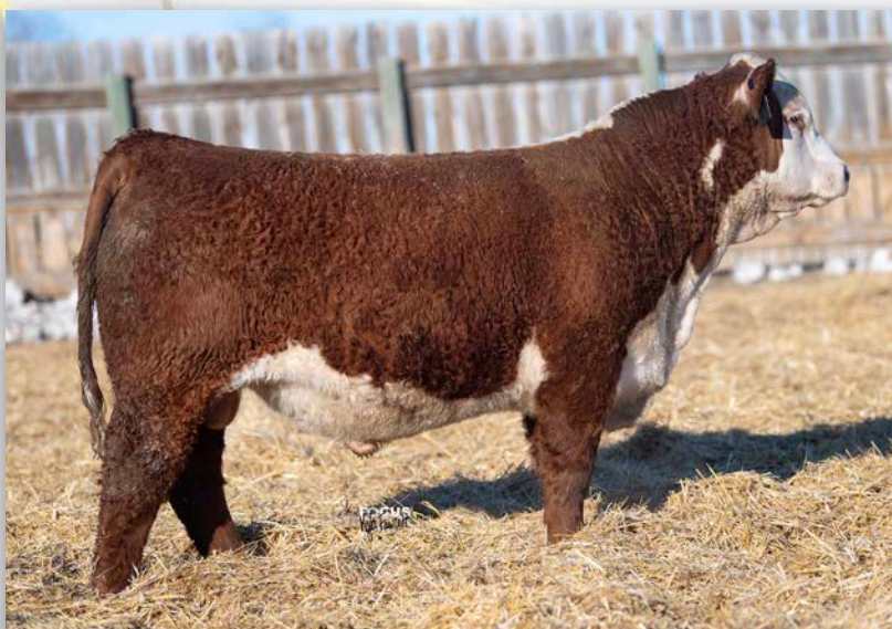
Lot 58 • ECR 173 ENDURE 2177 ET