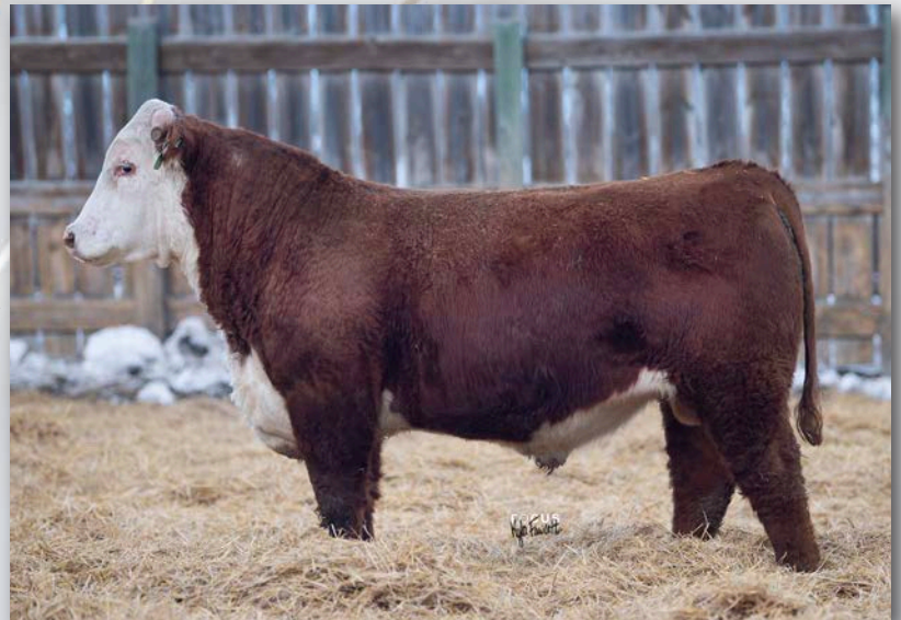
Lot 123 • ECR 326 EXTRA WHIT 1581