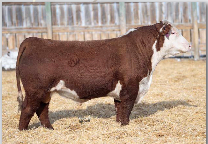
Lot 111 • ECR 738 SLEEP ON 1337