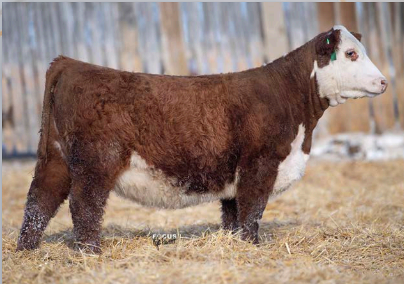
Lot 15 • ECR 8923 MISS ADVANCE 2392 ET

Big time spread on paper with a moderate birthweight, big growth and tremendous carcass numbers topped of with a 141 CHB. Long bodied type of cattle that is sure to raise those offspring that'll push down the scale.