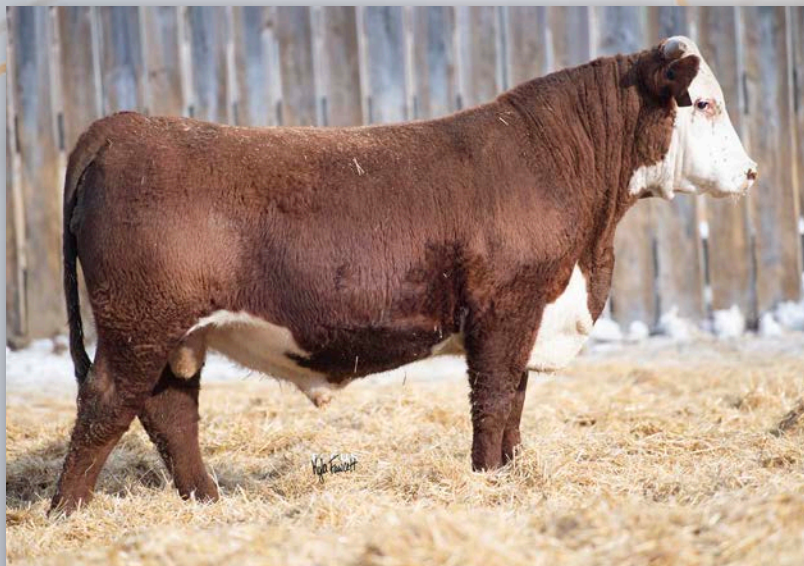
Lot 108 • ECR 893 ADVANCE 1508