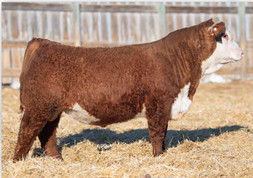
Lot 63 • ECR 238 FORTIFY 2017