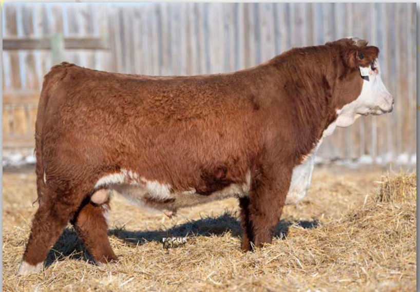
Lot 34 • ECR 0136 DOMINO 2106