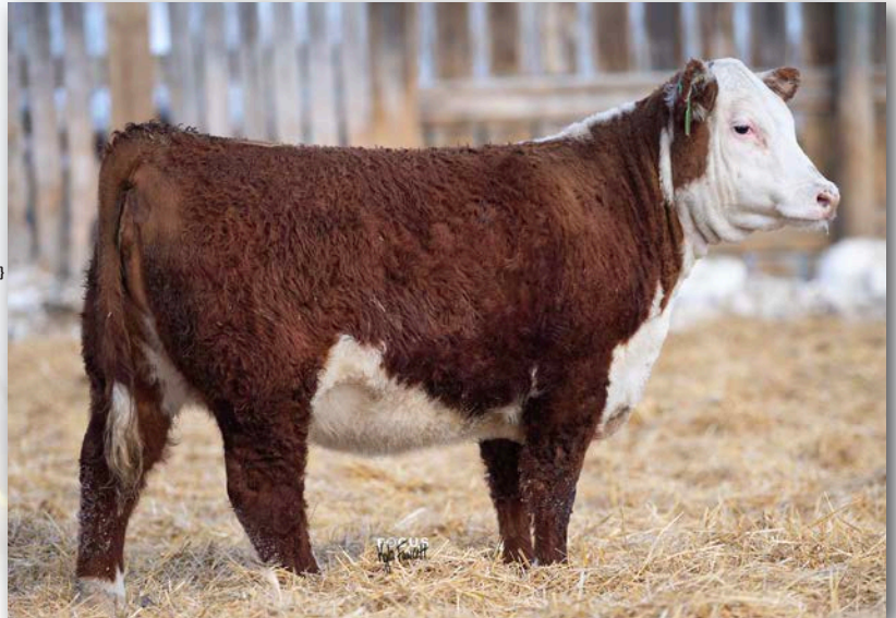
Lot 10 • ECR 11B LADY FORTIFIED 2115

Beautiful in her appearance and has a well balanced phenotype. A future calving ease specialist out of a direct daughter of Fortified and the now deseased Perfecto.