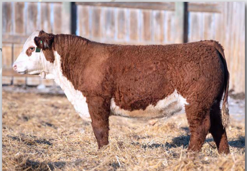
Lot 35 • ECR 173 ENDURE 2211 ET