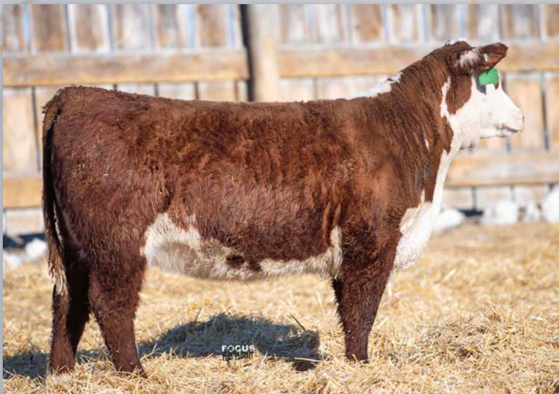
Lot 3 • ECR 238 MISS FORTIFY 2369

9170 daughter with true cow power look in terms of her overall design. Long sided, short marked and dark colored. She will have an awesome udder and great teat size. Traces back to Bob's mom for added longevity.