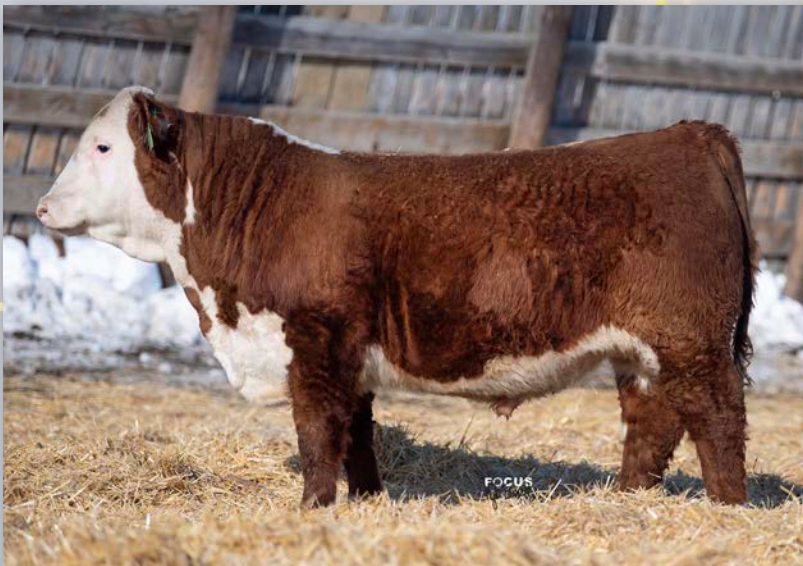
Lot 37 • ECR 238 FORTIFIED 2124