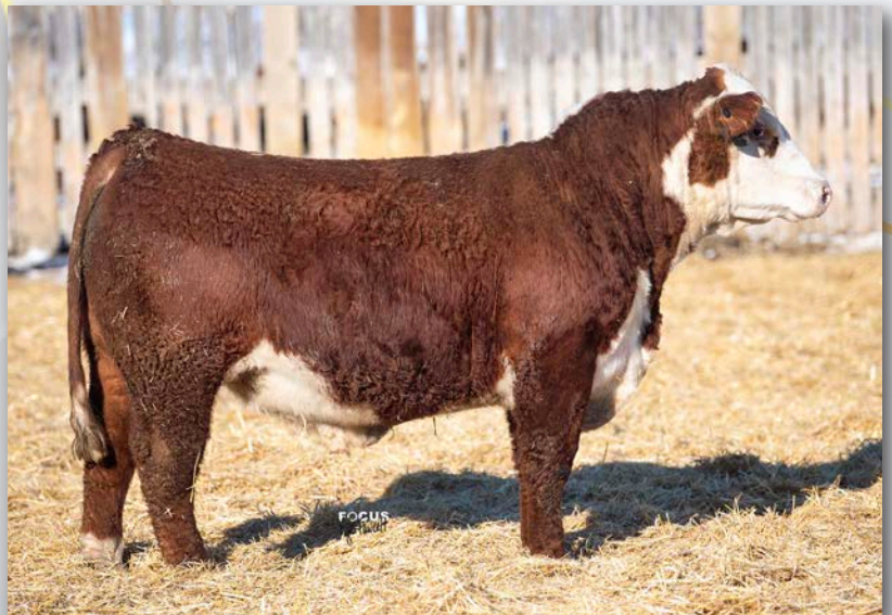
Lot 116 • ECR 8454 LAMBEAU 1388

• Nice combination of calving ease and true power with Sleep On and 860U in his pedigree • Dark red, pigment and power