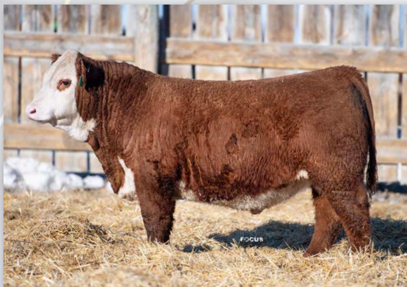
Lot 65 • ECR 238 FORTIFIED DIAMOND 2056