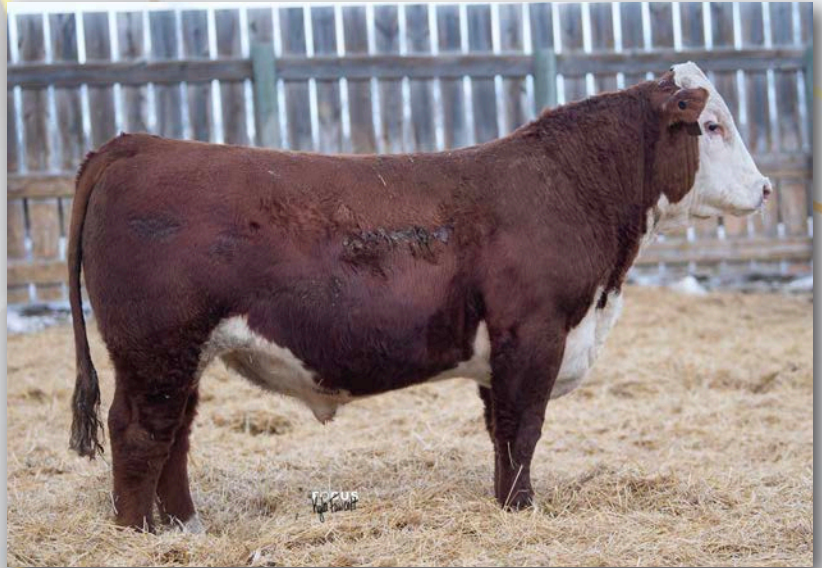
Lot 122 • ECR 326 WHITTY 1439