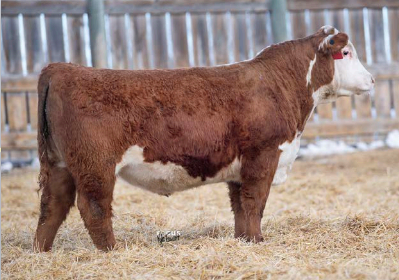
Lot 31 • ECR 0025 ADVANCE 2092