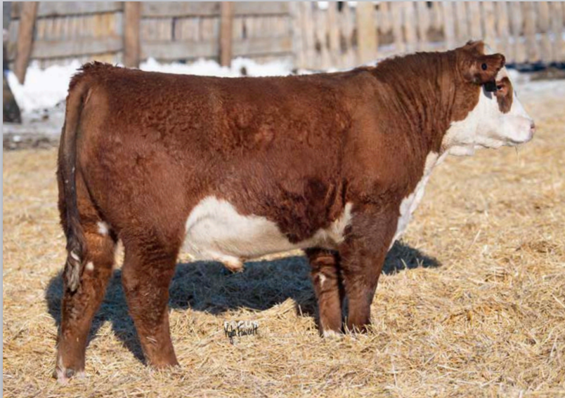
Lot 66 • ECR 173 ENDURE 2175 ET