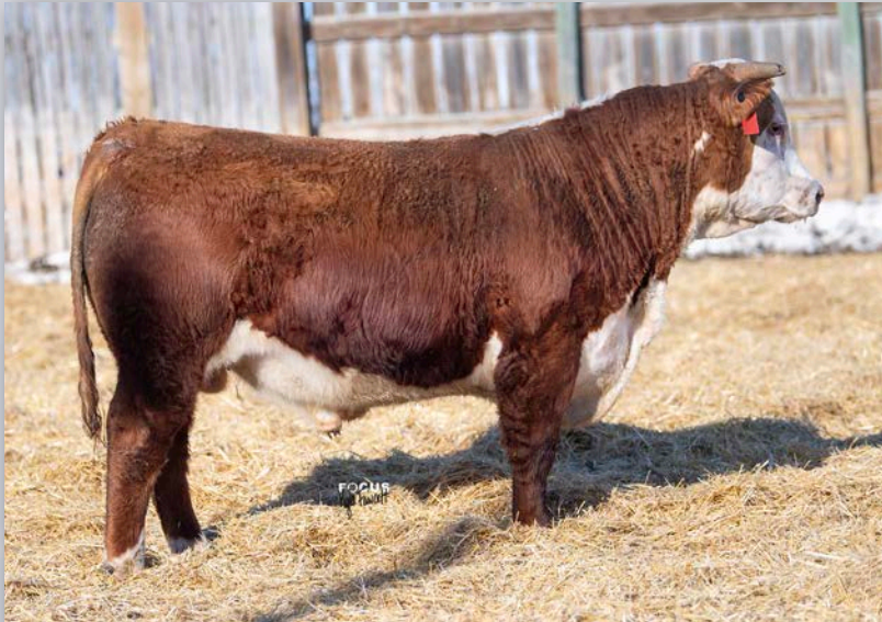
Lot 106 • ECR 5204 DOMINO 1375