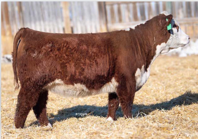
Lot 22 • ECR 9170 LADY EXCEL 2172

Cow power here. Middle framed and deep bodied. She's dark red and offers the new owner a tremendous prospect for the replacement pen. 9170 genetics are limited. Take advantage when you have the chance.