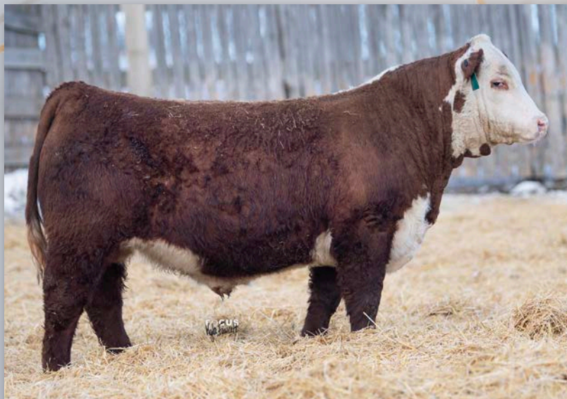
Lot 62 • ECR 901 DOMINO 2189