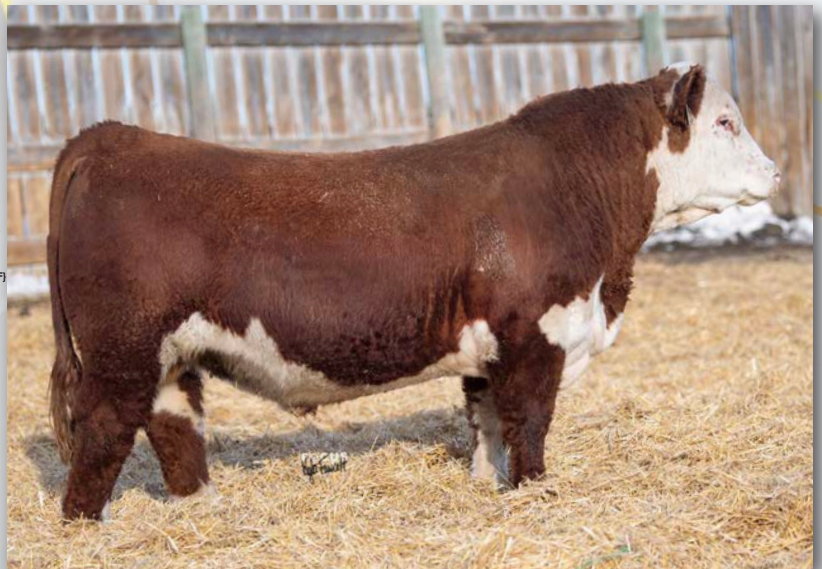
Lot 104 • ECR 8454 LAMBO 1204

• Here's a bull you will be sure to find on sale day • Extended with added muscle shape, full pigment and a big scrotal