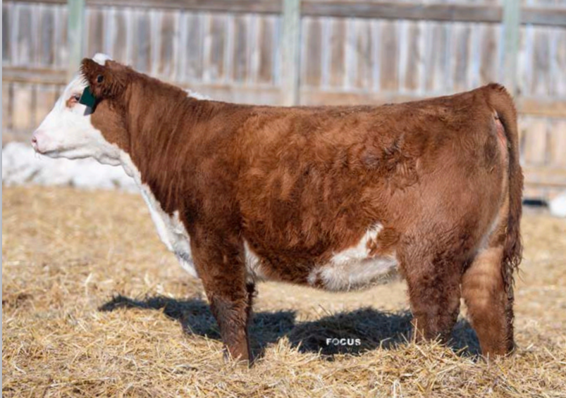
Lot 1 • ECR 5707 LADY ENDURE 2623