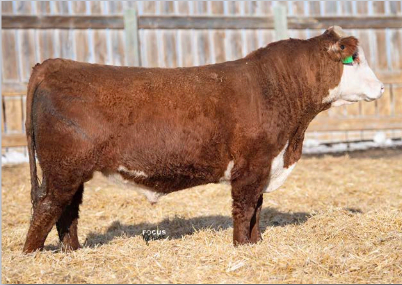
Lot 77 • ECR 11E HEY JOE 1128