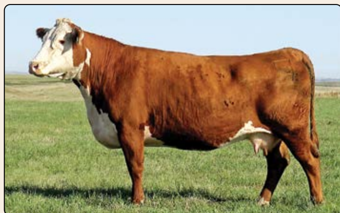
Dam: FH L1 Dominette 231 AF