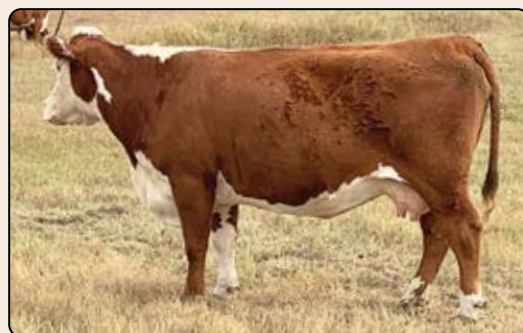
FH L1 Dominette 501 LC

Pigment LE 100% RE 100%. Smooth polled. Not many calves bred like this. He is long and thick with a good EPD package. Two dark red eyes and red to the ground.