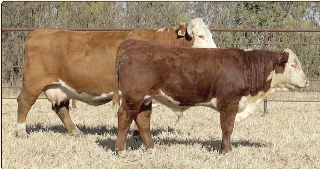
FH L1 Dominette 318 — 43402330 Pictured with bull calf 156.