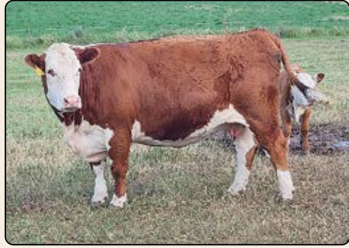
FH L1 Dominette 572 - Dam of 114 and 149