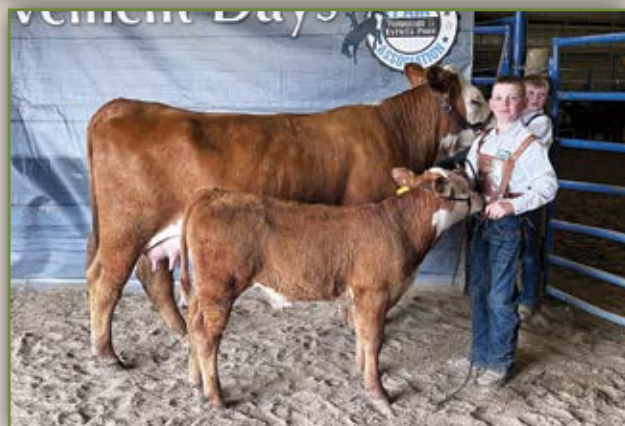
FH 1060H Miss Inspire 255 with calf 495. Grand Champion Cow/Calf Pair at the Stark-Billings Co. 4-H Achievement Days.

Sired by 1060H. He was used on heifers and his daughters did an outstanding job with their first calves in 2024. Dam is a good young cow building a strong performance record.