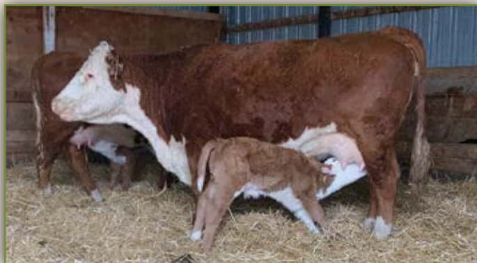
FH 5019C Miss Ada 742 BA. Dam of Lot 421.

Another conservatively marked 1060H bull calf. His dam has a nice udder with small teats.