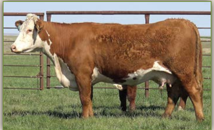
FH L1 Navita 5074. Dam of Lot 400.

Pigment LE 100% RE 70%. This long bodied calf should raise some awesome females as his mother traces back to Harrell & Oxley Hereford Ranches that are known for the power of their cow herds.