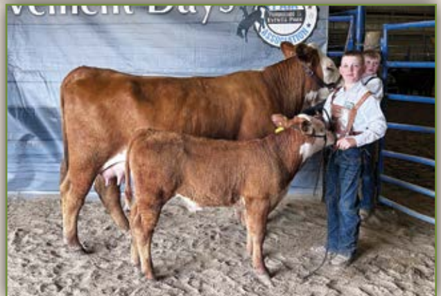
FH 1060H Miss Inspire 255 with calf 495. Grand Champion Cow/Calf Pair at the Stark-Billings Co. 4-H Achievement Days.

Pigment LE 10% RE 20%. Sired by 1060H. He was used on heifers and his daughters did an outstanding job with their first calves in 2024. Dam is a good young cow building a strong performance record.