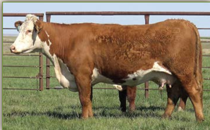
FH L1 Navita 5074. Dam of Lot 400.

This long bodied calf should raise some awesome females as his mother traces back to Harrell & Oxley Hereford Ranches that are known for the power of their cow herds.