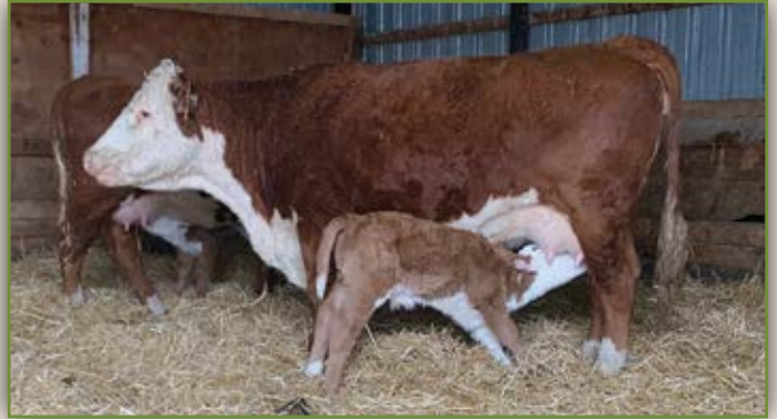
FH 5019C Miss Ada 742 BA. Dam of Lot 421.

Another conservatively marked 1060H bull calf. His dam has a nice udder with small teats.