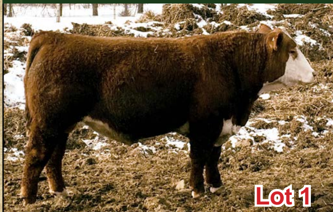
GANT TARGET 372

Sire: R On Target 5523 MGS: JDH 15T Wrangler 25W BW 3.2 WW 54 YW 87 MM 23