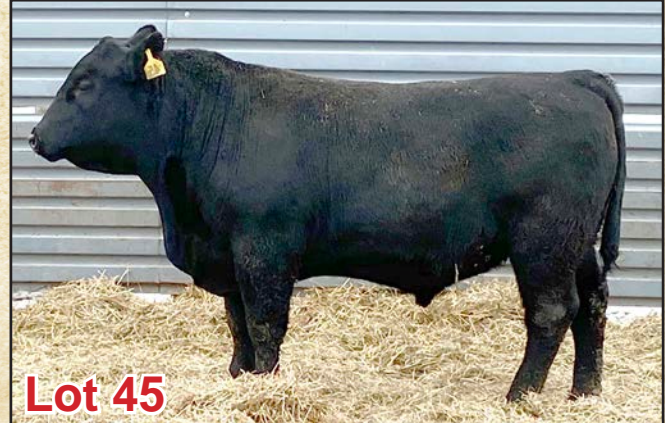
GANT UPGRADE 457

Sire: WAR Upgrade Y155 U161 MGS: WAR Forefront BW 2.4 WW 54 YW 110 M 22