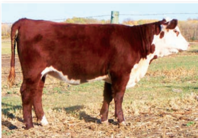
Lot 10 — KPH CHEVELLE 1207