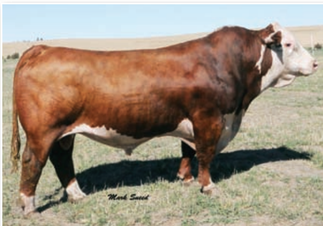
TH 223 711 Victor 755 — Sire of Lots 37 and 38