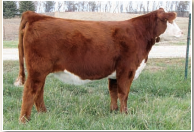
Lot 29 — JDH MS 7W MAIDEN 31Y ET