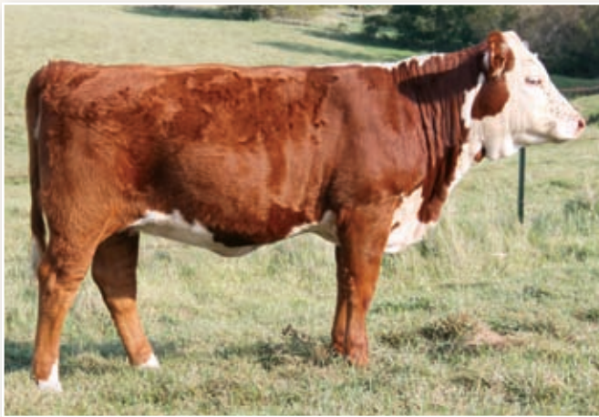
Lot 6 — GHF 632U Merci Zora 417Z