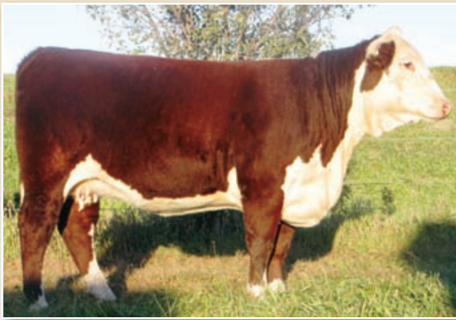
Lot 34 — NEIL 70U Ultress 160Y