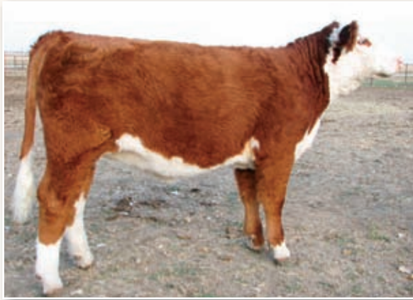
Lot 16 — SH Lady Warrior Z321E