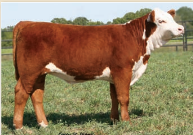
Lot 24 — WPF 09157 X87 Raina 2063