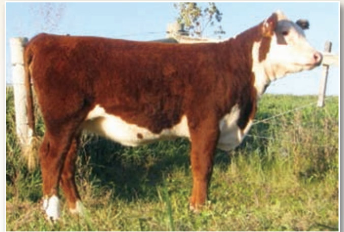
Lot 12 — NEIL 243R Bianca 203Z