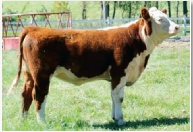
Lot 3A — PLC Miss Revolution 312

Consigned by Pauly Land & Cattle Co. Inc.