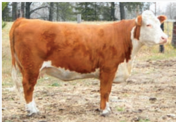
LJS Lady Embracer 0553 — Dam of Lot 19