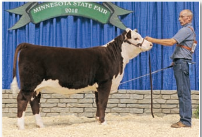
Lot 4 — GHF 0321 Merci Ziva 41Z