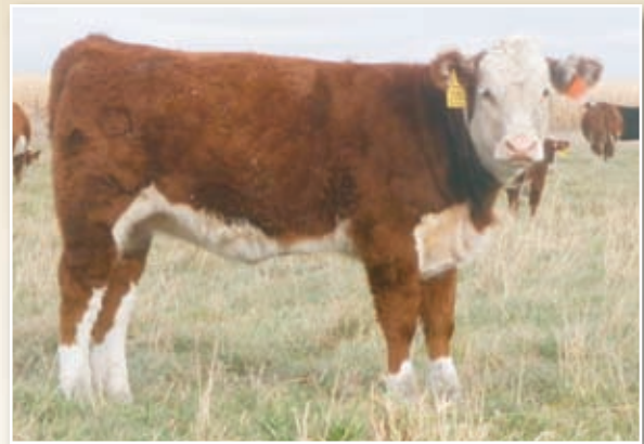
Lot 20 — SMR OLL Lady Star 203