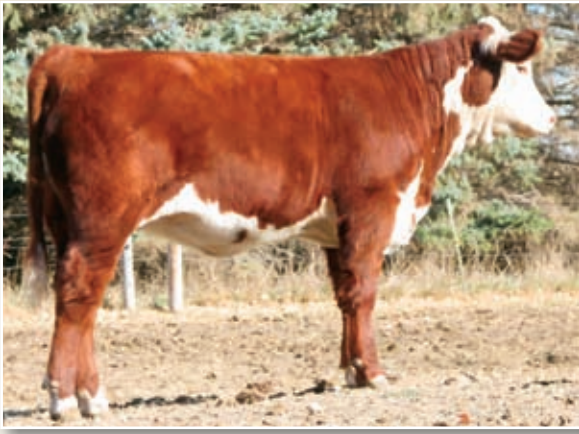
Lot 15 — SH Lady Embrace Z224