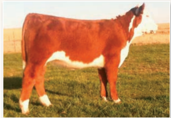
Lot 21 — SPH 35U Cracker Jack 45Z

Consigned by Springwater Polled Herefords