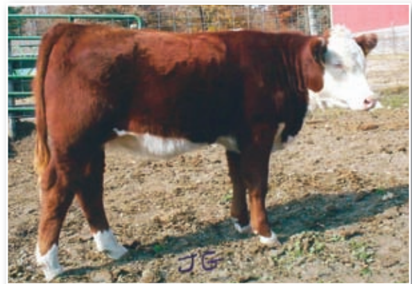
Lot 23 — ROF Mystic Lady 24Z