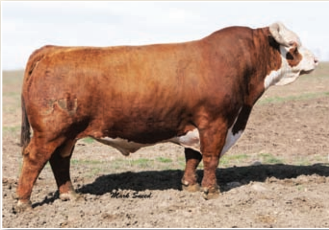
UPS Domino 3027