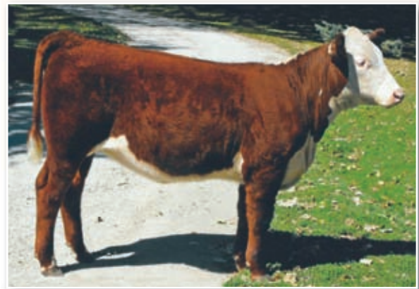
Lot 22 — M&M Bella