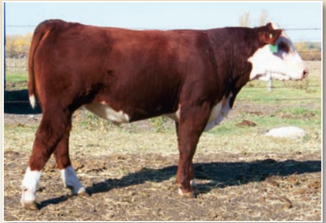
Lot 2 — KPH Timekeeper 1213