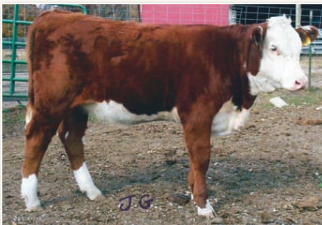
Lot 25 — ROF Mystic Lady 22Z