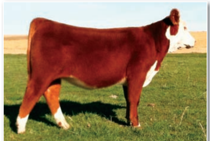
Lot 14 — SPH 45X Ms Thor 13Z

Consigned by Springwater Polled Herefords