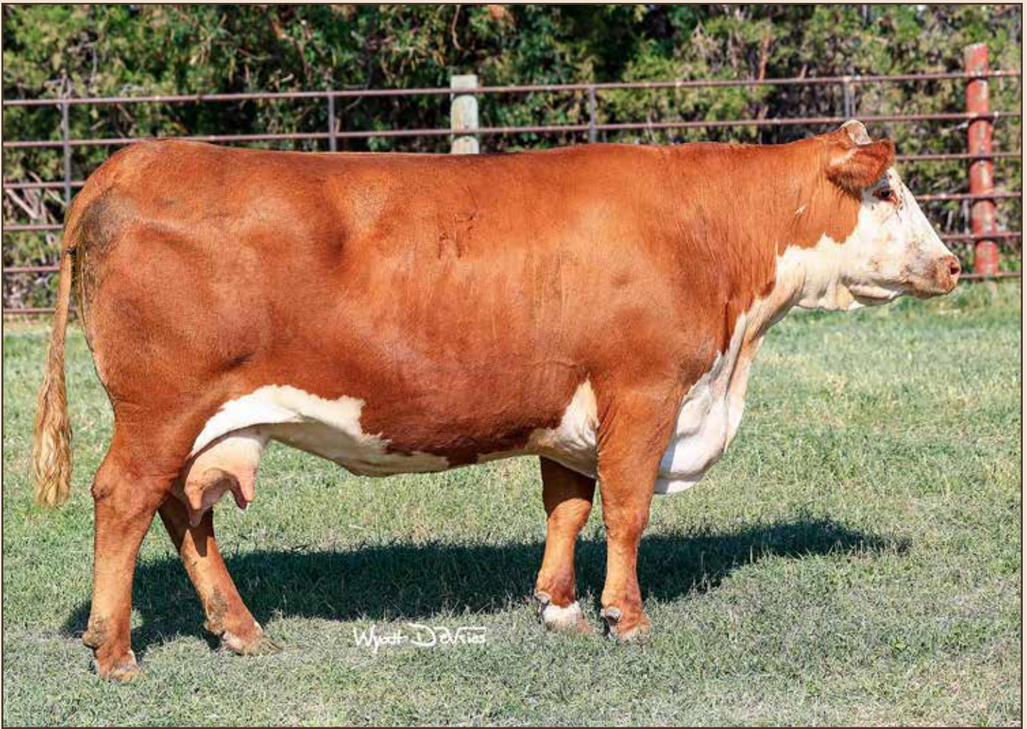
Lot 11 – CL1 DOMINETTE 456B 1ET