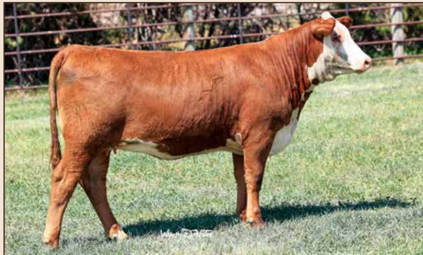
Lot 6 – HH MISS ADVANCE 2283K ET