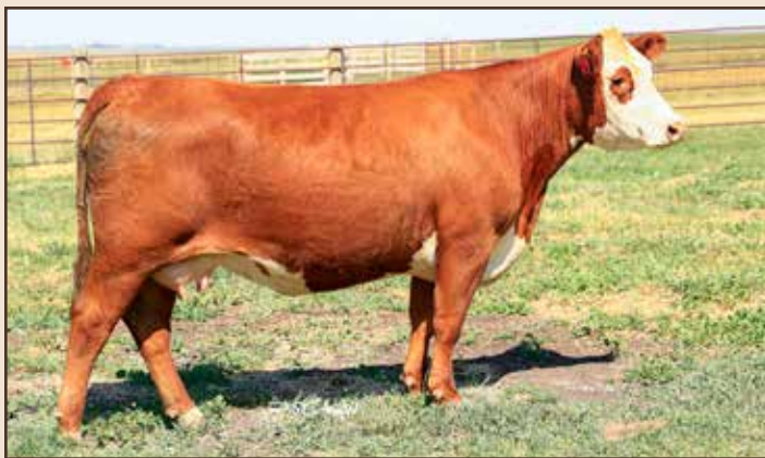
Lot 37 – HH MISS ADVANCE 0002H ET