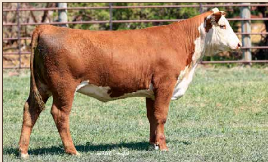
Lot 57 – HH MISS ADVANCE 2279K ET