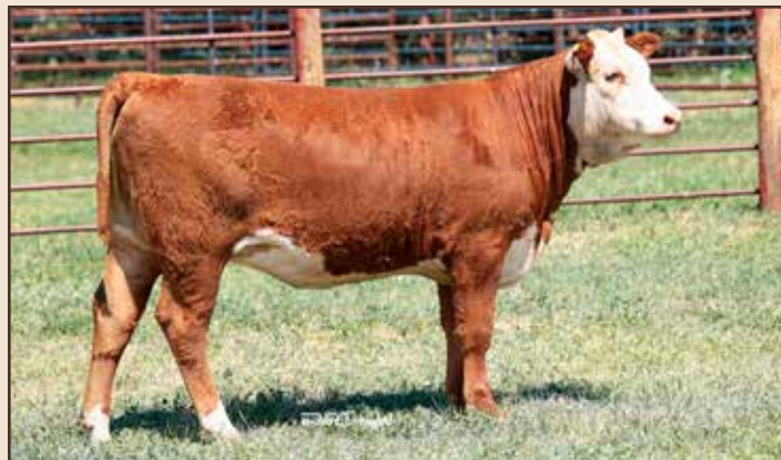
Lot 51 – HH MISS ADVANCE 2294K ET