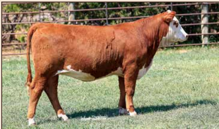
Lot 50 – HH MISS ADVANCE 2292K ET

Here is an opportunity to dip into the very best of our fall heifer group. We are moving away from our fall calving herd so have decided to offer almost all of our 2022 fall heifer crop in this sale. This is a group of females you could really start a program with. There are many ET heifers and natural calves from donor cows in this group. Look at the combination of EPDs, phenotype, and maternal strength in this group and help yourself.