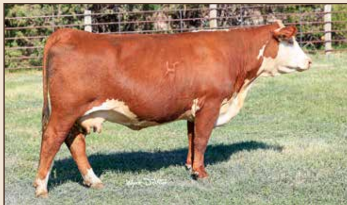
Lot 26 — HH MISS ADVANCE 1042J ET