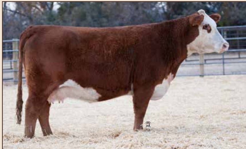
Lot 3 – HH MISS ADVANCE 8339F