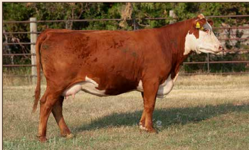
HH MISS ADVANCE 9139G – Dam of Lots 50 and 51