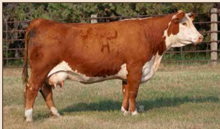
HH MISS ADVANCE 8065F ET — Dam of Lots 25 and 26