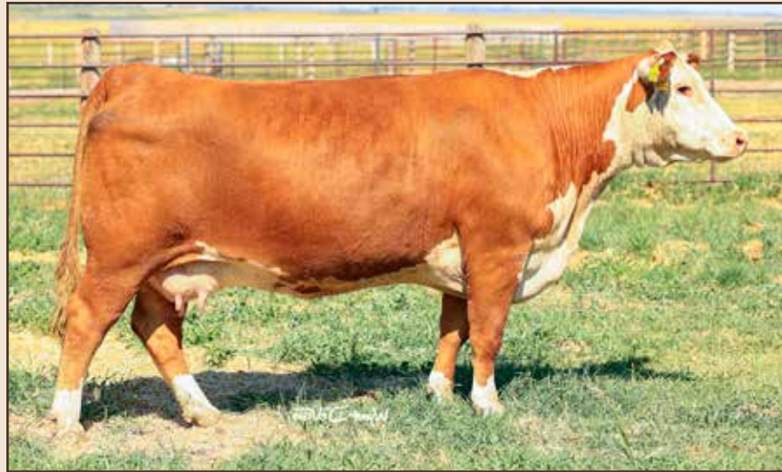
Lot 5 – HH MISS ADVANCE 9316G ET