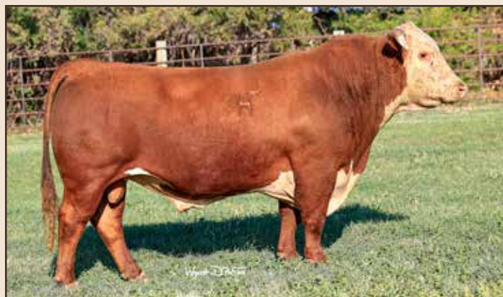
HH ADVANCE 0270H