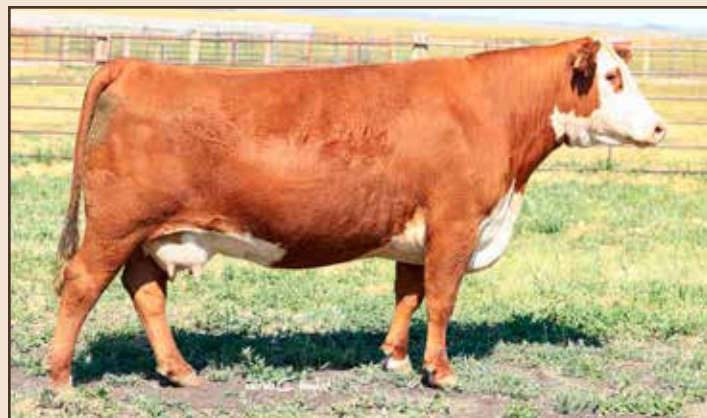
Lot 43 — HH MISS ADVANCE 8016F