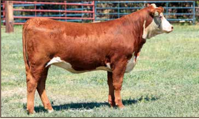
Lot 52 – HH MISS ADVANCE 2249K ET