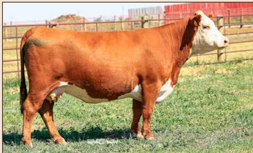
Lot 4 – HH MISS ADVANCE 9016G ET