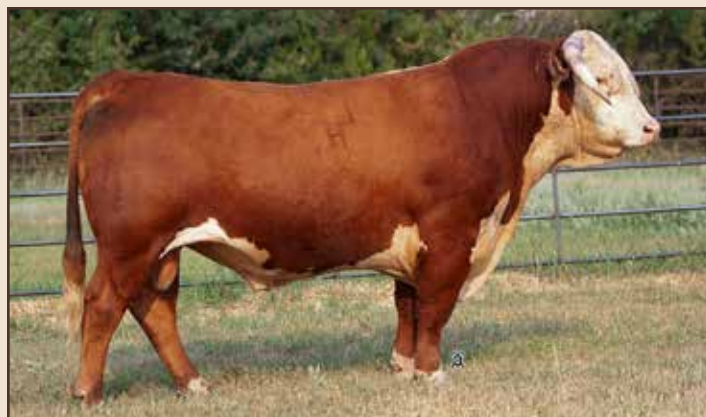
CL 1 DOMINO 8146F IET

Service C SIRE CL 1 DOMINO 0176H IET {DLF,HYF,IEF,MSUDF} 44141284 – Calved: 1/28/20 – Tattoo: RE: / LE: 176