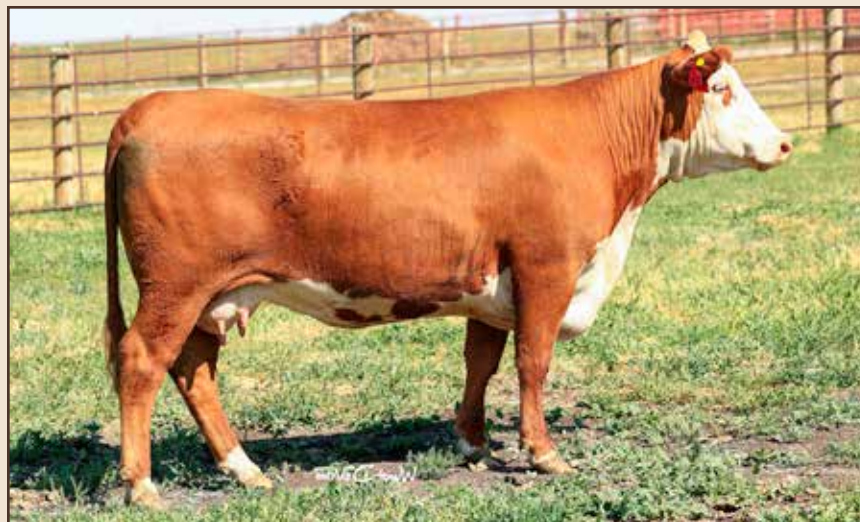
Lot 7 — HH MISS ADVANCE 0242H