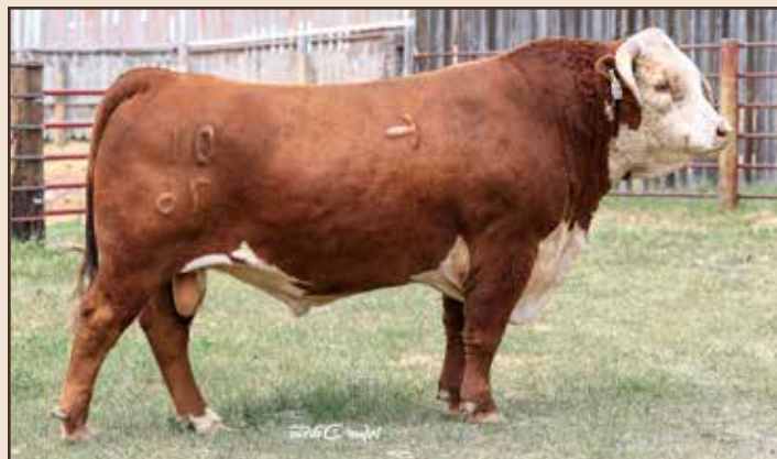
CL 1 DOMINO 0176H IET

Service D SIRE HH ADVANCE 0270H {DLF,HYF,IEF,MSUDF,MDF} 44203436 – Calved: 8/4/20 – Tattoo: RE: 270 / LE: 270