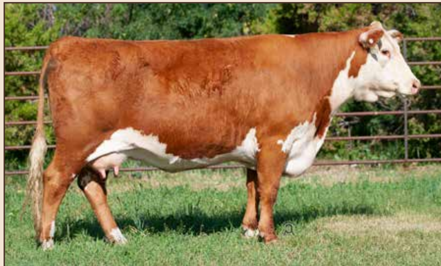
Lot 10 – HH MISS ADVANCE 5062C ET