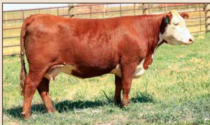
Lot 31 – HH MISS ADVANCE 1161J