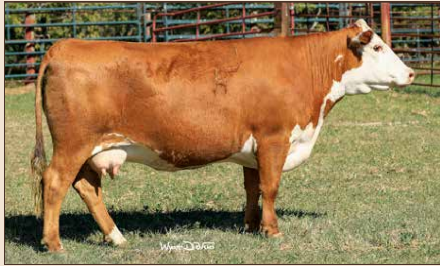
Lot 1 – HH MISS ADVANCE 8099F ET