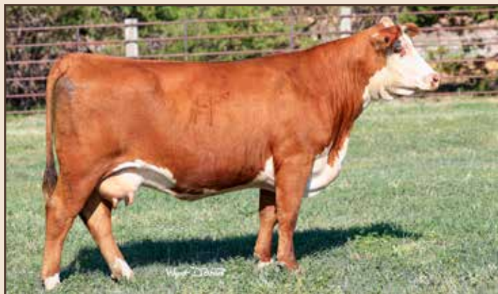
Lot 25 — HH MISS ADVANCE 1014J ET