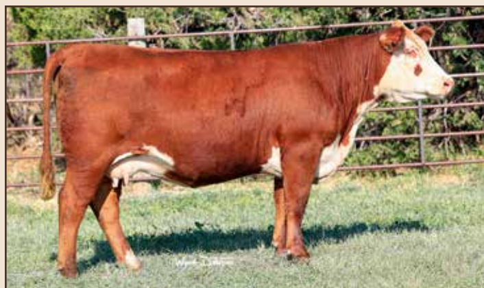
Lot 36 — HH MISS ADVANCE 1255J