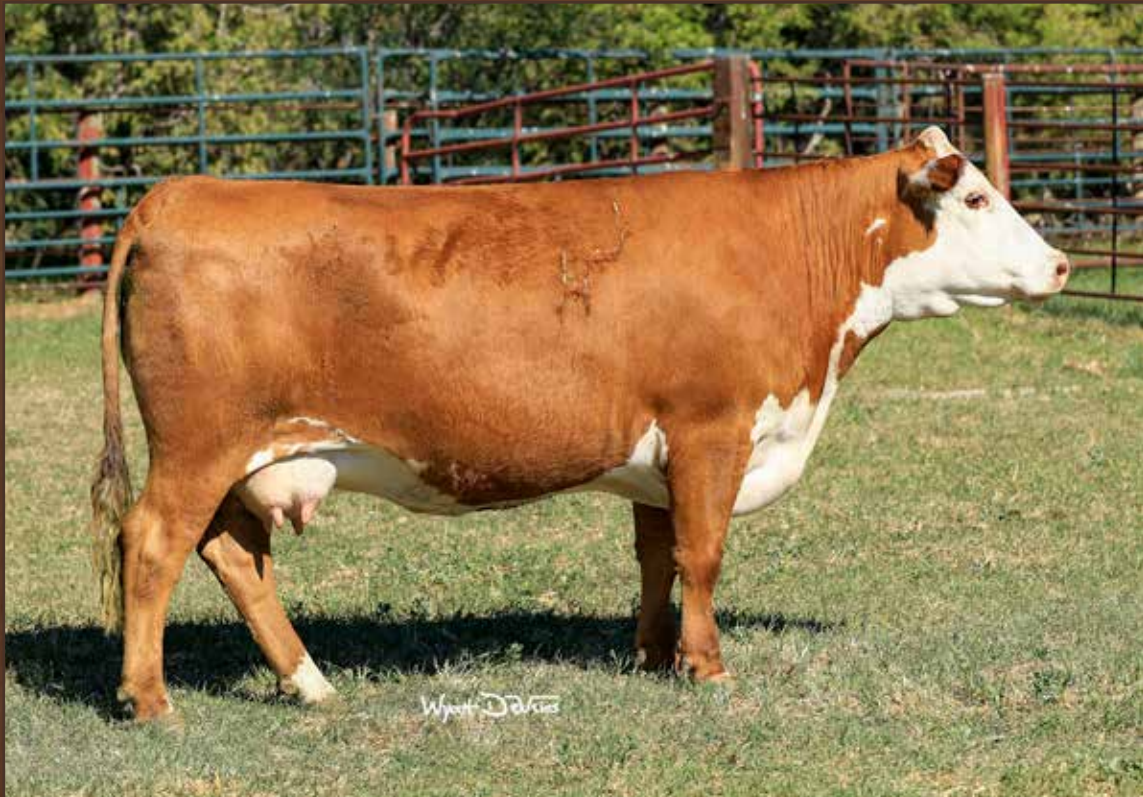
Lot 1 – HH MISS ADVANCE 8099F ET