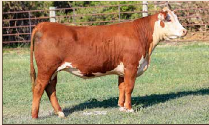
Lot 12 – HH MISS ADVANCE 2013K ET

This is another outstanding set of bred heifers on offer this year with many potential future donor prospects. You will admire the combination of EPDs, phenotype, and cow power in this stellar group. They are all bred to the HH Advance 0270H bull that topped our 2022 Sale at $95,000 for ½ interest. Due date and pregnancy status will be available in late August.