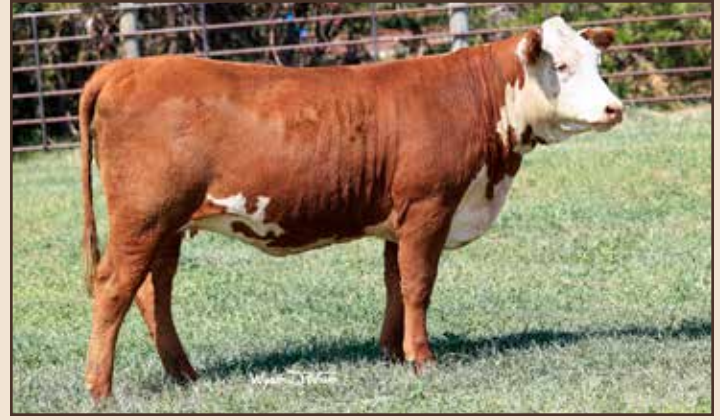
Lot 53 – HH MISS ADVANCE 2262K ET