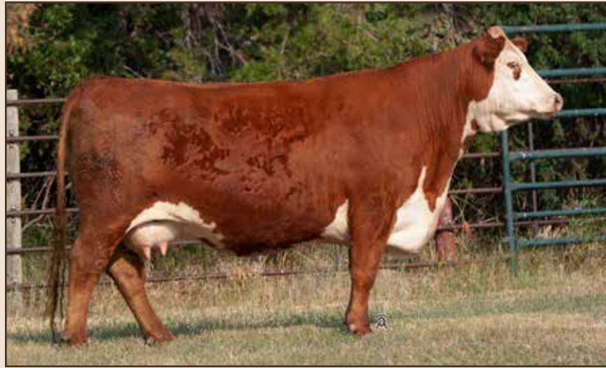
Lot 9 – HH MISS ADVANCE 7112E