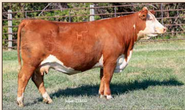
Lot 32 – HH MISS ADVANCE 1166J