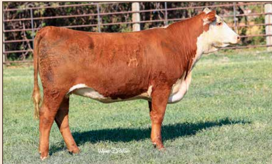
Lot 2 – HH MISS ADVANCE 2154K