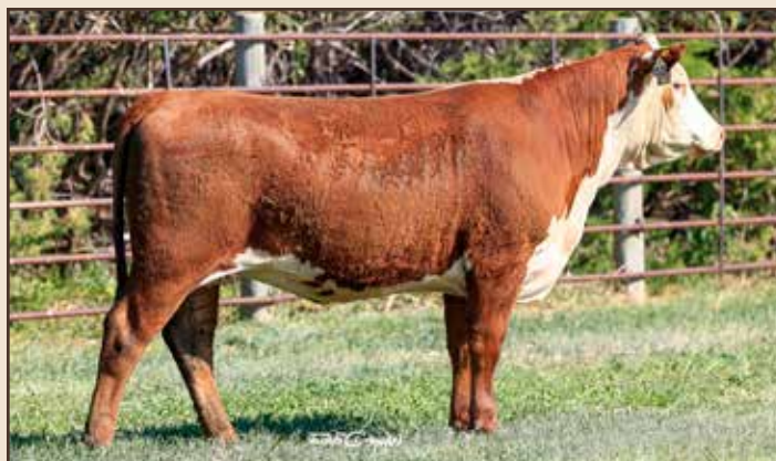
Lot 13 – HH MISS ADVANCE 2125K ET