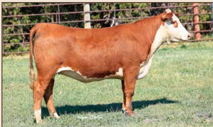
Lot 20 – HH MISS ADVANCE 2166K