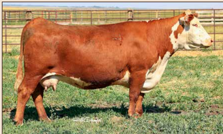
Lot 8 — CL 1 DOMINETTE 711E 1ET