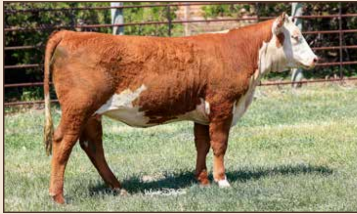
Lot 63 – HH MISS ADVANCE 2318K ET