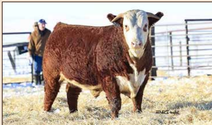
HH ADVANCE 2116K ET