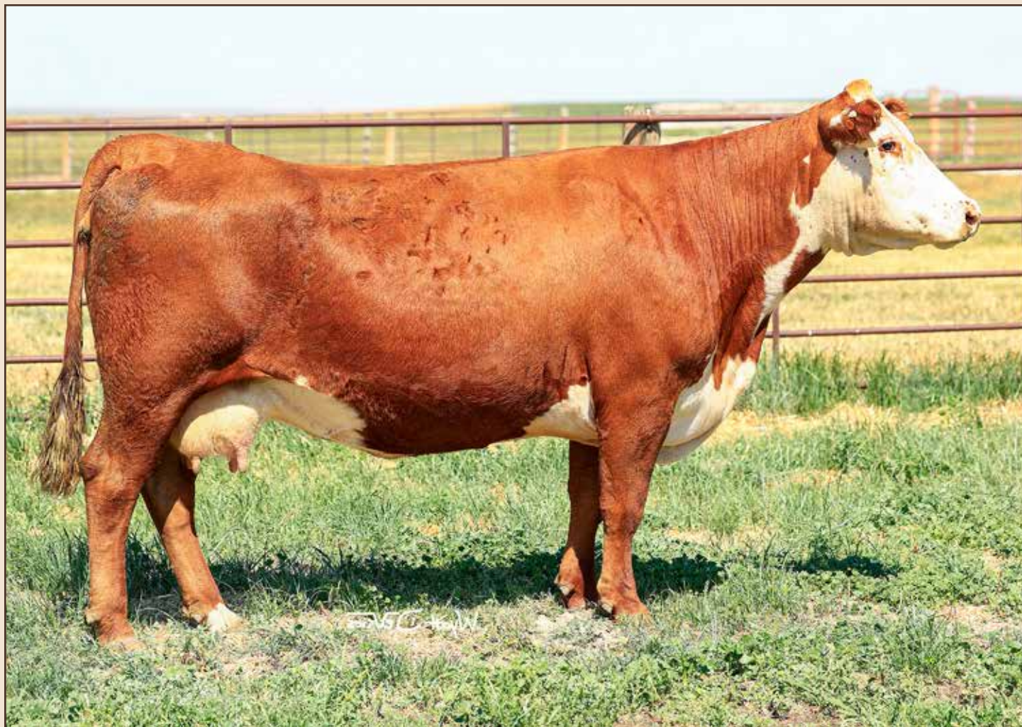
Lot 48 – HH MISS ADVANCE 5245C