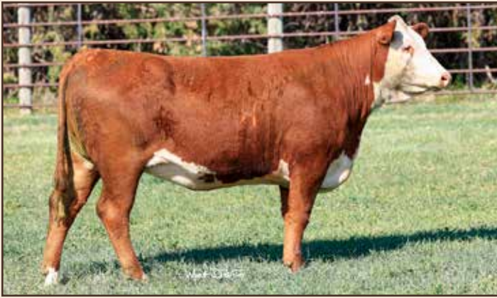
Lot 14 – HH MISS ADVANCE 2136K