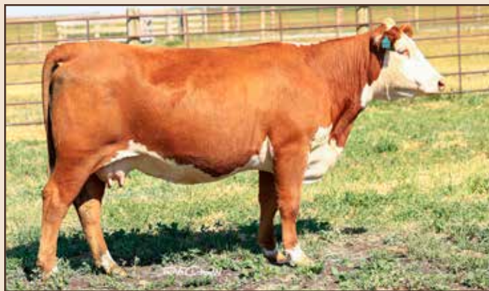
Lot 34 — HH MISS ADVANCE 1209J