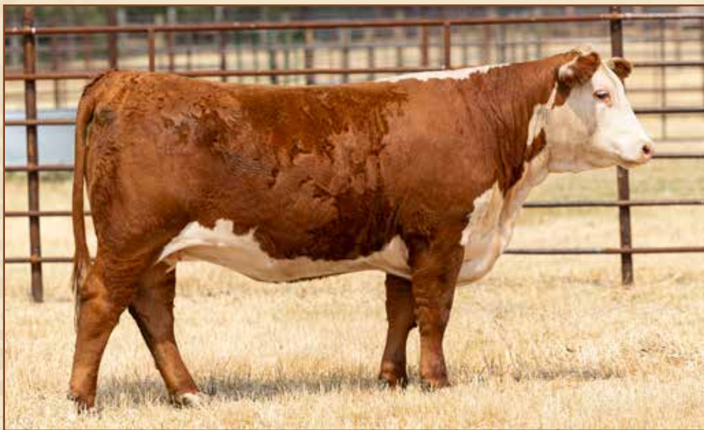
Lot 3 – HH MISS ADVANCE 3003L