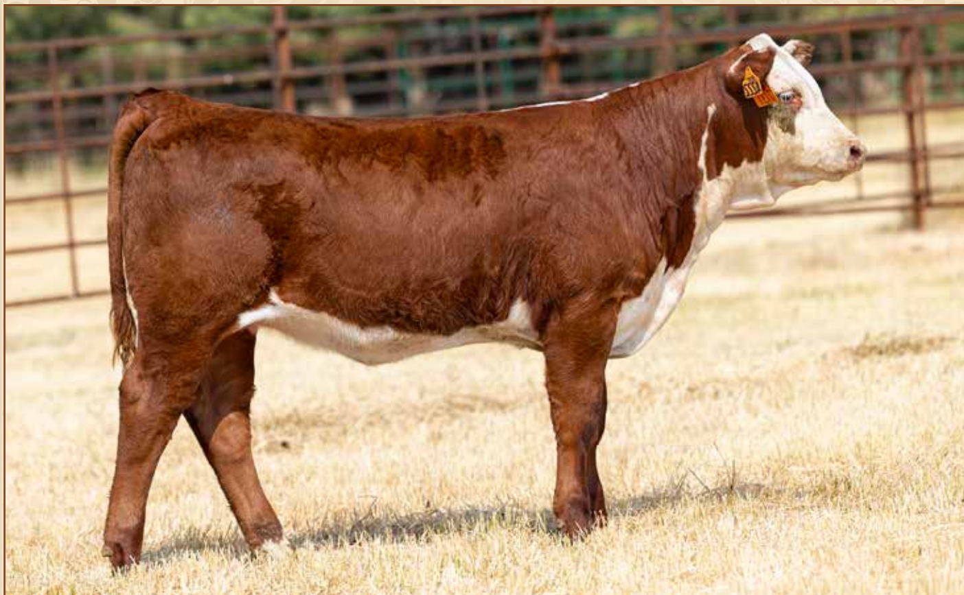
Lot 27 – HH MISS ADVANCE 4222M ET