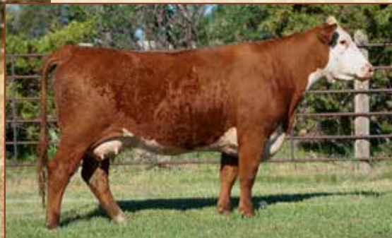
HH MISS ADVANCE 9017G ET – Dam of Lots 47, 68, 70 and 71