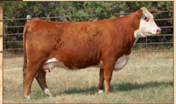
HH MISS ADVANCE 8046F — Dam of Lot 20