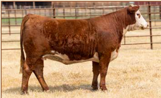
Lot 21 — HH MISS ADVANCE 3153L