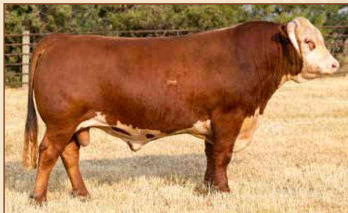
HH ADVANCE 2116K

Service HH ADVANCE 3107L ET {DLF,HYF,IEF,MSUDF,MDF,DBF} 44454247 – Calved: 1/13/23 – Tattoo: BE 3107