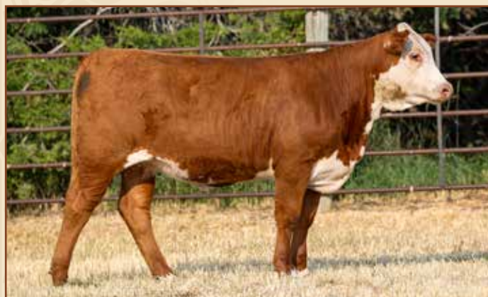
Lot 74 — HH MISS ADVANCE 3307L

Lot 74 COW HH MISS ADVANCE 3307L {DLF,HYF,IEF,MSUDF} 44518914 — Calved: 8/30/23 — Tattoo: BE 3307