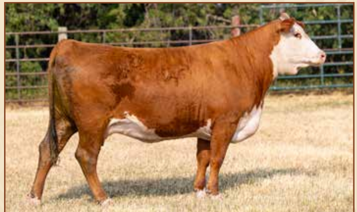
Lot 30 – HH MISS ADVANCE 2104K ET