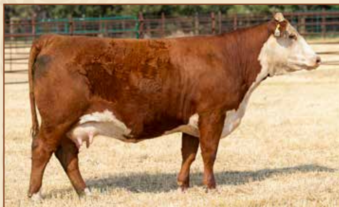
Lot 35 — HH MISS ADVANCE 2047K ET