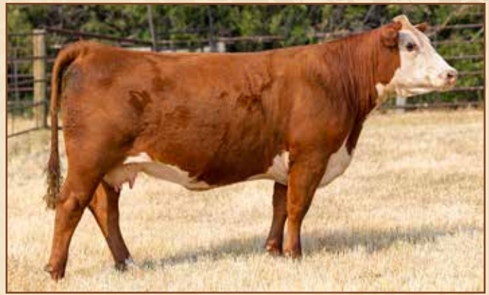
Lot 36 — HH MISS ADVANCE 2079K