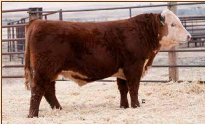
HH ADVANCE 1128J ET – Son of 6169D