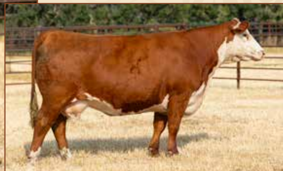
HH MISS ADVANCE 8237F – Dam of Lot 10