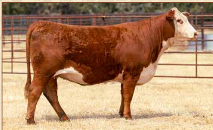
Lot 11 – HH MISS ADVANCE 3033L ET

Lot 11 COW HH MISS ADVANCE 3033L ET {DLF,HYF,IEF,MSUDF} 44454178 – Calved: 1/5/23 – Tattoo: BE 3033