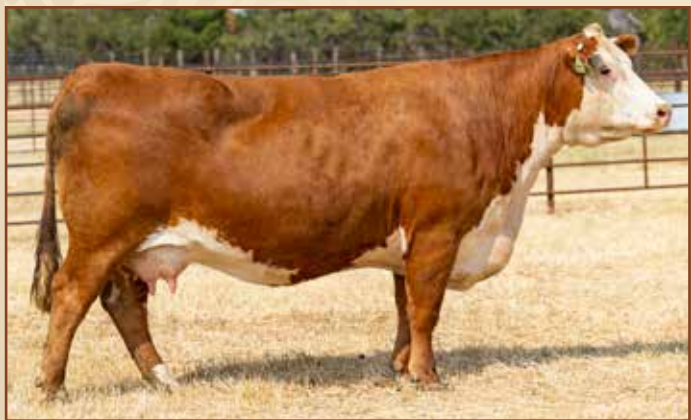
Lot 54 – HH MISS ADVANCE 7287E