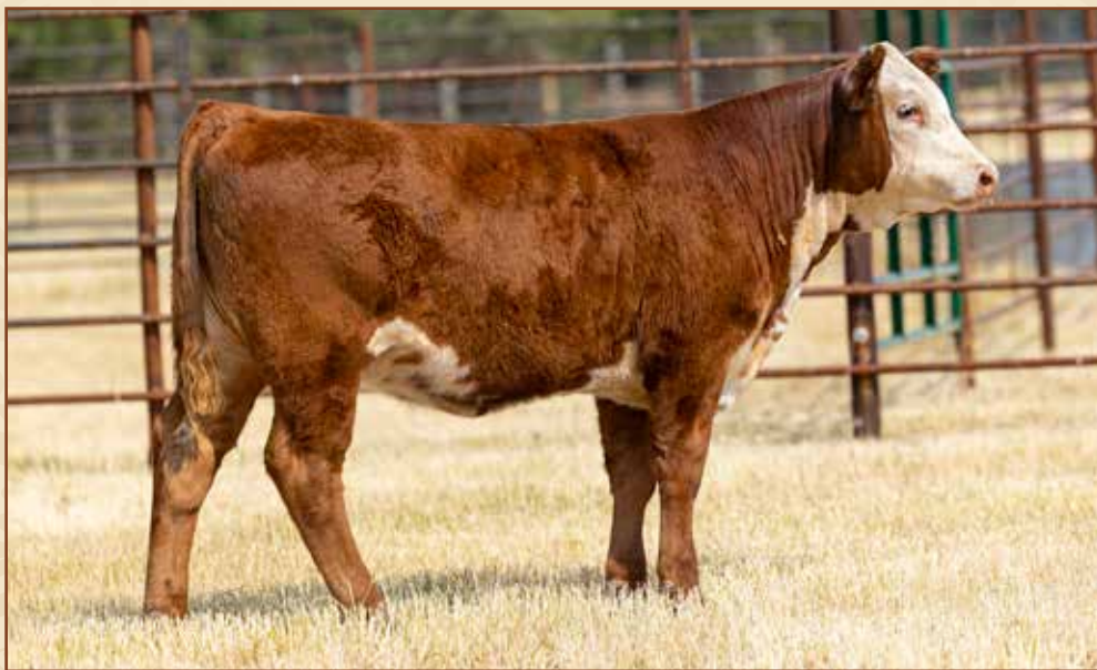
Lot 5 – HH MISS ADVANCE 4006M ET