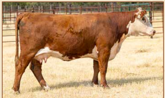
Lot 39 — HH MISS ADVANCE 2111K ET