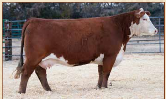
HH MISS ADVANCE 7210E — Dam of Lots 34 and 40