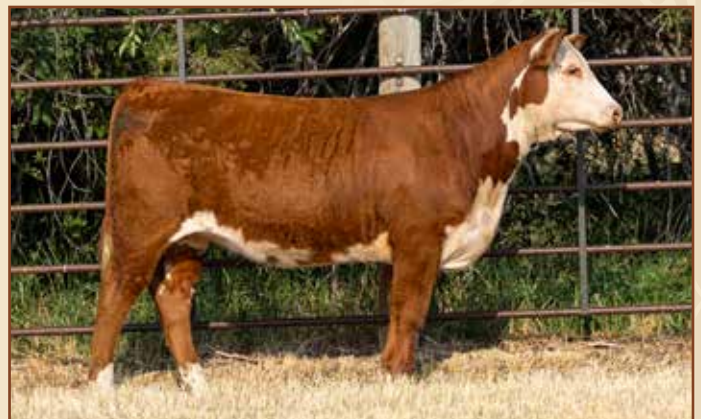
Lot 78 – HH MISS ADVANCE 3323L ET