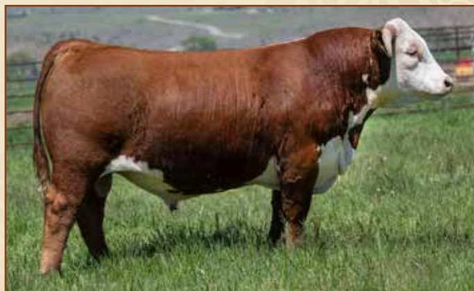
HH ADVANCE 3107L ET