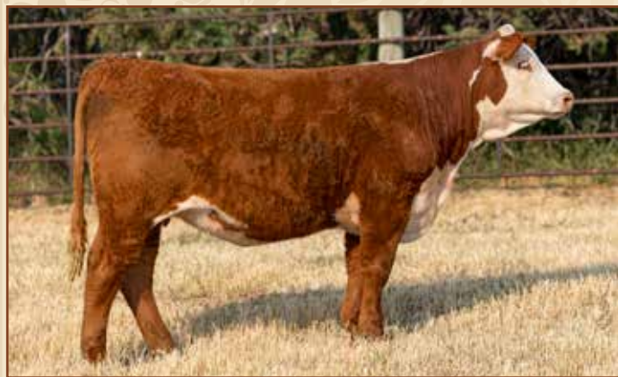
Lot 72 — HH MISS ADVANCE 3300L

Lot 72 COW HH MISS ADVANCE 3300L {DLF,HYF,IEF,MSUDF} 44518907 — Calved: 8/21/23 — Tattoo: BE 3300