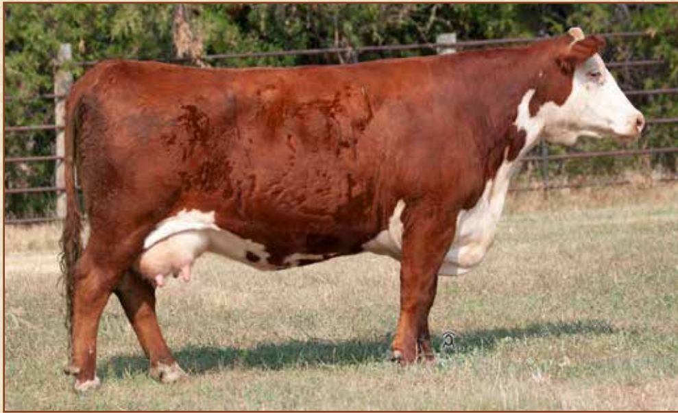
Lot 4 – HH MISS ADVANCE 7005E ET