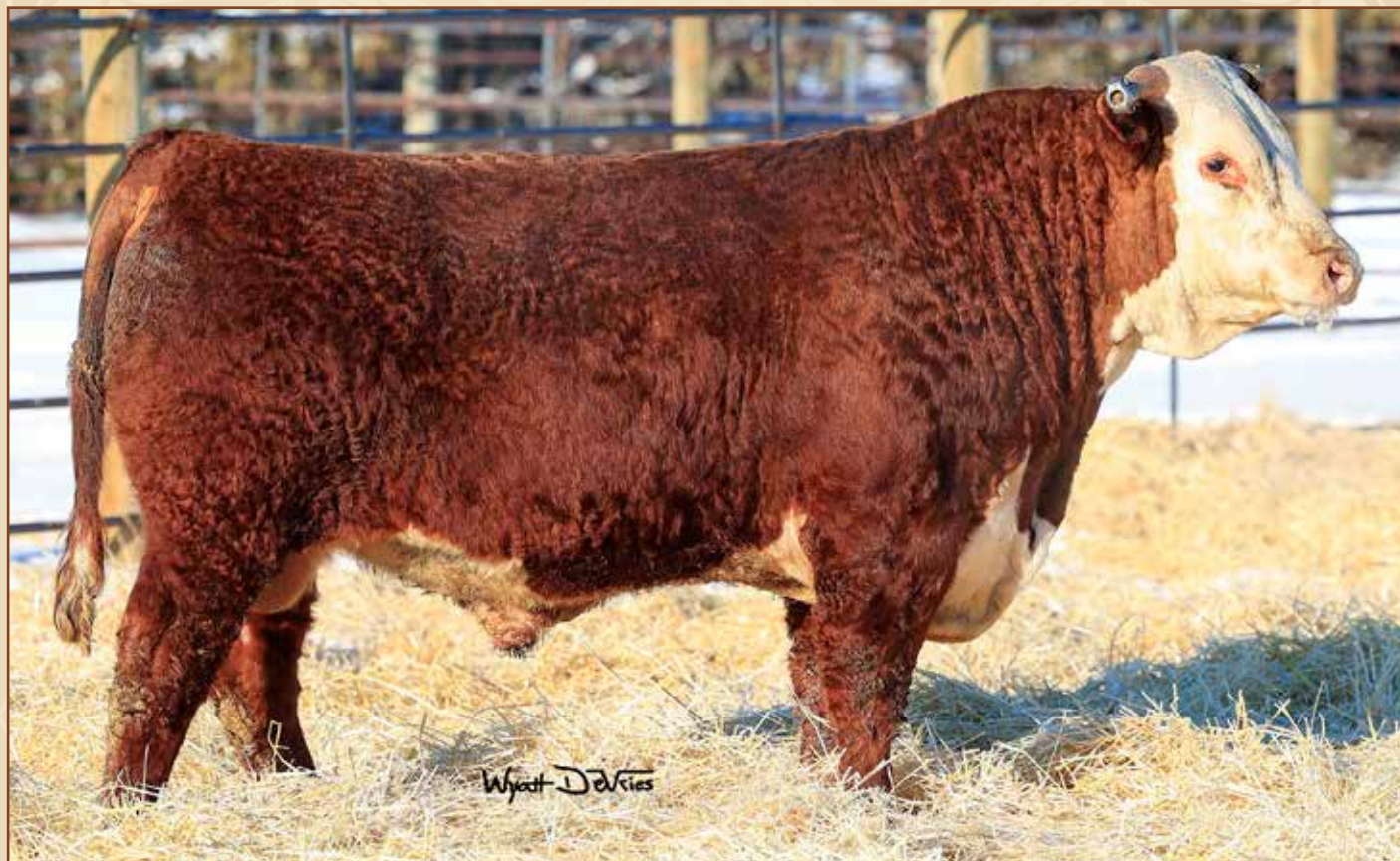
HH Advance 2031K ET – Service Sire for Lots 57 to 66