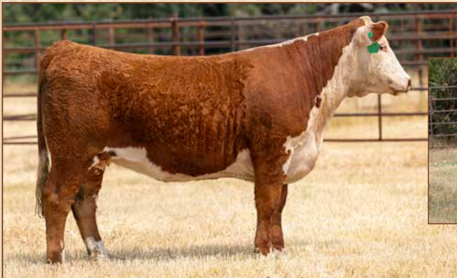
Lot 20 — HH MISS ADVANCE 3137L ET