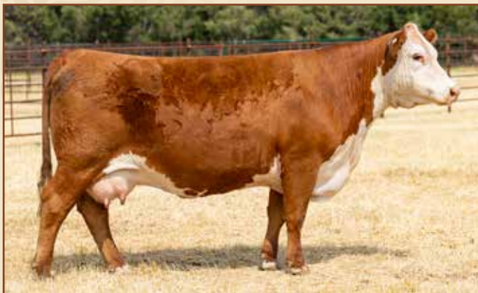
Lot 8 — HH MISS ADVANCE 7032E

Lot 8 COW HH MISS ADVANCE 7032E {DLF,HYF,IEF,MSUDF} 43786137 — Calved: 1/2/17 — Tattoo: BE 7032