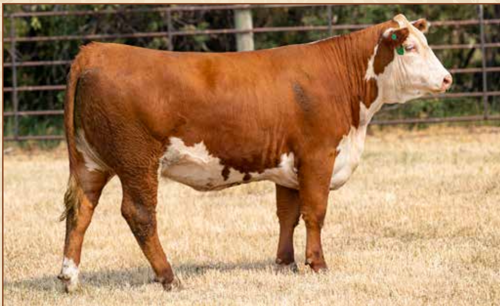
Lot 15 — HH MISS ADVANCE 3051L ET