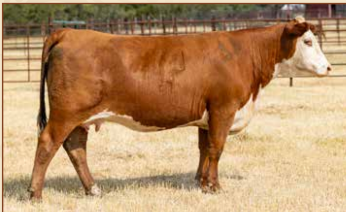
Lot 42 — HH MISS ADVANCE 2204K