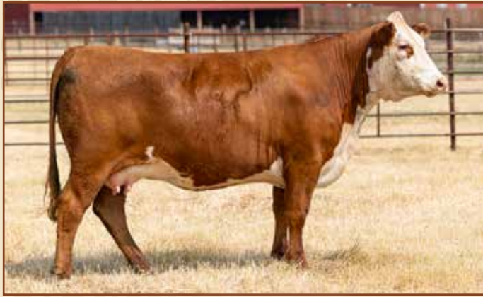
Lot 41 — HH MISS ADVANCE 2146K