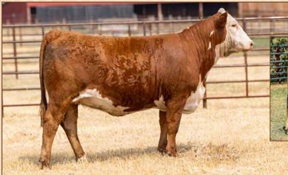
Lot 9 – HH MISS ADVANCE 3079L ET

Hands down the best set of bred heifers we have ever had in a fall sale. The depth of quality and EPDs on this group is exceptional. There are several future donors included in this set. They are all exposed to HH Advance 2116K to calve March 1st to April 20th. Due date and pregnancy status will be available in late August.