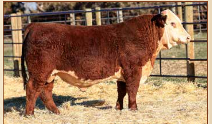
HH ADVANCE 2322K ET – Son of 6169D