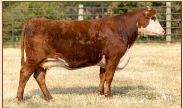
Lot 29 – HH MISS ADVANCE 2075K