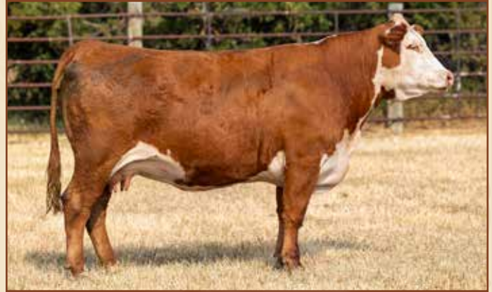
Lot 28 – HH MISS ADVANCE 2017K