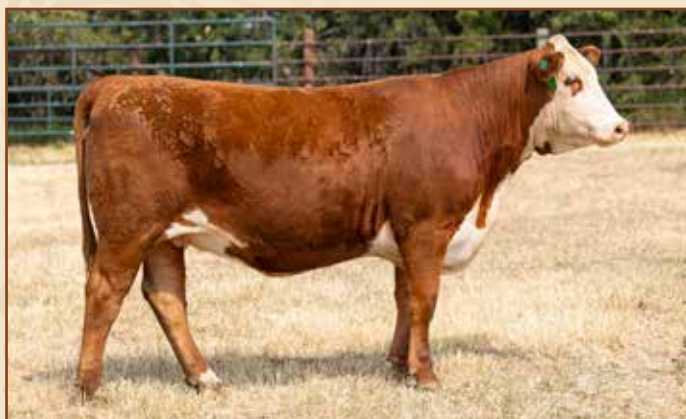
Lot 12 – HH MISS ADVANCE 3039L ET

Lot 12 COW HH MISS ADVANCE 3039L ET {DLF,HYF,IEF,MSUDF} 44454184 – Calved: 1/6/23 – Tattoo: BE 3039