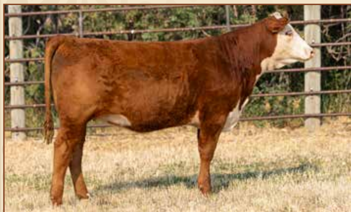
Lot 76 — HH MISS ADVANCE 3316L

Lot 76 COW HH MISS ADVANCE 3316L {DLF,HYF,IEF,MSUDF} 44518923 — Calved: 9/8/23 — Tattoo: BE 3316