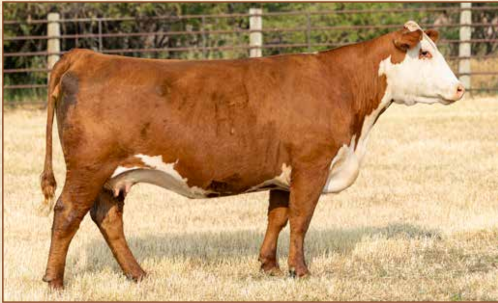
Lot 2 – HH MISS ADVANCE 1204J ET