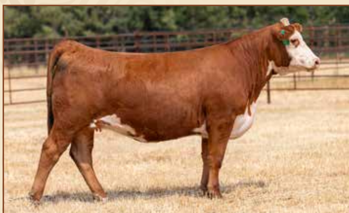
Lot 13 – HH MISS ADVANCE 3146L ET

Lot 13 COW HH MISS ADVANCE 3146L ET {DLF,HYF,IEF,MSUDF} 44454283 – Calved: 1/19/23 – Tattoo: BE 3146