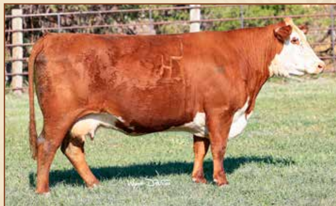
HH MISS ADVANCE 9136G — Dam of Lot 18