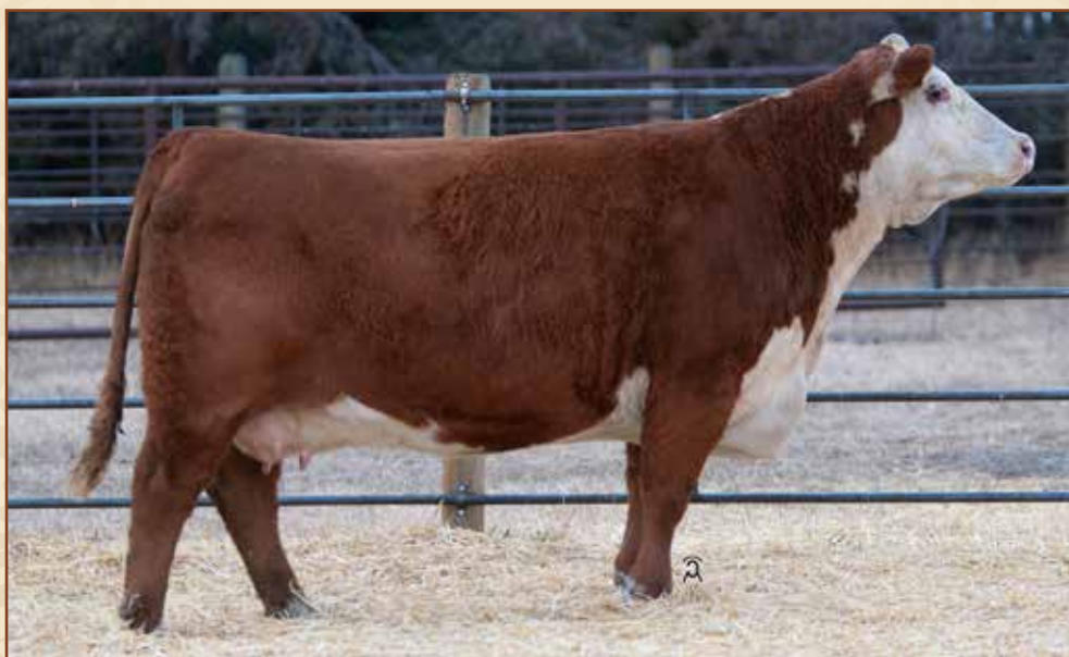
HH MISS ADVANCE 7131E ET – Dam of Lot 27