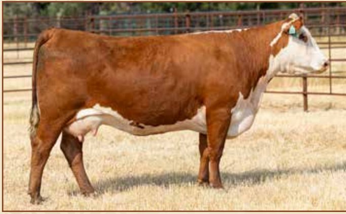
Lot 6 — HH MISS ADVANCE 1067J

Lot 6 COW HH MISS ADVANCE 1067J {DLF,HYF,IEF,MSUDF} 44238874 — Calved: 1/5/21 — Tattoo: BE 1067