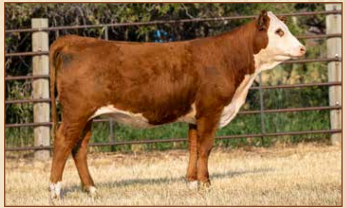
Lot 77 – HH MISS ADVANCE 3320L ET