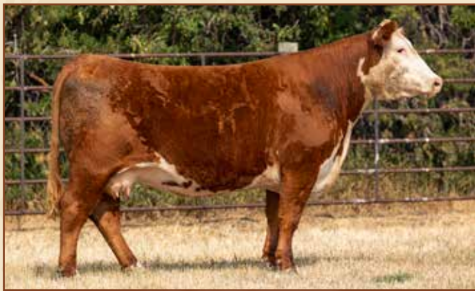
Lot 48 – HH MISS ADVANCE 1221J