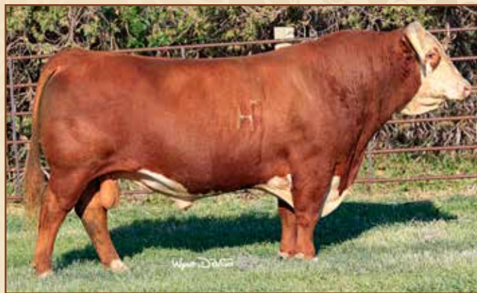
HH ADVANCE 0022H ET

Service HH ADVANCE 2123K {DLF,HYF,IEF,MSUDF,MDF} 44346775 – Calved: 1/13/22 – Tattoo: BE 2123