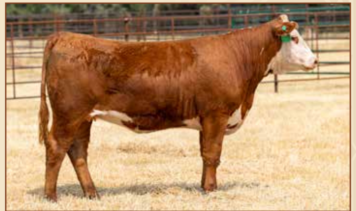
Lot 24 — HH MISS ADVANCE 3255L