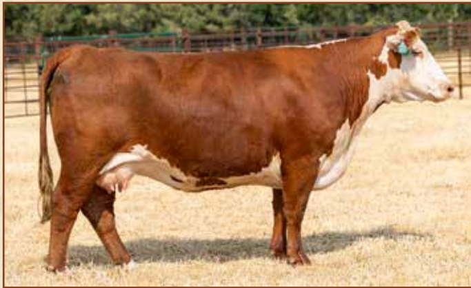
Lot 7 — HH MISS ADVANCE 1273J ET

Lot 7 COW HH MISS ADVANCE 1273J ET {DLF,HYF,IEF,MSUDF} 44239074 — Calved: 2/15/21 — Tattoo: BE 1273