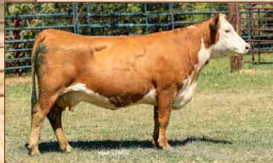
HH MISS ADVANCE 8123F – Dam of Lot 9