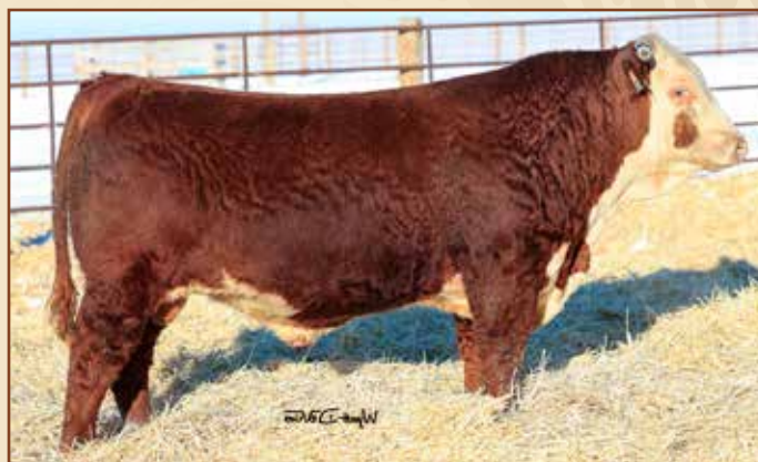
HH ADVANCE 2123K

Service HH ADVANCE 2116K {DLF,HYF,IEF,MSUDF,MDF} 44346768 – Calved: 1/13/22 – Tattoo: BE 2116