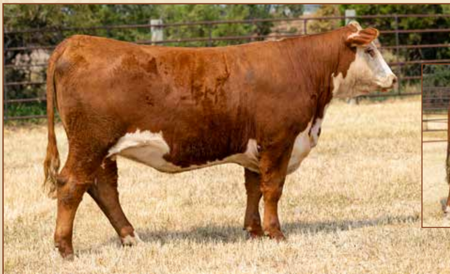
Lot 10 – HH MISS ADVANCE 3115L