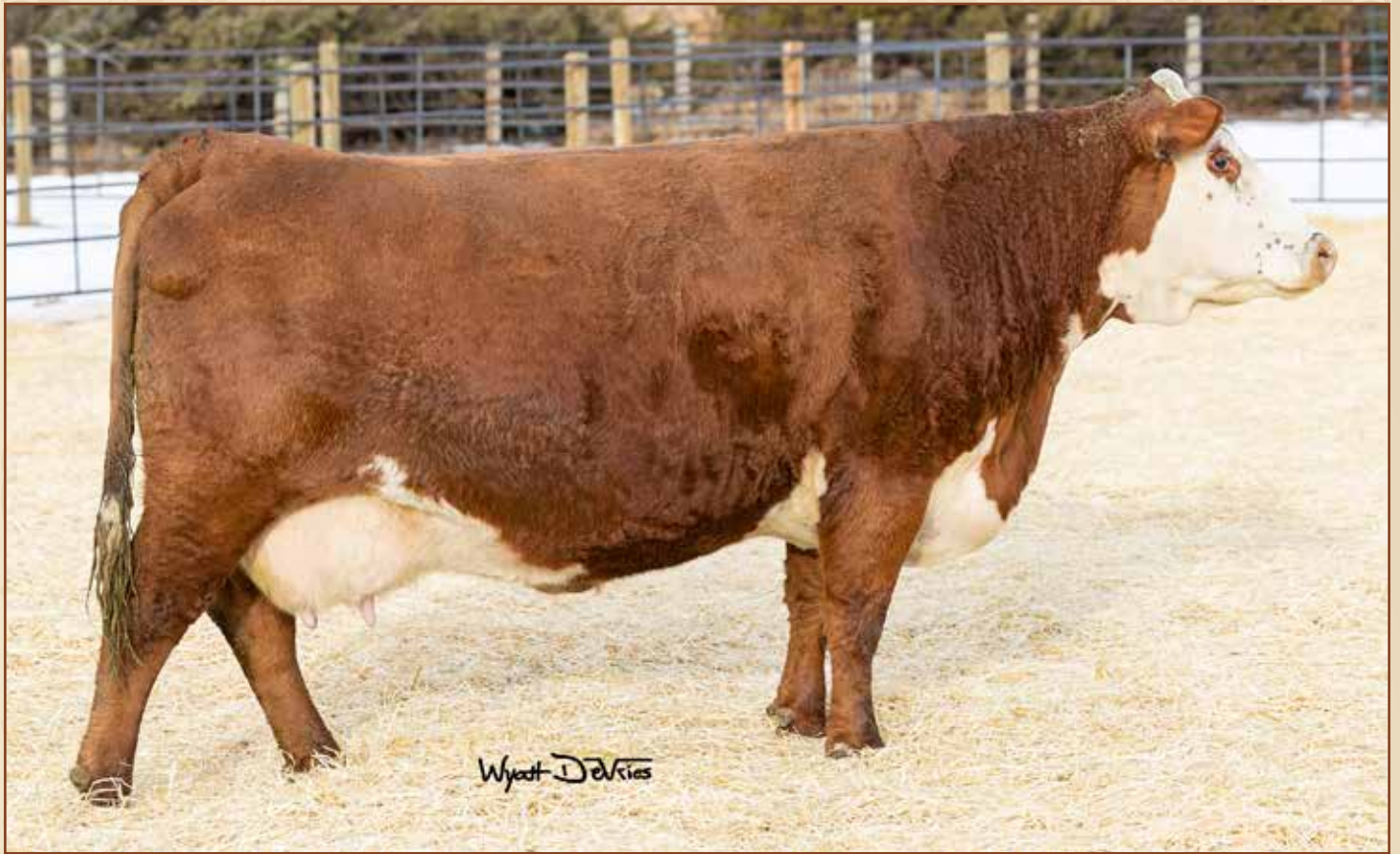
Lot 1 – HH MISS ADVANCE 6169D