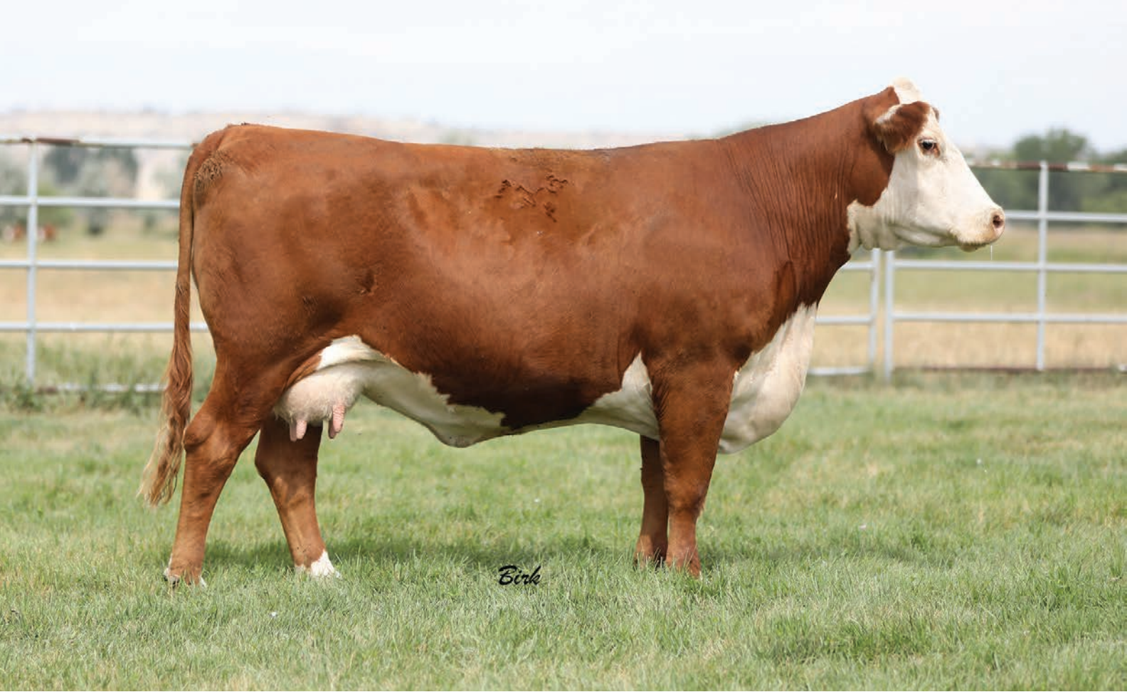
Lot 9--RVP 17Y Candy 101C