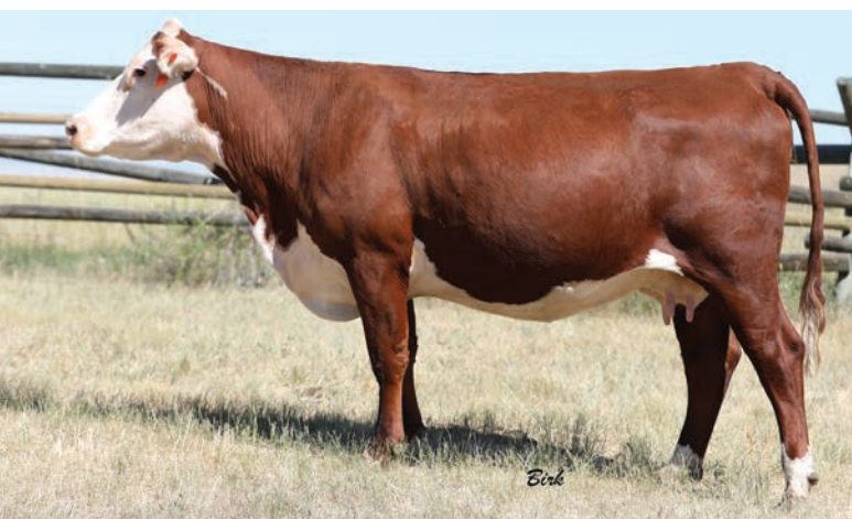
Lot 42--MC 751 10B Prairie Star 1745