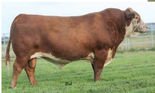
NJW 76S 27A Salute 201C--Featured Sire