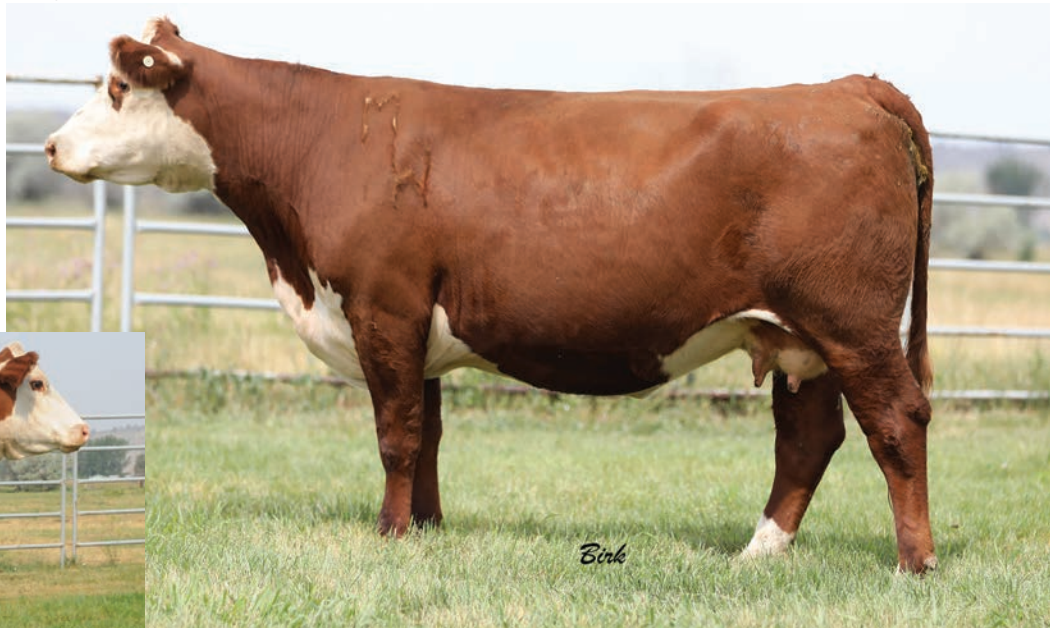
Lot 12--Mohican Carmel 401D ET