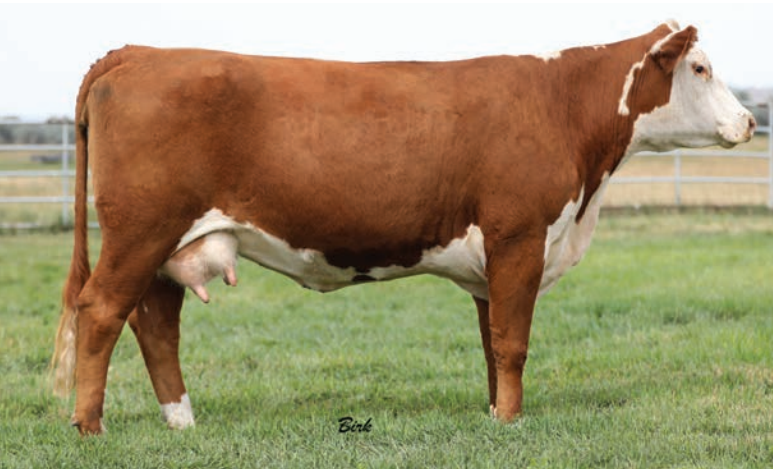
Lot 32--Mohican Lass 22D

31 TDP Lady 18D Cow P43689902..... CALVED: FEB 8, 2016 ..... TATTOO: LE-18D NJW 73S W18 HOMETOWN 10Y SHF WONDER M326 W18 ET MOHICAN TAKE CHARGE 417A ET NJW P606 72N DAYDREAM 73S P43386432 TH 223 711 DOMINETTE 404X ET DRF JWR PRINCE VICTOR 711 KBCR 19D DOMINETTE 223