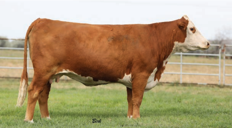
Lot 11--Mohican Mary Kay 34D