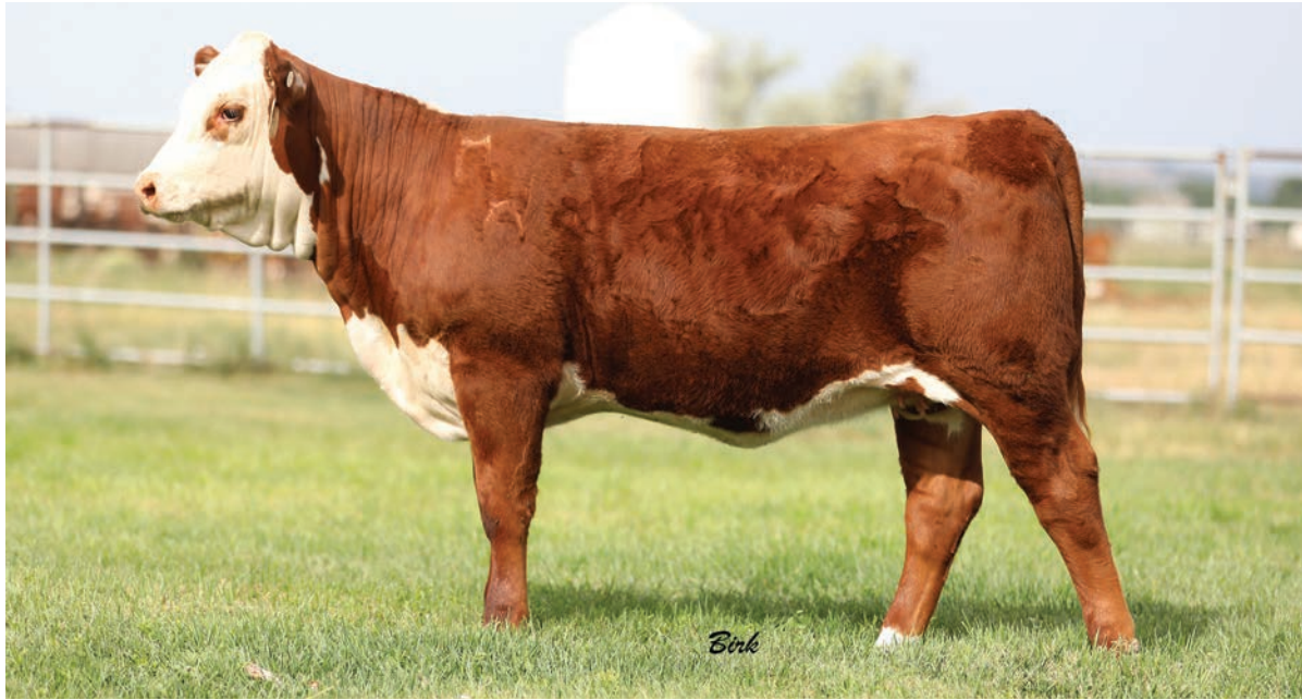
Lot 29A--TDP Peanut 55H

29 TDP Peanut 29D Cow P43690193.....CALVED: FEB 9, 2016 .....TATTOO: LE-29D