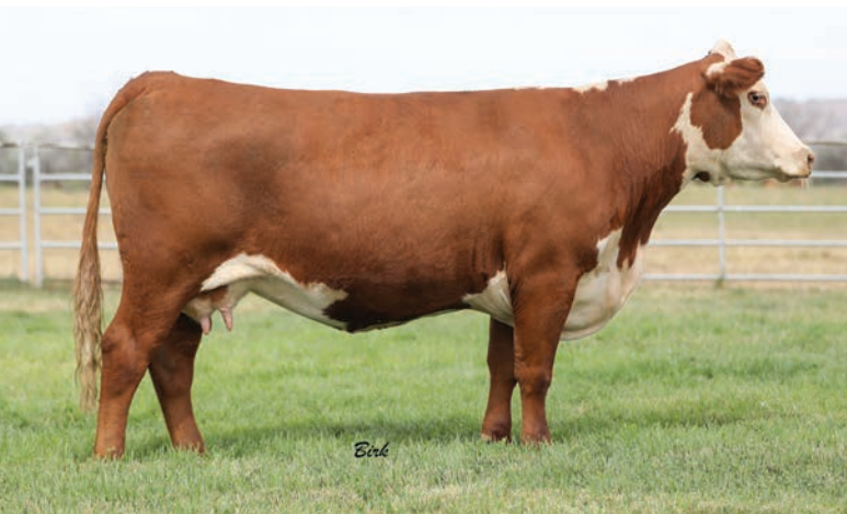
Lot 30--Walker JH Heidi 455B A299 621D

30 Walker JH Heidi 455B A299 621D Cow P43688156..... CALVED: JAN 30, 2016 ..... TATTOO: LE-621 FTF PROSPECTOR 145Y HUTH PROSPECTOR K085 FTF PORTERHOUSE 455B FTF CHICK A BOOM 7227T P43489292 FTF VERONICA 227Z TH 122 711 VICTOR 719T FTF FABULOUS 097X