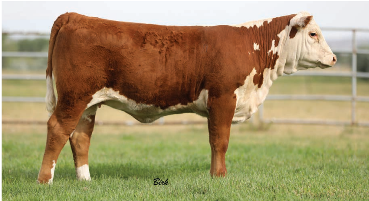
Lot 5A--Mohican Irene 92H