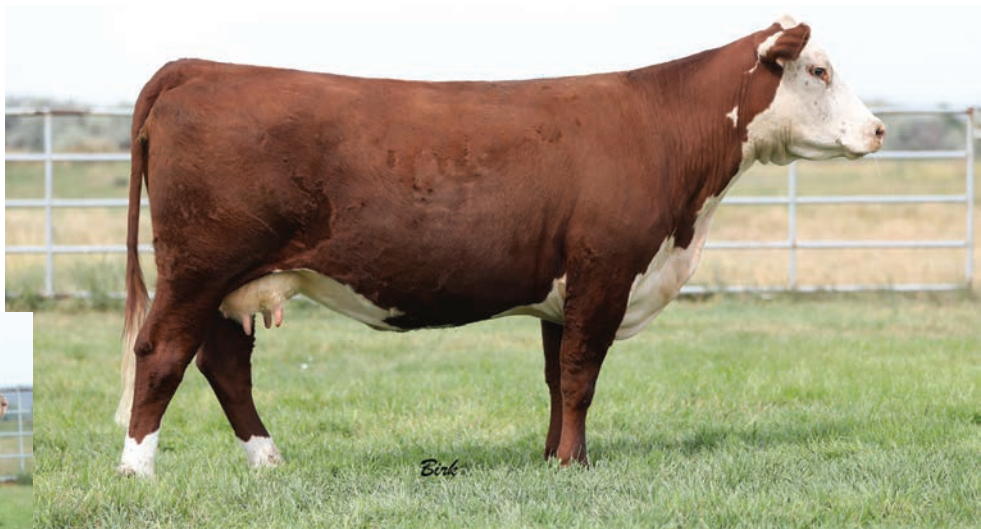
Lot 29--TDP Peanut 29D