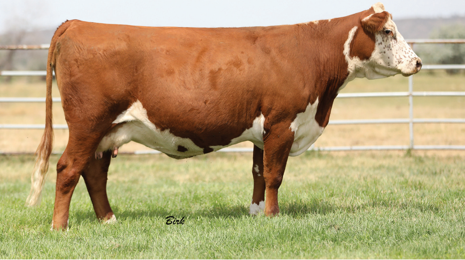
Lot 1--Mohican Mattie 122D