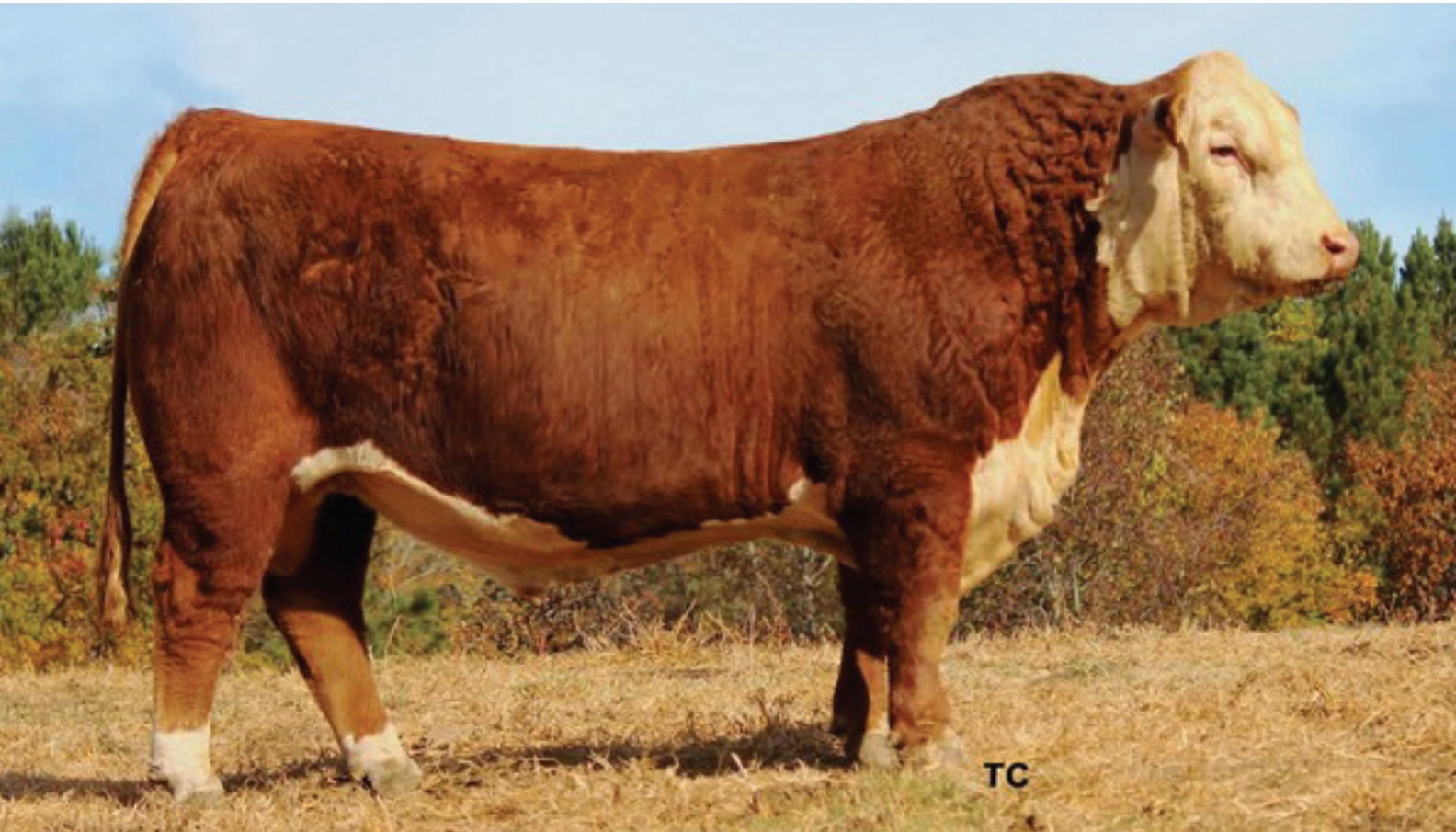
Innisfail WHR X651/723 4013 ET--Featured Sire, owned with White Hawk Ranch & ST Genetics Mohican West & Guest