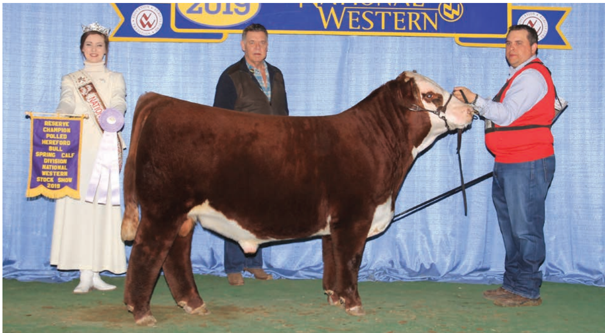
H Bell Ringer 8459 ET (43915089)--Featured AI Sire