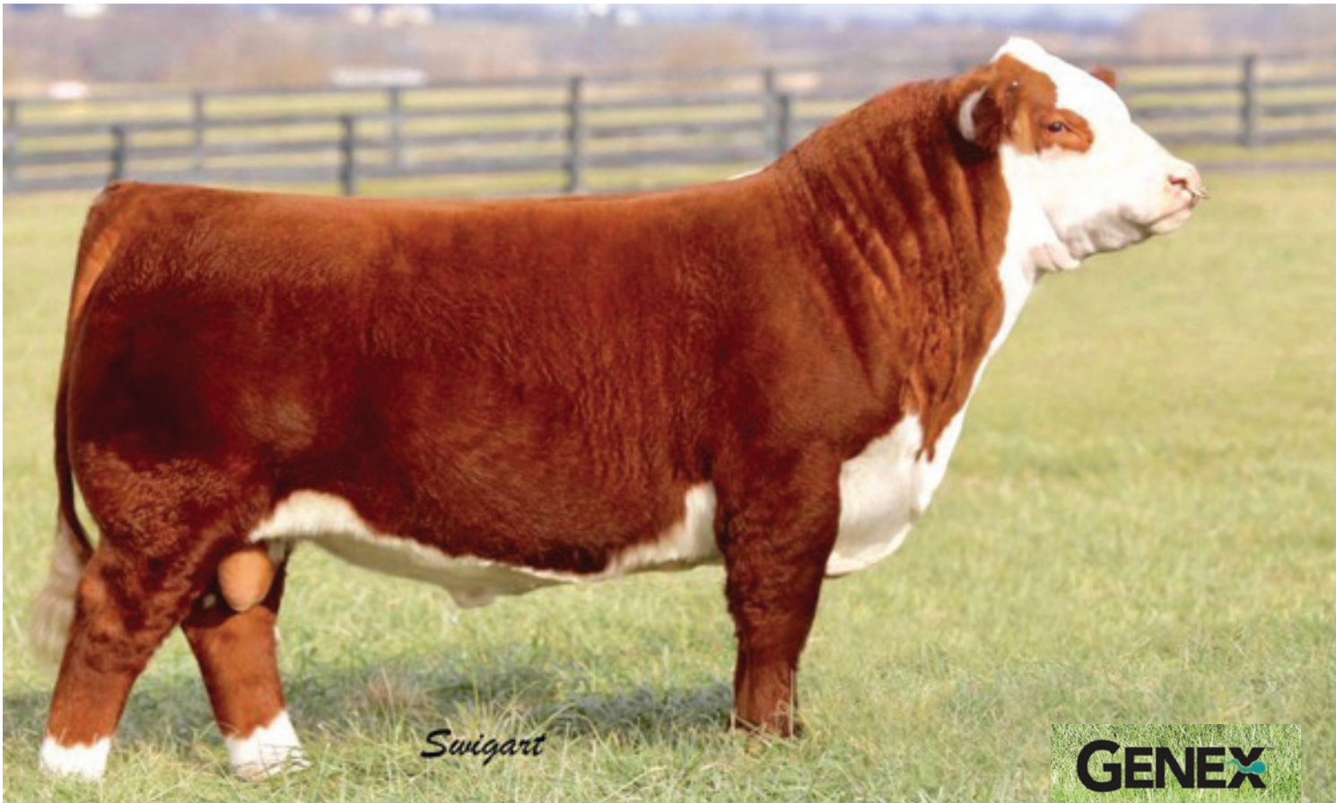
Boyd 31Z Blueprint 6153--Featured Sire, owned with Boyd Beef Cattle & Genex