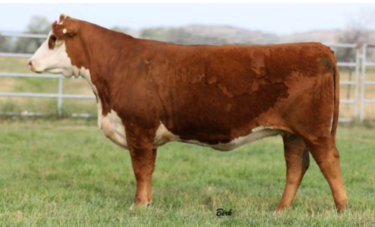
Lot 20--HH Miss Princess 36F ET

20 HH Miss Princess 36F ET Heifer P44021544..... CALVED: SEP 22, 2018 ..... TATTOO: LE-36F HYALITE ON TARGET 936 SCHU-LAR ON TARGET 22S R LEADER 6964 HYALITE TS LASS 310 P43500058 R MISS REVOLUTION 1009 MSU TCF REVOLUTION 4R R MISS WRANGLER 3007