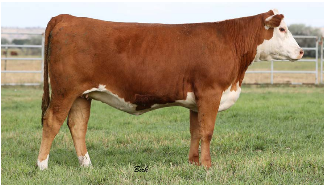
Lot 16--Mohican Tracy 38G