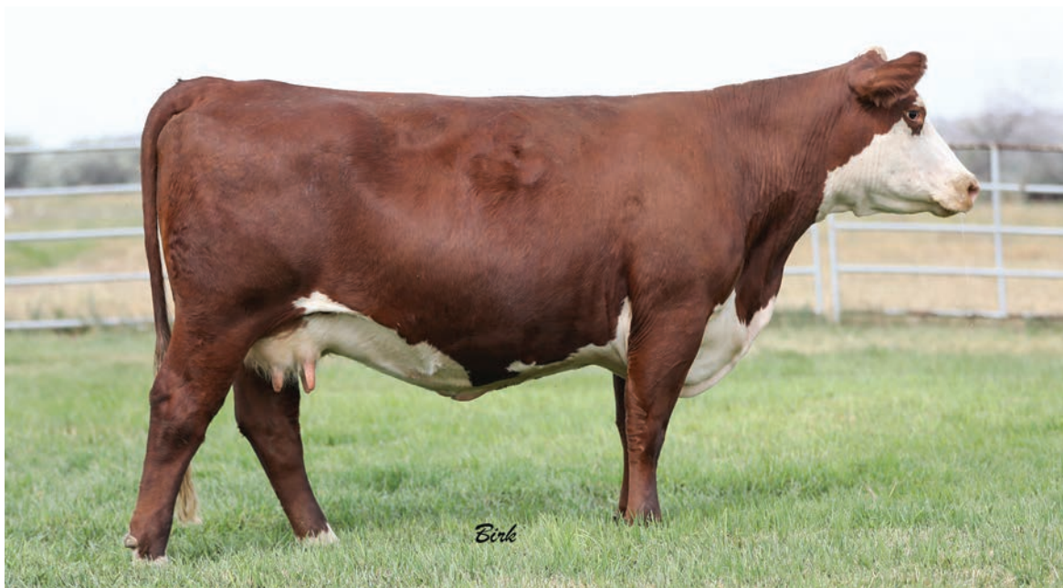
Lot 3--Mohican Good Plus 95D