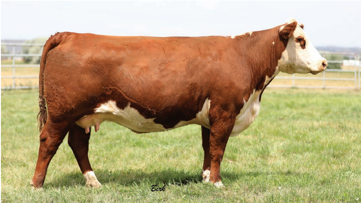
Lot 8--Perks 1014 Lifeline Lady 6103