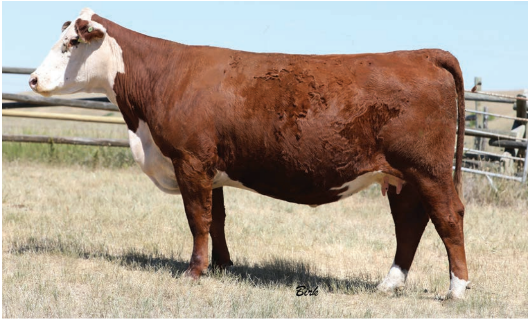
Lot 40--Square-D Lucie 757E