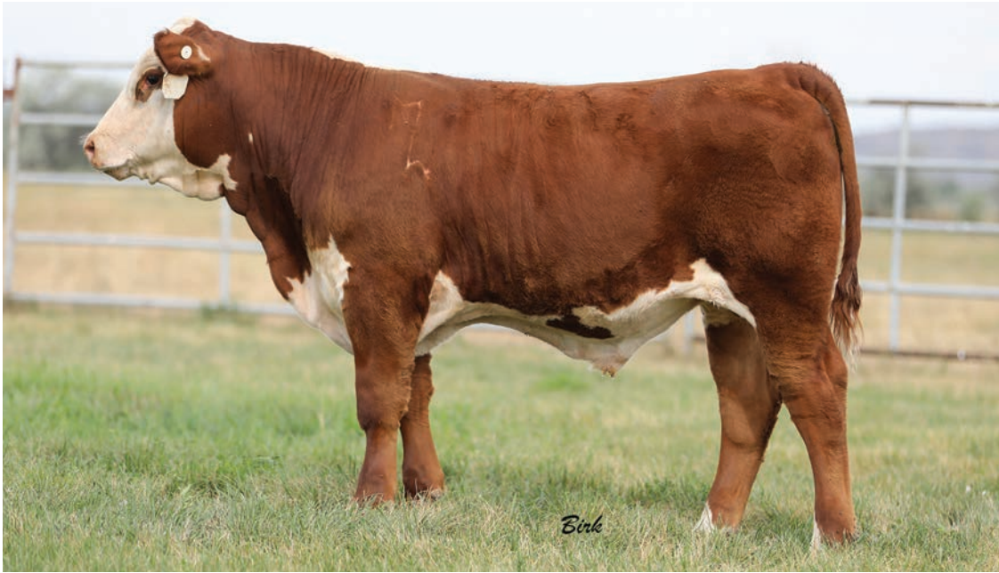
Lot 21A--Mohican Weigh Up 108H

21 ANL 17A Brnady 109Z 53D Cow P43778750..... CALVED: FEB 18, 2016 ..... TATTOO: RE-KKL 53D