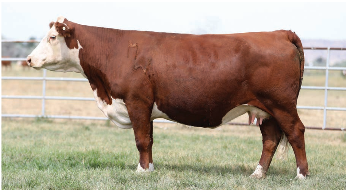
Lot 2--Mohican Advance 10D