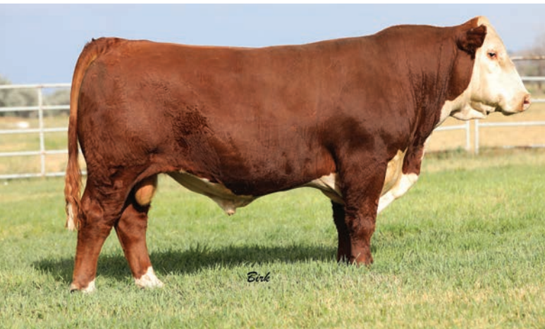
Mohican Sure Fire 76G--Service Sire for Lots 15-19

Ref. Mohican Sure Fire 76G Bull P44023999..... CALVED: FEB 19, 2019 ..... TATTOO: LE-76G CHURCHILL SENSATION 028X UPS DOMINO 3027 NJW LONG HAUL 36E ET CHURCHILL LADY 7202T ET P43829326 NJW 79Z 10W RITA 11B LJR 023R WHITMORE 10W BW 91H 100W RITA 79Z ET