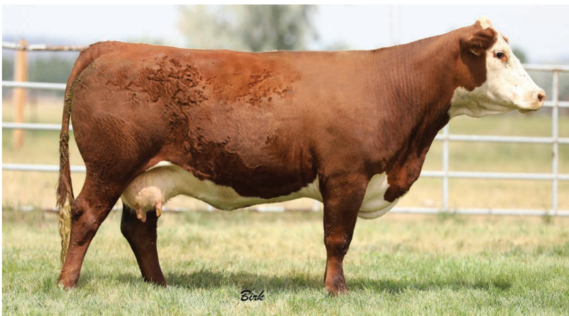
Lot 25--Mohican Megan 47D