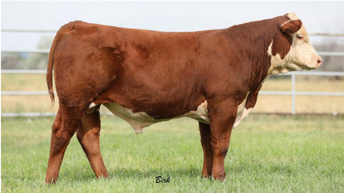
Lot 2A--Mohican William 2H