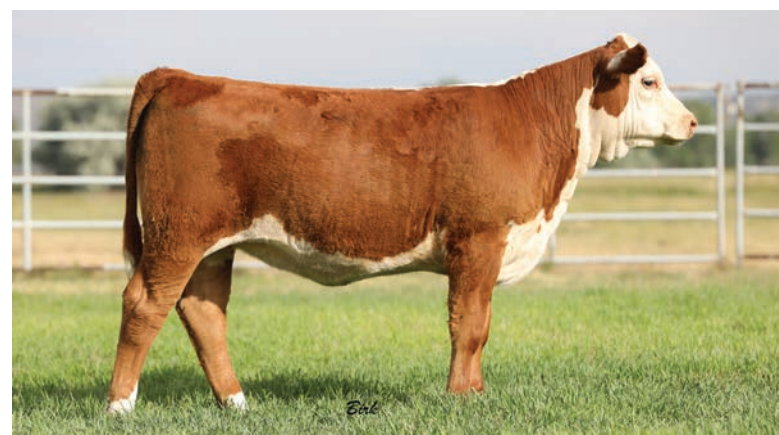
Lot 24A--TDP Melody 33H

24 TDP Melody Cow P43690350..... CALVED: FEB 25, 2016 ..... TATTOO: LE-96D TH 133U 719T UPGRADE 69X TH 122 71I VICTOR 719T TDP CROSSOVER Z400 TH 14S 103R MEGAN 133U P43292995 ASH LIL PEANUT 203P MOHICAN MINT 19M ASH MELODY 211M C NEW ERA ET UPS TCC NITRO 1ET TDP MELODY 419Y ET C NOTICE ME ET P43192066 ASH MELODY 211M REMITTALL KOOTENAY 9K BLAIR-ATHOL 20X HEIDI 26J