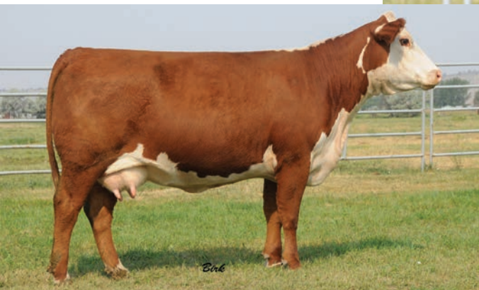
Mohican Carmel 6X--Donor Dam of Lot 12