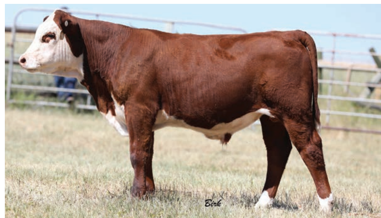
Lot 40A--MC 757E D173 Endure 2021