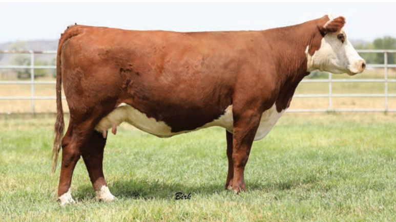
Lot 22--TDP Melody 8D