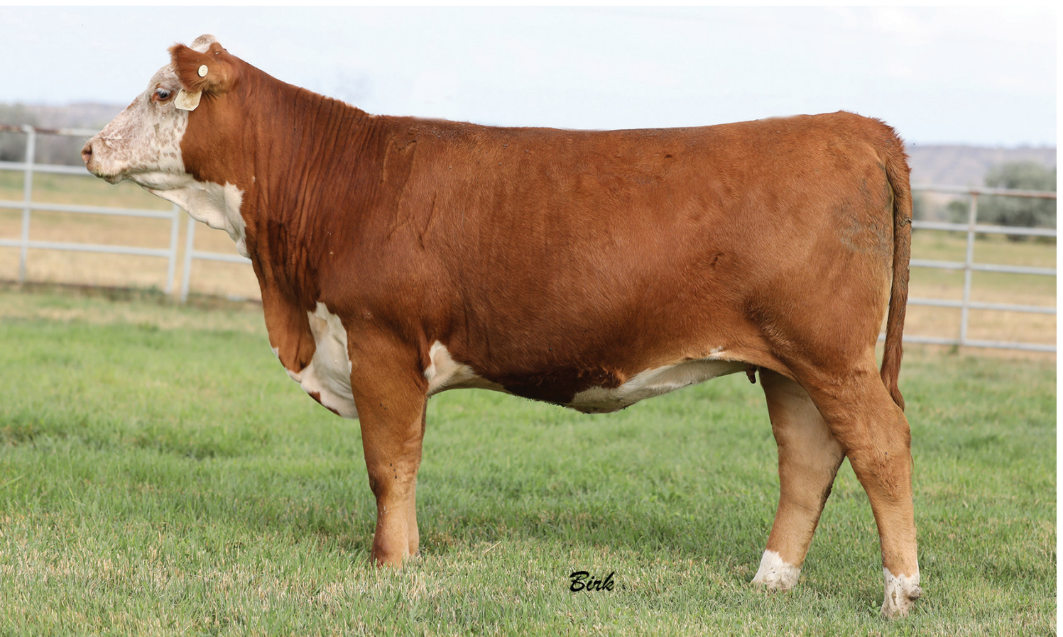
Lot 18--Mohican Fancy Maiden 56G