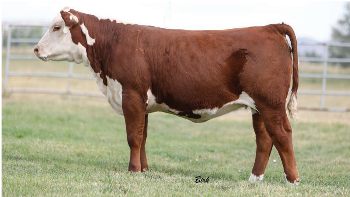
Lot 3A--Mohican Plus 46H