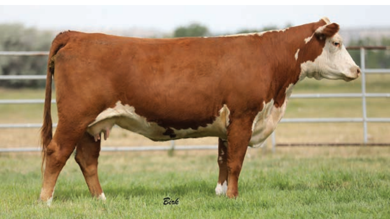
Lot 24--TDP Melody