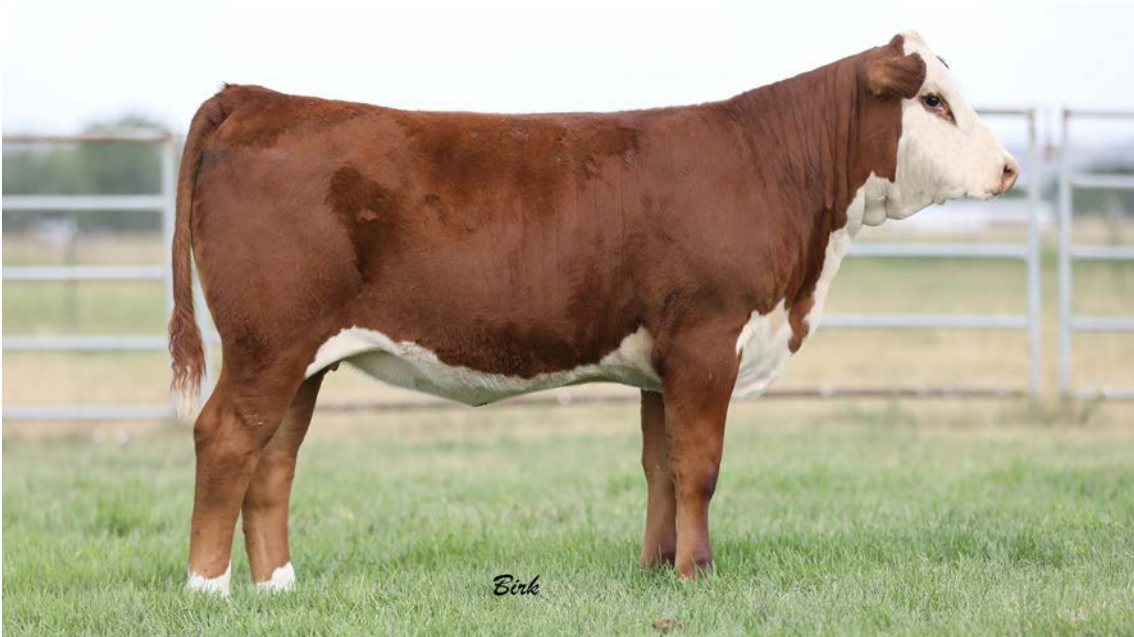
Lot 25A--Mohican Megan 36H