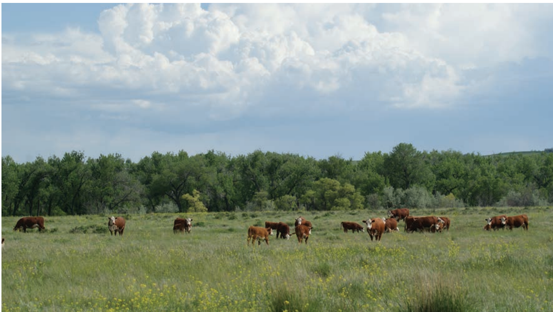
Pasture at MW