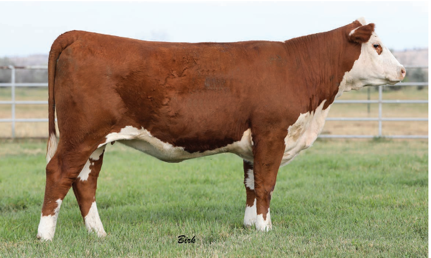
Lot 17--Mohican Lass 23G