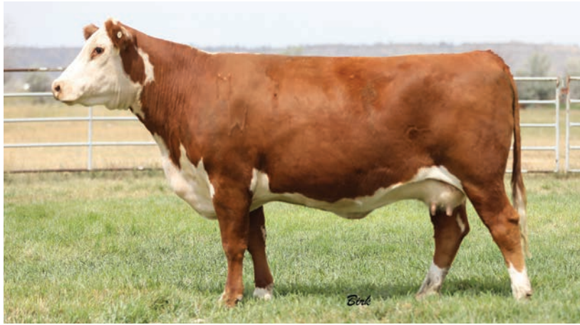
Lot 10--Mohican Mary Kay 75D