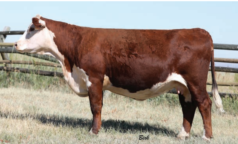
Lot 41--MC 1285 33T Ms Newtrend 1665 ET