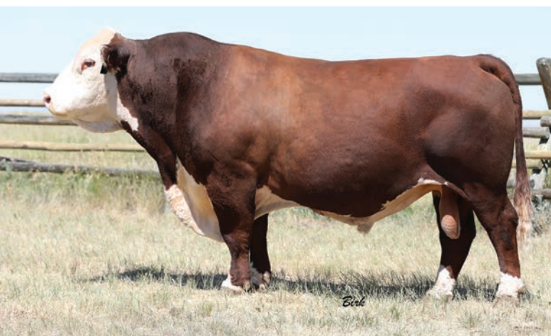
Square-D 42S Progress 323Y Featured Service Sire