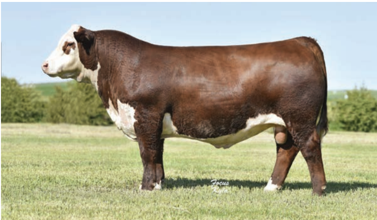
NJW 79Z Z311 Endure 173D ET Famed Sire of Lot 40A