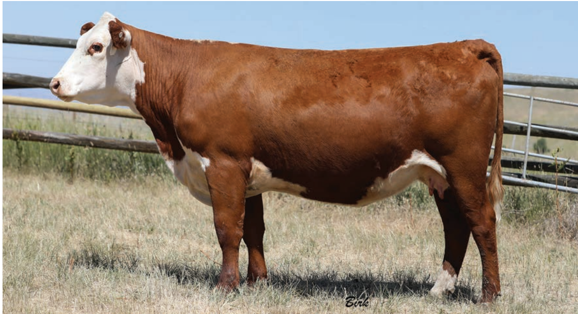
Lot 46--MC 1623 001A Pinnacle 1823