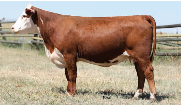
Lot 44--MC 1162 4051 Target 1817

44 MC 1162 4051 Target 1817 Cow P43944518.....CALVED: JAN 27, 2018 .....TATTOO: 1817 HYALITE ON TARGET 936 SCHU-LAR ON TARGET 22S WF ON TARGET 936 4051 HYALITE TS LASS 310 P43532022 WHITEHAWK 2328 BEEFMAID WHITEHAWK RF REVOLUTION FELTONS KATE P38