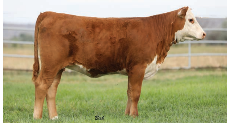
Lot 11A--Mohican Spenpour 63H