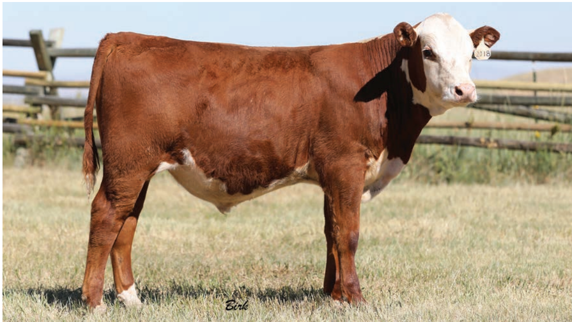
Lot 46A--MC 1823 722 Tested 2018