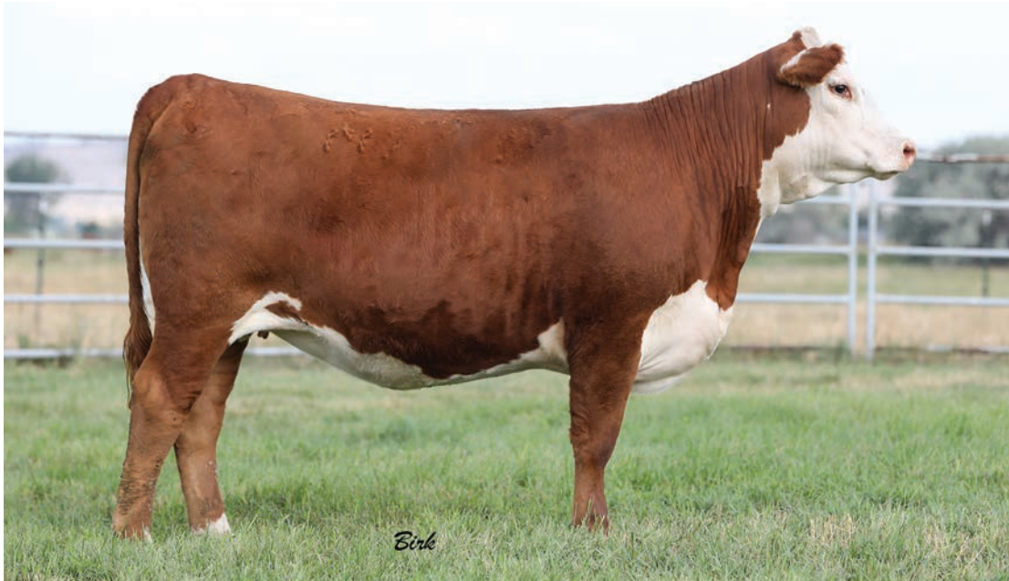
Lot 15--Mohican Sparkle 82G

15 Mohican Sparkle 82G Heifer P44023976..... CALVED: FEB 19, 2019 ..... TATTOO: LE-82G