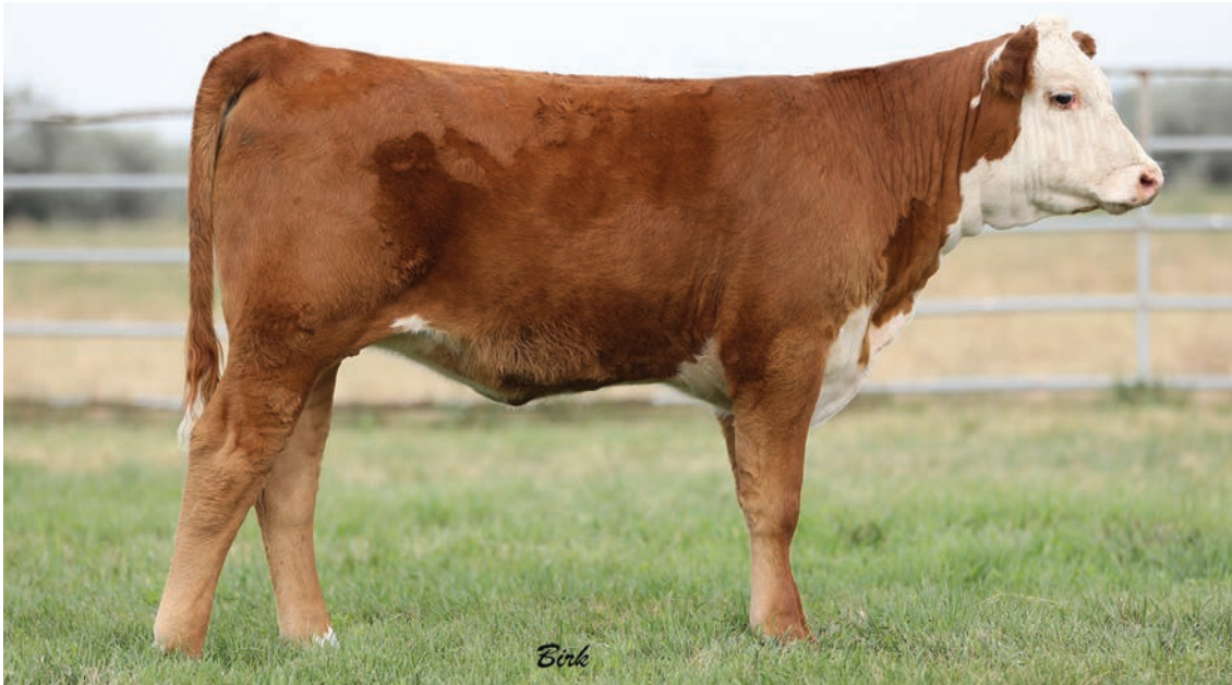
Lot 12A--Mohican Pauline 115H