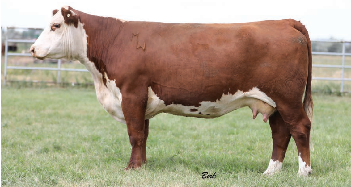
Lot 21--ANL 17A Brnady 109Z 53D