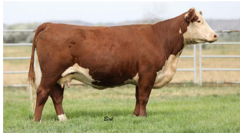
Lot 23--Mohican Spendour 37D

22 TDP Melody 8D Cow P43689912..... CALVED: FEB 5, 2016 ..... TATTOO: LE-8D BOYD POWERHOUSE 2028 TH 71U 719T MR HEREFORD MOHICAN BRICK M13B NJW 8S 4037 DOREEN 108X P43514423 LAKE BJG PERFECT MISS 325U SB 122L GIT-R-DONE 19R ET KFF PERFECT MISS MOHICAN TOP SHELF Z1 NJW 73S M326 TRUST 100W TDP MELODY 10B MOHICAN CARMEL 6X P43490807 TDP MELODY Z410 TH 122 71I VICTOR 719T ASH MELODY 211M