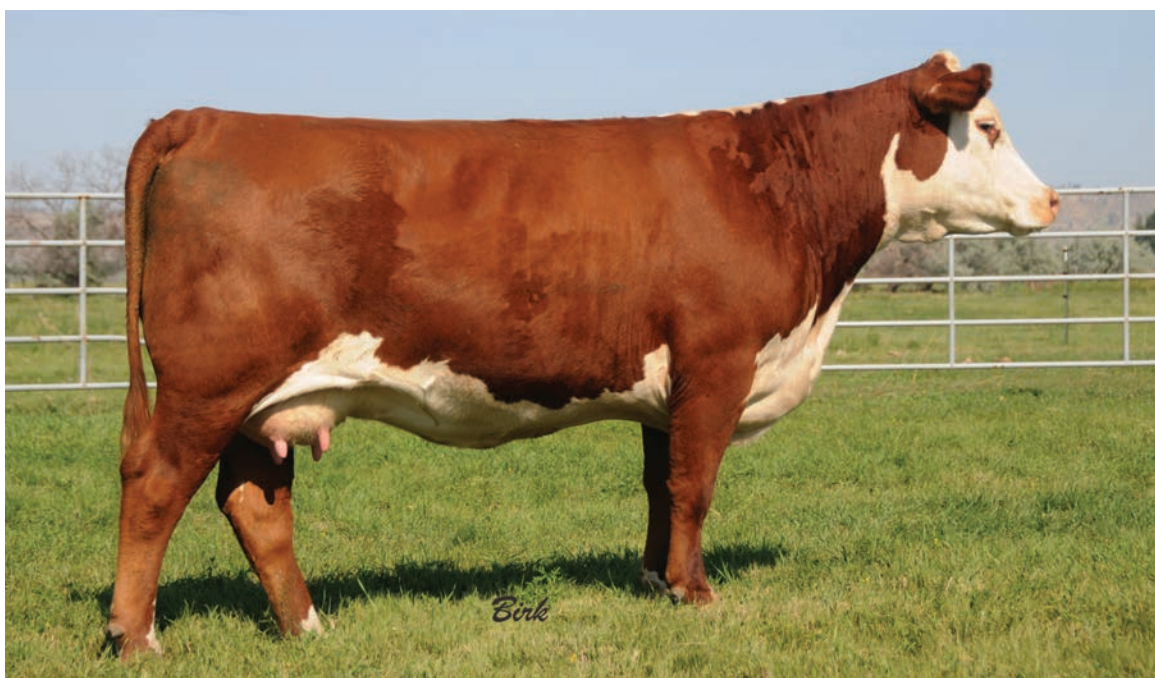
TH 223 71I Dominette 404X ET--$60,000 Paternal Grandam of Lot 5