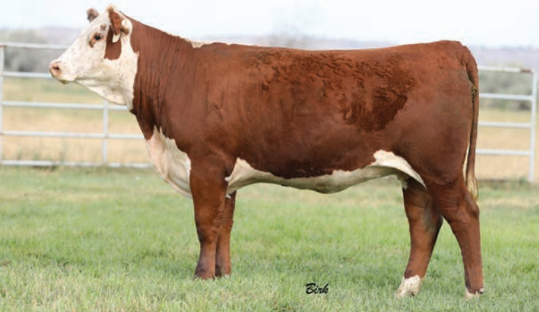
Lot 19--Mohican Prairie 28G

19 Mohican Prairie 28G Heifer P44024017..... CALVED: FEB 6, 2019 ..... TATTOO: LE-28G DR MW TRASK GRASSMASTER PW MOHICAN NASDAQ P316 MOHICAN BLUEPRINT 69B RKH MS IRENE 3A20 6G03 P43490788 NJW M326 UNFORGETTABLE 76WKCF BENNETT 3008 M326 NJW P606 72N DAYDREAM 73S TH 122 711 VICTOR 719T DRF JWR PRINCE VICTOR 711 MOHICAN PRAIRIE Z24 KBCR 19D DOMINETTE 122 PP43293097 TH 223 711 DOMINETTE 404X ET DRF JWR PRINCE VICTOR 711 KBCR 19D DOMINETTE 223