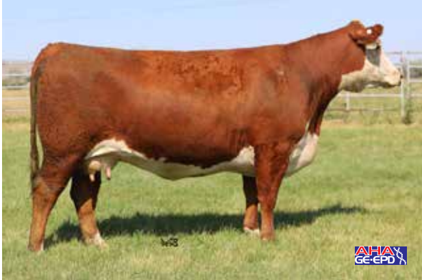
Lot 25 — Mohican Queen 207F