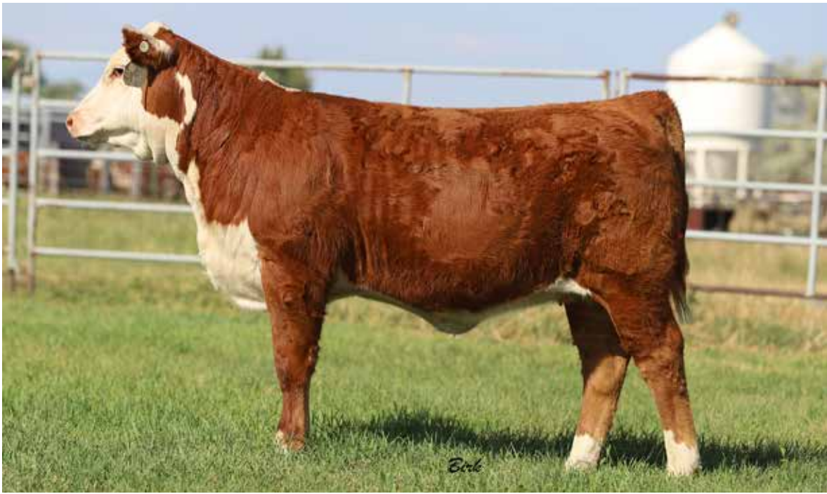
Lot 10A — Mohican Nadean 71K