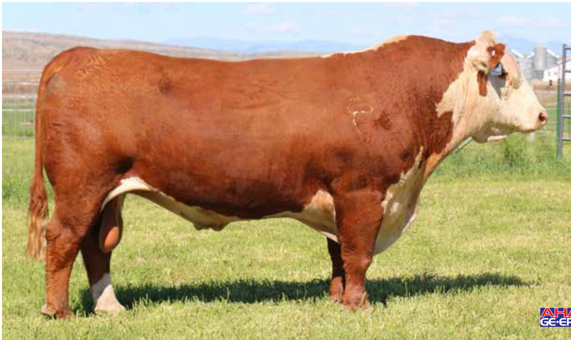
Churchill Manhattan 428B ET — Sire of Lots 39, 40, 47, 48 and 49