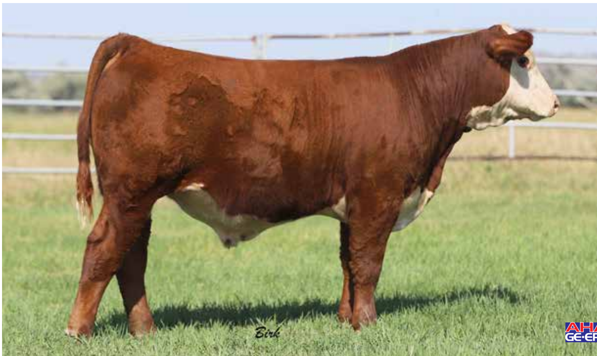
Lot 3 — Mohican Handy Man 40K