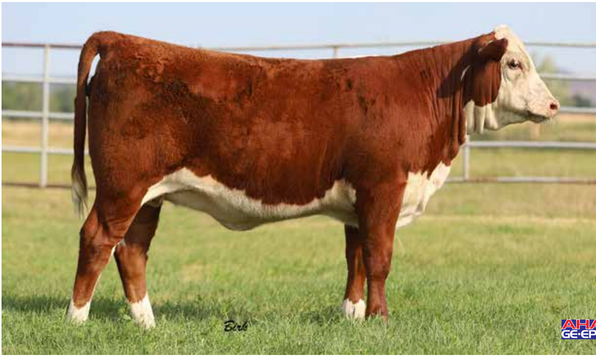
Lot 9A — Mohican Scarlet 51K