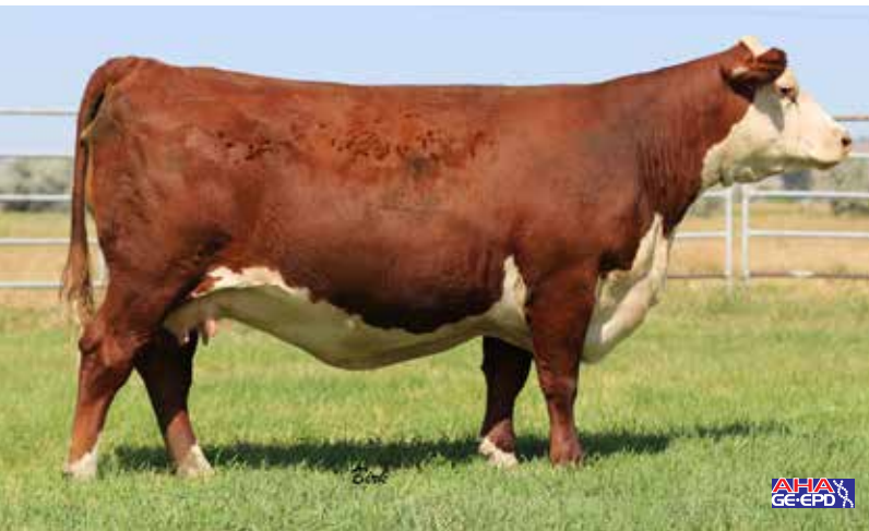
Lot 16 — RVP Z400 Fact Checker 96F