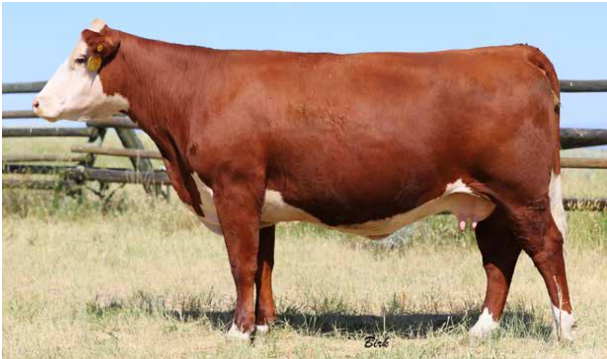
Lot 37 — WSF Lady Heartbeat G28