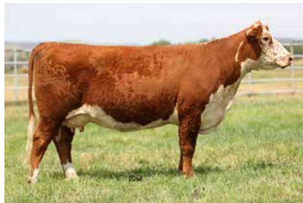
Mohican Fancy Maiden 51D — Dam of Mohican Will 116H