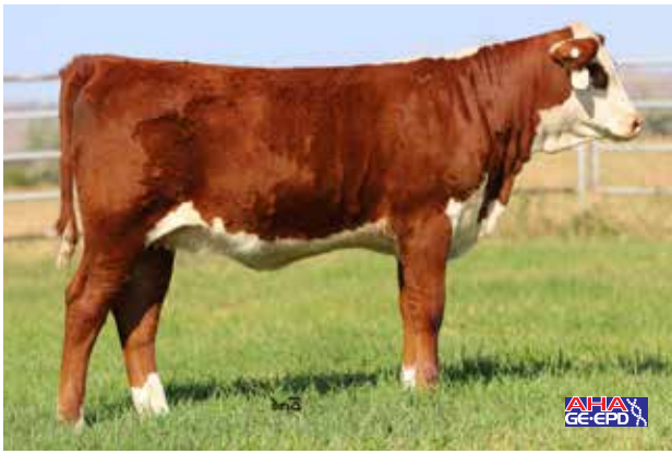
Lot 18A — Mohican Irene 57K