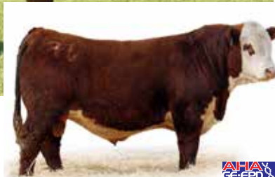
NJW Character 178J ET