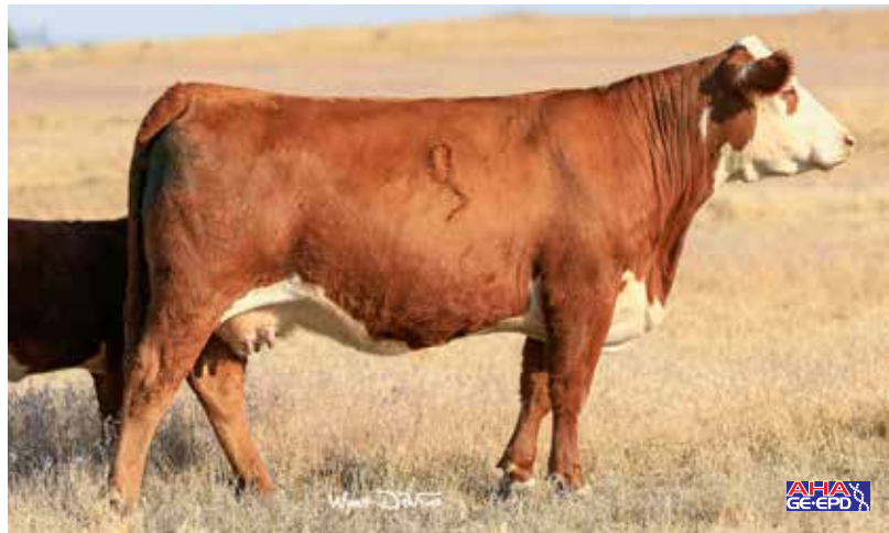
Lot 51 — DCR 320 Tara 0085