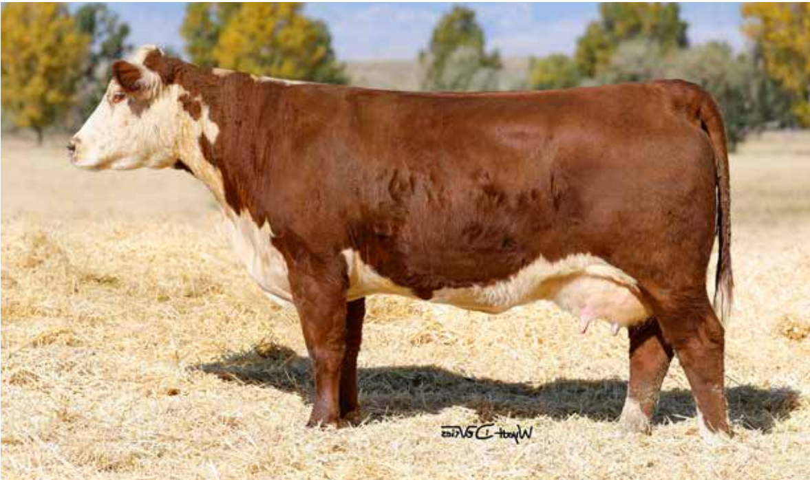
DCR 199B Diana 7629 — Dam of Lot 41