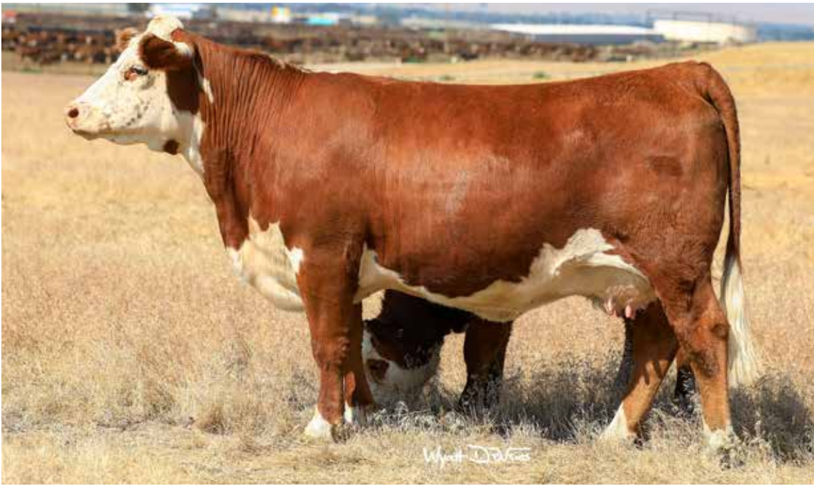
Lot 41 — DCR 320 Diana 0043