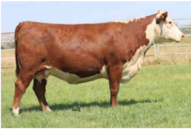
Lot 24 — RVP 4040 Golden Girl 86G