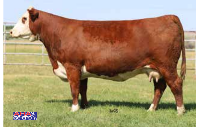
Lot 21 — Mohican Plus 50F