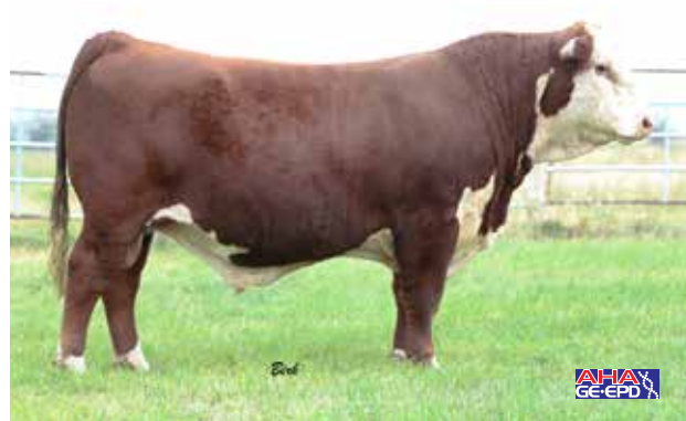
Mohican Company Man 51J — Maternal Brother to Lot 3