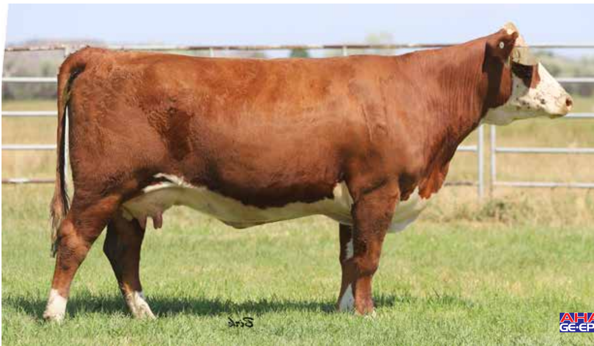
Lot 9 — Mohican Scarlet 2F