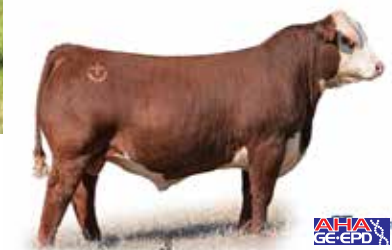
SHF Houston D287 H086