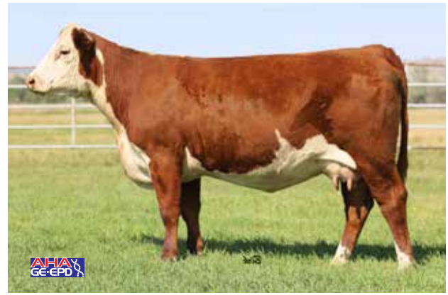
Lot 20 — Mohican Matty 13H