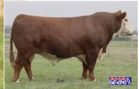
Mohican Sure Fire 76G Featured sire — Owned with Joey Skribanek, Caldwell, Tx.