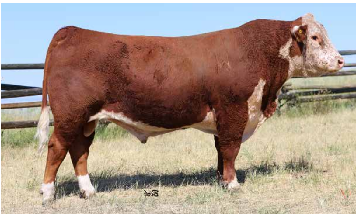
Mohican Will 116H — Featured Service Sire