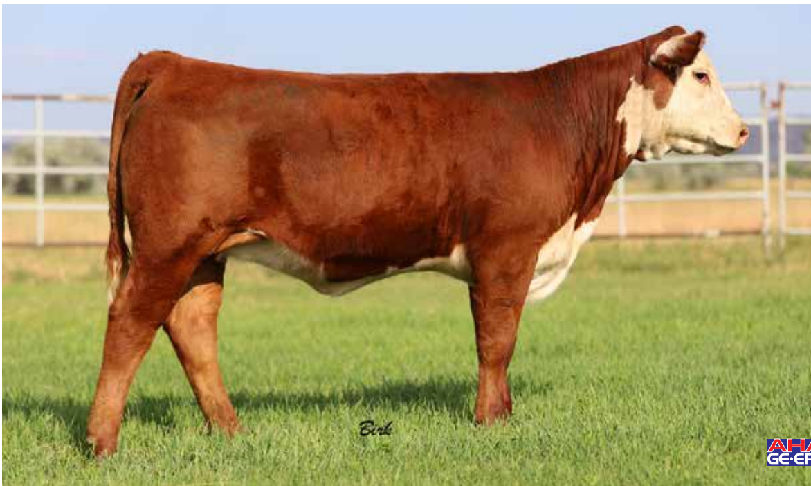
Lot 13A — Mohican Sage 22K