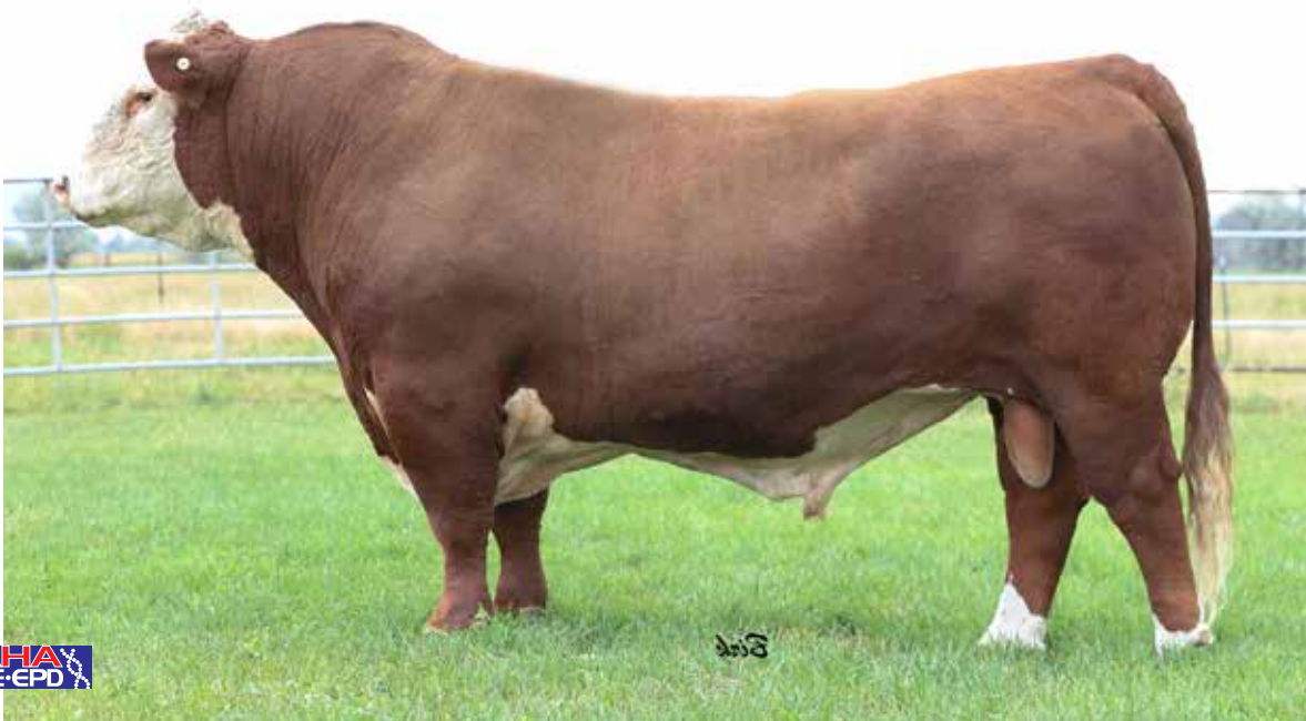
DM All Around 904G ET — Featured Sire