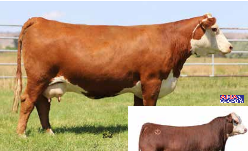
Mohican Rose 96G ET Dam of Lots 3 and 5