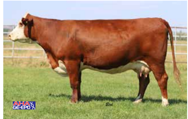
Lot 22 — Mohican Plus 63F