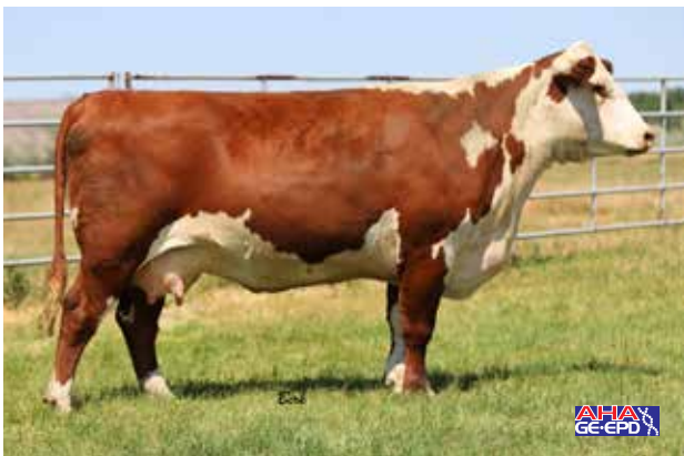
Lot 27 — TDP Sally 4F