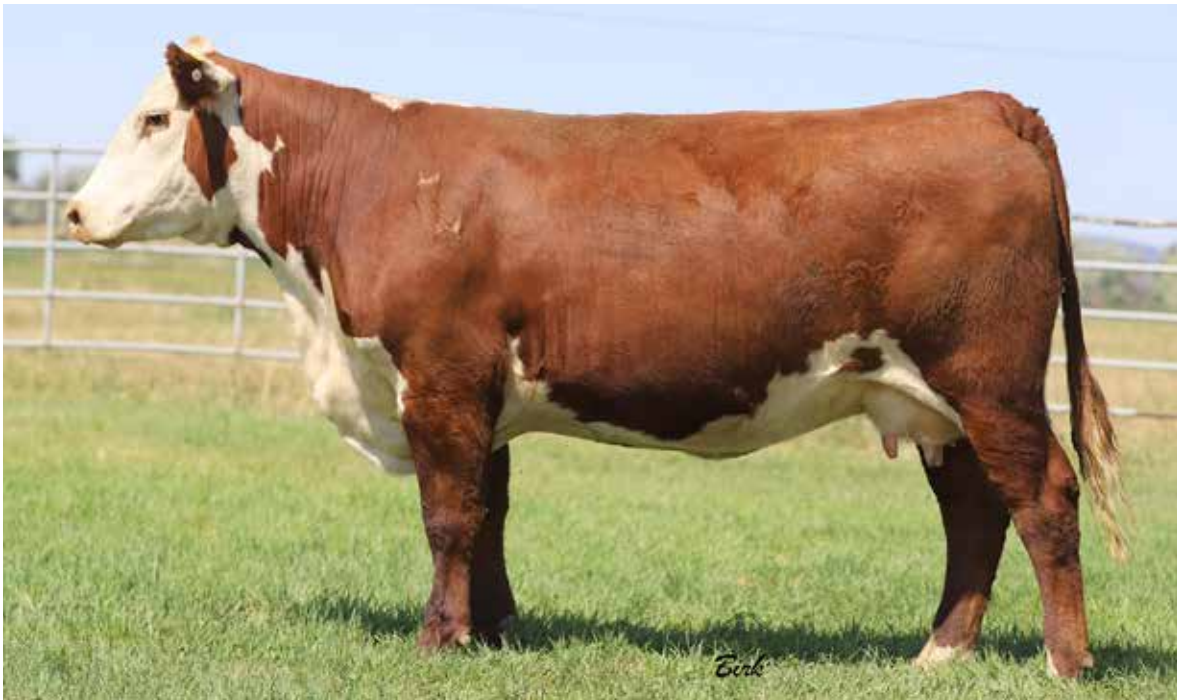
Lot 12 — ANL 68E Reba 3550A 152G