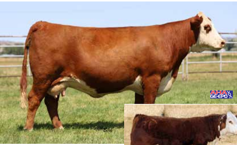
Lot 4 — NJW 139C 10W Lexy 10F ET