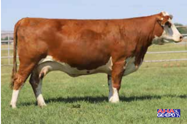
Lot 18 — Mohican Irene 68F