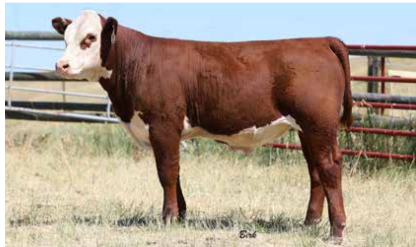
Lot 34A — MC 1736 173D Endure 2225