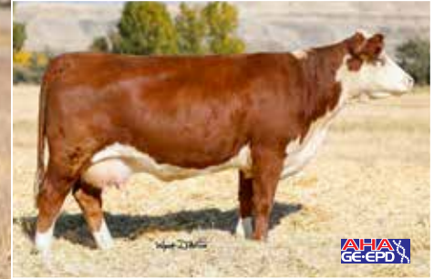
DCR 479 Beauty 7084 Dam of Lot 40