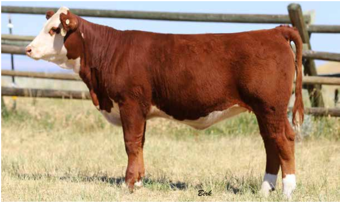
Lot 37A — MC G28 9156 Rita 2209