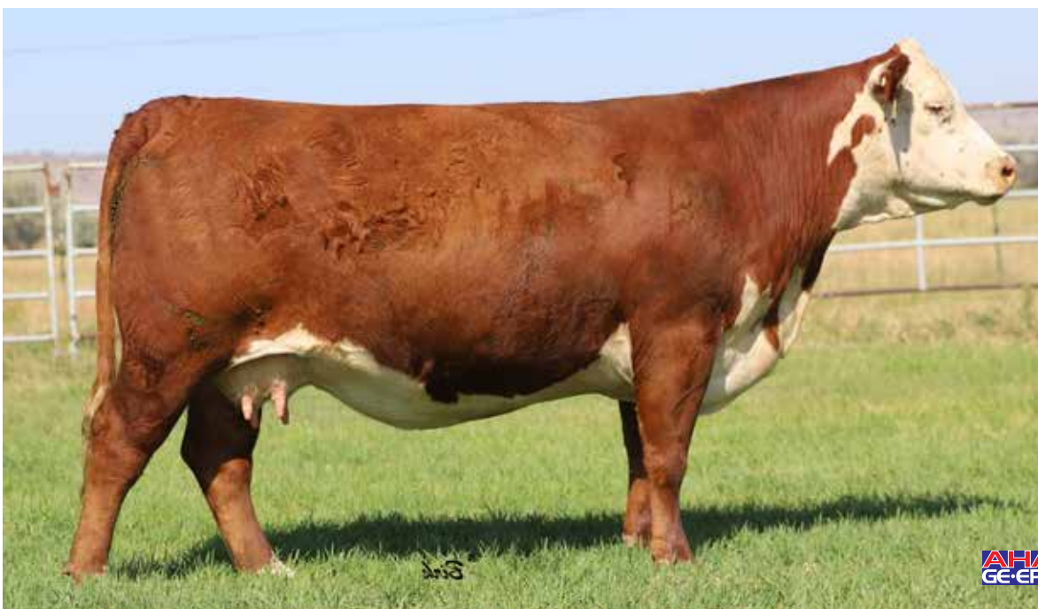
Lot 13 — H Ms Excel 7469 ET