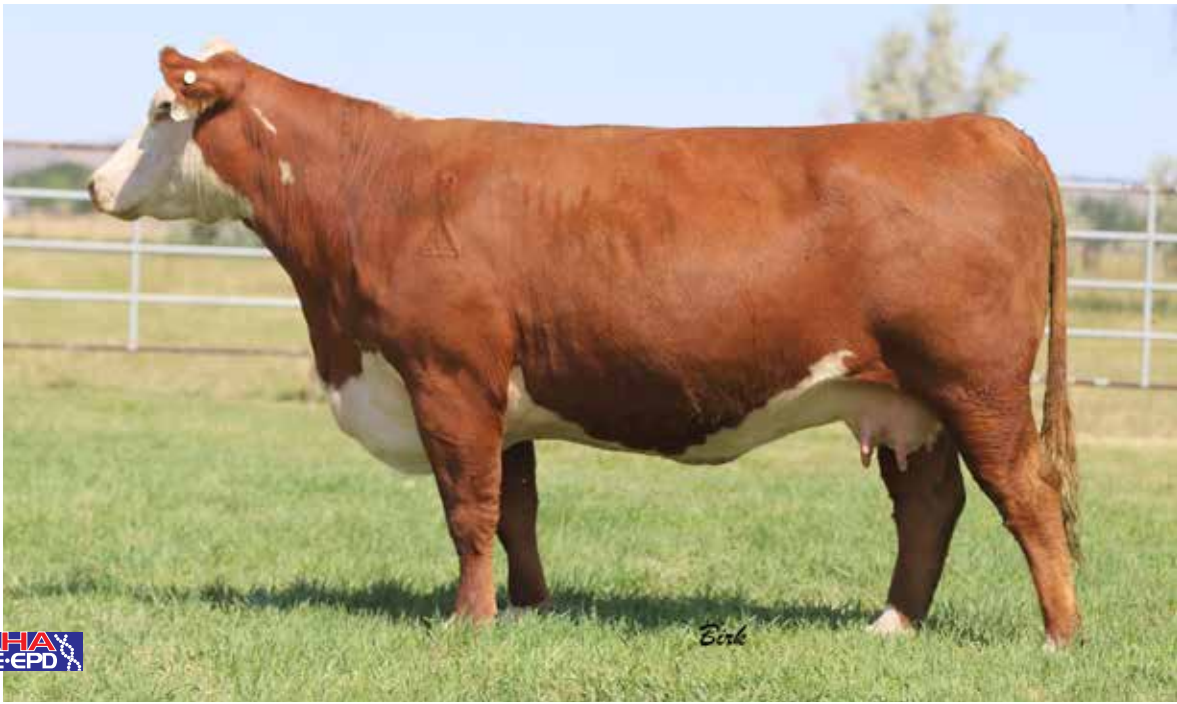
Lot 14 — VMHG Noticable 902G