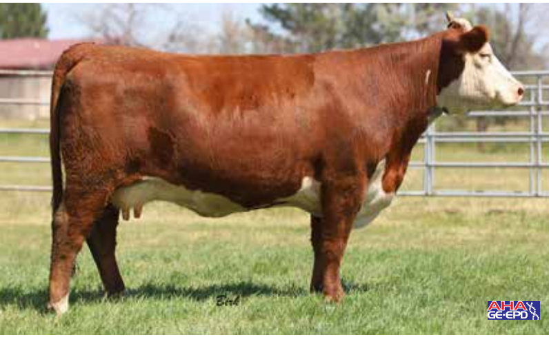
Lot 15 — Mohican Nita 3G