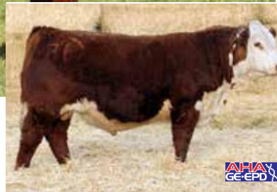
NJW Steadfast 156J ET