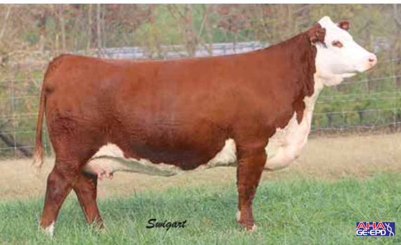
NJW 91H 100W Rita 31Z ET — Dam of Lot 1