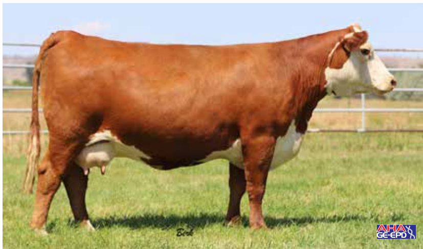
Mohican Rose 96G ET — Dam of Lot 3