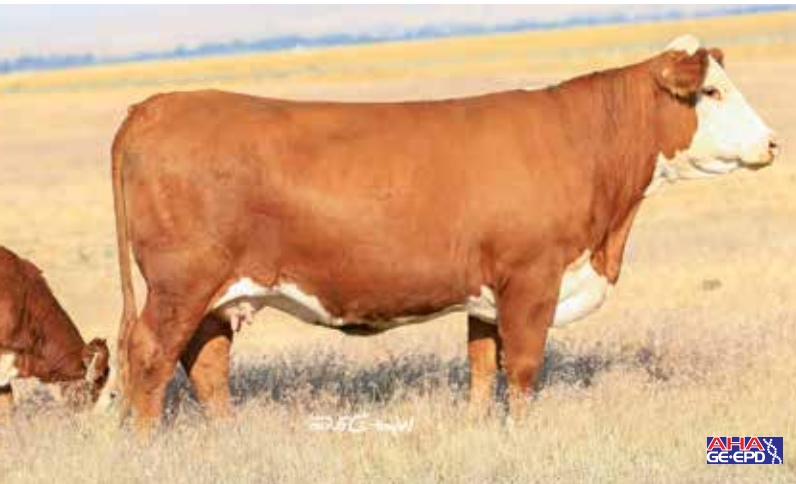
Lot 50 — DCR 479 Miss CAL 0149