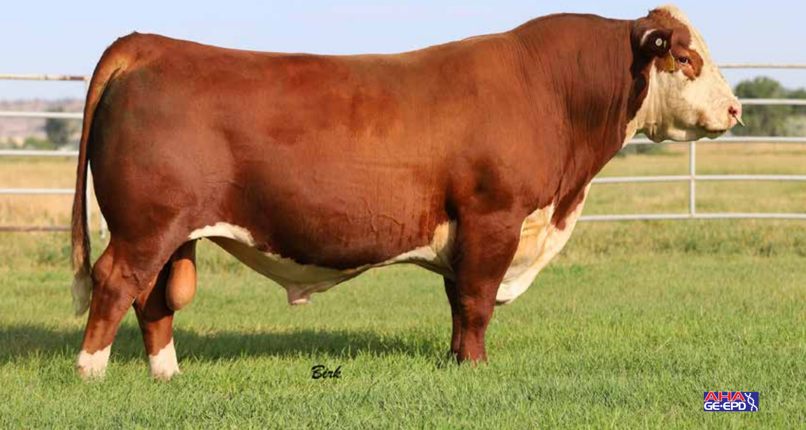
Lot 1 — Boyd 31Z Blueprint 6153