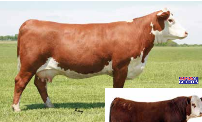
RHF 8Y Rose Garden 4067B — Dam of Lots 2 and 7