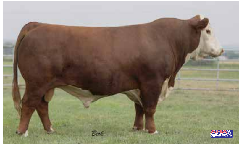
Mohican Sure Fire 76G — Sire of Lot 16A