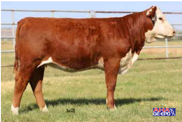
Lot 19A — Mohican Catalina 11k