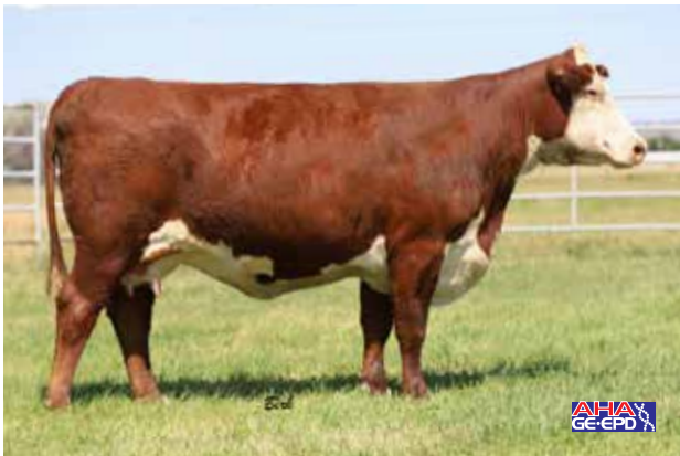
Lot 26 — Mohican Plus 201F