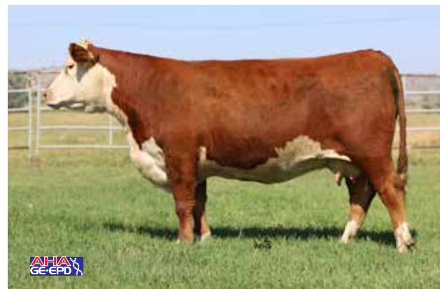
Lot 23 — JH 0209 Lady Whit 33B 8240