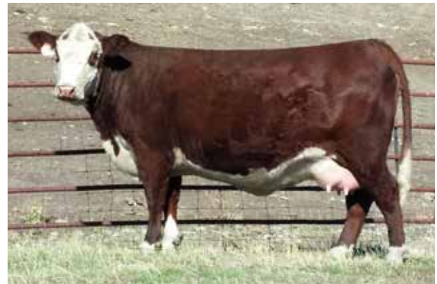
Grassy Run Apollinia 2020 — Dam of Lot 34