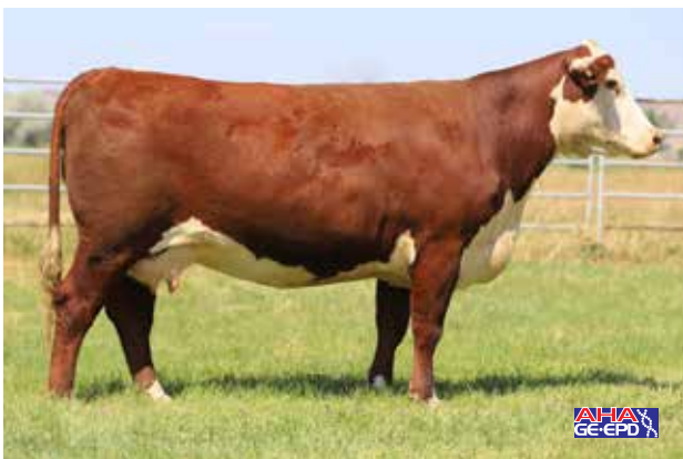
Lot 19 — Mohican Catalina 26F