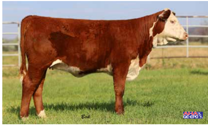
Lot 15A — Mohican Jan 23K