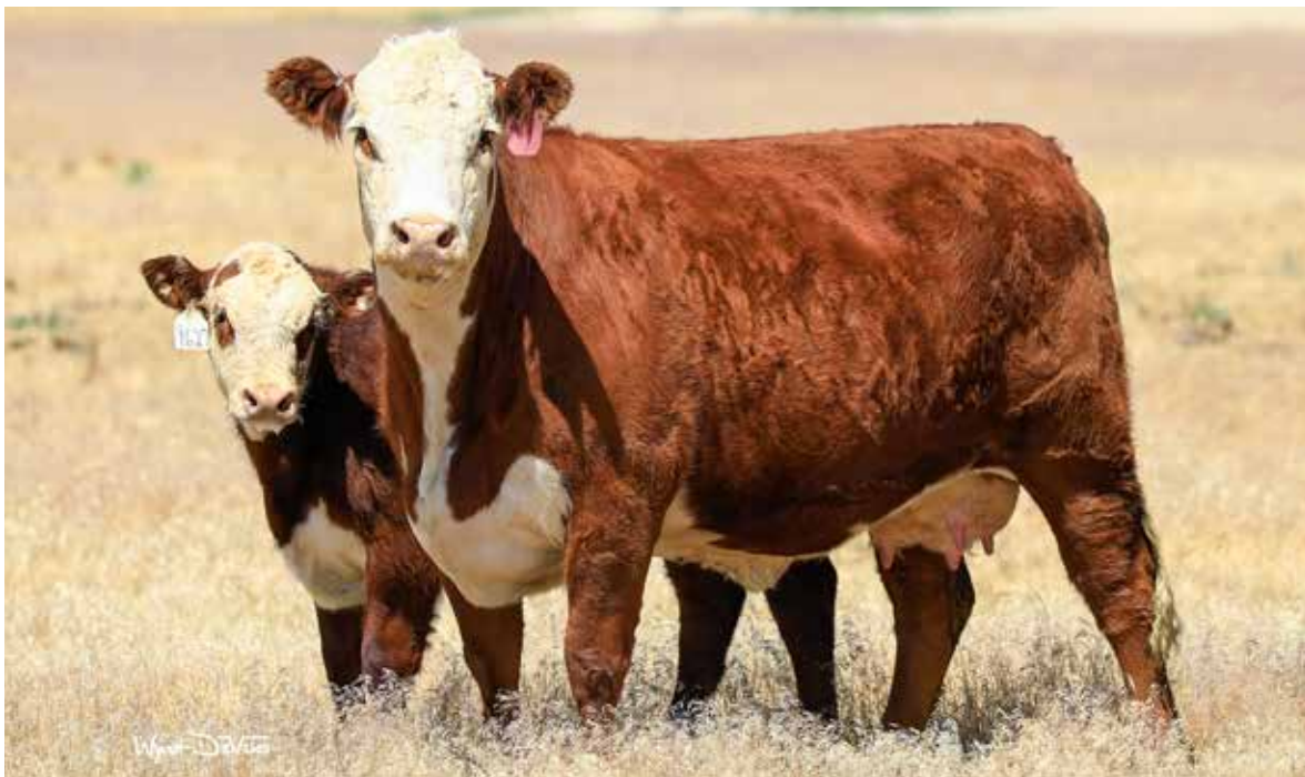
Lot 39 — DCR 428B Dominet 9627