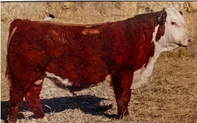
NJW 119D 27C Rimrock 195G (reg # 44056496)

Ridge is a long slick hided bull with a great sire look. He is dark colored and goggle eyed. The Ridge progeny are born light and gain quickly. The pedigree behind him is rock solid and packed with genetics strong in the profit driving traits. His dam is one of NJW's very best and coupled with a double cross of the maternal giant, 73S, the Ridge daughters should be jewels in the crown.