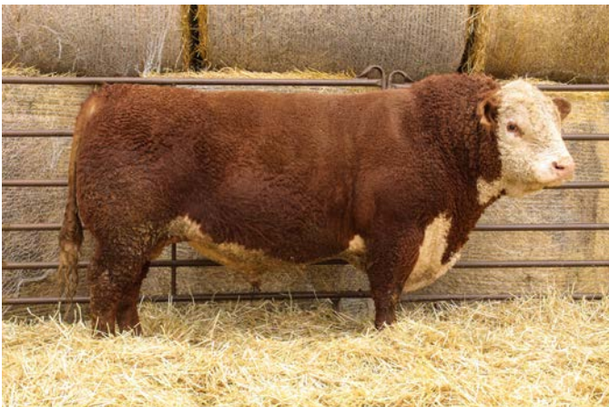
NJW 73S 456B Power 52E ET (reg # 43830206)

Rimrock was our bull of choice from the NJW Hereford program in 2020. He is an excellent Rimrock son out of a very good Mr. Maternal daughter. He's sound, free moving, pigmented PLUS he has numbers to back him. Top 1% M o G and REA; Top 5% WW, Milk, SC, Udder, Teat, CHB; Top 10% YW.