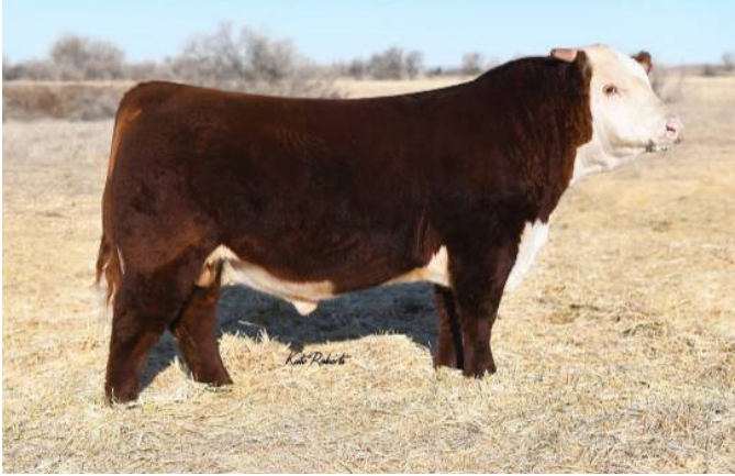
Churchill High Noon 8339F ET (reg # 44000066)

High Noon is a young bull that we are really cranked up about! He's fault-free and striking from every angle. He has tremendous muscle shape with very good feet, eyes, and color! He is balanced in his EPDs and his dollar indexes are right at the top of the breed.