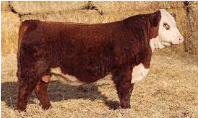
NJW 139C 103C RIDGE 254G (Reg #44056537)

High Noon is a young bull that we are really cranked up about! He's fault-free and striking from every angle. He has tremendous muscle shape with very good feet, eyes, and color! He is balanced in his EPDs and his dollar indexes are right at the top of the breed.