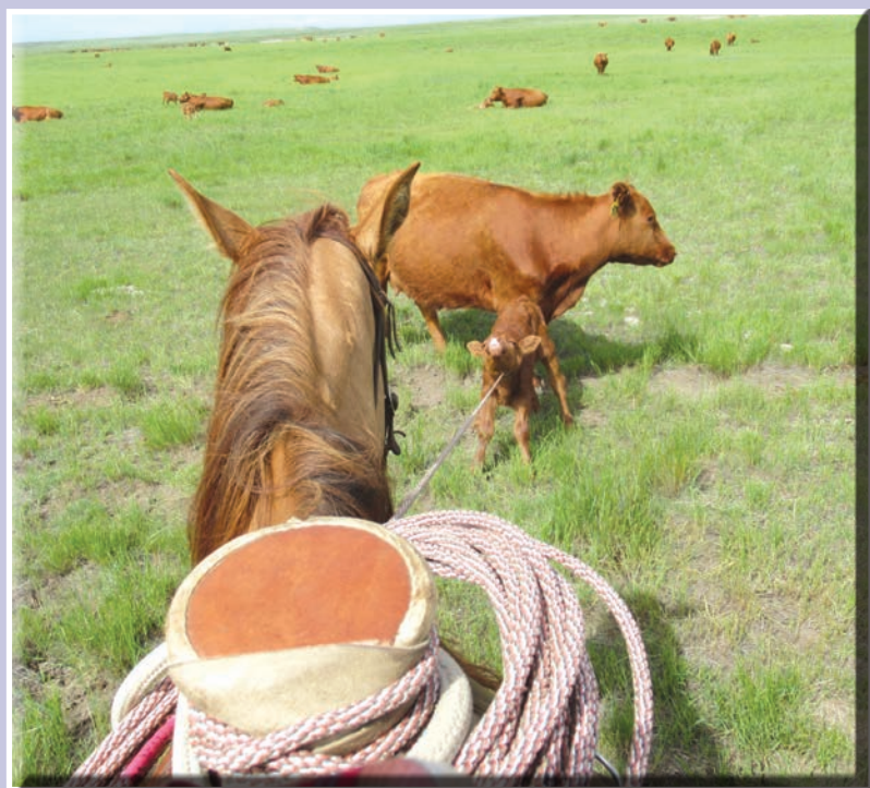
Carons Quarter Horses

River Hills Ranch 22759 357th Ave. Platte, SD