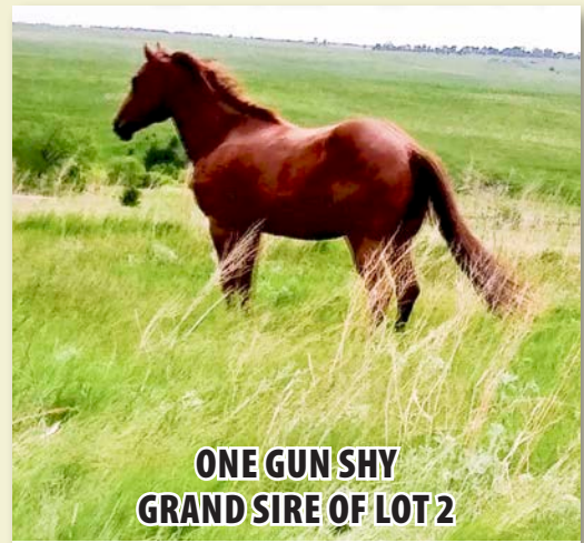
ONE GUN SHY GRAND SIRE OF LOT 2

MOLLY IS A DOUBLE BRED ONE GUN SHY FILLY. SHE IS QUIET, ATHLETIC AND SMART. SHE IS STARTED SHE WILL MATURE AT 15.2 HANDS. ONE GUN SHY, AKA "CODY" WAS ONE OF THE PROMINENT SIRES IN THE CARON QUARTER HORSE BREEDING PROGRAMS. RIDE HER AND THEN LET HER RAISE YOU SOME AMAZING COLTS. YOU WILL NOT BE DISAPPOINTED