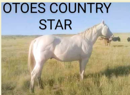
OTOES COUNTRY STAR GRAND SIRE OF LOT 1 • PAGE 10

A VERY NICE BUCKSKIN POA GELDING, WAS BEING RIDDEN BY A 12 YR OLD AND THEY GOT ALONG GREAT FOR AN OLDER CHILD WHO KNOWS HOW TO RIDE.