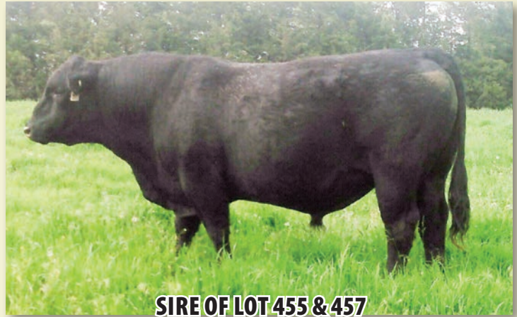
SIRE OF LOT 455 & 457

A long bodied and clean made bull. His calves will grow and have a mainstream look with Rifleman, Stockman and the 171X cow, the dam of Arrowsmith, all in his pedigree!