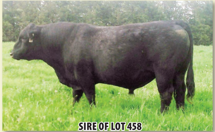
SIRE OF LOT 458

What a tank!! Has Ribeye & marbling to produce excellent end product. In the beef business? Want better beef quality? And cut out? Then take this bull home.