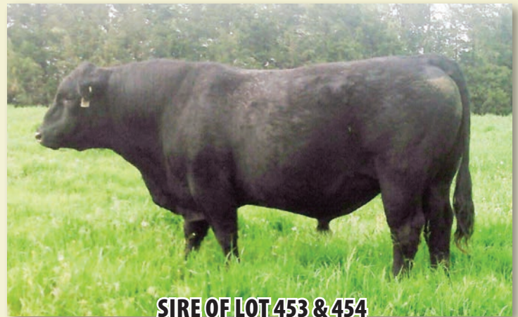
SIRE OF LOT 453 & 454

His dam is a moderate 75% cow that always brings a calf in at least 50% of her weight at weaning. Talk about efficiency! She is a branded red daughter.