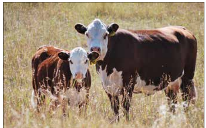
SNOWSHOE 45P LADY MAE 29P Z77 - MGD of 70J