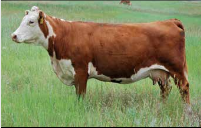
SNOWSHOE P606 SELENA U06 ET - Dam of J75 and Grandam J79

J79 A REG: 44312263 DOB: 3/17/21 POLLED SNOWSHOE 40E SELENA U06 J79