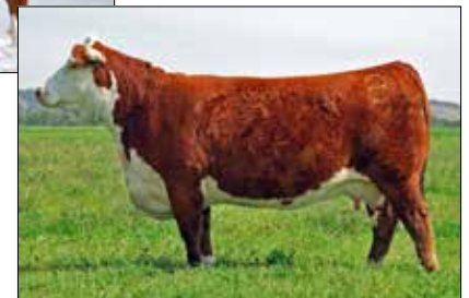
Grandam of Outlaw - Snowshoe 719T Katie T10 Y27