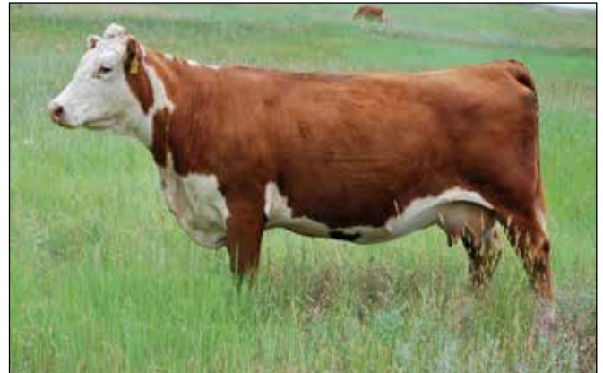
SNOWSHOE P606 SELENA U06 - MGD of 119H and 80J