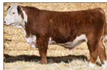
Son of Granite - 47J