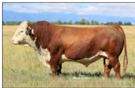
SNOWSHOE 719T PATERNO 23Y - Maternal Brother to 11J