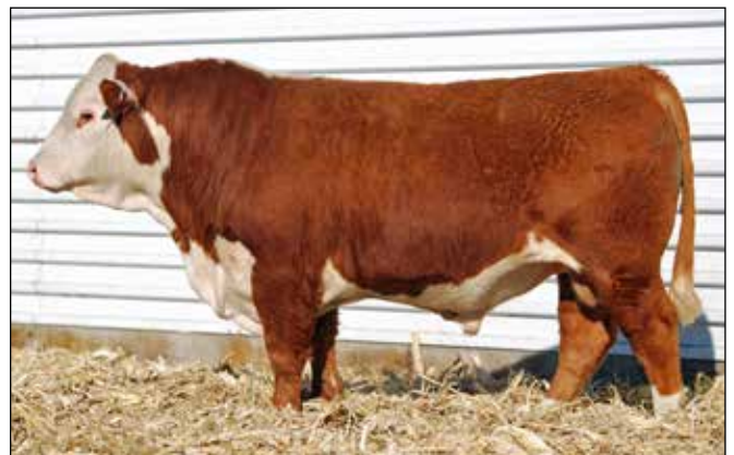
SNOWSHOE 32D GRANITE C25 82F - Sire of J25, J38, J50, J97 and J101