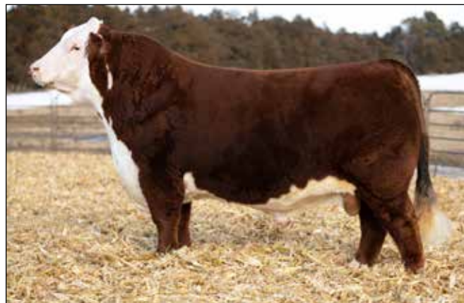
H MONTGOMERY 7437 - Sire of 02J, 11J and 40J

» Top 5% Milk, REA; 20% SC, Udder; 25% Teat, CW, BMI