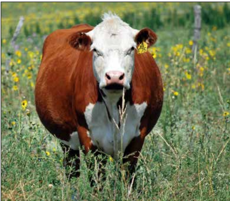
SNOWSHOE 19C TORI 31S E75 - Dam of 47J