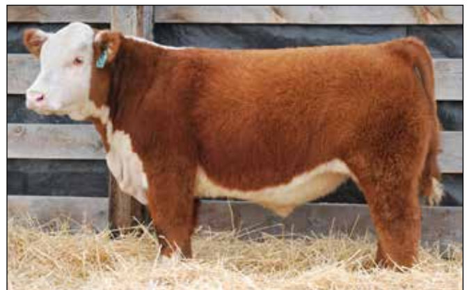
Maternal Brother 02J