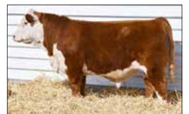
Maternal Brother to Granite - 70H