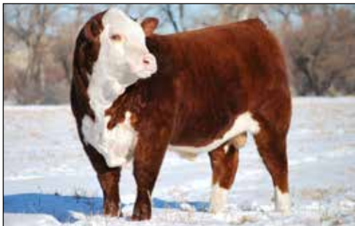
SNOWSHOE X51 Bannack Y27 19C - Grand Sire of 99J and sire of 49J