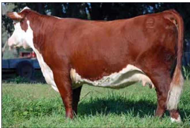
SNOWSHOE 719T SHIMMER T39 Z01 - Maternal sister to 40J