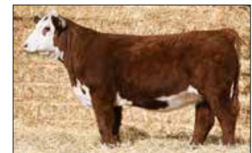
Daughter of Drover - J84