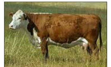
MGGD of Granite