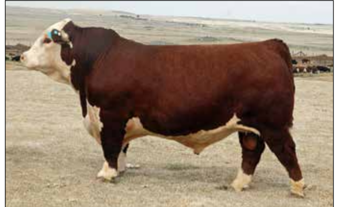
TH 13Y 358C BOTTOM LINE 206E - Sire of 119H and 131H