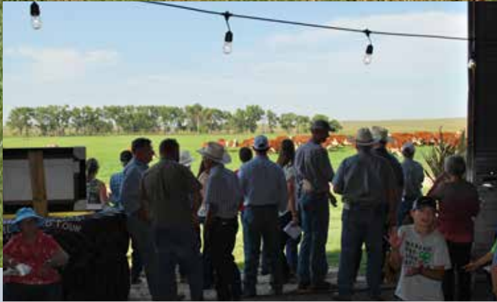
2021 Nebraska Hereford Tour