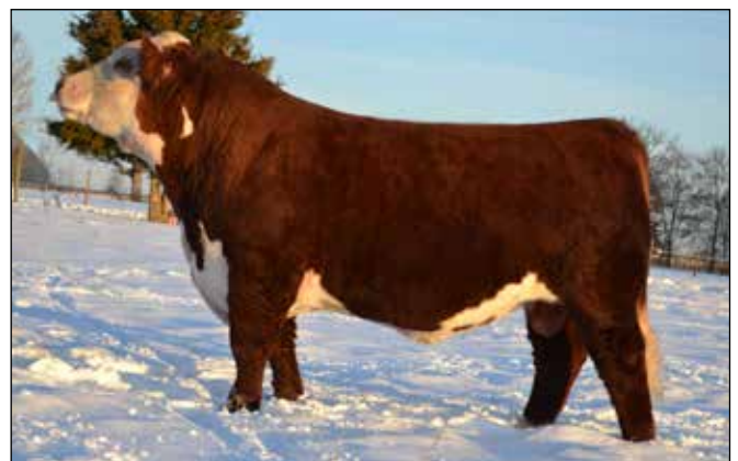
JDH VICTOR 719T 33Z ET - Sire to 104H, 105H and 113H