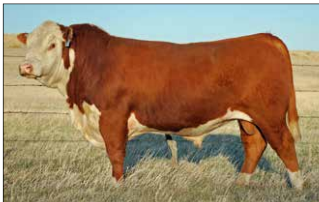
SNOWSHOE 32D GRANITE C25 82F - Sire of 21J, 37J, 47J, 51J, and 55J

26J A REG: 44301495 DOB: 2/15/21 POLLED SNOWSHOE BOTTOM LINE F03 26J