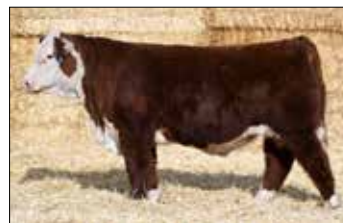
Son of Drover - 93J