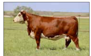
Dam of Drover