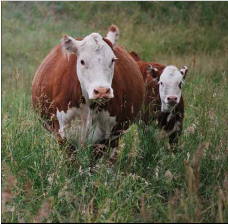
SNOWSHOE 483T SAPPHIRE T12 B12 - Dam of 73J

73J A REG: 44299548 DOB: 3/14/21 POLLED SNOWSHOE 40E VIKTOR B12 73J