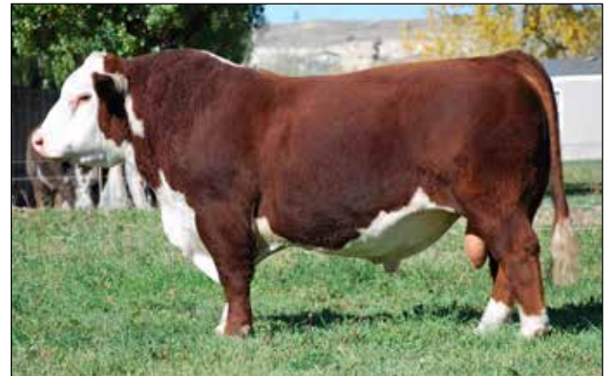
SNOWSHOE 31U TUFF 31S 42Z - MGS of 127H