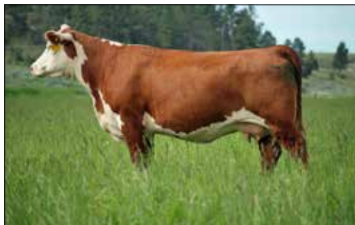
SNOWSHOE P606 SERENA T44 - MGD of 18J & MGGD of 15J