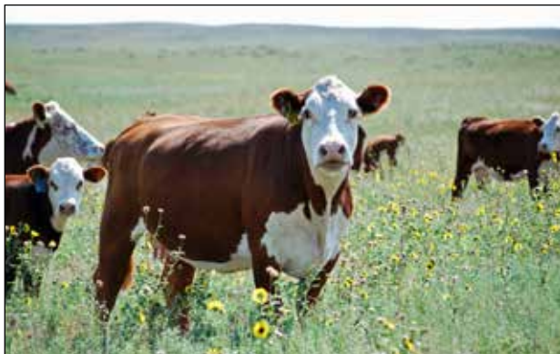
SNOWSHOE 90X KATIE T10 E48 - Dam of 61J