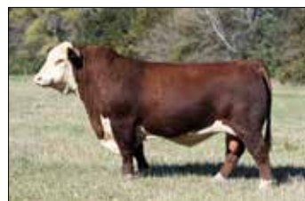
Sire of Drover