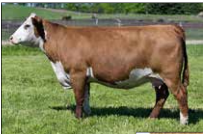
Dam of Victor

Top 15% for Sustained Cow Fertility (SCF), Baldy Maternal Influence (BMI); 20% Udder (structure), Carcass Weight (CW); 25% Birth Weight, Weaning Weight, Teat, Baldy Maternal Influence (BMI); 25% $CHB