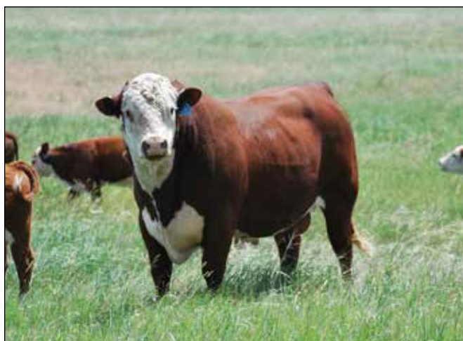
SNOWSHOE 19C OUTLAW U59 101F - Sire of 52J