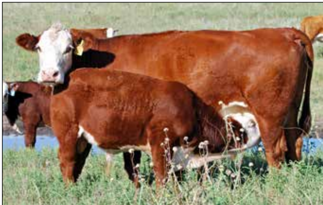
SNOWSHOE 719T WILDA 4120 Z16 - Dam of 83J with him at her side