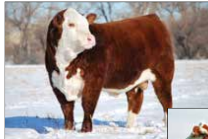
Sire of Outlaw