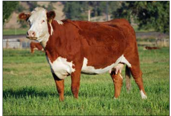
SNOWSHOE P606 MYSTIC BOOM 34R - MGD of J38