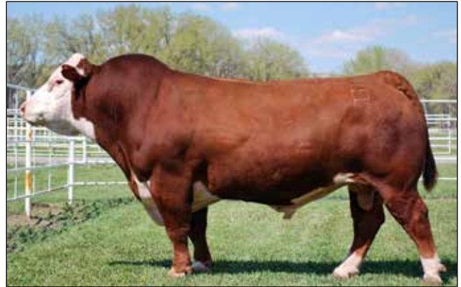
SNOWSHOE 20N SPUD 64R - MGS of 10J