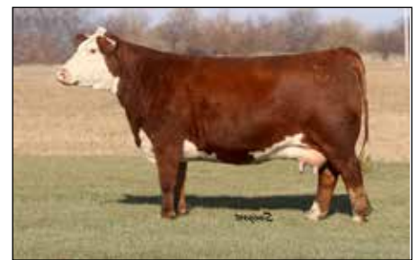
SNOWSHOE 64R PILAR X01 - Maternal Sister to 11J