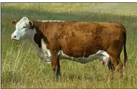
SNOWSHOE P606 PILAR U09 - Dam of 11J