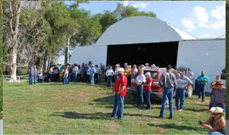
We were honored to host over 130 breeds at the 2021 Nebraska Hereford tour.