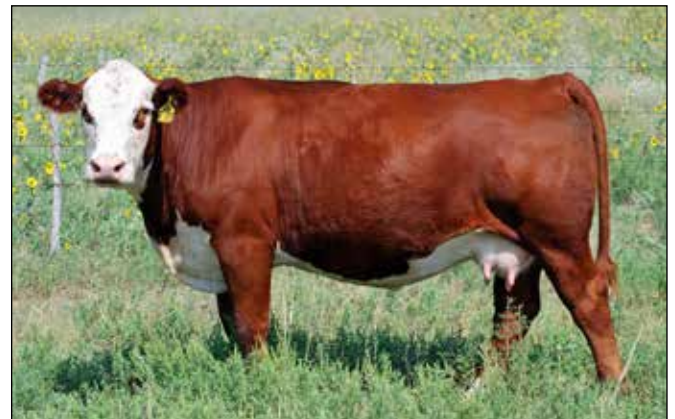
SNOWSHOE 90X TORI A78 E73 - Dam of 109J