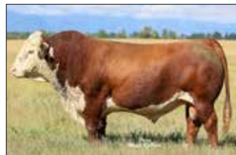
MGS of Granite