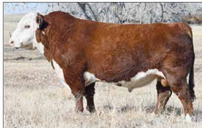
JDH 21Z VICTOR 33Z 40E ET - Sire of 110H, 46J, 63J, 73J, 90J, 100J, and 105J