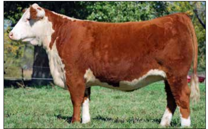
SNOWSHOE 23Y PANTHER Y20 C46 - Dam of J69