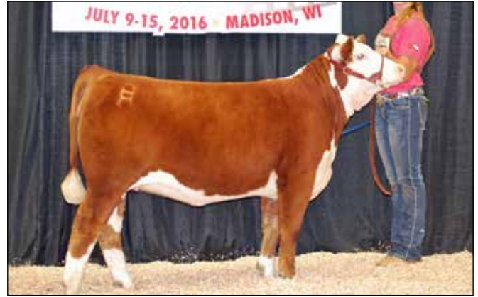
SNOWSHOE 42Z MYSTIC Y22 C76 - MGD of J112

J115 A REG: 44300069 DOB: 4/14/21 POLLED SNOWSHOE 101F BREEZE E86 J115