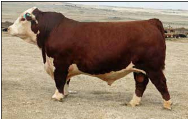
TH 13Y 358C BOTTOM LINE 206E - Sire of 10J and 26J