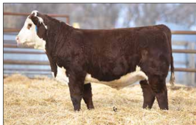
TH 49B 358C DROVER 134F - Sire of 116H, 129H, 137H, 139H and 0103