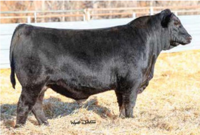
F A R Resilient 3005 PB AN ASA #4393492 Resilient sires lots 24-28

Purchased from Frey Angus Ranch in 2024 Sitz Resilient 10208 x Deer Valley Growth Fund We were looking for an Angus bull to cross with our Simmental cows and to also use him on some registered Angus cows. We wanted one that would give plenty of performance without sacrificing calving ease and maternal traits so we chose F A R Resilient. He has some of the most popular Angus bulls in his background and we are excited to have him in our line up. His sons all came easy at birth and then took off over summer, we are excited to see what they will continue to do and how his females turn out.