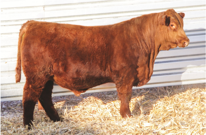
TNT Kenai L727 3/8 SM 5/8 AR ASA # 4242057 Kenai sires lots 39 & 40

Purchased from TNT Simmentals in 2024 Sutphin's Out In Front 6699 x BCLR Stur-D C88-2 Kenai was purchased to add to our SimAngus red bulls, especially on the Cowboy daughters. He has two bulls in the sale and they are the two highest wean weight bulls of the red bulls and both out of Cowboy daughters. They are both dark red that still show the characteristics that Cowboy had but get a little more frame from Kenai. He was in a small pasture with not very many cows so we are hoping for more out of him next year.