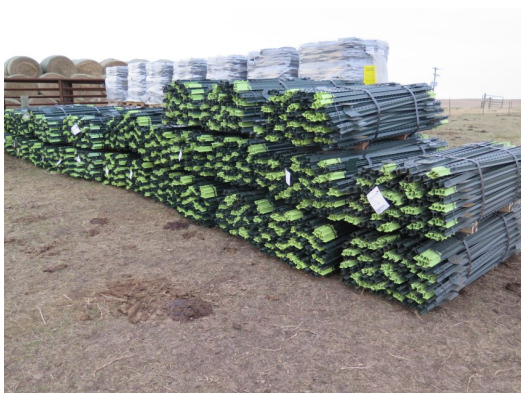
Heavy Steel Post (1.33) Treated Wood Post Railroad Ties Rough 2x8x16 Planks Barb and Barbless Wire H&W Gates