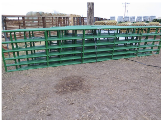
24' Free Standing Windbreak Panels 24' Free Standing Panels Free Standing Panels with Hinges for 8'-16' Gate